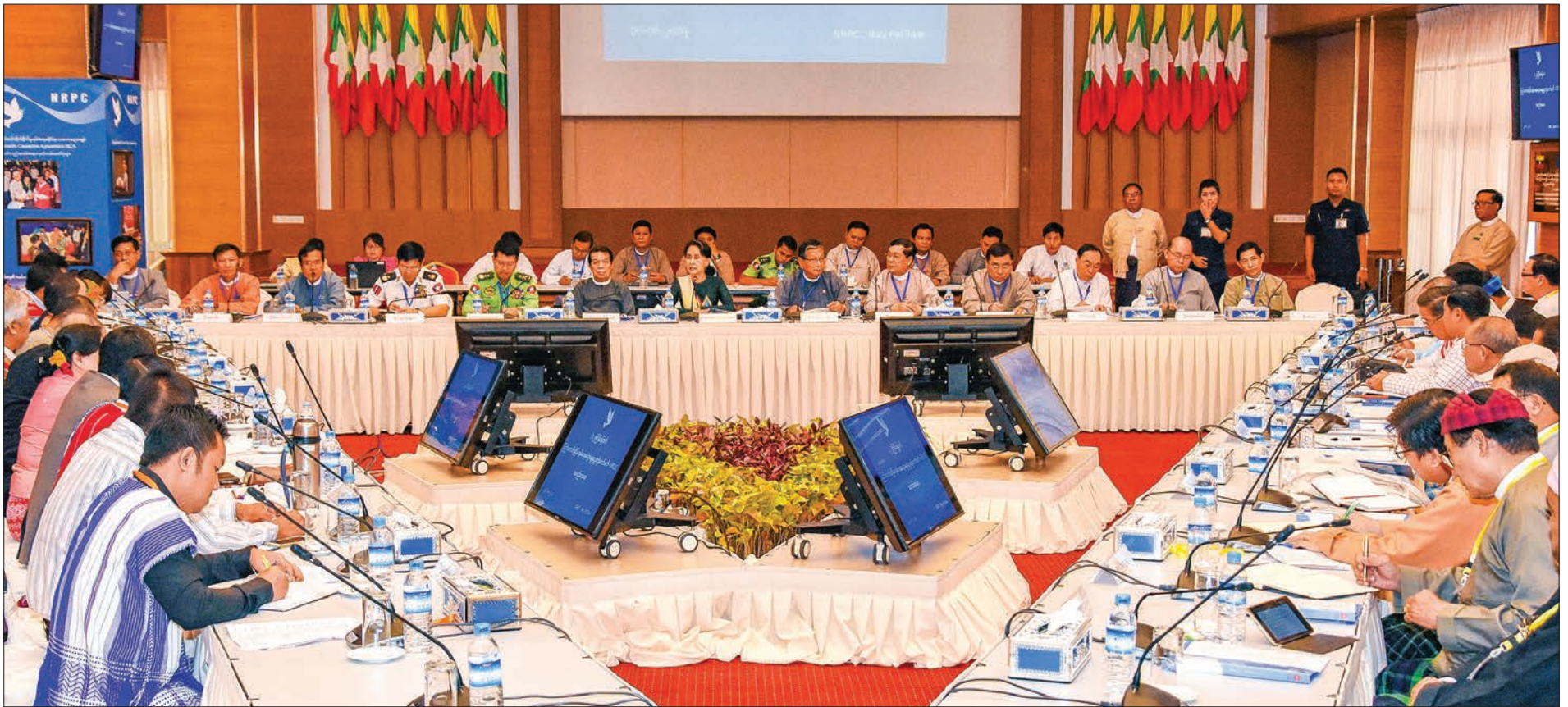
Union Peace Dialogue Joint Committee holds 12 th meeting in Nay Pyi Taw as it is chaired by State Counsellor Daw Aung San Suu Kyi, on 30 October 2017.