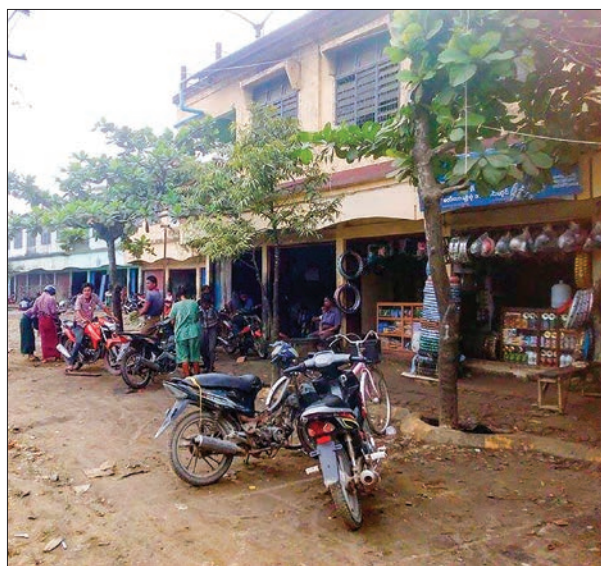
A shop selling spareparts for motorcycle in Maungtaw.

And, Maungtaw Four Miles market and Kanyintan market opened by