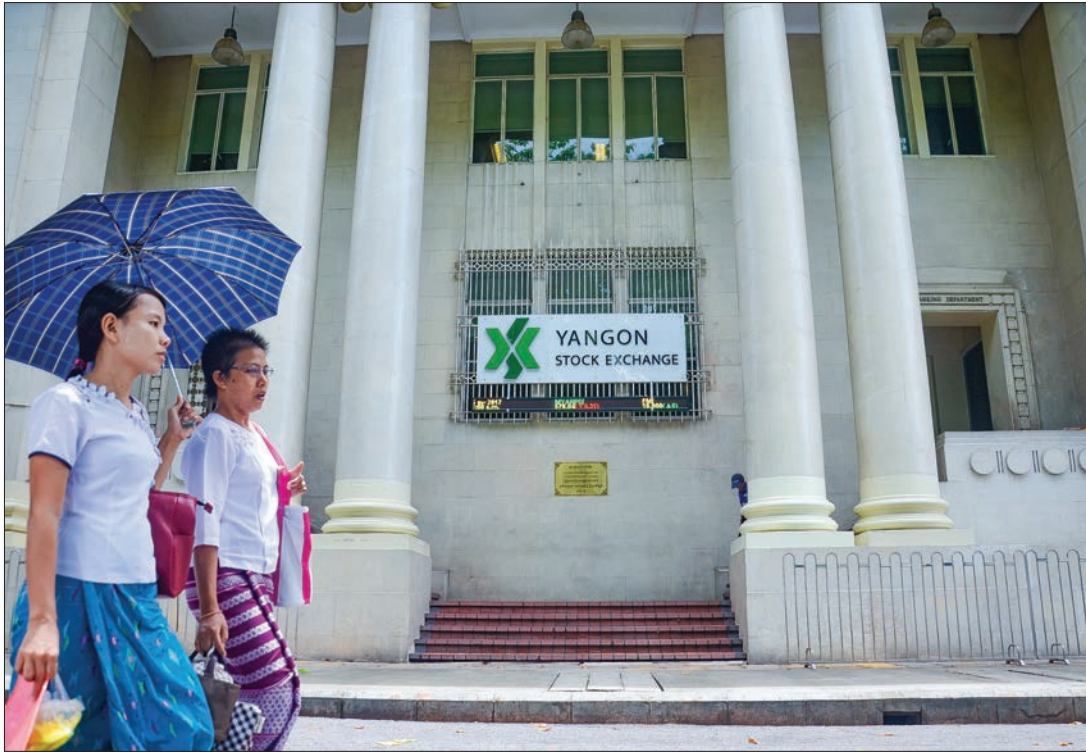
People walk in front of the YSX in downtown Yangon.