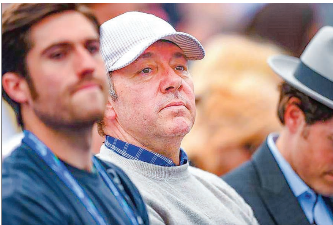
Actor Kevin Spacey.

Spacey, a Tony Award winner for "Lost in Yonkers," stars in the Netflix political drama "House of Cards." He also