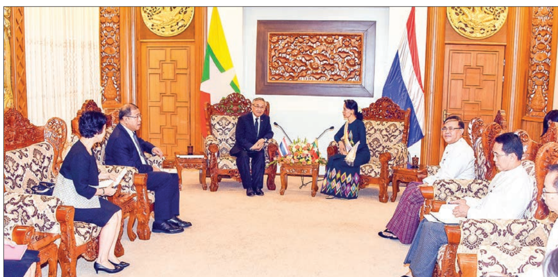
State Counsellor Daw Aung San Suu Kyi holds talks with Minister of Foreign Affairs of the Kingdom of Thailand Mr. Don Pramudwinai in Nay Pyi Taw on 30 October 2017.

During the meeting, they discussed promoting relation and cooperation between the two countries and development of Rakhine State.—Myanmar News Agency