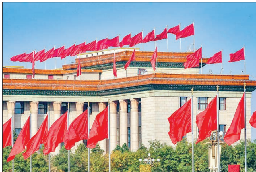
Red flags are seen on the top of the Great Hall of the People during the ongoing 19th National Congress of the Communist Party of China, in Beijing, China on 23 October, 2017.

The report also said former Chongqing Party boss Sun Zhengcai and a group of other top officials ousted for graft, including