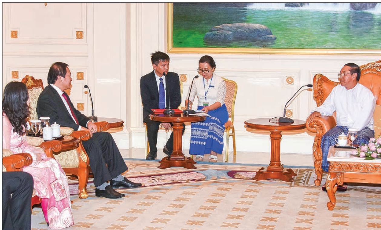
Vice President U Myint Swe holds talks with Mr. Truong Minh Tuan, Minister for Information and Communications of Viet Nam in Nay Pyi Taw on 30 October 2017.