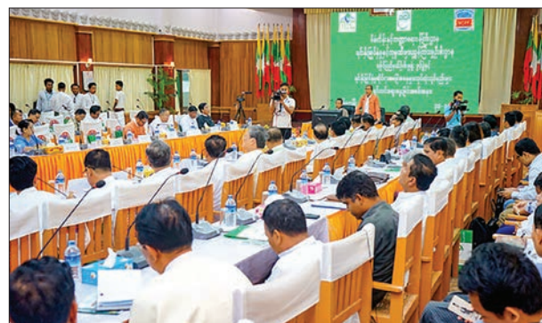
Authorities in Rakhine State hold talks with business men following the opening of Rakhine State Investment and Companies Administration Office.