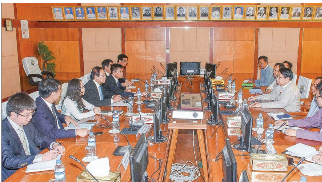
Union Minister for Information Dr Pe Myint receives a delegation led by Mr. Truong Minh Tuan, Minister of Information and Communications of Viet Nam on 30 October 2017.