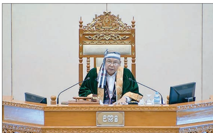
Amyotha Hluttaw Speaker Mahn Win Khaing Than.

Afterward, U Kyaw Lin, Deputy Minister for Construction and U Soe Thein, Deputy