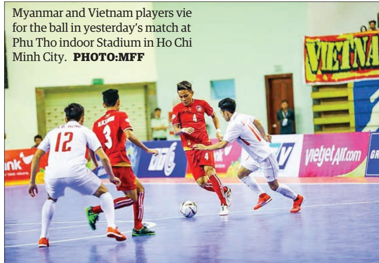
Myanmar and Vietnam players vie for the ball in yesterday's match at Phu Tho indoor Stadium in Ho Chi Minh City.

Victory means Federer trails world number one Rafael Nadal by 1,460 points going into the Paris Masters where 1,000 points are on offer for the champion. Del Potro would have moved into the eighth and final qualifying spot for London had he claimed a third Basel title, but now must reach the semi-finals at least in the French capital to make it to the season-ending tournament.—Reuters ■