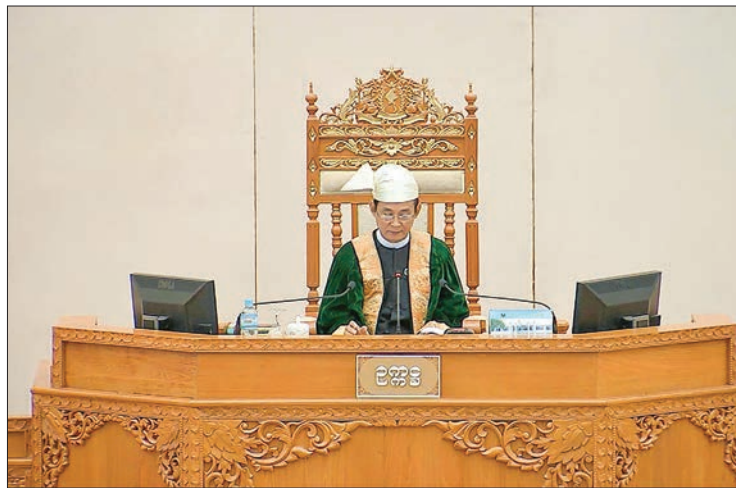
Pyithu Hluttaw Speaker U Win Myint.

As a first step this will be started in Yangon, Mandalay and Nay Pyi Taw. By February 2018, top-level and mid-level tax payers will be able to use this system. By using this system, tax payers will be able to pay and transfer the tax between banks within an hour or min-