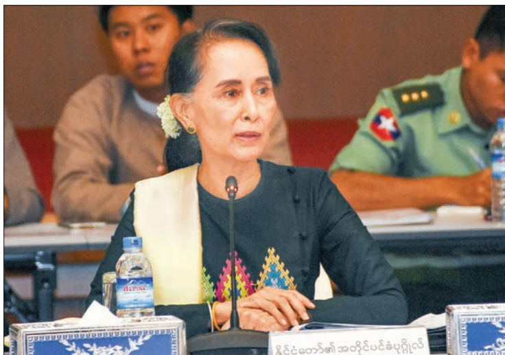
State Counsellor Daw Aung San Suu Kyi speaks at the meeting of the Union Peace Dialogue Joint Committee-UPDJC in Nay Pyi Taw.

State Counsellor Daw Aung San Suu Kyi also stressed the need for drawing up Standard Operating Procedures (SOPs) to be able to implement the agreements effectively and to establish an office for the UPDJC.