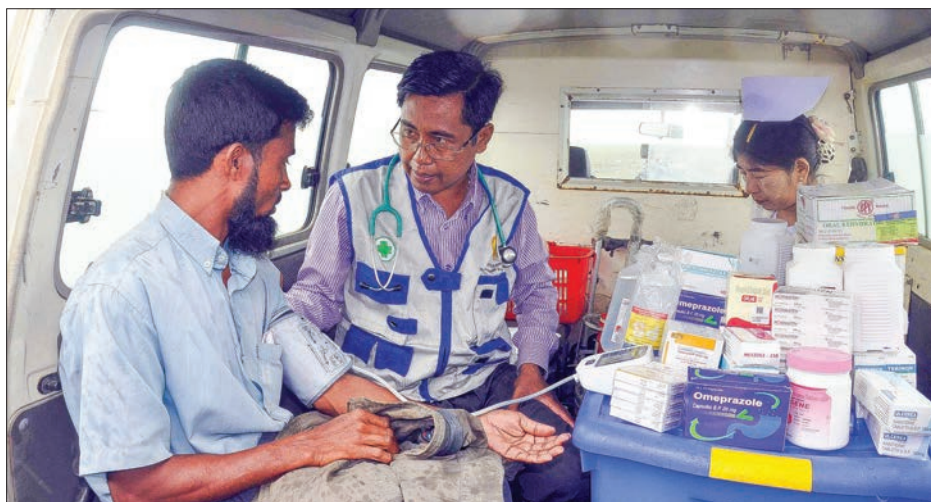
A muslim receives medical checkups before leaving for Bangladesh.

Dr Than Tun Kyaw added, "Our unit is comprised of 10 medical staff