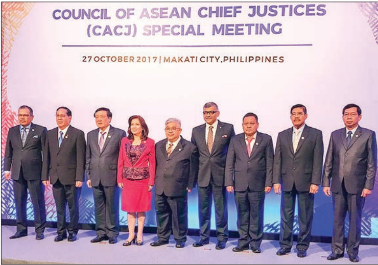
Union Chief Justice U Htun Htun Oo poses for a documentary photo with participants at CACJ Special meeting in Philippines.

es Council and current agendas were also mainly included in the discussion. Then, ASEAN Chief Justices signed the agreements in the Manila declaration and Memorandum of Understanding in relation to the ASEAN Judicial Portal for the implementation of the Internet Portal. Representatives from cooperation meeting were also discussed at the special meeting, it is learnt.—MNA ■