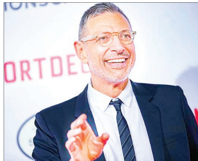
Jeff Goldblum.

Featuring new series regulars Chris Pratt and Bryce Dallas Howard, the film is slated to release on 22 June next year.—PTI ■