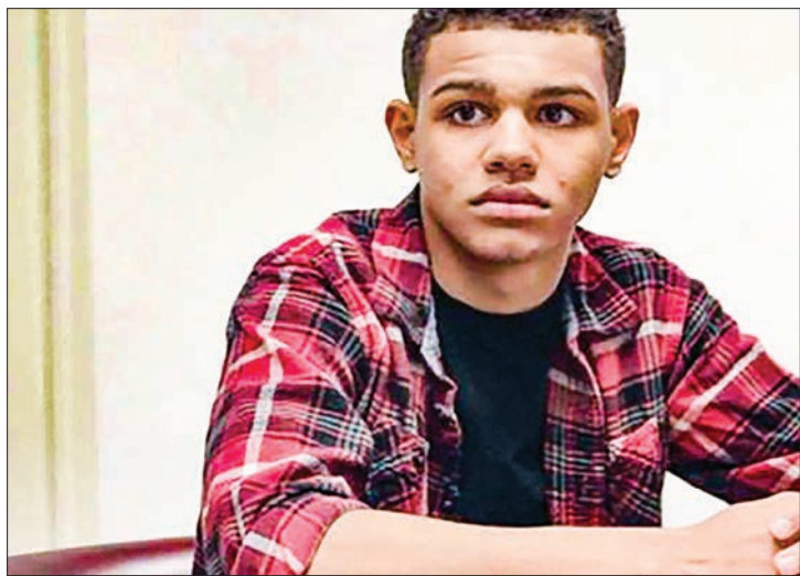
Actor Tyler Cornell.