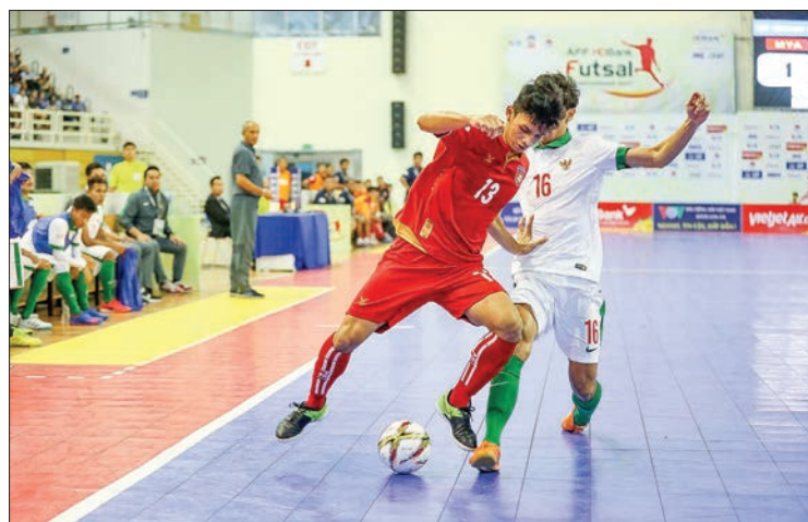
Futsal players from Myanmar and Indonesia vie for the ball in yesterday's match at Phu Tho indoor Stadium in Ho Chi Minh.