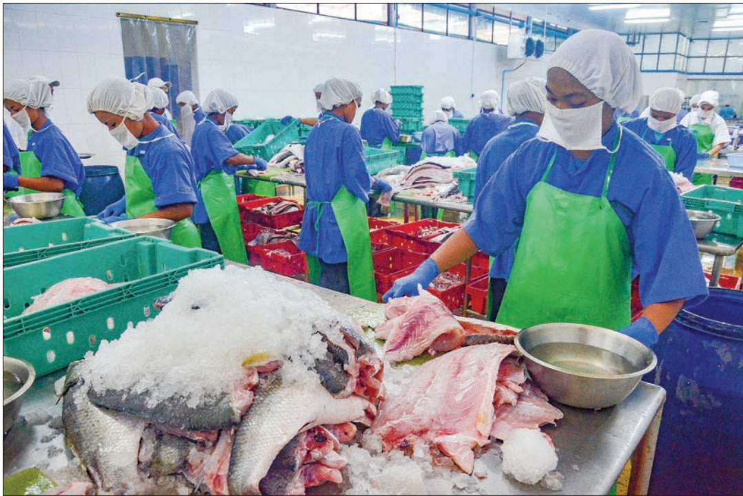
Labourers processing fish at a seafood export factory in Yangon. The export incomes were $328 million from fishery products last fiscal year.