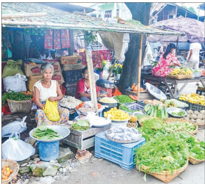
Street vendors selling fresh vegetables and fruits at the market in Maungtaw, Rakhine State.

After the establishment of new villages in the places of burnt-out villages, all the markets will be upgraded. —Thant Zin Win/Naing Lin Kyi ■