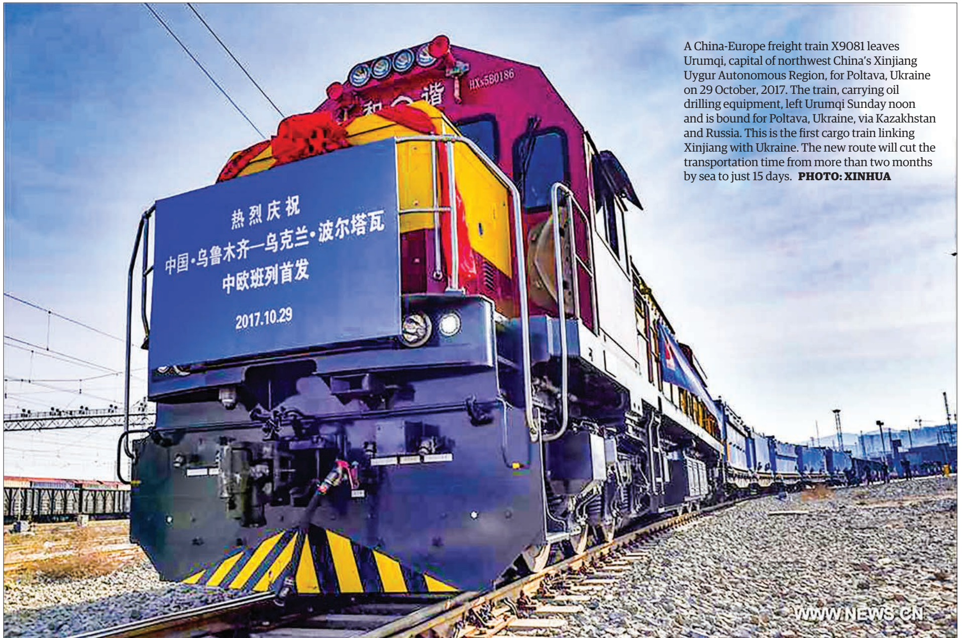
A China-Europe freight train X9081 leaves Urumqi, capital of northwest China's Xinjiang Uygur Autonomous Region, for Poltava, Ukraine on 29 October, 2017. The train, carrying oil drilling equipment, left Urumqi Sunday noon and is bound for Poltava, Ukraine, via Kazakhstan and Russia. This is the first cargo train linking Xinjiang with Ukraine. The new route will cut the transportation time from more than two months by sea to just 15 days.

URUMQI — A new China-Europe freight train route was launched on Sunday in Urumqi, capital of northwest China's Xinjiang Uygur Autonomous Region.