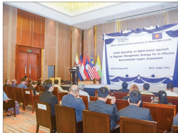
The opening ceremony of AICHR workshop held in Yangon.

THE Opening Ceremony of AICHR Workshop on Rights-based Approach to Regional Management Strategy for an Effective Environment Impact Assessment (EIA) hosted by Myanmar was convened at 8:00 am, 29th October, 2017 in Melia Hotel, Yangon.