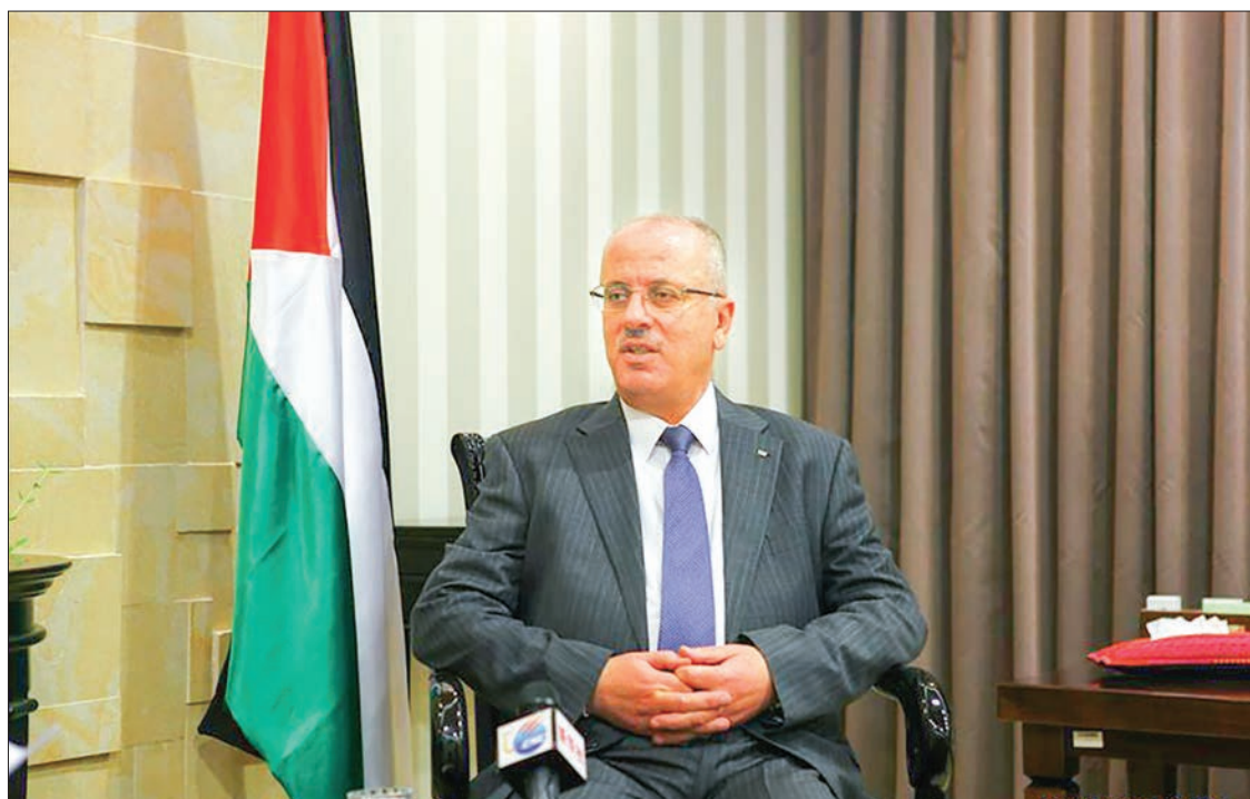
Palestinian Prime Minister Rami Hamdallah receives an exclusive interview by Xinhua in Ramallah on 6 March 2016.

of the sensitivities that some people do have about the Balfour declaration and we recognize that there is more to be done.