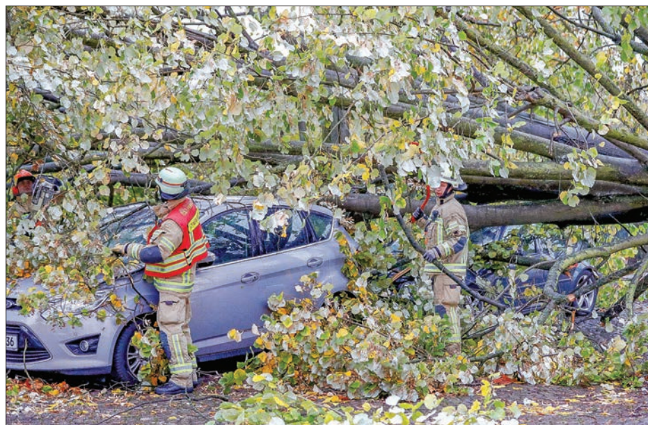
Firefighters are pictured next to a car damaged by a tree during stormy weather caused by storm called "Herwart" in Berlin, Germany on 29 October 2017.

and slowed road traffic, with a fallen tree blocking one highway just outside of the capital, Prague, the website of newspaper Mlada Fronta Dnes reported. Prague Zoo closed because of the winds, but Prague Airport was running without problems, newspaper Lidove Noviny's website reported. The winds also hit Poland, damaging a pipeline at Poland's liquefied natural gas terminal in the port of Swinoujscie. They caused a small leak but no greater damage, according to a spokesman for the state gas pipeline operator, Gaz-System. —Reuters ■