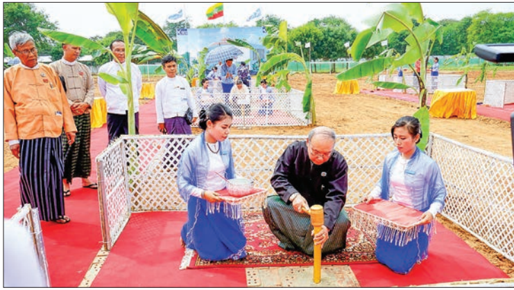
Amyotha Hluttaw Speaker Mahn Win Khaing Than at stake-driving ceremony for main building of the region Hluttaw.