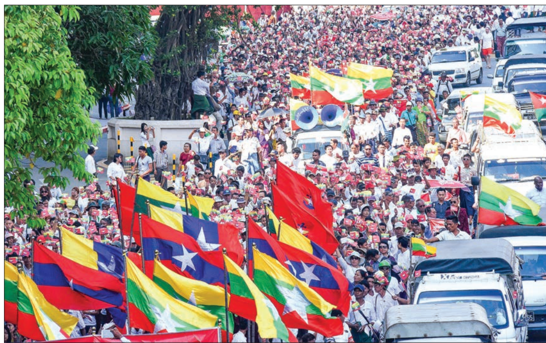
Thousands of participants supporting the Myanmar Tatmadaw and the good service personnel take part in downtown Yangon.

A ceremony to support the Myanmar Tatmadaw and the good service personnel was sponsored by Tatmadaw Lovers Association (Yangon) in front of Maha Bandoola Park near the City hall in Yangon yesterday.