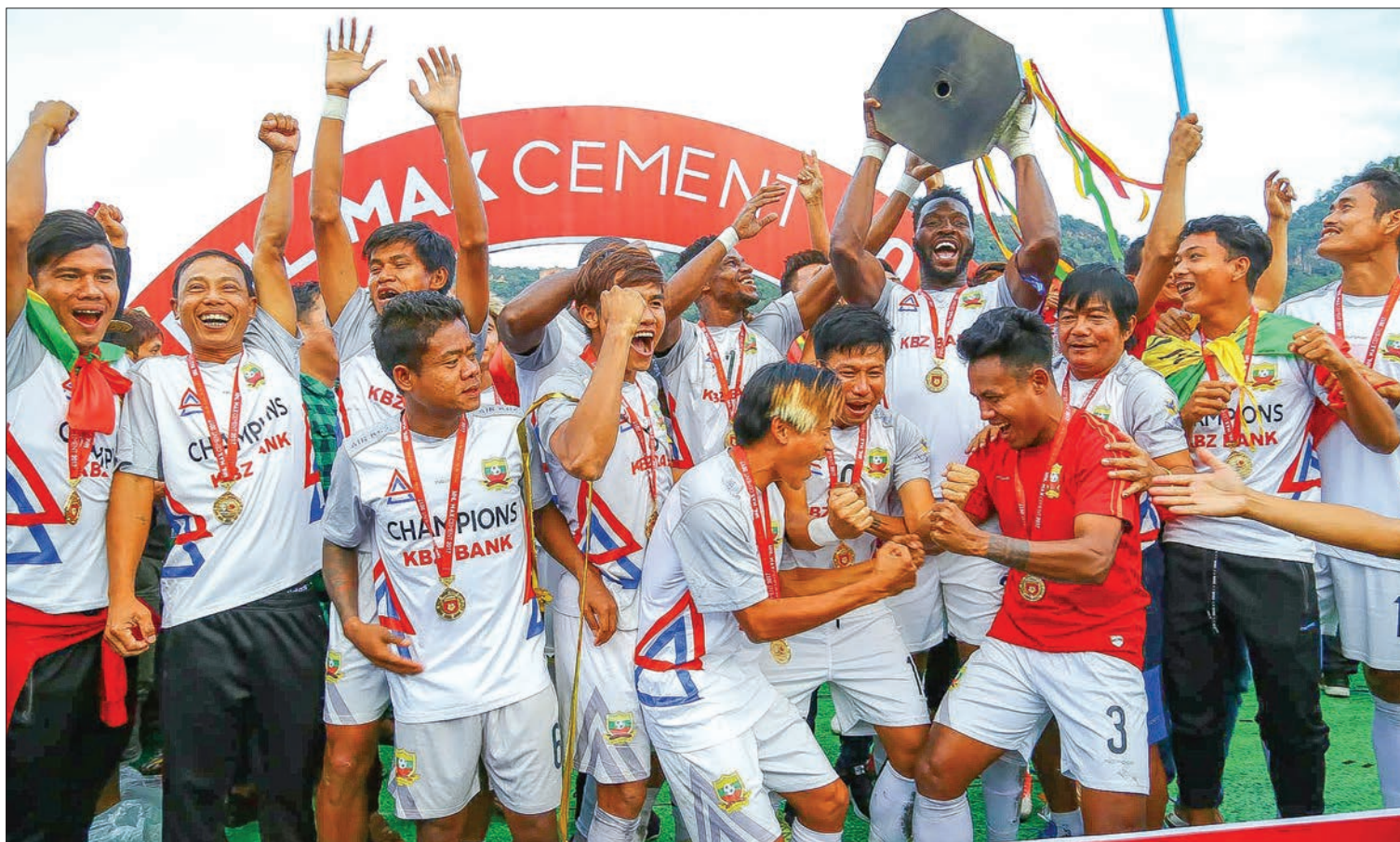
Champion Shan United FC celebrating their victory in Taunggyi Stadium yesterday after winning the MNL Max Cement Cup 2017.