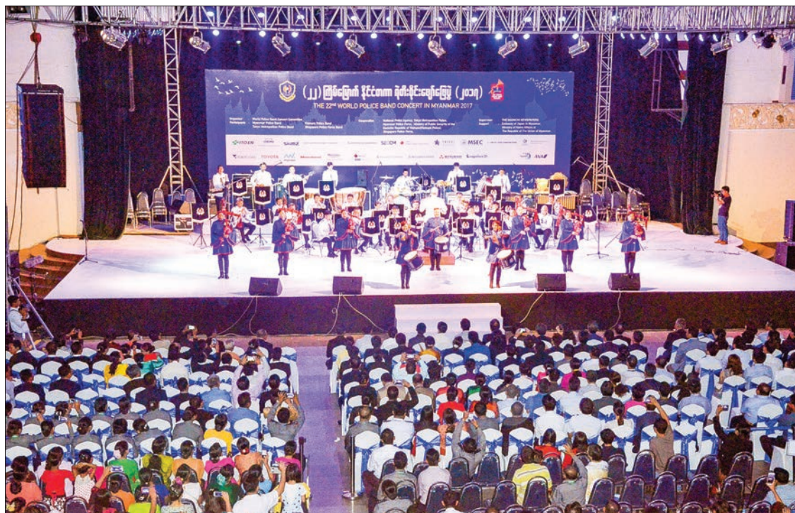
Members of International Police Music Band performing at Myanmar Convention Centre in Yangon on Sunday night.

This kind of concert will enhance trust in the Myanmar Police Force, said U Myint Wai of Mayangon.—Myanmar News Agency