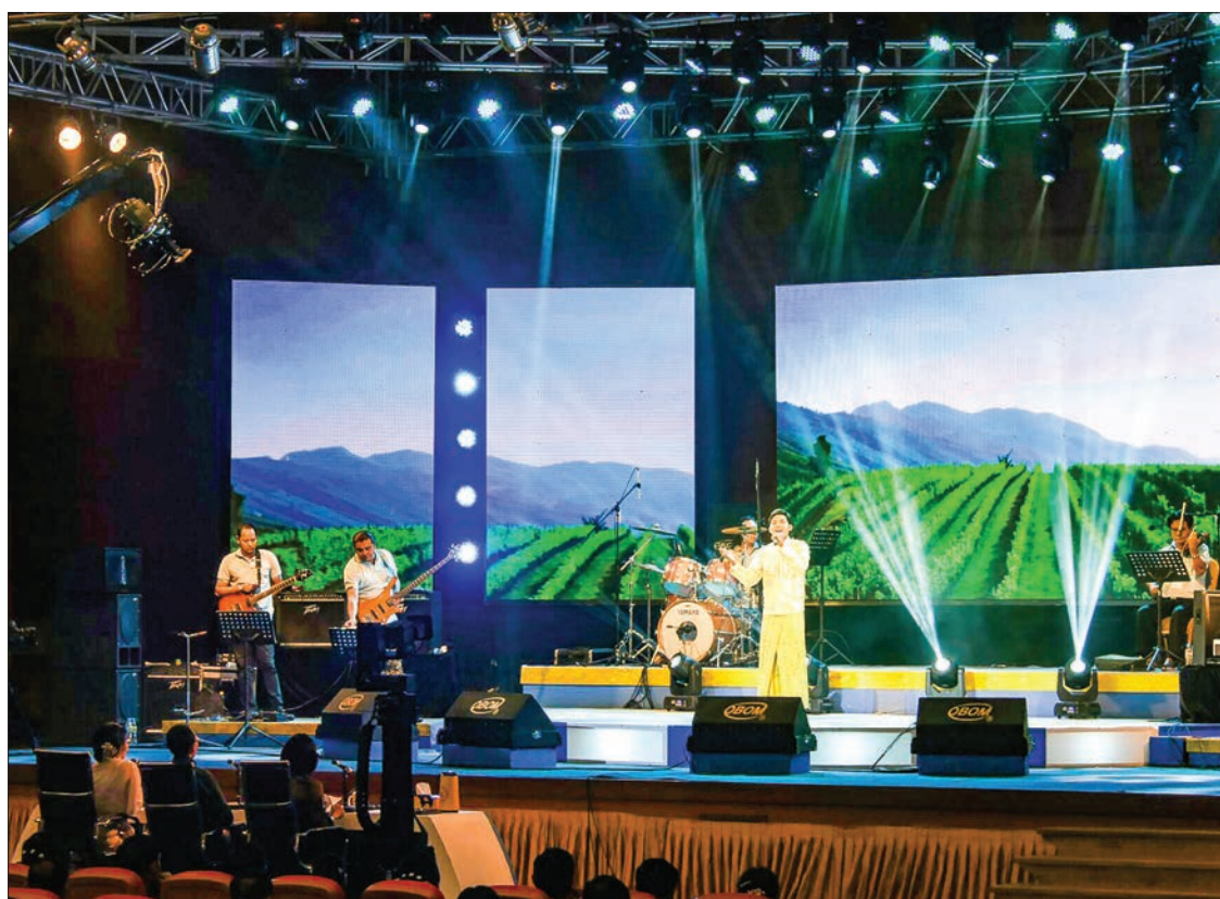
Contestants performing music at level-2 competition at peace music festival in Nay Pyi Taw.

The 10 contestants will have to take part in the Grand Final for first, second and third and seven consolation prizes. The first prize winner will get K 30 million, the second prize winner K 20 million, the third prize winner K 10 million and each consolation prize winner K 3 million.