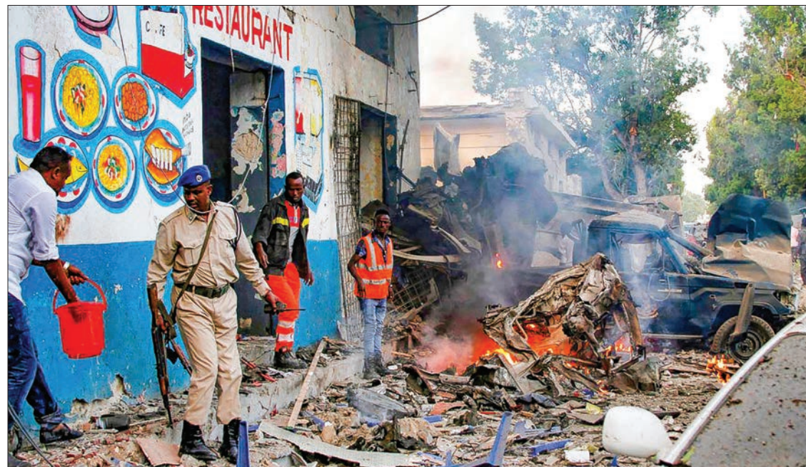
Somali security officers secure the scene of a suicide car bomb explosion, at the gate of Naso Hablod Two Hotel in Hamarweyne district of Mogadishu, Somalia on 28 October 2017.

Islamist group al Shabaab claimed the attack on Saturday. They want to overthrow the weak, UN-backed government and impose a strict form of Islamic law. — Reuters ■