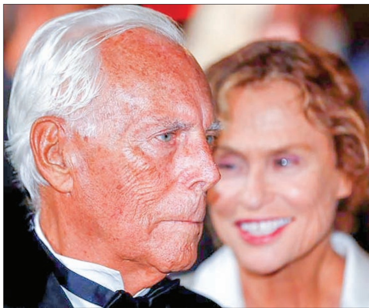
Italian designer Giorgio Armani arrives at the "Green carpet Fashion Awards" event during the Milan Fashion Week in Milan, Italy on 24 September, 2017.