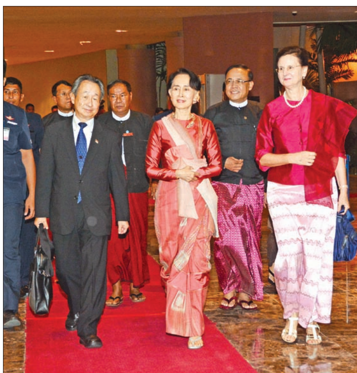
State Counsellor Daw Aung San Suu Kyi arrives to attend 72 nd Anniversary of the United Nations Day in Nay Pyi Taw.

Daw Aung San Suu Kyi, State Counsellor and Union