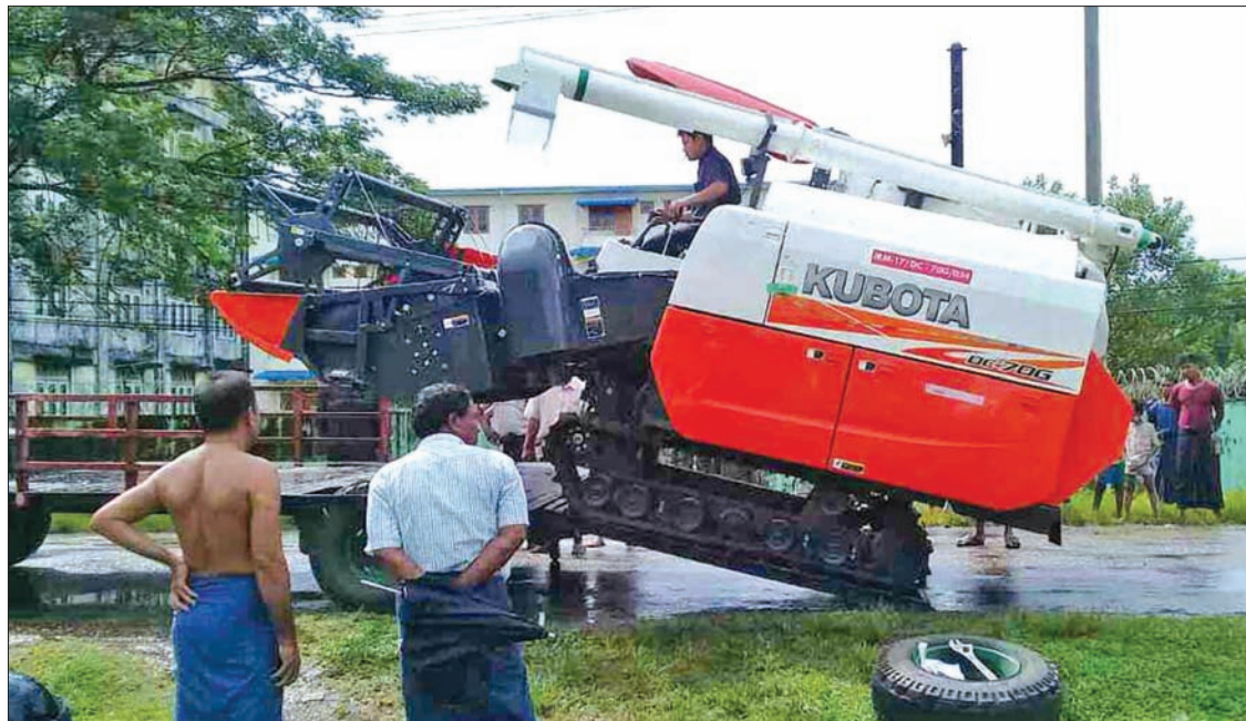
Agriculture Mechanisation Departments provide twenty-four combine harvesting machines to harvest paddy crops in Rakhine State.

anisation Department will open seven stations to harvest the ripe paddy crops of