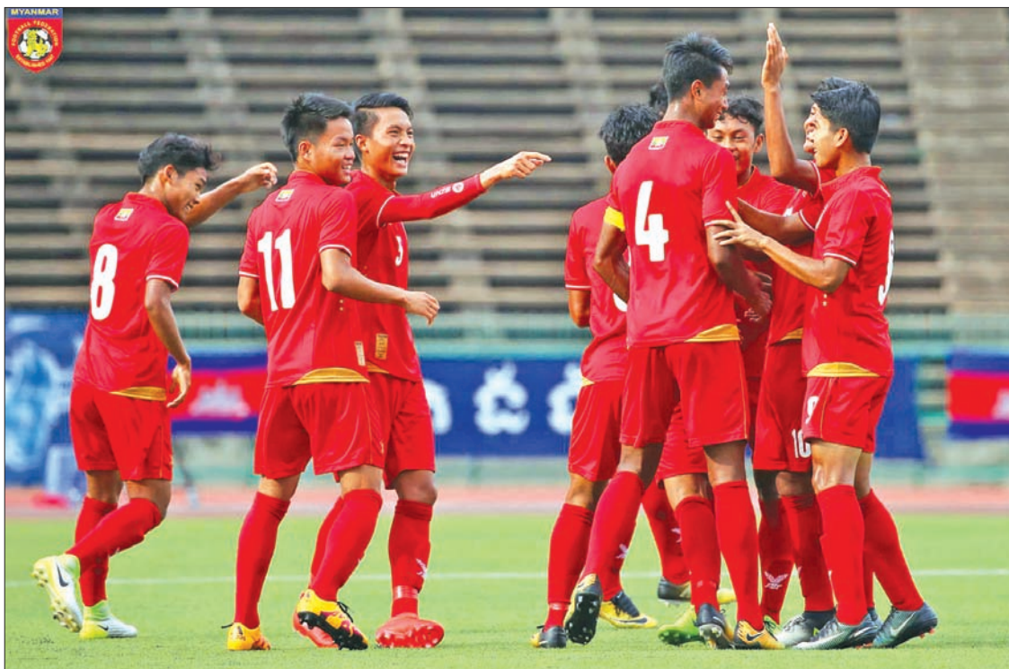
Myanmar U-19 football players enjoy after scoring goal at yesterday match against the Philippines.

Myanmar dominated the team from the Philippines, seemingly scoring at will. Upcoming matches for Myanmar are against Cambodia on 26 October and China PR on 28 October. ■