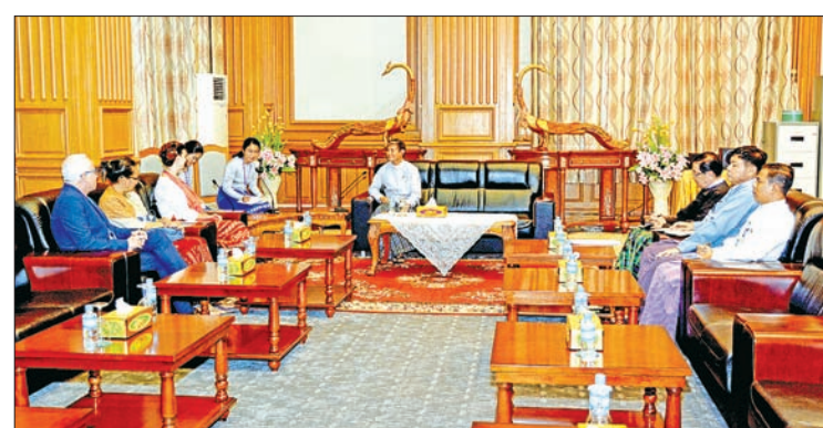
Pyithu Hluttaw Speaker U Win Myint holds talks with UN Resident Coordinator Ms. Renata Dessallien in Nay Pyi Taw.