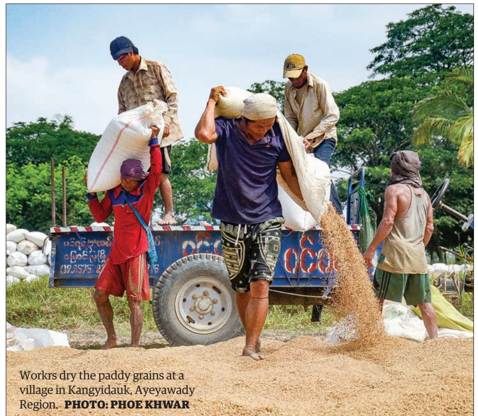
Workers dry the paddy grains at a village in Kangyidauk, Ayeyawady Region.