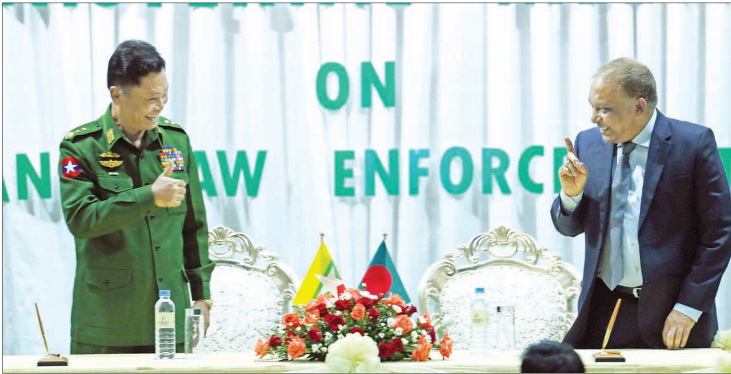
Union Minister for Home Affairs Lt-Gen Kyaw Swe (Left) gives thumbs up to his Bangladeshi counterpart Mr. Asaduzzaman Khan following a signing in Nay Pyi Taw agreeing to 10 points of bilateral cooperation between the two neighbouring countries.