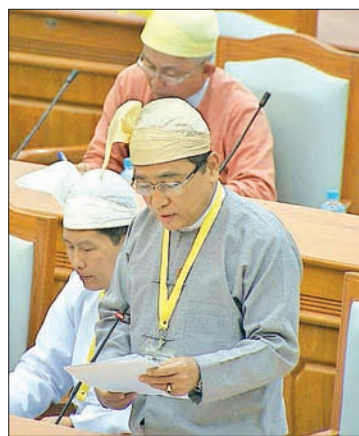
Union Minister for Social Welfare, Relief and Resettlement Dr Win Myat Aye.

will be used for the 66 KV power lines and substations projects. Ks4 billion for the 66 KV power line and substation to be constructed in this fiscal year were being applied to be included in the emergency fund. Once the hluttaw approves the request for emergency funds, construction work will be implemented quickly, said the Deputy Minister.