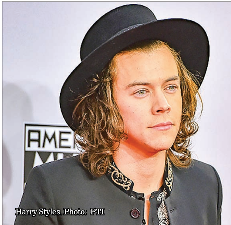
Harry Styles.

LOS ANGELES — Harry Styles was inappropriately touched while he was performing at Hollywood Bowl's charity event.