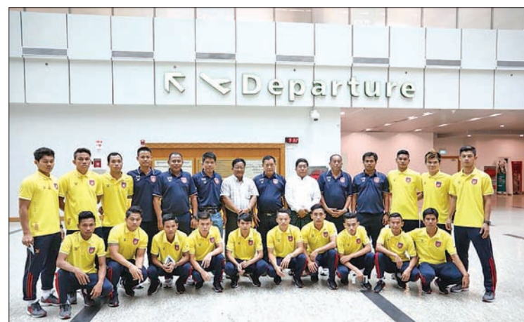
Myanmar national futsal team and coaches poses for documentary photo at the Yangon International Airport before they leave for Ho Chi Minh.

All group matches will be held from 26 to 30 October, and