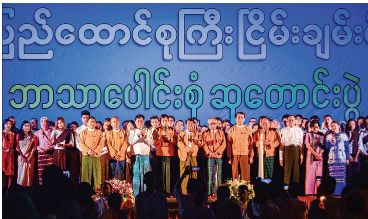
People of different faiths pray for peace in Myanmar at the 3rd interfaith rally.

In Maungtau township, there are 67 cows and 298 goats. In Pantaw Pyin, there are 27 cows and 135 goats. In Khontine, there are 17 cows and 95 goats. And in Ngakhura, there are 23 cows and 68 goats. All are being fed and are receiving medical care, it was learnt.—Myanmar News Agency ■