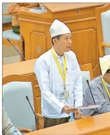
Deputy Minister for Electricity and Energy Dr Tun Naing.

A maximum of about nine months is required for tendering, material collection and construction of these works. A request for emergency funds was made as these works are to be completed by March 2018. Once these works are completed Yathedaung, Buthidaung and Maungtaung towns as well as 44 nearby villages will have 24 hours electricity and will support the regional security and develop-