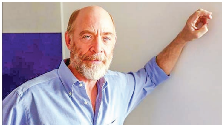
Oscar-winning actor JK Simmons.

LOS ANGELES — Actor J K Simmons has revealed that the sequel of "Justice League" is already in development.