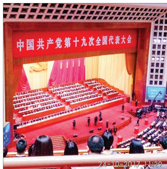
The closing ceremony of the 19 th National Congress of the Communist Party of China being held in Beijing, China.

The Congress takes place every five years. The 19th National Congress opened on 18 October. —Myanmar News Agency