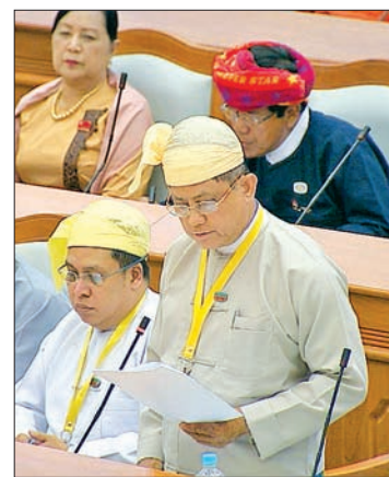
U Maung Maung Win, Deputy Minister for Planning and Finance.

U Maung Maung Win, Deputy Minister for Planning and Finance said, "Refilling the deficit of the State Budget with local and foreign loans is a procedure exercised by global countries. In Myanmar also, successive governments refilled additional budget deficits with local loans after calculating foreign loans and subsidies. Previously as well, annual loans were received from the Central Bank of Myanmar, but it was decided and managed by the Government only. Now, if the the Central Bank of Myanmar wants to lend money to the