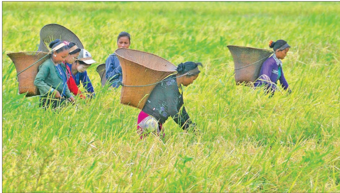
Ethnic women harvesting rice in a paddy field in Maungtau on 23 October 2017.

"There are 30,000 to 40,000 acres of paddy each in Buthidaung, Maungtau and Yathedaung townships. As a priority activity, we will provide grain machines, tractors and grain dryers. We will sell the fertilizer at a cheap cost. Also, we will purchase the paddy, setting a price," said U Ye Min Aung.