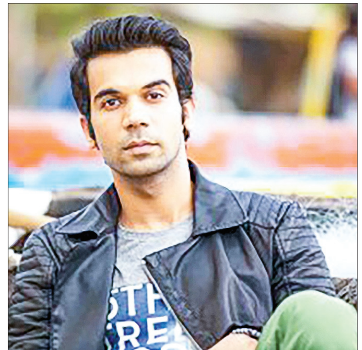
Rajkummar Rao. PHOTO: PTI

"Justice League" opes in theatres on 17 November. —PTI ■