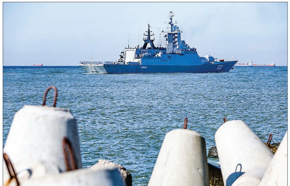
Boiky corvette.

Place : Office no. 27, Ground Floor, Meeting Room, Ministry of Electricity and Energy