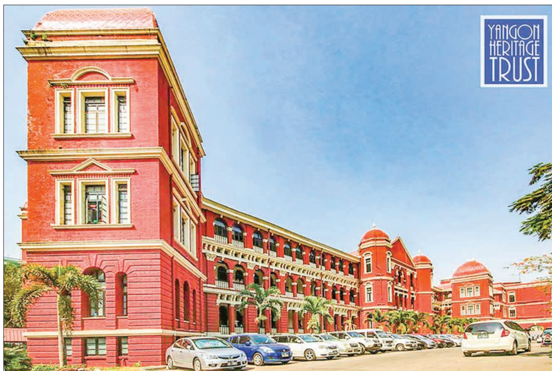
The Yangon General Hospital in downtown Yangon accepts the commemorative Yangon City Heritage Blue Plaque on 24 October 2017.