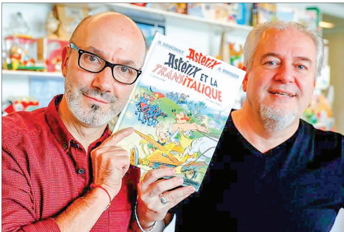
Author Jean-Yves Ferri (L) and illustrator Didier Conrad (R) pose with a copy of their new comic album "Asterix et la Transitalique" (Asterix and the Chariot Race) after an interview in Vanves near Paris, France on 17 October, 2017, the latest in the series created by illustrator Albert Uderzo and writer Rene Goscinny in 1959.

The original books, written by Rene Goscinny and illustrated