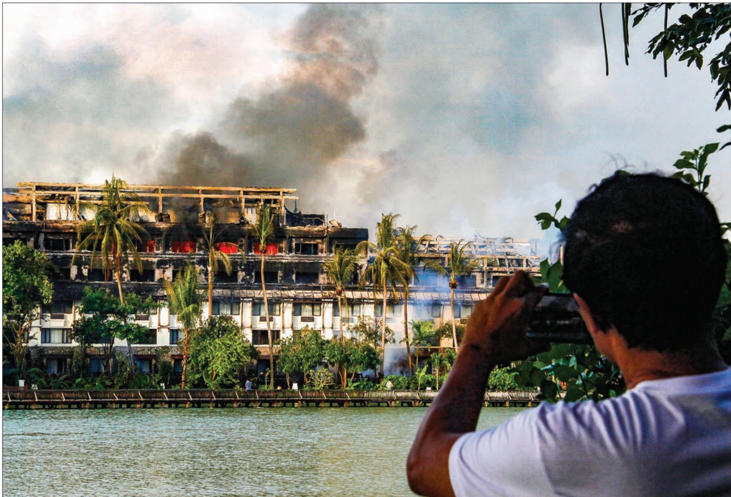
A man takes photos of the fire at Kandawgyi Palace Hotel yesterday morning as flames were still visible on upper floors.