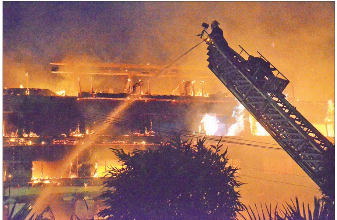
Firefighters work to extinguish a fire at Kandawgyi Palace hotel in Yangon on 19 October 2017.

Of the hotel's 185 rooms, 140 were burnt down. Only 40 rooms on the ground floor and first floor remain. An adjoining building and a nearby Japa-