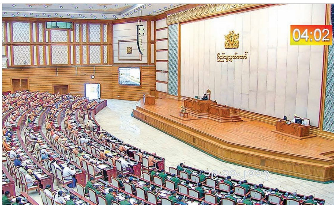
Pyithu Hluttaw session being convened in Nay Pyi Taw yesterday.

“National citizens are the ones among 13 countries that enjoy the fewest benefits from extraction of natural resources. The motion has been put forward with a view to applying pressure for reaching an all-inclusive development state and effective management of natural resources. It will be more beneficial use for the national development for our country to carry out things to be done in accord with the standards, instructions and