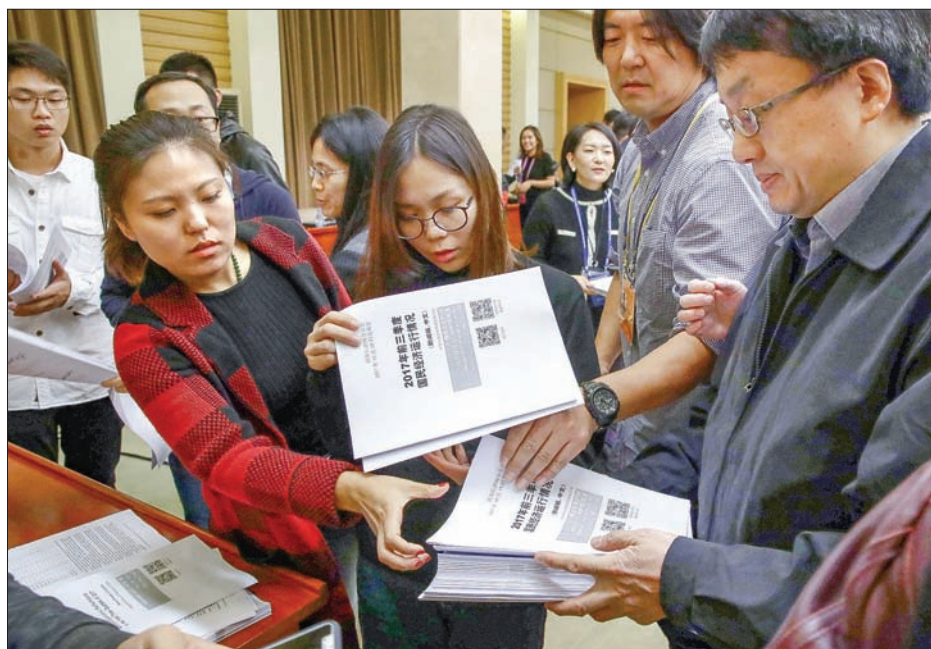
Reporters receive China's July-September gross domestic product data, released on 19 October, 2017, in Beijing.

The figure is down from the previous two quarters' expansion of 6.9 per cent in gross domestic product. This is the first slowdown marked since the first quarter of 2016, when its GDP growth slipped to 6.7 per cent from 6.8 per cent. However, the third-quarter performance is still much better than the Chinese government's GDP growth target this year of around 6.5 per cent, after its economy expanded 6.7 per cent in 2016 — the weakest pace in 26 years.