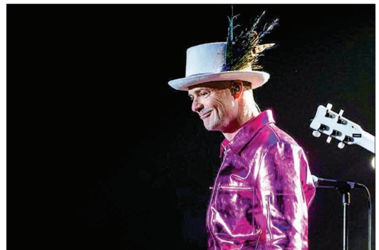
Tragically Hip lead singer Gord Downie performs at the Save-on-Foods Memorial Centre to kick off the band's latest "Man Machine Poem" tour in light of Downie's brain cancer diagnosis, in Victoria, BC, Canada on 22 July, 2016.

Downie had become an outspoken supporter of Canada's indigenous people, penning songs about the painful legacy of colonialism and urging Canadians towards reconciliation. —Reuters ■