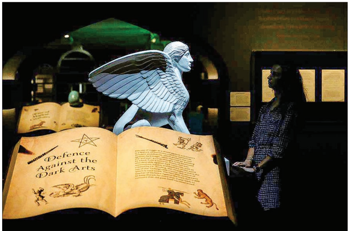
A gallery assistant poses for photographs during the press preview of the exhibition "Harry Potter: A History of Magic" at the British Library in London, Britain on 18 October, 2017.

The seven Harry Potter books have been translated into 68 languages and have sold more than 400 million copies worldwide, Rowling's publishers say.