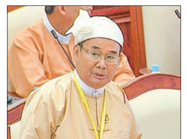
Union Minister U Ohn Win.