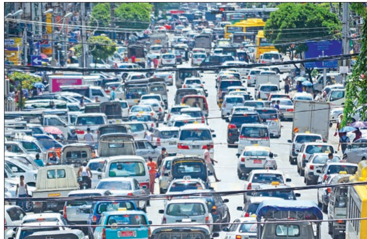
Vehicles seen in downtown Yangon.

According to new vehicle import policy, model year 2014 would be the oldest cars allowed for the vehicle import in 2018. Also, only vehicles with left-hand drive are allowed to import un-