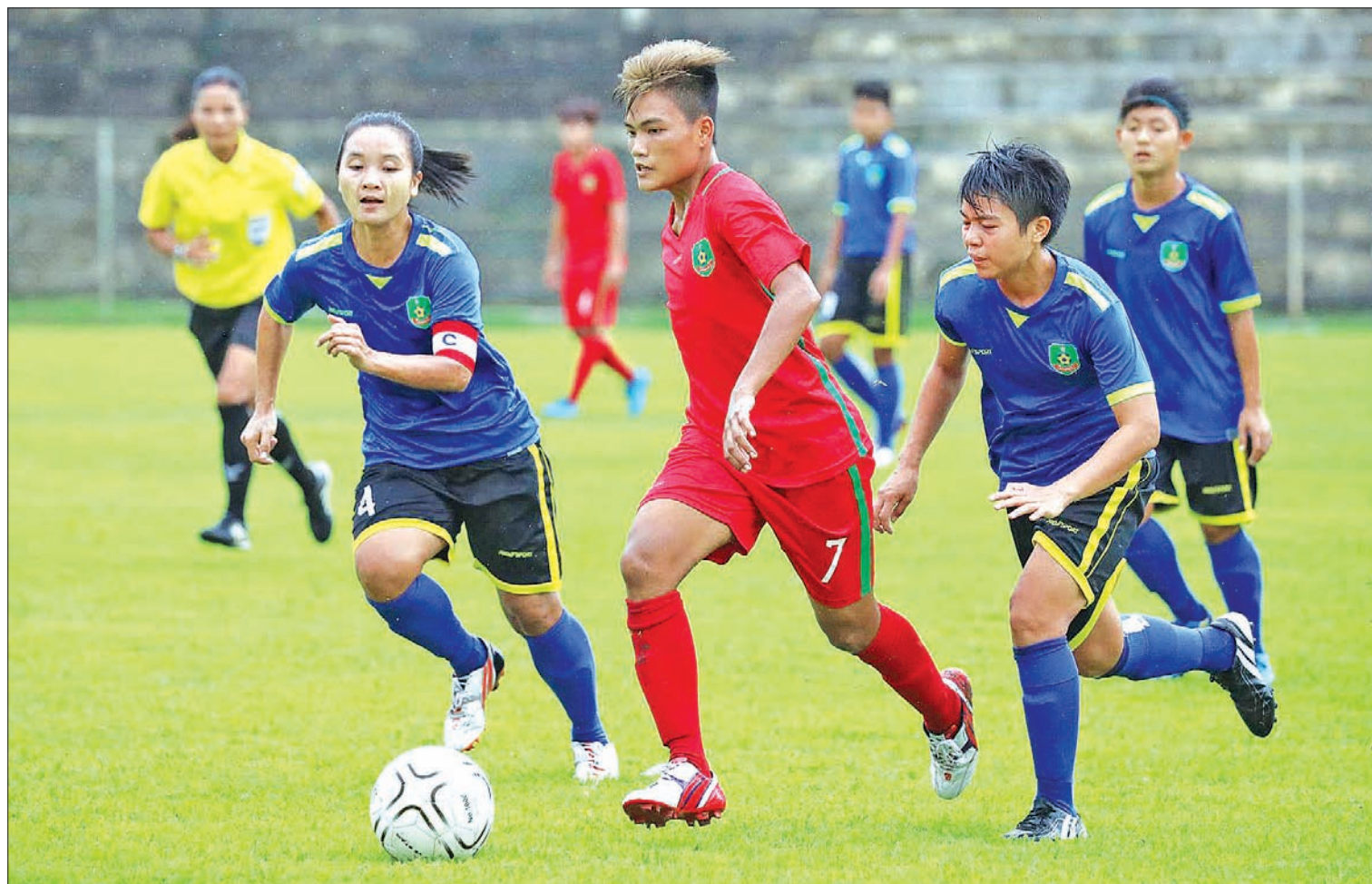
Players from Gandamar and Myawaddy vies for the ball in yesterday's match at Padonmar Stadium in Yangon.