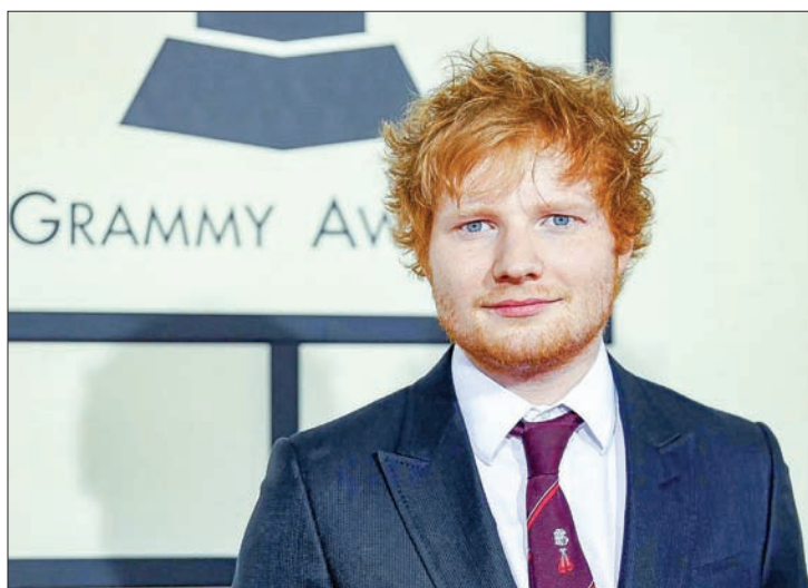
Singer Ed Sheeran.