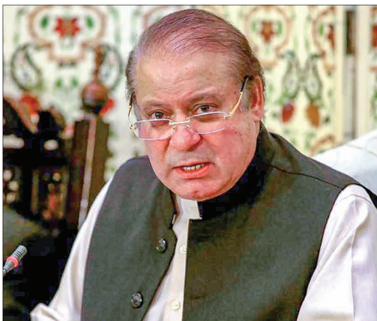
Pakistan's former prime minister Nawaz Sharif.

A Reuters witness in court said Sharif, his daughter Maryam, as well as her husband Muhammad Safdar, had all been