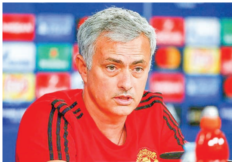
Manchester United manager Jose Mourinho.

"Sometimes I feel being good defensively is a crime, but that is a way of getting results. We are one point from qualifying and one victory away from win-