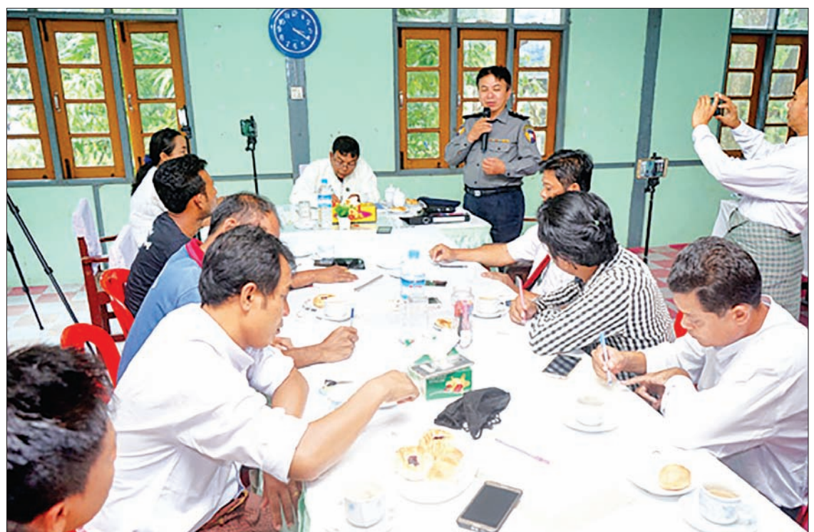
Authorities in Sittway meet with local media personnel.

The head of Rakhine State's Information and Public Relations Department, police officials and journalists representing print and broadcast media including Eleven, RFA, SkyNet, News Watch, DVB, MCN, Irrawaddy, Narinjara and Rakhine Gazette participated in the meeting. ■