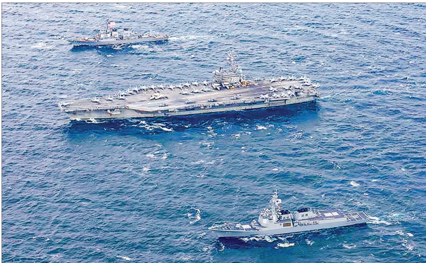
The Navy's forward-deployed aircraft carrier USS Ronald Reagan and the forward-deployed Arleigh Burke-class destroyer USS Stethem steam alongside ships from the Republic of Korea Navy in the waters east of the Korean Peninsula on 18 October, 2017.