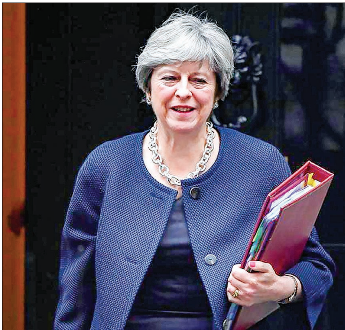
Britain's Prime Minister Theresa May leaves 10 Downing Street in London, Britain on 18 October, 2017.

Offering concessions, May will say that EU citizens settling in Britain will no longer need to have Comprehensive Sickness Insurance, as they currently