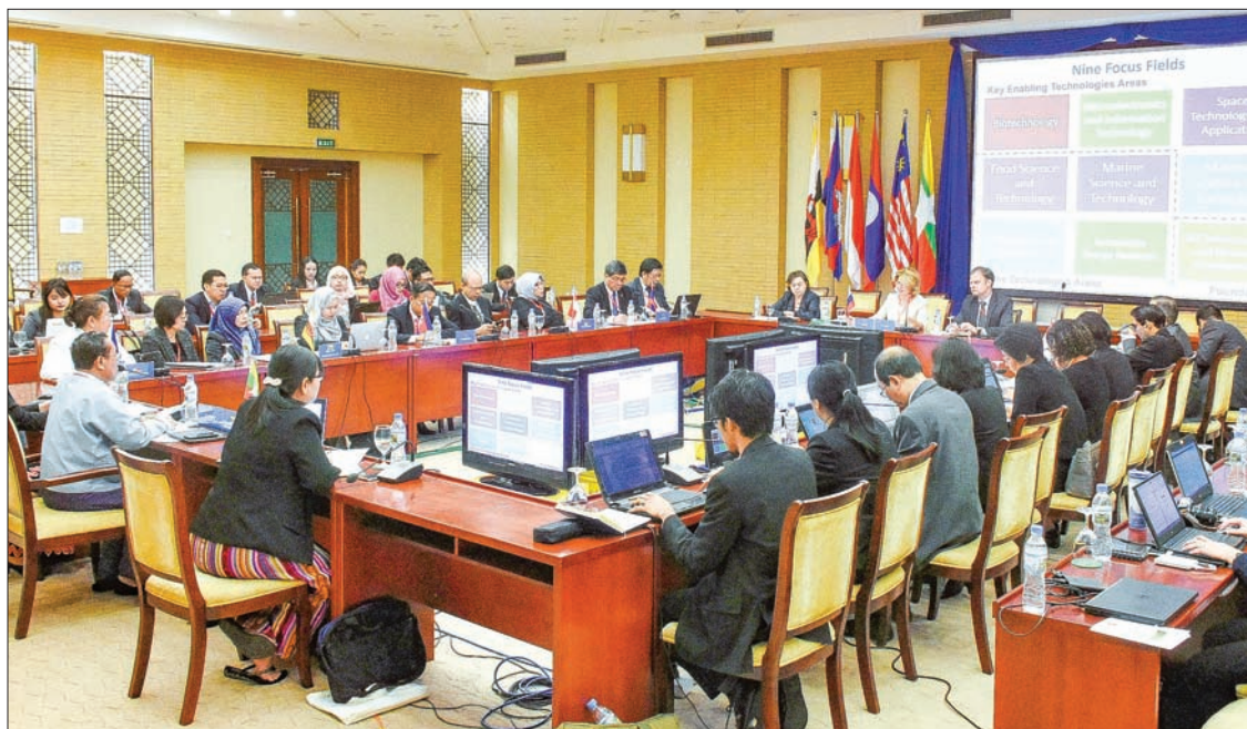
The coordination meeting between the ASEAN Committee on Science and Technology (COST) and Russia held in progress at hall of MICC-2 in Nay Pyi Taw.