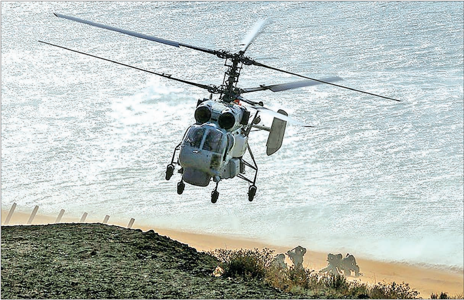
The helicopters have received upgraded onboard radio-electronic equipment and a search system.