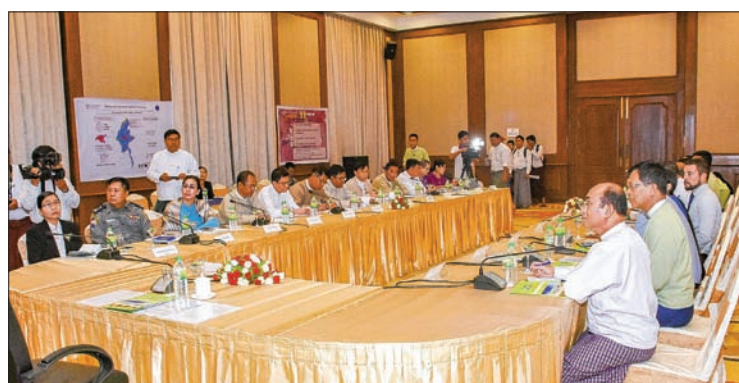
Officials discuss collecting data on animal population.

The Union Minister said the animal census could not be conducted successfully simply by having time, manpower and technology. The work can be successfully conducted by the Livestock Breeding and Veterinary Department with the support of