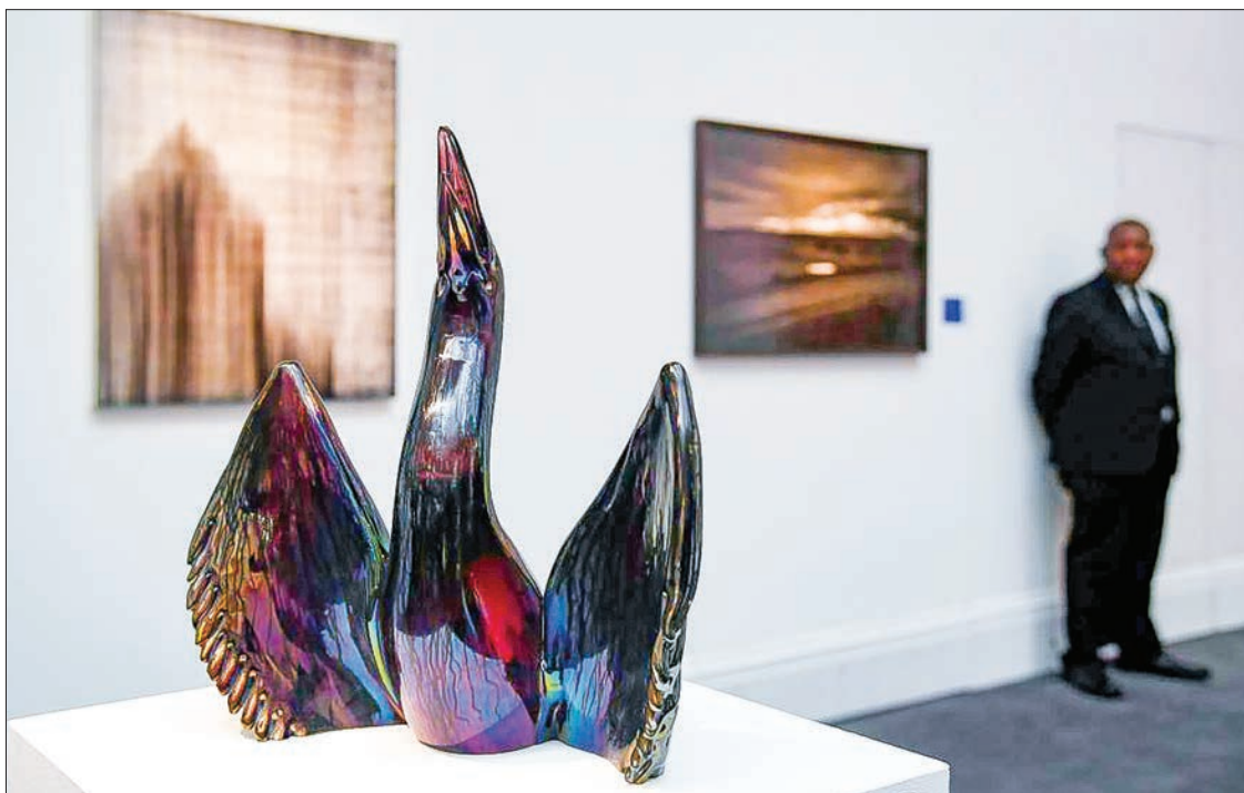
The Sculpture “Black Phoenix” by Paul Fryer which forms parts of a forthcoming charity auction for the survivors of the London Grenfell Tower fire, at Sotheby's in London, Britain on 12 October, 2017.

The most valuable artwork for sale is “Freischwimmer 193” by Wolfgang Tillmans, a very large green print. The estimated price range is 120,000 to 180,000 pounds. —Reuters ■