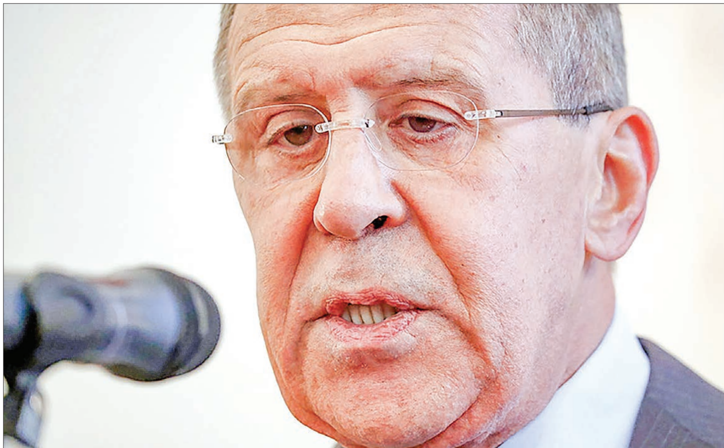
Russian Foreign Minister Sergey Lavrov.

SOCHI — The world community is unable to unite in the war on terror now since some states are pursuing their own geopolitical goals, Russian Foreign Minister Sergey Lavrov said on Monday during the Festival of Youth and Students in Sochi.