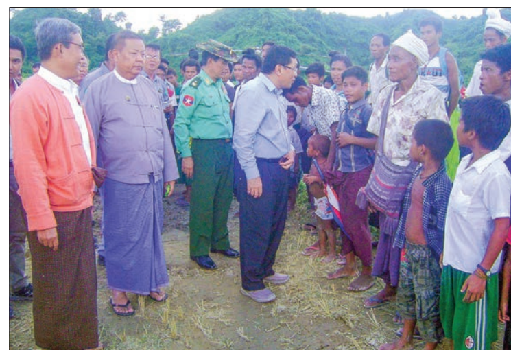
Union Minister Dr Win Myat Aye meets with villagers to provide humanitarian assistance in Maungtaw.

The Union Minister and party went on to Pantawpyin