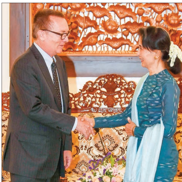
State Counsellor Daw Aung San Suu Kyi shakes hands with Mr. Jeffrey Feltman in Nay Pyi Taw.