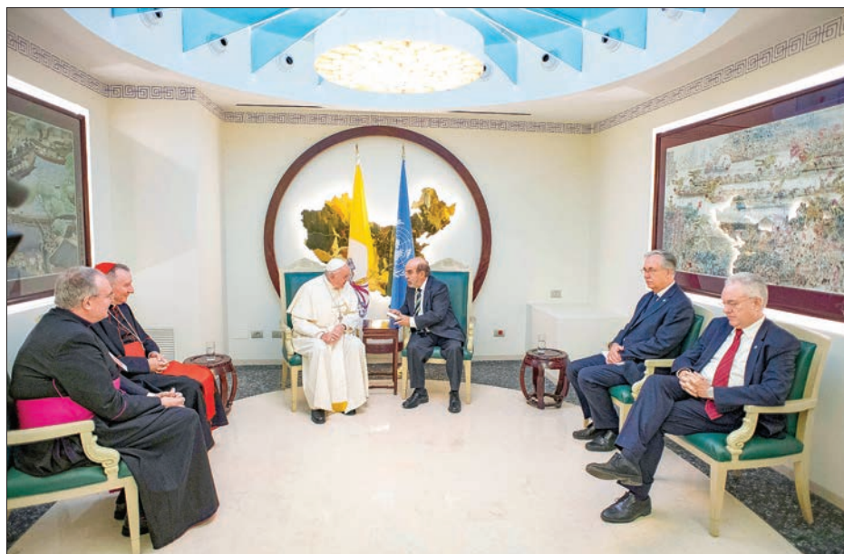
Pope Francis talks with Food Agriculture Organisation (FAO) Director General Jose Graziano da Silva during his visit at the FAO headquarters in Rome, Italy on 16 October, 2017.

“Thanks to scientific knowledge, we know how