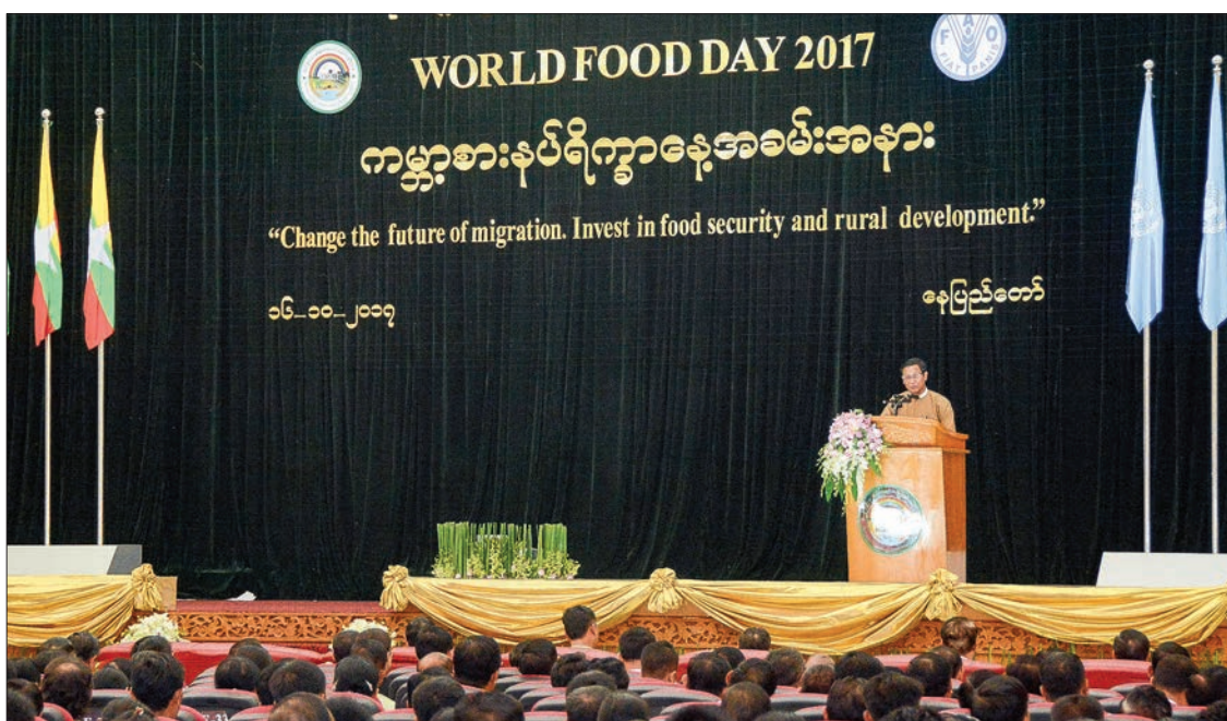
Vice President U Henry Van Thio addresses the ceremony to mark World Food Day 2017 in Zeyathiri Township, Nay Pyi Taw on 16 October 2017.

ricultural sector of developing countries is over 20% of the total economic breakdown due to the climate change and natural disasters.