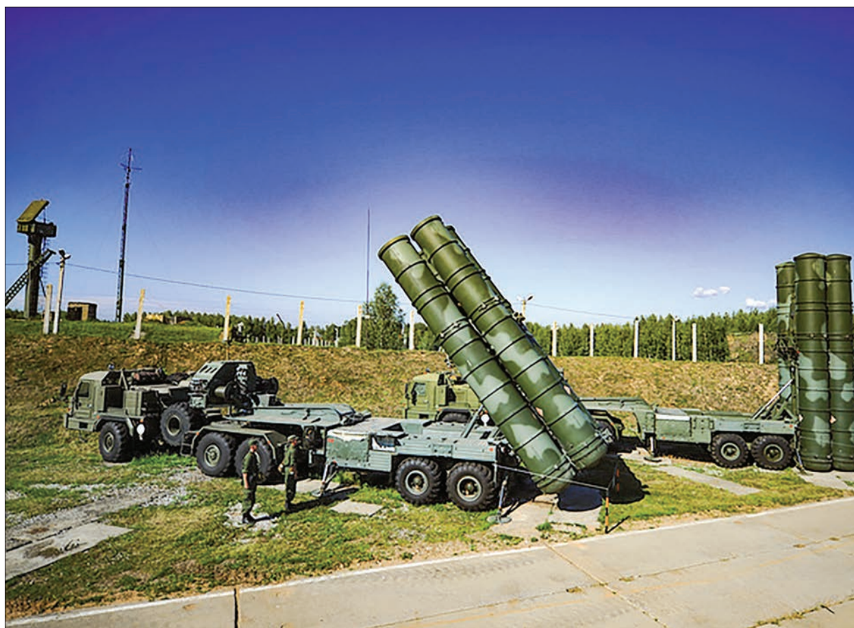
S-400 air defense systems near Moscow.