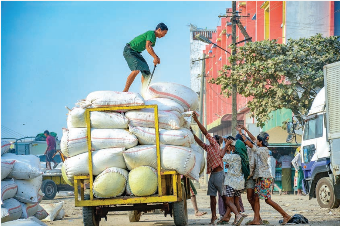
Workers unloading rice bags from the vehicle.