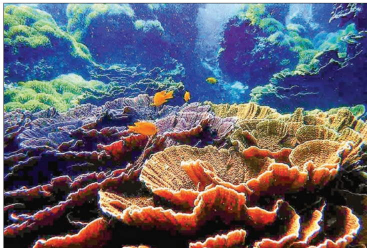
Colorful fish, corals and sponges on the coral reef in Kawthoung, Taninthayi Region.

To accommodate increasing number of visitors to the Myeik Archipelago, more than 200 hotel rooms will be added in the coming high season starting in