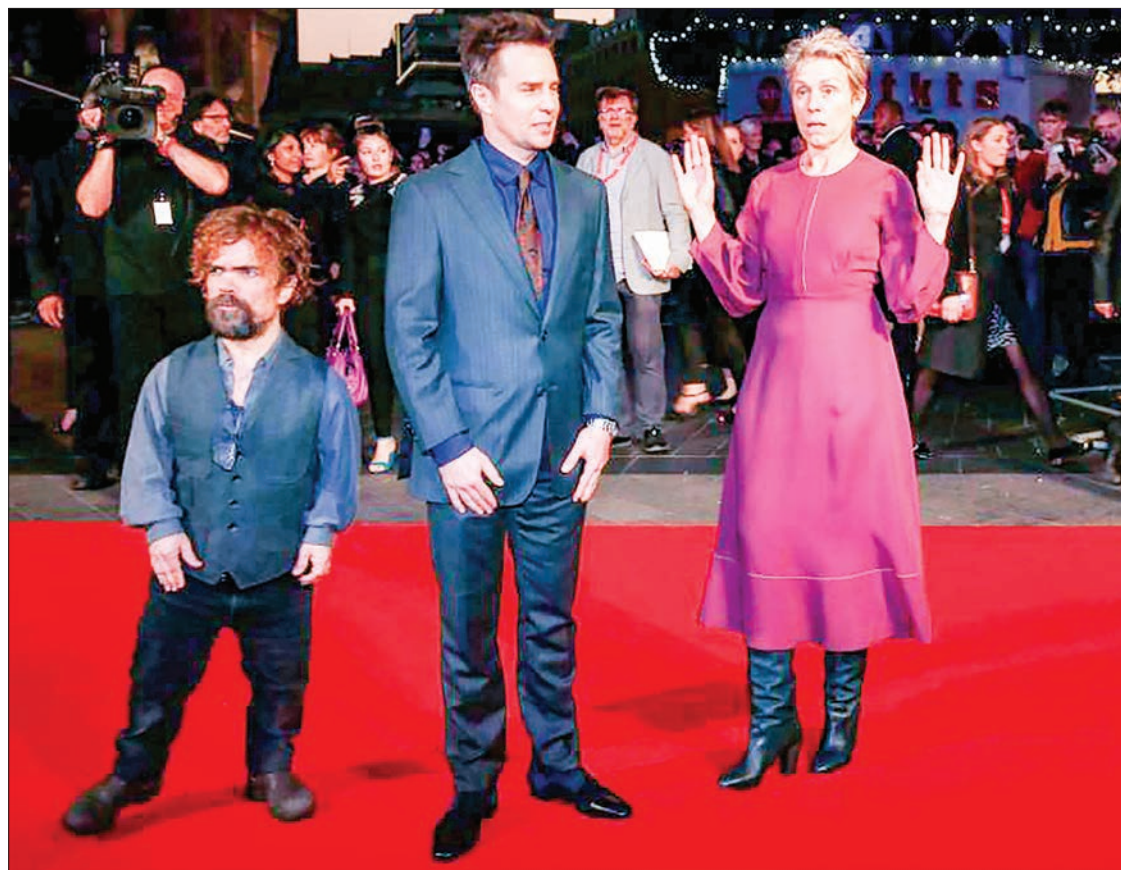
Actors Peter Dinklage, Sam Rockwell and Francis McDormand arrive for the UK premiere screening of “Three Billboards Outside Ebbing, Missouri”, on the closing night of the British Film Institute (BFI) London Film Festival at the Odeon, Leicester Square in central London, Britain on 15 October, 2107.

In “Three Billboards Outside Ebbing”, her character de-