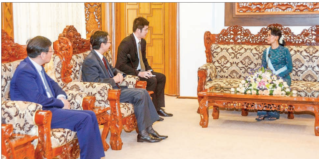
State Counsellor Daw Aung San Suu Kyi meets with Mr. Sun Guoxiang, Special Envoy for Asian Affairs of the Ministry of Foreign Affairs of the People's Republic of China in Nay Pyi Taw on 16 October 2017.