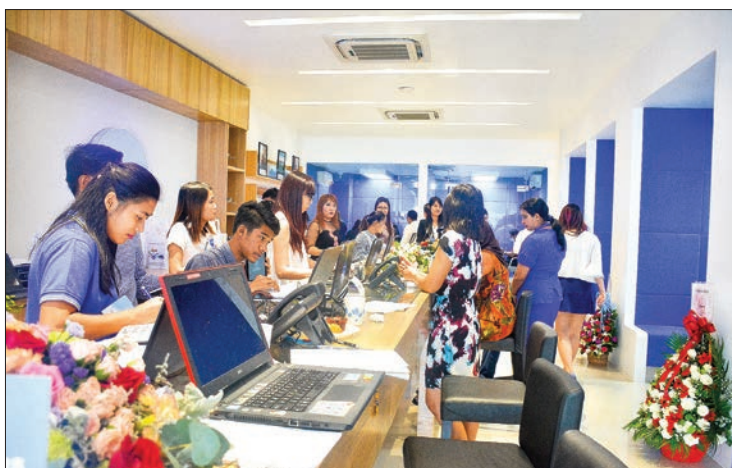
The Oway new office opening ceremony held in Yangon on 14 th October 2017.

Representatives from Oway partner companies and airlines, royal customers and media attended the opening ceremony. The ceremony includes special sales event for Oway Travel's 5 th Anniversary and luck draw for walk-in customers.—GNLM ■