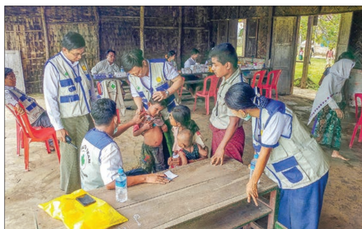
Mobile health care members providing medical treatment to the children in Maungdaw yesterday.

AUTHORITIES in Maungdaw have sent mobile health care teams to areas, which have seen stability, to provide emergency care to villagers.