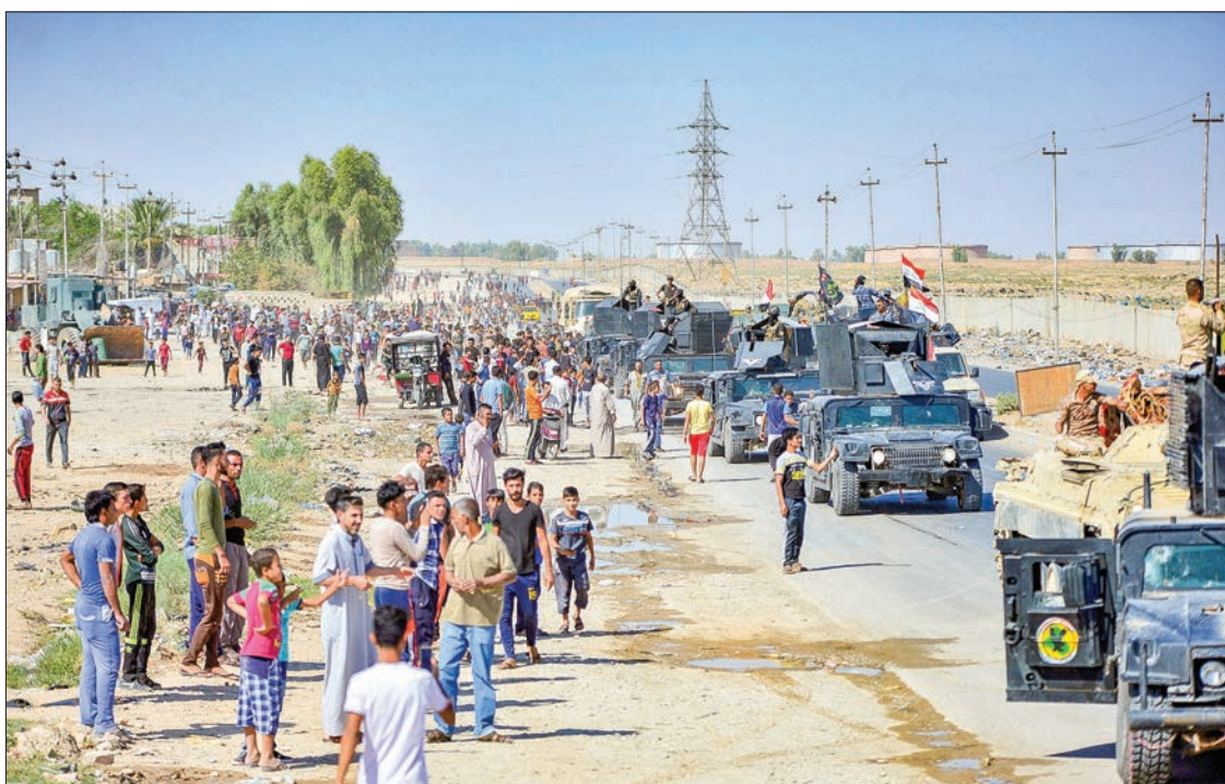
Iraqi people gather on the road as they welcome Iraqi security forces members, who continue to advance in military vehicles in Kirkuk, Iraq on 16 October, 2017.

The action in Iraq helped spur a jump in world oil prices