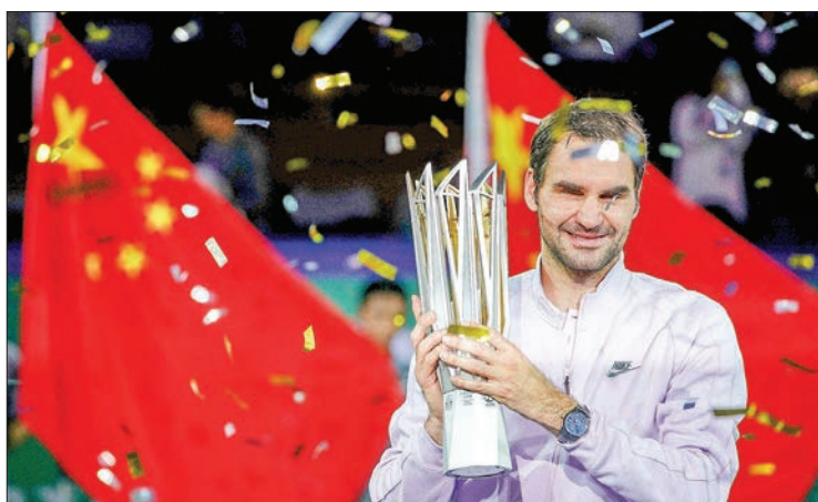
Roger Federer of Switzerland lifts the trophy after winning against Rafael Nadal of Spain in Shanghai, China on 15 October, 2017.

“The serve only got better and I saved the best for last ... In a way, not surprising because I felt good all week—I was ready.” The Swiss next headlines his home Basel International starting on 21 October. —Reuters ■