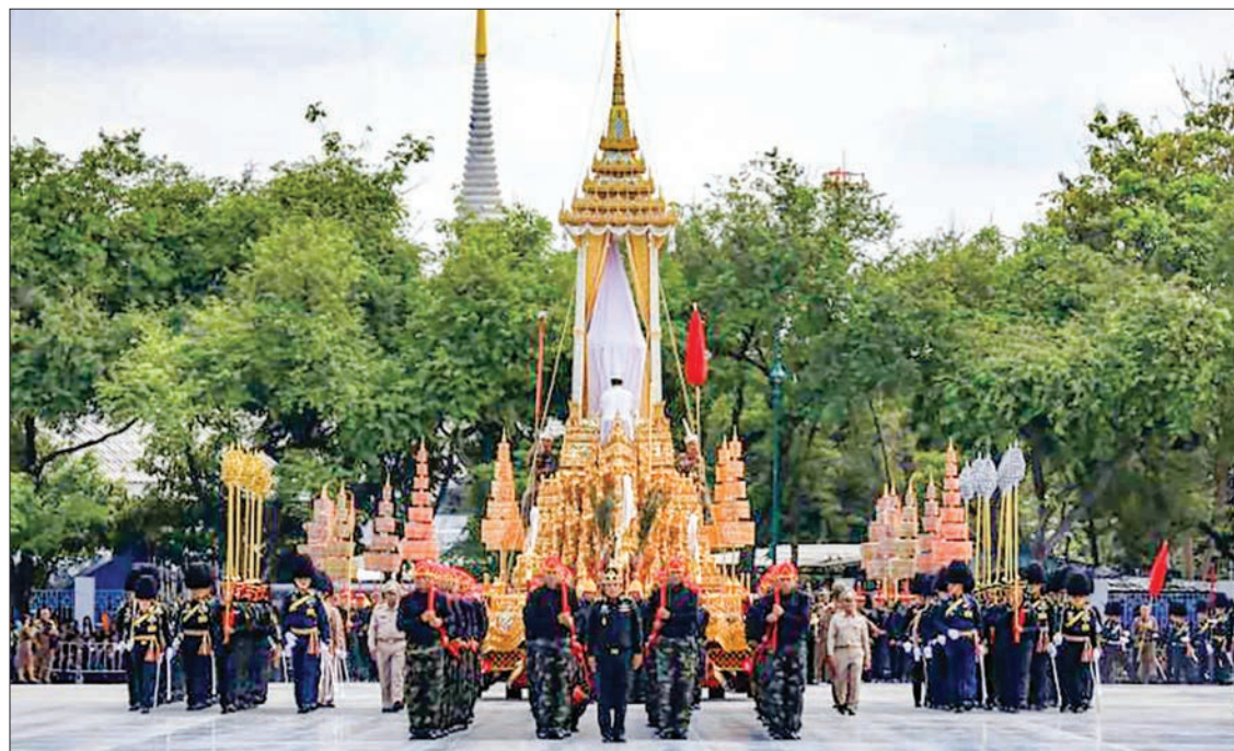
Officials take part during a funeral rehearsal for late Thailand's King Bhumibol Adulyadej near the Grand Palace in Bangkok, Thailand on 15 October, 2017.

The Interior Ministry earlier this month filed a lawsuit seeking the dissolution of the CNRP ahead of next year's general election. —Kyodo News ■