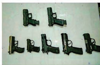
File photos show confiscated firearms, ammunitions and stimulant tablets at the Nay Pyi Taw international airport.