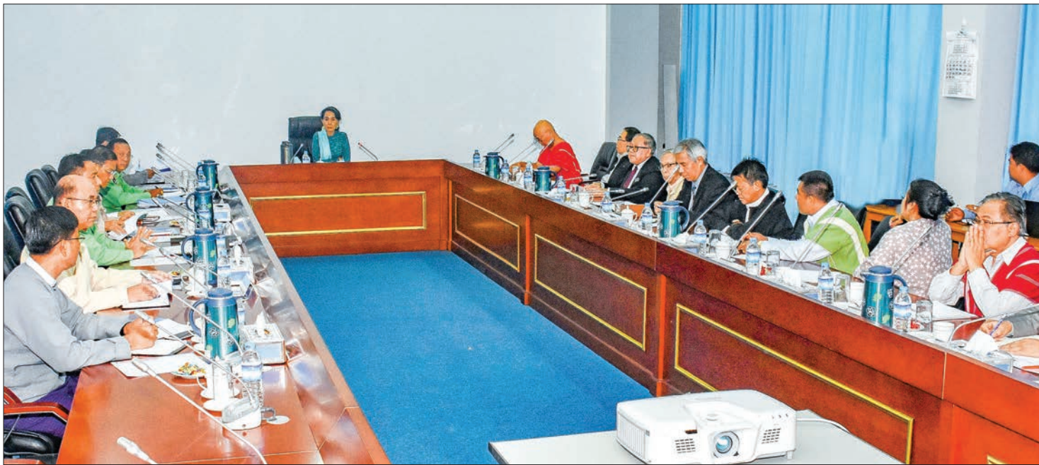
Daw Aung San Suu Kyi meeting with representatives of the signatories to the Nationwide Ceasefire Agreement.