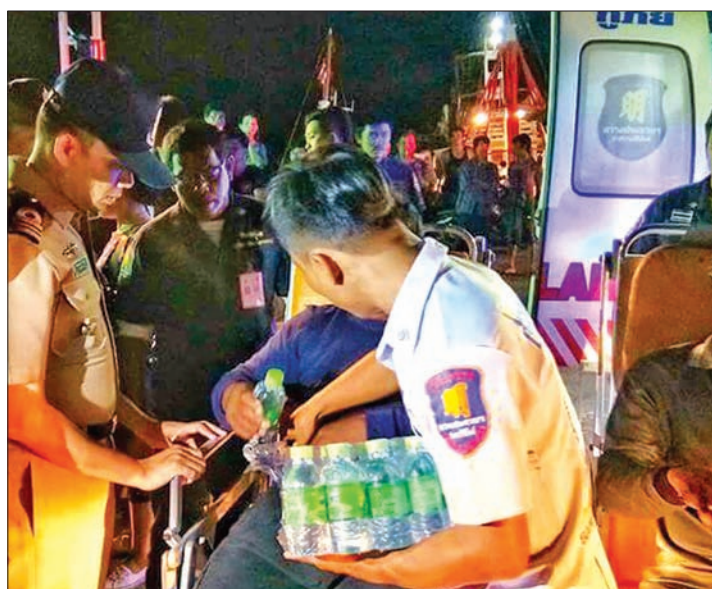
Volunteers provide assistance to the fishermen.

There was only one injury, a minor leg injury, and all were safely rescued by a Thai Coast Guard vessel. All crewmembers of the boat, both Myanmar and Thai, were being given timely treatment, according to the social networking site of Chonyuen Wisutthipat.—Kyaw Soe (Kawthoung)