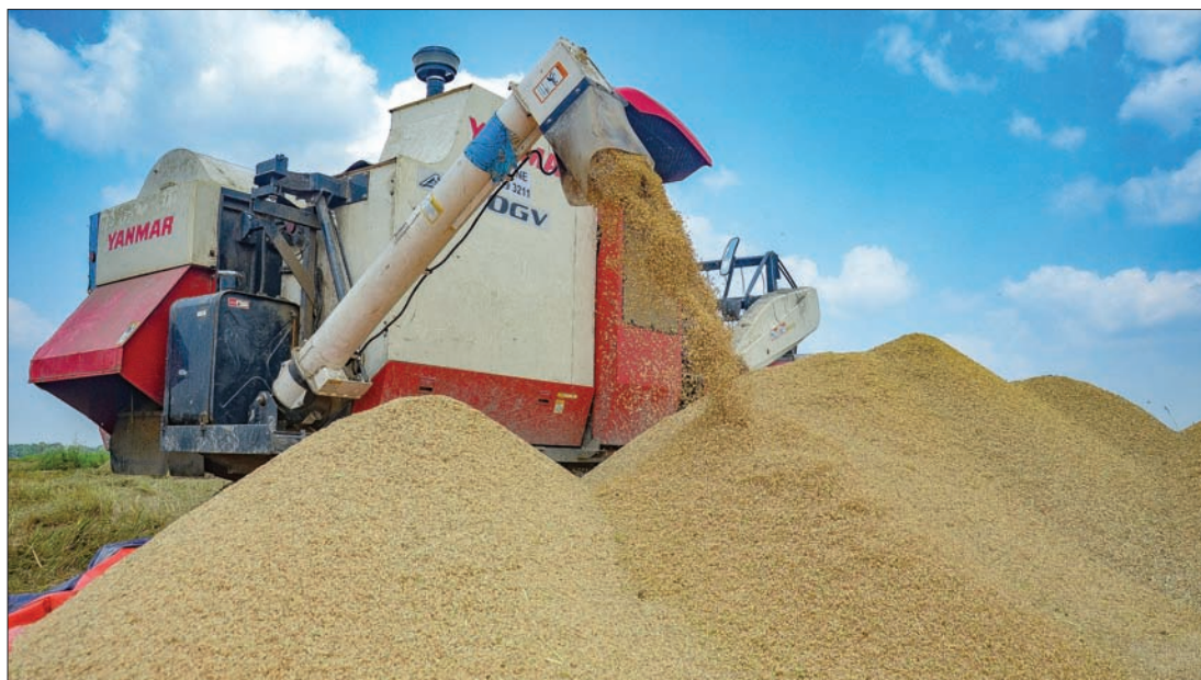
Collection of rice from a threshing machine in Kangyidauk, Ayeyawady Region.