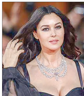
Hollywood star Monica Bellucci.