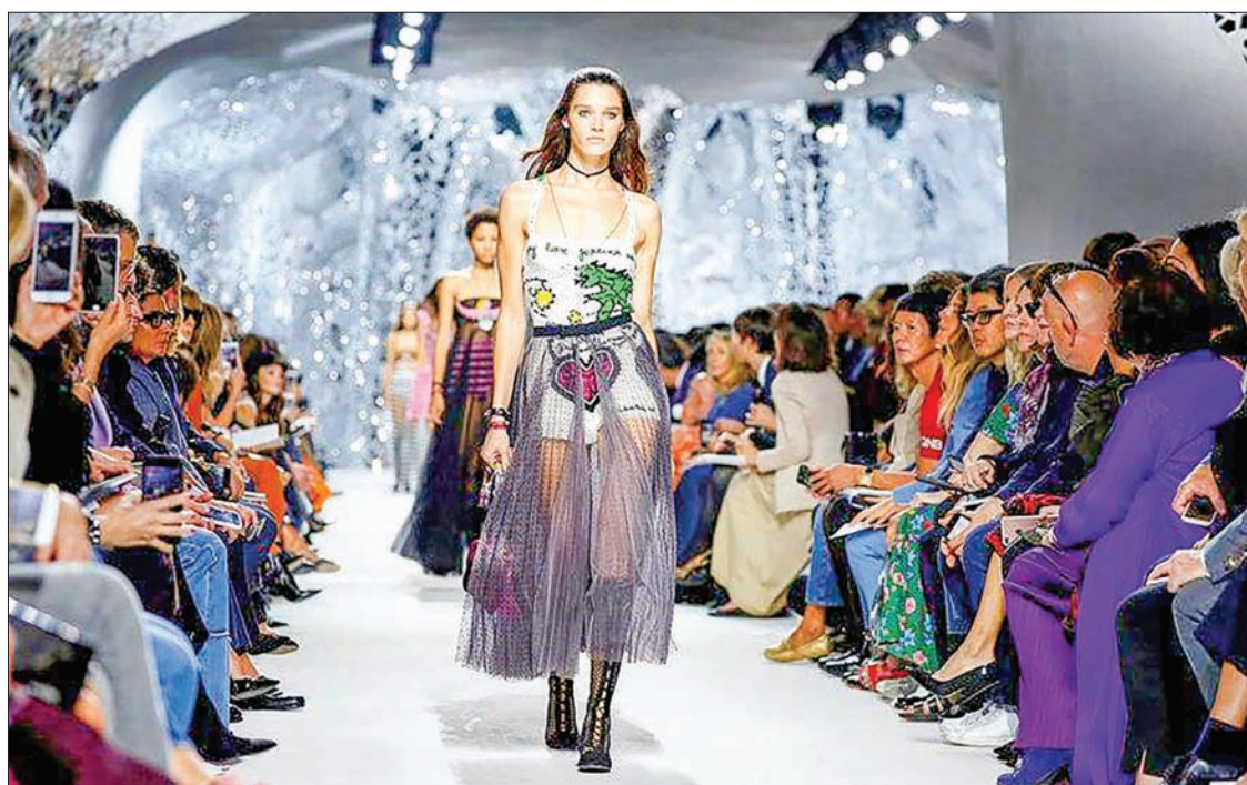
A model presents a creation designer Maria Grazia Chiuri as part of her Spring/ Summer 2018 women's ready-to-wear collection show for fashion house Dior during Paris Fashion Week, France on 26 September, 2017.