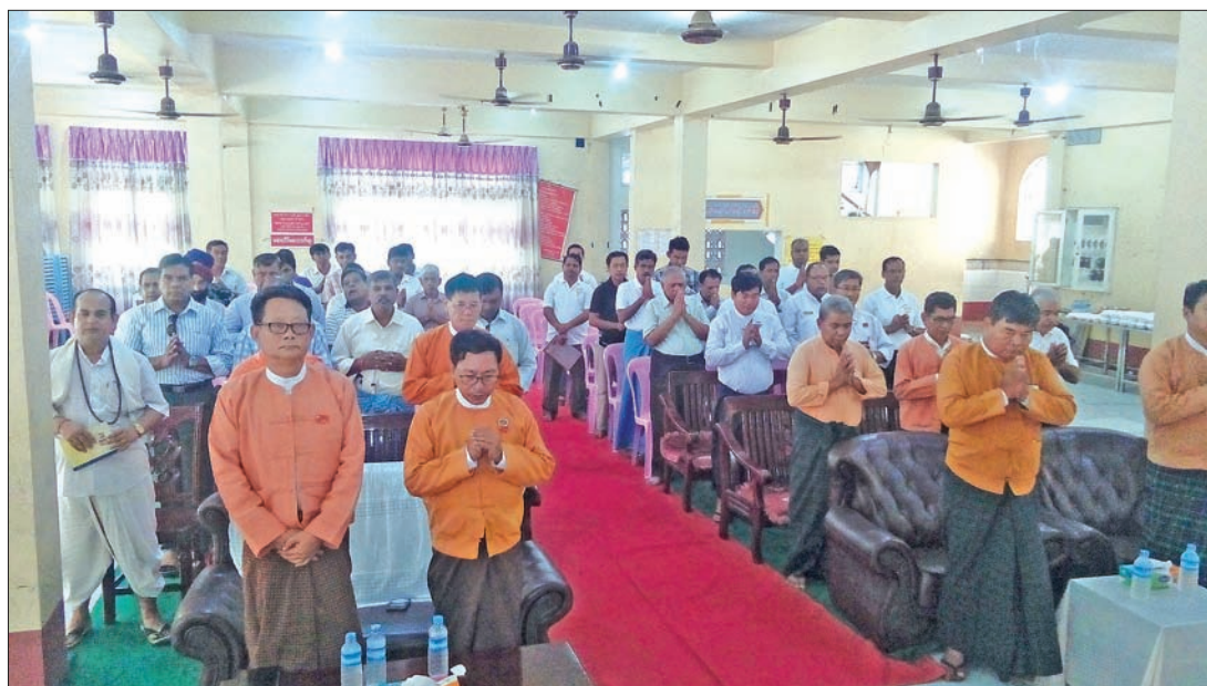
Hindu families pray for victims of the ARSA terrorist attacks in northern Rakhine.

is that the vast majority of Muslims did not abandon their hearth and home. While there has been an exodus, more than 50 per cent of the Muslim villages in northern Rakhine remain intact," said the National Security Advisor.—GNLM ■