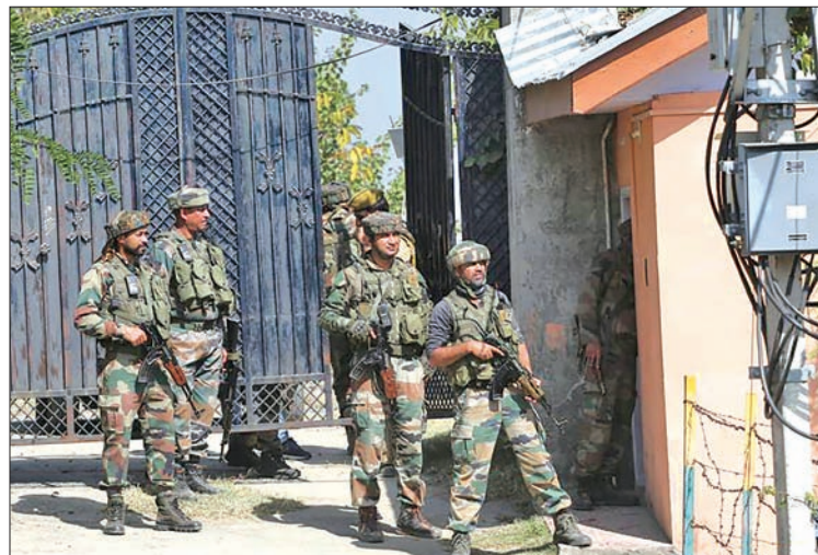
Indian army troopers stand guard near the site of a gunfight inside India's Border Security Force (BSF) camp in Srinagar, summer capital of Indian-controlled Kashmir on 3 October, 2017. An Indian border guard and two militants were killed, while as three others and a policeman were wounded Tuesday in a predawn militant attack on India's Border Security Force (BSF) camp in restive Indian-controlled Kashmir, police said.