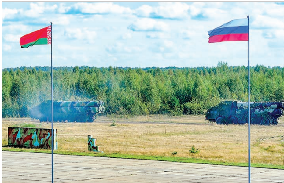
The Zapad-2017 strategic drills were held on September 14-20 in Belarus and Russia.

"Are Russia and Belarus wary of military drills that are taking place in