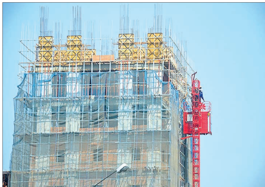
A construction site being seen in Yangon.

The Ministry of Construction estimates that Myanmar will need 4.8m more housing units by 2040 – 1m in Yangon alone – as the country’s population