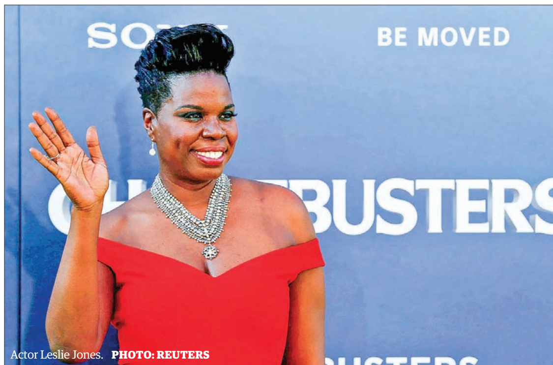
Actor Leslie Jones.