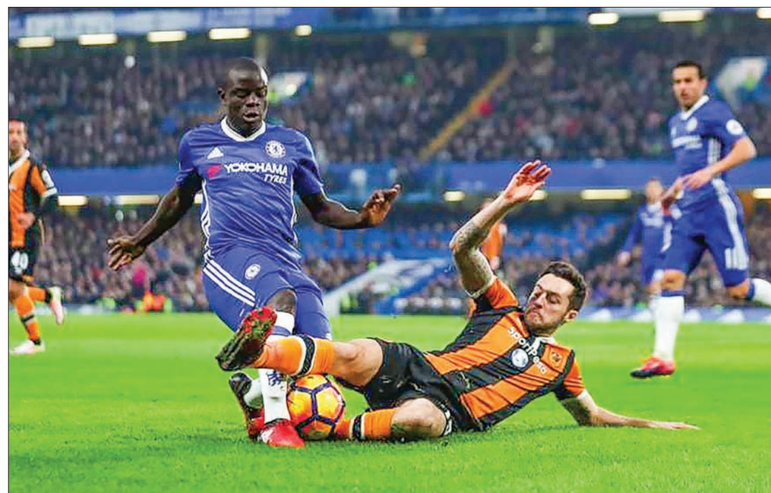
Chelsea's N'Golo Kante in action with Hull City's Ryan Mason during the match of Premier League in Stamford Bridge on 22 January, 2017.

Mason, who left Spurs in 2016, made 16 appearances for Hull last season. —Reuters ■