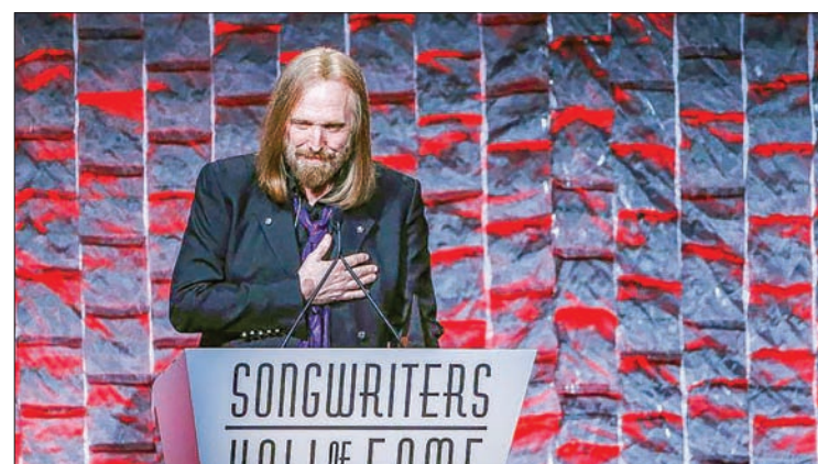
Musician Tom Petty speaks to guests after being inducted during the 47th Songwriters Hall of Fame Induction ceremony in New York, US on 9 June, 2016.

Police said the motives of the gunman, who killed himself, were unknown. —Reuters ■