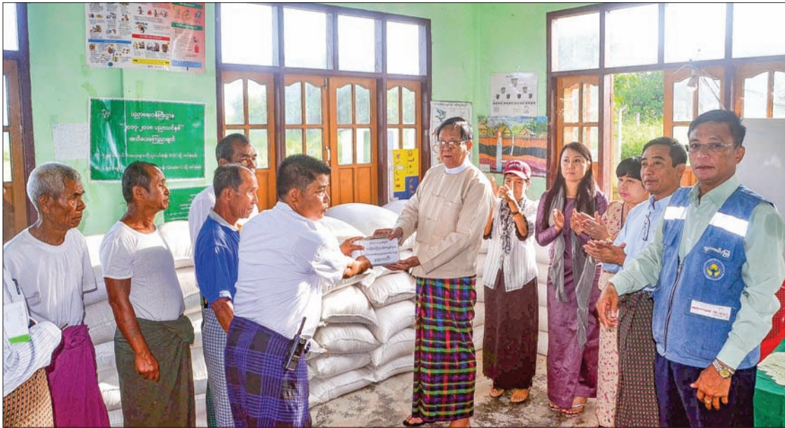
Amyotha Hluttaw Deputy Speaker U Aye Tha Aung, centre, delivers cash assistance and bags of rice to villagers in northern Rakhine State affected by the 25 August terrorist attacks.