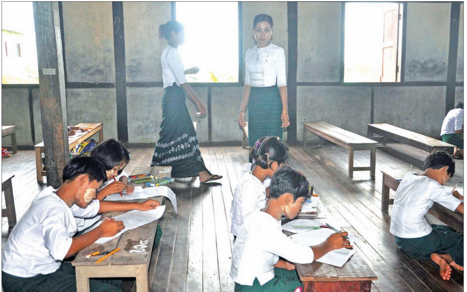
Teachers at a school in Sittway two days before the announcement of the appointment of 101 new teachers for Rakhine State.