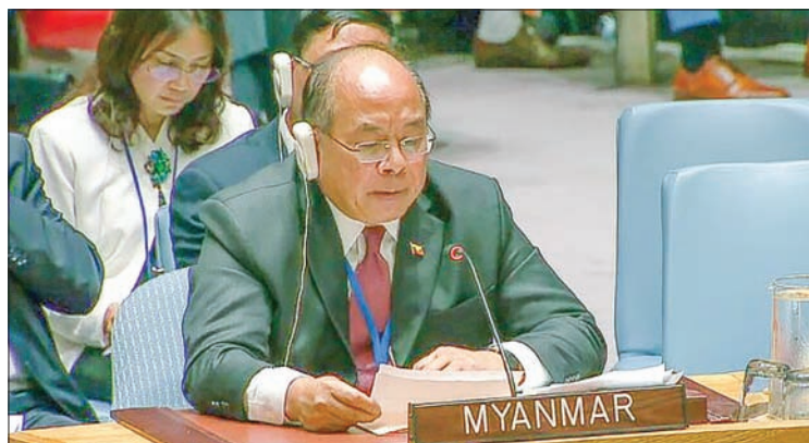
National Security Advisor U Thaung Tun.