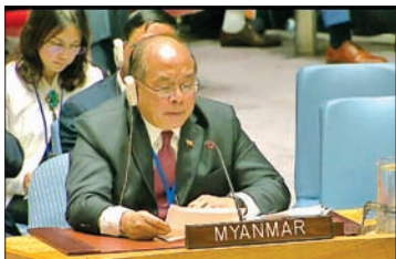
U Thaung Tun, National Security Advisor.

The National Security Advisor has urged international communities not to use the terms “ethnic cleansing” and “genocide” lightly regarding the issue in northern Rakhine State.