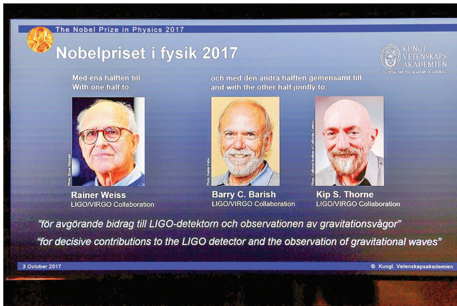
The names of Rainer Weiss, Barry C Barish and Kip S Thorne are displayed on the screen during the announcement of the winners of the Nobel Prize in Physics 2017, in Stockholm, Sweden on 3 October, 2017.