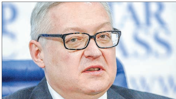
Russian Deputy Foreign Minister Sergey Ryabkov.

"Such meetings are definitely held for the benefit," the Russian diplomat said. "We keep moving up on the present-day agenda, but the progress is very slow, and this is why we