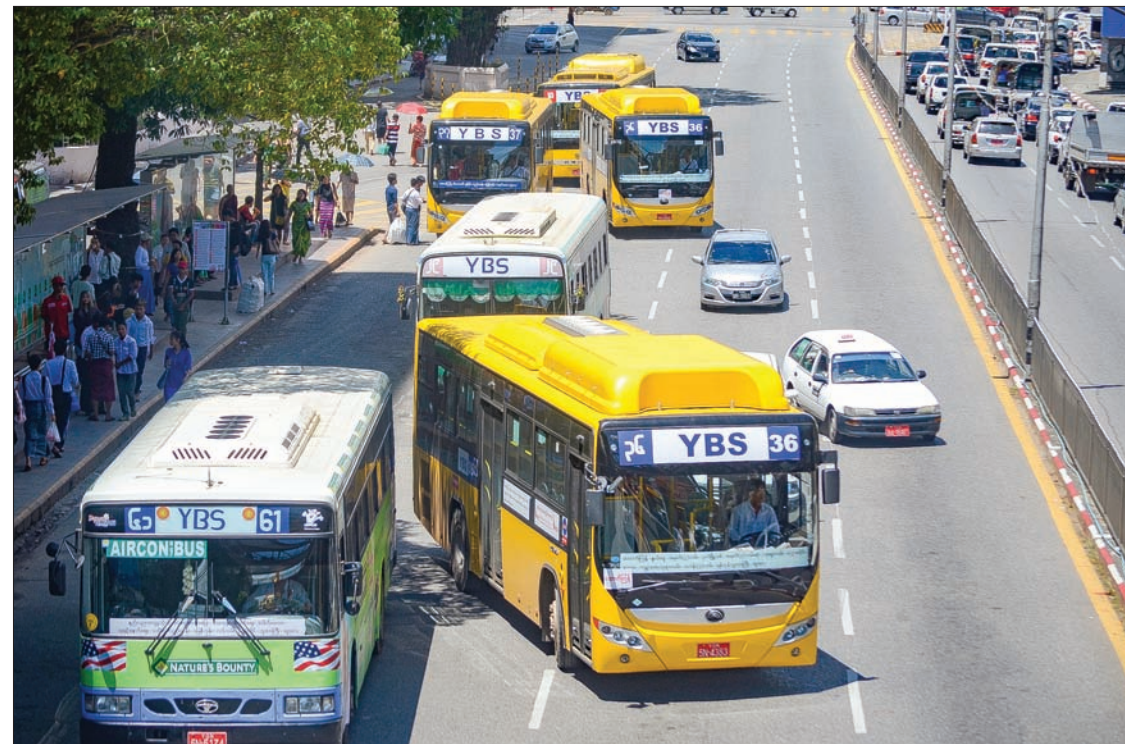
Authorities to install GPS devices in YBS buses.

The aim of the installation of GPS systems on buses is to track bus routes, check locations and distances between individual buses and see images from inside the bus. Thanks to this system,