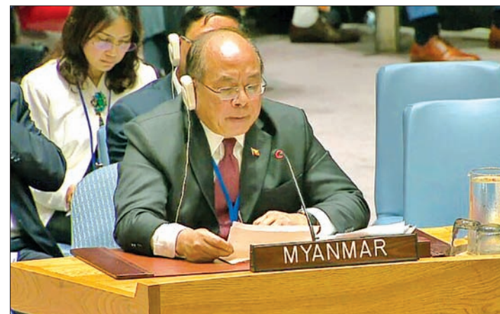
National Security Advisor U Thaung Tun delivers his address to the UN Security Council at the UN in New York City.

Myanmar is one of the most ethnically diverse countries in the world. It is home to 135 officially recognised ethnic groups, each with its own distinctive culture and adherence to a variety of religions, including Buddhism, Islam, Christianity and Hinduism. Religious groups have been living in harmony throughout the