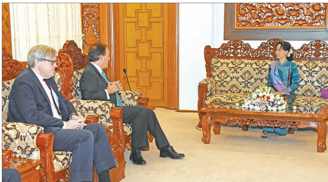
State Counsellor Daw Aung San Suu Kyi holds talks with Rt. Hon Mark Field MP, Minister of State for Foreign and Commonwealth Office.