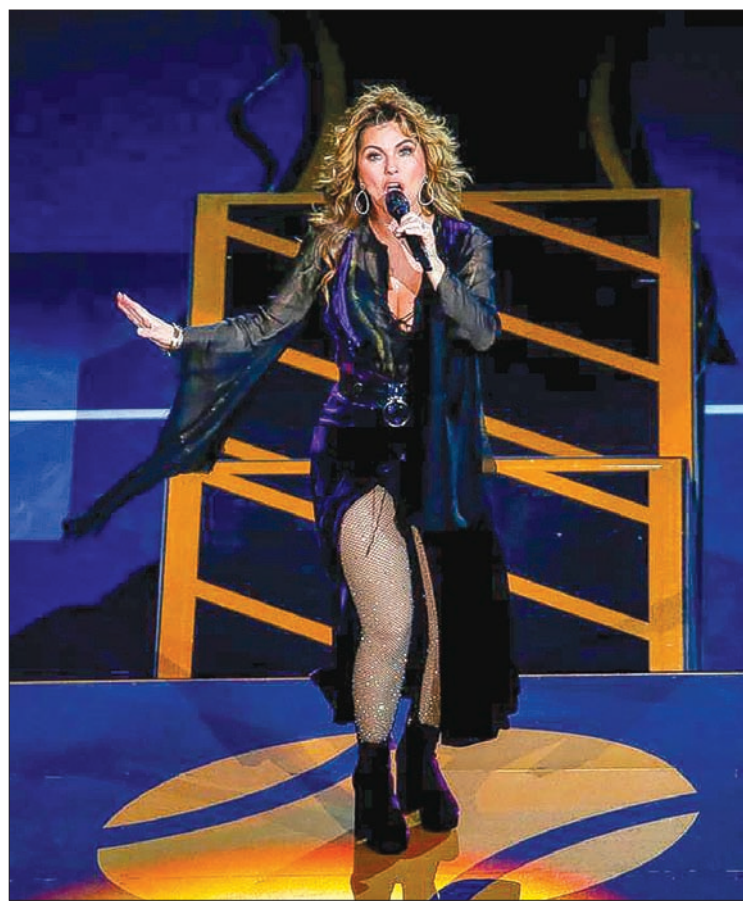
Singer Shania Twain performs inside Arthur Ashe Stadium during opening ceremony at the US Open in New York, NY, US on 28 August, 2017.

"This has all just come out of just a phase that was a transition for me. So hey! I'm feeling good," she said.—Reuters ■