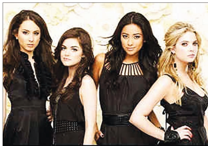
The cast of Pretty Little Liars.

But since then TV shows like "Transparent," "Modern Family" and "This Is Us" have brought transgender actors, bisexuals, and gay parents into American living rooms.—Reuters ■