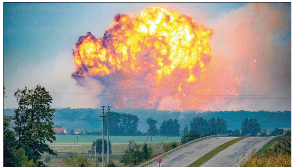
Smoke and flames rise over a warehouse storing ammunition for multiple rocket launcher systems at a military base in the town of Kalynivka in Vinnytsia region, Ukraine on 27 September, 2017.

Myanma Oil and Gas Enterprise Ph . +95 67 - 411206