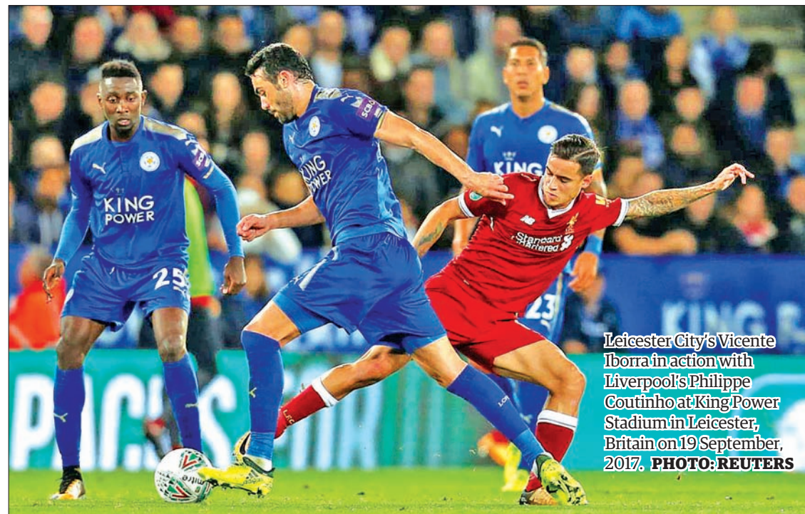
Leicester City's Vicente Iborra in action with Liverpool's Philippe Coutinho at King Power Stadium in Leicester, Britain on 19 September, 2017.

Leicester, who are 17th in the league table, travel to Bournemouth on Saturday.—Reuters ■