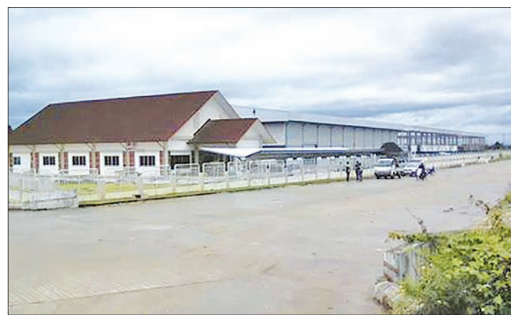
Factories seen at Myawady Economic Zone near the border of Myanmar and Thailand.

“Job application forms are now accepted. Total 50 applicants we have today. Applicants who come from other places also applied. They will be employed if the qualification meets