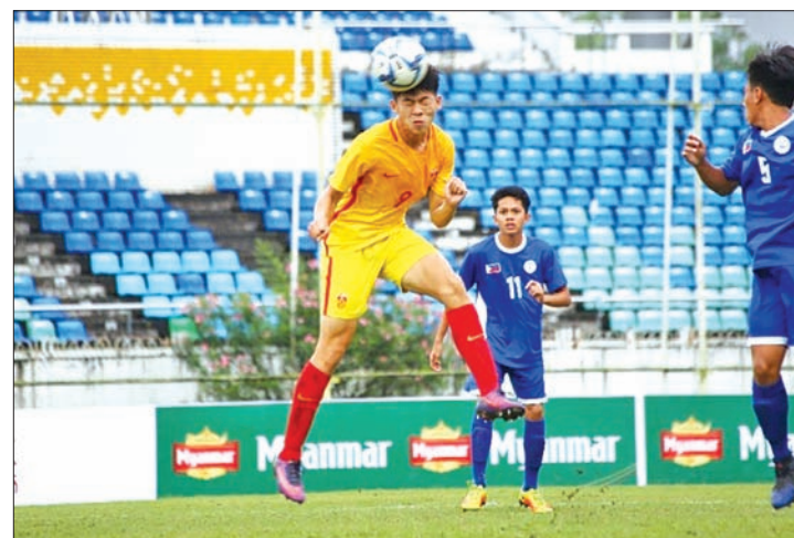
China footballer heading the ball in yesterday's first match at Thuwunna Stadium.