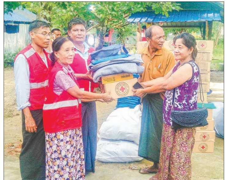
Red Cross members present commodities to displaced persons at camps in Sittway for internally displaced people.