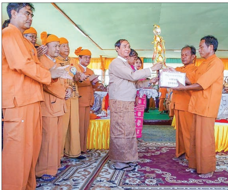
Pyithu Hluttaw Speaker U Win Myint presents prize to male contestant winners team during the Inle Phaung Daw Oo Pagoda Festival.

Afterward, the Images visited round Nyaungshwe for people to pay holy respect. Following that Inle traditional regatta was held and prizes were offered to winner teams.