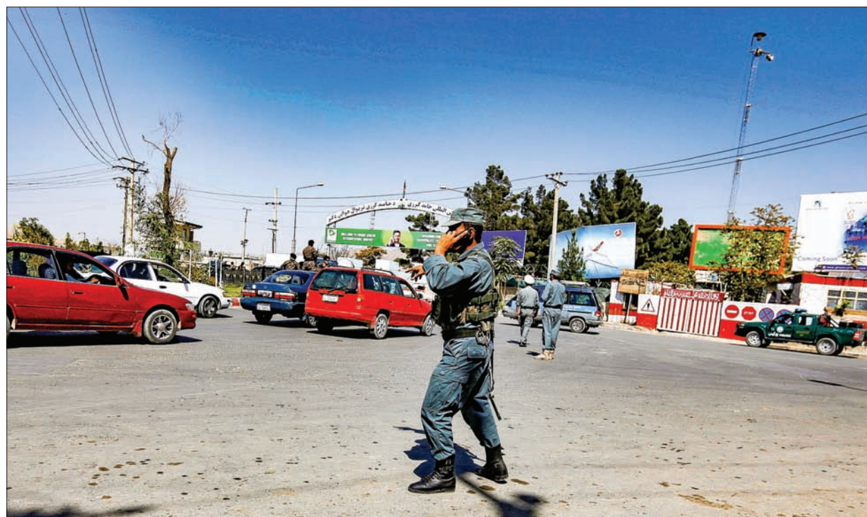
Afghan policemen stand guard outside of Kabul Airport after rockets exploded in Kabul, Afghanistan on 27 September, 2017.

Mattis has said that the United States will send an additional 3,000 troops to Afghanistan to help train Afghan security