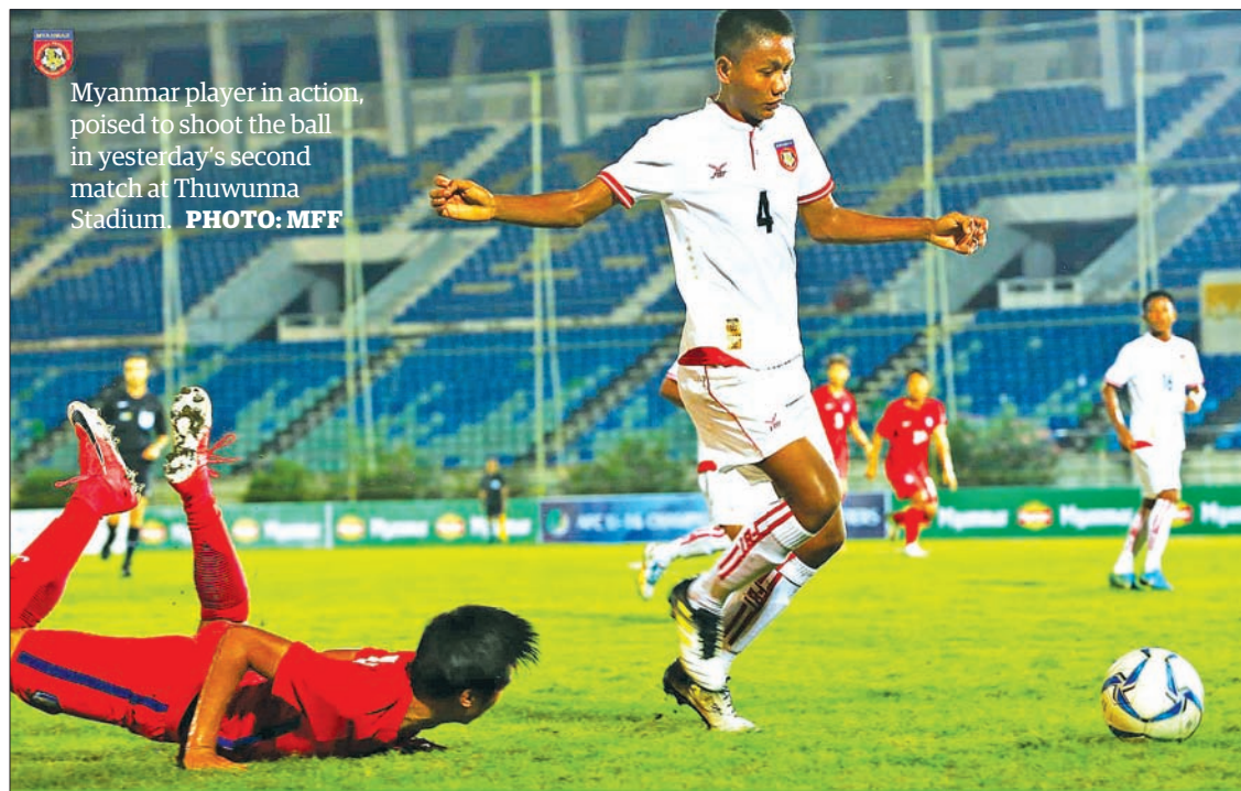
Myanmar player in action, poised to shoot the ball in yesterday's second match at Thuwunna Stadium.

Although Host Myanmar played at their utmost effort with a strong hope of gaining a qualifying chance to 2018 AFC U-16 Championship in Malaysia, Myanmar blurred the hopes in yesterday's match against South Korea, a football powerhouse of Asia with a result of 0-4 at the Thuwunna Stadium in Yangon yesterday.