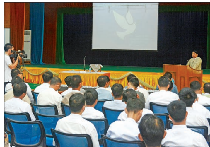
Union Minister for Information Dr Pe Myint delivers the opening address at the paper reading on performance for internal peace process in Myanmar.

that a policy would be needed in implementing the projects and to resettle the ethnic villages and to construct concrete layers on border roads. Then, committee members, Permanent Secretaries and department heads participated in sector-wise discussions on regional security, rule of law, and forming the accepting and resettling committees for returnees, the preparation works for issuing NV Cards, quick release of news, scrutiny on land ownership, the improved efficiency of the telephone lines, preparations for the students at relief camps to be able to continue their studies and rendering health care and electrification.—Myanmar News Agency ■