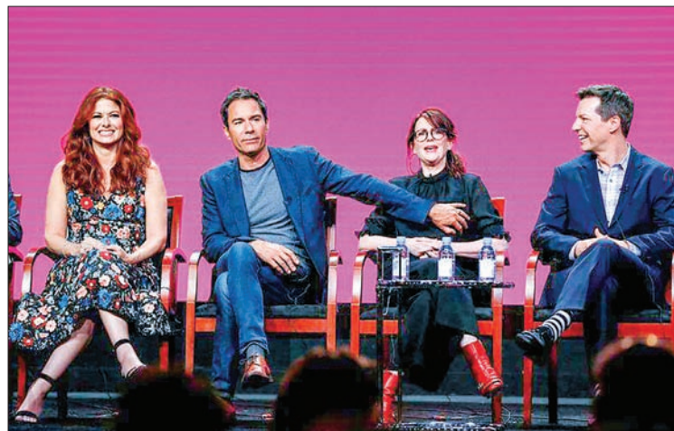
Cast members Debra Messing and Eric McCormack attend a panel for the television series "Will & Grace" during the TCA NBC Summer Press Tour in Beverly Hills, California, US on 3 August, 2017.