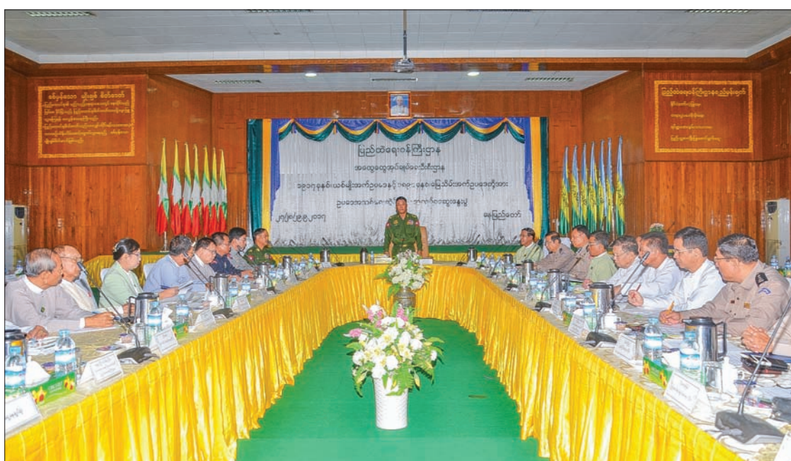
Union Minister for Home Affairs Lt-General Kyaw Swe delivers a speech at the opening ceremony for a workshop on amendment of land confiscation act.

In addressing at the workshop, the Union Minister said it