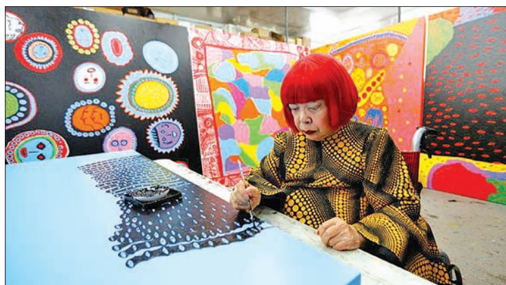
Japanese avant-garde artist Yayoi Kusama works on a creation at her studio in Tokyo, Japan on 26 September, 2017.

Kusama left for New York at 27, where she made a name for herself with her painting, its motifs inspired by the halluci-