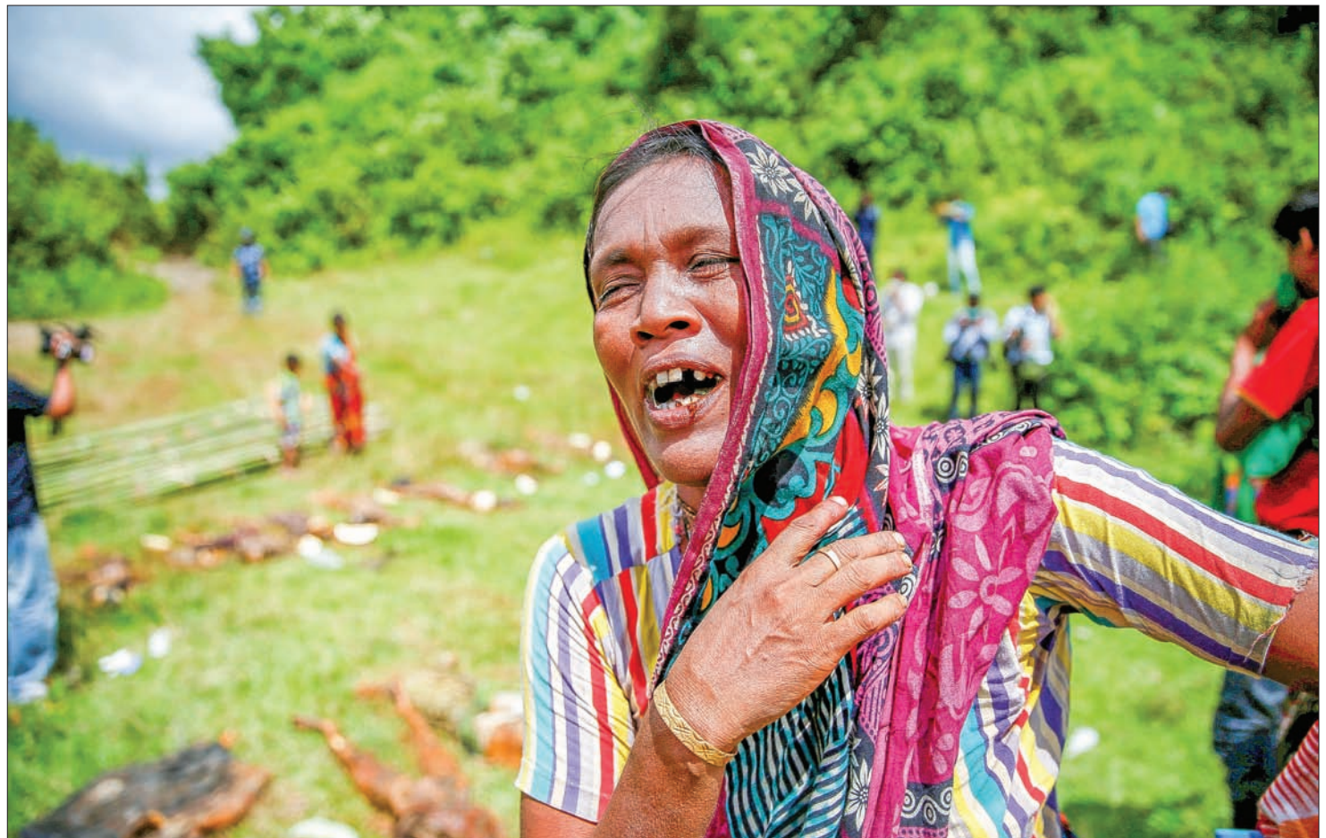
A Hindu villager reacts while identifying the bodies of relatives found by government forces that authorities suspect were killed by terrorists last month. The bodies were found in mass graves near Maungtaw in northern Rakhine on Sunday.