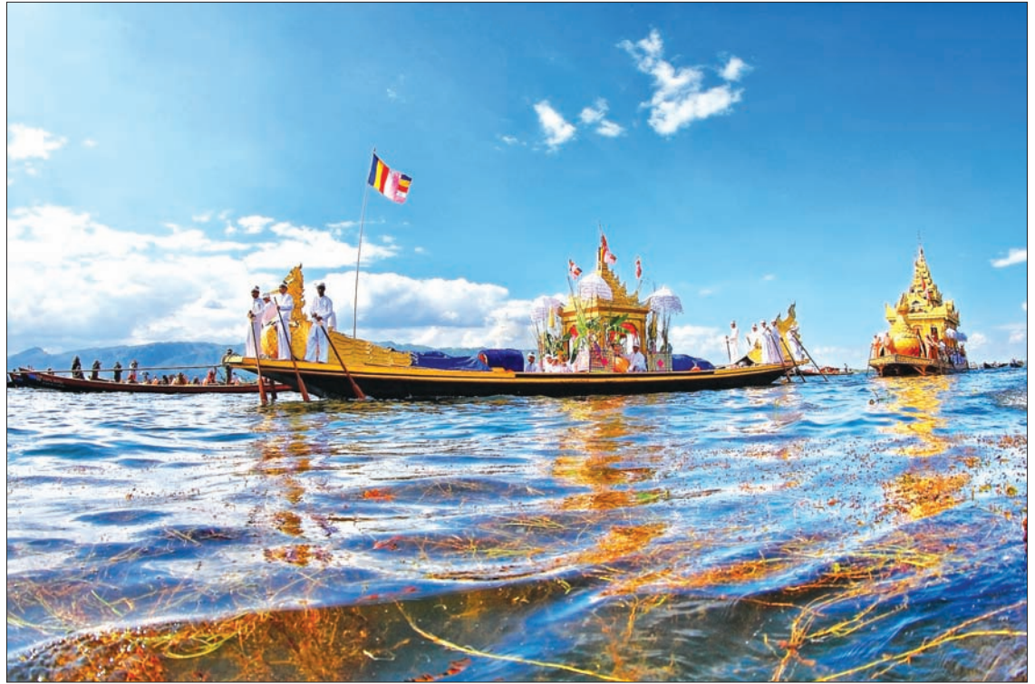
The Buddhas from the pagoda taken on a procession over Inle Lake to Nyaungshwe Township during Phaung Daw Oo Pagoda Festival.

Usually, the number of tourists increases in October. But this year, the open season