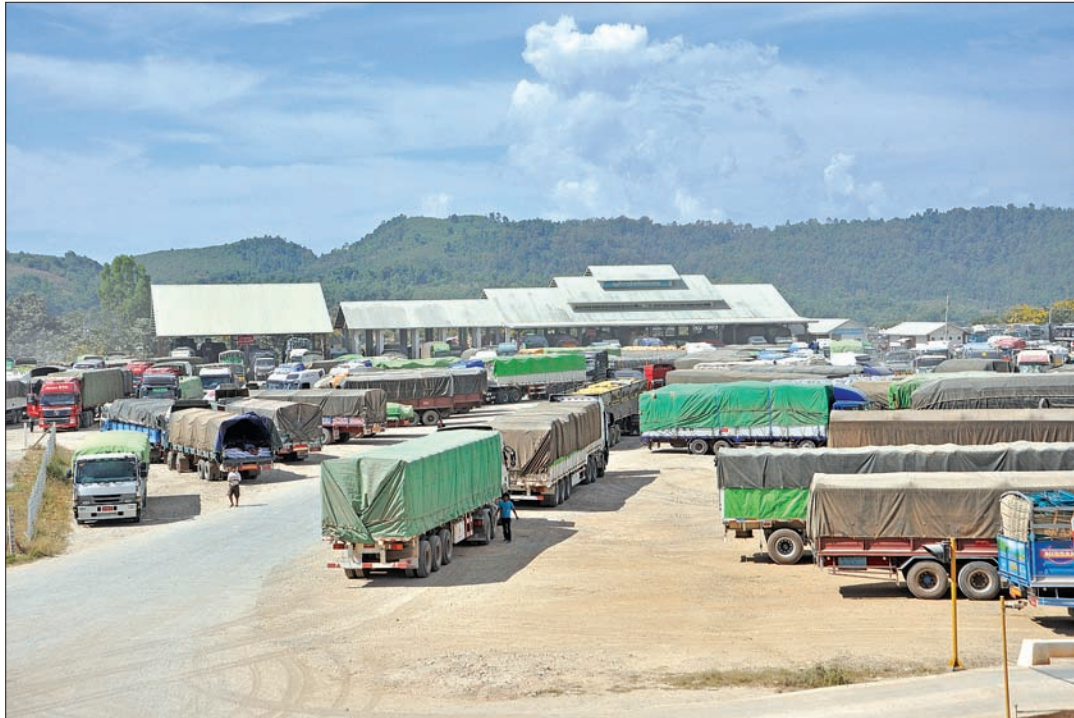
Trucks seen at 105-mile trade zone Muse, northern Shan State.

The border trade value as of 25 August in the current FY was US$2.27 billion in Muse, US$ 91.9 million in Lwejel, US$249.8 million in Chinsh-