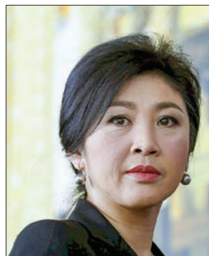
Former Thai Prime Minister Yingluck Shinawatra.

BANGKOK — Thailand's Supreme Court sentenced former prime minister Yingluck Shinawatra in absentia to five years in prison on Wednesday for mismanaging a rice subsidy scheme that cost the country billions of dollars.