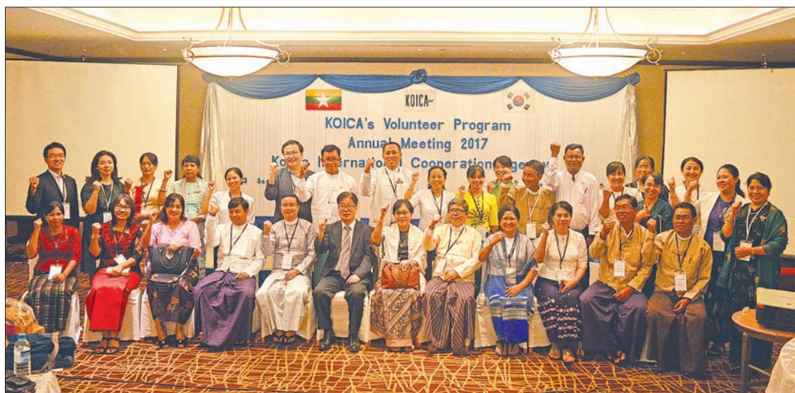
Participants pose for a documentary photo at the annual meeting of KOICA's Volunteer Program 2017.

"Consistent and effective communication between volunteers and departments can bring about great success in volunteering activities", said Dr.