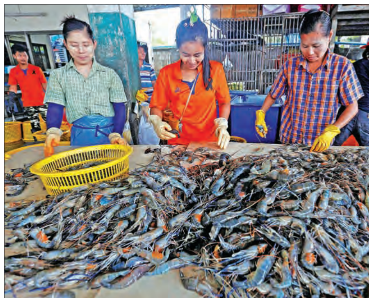
Workers from Myanmar sort shrimp at a wholesale market in Mahachai, in Samut Sakhon province, Thailand, in July 2017.

The Ministry's statement said that in addition to the six CI stations in Samut Sakhon (Mahachai) 1 and 2, Samut Prakan, Mae Sai, Mae Sot and Ranong, three more stations were opened in Chaing Mai, Nakhon Sawan and Songkhla.