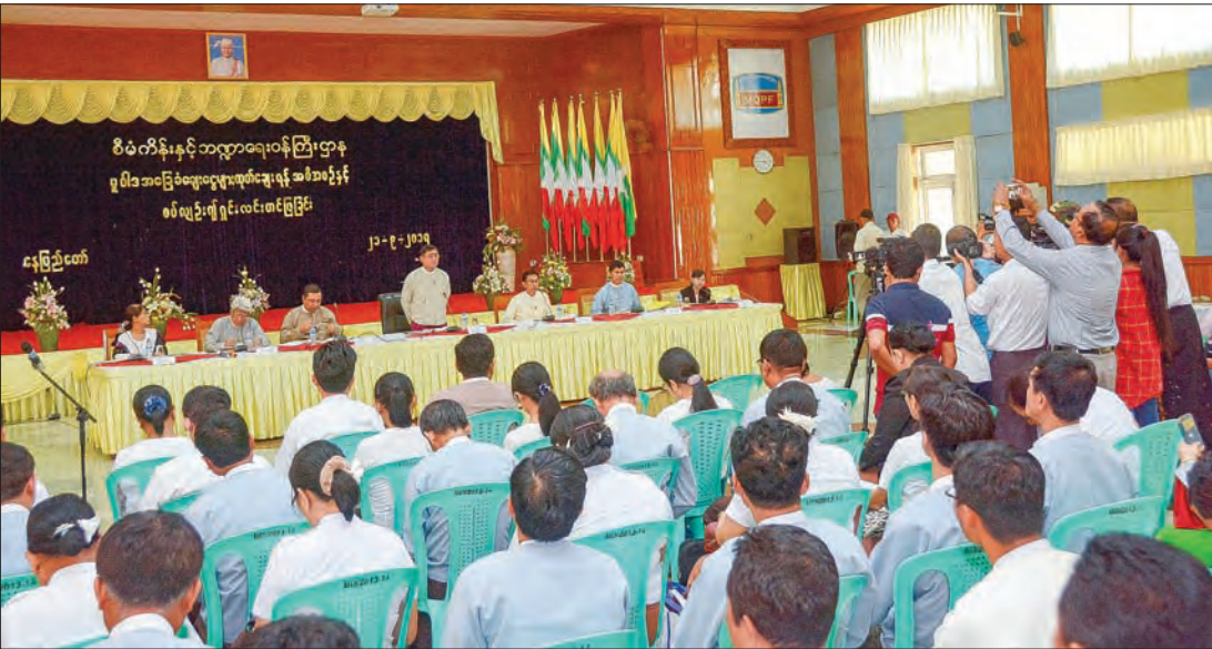
Officials of Ministry of Planning and Finance clarifies loans for agro-livestock, SME and construction at the Ministry of Planning and Finance in Nay Pyi Taw on 21 September 2017.