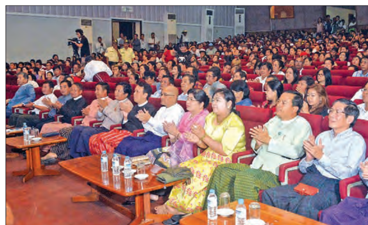
Dignitaries enjoy the contest of Anyeint troupes.