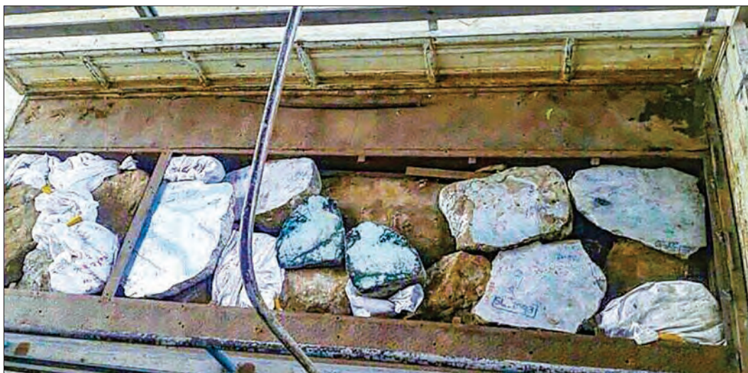
Jade stones of varying sizes seen on the illegal vehicle in northern Shan State.