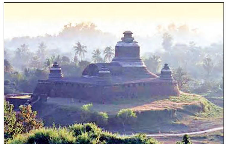
An ancient temple in Mrauk U.

"There are three kinds of heritage — cultural heritage, natural heritage and mixture heritage — culture and nature. Mixture heritage is the kind such as Inlay Lake. Mrauk is cultural heritage. So arrangements are being made to have the Mrauk U region en-