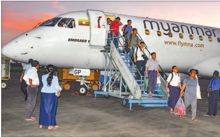
The media group from China arrive at Sittway Airport in Rakhine State on 21 September 2017.