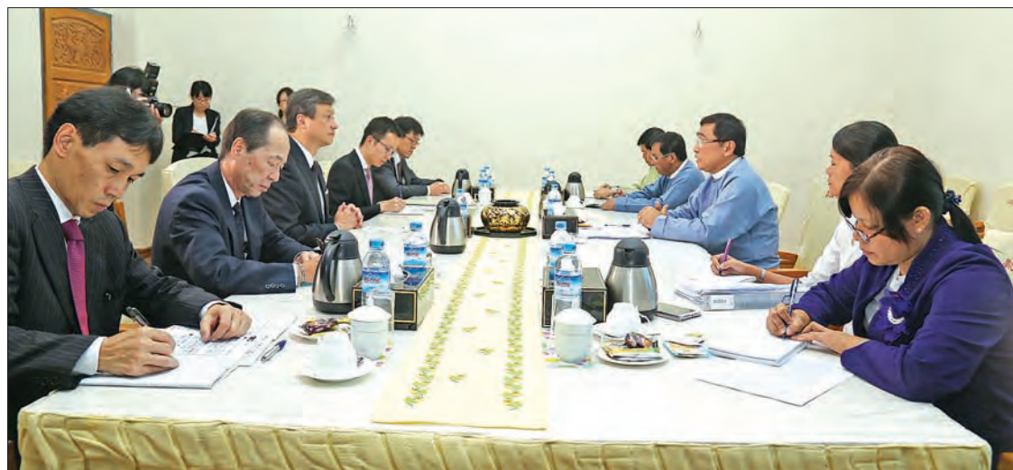
Union Minister Dr Win Myat Aye holds talks with Japan Parliamentary Vice-Minister for Foreign Affairs Mr. Iwao Horii in Nay Pyi Taw on 21 September, 2017.

The Union Minister said the incumbent democratic government has only been in power for 18 months, and establishment of democracy, rule of law and a socio-economic base were given priority. Work on national reconciliation is also being conducted consistently. The Union Minister discussed priority being given to states where development is lagging behind, the status of work