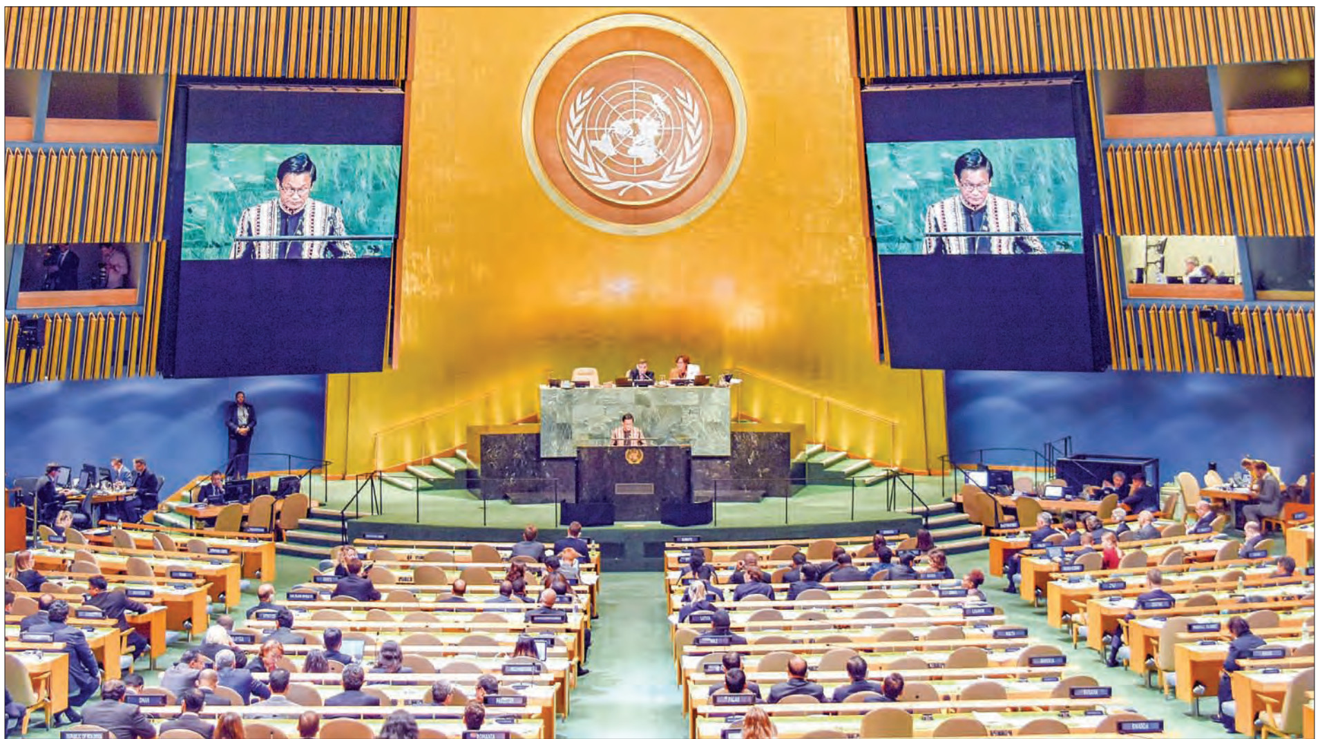
Vice President U Henry Van Thio addresses the 72nd United Nations General Assembly at UN headquarter in New York, US, on 20 September 2017.

No armed clashes have been reported since 5 September.