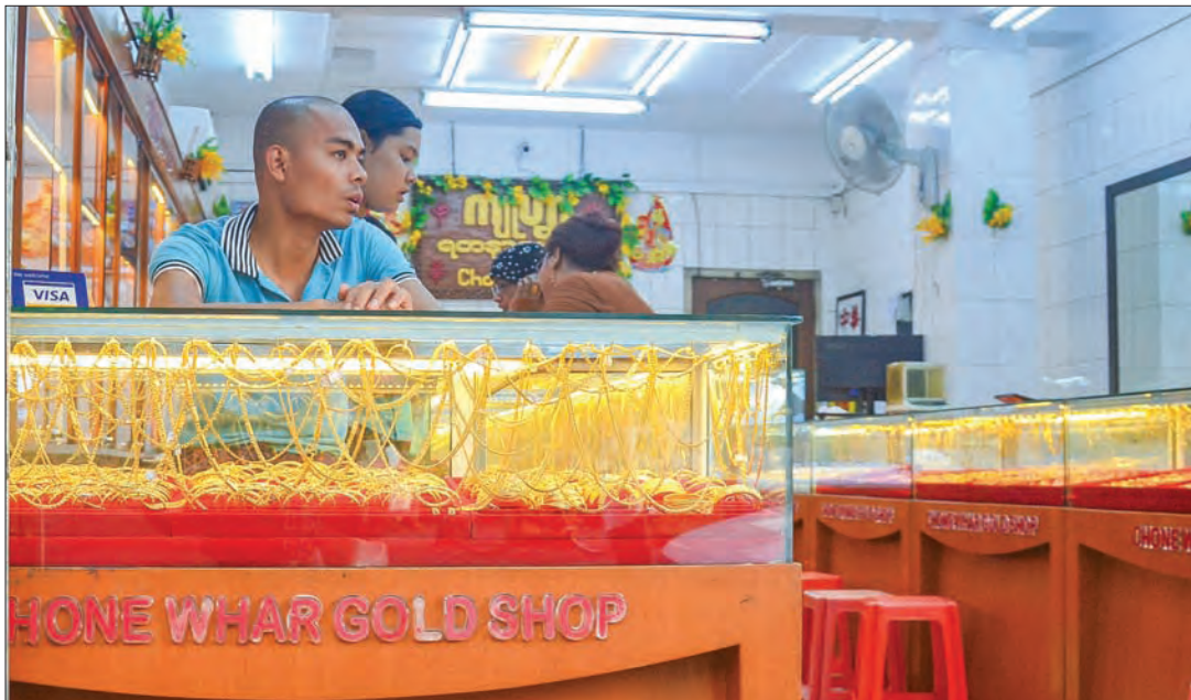
A sales man anticipates customers as gold price rises at a shop in Yangon.