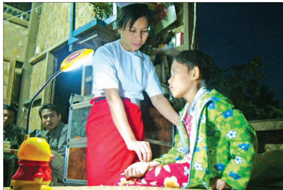
A nurse checks a patient at a rural clinic near Nay Pyi Taw.

tor engagement, the government is rolling out reforms to streamline processes for local and foreign companies to invest in the country's growing health care sector.