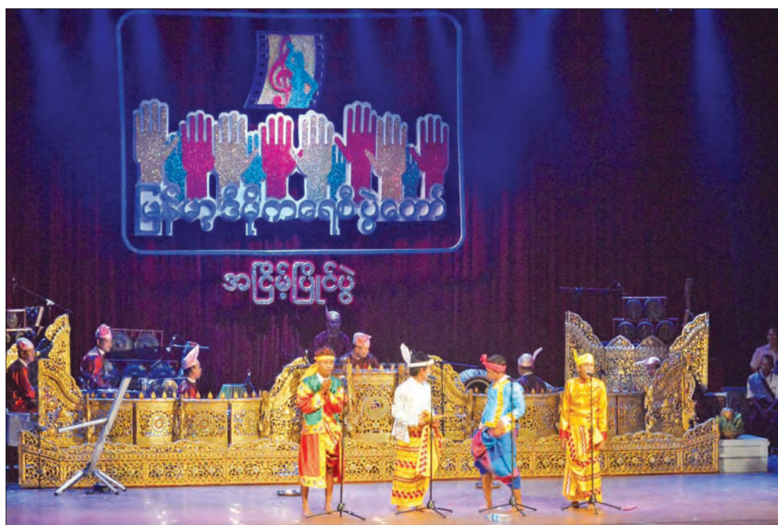
Eight Anyeint troupes compete in the final contest, making constructive criticisms for the transition period of Myanmar.