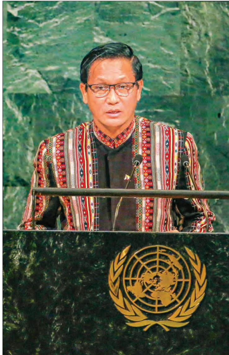
Vice President U Henry Van Thio addresses the 72nd United Nations General Assembly at U.N. headquarters in New York, U.S., on 20 September 2017.

Yesterday, the State Counsellor briefed the Diplomatic Corps on the government's efforts regarding national reconciliation and peace. She highlighted the achievements in the past 18 months and challenges that remain. In touching upon the situation in Rakhine, she said that Myanmar shares the concern of the international community regarding displacement and suffering of all communities affected by the latest round of terrorist attacks. She also stressed that "We condemn all human rights violations and unlawful violence. We are committed to the restoration of peace, stability and rule of law throughout the State. The security forces have been instructed to adhere strictly to the Code of Conduct in carrying out security operations, to exer-