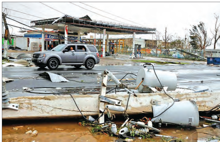
Damaged electrical installations are seen after the area was hit by Hurricane Maria en Guayama, Puerto Rico, on 20 September 2017.

It ripped roofs off almost all structures on the island country of Dominica, where seven people were confirmed dead. The toll is expected to climb when