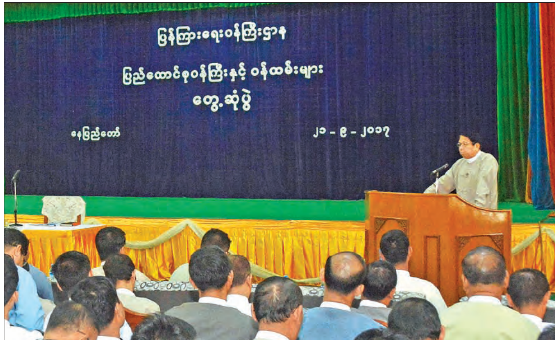
Union Minister Dr. Pe Myint delivers an opening speech at the meeting with staff from departments and enterprise under the ministry in Nay Pyi Taw on 21 September.

The presentations presented by those present at the ceremony included matters on extension of the set up of IPRD offices in districts and townships, detailed data collection on films, the supplying of books issued by Sarpay Beikman, the budget shortage for development in sports sector, the acquisition of daily allowances plus lodging fees for staff from other areas to come to Nay Pyi Taw on duty, appointment of daily