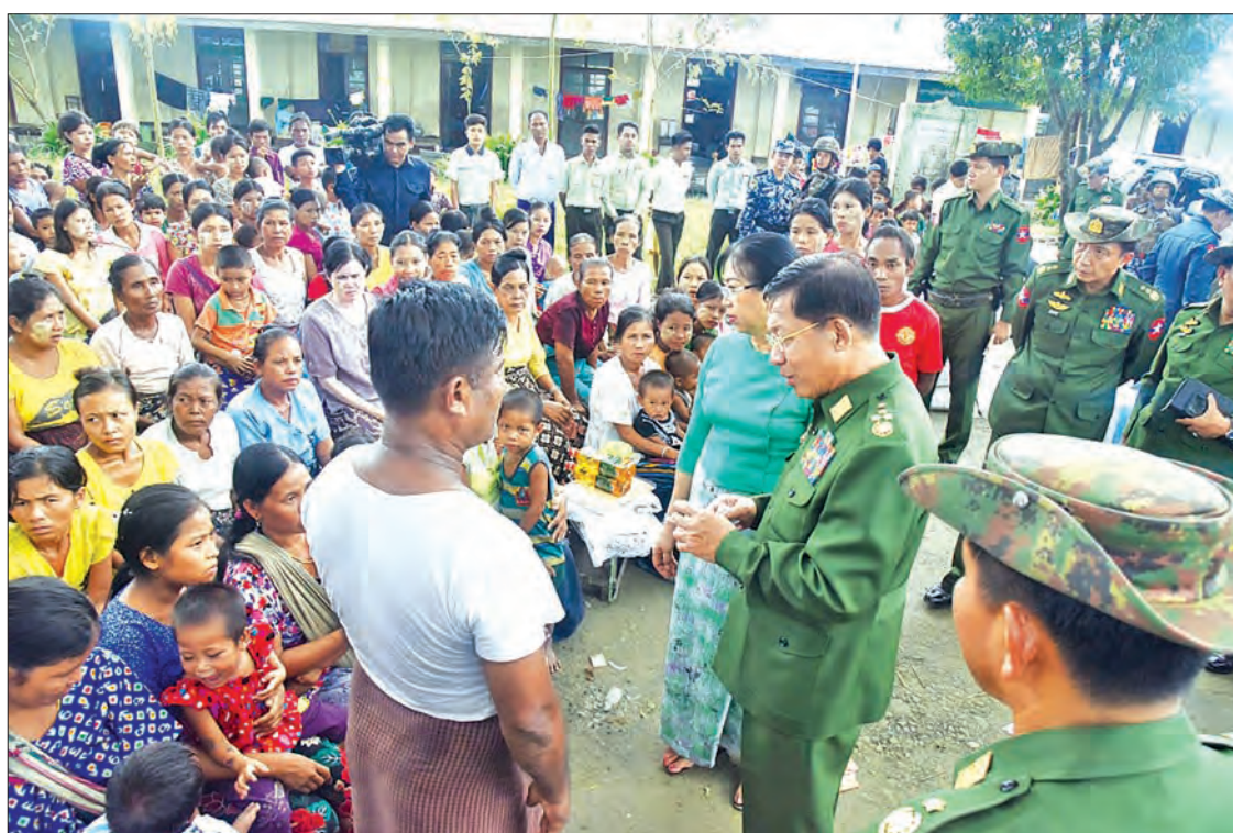
Senior General Min Aung Hlaing meets with local people in Sittway, Rakhine State.

displaced villagers from nearby villages who were staying in No. 2 sub school in the 4 mile area. The Senior General and wife encouraged the villagers and provided aid.