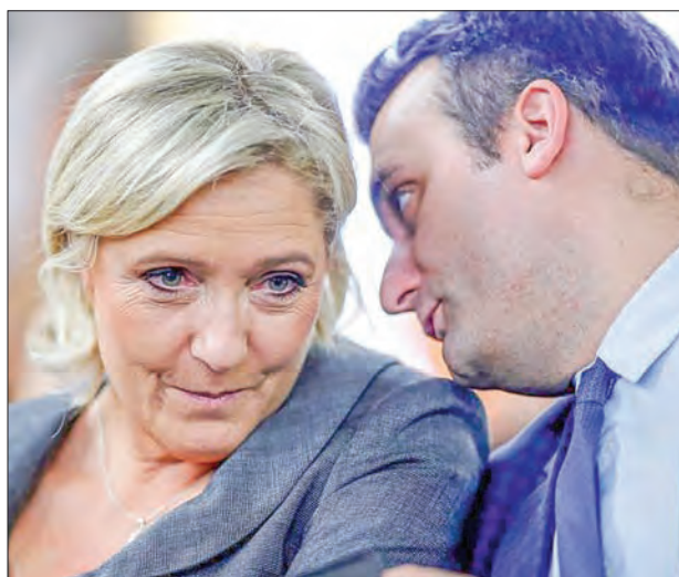
France's far-right National Front (FN) leader Marine Le Pen (L) and vice-president Florian Philippot attend a FN political debate in Paris, France, on 15 November, 2016.