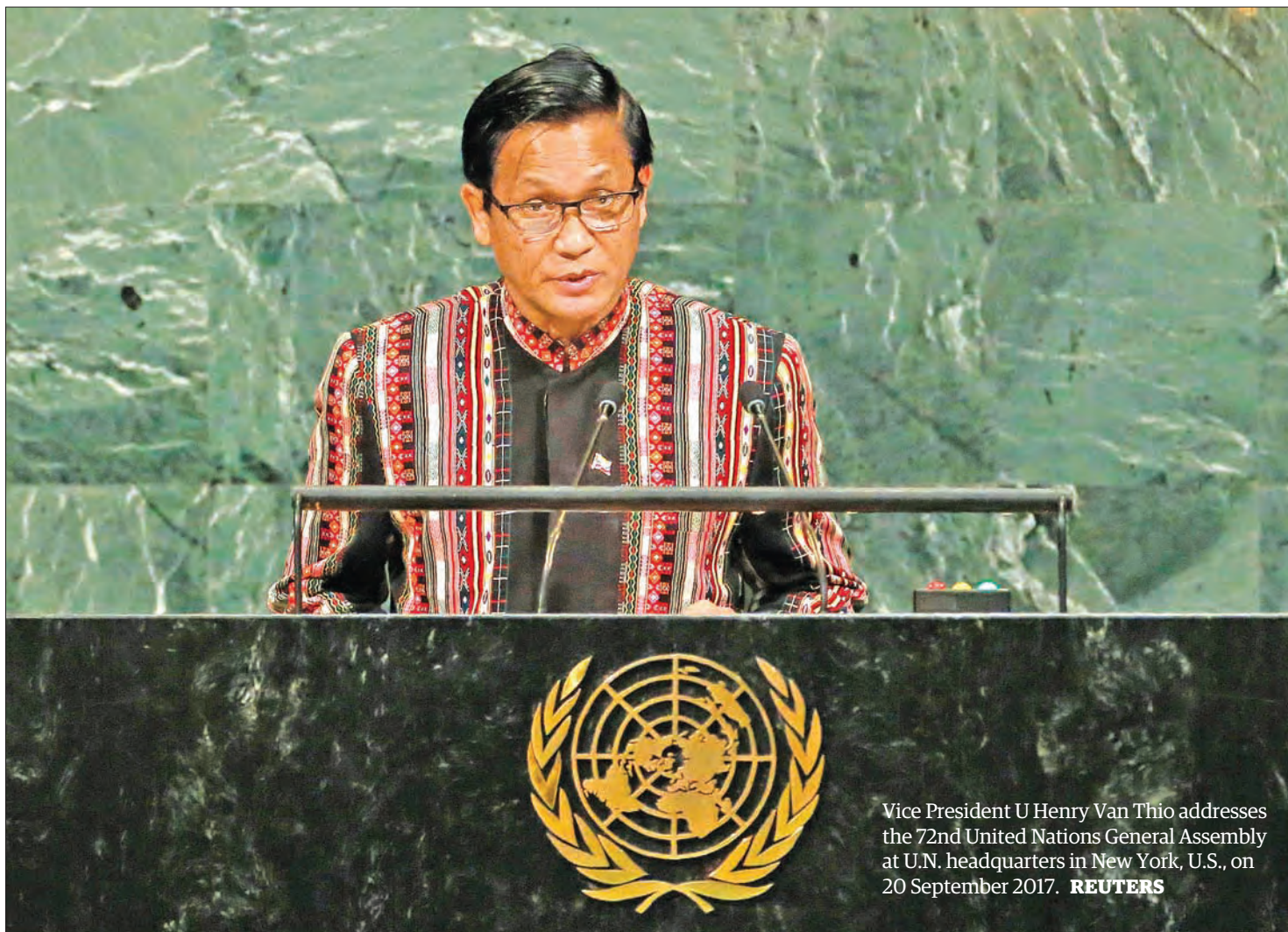
Vice President U Henry Van Thio addresses the 72nd United Nations General Assembly at U.N. headquarters in New York, U.S., on 20 September 2017.