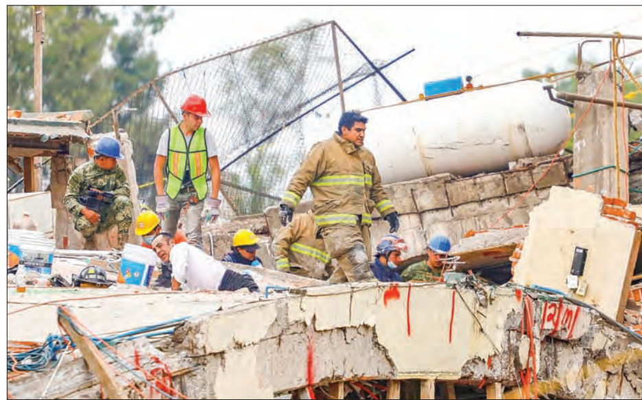
Rescue workers search through the rubble for students at Enrique Rebsamen school after an earthquake in Mexico City, Mexico, on 20 September 2017.

As the odds of survival lengthened with each passing hour, officials vowed to continue with search-and-rescue efforts such as the one at a collapsed school in southern Mexico City where Navy-led rescuers could