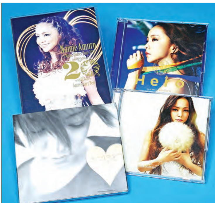
Photo taken 20 September, 2017, shows albums of Japanese pop singer Namie Amuro, who said the same day she will retire from show business in September 2018.

She also won music awards including the prestigious Japan Record Award for two years in a row and marked several mile-