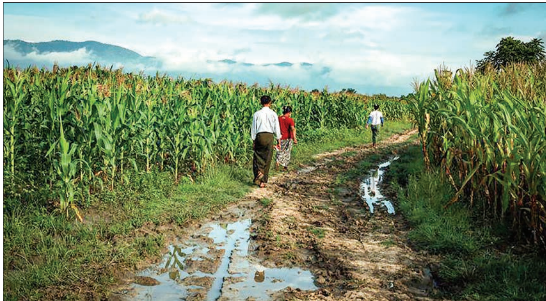
Farmers walk in their farm outside Yebu village in Shwenyaung township, Shan State.