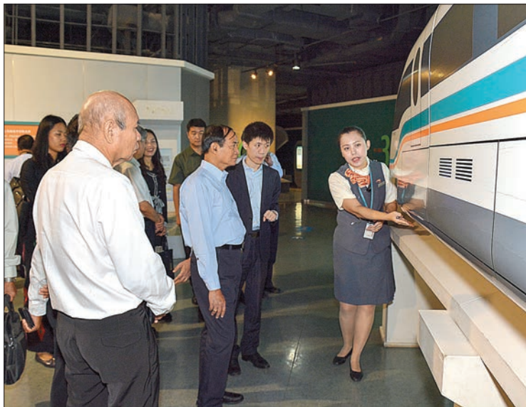
Pyithu Hluttaw Speaker U Win Myint observes Shanghai Maglev train in Shanghai yesterday.

Hluttaw Speaker and party boarded a train and departed from Shanghai Hong Qiao Rail-