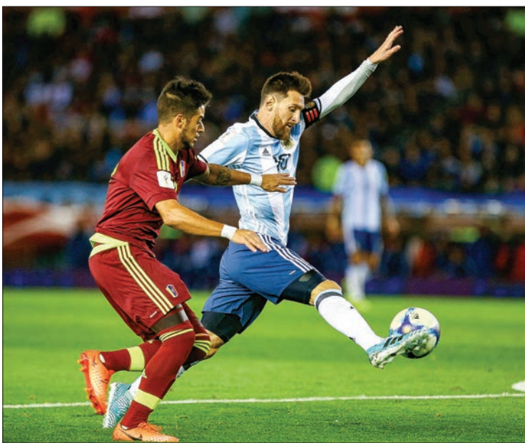
Argentina's Lionel Messi and Venezuela's Junior Moreno at the match of 2018 World Cup Qualifiers at Monumental stadium in Buenos Aires, Argentina on 5 September, 2017.

"Venezuela started to grow when they realised we couldn't finish them off," Argentina