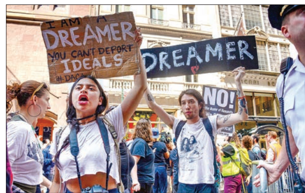
Protesters stage a rally in front of Trump Tower in New York on 5 September, 2017, against President Donald Trump's announcement that his administration will end a program that protects from deportation about 800,000 young immigrants who were brought into the United States illegally as children.

"Because it made no sense to expel talented, driven, patriotic young people from the only country they know solely because of the actions of their parents, my administration acted