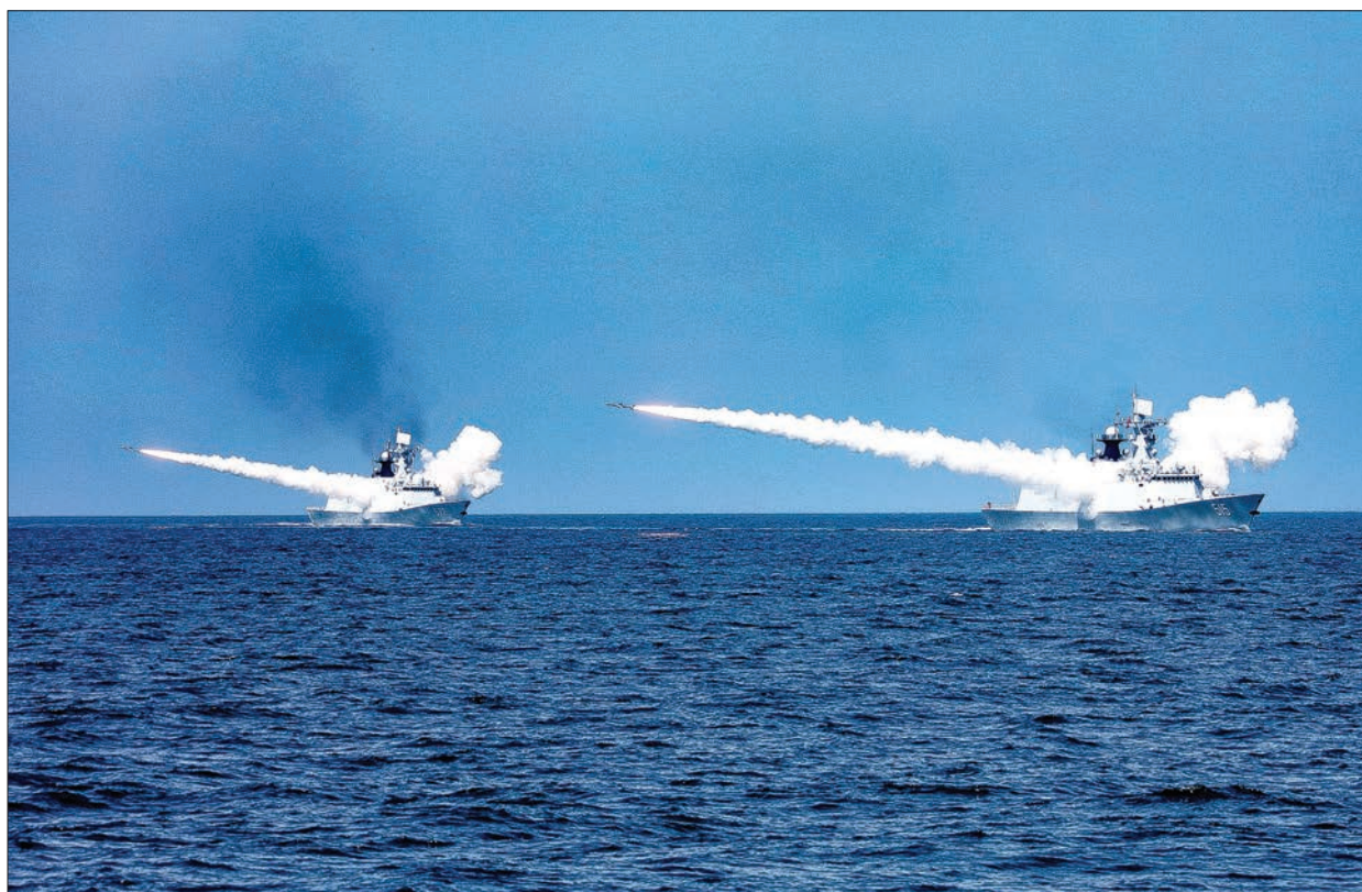
Chinese naval warships fire missiles during a live-fire military drill in the waters of Bohai Sea and Yellow Sea, off China's east coast on 7 August, 2017.