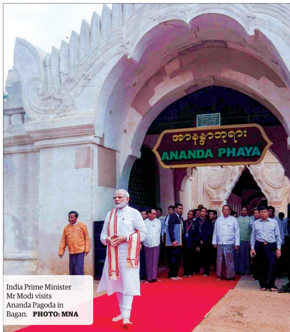
India Prime Minister Mr Modi visits Ananda Pagoda in Bagan.

Mr. Modi then met with the Indians in Myanmar and gave necessary advice. —Myanmar News Agency ■