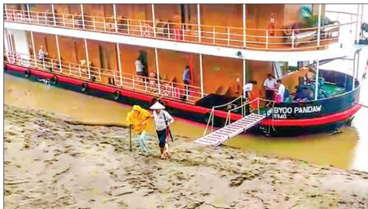
Tourists are visiting along the Chindwin River with a cruise ship.

Among other schools, the programme will be established at the Saunders Weaving Institute located in Amarapura Township, Mandalay Region. The institute was established in 1914. ■