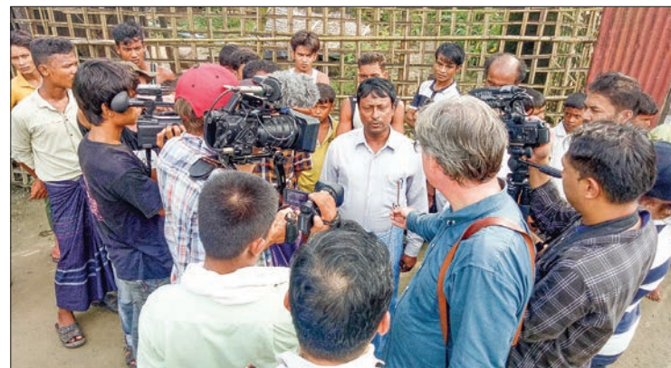
Journalists interviewing local people in Maungtaw.

The media group then proceeded to Shwezar, Kappakaung village tract, and Gonna Village, where they interviewed and photographed some of the 14,000 people of the Islamic faith, who were found to be living in peace and stability, with no extremist terrorists in the village, according to the information department. Daily activities were running