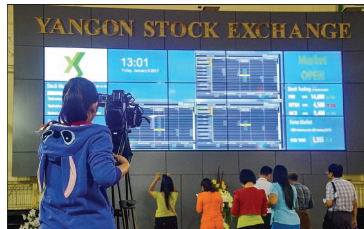
Yangon Stock Exchange in Yangon.

Online trading promises to give the exchange, which has declined in value, more exposure and could encourage more participation. In August, 294,615 shares worth Ks2.29 billion were traded on YSX. And by yesterday, there had been 10,146 shares trades worth an estimated Ks56 million this month. Share prices at the closing time yesterday were Ks14,000 for FMI, Ks3,450 for MTSH, Ks8,800 for MCB and Ks29,000 for FPB. —GNLM ■