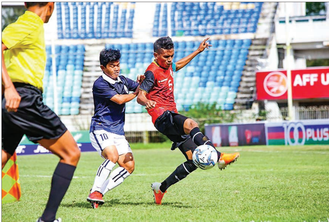
Cambodia and Timor Leste players vying for the ball in yesterday's AFF Group A match at Thuwanna Stadium in Yangon.