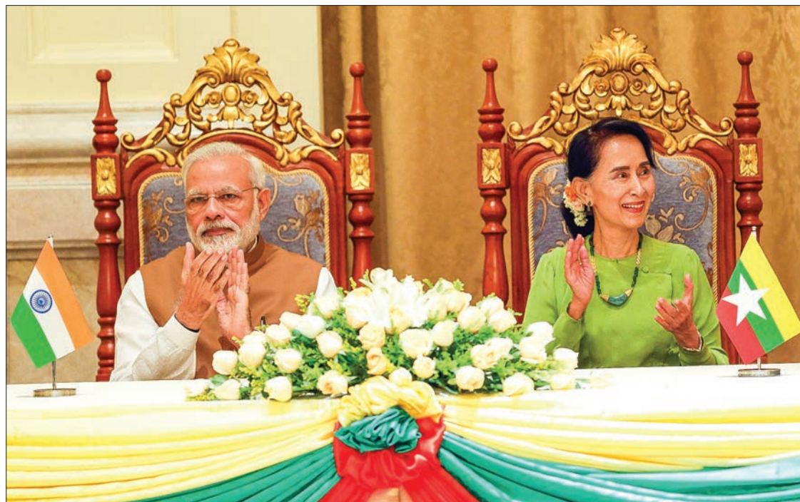
State Counsellor Daw Aung San Suu Kyi and Prime Minister of India Narendra Modi attend a ceremonial welcome at the Presidential Palace in Nay Pyi Taw on 5 September 2017.

26. The two sides welcomed the successful negotiations and finalization of the agreement on border crossing which will help in regulating and harmonizing movement of people across the common land border and thus promote bilateral trade and tourism and directed their senior officials to expeditiously conclude the formalities for its signature. Leaders of both countries agreed