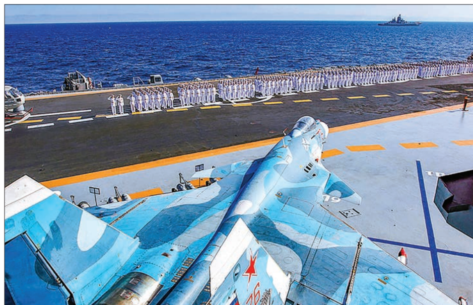
The Russian Navy earlier said the Russian fleet hoped to get a nuclear-powered aircraft carrier by the end of 2030.

MOSCOW — The Russian industry will be able to build aircraft carriers having a displacement of 110,000-115,000 tonnes by 2020, Deputy Prime Minister Dmitry Rogozin said on the Rossiya-24 round-the-clock TV news channel on Tuesday.