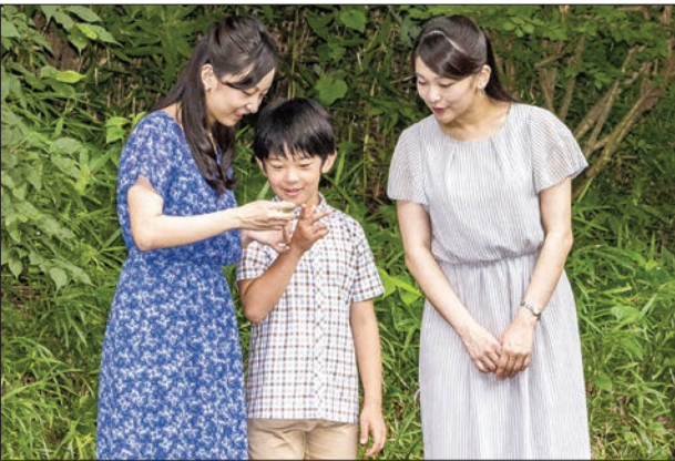
Supplied photo taken on 14 August, 2017, shows Japanese Prince Hisahito (C), Emperor Akihito's grandson, talking with his sisters Princess Mako (R) and Princess Kako. Prince Hisahito, who is third in line to the imperial throne, turned 11 on 6 September.

The interview fuelled speculation among bookmakers that the couple could get engaged soon and comes a day after William revealed that he and his wife Kate were expecting their third child. —Reuters ■