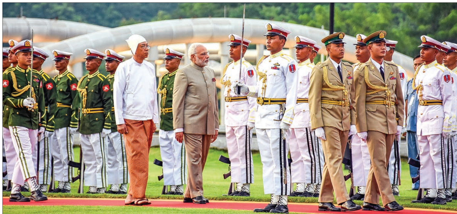
President U Htin Kyaw and Indian Prime Minister Narendra Modi inspect the honour guard at the Presidential Palace in Nay Pyi Taw.

two leaders reviewed developments since the very successful State visits of the President and the State Counsellor of Myanmar to India in August and October 2016 respectively. They reviewed ongoing official exchanges, economic, trade and cultural ties, as well as people-to-people exchanges that reflect the harmony between Myanmar's independent, active and non-aligned foreign policy and India's pragmatic Act East and Neighbourhood First policies. They pledged to pursue new opportunities to further deepen and broaden bilateral relations for the mutual benefit of the people of both countries. They reaffirmed their common aspirations for peace, collective prosperity and development of the region and beyond.