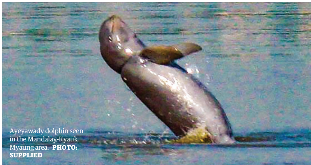
Ayeyawady dolphin seen in the Mandalay-Kyauk Myaung area.

A new Ayeyawady dolphin was born in the Ayeyawady Dolphin Conservation Area in Mandalay Region and Kyauk Myaung, according to U Maung Lay, a fisheries worker from Hsin Kyau village. The