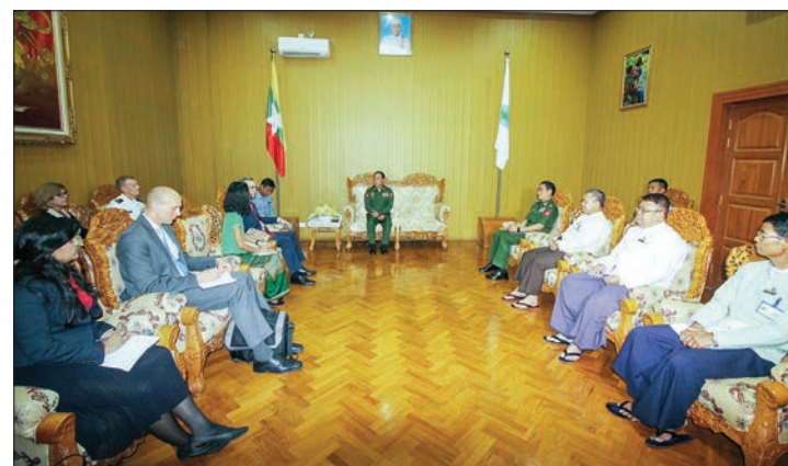
Union Minister for Border Affairs Lt-Gen Ye Aung holds talks with Mr. Scot Marciel, the United States Ambassador to Myanmar, in Nay Pyi Taw.

leased to know the conditions on the ground of terrorist attacks in Maungdaw by international countries; the safety, welfare, and healthcare of civilians; supporting urgently needed food and goods for displaced civilians by helicopters and motorboats; the reconstruction of infrastructure buildings destroyed by ARSA extremist terrorists; the bilateral cooperation of the two countries and the ability to involve international organisations to support the displaced civilians and long-term peace and development of Rakhine State. — Myanmar News Agency ■