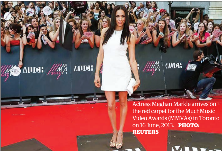
Actress Meghan Markle arrives on the red carpet for the MuchMusic Video Awards (MMVAs) in Toronto on 16 June, 2013.

While observing his parents, he carefully offered flowers and bowed deeply in Nagasaki Peace Park, where the ground zero monument dedicated to victims of the bombing sits. In May, he watched a Summer Grand Sumo Tournament bout at Ryogoku Kokugikan and visited the Sumo Museum as part of an off-school learning program. —Kyodo News ■