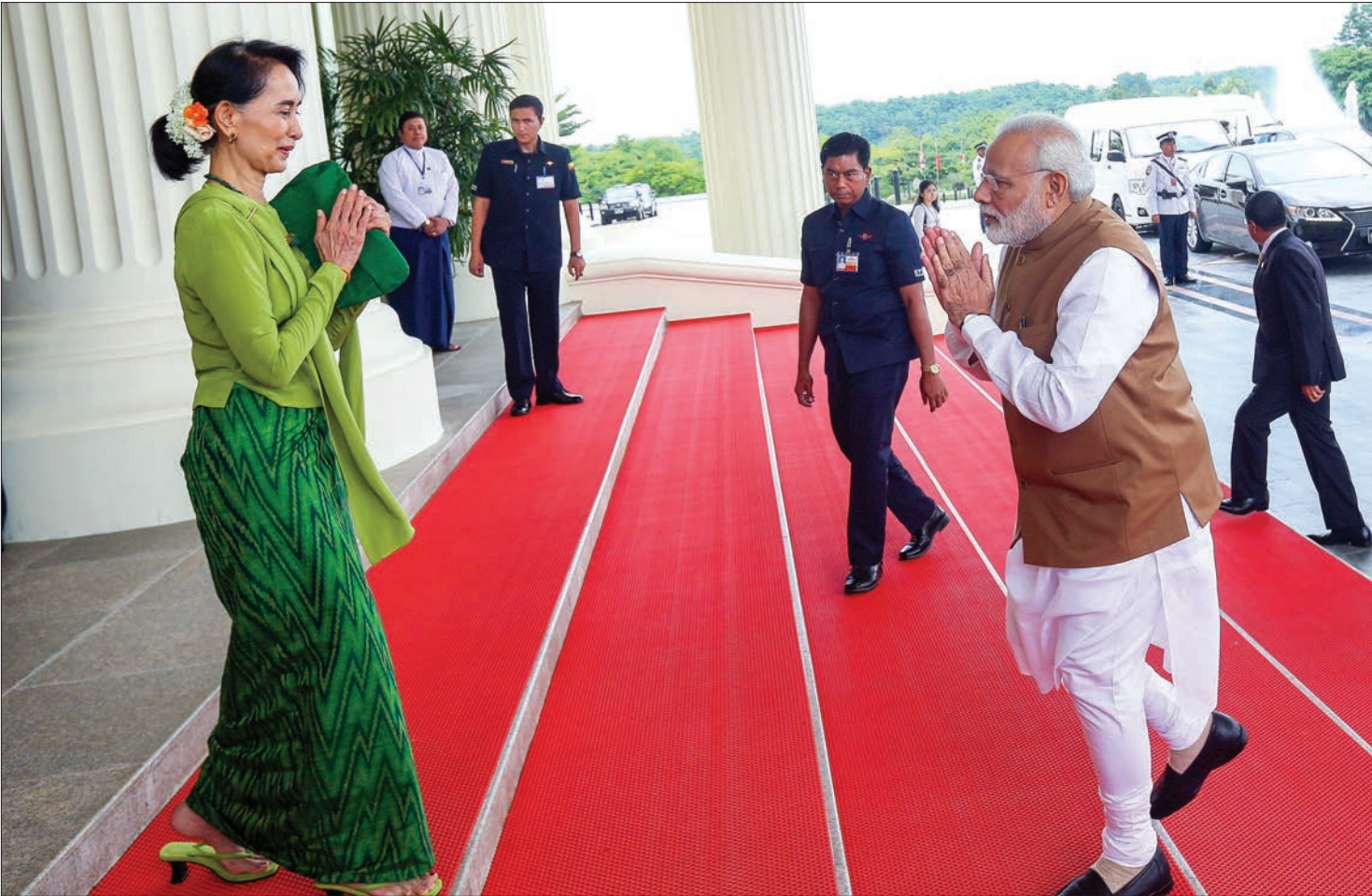
Daw Aung San Suu Kyi (left) welcomes India Prime Minister Mr. Narendra Modi as he arrives in Nay Pyi Taw for a state visit.