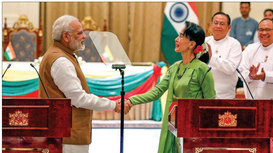
State Counsellor Daw Aung San Suu Kyi and India's Prime Minister Narendra Modi shake hands after their joint press conference in the Presidential Palace in Nay Pyi Taw on 6 September 2017.

14. The two sides noted with satisfaction the cooperation in the field of agricultural research and education, especially through the rapid progress in operationalizing