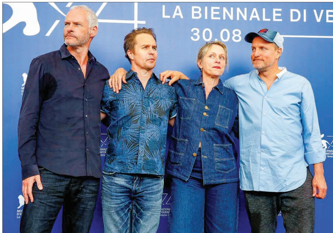
Director Martin McDonagh, actors Sam Rockwell, Frances McDormand and Woody Harrelson pose during a photocall for the movie "Three Billboards Outside Ebbing, Missouri" at the 74th Venice Film Festival in Venice, Italy on 4 September, 2017.

In the movie, director Martin McDonagh said he sought to point to all shades of gray, to see "humanity in everyone and not see anyone as particularly the hero or villain of the piece".