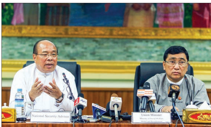
National Security Adviser U Thaung Tun (Left) and Union Minister Dr Win Myat Aye (Right) are seen at the press conference on situation in Rakhine.

At the press briefing, the National Security Advisor provided an update on the general situation in Rakhine State. He stressed that fabricated news on the situation in Rakhine are written and published with the intent to mislead the public. These social media campaigns are aimed to promote the interests of the terrorists by creating further divisions between the already divided communities in northern Rakhine. These also cause international misperception on Myanmar. He urged the media to join hands with the Myanmar government in its efforts to bring in