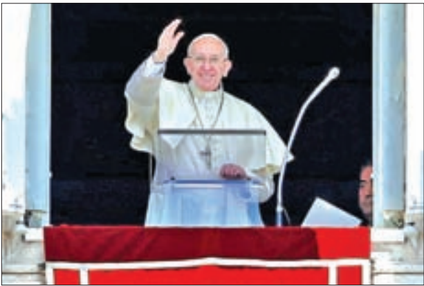
Pope Francis waves as he leads the Angelus prayer in Saint Peter's Square at the Vatican, on 9 July 2017.