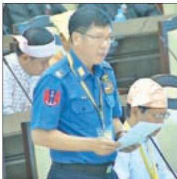
Maj-Gen Myint Nwe.

It was also found that application was made according to regulation to develop these lands and as per decision number 26 of Yangon Division Peace and Development Council exec-