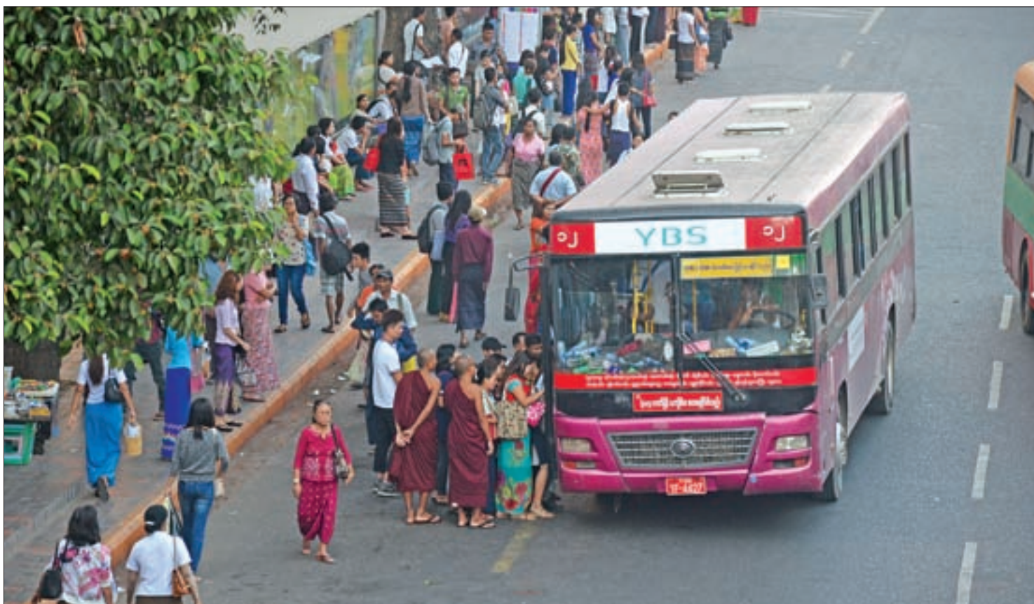
A YBS bus seen at a bus-stop in downtown Yangon.

Due to limitation of space we are only able to publish "Letter to the Editor" that do not exceed 500 words. Should you submit a text longer than 500 words please be aware that your letter will be edited.