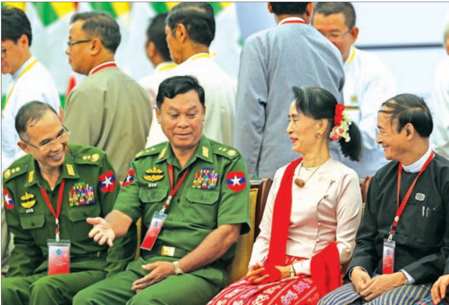
State Counsellor Daw Aung San Suu Kyi (2nd Right) talks to Union Minister for Home Affairs Lt-Gen Kyaw Swe (2nd Left) and Union Minister for Defence Lt-Gen Sein Win (Left) as they pose for documentary photo at the Forum on Myanmar Democratic Transition.