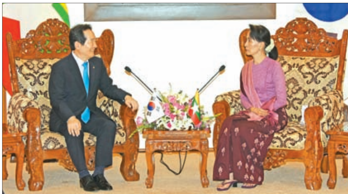
State Counsellor Daw Aung San Suu Kyi holds talks with Mr. Chung Sye-kyun, Speaker of the National Assembly of the Republic of Korea in Nay Pyi Taw yesterday.

During the meeting, they discussed matters on bilateral relations and cooperation, promoting friendly relations between two Parliaments of Myanmar and the Republic of Korea.— Myanmar News Agency ■