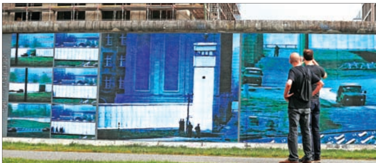
Visitors look at the art installation “Beyond The Wall” by German artist Stefan Roloff at the backside of the East Side Gallery in Berlin, Germany, on 10 August 2017.

The new exhibition features stills from videos that German-American artist Stefan Roloff shot of the Berlin Wall from the west in 1984 — including East German soldiers peering through binoculars, climbing ladders up to watchtowers and walking