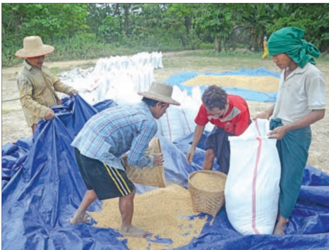
Farmers work as they harvest paddy in a field in Kangyidauk township, Ayeyawady Region in April. The export of rice by sea increased in the last week of July.

China and Bangladesh imported more than 25,000 tons of rice from Myanmar through border trade camps in the same week, decreasing 2,765 tons when compared with the week