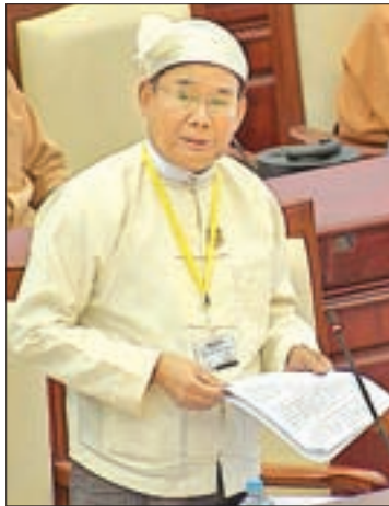
U Ohn Win.

Also at the meeting U Min Naung of Pinlebu constituency raised a question on plan to release farm lands within reserved and protected forest areas to which Union Minister for Natural Resources and Environmental Conservation U Ohn Win said the government had pledged to have 30 per cent of the country's area as reserved and protected forest areas while 10 per cent