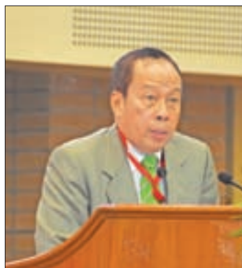
Retired Commander-in-Chief of Indonesia Mr. Agus Widjojo.