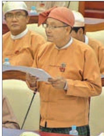
U Kyaw Soe.

is reserved as natural reserve area for climate change. Currently only 24.83 per cent of the country's area is reserved and protected forest area and 5.79 per cent is natural reserve area. As such, there is no plan to release farm lands within reserved and protected areas answered the Union Minister.