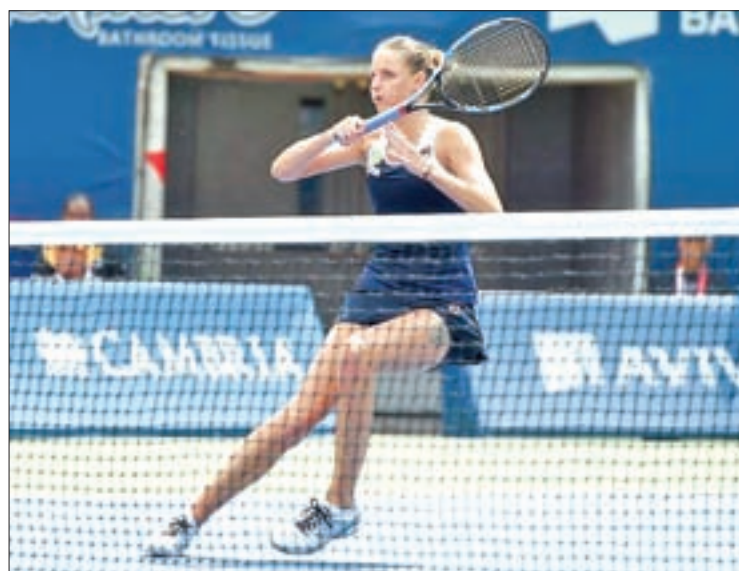
Karolina Pliskova of the Czech Republic plays a shot against Naomi Osaka of Japan (not pictured) during the Rogers Cup tennis tournament at Aviva Centre in Toronto, Ontario, Canada, on 10 August 2017.

Pliskova, playing her first tournament since a shock second round defeat at Wimbledon, had shown signs of rust