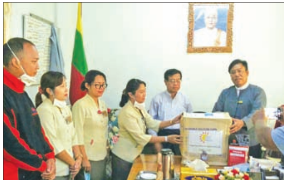
Members of BFM hand over the personal protection equipment to the Hinthada hospital.

The philanthropic foundation has since donated Ks 50 million and 200 sets