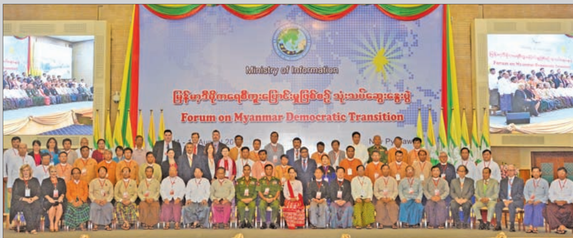
The participants of the first day of the Forum on Myanmar Democratic Transition pose for documentary photo in Nay Pyi Taw. The forum will last for three days from 11 to 13 August at the Myanmar International Convention Center-2. (NEWS ON PAGE-1)