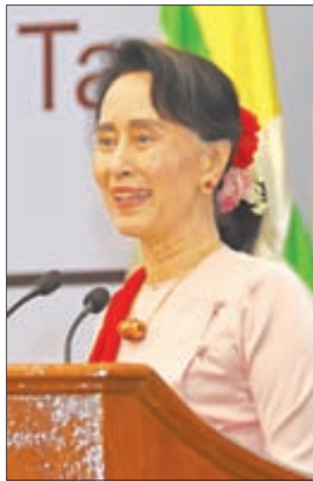
State Counsellor Daw Aung San Suu Kyi.

Thus, we are prioritizing our efforts on nationwide ceasefire. Simultaneously we are exerting our efforts to develop the whole nation. Economic reforms as well aren’t easy ones. In other words, our country lagged behind in development compared to conditions of neighboring countries. While they are making their efforts to the best of their ability, we had no chance to do so. So, we followed them. In spite of it, there are some advantages in following others. That is none other than having a chance to take lessons from their experiences. As regards, the democracy movement as we call it, though named it Democracy Revolution by others, it is in fact an “An Intellectual Revolution.” To gain democracy, it is necessary to bear the spirit of democracy. Only if it is so, our democracy will survive for ever. So, we need to change our mindsets concerning our doc-