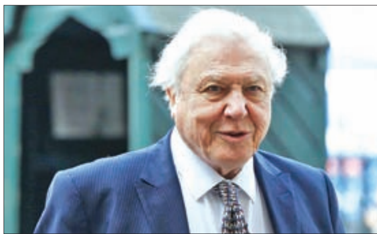
Naturalist David Attenborough arrives for a memorial service for his brother Richard Attenborough at Westminster Abbey in London, on 17 March 2015.

were mired in villains of the time,” he told Reuters. “I was trying not to wallow in all the negativity that was around by beaming in on what was the most joyous thing I could think of. And it was him as a young man becoming the Attenborough we know.”