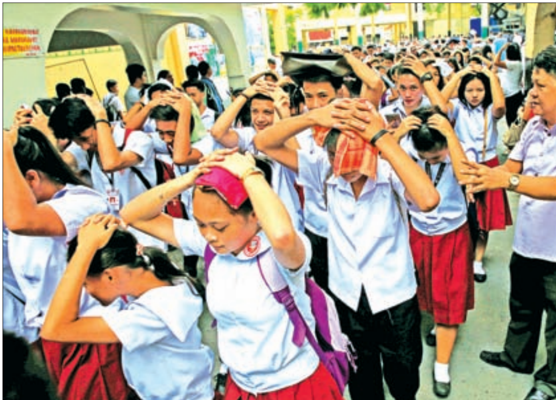
Students use their hands to cover their heads as they evacuate their school premises after an earthquake of magnitude 6.2 hit the northern island of Luzon and was felt in the Metro Manila, Philippines, on 11 August 2017, shaking buildings and forcing the evacuation of offices and schools.

The Philippines is on the geologically active Pacific Ring of Fire and experiences frequent earthquakes.—Reuters ■