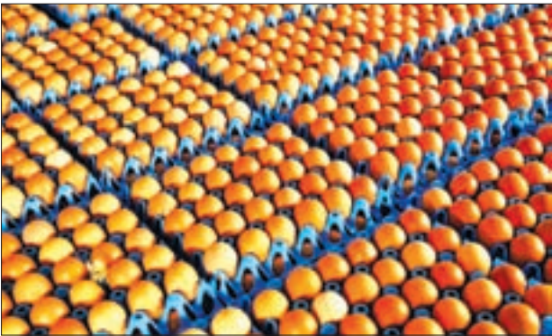
Eggs are packed to be sold at a poultry farm in Wortel near Antwerp, Belgium, on 8 August 2017.

BRUSSELS — The European Commissioner charged with food safety has called for a meeting of ministers and national watchdogs to discuss the fallout of an eggs contamination scare that has led to finger pointing between several European Union members. Tensions have risen between agricultural ministers in Belgium, the Netherlands and Germany after traces of moderately toxic insecticide fipronil were found in batches of eggs, linked by authorities to a Dutch supplier of cleaning products. While initially the Belgian food safety regulator drew criticism from abroad for not acting fast enough after being made aware of fipronil contamination, Belgium's agriculture minister