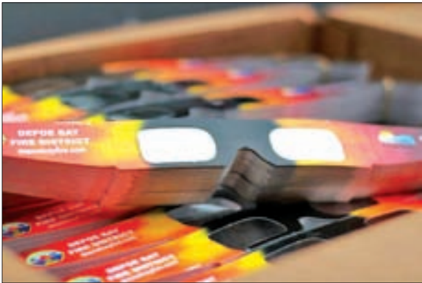
Solar eclipse glasses that will be handed out by the community are pictured in Depoe Bay, Oregon, US, on 8 August 2017.