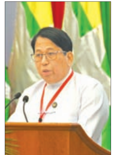
Union Minister for Information Dr Pe Myint.

Following the opening speech of the State Counsellor, Union Minister for Information Dr Pe Myint delivered an opening speech, expressing his hope that the forum would produce a clear image which shows the point where Myanmar arrived currently in its democratic transition.