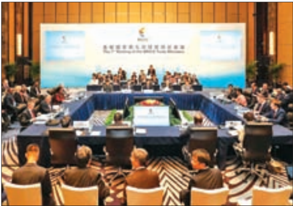
The 7th Meeting of the BRICS Trade Ministers is held in Shanghai, east China on 1 August, 2017. Trade ministers of BRICS nations are discussing trade facilitation, economic and technological cooperation, capacity building and the multilateral trade system at their annual meeting in Shanghai, according to China's minister of commerce.

hostages. More than 600 rebels and soldiers have been killed in the unrest. Duterte last month submitted to Congress a budget of 3.76 trillion Philippine pesos ($15 billion) for next year, including 145 billion pesos for the defence. "We're willing to help," said Senator Panfilo Lacson, adding that soldiers were battle-weary after two months of fighting in Marawi. "We need fresh legs, so in legislation we can help by fast-tracking the budget to increase the troop ceiling." He said the president also asked to boost the police force by 10,000 men, recruiting more to be deployed as commandos to help the military fight insurgents.—Reuters ■