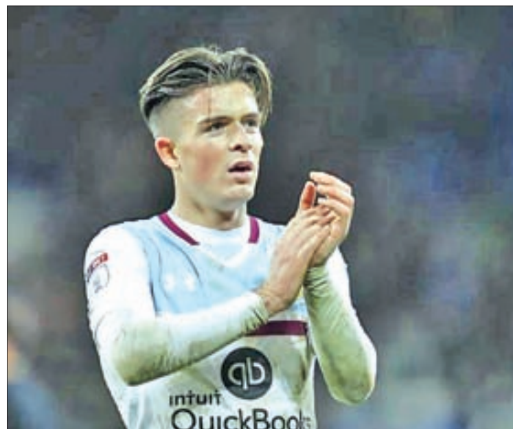
Aston Villa's Jack Grealish.

"We're obviously disappointed with the injury. He's still in hospital and things aren't great.