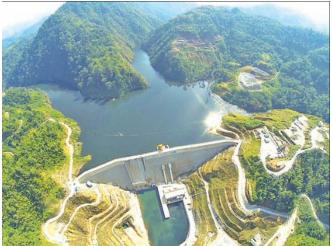
The aerial view of Upper Paunglaung hydroelectricity power project in Pyinmana Township, Nay Pyi Taw.

According to the estimated calculation, the Paunglaung River is capable of generating 2 billion kilowatts per hour, annually.—GNLM ■