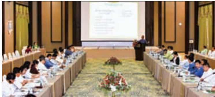
Workshop on the principle and law of investment for ministries held in Nay Pyi Taw yesterday.

In attendance at the meeting were the Deputy Minister for Planning and Finance, the Myanmar Investment Commission Secretary, the Director-General of Directorate of Investment and Company Administration, permanent secretaries and deputy permanent secretaries of related ministries. —Myanmar News Agency ■