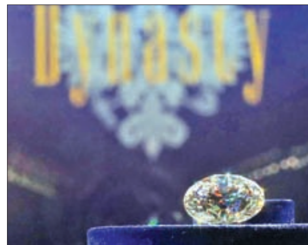
A photographer takes a picture of the main 51.38-carat diamond on display during Russian miner Alrosa's presentation of the Dynasty polished diamonds collection in Moscow, Russia on 1 August, 2017.

"As to overall characteristics, it is unprecedented in the history of Russia," Alrosa said. The other stones in the collection are a 16.67-carat round-cut diamond, a 5.05-carat