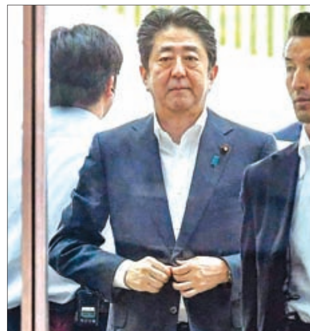
Japanese Prime Minister Shinzo Abe arrives at his office in Tokyo on 2 August, 2017, a day before his scheduled reshuffle of his Cabinet and the leadership of his Liberal Democratic Party.

Takeshita, who once served as disaster reconstruction minister, may take a new party post, according to the sources. Meanwhile, Bunmei Ibuki, a former lower house speaker, has rejected a request from Abe to become education minister, the sources said. —Kyodo News ■