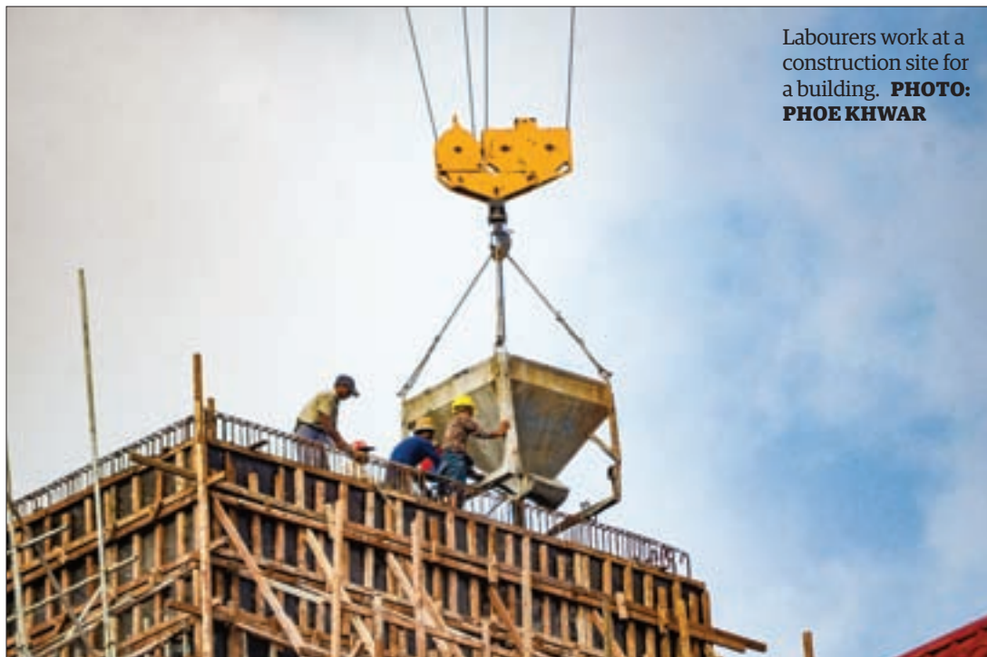
Labourers work at a construction site for a building.