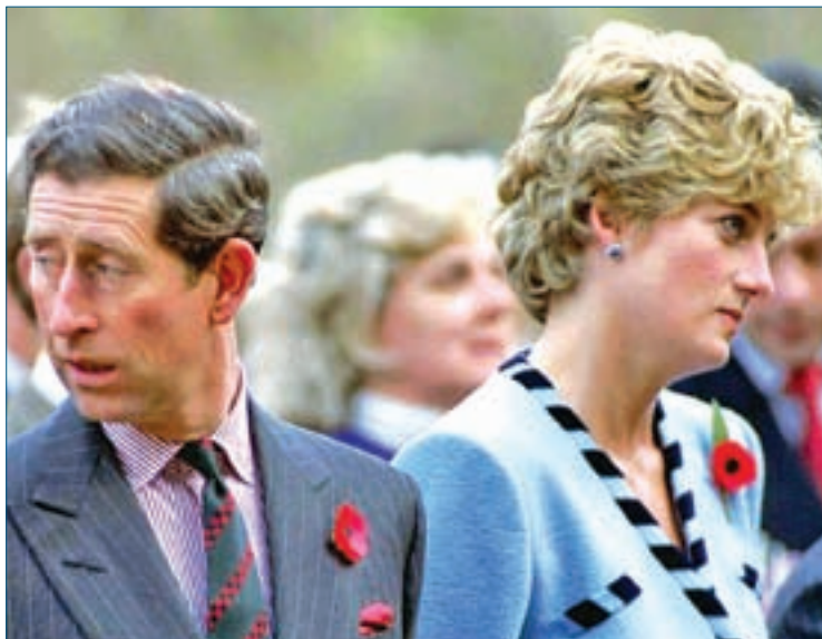
Britain's Princess Diana and Prince Charles look in different directions during a Korean War commemorative service in November 1992.

know there was no requirement for it from his case," Diana says. "Sort of once every three weeks."