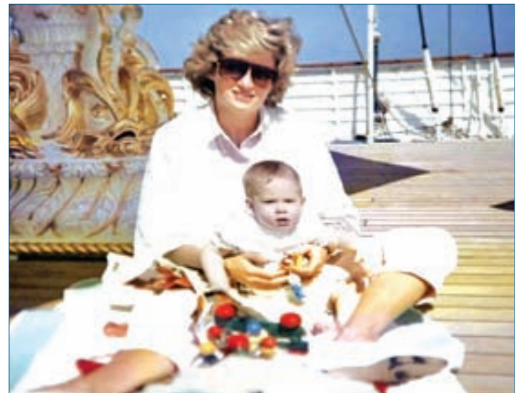
Britain's Prince Harry and the late Diana, Princess of Wales are seen in an undated photo released by Kensington Palace on 24 July, 2017.

After a lengthy court battle, the tapes were handed to Settelen.