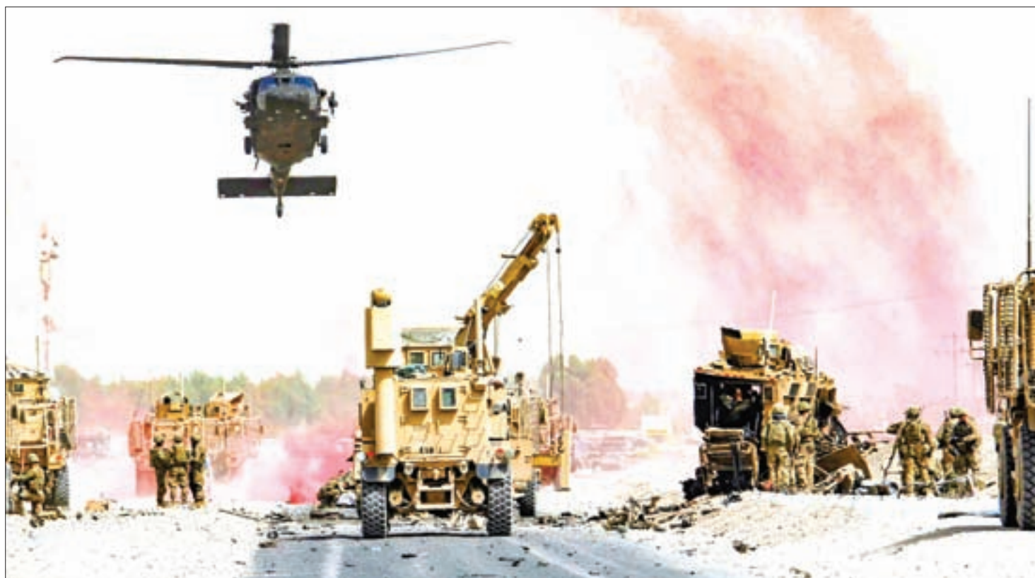
US troops assess the damage to an armoured vehicle of NATO-led military coalition after a suicide bomber's attack in Kandahar province, Afghanistan on 2 August, 2017.