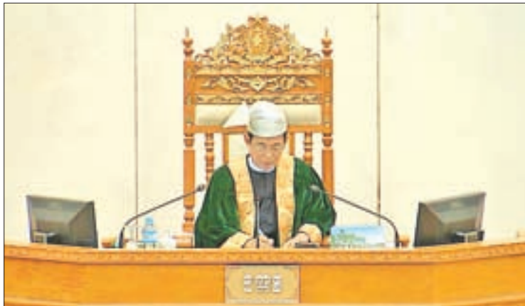
Pyithu Hluttaw Speaker U Win Myint.

"To implement successfully the Tamu Trade Zone, the Kalewa-Kyigone-Tamu Road on the Myanmar side needs to be up-