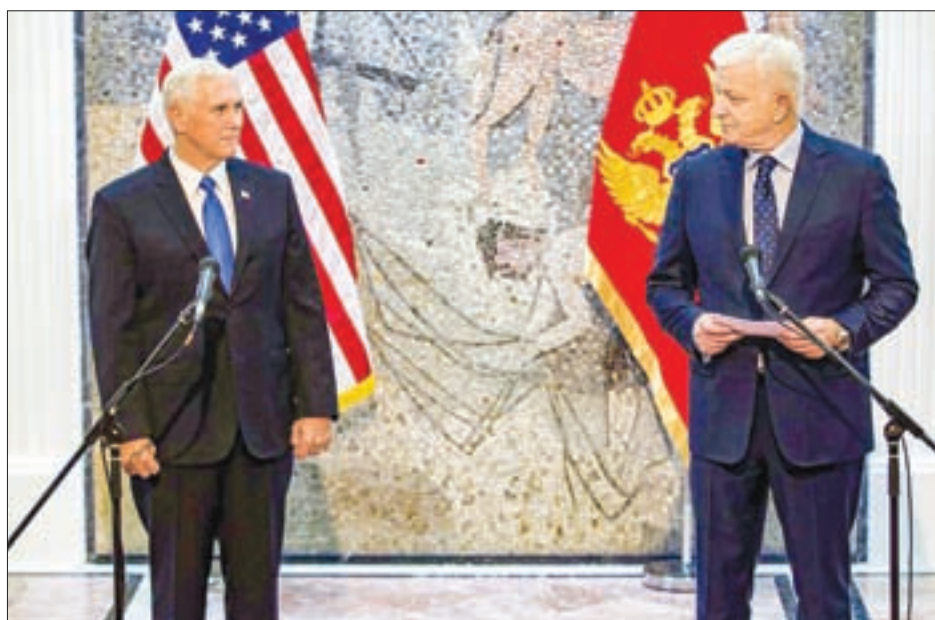
US Vice President Mike Pence and Montenegrin Prime Minister Dusko Markovic look at each other ahead of their meeting in Podgorica, Montenegro on 2 August, 2017.

On Wednesday, Pence underscored Washington's commitment to Euro-Atlantic ties, a commitment many in Europe have questioned with the rise to power of President Donald Trump who had lambasted NATO as "obsolete" and argued in favor of better relations with Russia.