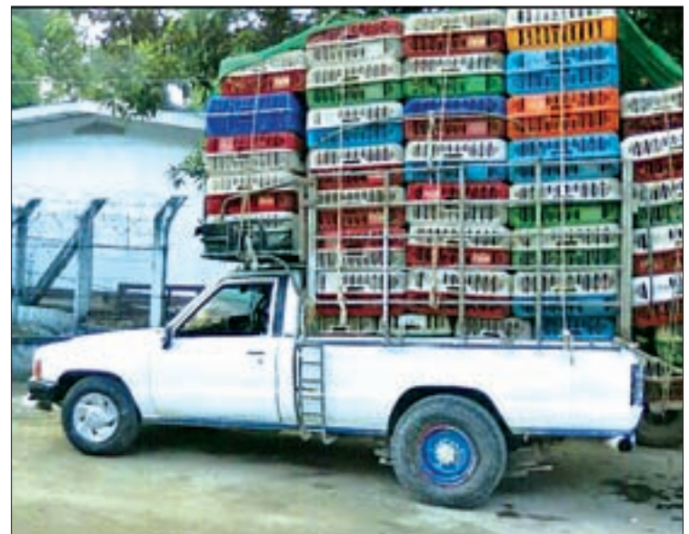
Vehicle carrying chicken cages.

trict and township maternal and Child Welfare Association members, officials and shop owners of the market and local populace. ■