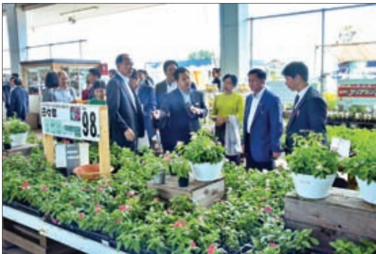
Senior General Min Aung Hlaing observes Komeri Home Center, touring display stalls in the Centre in Tokyo.