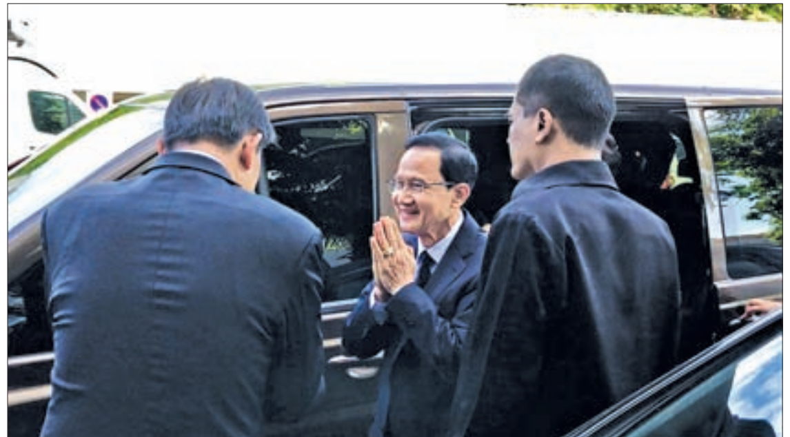
Former Thai Prime Minister Somchai Wongsawat (C) arrives at the Supreme Court in Bangkok on 2 August, 2017. He was acquitted of malfeasance in office in connection with a deadly crackdown on antigovernment protesters in 2008.

Aside from Somchai, who is the brother-in-law of ousted Prime Minister Thaksin Shinawatra, the defendants also included former Prime Minister