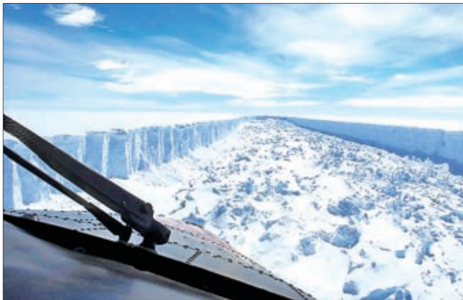
Larsen C ice shelf in Antarctica.

Ten years ago, Chilingarov and a team of polar explorers descended to the Arctic seabed at the intersection of geographical meridians in the Mir-1 and Mir-2 bathyscaphes. The expedition was part of a program to explore the Arctic continental shelf