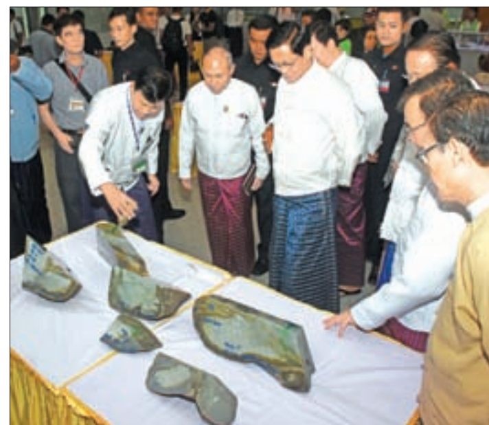
Vice President U Henry Van Thio looks at jade stones displayed at the 54 th Myanmar Jade and Gems Emporium in Nay Pyi Taw.

As for jade and minerals, there are 20 lots of fine jade works owned by the State, 20 lots of State-owned crude jade, 2,900 lots of crude jade by State-joint ventured companies, 3,545 lots of crude jade owned by the private sector, 16 lots of other mineral crude gems, 25 lots of