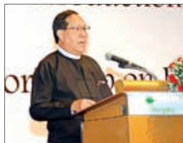
U Htun Htun Oo, Union Chief Justice.

A ceremony for the start of the introduction to judicial ethics for judges was held yesterday at the Thingaha Hotel in Nay Pyi Taw, with the Union Chief Justice issuing a solemn address.