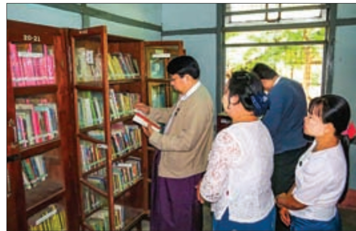
Union Minister for Information Dr Pe Myint inspects the People's Library, at Wundwin Township (IPRD).

Dr Pe Myint arrived at the office of Wundwin Township IPRD later in the afternoon, inspecting the People's Library, the children's reading room and the museum. The Union Minister instructed officials to accumulate more traditional tools and equipment which were being exhibited in the small museum that is part of the library, as well as to compile concise excerpts of dates of scripture, authors' or compilers' names and subject matter for the museum's ancient palm-leaf writings. —Myanmar News Agency ■