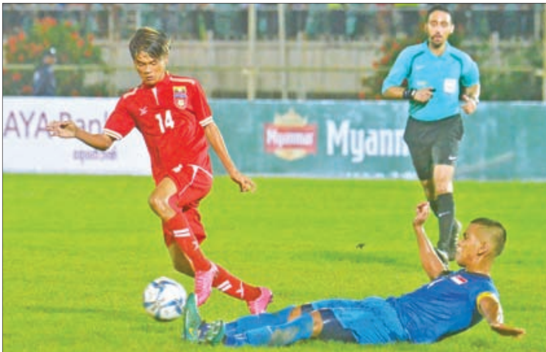
Myanmar and Singapore players vying for the ball during ASIAN U-23 qualification.

Semi-final matches will be on 27 August. The final match and the match for third place will be on 29 August. ■