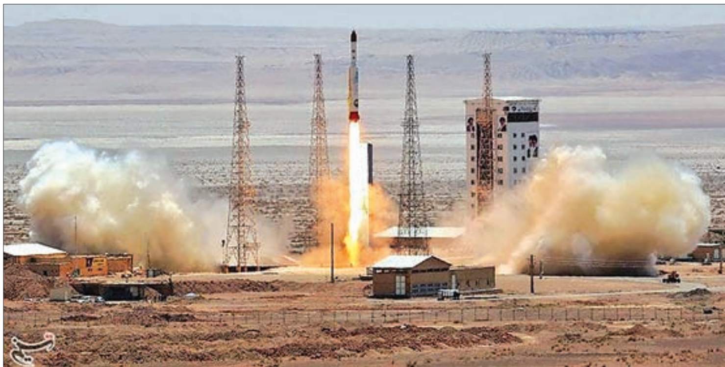
Simorgh rocket is launched and tested at the Imam Khomeini Space Centre, Iran, in this handout photo released by Tasnim News Agency, on 27 July 2017.