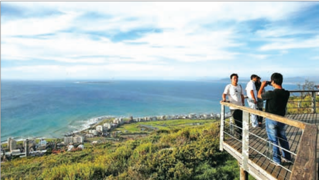
Tourists take pictures from a viewing platform overlooking Cape Town's Atlantic beachfront and Robben Island, where former President Nelson Mandela spent much of his 27 year incarceration, in this picture taken in 2013.

The country's credit rating, meanwhile, has been downgraded to junk by two of the top three