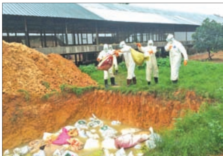
Dead chicken are buried in Dawei.