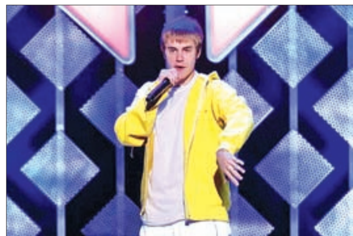
Justin Bieber performs at Z100’s Jingle Ball in Manhattan, New York, US, December 9, 2016.

The accident happened as Bieber, 23, was pulling out of parking lot following a church