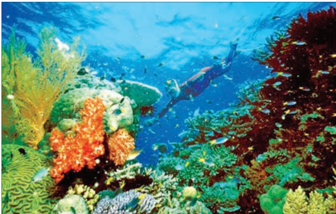
A tourist swims on the Great Barrier Reef in this undated file picture.

"This project is ambitious, but we want as many people as possible on board the electric vehicle revolution, as part of our