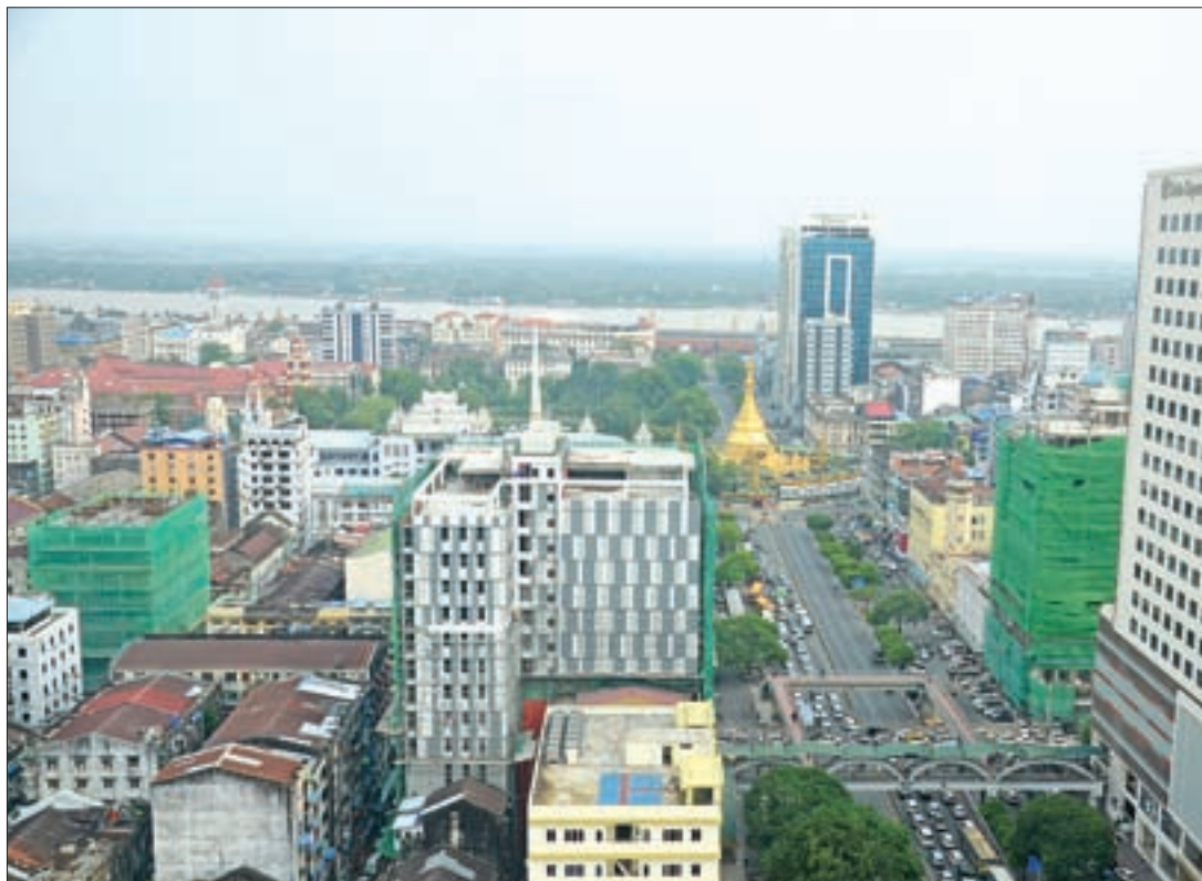
Downtown Yangon .

Due to limitation of space we are only able to publish "Letter to the Editor" that do not exceed 500 words. Should you submit a text longer than 500 words please be aware that your letter will be edited.