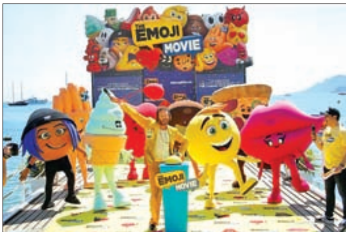
Actor T. J. Miller poses during a photocall for the film “The Emoji Movie” at 70th Cannes Film Festival, Cannes, France, on 16 May 2017.

The consortium approves about 50-100 new emojis every