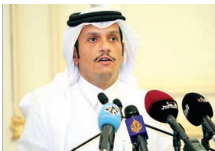
Qatar’s Foreign Minister Sheikh Mohammed bin Abdulrahman al-Thani attends a joint news conference with French Foreign Minister Jean-Yves Le Drian in Doha, Qatar, on 15 July 2017.

In June, Qatar asked the Montreal-based UN aviation agency to intervene after its Gulf neighbours closed their airspace to Qatar flights. While Egypt last week accused Qatar of adopting a “pro-terrorist” policy that violated UN Security Council resolutions and described it as “shame-