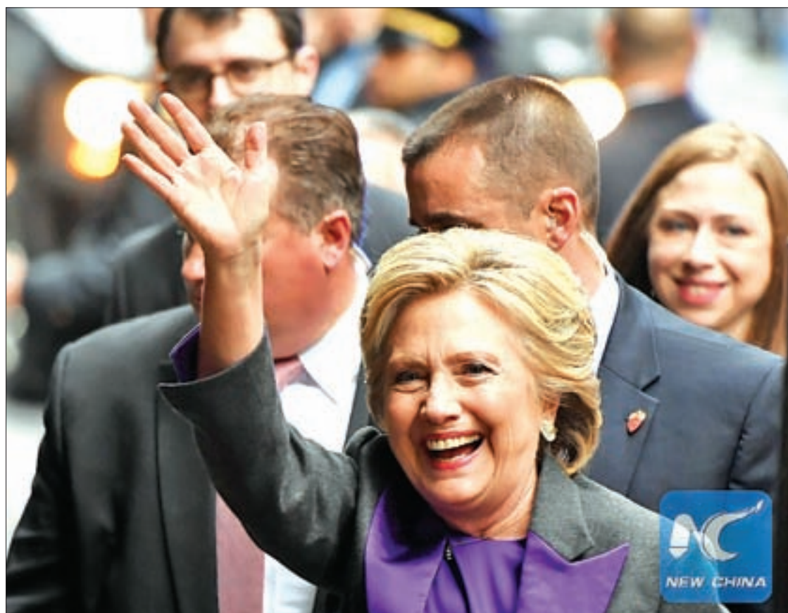
File photo taken on 9 November 2016 shows that US Democratic presidential nominee Hillary Clinton arrives for her first public concession speech after losing the presidential election to the Republican candidate in New York, the United States.

“This is her most personal memoir yet,” said Simon & Schuster on its Web page for the book in which for the first time Clinton reveals “what she was thinking and feeling during one of the most controversial and unpredictable presidential