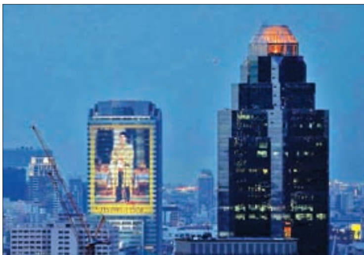
A portrait of Thai King Maha Vajiralongkorn is seen on a building on the eve of his 65th birthday in Bangkok, Thailand, on 27 July 2017.

The Thai government is officially in a year-long period of mourning following the death last October of King Bhumibol Adulyadej, Vajiralongkorn's father, which means government offi-