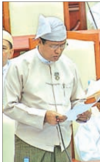
U Maung Myint.

U Ohn Win, Union Minister for Natural Resources and Environmental Conservation,