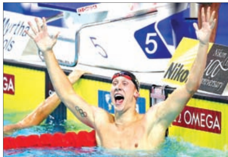
Chase Kalisz of the US celebrates winning the race at 17th FINA World Aquatics Championships - Men's Medley 200m 100m final - Budapest, Hungary, on 27 July 2017.

Hagino touched for silver 0.05 seconds back. "I would've definitely laughed at you months ago if you had told me this was going to be my first title," Kalisz added. "I was over three seconds slower."—Reuters ■