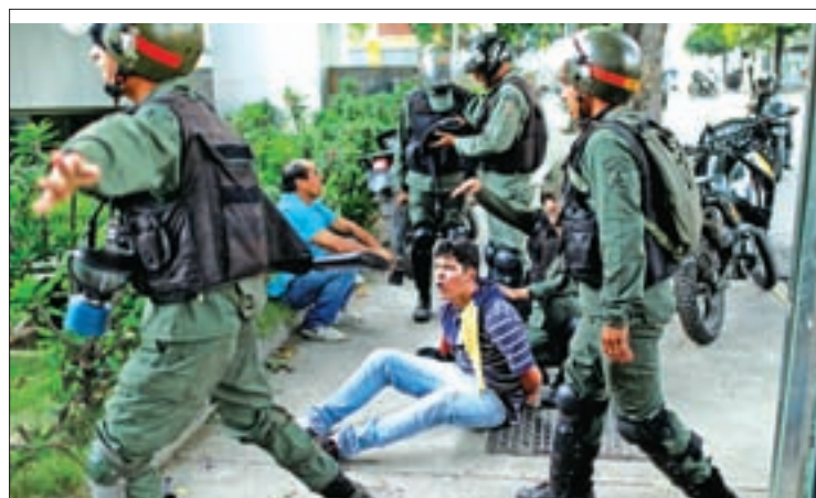
A demonstrator is detained at a rally during a strike called to protest against Venezuelan President Nicolas Maduro's government in Caracas, Venezuela on 27 July 2017.