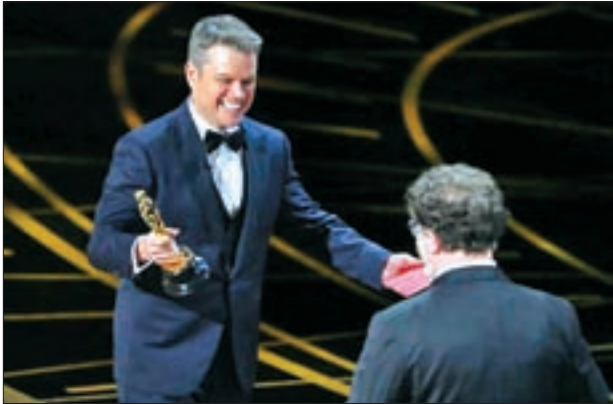
Matt Damon presents Best Original Screenplay winner Kenneth Lonergan for "Manchester by the Sea" with his Oscar in Hollywood, California, US, on 26 February 2017.

"(Distributor) Paramount was very much in doubt over whether to present the film at a festival in order not to make any spoilers," festival direc-