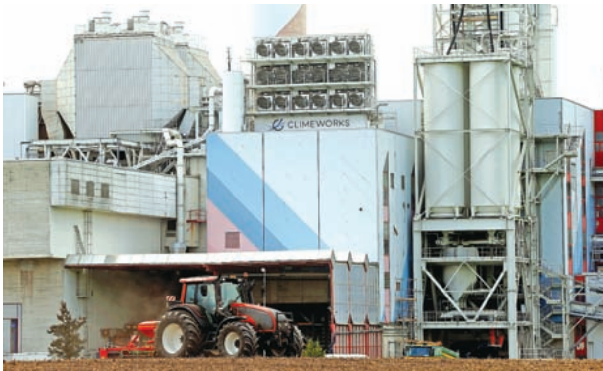
A facility for capturing CO2 from air of Swiss Climeworks AG is placed on the roof of a waste incinerating plant in Hinwil, Switzerland, on 18 July 2017.