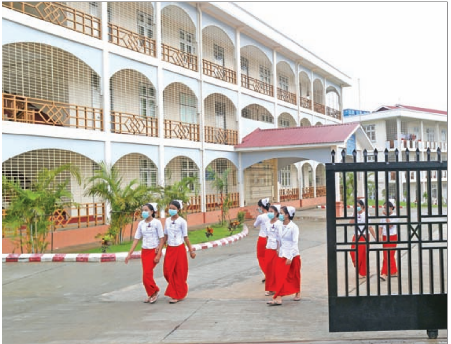
SEE PAGE-9 Nurses wearing masks are seen in Nay Pyi Taw. Two H1N1 patients are receiving medical care at a hospital in Nay Pyi Taw.

"Many people assume they have contracted a normal flu, as the symptoms with the influenza are quite similar and this is one of the causes of death as people receive late treatment from it. Knowledge sharing seminars are planned to be held in schools, hospitals, offices, factories, bus stops, train stations, ports and airports,