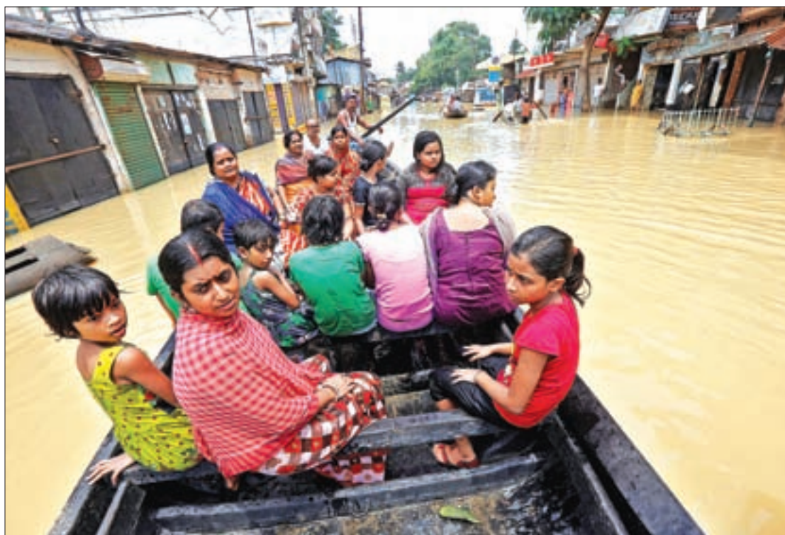
People use a boat as they try to move to safer places along a flooded street in West Midnapore District, in the eastern state of West Bengal, India, on 27 July 2017.