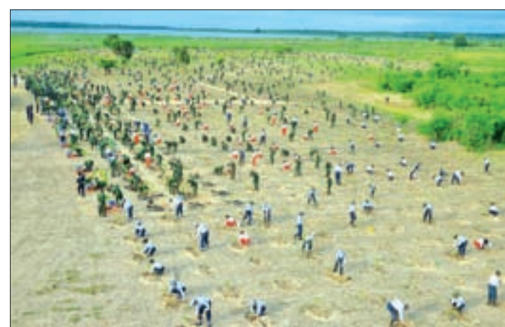
Family members of the Tatmadaw plant trees.

Next, Senior General Min Aung Hlaing and wife planted teaks as Deputy Commander-in-Chief of Defence Services Commander-in-Chief (Army) Vice-Senior General Soe Win, union ministers and wives, high ranking Tatmadaw officers and wives of Commander-in-Chief