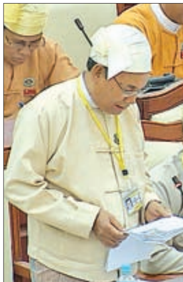
U Ohn Win.

A motion was passed for the Union Government to handle illegal logging and illegal timber trade with the full force of the law at the Pyithu Hluttaw yesterday.