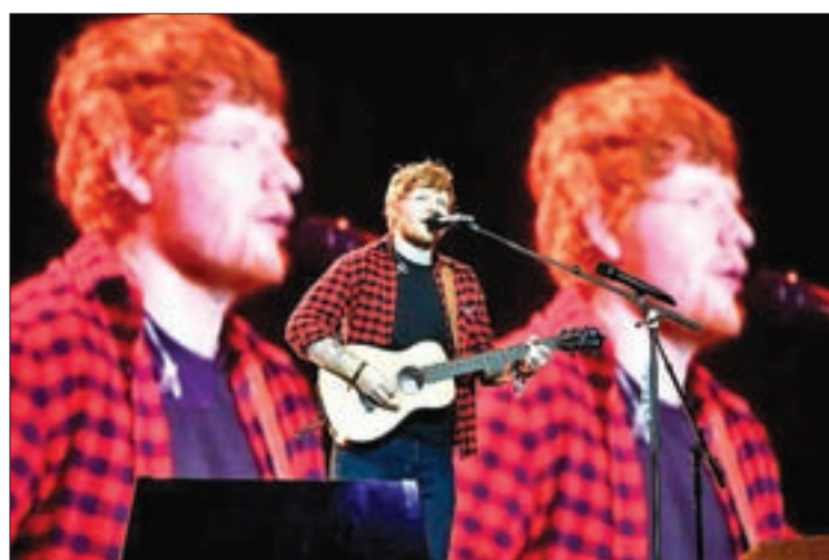
Ed Sheeran performs on the Pyramid Stage at Worthy Farm in Somerset during the Glastonbury Festival in Britain, on 25 June 2017.