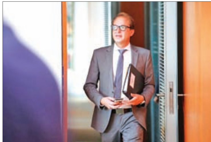
German Transport Minister Alexander Dobrindt attends the weekly cabinet meeting at the Chancellery in Berlin, Germany, on 19 July 2017.

The 4-million tally includes about 2.5 million diesel cars VW has had to recall in Europe's largest auto market over its