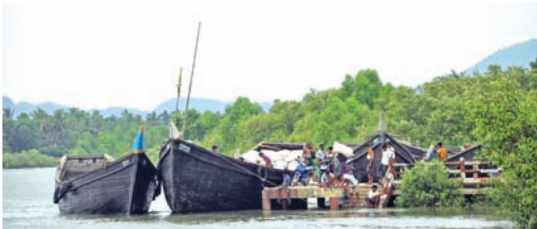
Workers loading boats with bags of rice in Maungtau.