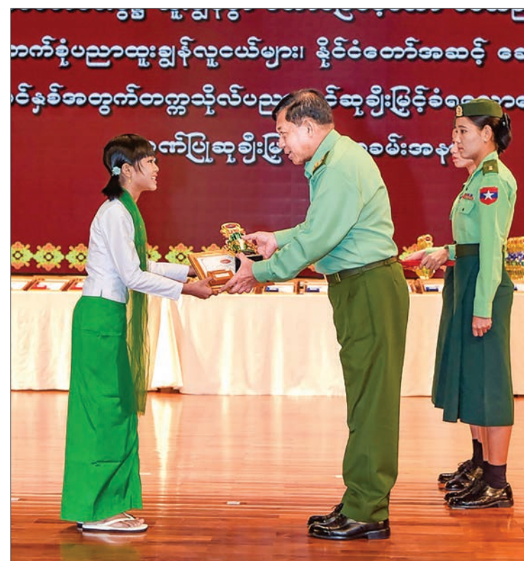
C-in-C Senior General Min Aung Hlaing awarding an outstanding female student from a Tatmadaw family.

and daughters of Tatmadaw members who passed the 2016-2017 matriculation examination and award winning students of national level essay, painting and cartoon competitions. Next, awards and certificate of honors were handed out to Tatmadaw Basic Education High Schools and Tatmadaw schools with best passing results, Tatmadaw members and sons and daughters of Tatmadaw members who passed the 2016-2017 matriculation examination with distinctions and award winning students of national level essay, painting and cartoon competitions. —Myanmar News Agency ■