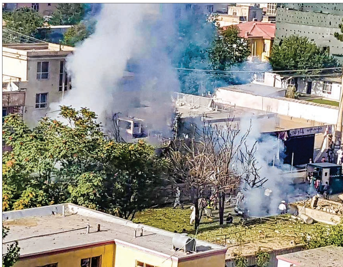
Smoke rises at Zawul Institute of Higher Education after an explosion near the institute in Kabul, Afghanistan on 24 July, 2017 in this still photograph uploaded on social media.

Government security forces said a small bus owned by the Ministry of Mines had been destroyed in the blast but the National Directorate for Security, the main intelligence agency, said none of its personnel had been hit.