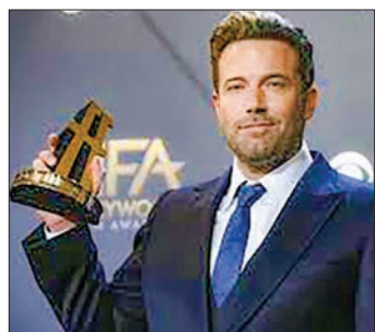
Ben Affleck.

"I'd love to do it as long as they'll have me. Eventually it'll be somebody else, and I'm sure they'll get somebody great. But