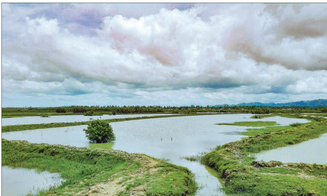
Shrimp breeding farms, like the one in this picture, contributes to the marine shrimp exports from Maungtaw to other neighbouring country.

Currently, inshore fishing industry was closed for security after 2016 October armed attack and only shrimp breeding is being operated. It has been learnt that Maungtaw is the best region for breeding freshwater