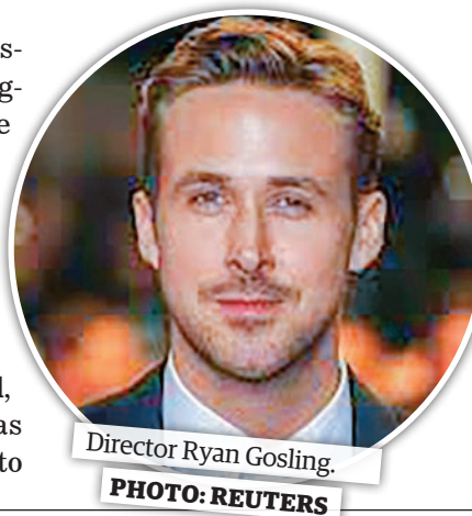
Director Ryan Gosling.

Gosling said he was in a constant state of nervousness while working with Ford, who is reprising his role as Rick Deckard in the sequel to