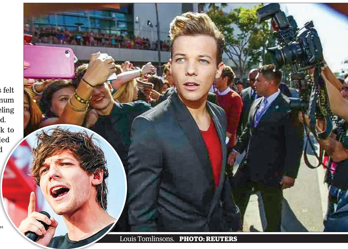
Louis Tomlinson.