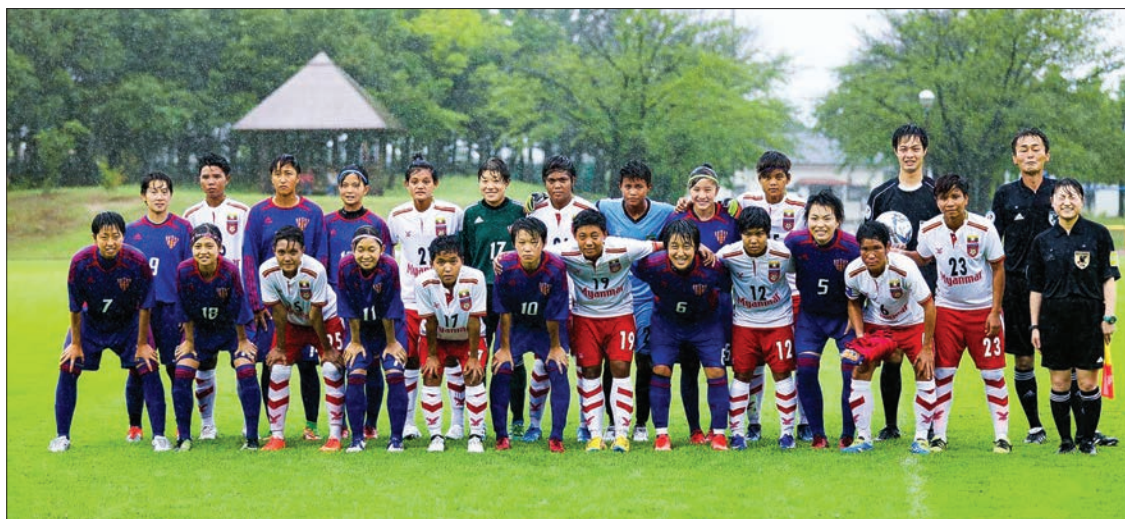
Myanmar and Japan teams pose for the photo in the playground.