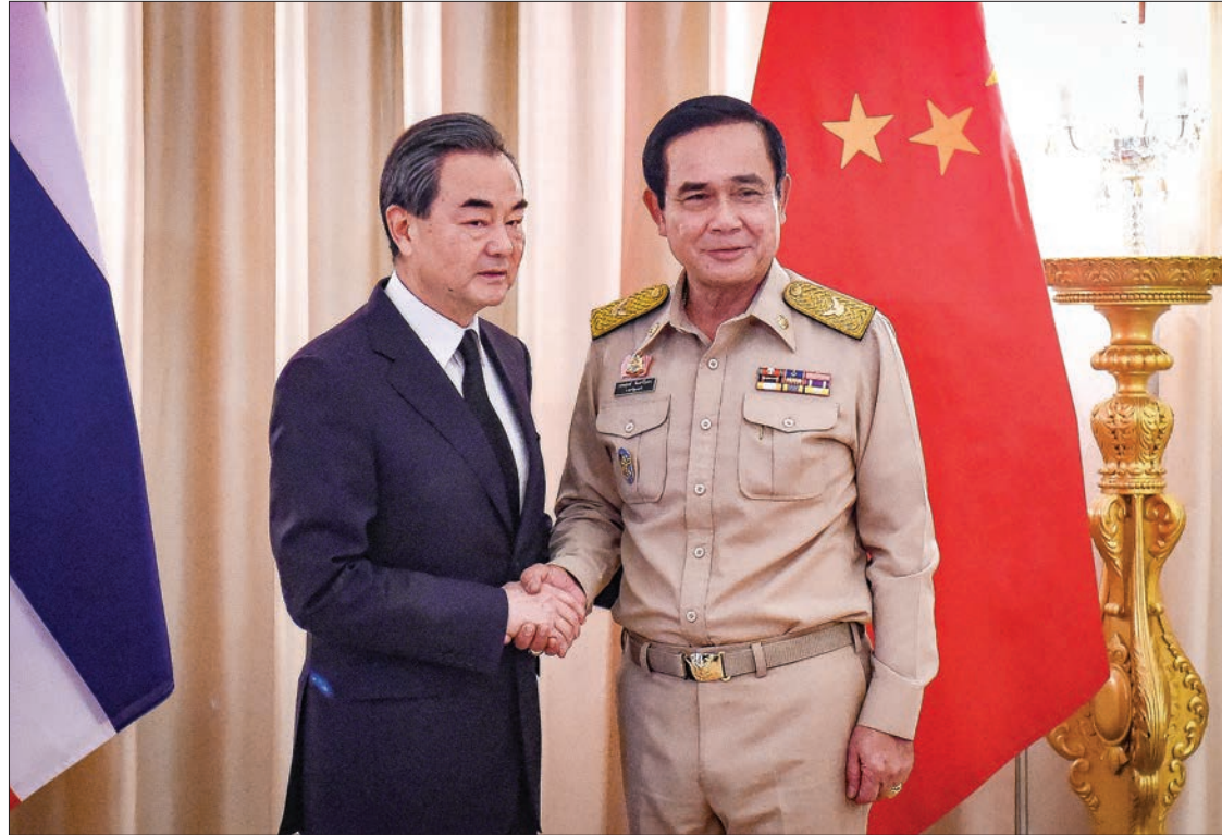
Chinese Foreign Minister Wang Yi (L) shakes hands with Thai Prime Minister Prayuth Chan-O-cha (R) at Government House in Bangkok on 24 Thailand July, 2017.

Addressing the South China Sea issue, Wang, on an official visit to Bangkok, told reporters China would like to “maintain stability in the South China Sea, abiding by the terms