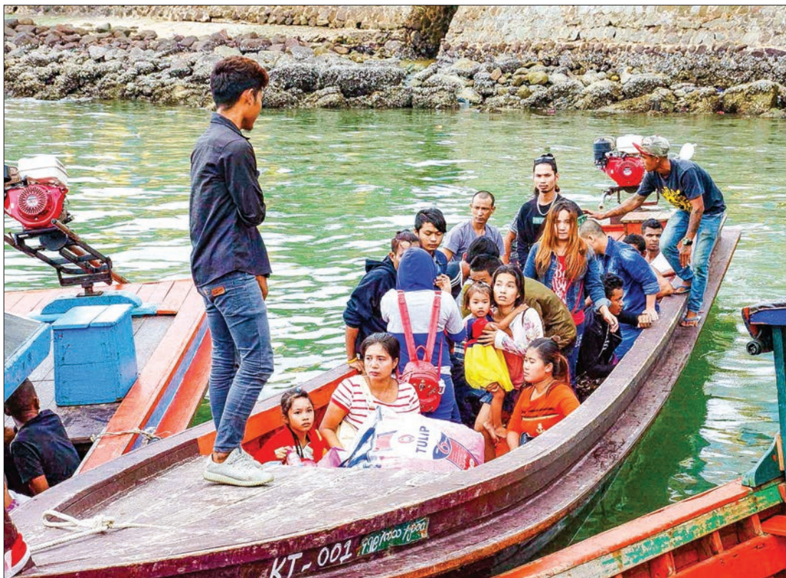
File photo taken on 20 July shows Myanmar migrants workers arrive Kawthoung on Thai-Myanmar Border.

gnlmdaily@gmail.com www.globalnewlightofmyanmar.com www.facebook.com/ globalnewlightofmyanmar