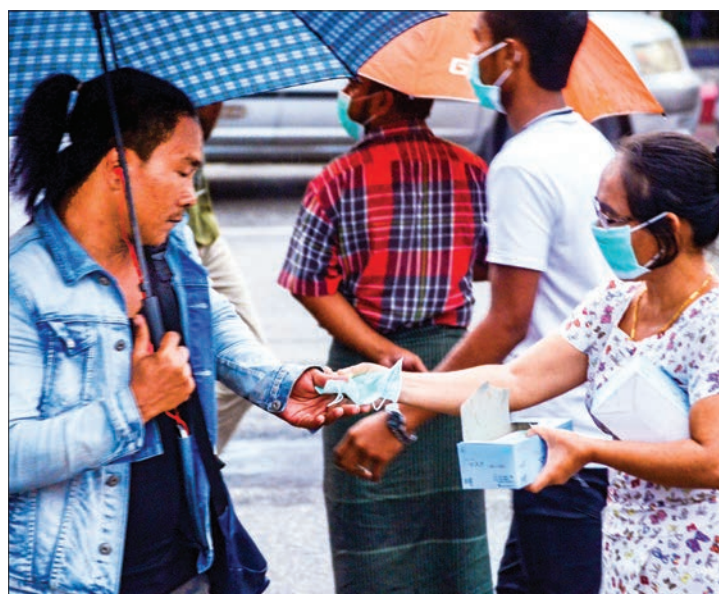
A woman gives out free masks to passerbys as the Seasonal Influenza H1N1 arrives in Yangon.

H1N1 disproportionately affects children, the elderly and other people with weakened immune systems. In 2009, the virus spread to most countries in the world. At least 66 people contracted it in Myanmar, according to official comments carried by media at the time.—Ko Moe (GNLM) ■