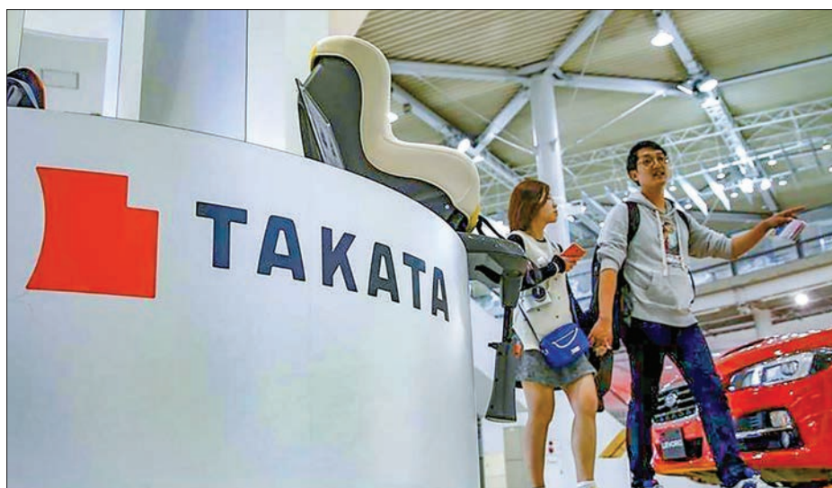
Visitors walk behind a logo of Takata Corp on its display at a showroom for vehicles in Tokyo, Japan, on 6 November 2015.

"We would have very serious concerns if man-