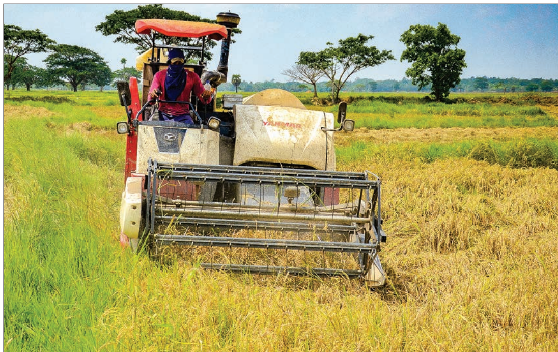
A farmer drives a harvester as he harvests rice in field.

Trade representatives also stressed the importance of private agricultural trade between the two nations over land and sea. Myanmar and Bangladesh sea and land port facilities at Maungtau and Sittway were also discussed. The nations will hold a follow up meeting of the Bangladesh-Myanmar Joint Trade Commission in Nay Pyi Taw in November 2017. —Zar Lin Thu (AMIA) ■