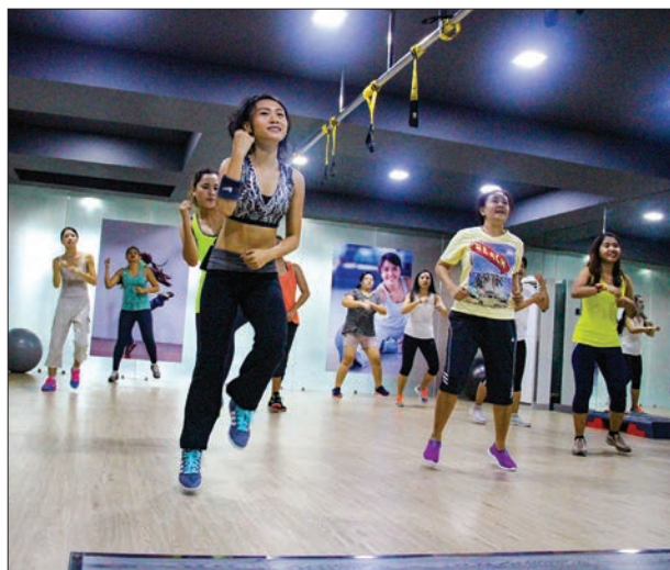
A Zumba class in Yangon.

According to a study, approximately 15 million people now take regular Zumba classes in over 200,000 locations across 80 countries.—GNLM ■