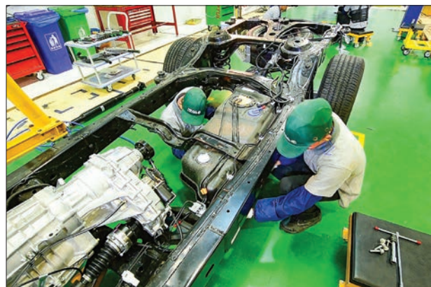
A worker putting together parts of a Ford in a factory in East Dagon Myothit, Yangon.