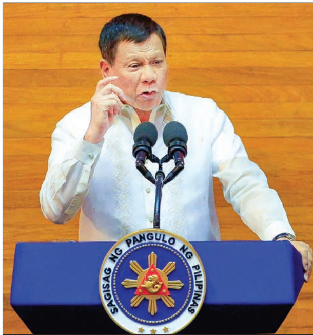
Philippine President Rodrigo Duterte gestures as he delivers a speech during the State of the Nation Address (SONA) on the Joint Session of the 17th Congress at the House of Representatives in Quezon City, Manila, Philippines on 24 July, 2017.

The Philippines is the world's biggest supplier of nickel ore and also among the top producers of copper and gold. However, the sector contributes less than 1 per cent to the country's economy, based