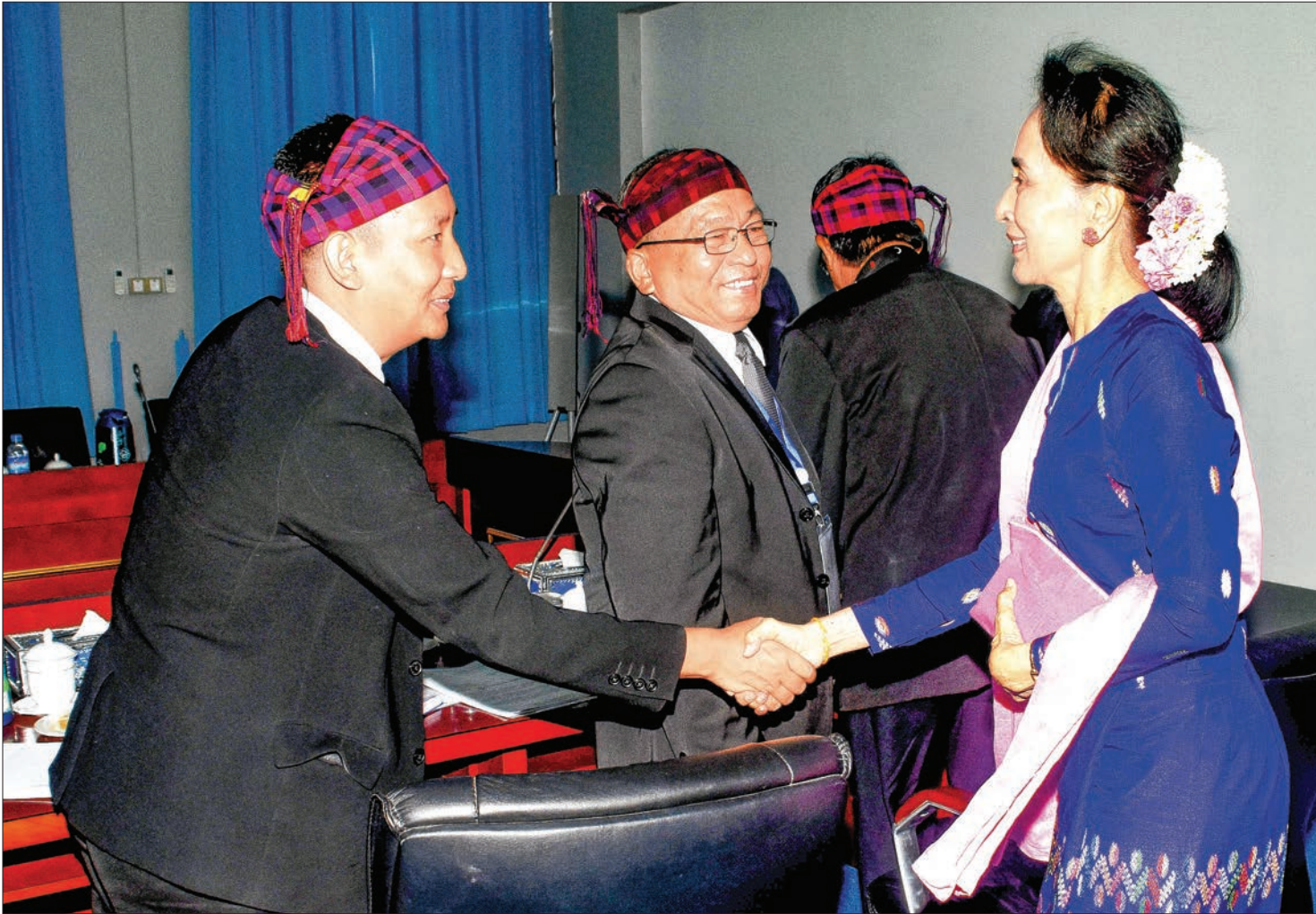
State Counsellor Daw Aung San Suu Kyi welcomes the delegation of Kachin Baptist Convention (KBC).