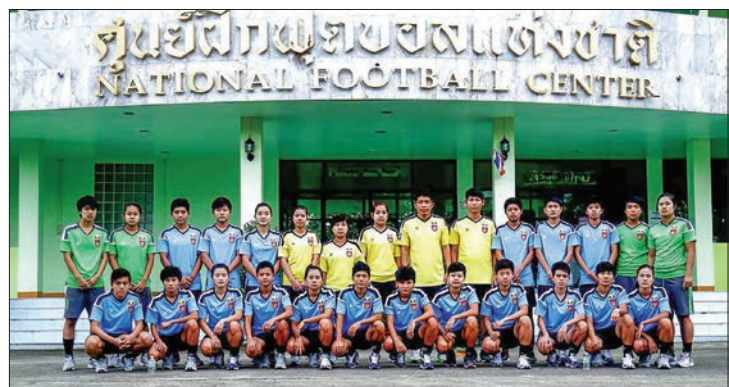
Myanmar women's futsal team is seen in front of the National Football Center in Thailand.

Futsal competitions at the 2017 Southeast Asian Games in Kuala Lumpur will take place at Panasonic Stadium in Shah Alam. Five women futsal teams will compete – Malaysia, Thailand, Viet Nam, Myanmar and Indonesia – starting on 18 August. ■