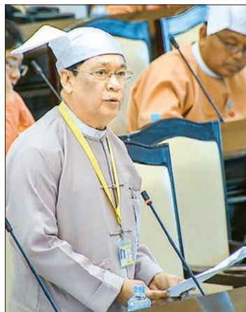
Union Minister for Labour, Immigration and Population U Thein Swe.

In responding to a question by U Kin Shein of Tanintharyi Region constituency 9 on appointing township religious affairs department head, Union Minister for Religious Affairs and Culture Thura U Aung Ko said in townships where there is no township religious affairs department head, township immigration and national registration department head work concurrently as township religious affairs department head and any religious affairs matters in such townships are handled by