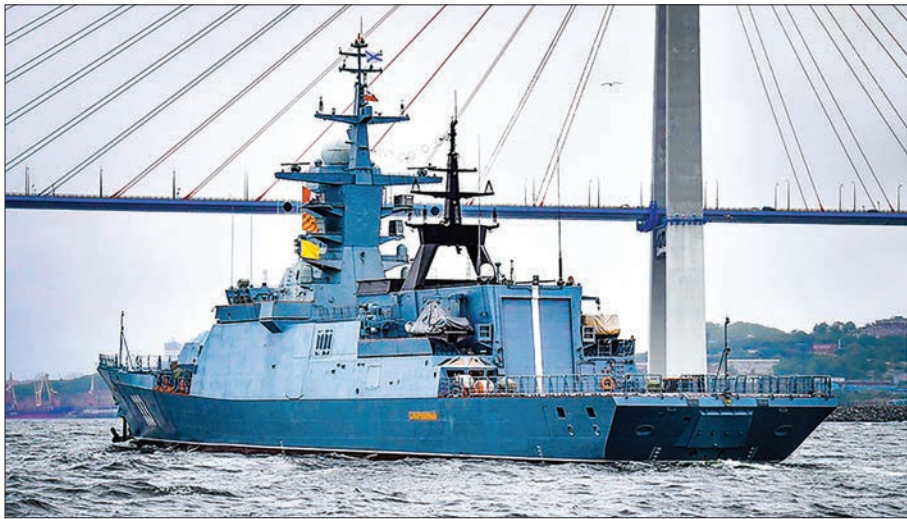
Sovershenny corvette.