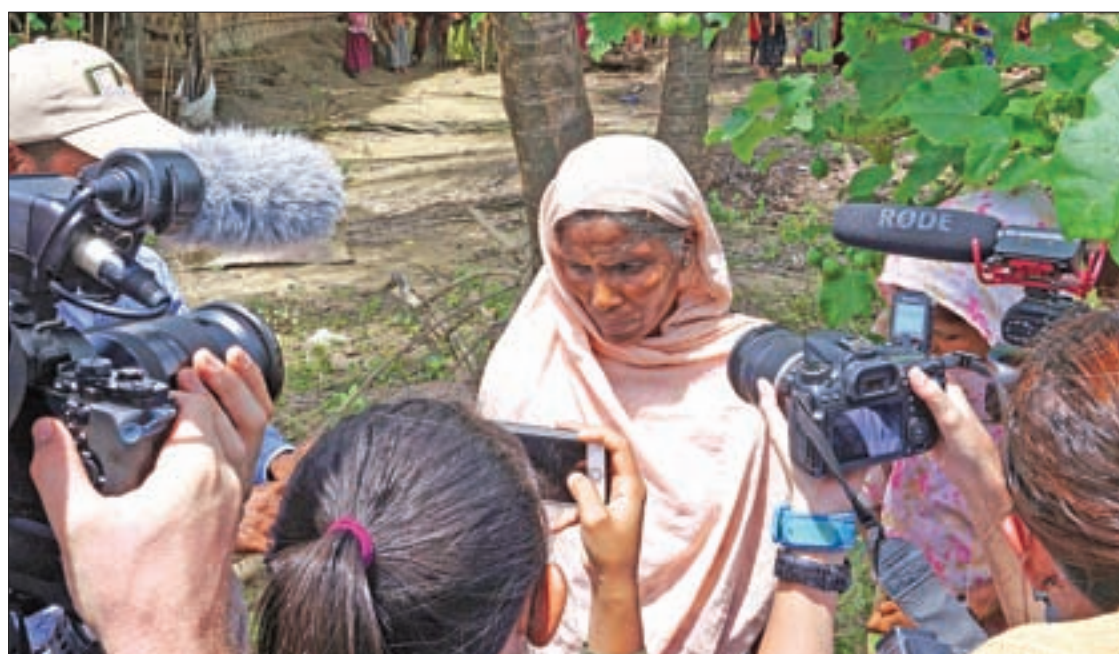
A woman speaks to media in Maung Na Ma village, northern Rakhine, on 13 July 2017.

HaY says it is fighting for the rights of 1.1 million members of