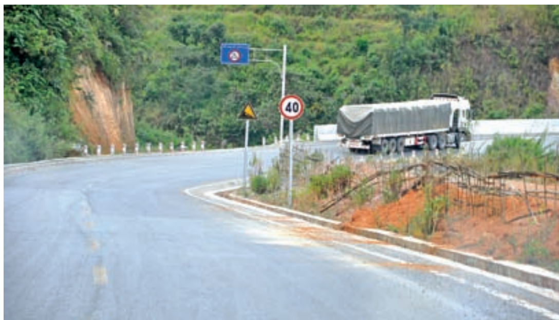
A truck runs near Muse 105-mile trade zone in northern Shan State.

The government plans to construct 100,000 apartments within five years term and targets one million apartments by 2030. ■