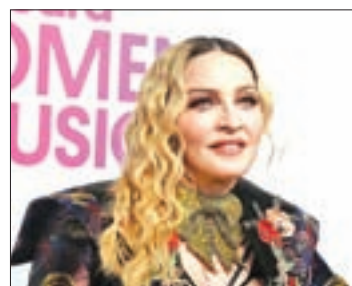
Madonna poses on the red carpet at the Billboard Magazine's 11th annual Women in Music luncheon in New York, US, on 9 December 2016.