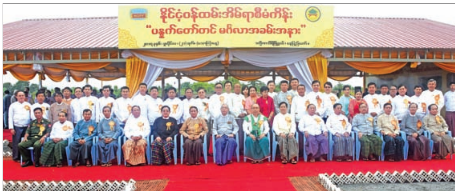
President U Htin Kyaw poses for a documentary photo with participants at a stake-driving ceremony for staff housing yesterday.