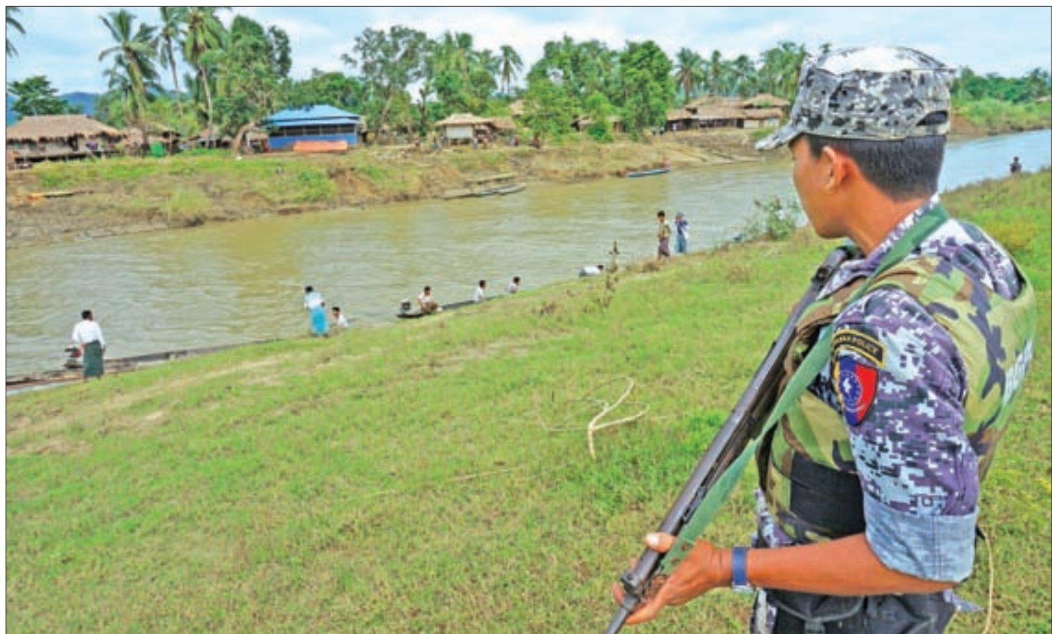
A Myanmar border guard police officer stands guard in Tin May village, Buthidaung township, northern Rakhine state, Myanmar on 14 July 2017. Picture taken July 14, 2017.

At least 44 civilians have been killed and 27 have been kidnapped or gone missing in