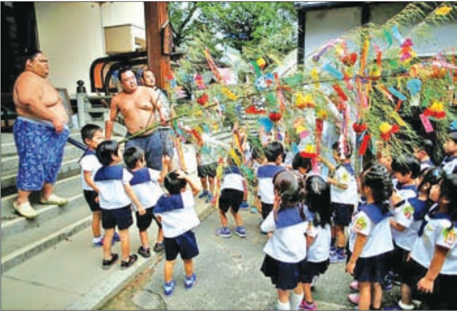
Tanabata festival decorations, made with a bamboo branch and strips of coloured paper, often with people's wishes written on them, are presented to sumo wrestlers from kindergarteners.

NAGOYA, (Japan) — The sound of bodies slapping against each other rocks the stifling sumo "stable" in the Japanese city of Nagoya, as 11 gigantic wrestlers wearing only loincloths take turns throwing each other out of a ring of sand. The wrestlers, or 'rikishi', at the prestigious Tomozuna stable spend more than three hours each morning practicing holds in Japan's 15-century-old national sport, with defeat facing the first to fall or be forced out of the ring. With rare permission granted by sumo's governing body, Reuters was able to observe the stable's wrestlers training at their temporary Buddhist temple base for the Nagoya Grand Sumo Tournament that began last week, gaining insight into the intricacies of sumo. Entering the world of sumo is to eat, live, and breathe Japanese — from the samurai-style topknots to the rigid hierarchy. But the tough training and tradition-bound ways have put off many Japanese youth, leaving sumo to be dominated by foreign — mostly Mongolian — wrestlers, who face a grueling path to assimilation. "Language was the biggest source of stress," said Tomozuna Oyakata, better known by his fighting name Kyokutenho, the first Mongolian-born wrestler to lead a sumo stable. "I couldn't understand anything when I was being scolded, or even when I was being praised," said the master, one of the first six Mongolians to be inducted into the sport in 1992. Today, the one-time champion, who was born Nyamjavyn Tseveg-