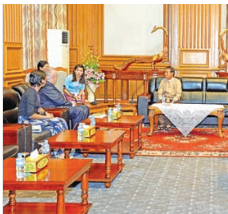
Speaker of Pyithu Hluttaw U Win Myint holds talks with Clerk of Legislation from the House of Commons of UK.

During the meeting, they discussed matters relating to cooperation between the two parliaments, strengthening of the hluttaw works and assistance on hluttaw development processes.—Myanmar News Agency ■