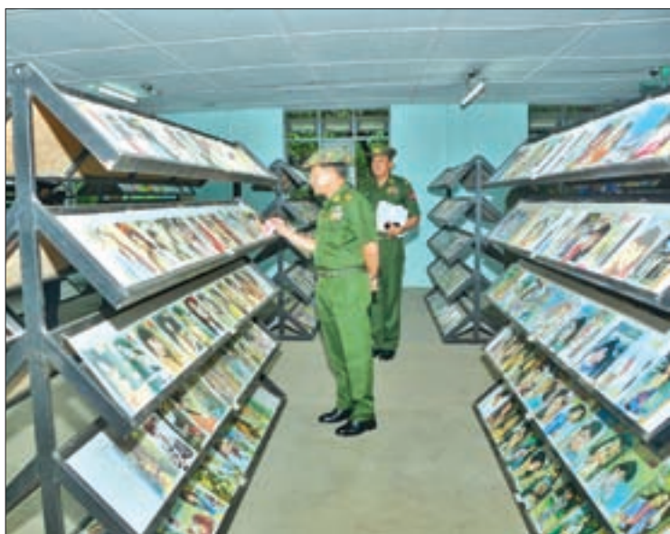
Senior General Min Aung Hlaing peruses books displayed at the Myawady Literary House.