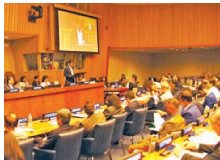
Vice President U Henry Van Thio delivers a speech at the 3rd UN Special Thematic Session of Water and Disasters.

In collaboration with the World Bank, the Netherlands and Australia, Myanmar has launched a water resources panel to find development and research partners as well as financial and technical assistance to enhance its networking relationship in the water sector.—Myanmar News Agency ■