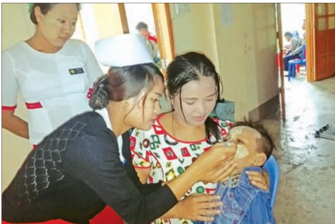
A nurse gives polio vaccine to a child in Maungtaw.

Afterwards, the C-in-C of Defence Services and members inspected books, periodicals and back issues such as collections of Myawady and Ngwetaryi magazines since the time of its first publication.—Myanmar News Agency ■