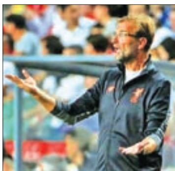
Liverpool Juergen Klopp.

"But, a very important message — maybe we're not a selling club. That's how it is.