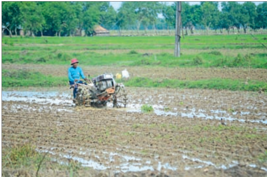
A farmer ploughs a farmland with a machine in Dala, outside Yangon.