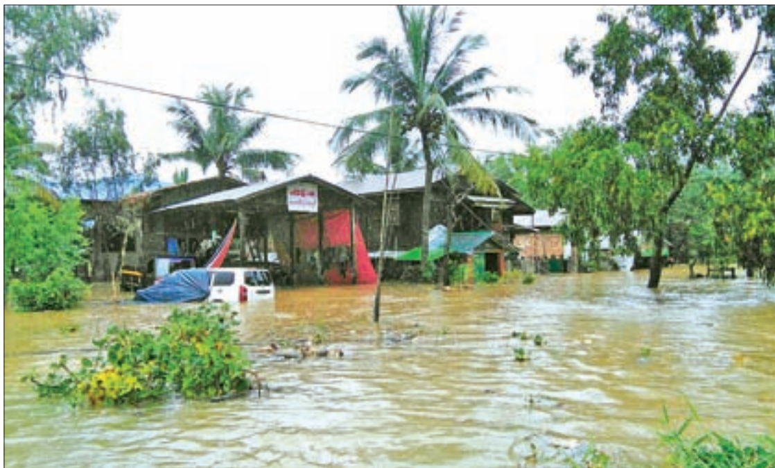
Houses are submerged in flood water after heavy rains in Kyai- kto Township, Mon State.

Over 688 houses in the combined areas of Kawsanna- ing Ward, Zayarmon Ward, the Northern Ward and Lone Pa- kkalate Village were partially submerged, forcing over 2,746 people to take refuge in tem- porary camps set up in local monasteries and schools.