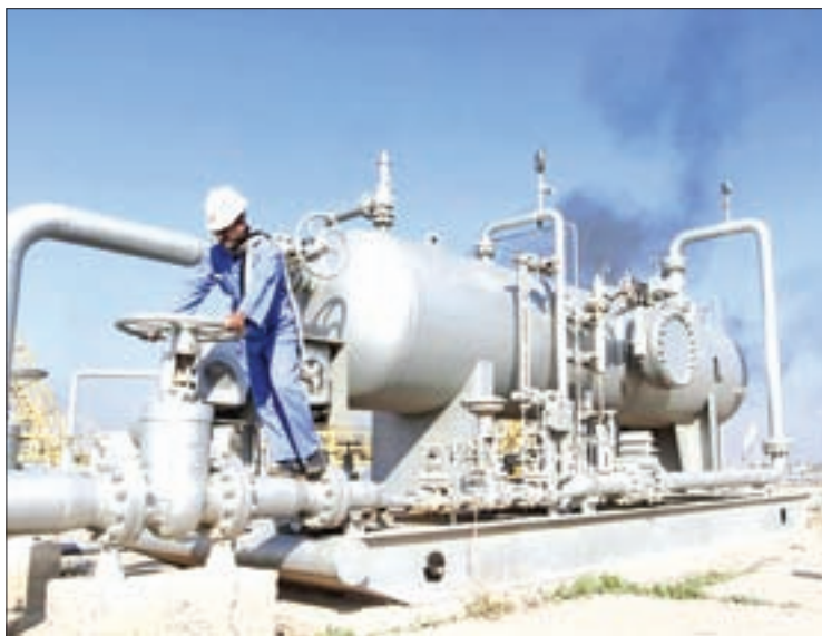
A worker checks the valve of an oil pipe at Nahr Bin Umar oil field, north of Basra, Iraq, in 2015.

crude supplies has put pressure on oil prices and key members of the Organisation of the Petroleum Exporting Countries (OPEC) are scheduled to meet non-members in St. Petersburg, Russia, on Monday to discuss market conditions and whether more action is needed to support prices.