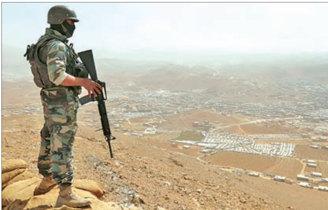
A Lebanese soldier carries his weapon as he stands on sandbags at an army post in the hills above the Lebanese town of Arsal, near the border with Syria, Lebanon, on 21 September 2016.

Hezbollah's al-Manar TV said Nusra militants were under attack in Juroud Arsal and