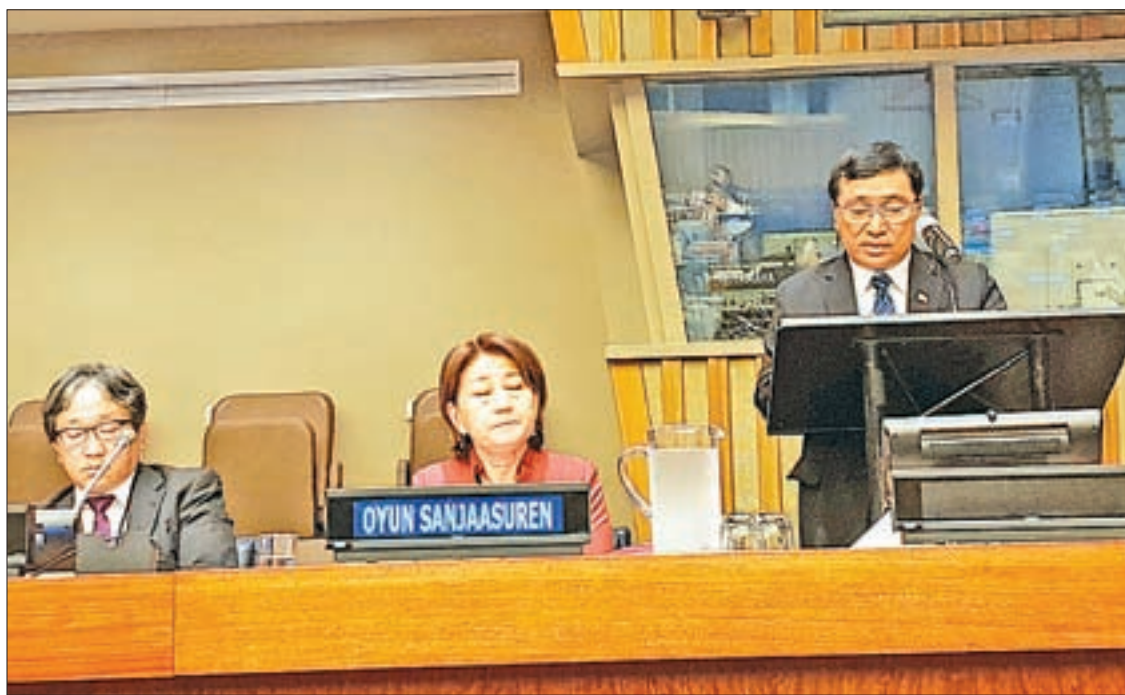
Dr. Win Myat Aye addresses at UN Special Thematic Session on Water and Disaster meeting.