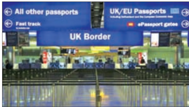
UK Border control is seen in Terminal 2 at Heathrow Airport in London, in 2014.

Concerns over immigration were a key driver behind last year's vote to leave the EU and the government has made controlling Britain's borders central to its Brexit plans.