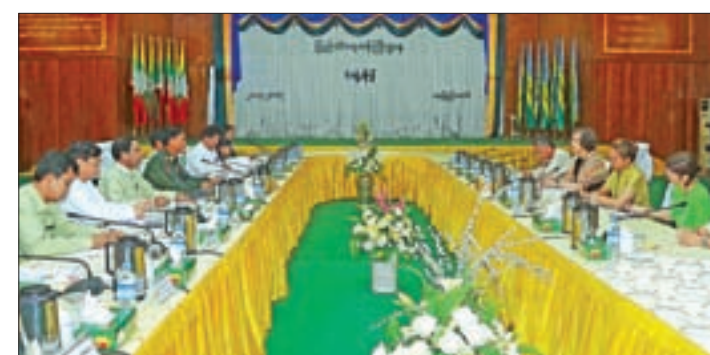
Maj-Gen Aung Soe, Secretary of Central Review Committee on Confiscated Farm Lands and Other Lands, meets with UN Human Rights envoy Ms Yanghee Lee.

In her call on the Secretary of Central Review Committee on Confiscated Farm Lands and Other Lands, the status of returning confiscated farmlands and other lands to rightful owners was discussed.—Myanmar News Agency ■