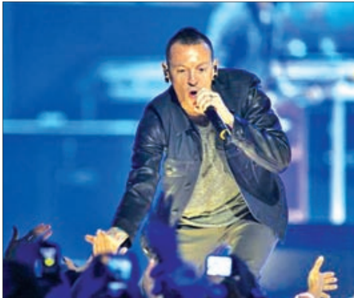
Chester Bennington of the band Linkin Park performs during the second day of the 2012 iHeartRadio Music Festival at the MGM Grand Garden Arena in Las Vegas, Nevada in 2012.

Bennington had a history of alcohol and drug abuse. He spoke openly in the past about his struggles to overcome his demons when Linkin Park first found fame in 2000 with their best-selling debut album "Hybrid Theory" and went on to become one of the most popular alt-rock bands of their gen-