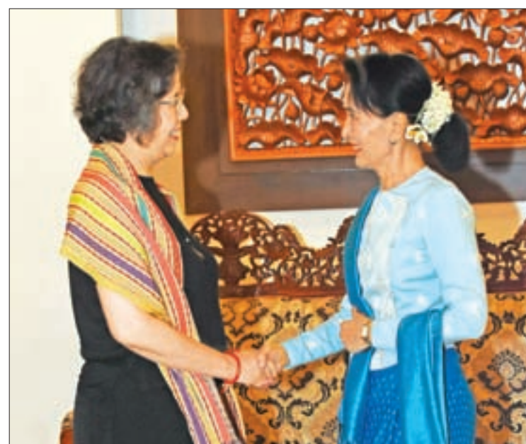
State Counsellor Daw Aung San Suu Kyi shakes hands with Special Rapporteur Ms. Yanghee Lee in Nay Pyi Taw yesterday.

State Counsellor and Union Minister for Foreign Affairs of the Republic of the Union of Myanmar Daw Aung San Suu Kyi received the Special Rapporteur on the Situation of Human Rights in Myanmar Ms. Yanghee Lee at the Ministry of Foreign Affairs, Nay Pyi Taw, at 11:30 hours on 21 July 2017. During the meeting, they discussed matters pertaining