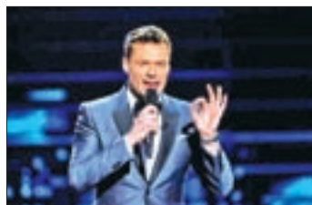
Ryan Seacrest.

With a nod from Seacrest, Ripa said, "We've been talking about it for a little while, but I am happy to confirm ... that Ryan Seacrest is returning as the host of 'American Idol,'" prompting cheers from the studio audience. Seacrest has co-hosted ABC's morning