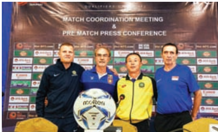
Coaches and team leaders from Myanmar, Australia, Singapore and Brunei at the Press Conference.