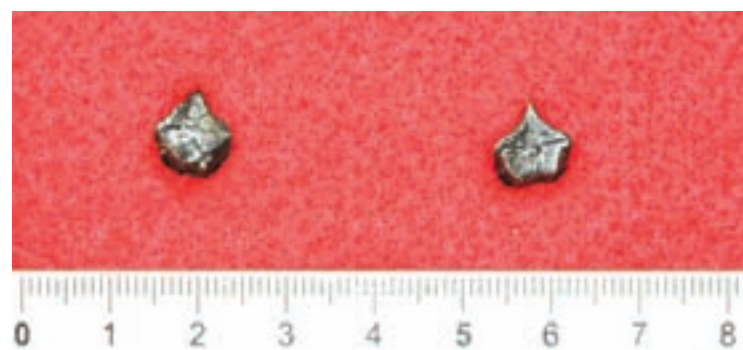
Fossil teeth of a plant-eating dinosaur are shown at Fukui Prefectural Dinosaur Museum in Japan on July 10, 2017.

Hitachi Payment has already deployed 9,500 cash-recycling ATMs in the South Asian country, accounting for about 47 per cent of the total network of around 20,000 ATMs. It aims to deploy another 500 to reach the 10,000 mark soon. —Kyodo News