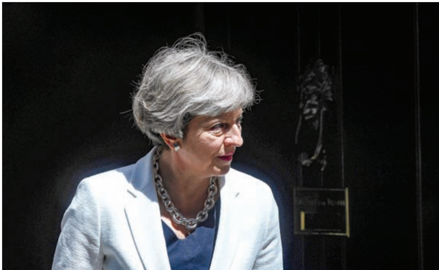
Britain's Prime Minister, Theresa May, waits on the doorstep of no 10 to greet the Prime Minister of Estonia, in Downing Street, central London, Britain on 18 July, 2017.