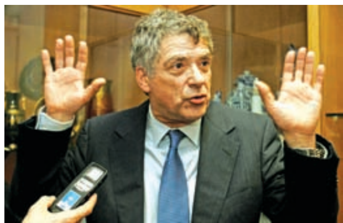
Spain's Football Federation President Angel Maria Villar talks to journalists after signing a cooperation agreement for a joint bid for the 2018 World Cup with Portugal's Football Federation in Lisbon on 19 January, 2009.

During the training period, they will play four friendly matches against Thailand women's national team on 19 July, Kasem Bundit University team on 21 July and Thailand women's national team on 23 July as a second round and Iran team on 25 July in Thailand. Myanmar will play three matches in the playground of Kasem Bundit University team and the second round match against Thailand women's national team on 23 July will play in another playground. —Kyaw Zin Tun ■