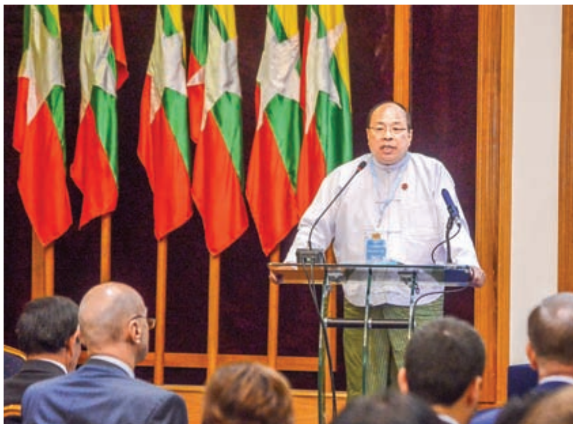
National Security Advisor U Thaung Tun briefs on the status of implementation on the recommendations contained in the Interim Report of the Rakhine Advisory Commission at National Reconciliation and Peace Centre in Yangon.

At the briefing of the diplomatic corps and representatives of the UN Specialized Agencies at the National Reconciliation and Peace Centre in Yangon yesterday by Union Minister U Kyaw Tint Swe and U Thaung Tun confirmed that since October 2016, 44 civilians have been murdered and 27 abducted in northern Rakhine. He said that there is evidence of increasing terrorist activities in the area. On 20 June, the military uncovered a tunnel, guns, and a training