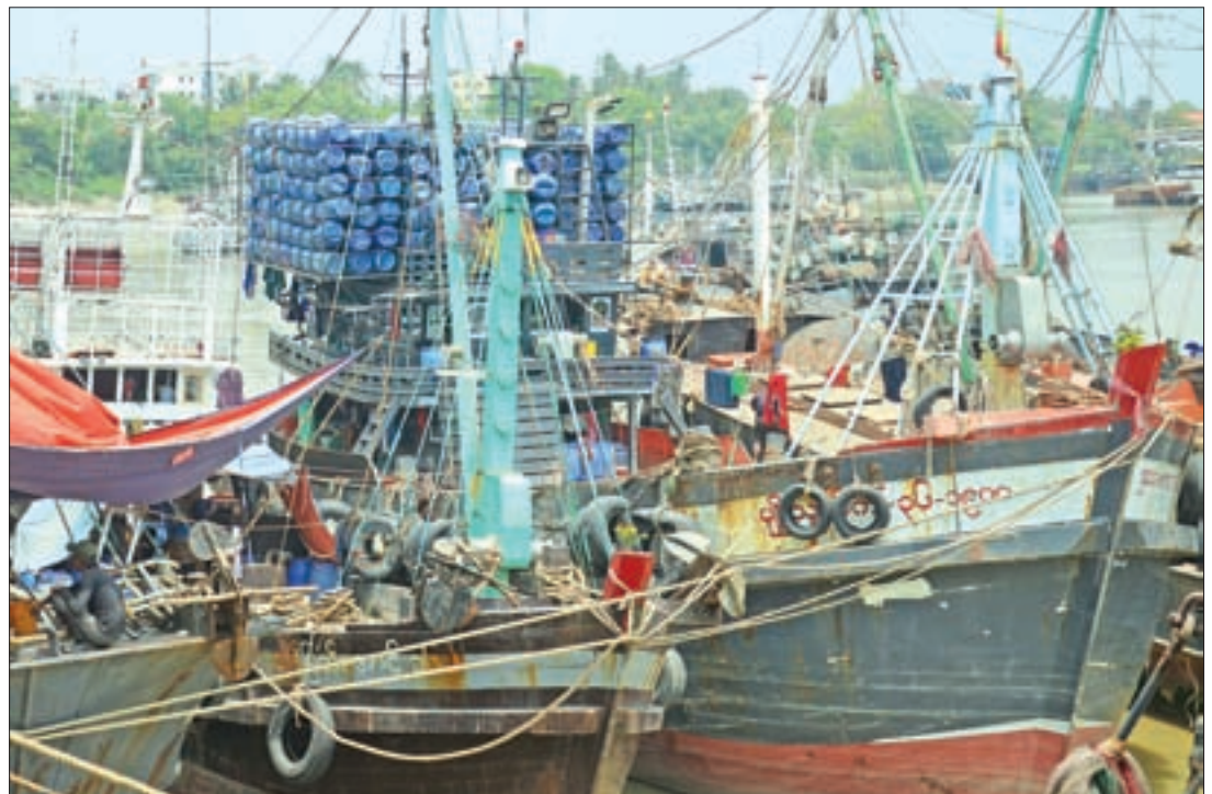
Fishing vessels seen at Nyaung Tan Jetty, Yangon.

The Fisheries Department signed a consultation contract in March 2017 with F&S Marine, a French fisheries consultancy, to implement the systems and the so-called Myanmar Monitoring Control and Surveillance