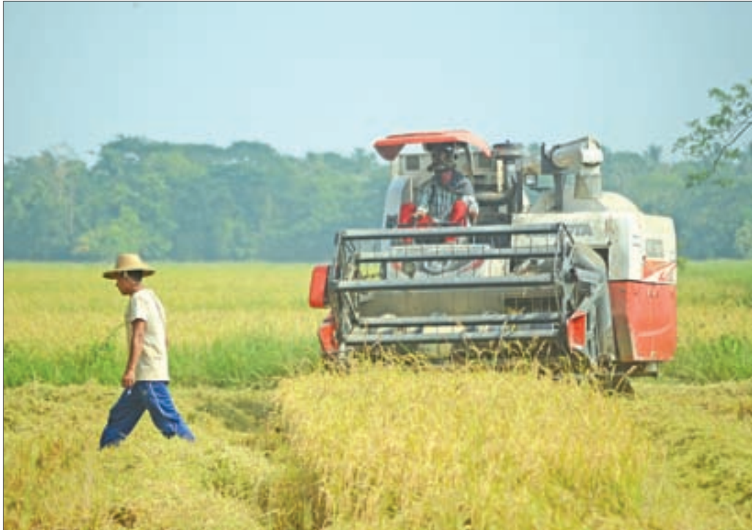
A farmer walks past the harvester in a paddy field in Kangyidauk, Ayeyawady.