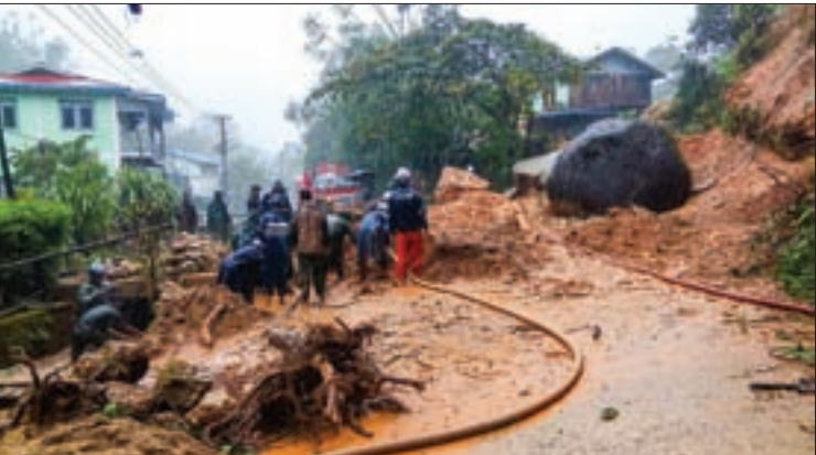
Police officers and rescue workers work to clean up after the landslides in Thandaunggyi, Hpa-an District yesterday.