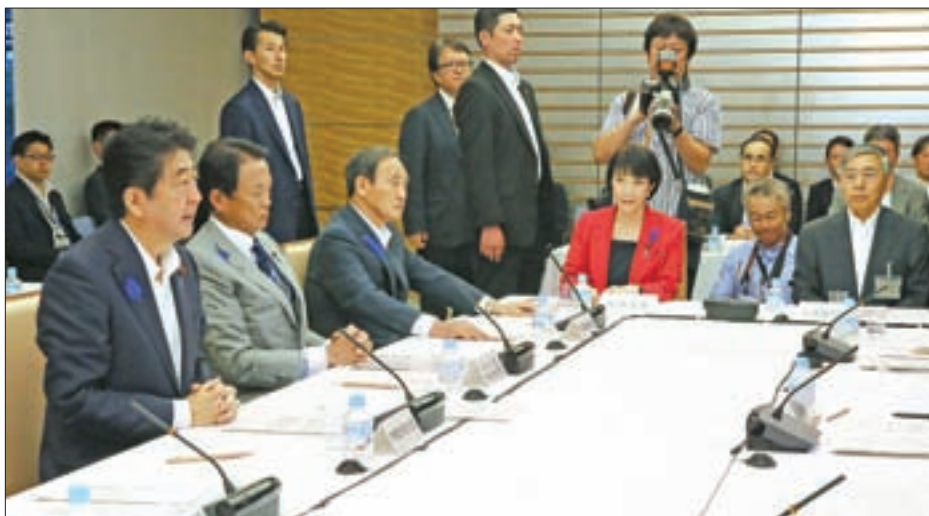
Japanese Prime Minister Shinzo Abe (L) addresses a meeting of the Council on Economic and Fiscal Policy at the prime minister's office in Tokyo on 18 July, 2017.

A primary balance deficit means even after excluding debt-servicing costs, the government cannot finance its annual budget without issuing