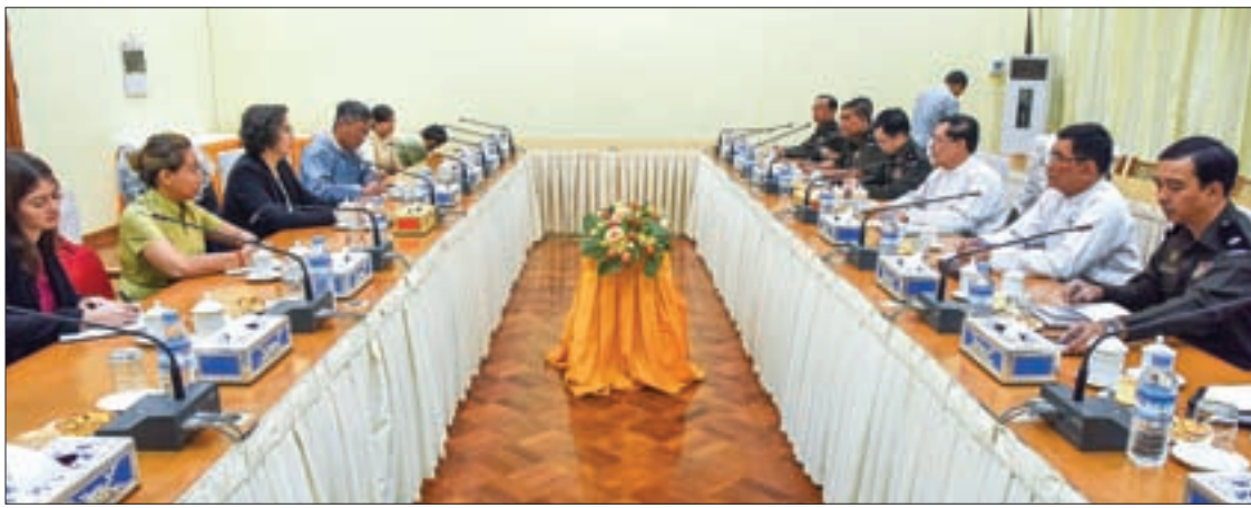
Special Rapporteur Ms. Yanghee Lee holds talks with Union Minister for Labour, Immigration and Population U Thein Swe.