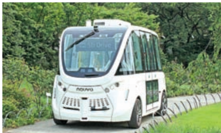
A driverless bus developed by a French manufacturer is put through its paces at a park in central Tokyo on 18 July, 2017. The bus uses a camera to detect any obstacles in its way.

TOKYO — A self-driving electric vehicle developed by a French company completed its first demonstration test in Japan on Tuesday at a park in Tokyo, amid efforts to realize fully automated public transportation services.