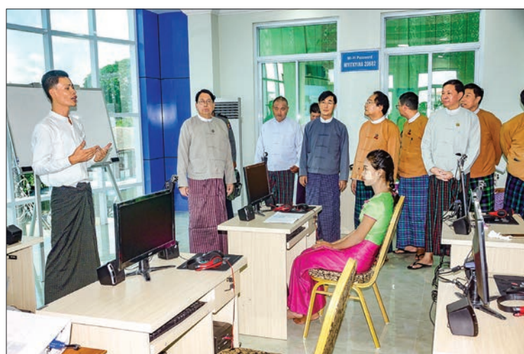
Union Minister Dr. Pe Myint looks around the community centre.

A community centre was opened in Myitkyina, the capital of Kachin State in the northernmost sector of Myanmar yesterday morning, with an address by Union Minis-