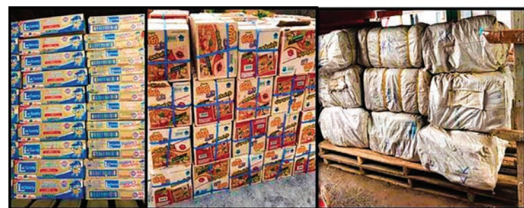
Illegal goods seized at Yepu checkpoint.

The customs department seized illegal goods amounting to Ks1.4 billion through all points of entry in April. The figures increased to Ks3 billion in May. In June, the customs seizures reached Ks3.7 billion.—Myanmar News Agency ■