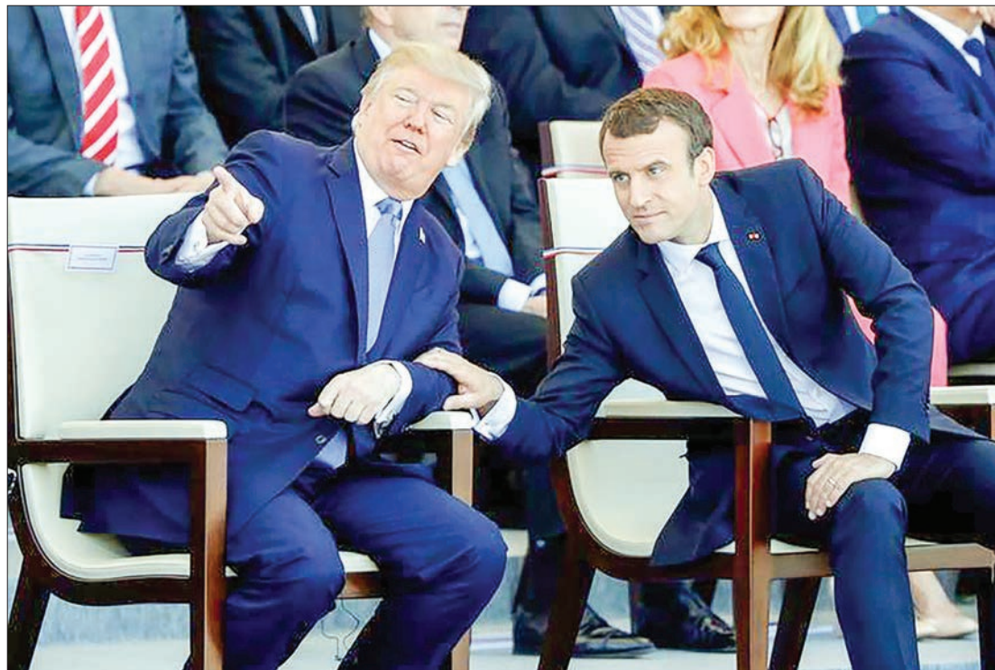
French President Emmanuel Macron and US President Donald Trump attend the traditional Bastille Day military parade on the Champs-Élysées in Paris, France, on 14 July 2017.

Trump on Friday appeared to hold the door open to a change of position on the 2015 Paris climate change agreement which he pulled the United States out of earlier this year.