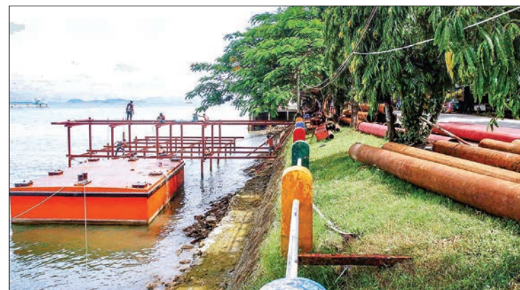
Landing bridge for tourists and local visitors constructed in Kawthoung. PHOTO: KYAW SOE (KAWTHOUNG) ■

They are planning to finish the constructing of this harbor bridge in time for the coming season.—Kyaw Soe (Kawthoung) ■