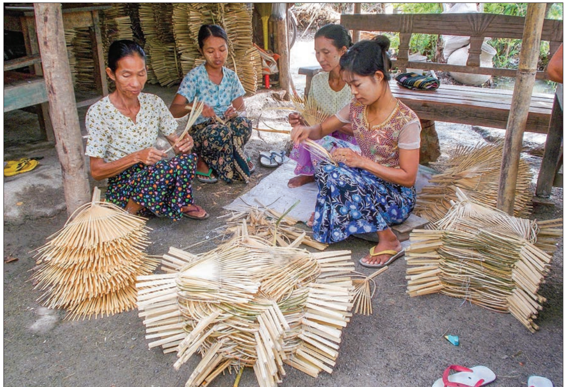
Women making bamboo fans.

over plastic designs for their authenticity.