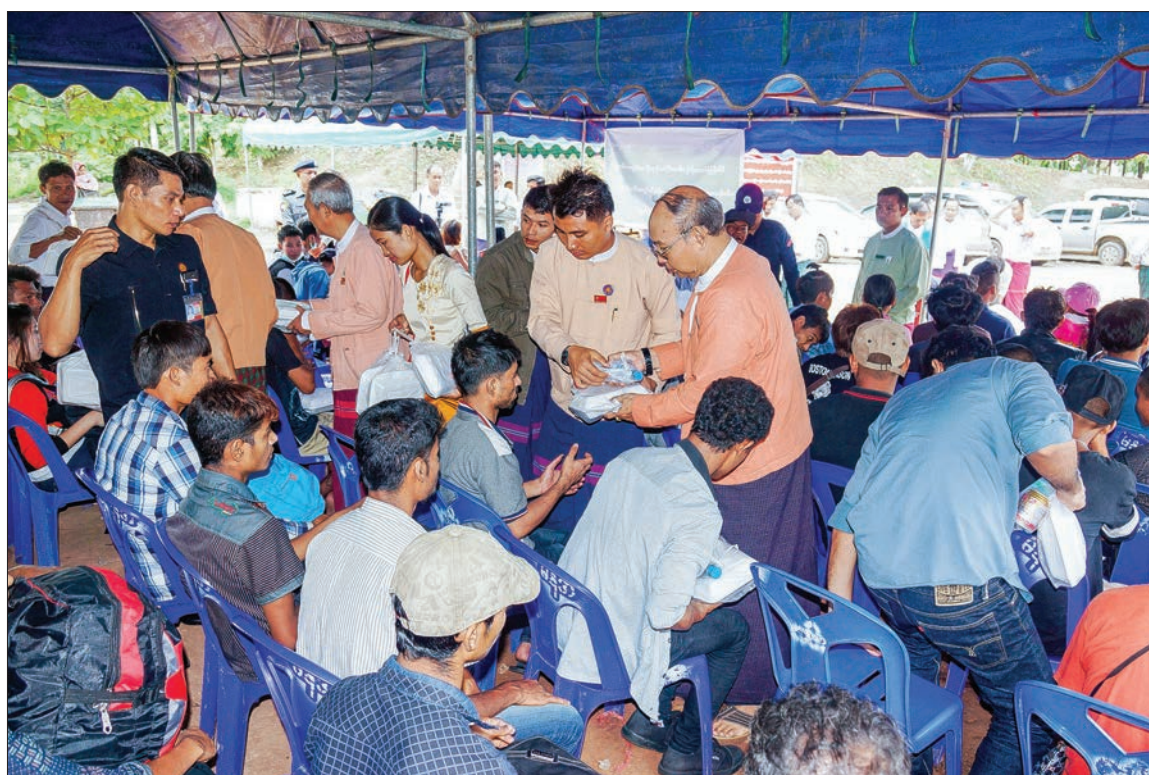
Speaker of Amyotha Hluttaw Mahn Win Khaing Than presenting foodstuff to returnees from Thailand. ■

Afterwards, the Speaker of Amyotha Hluttaw met with the members of Hluttaw, departmental officials, ward and village administer at the meeting hall of Myawaddy combined office and explained the matters relating to the allotment of Hluttaw Fund and works of the Hluttaw. Then he outlined the guidance upon the expending of Union Hluttaw development Fund. ■