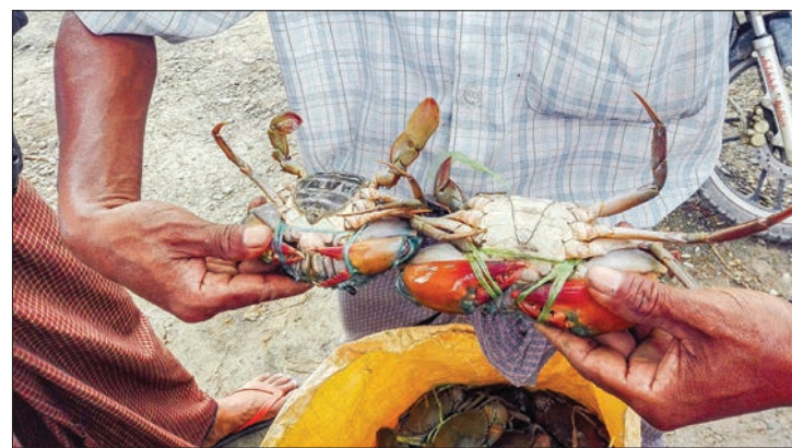
Crab catchers enjoying good business in Rakhine State.

"Crabs are bred in rainy season and consequently the crab catching is good during this season" said Ko Soe Aung of Aungminglar Village of Maungtau Township. Sea crabs are caught by placing traps in prawn ponds. "Sea crabs caught from Maungtau area are sent to Sittway through Angumaw by Hilux pick-ups. Daily output is three Hilux truckloads. They are sent alive to China from Sittway", said crab trader U Tin Maung of 4 th Ward of Buthidaung