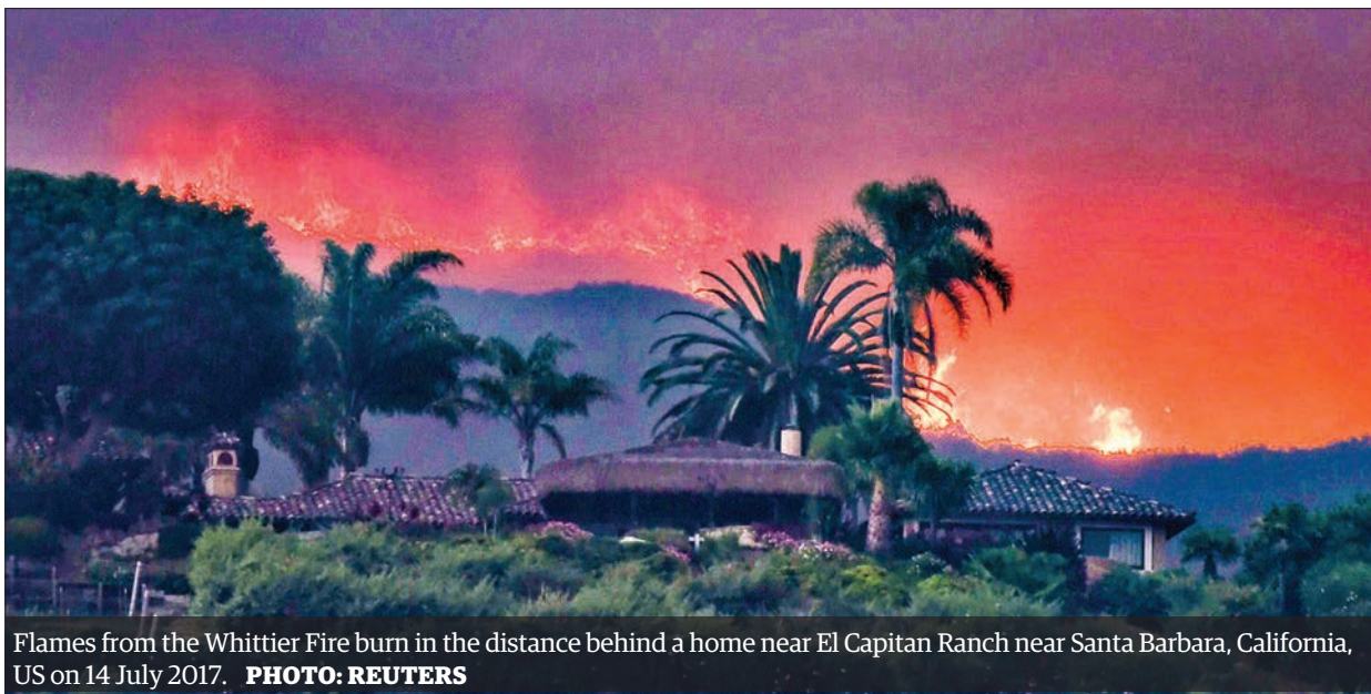
Flames from the Whittier Fire burn in the distance behind a home near El Capitan Ranch near Santa Barbara, California, US on 14 July 2017.

Still, firefighters have made significant gains against the so-called Wall Fire, which had damaged or destroyed 44 homes in Butte County and more than 60 other structures, calling it mostly contained as of Saturday. The Alamo Fire, which charred some 29,000 acres and destroyed at least one home in San Luis Obispo County, was said to be 92 percent contained as of Saturday morning.—Reuters ■