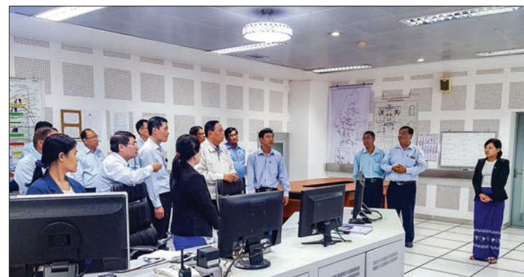
Union Minister U Win Khaing meets officials and staff of Yeywa hydropower dam.

UNION Minister for Construction U Win Khaing visited Yeywa hydropower dam in Mandalay Region where to inspect the turbine and generator of a 790-megawatt power plant.