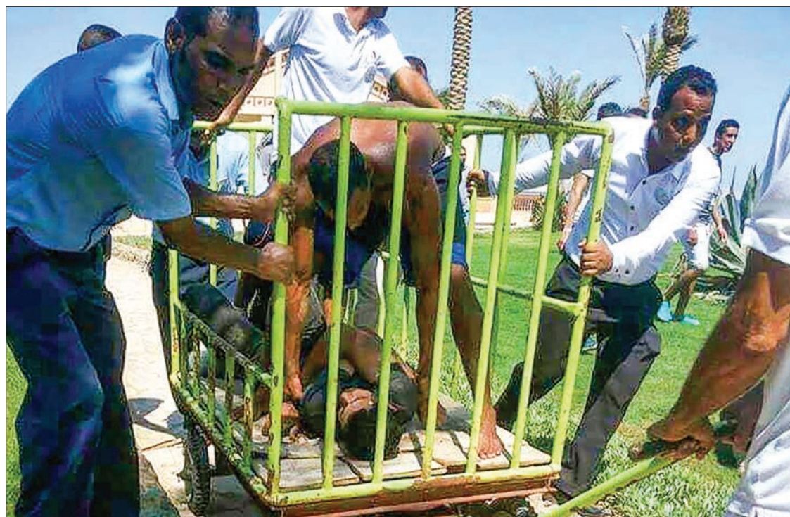
Workers and security detain the man who stabbed two German tourists to death and wounded four others during an attack of the Zahabia hotel resort in Hurghada, south of the capital Cairo, Egypt, on 14 July, 2017.

It was the first major attack on foreign tourists since a similar assault on the same resort more than a year ago, and comes as Egypt struggles to revive a tourism industry hurt by securi-