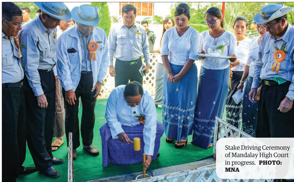
Stake Driving Ceremony of Mandalay High Court in progress.

The Region High Court building is 240 ft long and 240 ft wide RC, 3-storied building which will be constructed on the land of 4.89 acres by Building Department (2) special team (6) of Ministry of Construction. —Myanmar News Agency ■