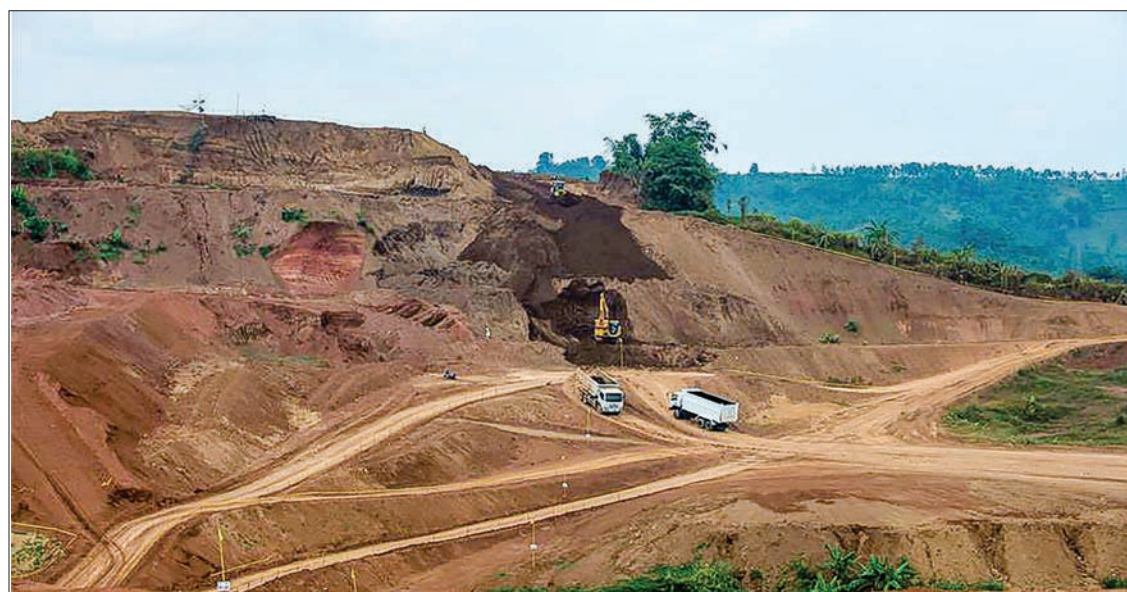
Photo taken on 15 July, 2017 shows the the construction site of the Walini tunnel project of the High-Speed Railway (HSR) linking Indonesian capital Jakarta to Bandung. The Walini tunnel project of the High-Speed Railway (HSR) linking Indonesian capital Jakarta to Bandung was launched here Saturday.

Fighting broke out in the Philippines' only Islamic city on 23 May when militants allied with Islamic State (IS) in the Middle East attacked a hospital, a school and government buildings in a failed attempt to control the city.—Xinhua ■