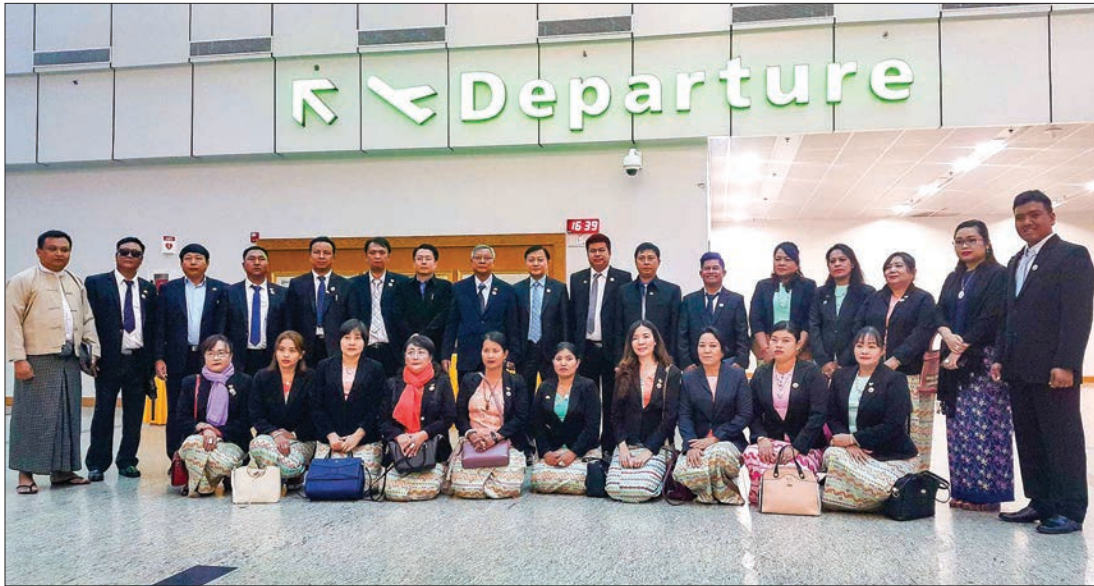
Delegation of Myanmar Real Estate Service Development Association and Viet Nam Real Estate Service Association seen at Yangon International Airport before departure for Viet Nam.