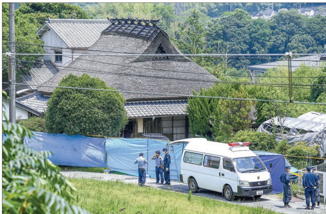
Police officers investigate near a house in Kobe, western Japan, on July 16, 2017, after an elderly couple were found collapsed there. The couple were later confirmed dead while another woman was found dead nearby.

The police arrested the man who lives at the house where the phone call was made on suspicion of violating the Firearms and Swords Control Law for possessing a kitchen knife at a shrine close to the residence. They are investigating whether the man is related to the deaths of the three people. — Kyodo News