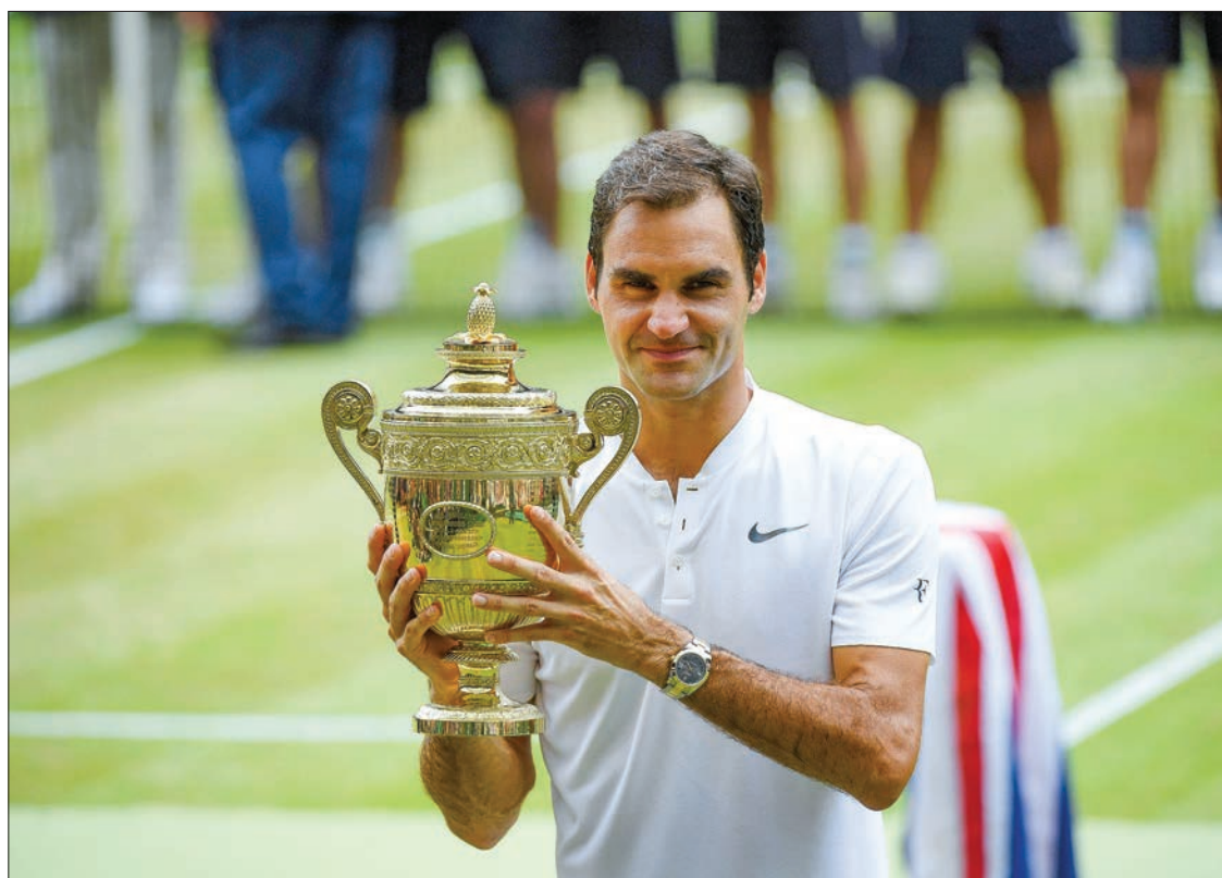
Switzerland's Roger Federer poses with the trophy as he celebrates after winning the final against Croatia's Marin Cilic in London, Britain, on 16 July 2017.

After a reasonably solid start he became discombobulated and after falling 3-0 behind in the second set he slumped on