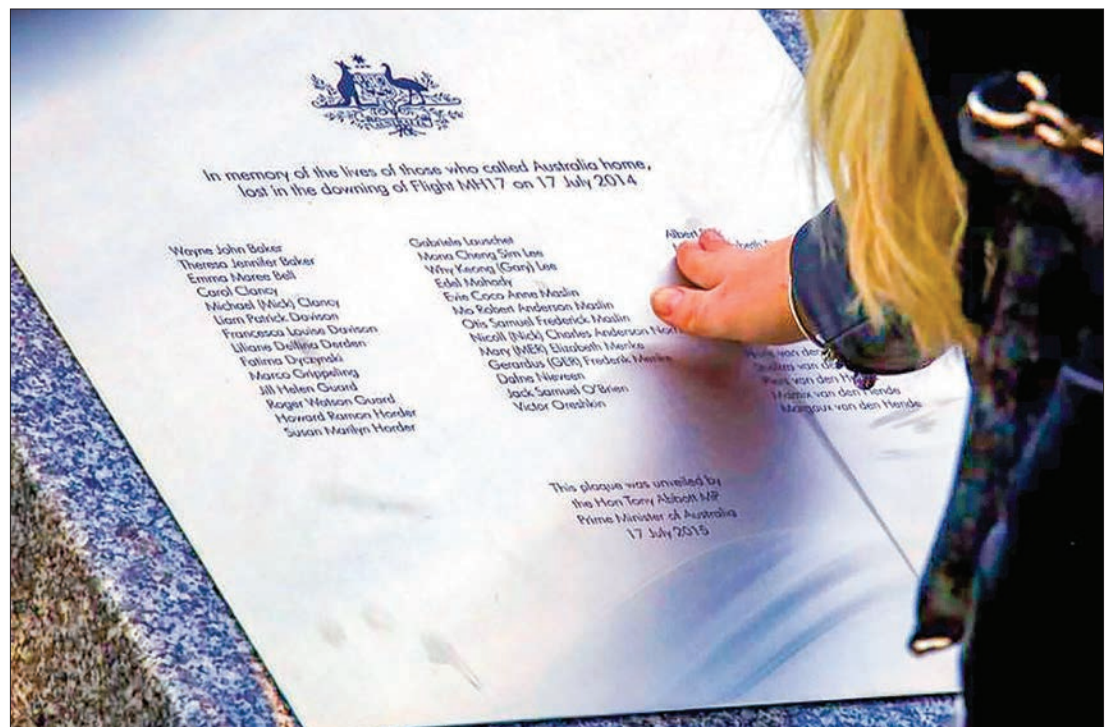
A relative of an Australian victim of Malaysia Airlines jet MH17 touches a memorial that was unveiled outside Parliament House in Canberra, Australia, on 17 July 2015.

The SAARC is a regional body to promote regional cooperation and cordial relations among these South Asian countries. —Xinhua ■