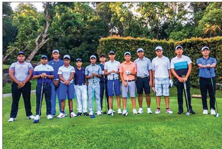
Myanmar golfers who participated in Singapore Open Amateur Championship.