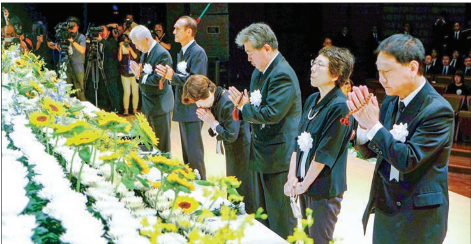
A memorial service is held in Kashiwazaki, Niigata Prefecture, on 16 July 2017, to mark the 10th anniversary of an earthquake that killed 15 people and injured more than 2,300 others in and around the prefecture.

"We have kept moving toward reconstruction