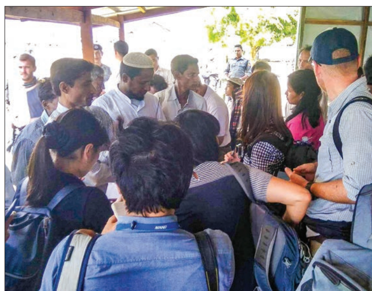
Independent media group collecting news in Rakhine State.

Rakhine State in October. The suspects were detained in Ngakhura police station pending further investigation. —Myanmar News Agency ■