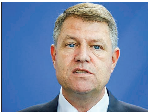
Romanian President Klaus Iohannis during a news conference at the Chancellery in Berlin, Germany, on 19 June 2017.