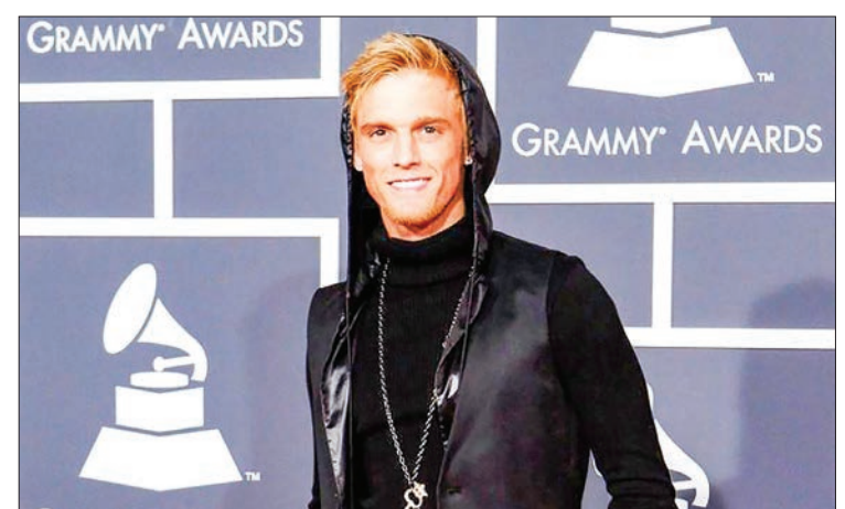
Singer Aaron Carter poses on the red carpet at the 52nd annual Grammy Awards in Los Angeles in 2010.