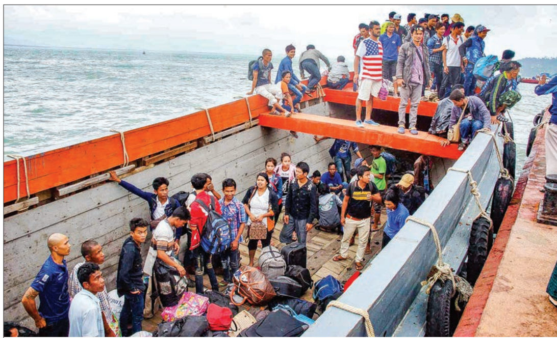
Undocumented Myanmar migrant workers in Thailand return to Kawthoung port. PHOTO: KYAW SOE (KAWTHOUNG) ■

The Ministry of Social Welfare, Relief and Resettlement, the Region Relief and Resettlement Department and local social organizations arranged highway coach tickets and other travel allowances for returning Myanmar workers.—Kyaw Soe (Kawthoung) ■