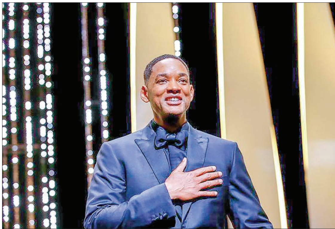
Jury member Will Smith reacts on stage 28 May 2017.

Disney has dominated the box office with animated and live-action films, which include