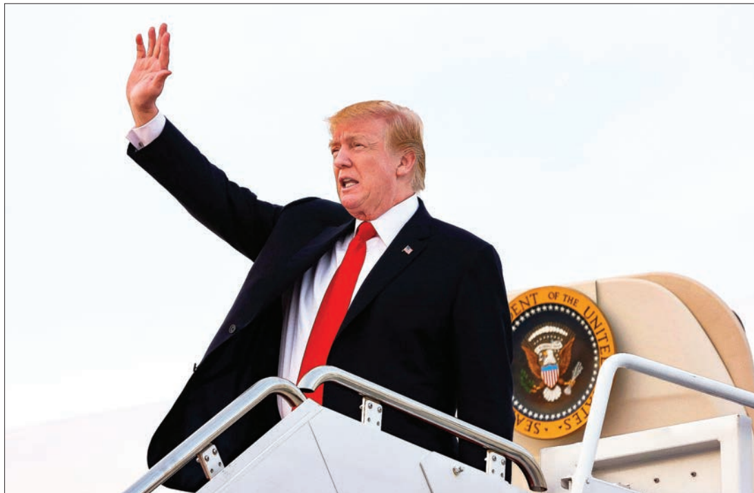
US President Donald Trump waves at Joint Base Andrews, Maryland, US, upon his return to Washington after a weekend at the Trump National Golf Club in Bedminster, New Jersey on 3 July, 2017.

Meanwhile, the appointment of a special counsel who is investigating potential links between the Russian government and members of the Trump campaign has weakened the president’s ability to maneuver with Russia, foreign policy experts say. The US intelligence community has concluded Russia sponsored hacking of Democratic Party groups last year to benefit Trump over his Democrat challenger Hillary Clinton. Russia has denied those allegations while Trump has repeatedly dismissed the idea of any coordination between his campaign and Russia as a “witch hunt.”