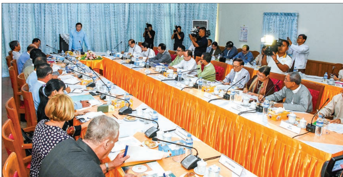
Vice President U Henry Van Thio addresses at the second meeting of the National-level Water Resource Committee in Nay Pyi Taw yesterday.

Vice President U Henry Van Thio has called for taking urgent steps for improvement of environmental conservation, putting the conservation of Inle Lake in Shan State and watershed areas of dams under the spotlight in the 2017-2018 Financial Year.