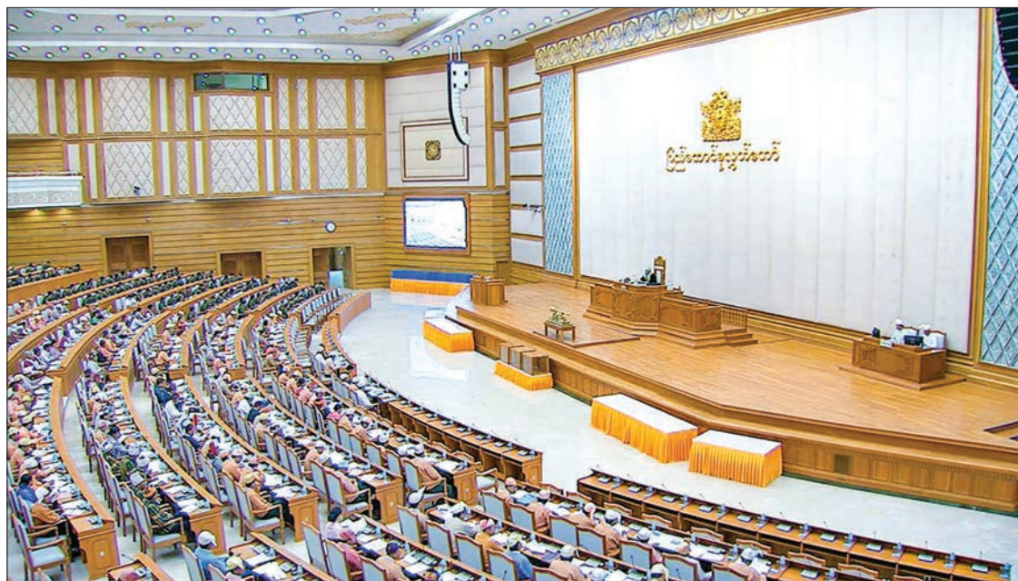
Pyidaungsu Hluttaw is being convened in Nay Pyi Taw.

The Internal Revenue Department (IRD) estimated commercial tax for the second half of FY2016-2017 would be Ks1.27 trillion – instead Ks1.34 trillion