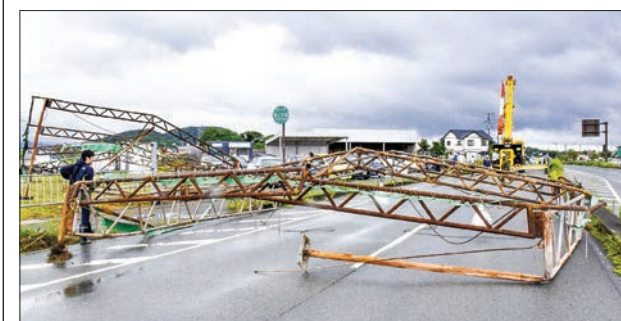
Photo taken on 4 July, 2017, shows a house damaged by fire in the city of Tome, northeastern Japan.

The typhoon is expected to be downgraded to a tropical depression by Wednesday morning off eastern Japan, the agency said.—Kyodo News ■