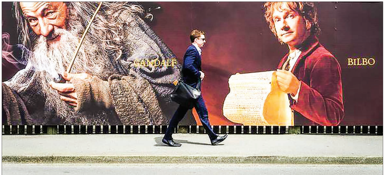
A man walks along a fence hung with large format hoardings of J R R Tolkien characters from The Hobbit movie in Wellington on 27 November, 2012.