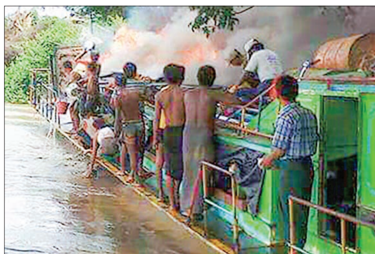
Villagers trying to extinguish the fire on the boat.

There were 48 passengers on the Myint Myat Thu-2 passenger boat. All of the passengers except for the missing man,