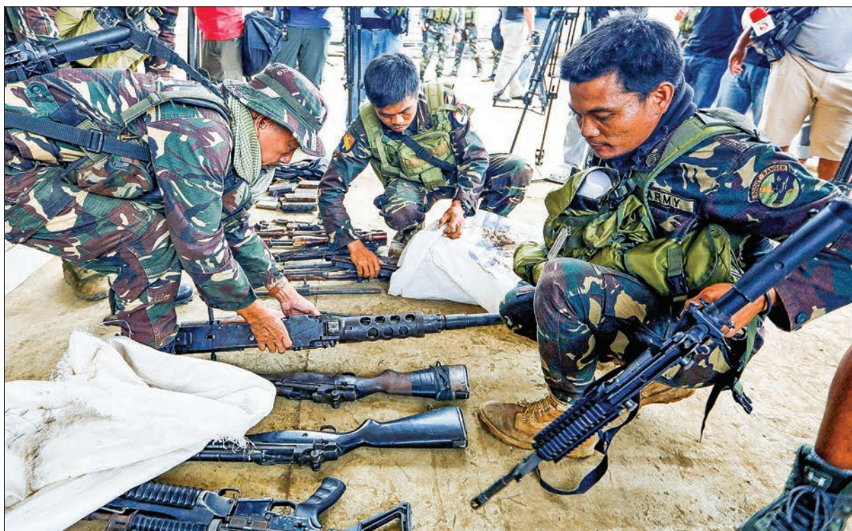
Philippines army soldiers store seized combat weapons in bags after a news conference, as government troops continue their assault against insurgents from the Maute group in Marawi city, Philippines on 4 July, 2017.