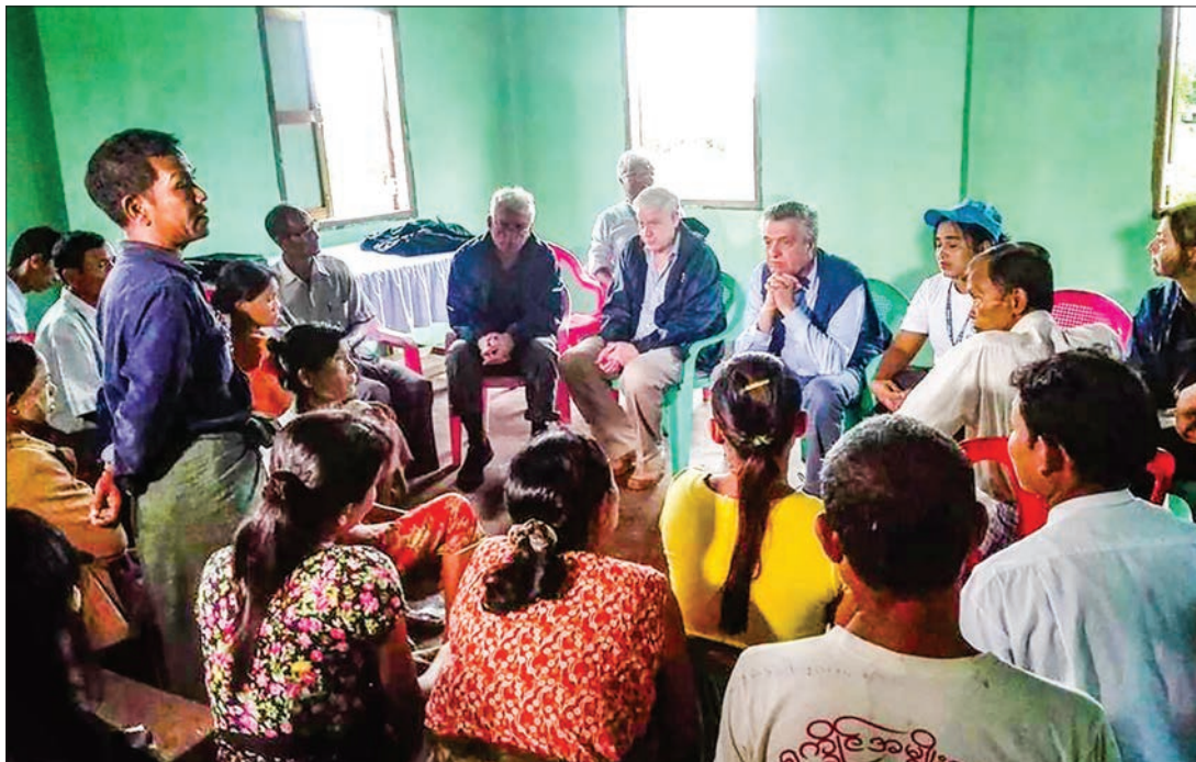
Mr. Filippo Grandi, the UN High Commissioner for Refugees, centre, with hands folded, meets with villagers in Maungtaw Township yesterday.

The UN delegation left Maungtaw for Yangon in the afternoon. SEE PAGE-9