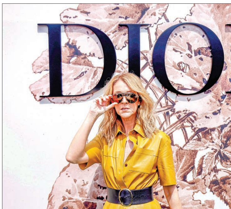
Singer Celine Dion poses before Dior fashion house Haute Couture Fall/Winter 2017/2018 show in Paris, France on 3 July, 2017.

Chiuri was named as its first female creative director in July 2016 as Dior sought to connect with younger consumers and boost sales hit by the global