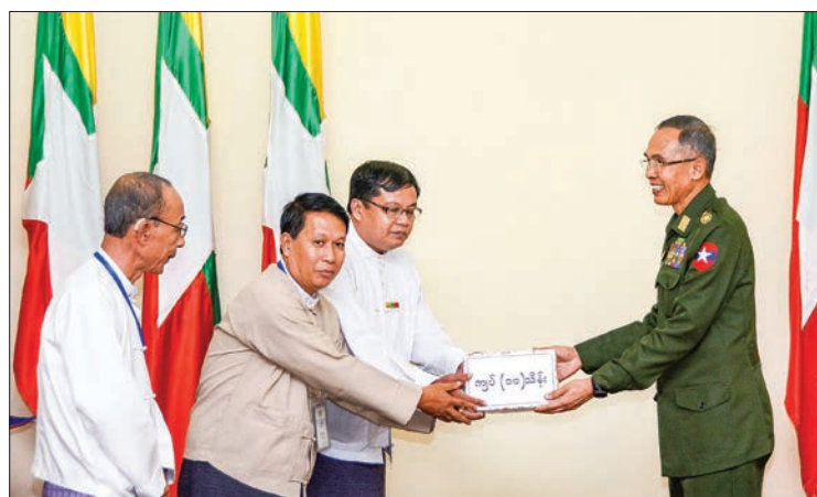
Union Minister for Defence Lt-Gen Sein Win accepts cash donation from officers from Officer Training School intake-83.