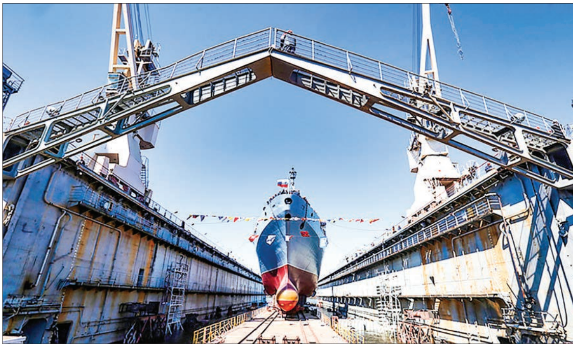
The Russian designs for the advanced warships and vessels presented at the International Naval Show were of special interest to several dozen foreign delegations.