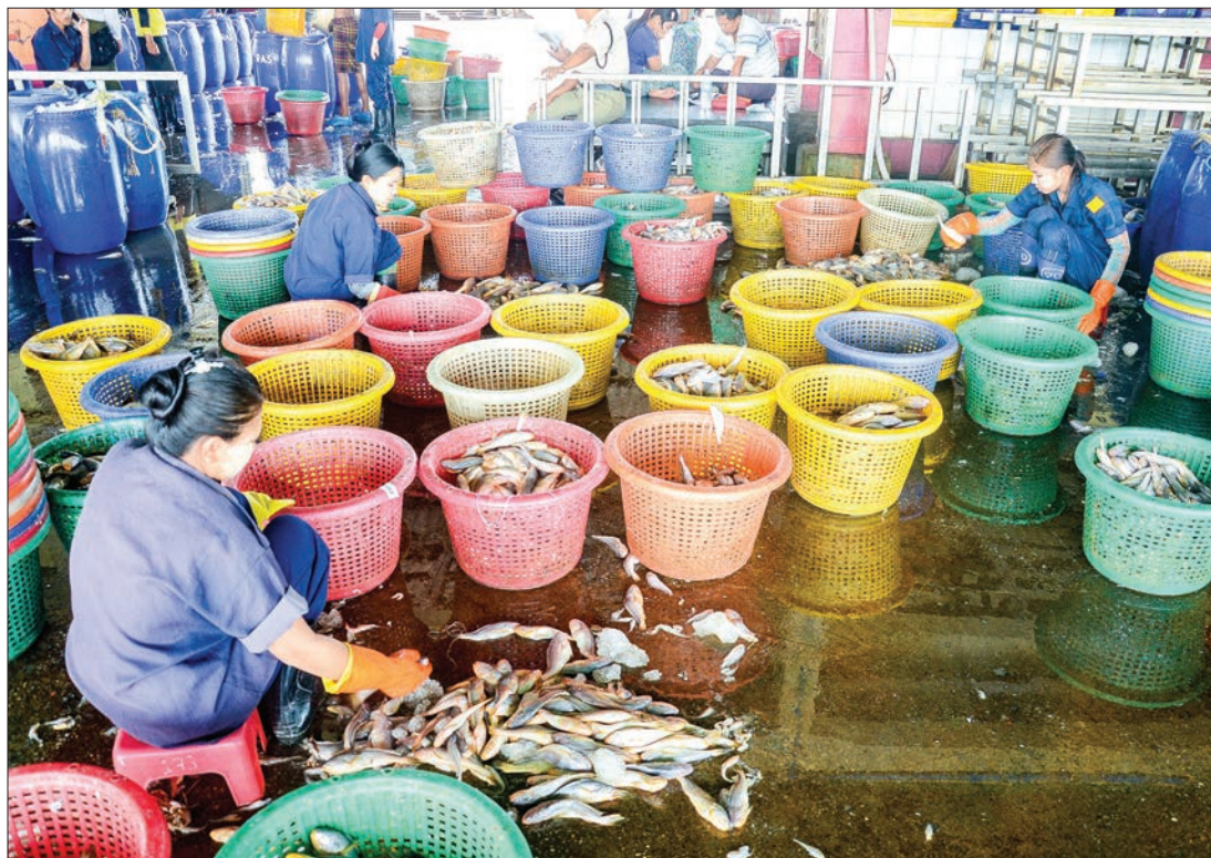
Workers sort fish at Nyaung Tan Jetty in Yangon.