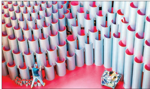
An install team member works on Studio Gang's 'Hive', the latest Summer Block Party interactive installation, at the National Building Museum in Washington, DC, US on 3 July, 2017.