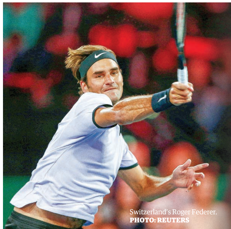
Switzerland's Roger Federer.

"We met that request. We thank him for his engagement and wish him all the best." There were no details regarding the length of his contract but German media reported the transfer fee at 17 million euros (14.94 million pounds). — Reuters ■