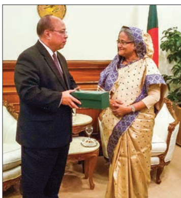
Sheikh Hasina, the Prime Minister of Bangladesh, right, meets with U Thaung Tun, Myanmar's National Security Advisor.