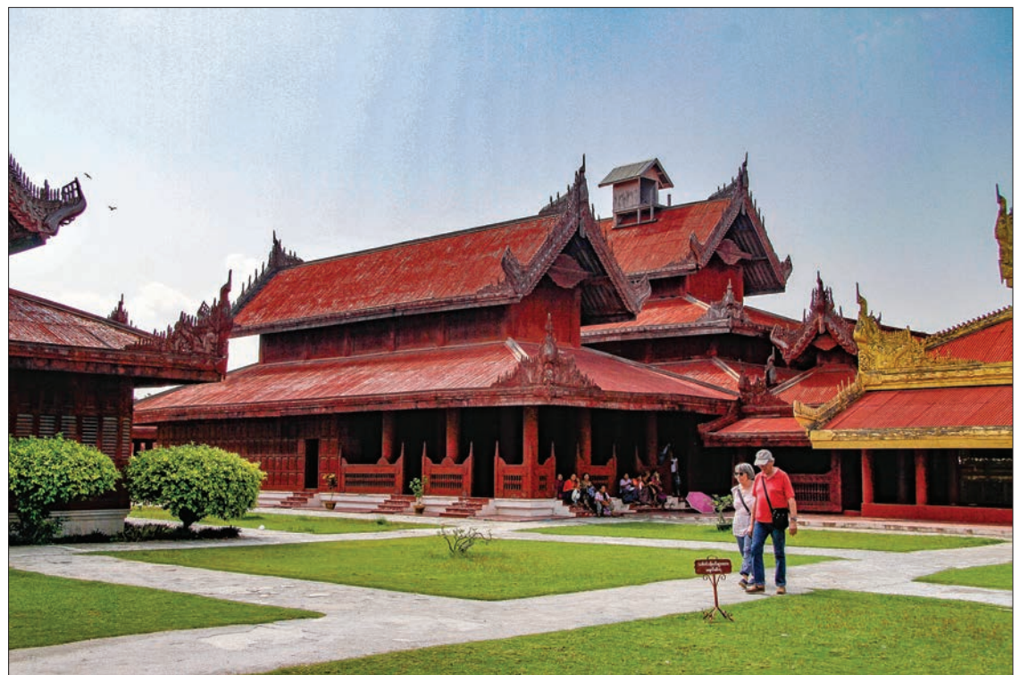
Mya Nan San Kyaw Golden Palace, one of the tourists attractions in Mandalay.

In 2015, there were only 170 hotels in Mandalay. The number of hotels has increased to 187 hotels with over 1,200 rooms last year.