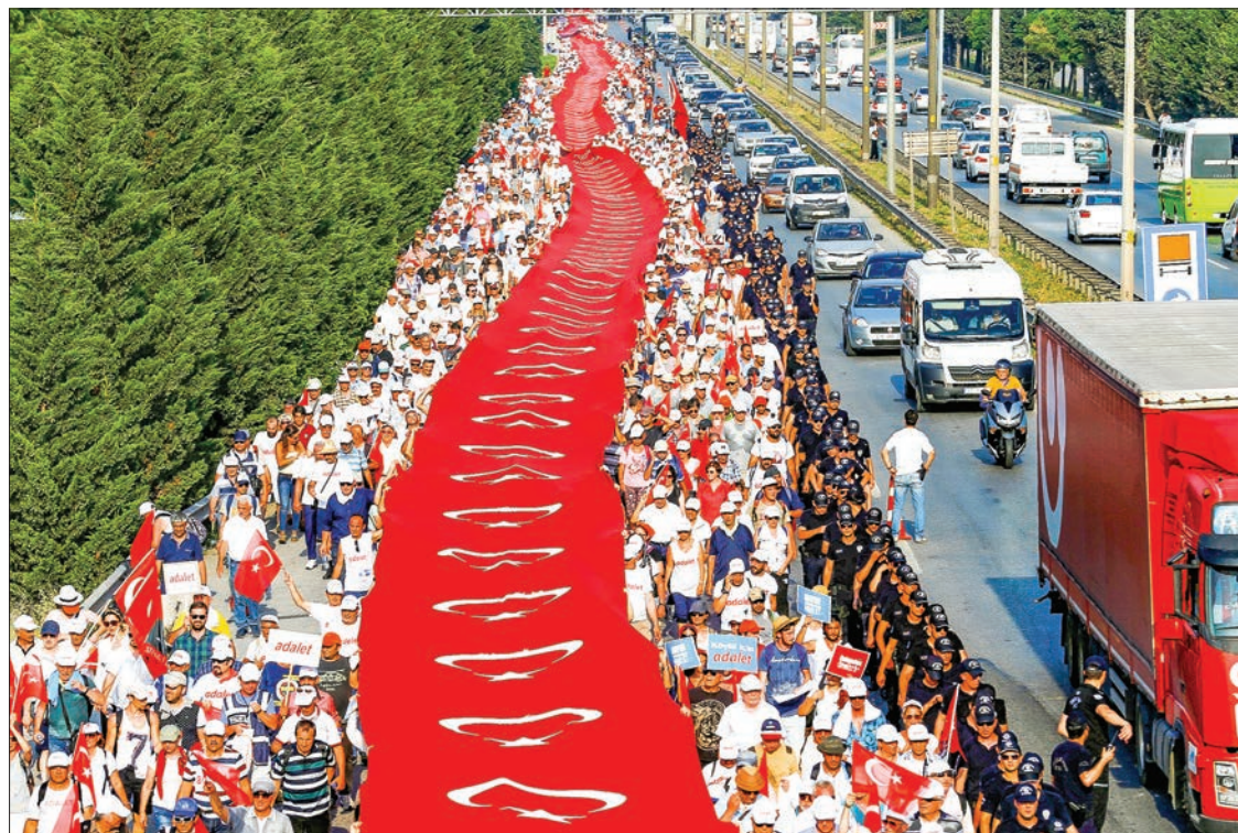
Supporters of Turkey's main opposition Republican People's Party (CHP) leader Kemal Kilicdaroglu walk with a giant Turkish flag on the 19th day of a protest, dubbed "justice march", against the detention of the party's lawmaker Enis Berberoglu, near Izmit, Turkey on 3 July, 2017.

On the 20 th day of his march, triggered by the jailing of a CHP deputy on spying charges, Kilicdaroglu signed an appeal to the European Court of Human Rights against the election board's decision to accept un-