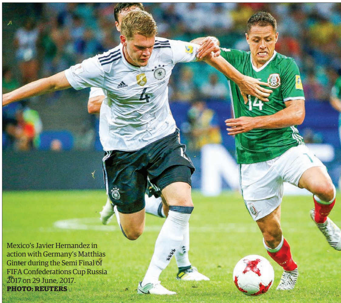
Mexico's Javier Hernandez in action with Germany's Matthias Ginter during the Semi Final of FIFA Confederations Cup Russia 2017 on 29 June, 2017.

"He has progressed a lot as a player in the last few years and I know he will give us something different at the back — he is good with both feet, he's big and he's good in the air also. — Reuters ■