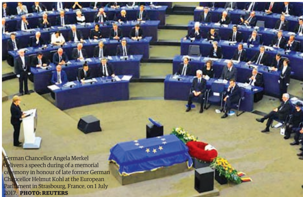
German Chancellor Angela Merkel delivers a speech during of a memorial ceremony in honour of late former German Chancellor Helmut Kohl at the European Parliament in Strasbourg, France, on 1 July 2017.

No police died. However, five suffered gunshots and are in stable condition, with two of those officers suffering head wounds, according to state police. Found at the scene were 16 semi-automatic rifles, nine handguns and a shotgun, the attorney general's office said. The coastal state of Sinaloa is a focal point in Mexico's drug war. It is home to the Sinaloa cartel, whose most well known boss, Joaquin "El Chapo" Guzman, was extradited to the United States in January to face trial. Police killed 17 people for every officer lost in gunbattles in 2014, according to a study by Mexico's National Autonomous University, a number experts say is consistent with excessive use of force. —Reuters ■