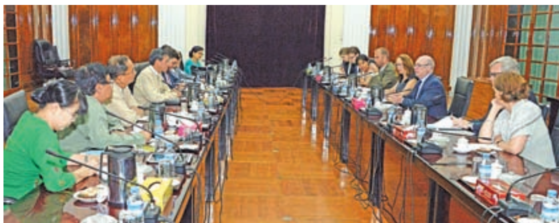
Myanmar official led by Minister Dr. Myo Thein Gyi hold meeting with British Counterparts.

The Union minister also attended ceremonies to open upgraded high schools in Natmawk and Yenanchaung townships.—Myanmar News Agency ■