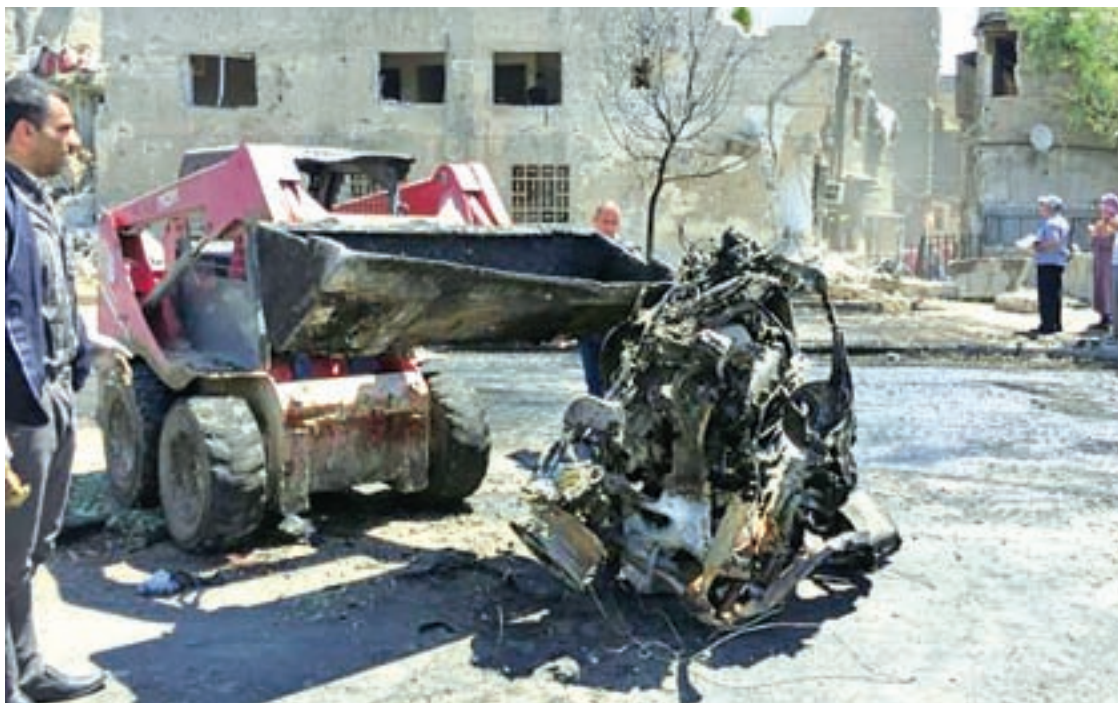
People inspect the damage at one of the blast sites in Damascus, Syria, on 2 July, 2017.

State TV said the casualty toll had been minimised because the security forces had prevented “the terrorists from reaching their targets”, saying they had aimed to target busy areas on the first day back to work after the Eid al-Fitr holiday.