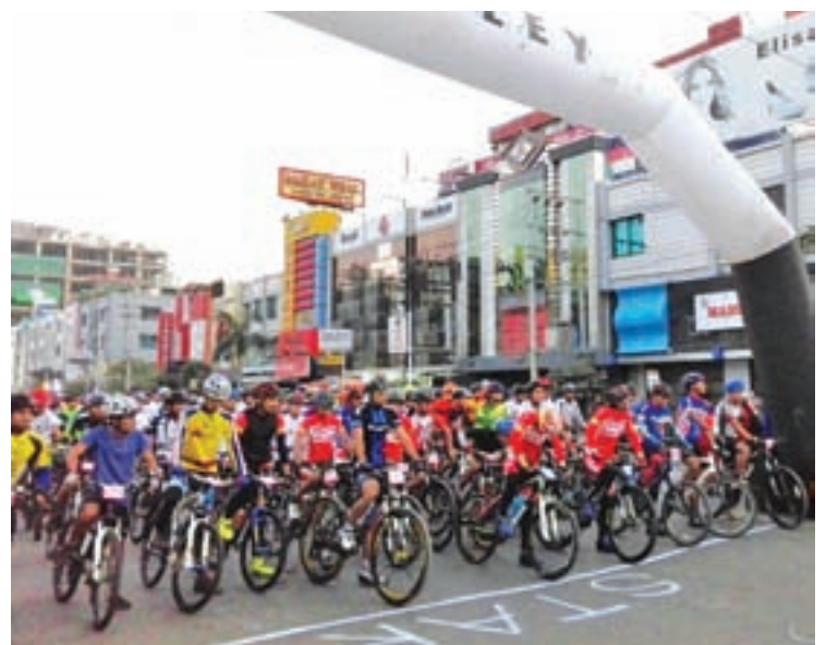
Mandalay is ready to host an uphill and downhill cycling contest.

The first prize winner in the downhill event will receive Ks200,000 cash, second prize receives Ks150,000 and third prize winners get Ks100,000.