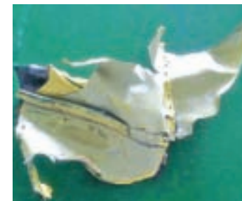
A piece of aluminum.