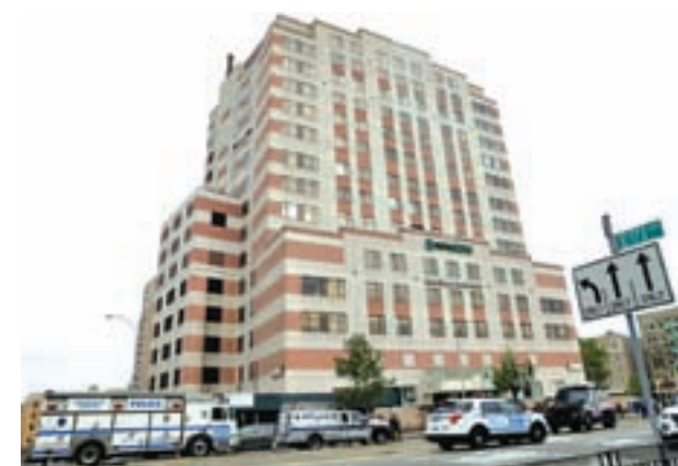
NYPD officers work outside Bronx-Lebanon Hospital, after an incident in which a gunman fired shots inside the hospital, in New York City, US, on 30 June, 2017.

The email did not appear to threaten violence.—Reuters ■