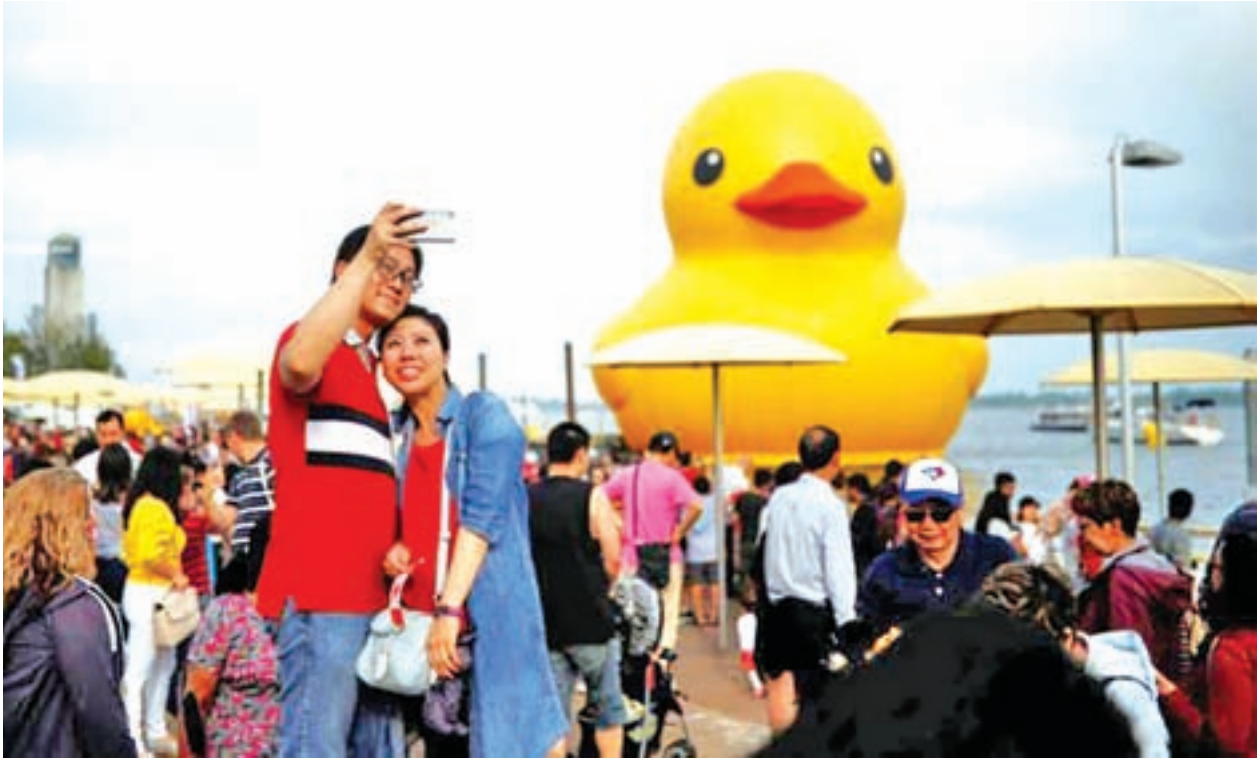
A couple takes a 'selfie' in front of a large inflatable duck installation on the waterfront on Canada Day, as the country marks its 150 th anniversary with 'Canada 150' celebrations, in Toronto, Ontario, Canada, on 1 July 2017.