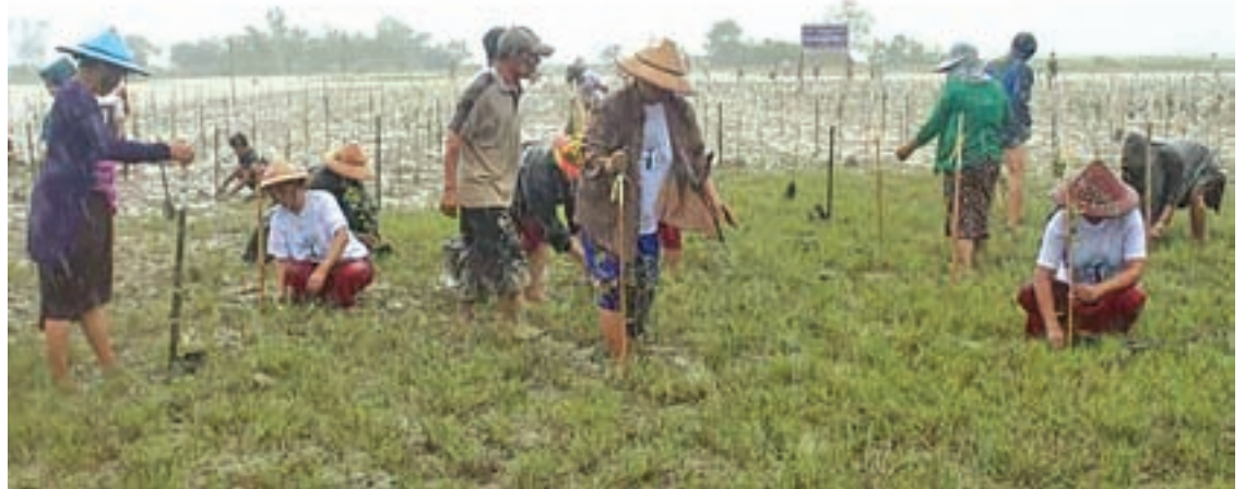
Thousands of mangroves will be grown on Sonema Island in Ye Township, Mon State.

Last fiscal year of 2016-2017, the forestry department planted more than 6,000 mangrove plants on 190 acres of land in Andin Village in Ye Township in