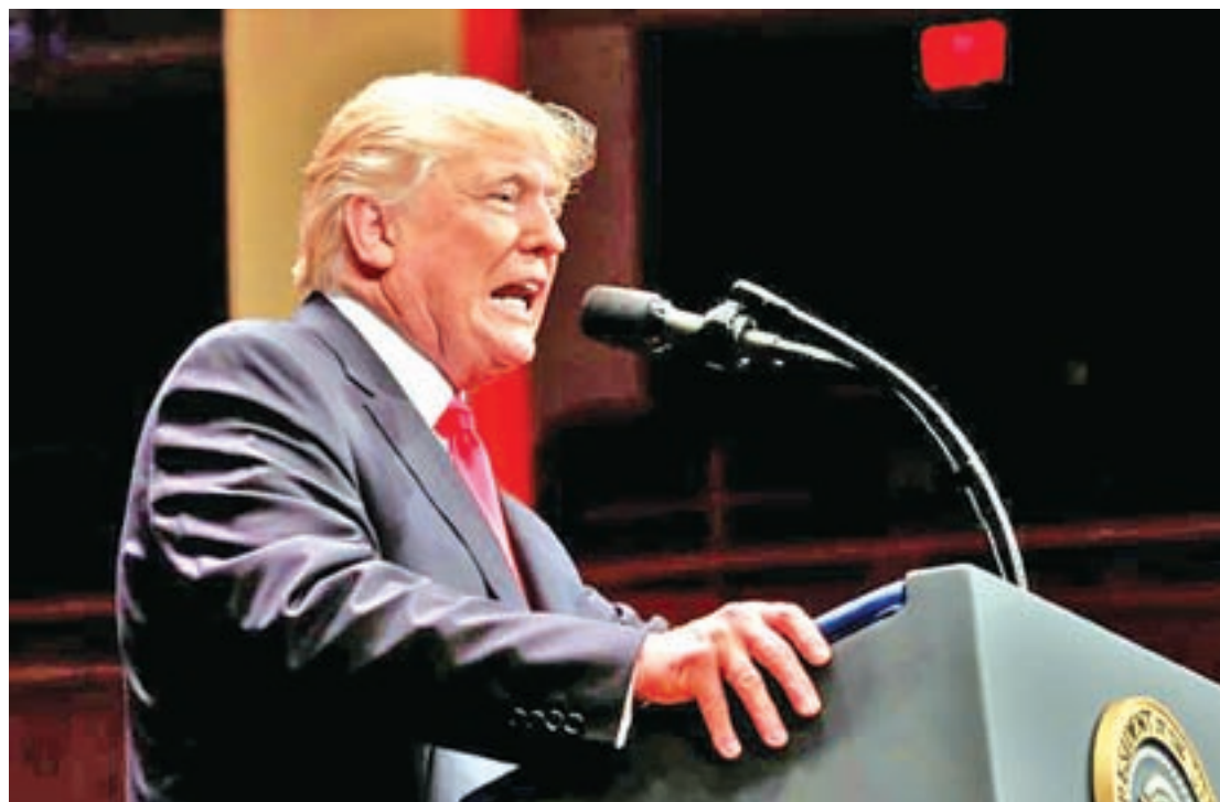
US President Donald Trump speaks at the Celebrate Freedom Rally in Washington, US, on 1 July 2017.

Trump, who is spending a long weekend at his property in