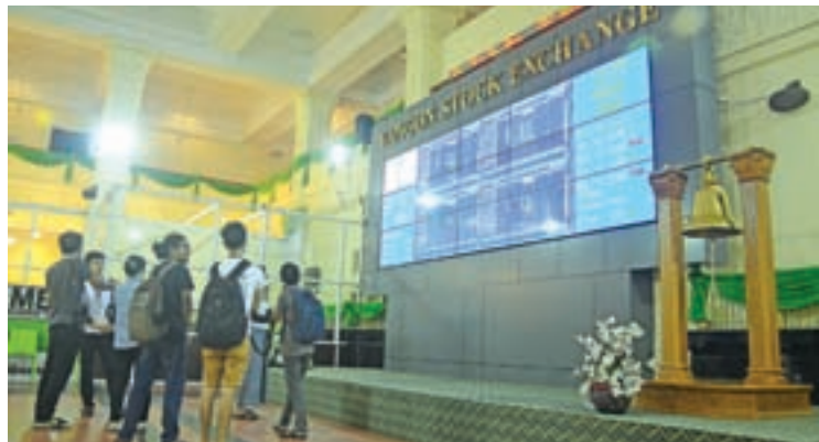
Yangon Stock Exchange in progress.

THE FOUR companies listed on the Yangon Stock Exchange (YSX) traded shares with an estimated value of Ks1.5 million in June, continuing a downward trade volume trajectory, according to data released by YSX.