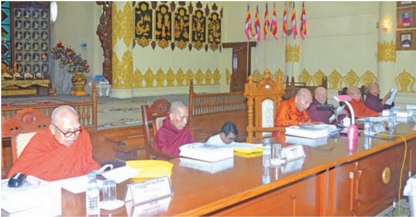
Seventh 47 member State Sangha Maha Nayaka Committee holds 14th meeting.