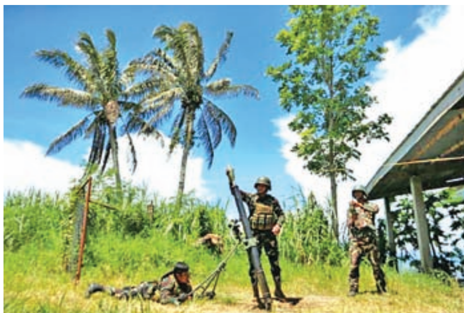
Filipino soldiers launch a mortar from their combat position as government troops continue their assault against insurgents from the Maute group in Marawi city, Philippines on 1 July 2017.

A spotter sat next to him, with his scope set into another hole. The two spoke quietly to each other as the sniper took three more shots across the Agus river into the