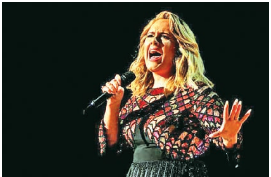
Adele sings "Hello" at the 59th Annual Grammy Awards in Los Angeles, California, US, on 12 February 2017.

The Grammy-award singer has previously had to cancel concerts due to problems with her throat following vocal cord surgery in 2011.—Reuters ■