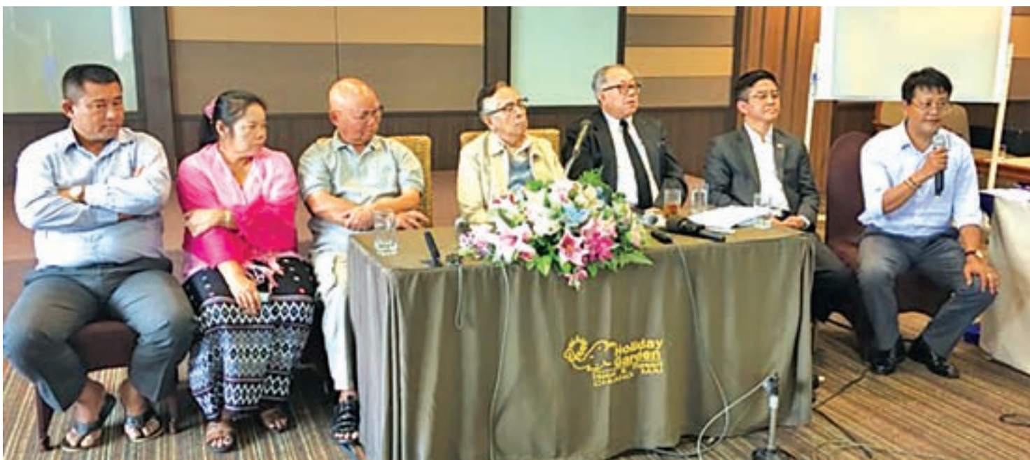
PPST members meet the press after the meeting in Chiangmai in Thailand.