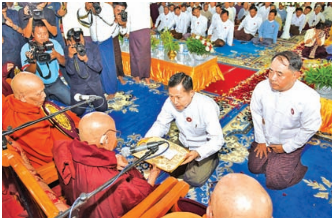
Deputy Commander-in-Chief of Defence Services, Commander-in-Chief (Army) Vice-Senior General Soe Win presents offertories to Sayadaw.

75 th Anniversary Diamond Jubilee of Mahawithutarama Zaygone Monastery of Pyinmana, Naypyitaw Council Region was held at that monastery at 1pm of 1st July.