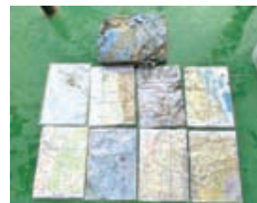
salvaged papers.

The wreckage was salvaged by navy vessels and local fishing boats which have been combing the sea floor with divers and sonar.—Myanmar News Agency ■