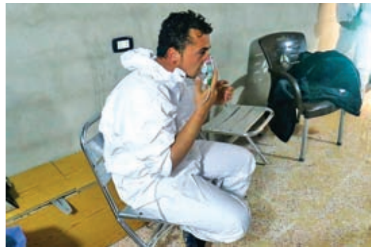
A man breathes through an oxygen mask, after what rescue workers described as a suspected gas attack in the town of Khan Sheikhoun in rebel-held Idlib, Syria, on 4 April 2017.

Russia warned it would respond proportionately if the United States took pre-emptive measures against Syrian forces after Washington said on Monday it appeared the Syrian military was preparing to conduct a chemical weapons attack.—Reuters ■