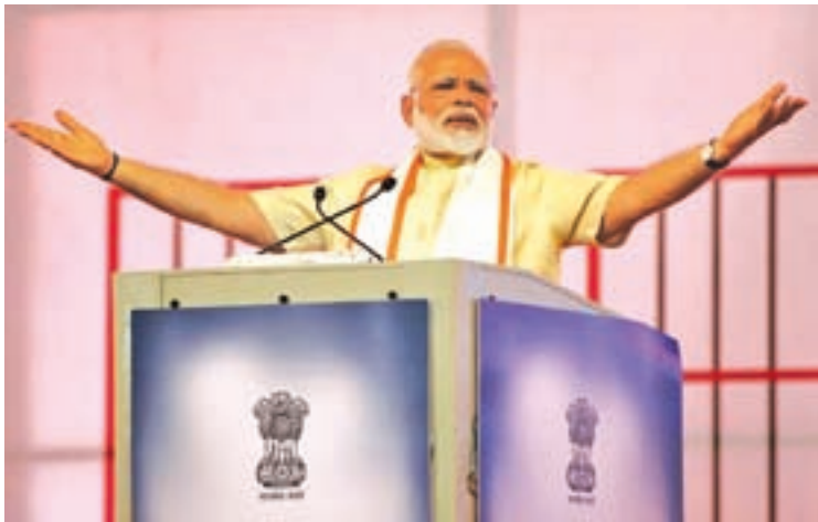
India's Prime Minister Narendra Modi addresses a gathering during his visit to Gandhi Ashram in Ahmedabad, India, on 29 June 2017.

MUMBAI — India has cancelled the registration of more than 100,000 companies which were “in violation of laws”, Prime Minister Narendra Modi said, in the latest effort by the government against “black money” and tax evasion.