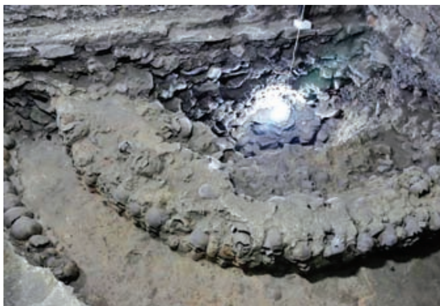
Skulls are seen at a site where more than 650 skulls caked in lime and thousands of fragments were found, in the cylindrical edifice near Templo Mayor, one of the main temples in the Aztec capital Tenochtitlan, which later became Mexico City, Mexico, on 30 June 2017.

But the archaeological dig in the bowels of old Mexico City that began in