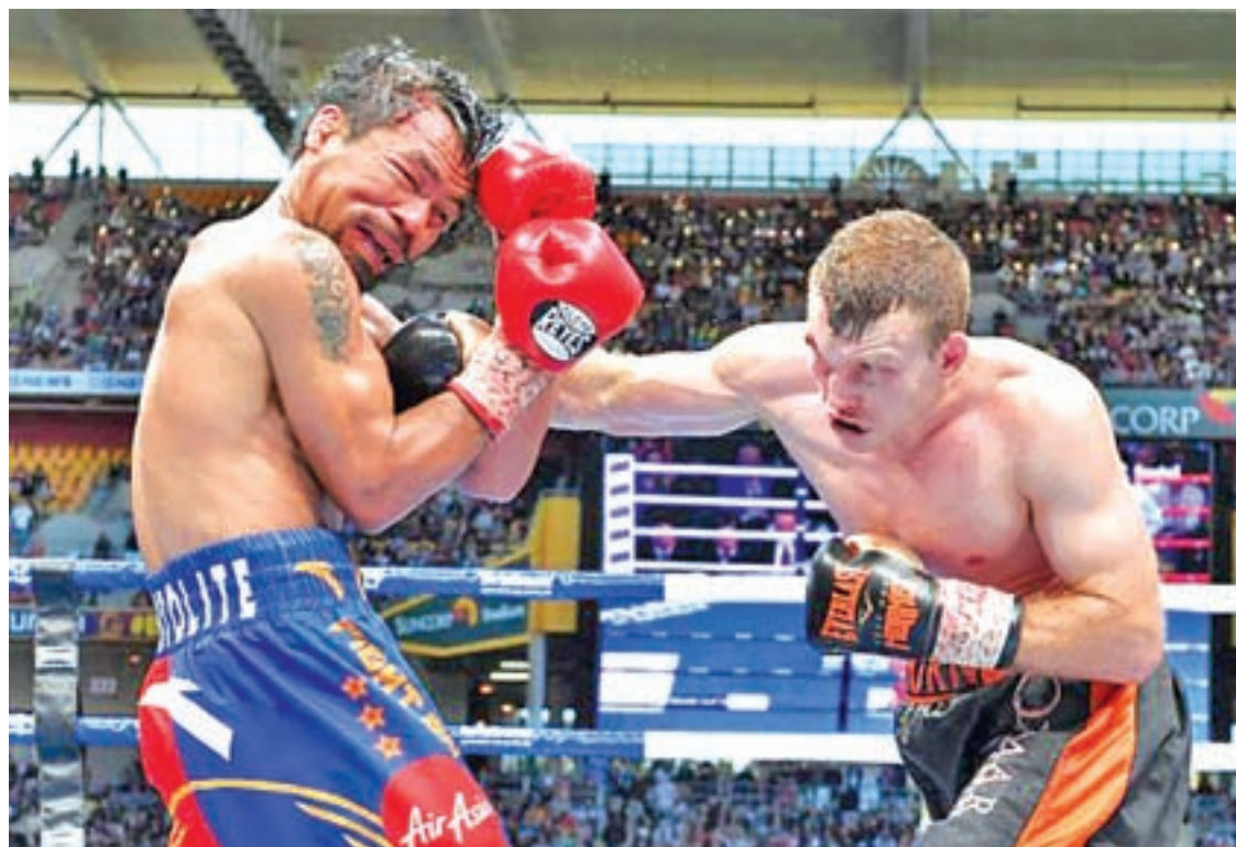
Jeff Horn of Australia punches Manny Pacquiao of the Philippines during WBO World Welterweight Title in Brisbane, Australia, on 2 July 2017.

With blood pouring from both sides of his forehead after accidental butts, the southpaw launched a fierce assault on Horn