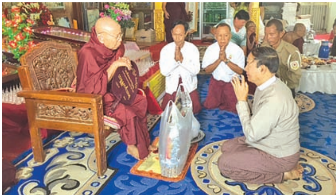
Pyithu Hluttaw Speaker U Win Myint pays respects to Sayadaw Baddanta Kavisara.

The Sayadaw gave a blessing.—Myanmar News Agency ■