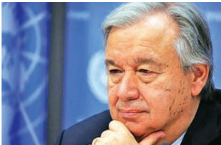
United Nations Secretary-General Antonio Guterres takes part in a news conference at the United Nations headquarters in New York, US, on 20 June, 2017.

He gave no details, but said in a statement that he had held a “positive, results-oriented” meeting with Greek Cypriot leader Nicos Anastasiades and Turkish Cypriot leader Mustafa Akıncı, as well as Greek Foreign Minister Nikos Kotzias and Turkish Foreign Minister Mevlut Cavusoglu