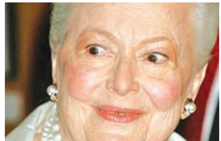
Actress Olivia de Havilland, 89, two-time Academy Award winner, arrives for the 'Academy Tribute to Olivia de Havilland' at the Academy of Motion Picture Arts & Sciences, Beverly Hills in 2006.

De Havilland moved to Paris in the 1950s, where she currently resides, and has only made rare public appearances since retiring.—Reuters ■