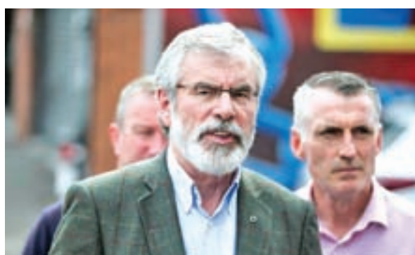
Sinn Fein’s party president Gerry Adams addresses journalists in Belfast, Northern Ireland, on 9 June, 2017.

due to update parliament on Monday. “I think it is very unlikely that there will be an agreement by Monday,” Adams said in a statement. If power-sharing is not restored, Northern Ireland risks reverting to direct rule from London for the first time in a decade, a step backwards in the delicate balance between mainly Catholic Irish nationalists seeking union with Ireland and predominantly Protestant unionists who want to stay in the United Kingdom.—Reuters ■