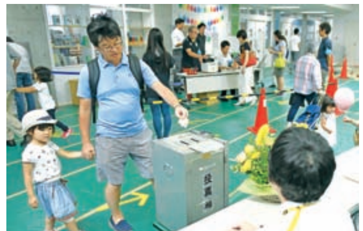
A voter casts a ballot at a polling station in Tokyo on 2 July 2017 for the Tokyo metropolitan assembly election.

This followed the revelation of an audio recording in which a junior female LDP lawmaker