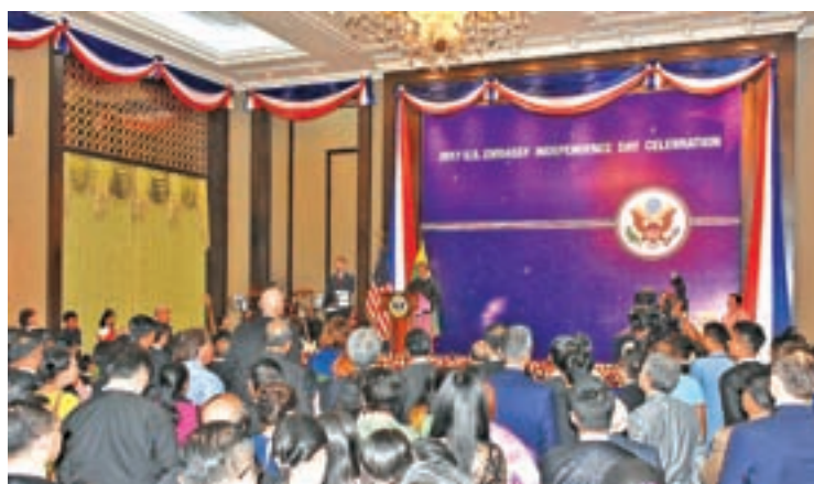
US Embassy's Independence Day Celebration in Nay Pyi Taw.

United States Ambassador to Myanmar Mr Scot Marciel and Union Minister for Office of the State Counsellor U Kyaw Tint Swe delivered the opening speeches. U Hla Thein Chairman of Union Election Commission, Union Ministers, National Security Advisor to the Union Government U Thaung Tun, Chief of General Staff (Army,