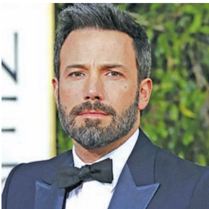
Hollywood star Ben Affleck.

The sequel will also probably include Jon Bernthal, who played a key role in the original.—PTI ■