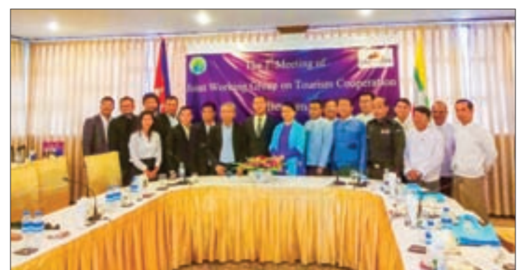
Cambodia and Myanmar held talks over tourism sector.

Attendees discussed coordination of air routes, visa requirements, tourism information exchanges and a joint tourism action plan. The group also agreed to establish joint marketing efforts including