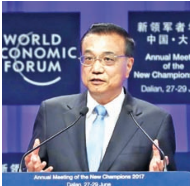
Chinese Premier Li Keqiang addresses the opening ceremony of the Annual Meeting of the New Champions 2017, or Summer Davos, in the city of Dalian, northeast China's Liaoning Province on 27 June, 2017.

The government set the GDP growth target at around 6.5 per cent for the full year, while pledging to pursue better results in actual economic work. In addition, China will keep its consumer price increase at around 3 percent and the registered urban un-