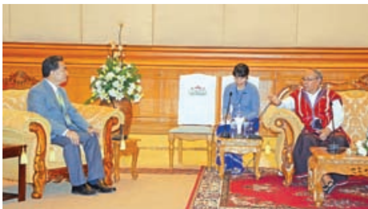
Amyotha Hluttaw Speaker holds talks with Representative Myanmar of Universal Peace Federation.

discussed the programme on Launching of the International Association of Parliamentarians for Peace- Myanmar of Universal Peace Federation.