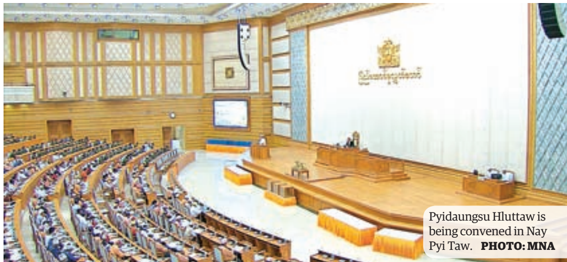
Pyidaungsu Hluttaw is being convened in Nay Pyi Taw.