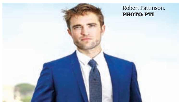
Robert Pattinson.

LONDON — Robert Pattinson has said he offered catering to get a role in "Good Times".