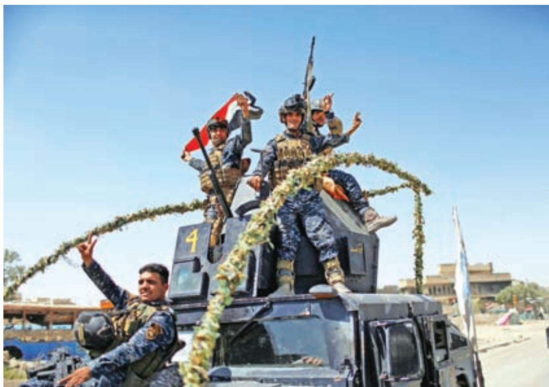
Members of the Iraqi Federal Police gesture after returning back from the front line in the Old City of Mosul, Iraq on 28 June, 2017.

"We will host him with dignity as he is the president of the United States, but no he is not welcome. That's clear," Jean-Luc Melenchon, leader of the France Unbowed movement, told Europe 1 radio.—Reuters ■