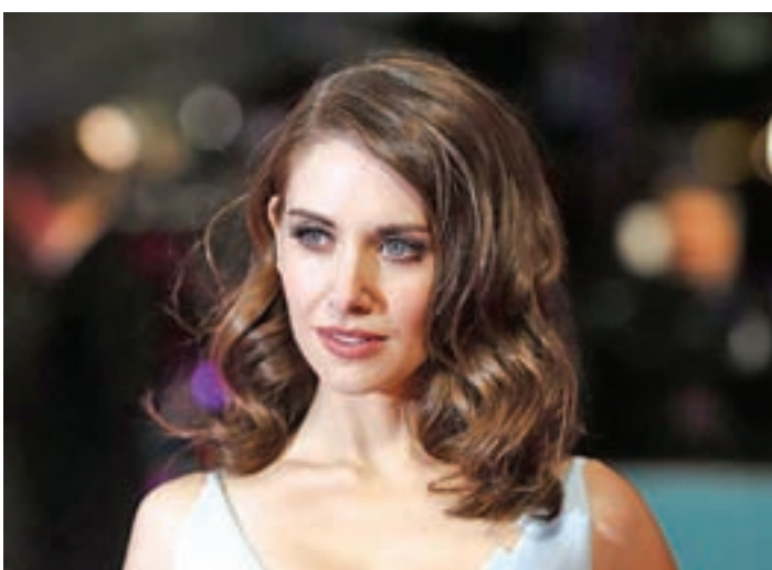
US actress Alison Brie.

Speaking about her latest venture, she says, "Glow" is such a unique animal. It's really unlike contemporary wrestling that is being done today. "On the one side, it's about physicality, feeling comfortable and powerful within yourself, and it's also about discovering your inner warrior and your alter ego; another personality. Especially for the women here, who can be messy and aggressive in ways that women (in real life) so often feel like they can't.—PTI ■