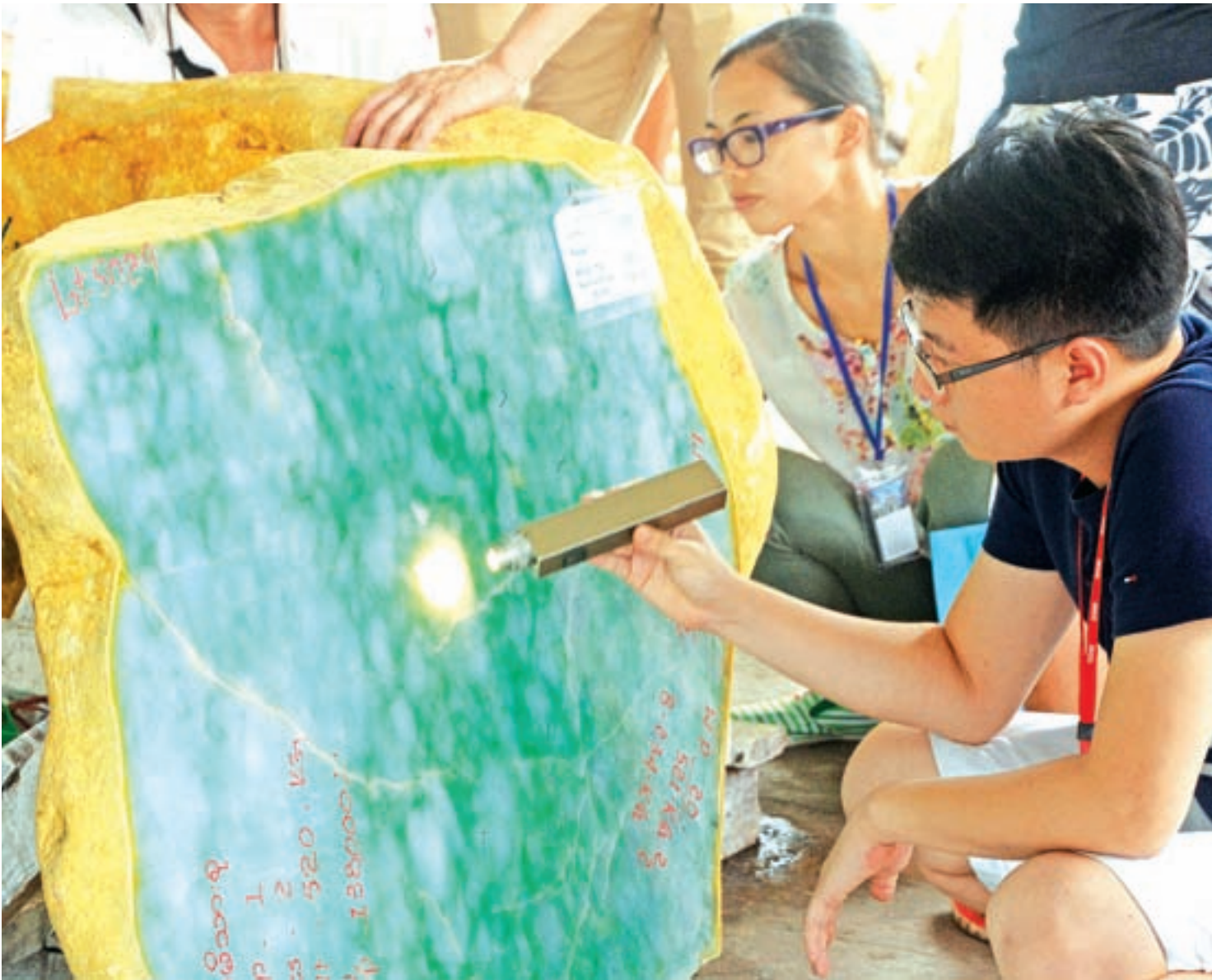
Merchants appraise jade stones at the 53 rd Myanmar Gems Emporium in the Mani Yadana Jade Hall in Nay Pyi Taw.