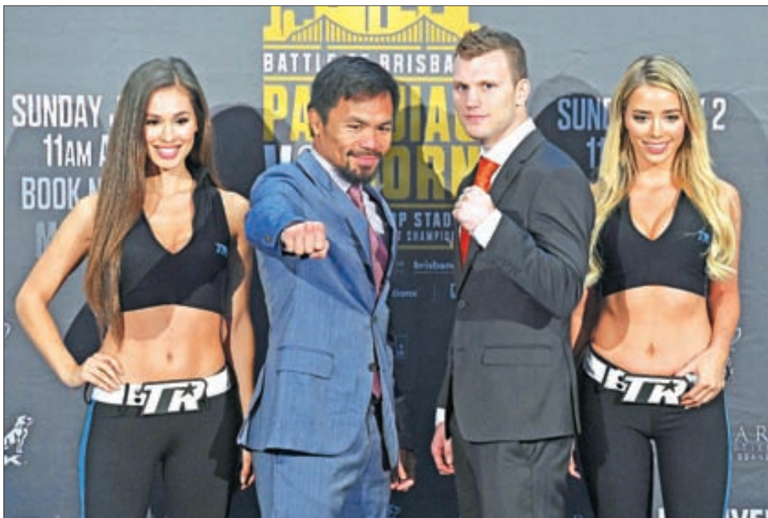
Boxers Manny Pacquiao of the Philippines and Australia's Jeff Horn stand together following their official news conference ahead of their WBO welterweight fight in Brisbane, Australia on 28 June, 2017.