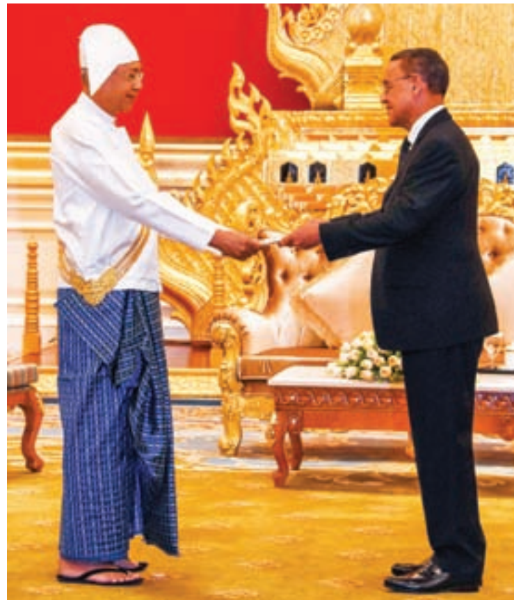
President U Htin Kyaw accepts Letter of Credence from the newly-accredited South African Ambassador.