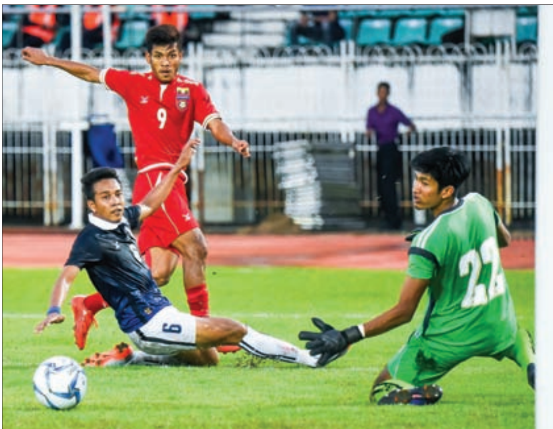
One of Myanmar player touches the ball directly into the net.

The Myanmar U-22 national football team will next play Hong Kong tonight at 6pm. —Nyi Myat Thawda ■