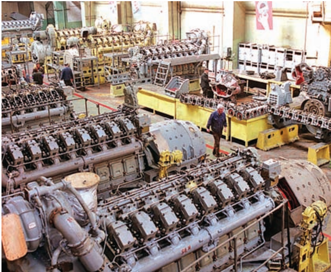
Maritime engines may be further improved by increasing their capacity and efficiency.