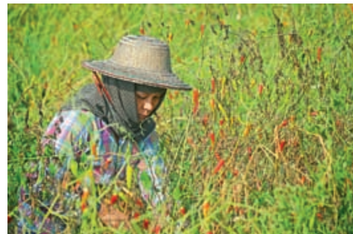
A farmer harvests chillies in Kangyidauk town, Ayeyawady Region.

"We had a desire to launch the servicing of crop insurance three years ago. But no one encouraged us, saying that we would make a loss. So we studied how it was managed in other countries and whether there were any company which went bankrupt. We found that state-owned enterprises, joint ventures and government-subsidised companies were operating.