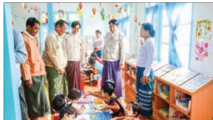
Union Minister Dr. Pe Myint visits the community centre at Pyinmana Information and Public Relations Department.

Later, the Union Minister gave commemoration certificates to people who donated to the community centre. The Union Minister then inspected the mobile library bus donated by the Daw Khin Kyi Foundation and the community centre. The community centre and mobile library that opened in Pyinmana yesterday is the fifth one to be opened, with others already opened in Kawhmu, Insein, Myaungmya and Natmouk townships. The Daw Khin Kyi Foundation and the Ministry of Information have signed a memorandum to open mobile libraries and community centres in 26 townships in 14 regions and states within five years. The next destination is said to be in Myitkyina.—Myanmar News Agency ■