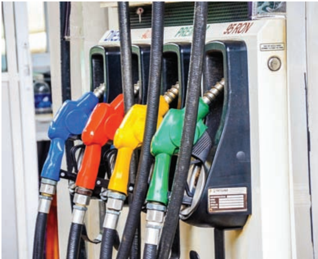
Fuel pumps are seen at a refilling station in Yangon.