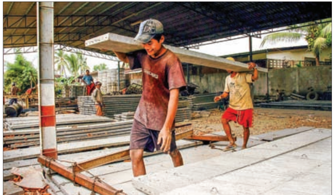
Migrant workers from Myanmar work at a construction site in Malaysia.

U Kyaw Htin Kyaw, the general secretary of Myanmar Oversea Employment Agencies