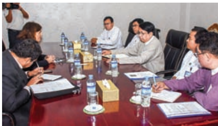
Union Minister for Information Dr Pe Myint holds talks with Norwegian Ambassador in Nay Pyi Taw.