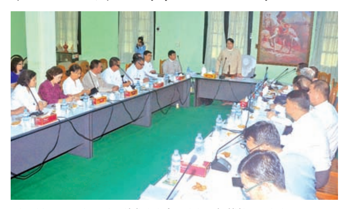
Union Minister Dr Pe Myint meeting with dignitaries from printing and publishing organizations. PHOTO:

Fifteen volumes of the Myanmar Encyclopedia had been published by the Myanmar Translation Society (Sarpay Beikman) from 1954 to 1976. Starting from 1978, an annual Myanmar Encyclopedia (condensed) was published yearly for 39 issues. It is learnt that the Printing and Publishing Department of the Ministry of Information, Sarpay Beikman and Tun Foundations are working together to update and publish the original 15 volumes of the Myanmar Encyclopedia. —Yi Yi Myint & Ohnma Thant■