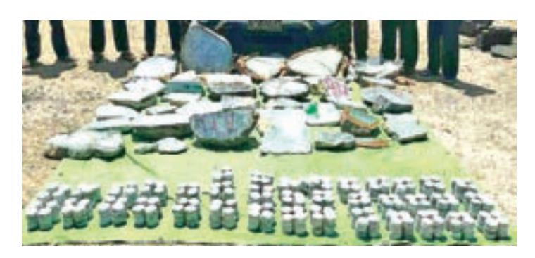
Seized jade stones are seen.

Gates were opened to prevent the flow of illegal goods. On Friday, the, Yaypu Permanent Inspection Gate confiscated goods with an estimated worth of Ks 130.70 million in four separate incidents. The Mayanchaung Permanent Inspection Gate also uncovered the attempted transport of illegal goods worth of Ks10.7 million in three separate cases.—001 ■