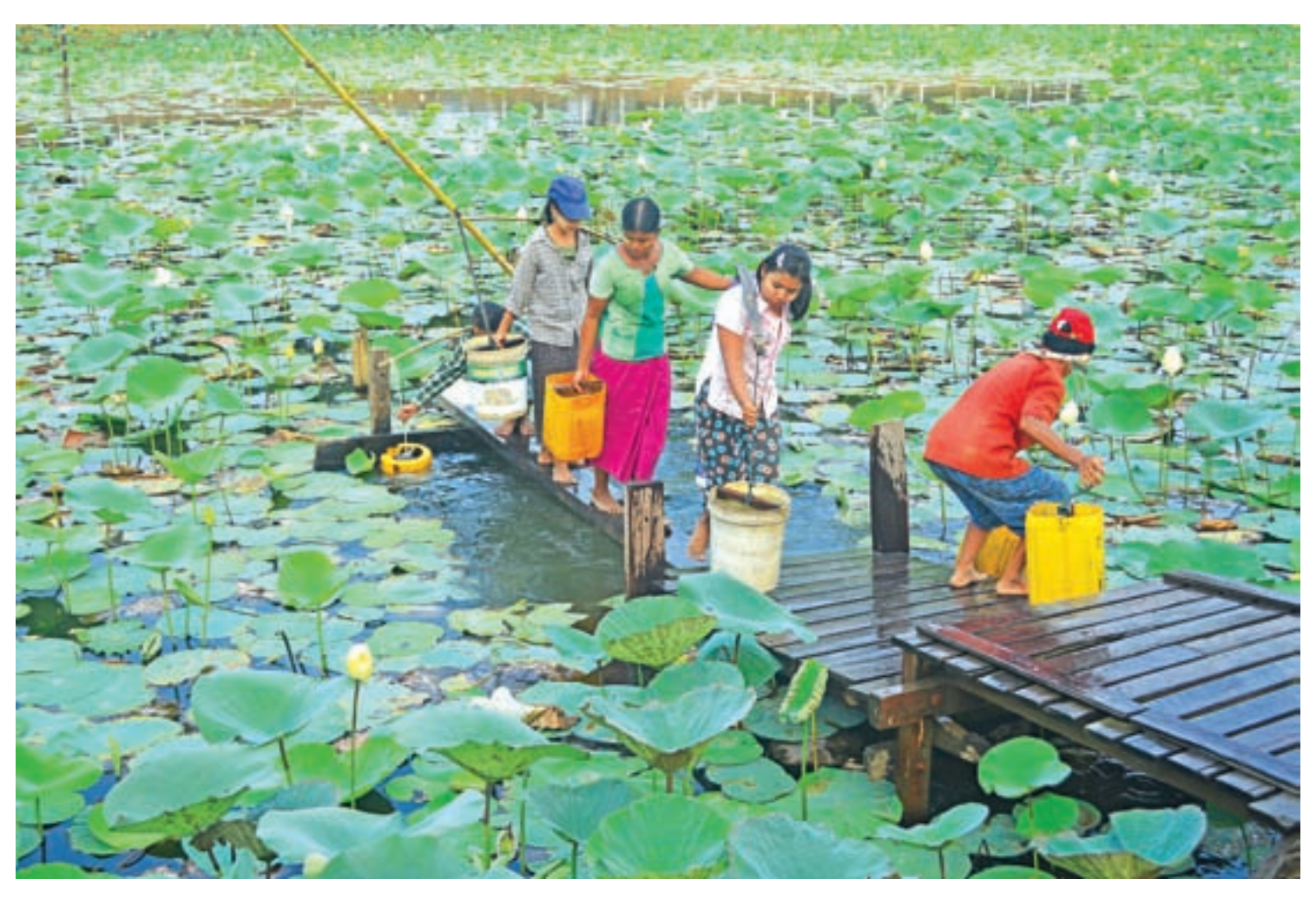
People collect drinking water from a lake in Dalla in the southern outskirts of Yangon. A partnership with the World Bank since 2015 has helped families in villages across Myanmar with education, health, clean water, sanitation, electricity for lighting, refrigeration, and business development.