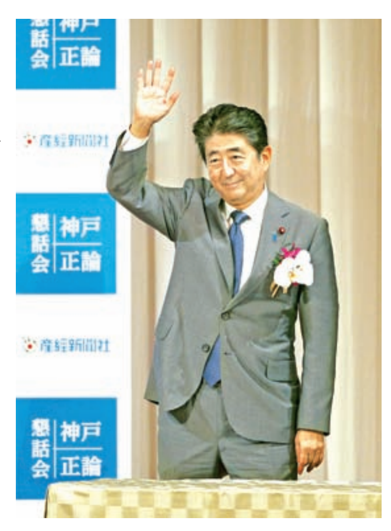
Japan's Prime Minister Shinzo Abe, leader of the ruling Liberal Democratic Party, gives a speech in Kobe on 24 June, 2017.

Abe has said he hopes the revised supreme law will be put into force in 2020, when Japan will host the Olympics and Paralympics in Tokyo. Achieving the politically sensitive goal requires careful planning, with two major national elections upcoming — the House of Representatives election by December 2018 at the latest and the House of Councillors election in the summer of 2019.—Kyodo News ■