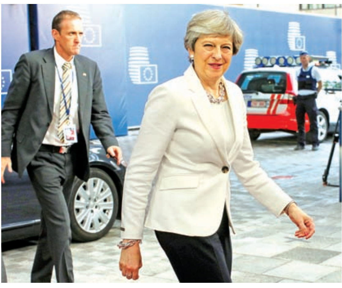
British Prime Minister Theresa May arrives at the EU summit in Brussels, Belgium on 23 June, 2017.

Many leaders want to see details that May promised for Monday, including the nit-