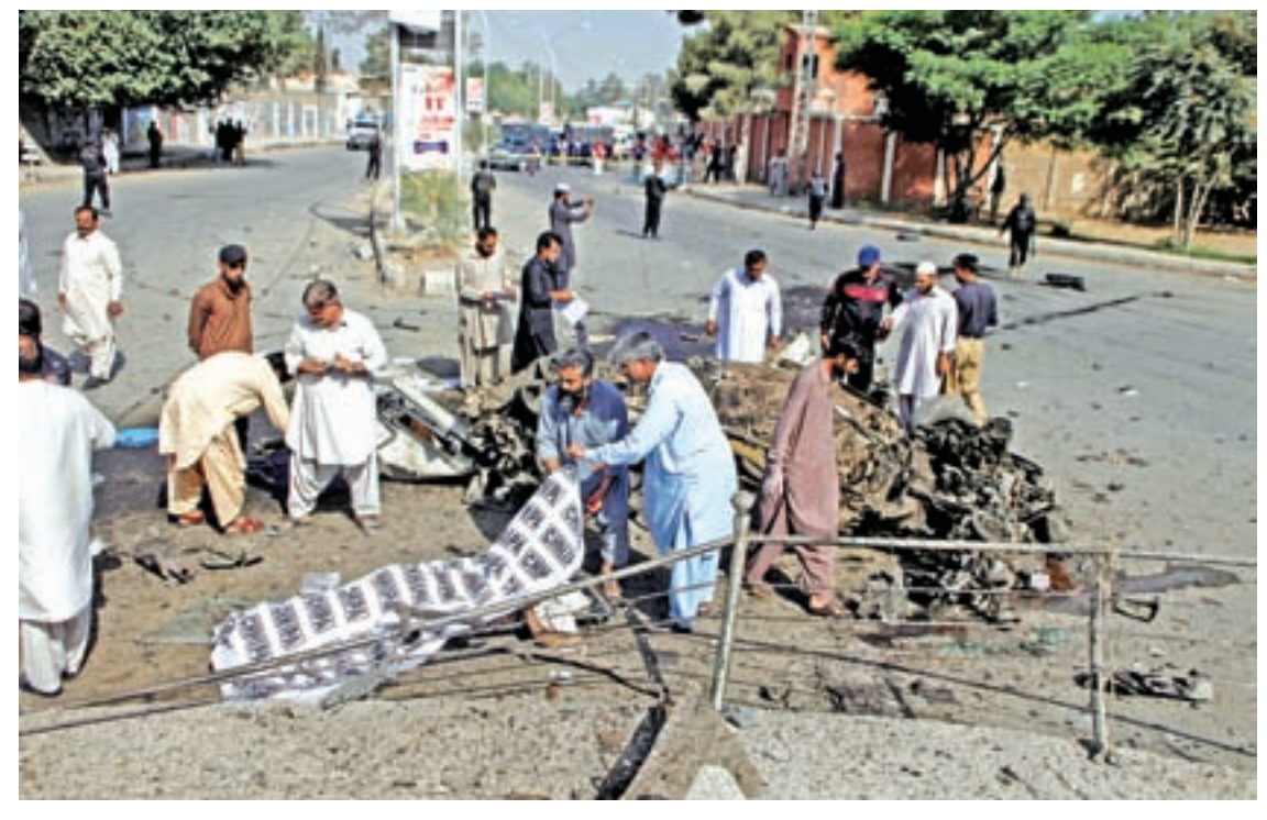
Police and rescue officials inspect the site of blast in Quetta, Pakistan on 23 June, 2017.

LeJ Al Alami, which has previously partnered with Middle East-based Islamic State to carry out attacks in Pakistan, said it has previously "warned