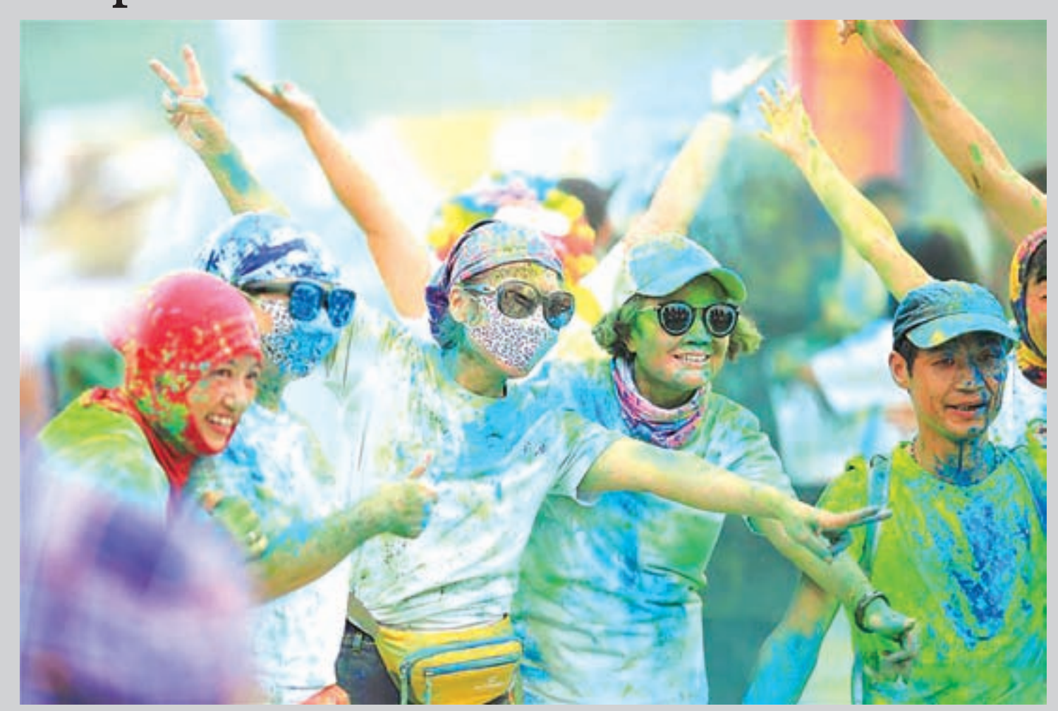
People attend a colour run in Hengyang, central China's Hunan Province on 24 June, 2017. More than 3,000 people took part in the colour run here on Saturday.