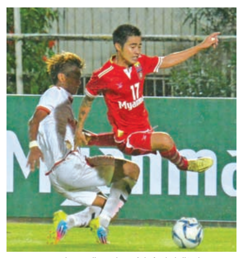
Myanmar U-22 and MWL All Star players fight for the ball in the test match at Thuwunna Stadium in Yangon.

playing well in the early part of second half, but gradually picked up the pace to equalise on the 70th minute. Than Paing scored after Sithu Aung created