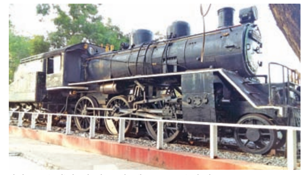
The locomotive displayed at the Death Railway Museum in Thanbyuzayat.

of 611.45 tons, height of 26.75 feet and girth of 84 feet from the floor of the ocean and placed it on the top of Kyaiktiyo Mountain which is about 80 feet in girth and 124 feet in height. It is said that when the celestial king placed the boulder at the top of the mountain there was gap between the main mountain and the boulder measuring the height of a broody hen.