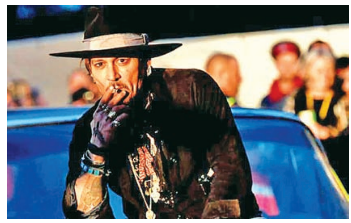
Actor Johnny Depp poses on a Cadillac before presenting his film The Libertine, at Cinemageddon at Worthy Farm in Somerset during the Glastonbury Festival in Britain on 22 June, 2017.

"I apologize for the bad joke I attempted last night in poor