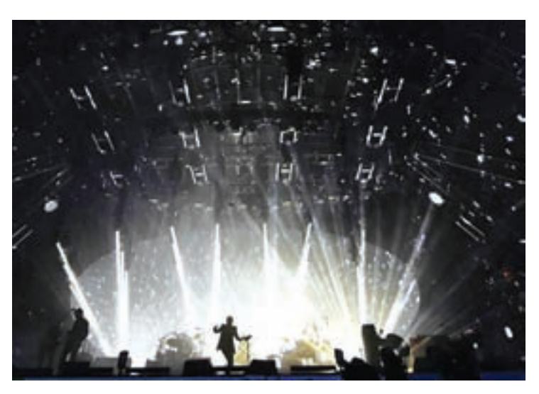
Radiohead performs on the Pyramid Stage at Worthy Farm in Somerset during the Glastonbury Festival in Britain on 23 June, 2017.

Other performers on the main stage at Worthy Farm in south-west England, included 81-year-old Kris Kristofferson and English indie band the xx.—Reuters