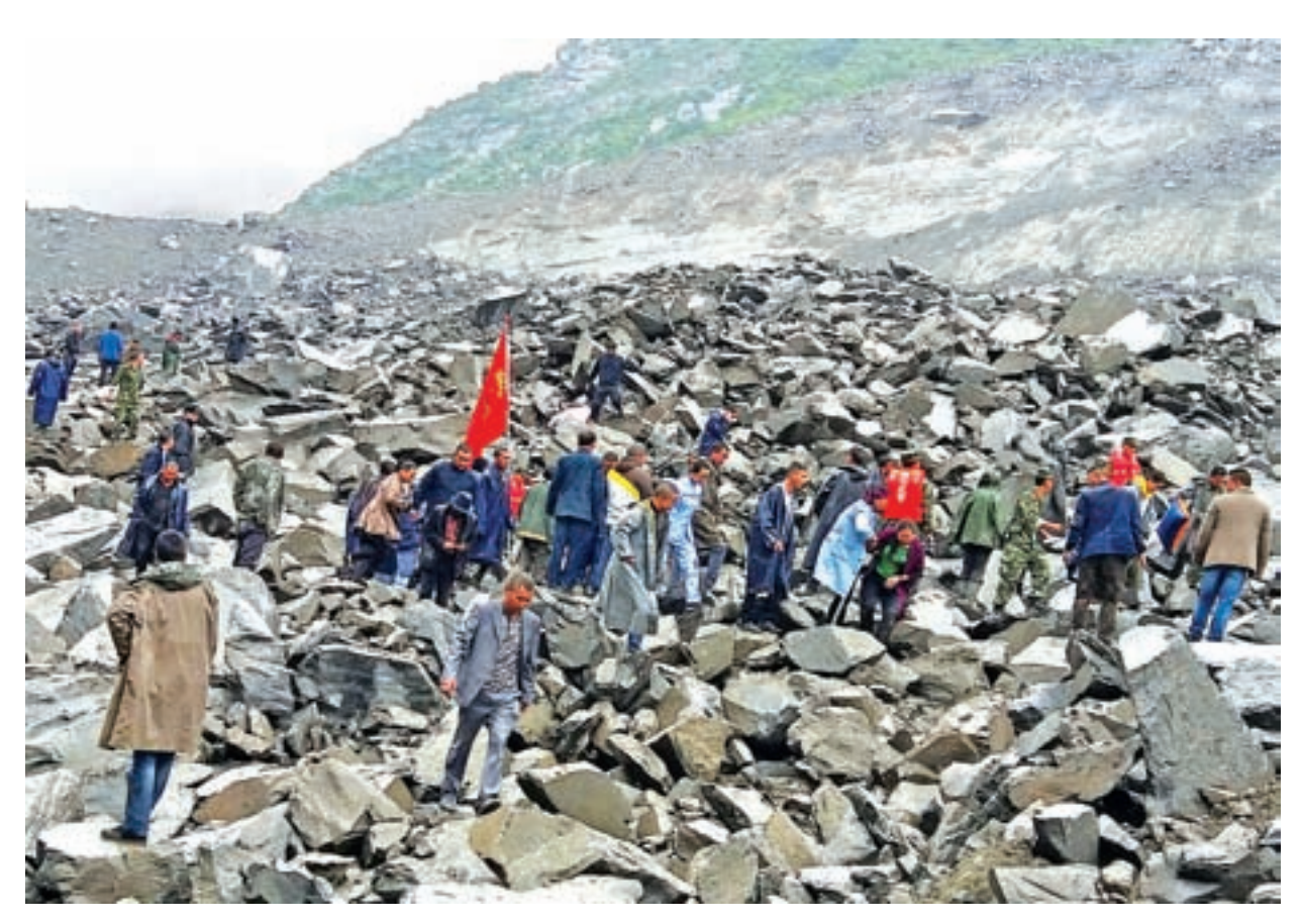
People search for survivors at the site of a landslide that destroyed some 40 households, where more than 100 people are feared to be buried, according to local media reports, in Xinmo Village, China, on 24 June 2017.