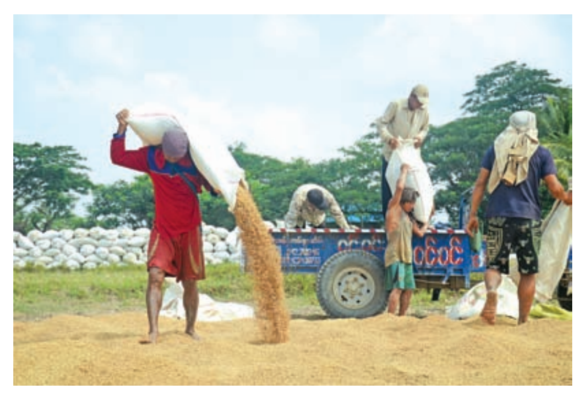
Farmers dry paddy on a rice field in Ayeyawady Delta.