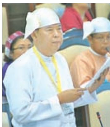
U Win Maw Htun, Deputy Minister for Education.