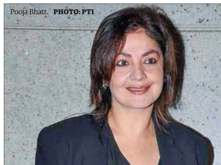
Pooja Bhatt.