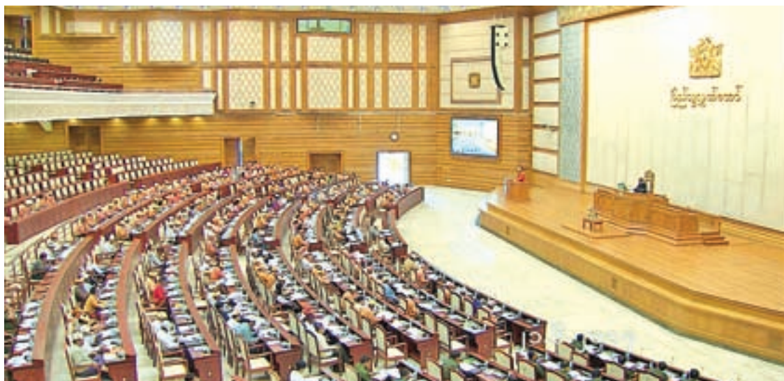
Pyithu Hluttaw discussed about citizenship issues for children born abroad.

Myanmar nationals who moved abroad and acquired new citizenship, or other Myanmar nationals who have otherwise lost or relinquished Myanmar citizenship must also apply for Myanmar citizenship for their offspring, according to U Thein Swe.