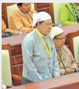
U Thein Swe, Union Minister for Labour, Immigration and Population.