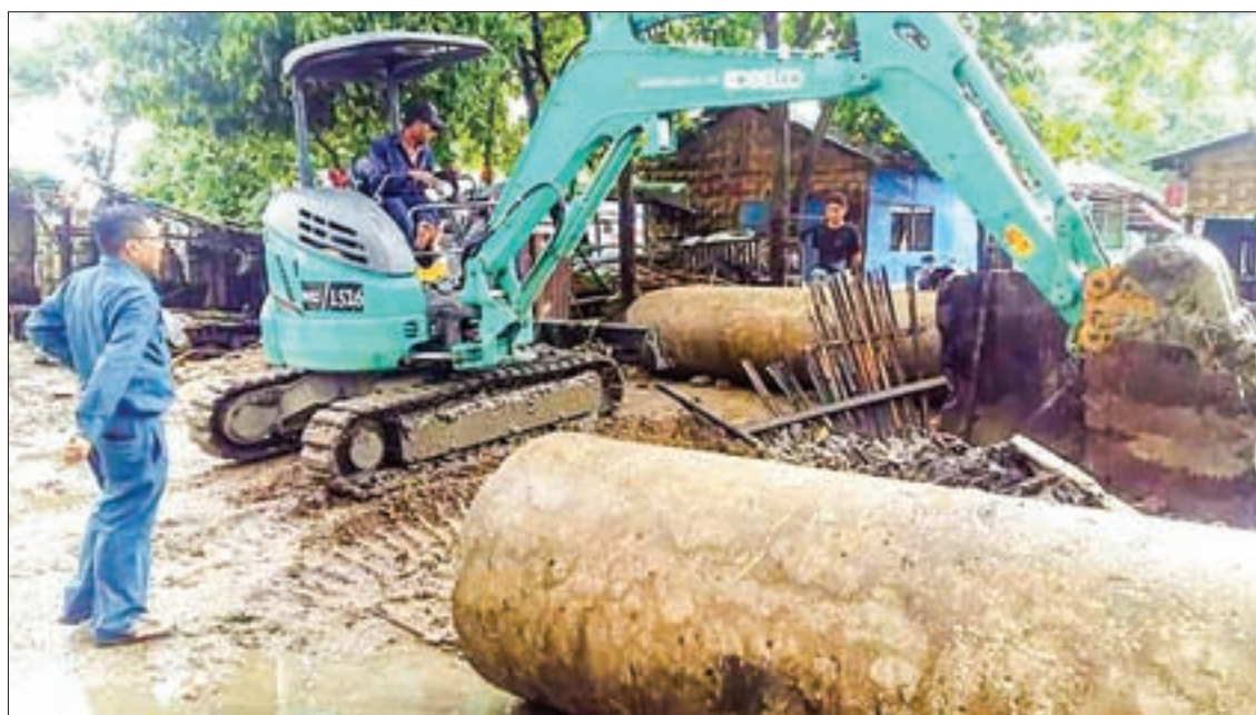
A YCDC official inspects a working site in Yangon.