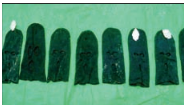
Black ski masks found in the tunnel.

terrorist training caught with 4 dwelling huts and other commodities, in the evening of March 7 in the gorges near Tinn May village.