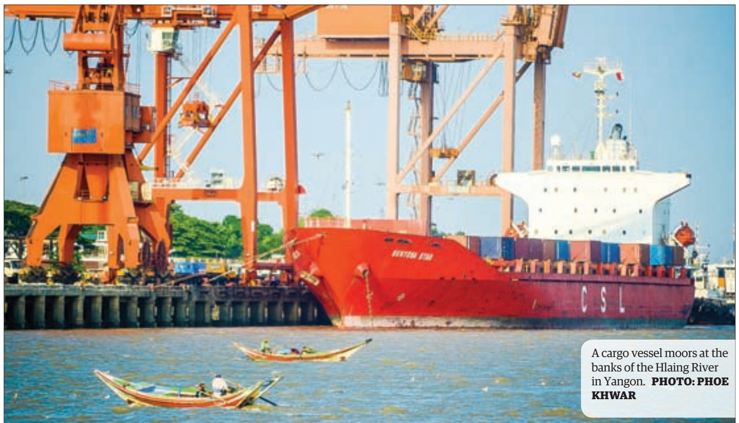
A cargo vessel moors at the banks of the Hlaing River in Yangon.

Due to limitation of space we are only able to publish "Letter to the Editor" that do not exceed 500 words. Should you submit a text longer than 500 words please be aware that your letter will be edited.