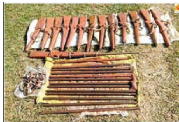
Guns and wooden sticks found in the tunnel.