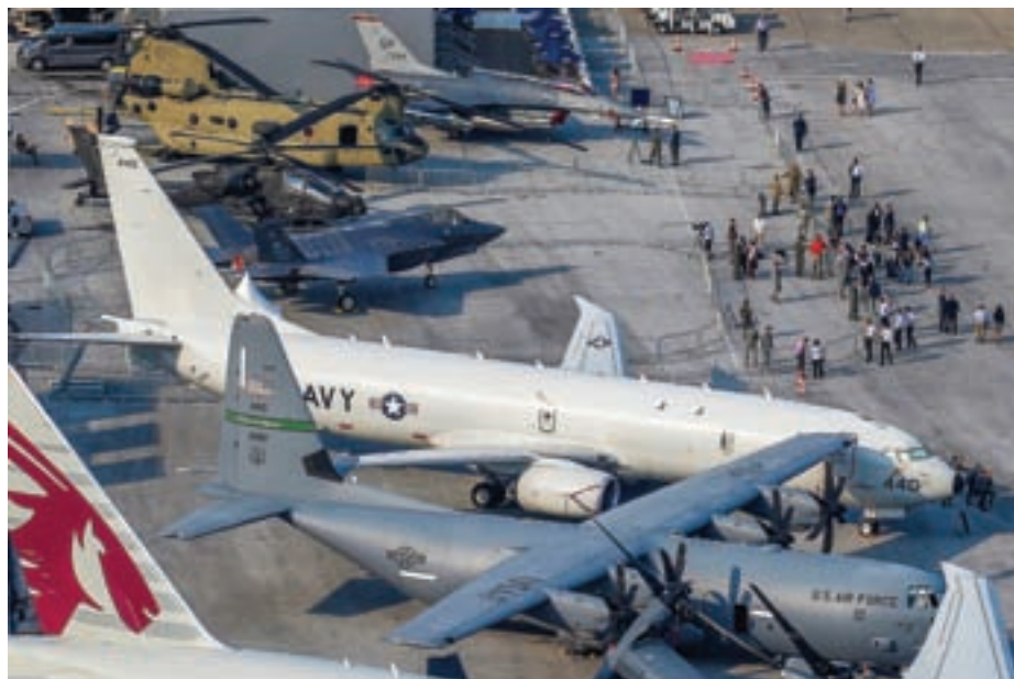
An aerial view of the 52nd Paris Air Show at Le Bourget Airport near Paris, France on 21 June, 2017.

“It’s a cool little programme,” he said. “This is just the first tranche, but it