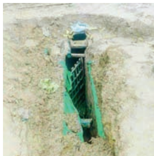
Left, the tunnel discovered by security forces used for terroroist training. Right, top: rice and cooking oil found at the training site. Right, centre: binoculars, weapons, wire and gunpowder. Right, bottom: the entrance of the tunnel.