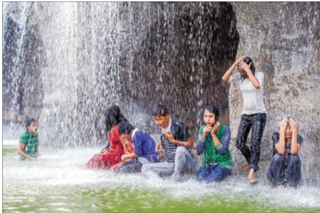
People cool themselves down under the artificial waterfall in Nay Pyi Taw.

“We are running out of choices for the future ... For heatwaves, our options are now between bad or terrible”