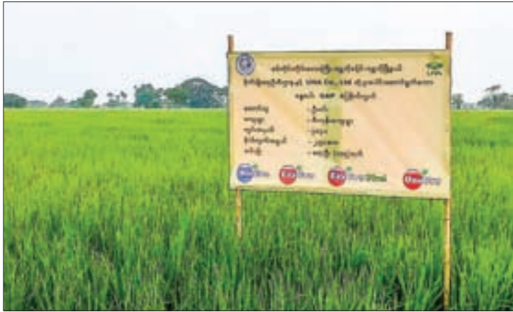
A paddy field plot in Shwebo Township, Sagaing Region.