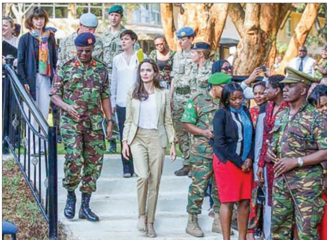
US Actor and UNHCR Special Envoy Angelina Jolie arrives to give a statement in front of the sexual and gender-based violence prevention course at The International Peace Support Training Centre in Nairobi, Kenya on 20 June, 2017.

The UNHCR says Kenya hosts some 491,000 refugees, of which 101,713 are from South Sudan, which the UN has said is the world’s fastest growing refugee crisis. —Reuters ■