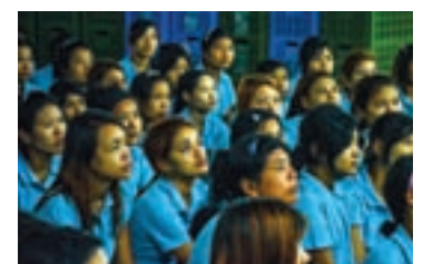
NATIONAL Statistics for Myanmar labour force released