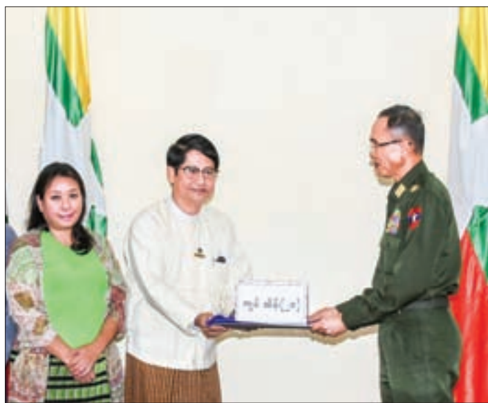
Union Minister Lt-Gen Sein Win accepts cash donation from U Thet Lwin Toe for plane crash victims; families.