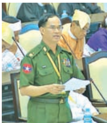
Major General Aung Soe, Deputy Minister for Home Affairs.