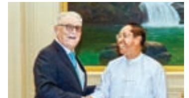
NATIONAL Vice President U Myint Swe receives German Ambassador