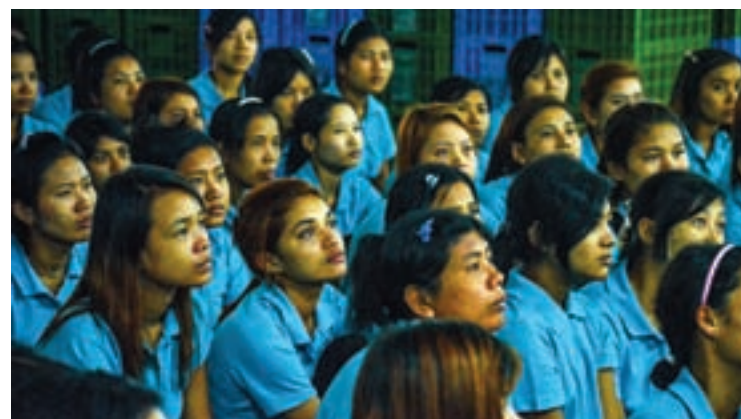
Only 51 per cent of females between the ages of 15 to 64 are in the labour force in Myanmar.

The report shows that there are 500,000 children between the age of 10 to 14 who are currently working and 77,000 children are searching for employment. The schooling rate is low among working children with 82 per cent of 10 years old children and 91 per cent of 12 years old children having never attended school. Agriculture is the main industry for Myanmar and 40 per cent of