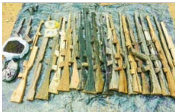
Wooden guns used for practise were found in the tunnel.

In the afternoon of January 4, 2017 4 persons including Gumushoo aged 19 who attended the terrorist training, were seized together with 13 pieces of local-made guns & related items at Maunggyitaung village, with Maulawi Adu-larmein, trainee from the