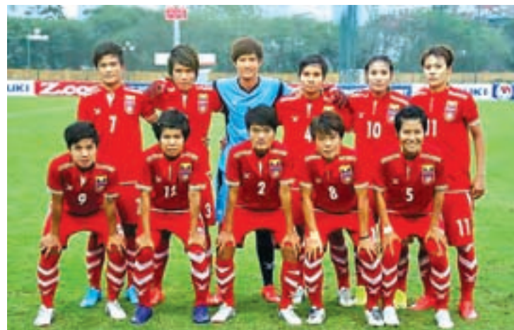
Myanmar women's national football team seen before an international match.

Myanmar Football Federation (MFF) is attempting to reach the agreement for Myanmar women's national football team to play a friendly match with Japanese U-22 and J-League clubs. "The plan was arranged so as to test the ability of the players before they participate in SEA Game matches and we are aiming for the team to possess the gold medal in 29th SEA game that is going to be held in Malaysia." The officials from MFF have been asked about agreement to officials of Japanese football association for the friendly matches and Japanese officials will reply in a few days", said MFF's Deputy administra-