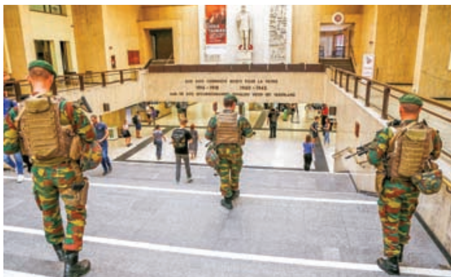
Belgian soldiers patrol inside Brussels central railway station after a suicide bomber was shot dead by troops in Brussels, Belgium on 21 June, 2017.

He then ran back up to the concourse where commuters had been milling around and rushed toward a soldier shouting "Allahu akbar" — God is greater, in Arabic. The soldier, part of a routine patrol, shot him several times. Bomb dis-