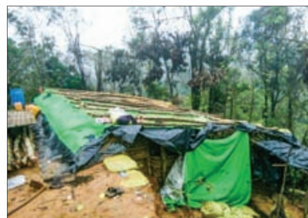
Makeshift huts used for living in.