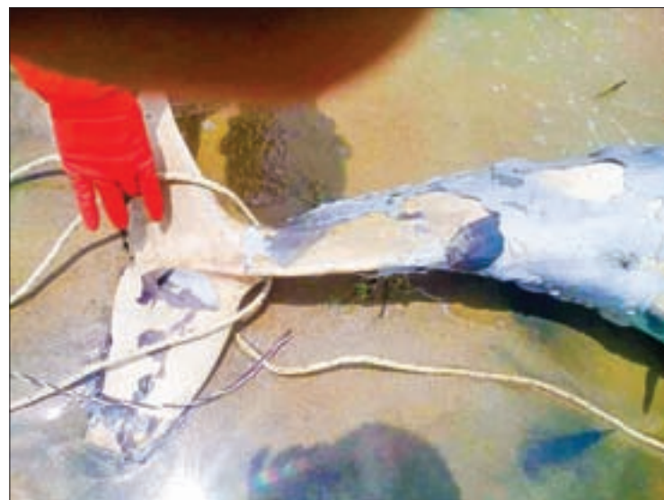
The dolphin was thought to have died of old age and was found three days after its assumed death on 19 June.