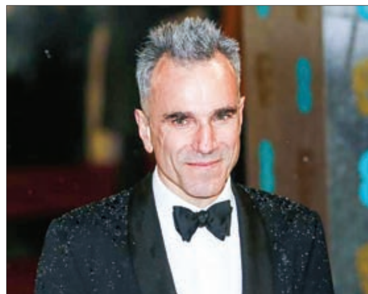
Actor Daniel Day-Lewis poses as he arrives for the British Academy of Film and Arts (BAFTA) awards ceremony at the Royal Opera House in London on 10 February, 2013.

He previously won Academy Awards for his roles as a paraplegic Irish writer in “My Left