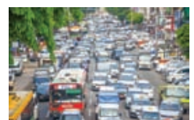
LOCAL BUSINESS Nearly 600,000 vehicles permitted for import