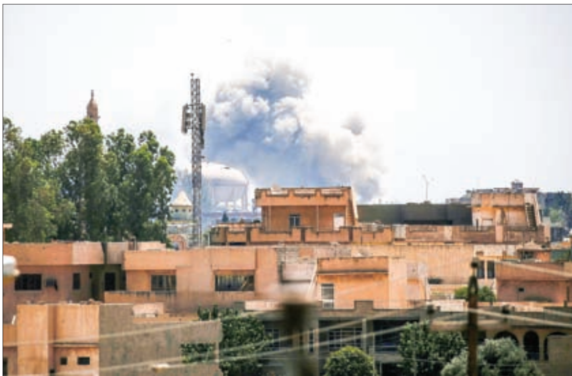
Smoke billows from the positions of the Islamic State militants after an airstrike in western Mosul, Iraq on 19 June, 2017.

Iraqi officials have privately expressed the hope that the mosque could be captured by