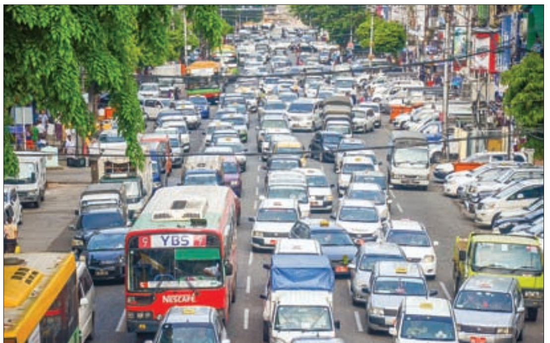
Yangon's traffic may become more congested after more vehicles are imported.

MAPCO is attempting to generate electricity by setting up a paddy husk power plant”, said a responsible person from MAPCO to Myawady.—GNLM ■