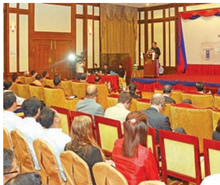
Union Attorney General U Tun Tun Oo addresses the audience at the Royal ACE Hotel in Nay Pyi Taw yesterday.

Those present at the meeting were presented with the annual report. The report is available on http://www.unionsupremecourt.gov.mm . Suggestions for the project for judicial reform can be sent to ousc.planningteam@gmail.com . —Myanmar News Agency ■