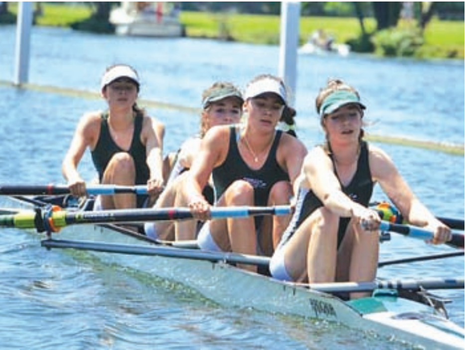
The Surbiton High School Boat Club compete in a race at the Henley Women's Regatta in Henley-on-Thames, Britain on 17 June, 2017.

"It really celebrates women's achievement," he said.— Reuters ■