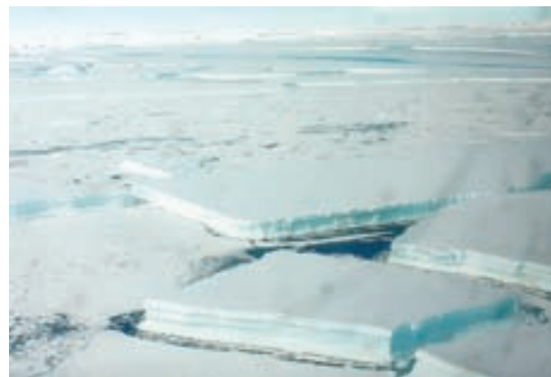
A view of icebergs remaining after a break-up of Wilkins ice shelf on the Antarctic Peninsula on 19 January, 2009.