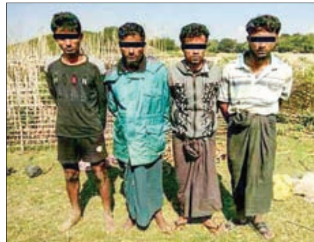
Four men suspected of running a previous training camp.

With a view to control and influence Maungtaung area by uses of terrorist, 34 innocent people including village elders and a librarian were killed in various ways, with 22 others abducted.—State Counsellor's Office Information Committee ■