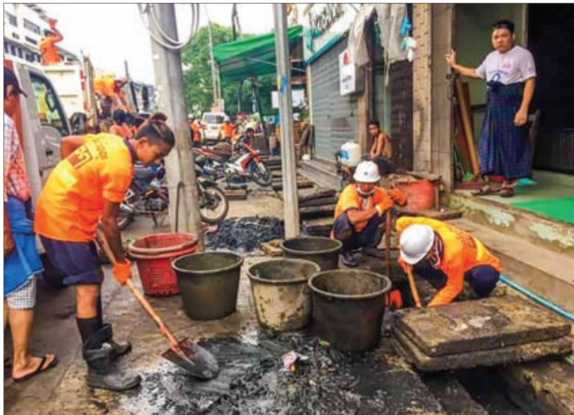
YCDC workers cleaning garbage systematically in front of the buildings.