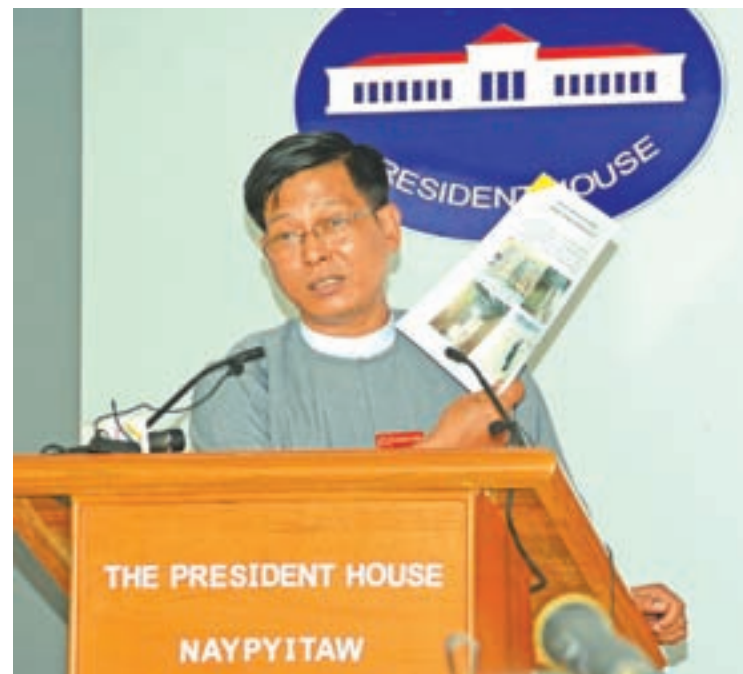
Director-General U Zaw Htay speaks to journalists in the Presidential House in Nay Pyi Taw yesterday.

It has been made clear that only the 21 groups who were at the NCA negotiations will be accepted and groups who formed after the NCA will not be accepted, said U Zaw Htay.