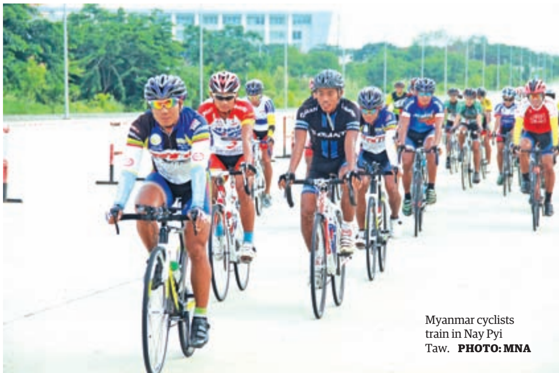
Myanmar cyclists train in Nay Pyi Taw.

Any interested person can call 09-250205652 no later than 28 June. — Myanmar News Agency ■