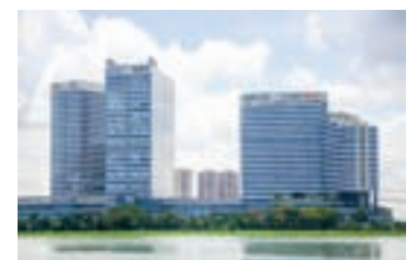
THE YANGON City of dream—Yangon