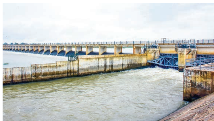
Diversion Dam in Pyinmana.

The multi-purpose project keeps water sent after producing hydro-power from the Paung Laung Embankment dam and water which will flow into it from the water flowing area of 600 sq miles between Tatkon and Pyinmana township. It has been learnt that it aims to distribute water to 35000 acres of farmlands.—Myanmar News Agency ■