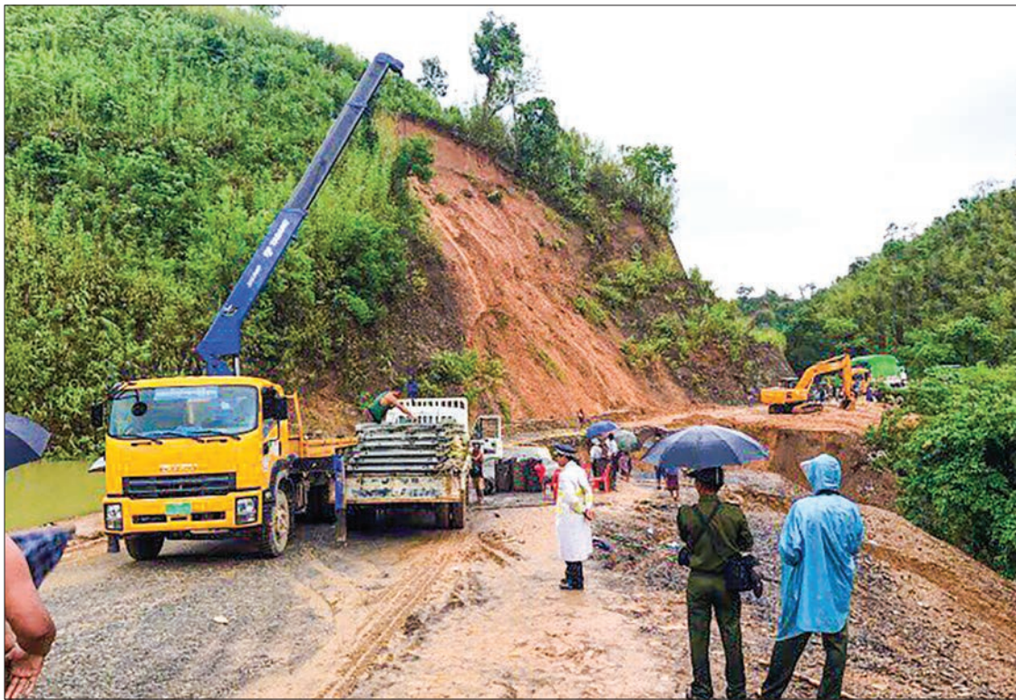
Officials inspect the site of the landslide on the Yangon-Sittway road to construct a bailey bridge.