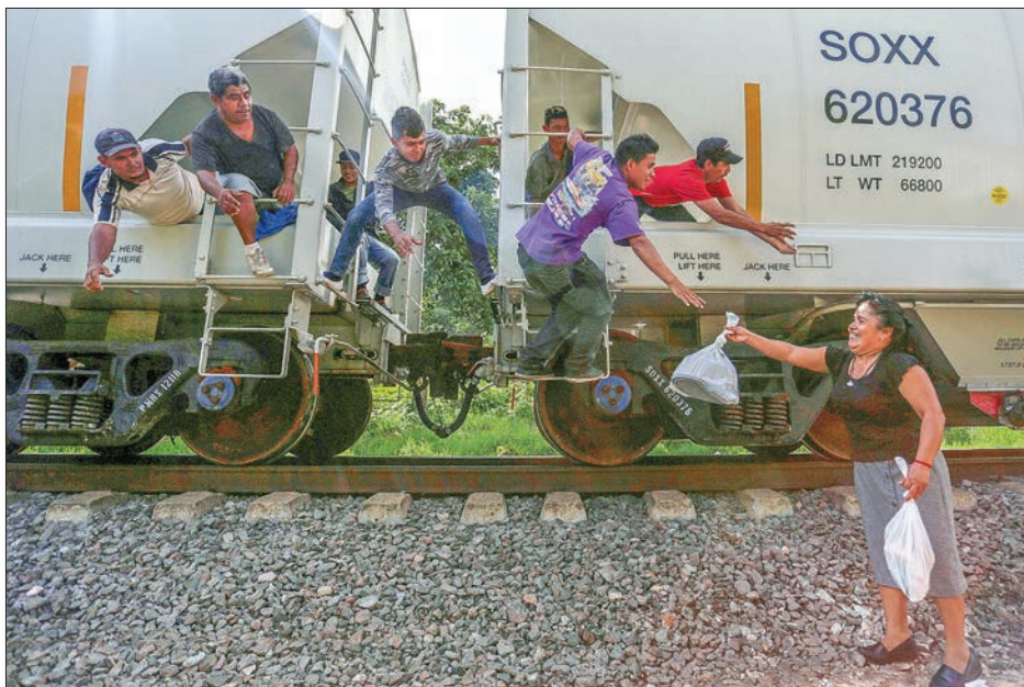
A woman from a group called "Las Patronas" (The bosses), a charitable organisation that feeds Central American immigrants who travel atop a freight train known as "La Bestia", passes food and water to immigrants on their way to the border with the United States, at Amatlan de los Reyes, in Veracruz state, Mexico, on 22 October 2016.

Trump took office vowing to slash illegal immigration to the United States. He has created tensions with Mexico's