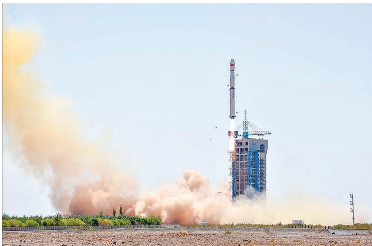
A Long March-4B rocket carrying X-ray space telescope to observe black holes, pulsars and gamma-ray bursts blasts off from Jiuquan Satellite Launch Center in northwest China's Gobi Desert, on 15 June 2017.

The result of the wisdom and efforts of several generations of Chinese scientists, Insight is expected to push forward the development of space astronomy and improve space X-ray detection technology in China.—Xinhua ■