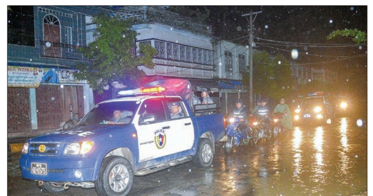
A police sentry patrols the streets of Maungtaung at night.

It has been learnt that Maungtaung police forces are carrying out educative talks in townships.