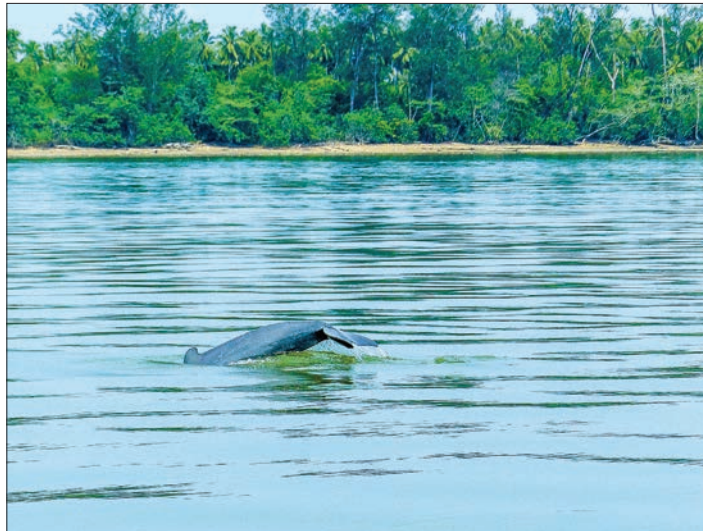
The Ayeyawady dolphin conservation area will be extended to nautical mile 225 from nautical mile 52.

The fisheries department will conduct a field survey in 10 villages with the assistance of the Wildlife Conservation Society (WCS). For the local