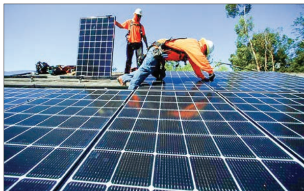
Solar installers from Baker Electric place solar panels on the roof of a residential home in Scripps Ranch, San Diego, California, US, on 14 October 2016.

A separate report released on Wednesday by Deloitte found that consumer and business prefer-