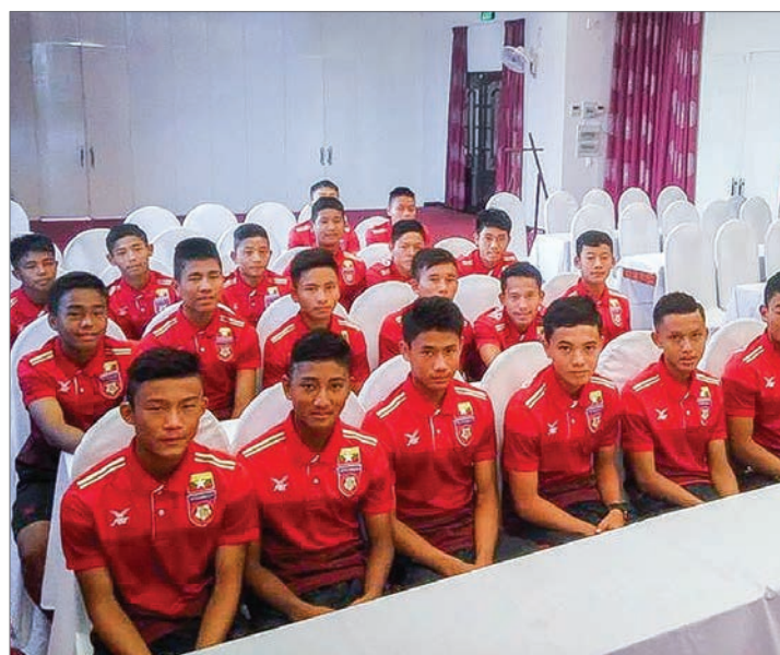
Myanmar U22 players will begin their training under coach Gerd Friedrich for their upcoming international match.

Myanmar U15 will play with host Vietnam on 18 June and Vietnamese Channel VTV is going to broadcast all the upcoming matches. —Kyaw Zin Lin ■