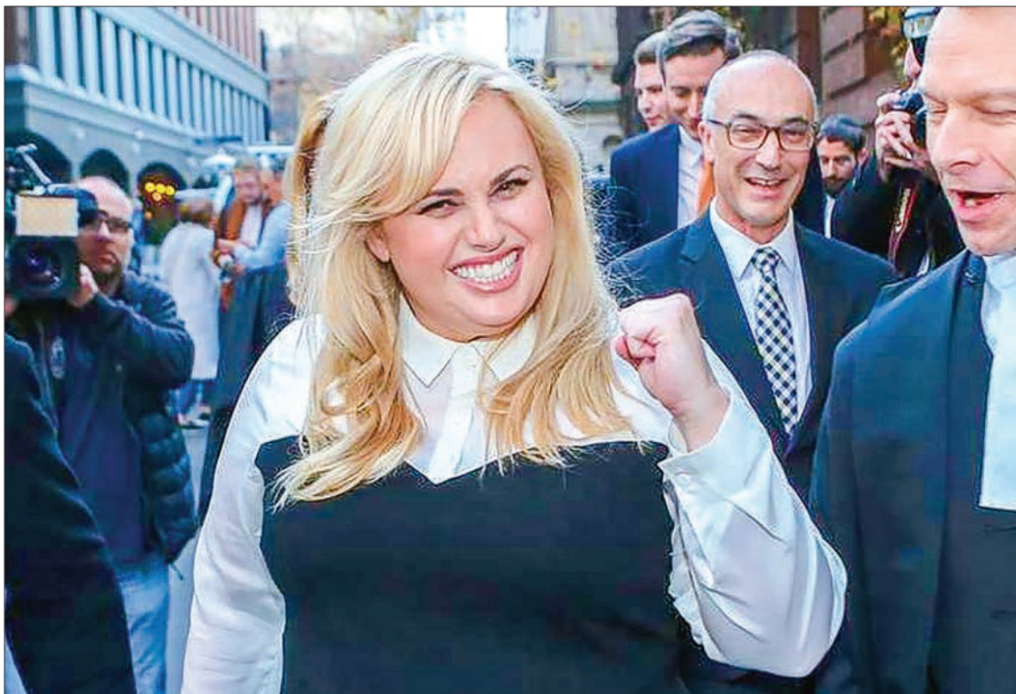
Australian comedian and actor Rebel Wilson reacts as she leaves the Victorian Supreme Court in Melbourne, Australia, on 15 June 2017.