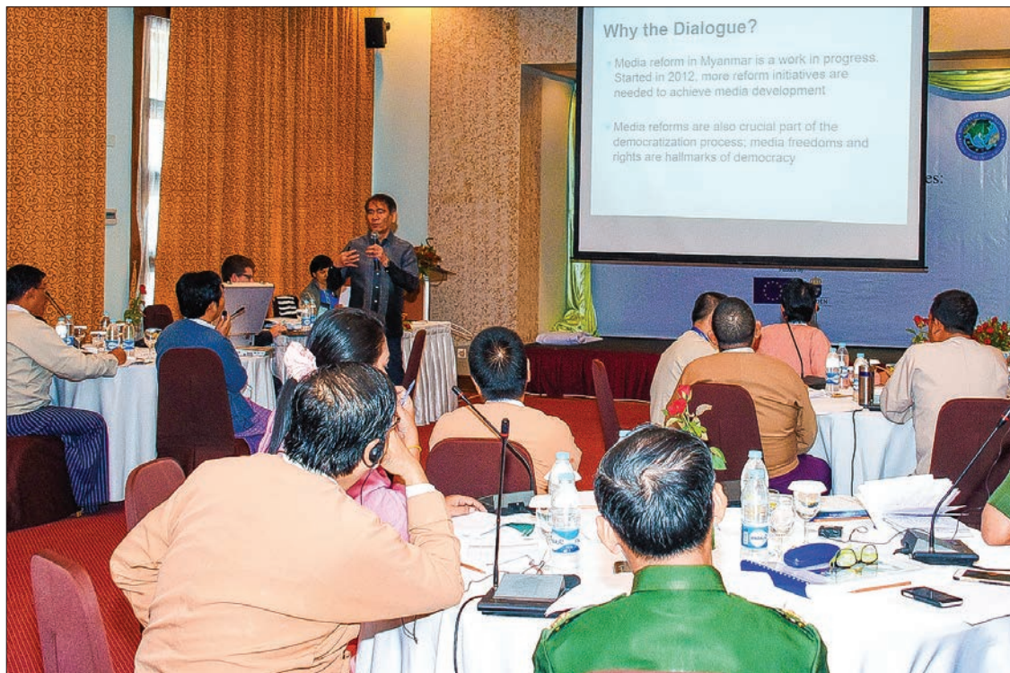
Dialogues on Freedom of Expression Issues, Focus on Public Service Broadcasting.

Participants of the conference included Hluttaw representatives, department officials, Tatmadaw officials and representatives from UNESCO.—Myanmar News Agency ■