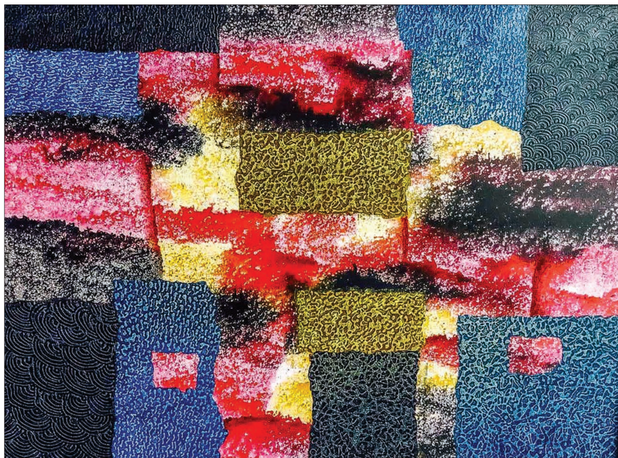
“Conflicts” by Artist Tin Win (Beikthano) is displayed at the Artists Beyond Boundaries.