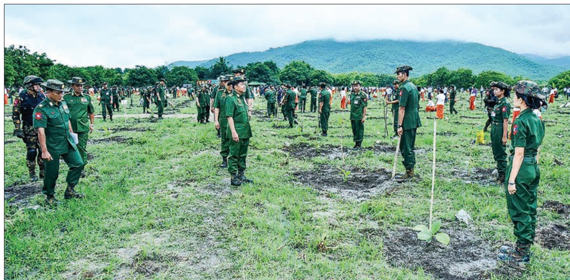
Senior General Min Aung Hlaing and wife plant trees near the Yezin dam in Zeyathiri.

COMMANDER-in-Chief of Defence Services Senior General Min Aung Hlaing and his wife planted a tree at the 1st monsoon tree-planting ceremony 2017 organised by the families of the Office of the Commander-in-Chief (Army, Navy, Air) in Nay Pyi Taw yesterday.