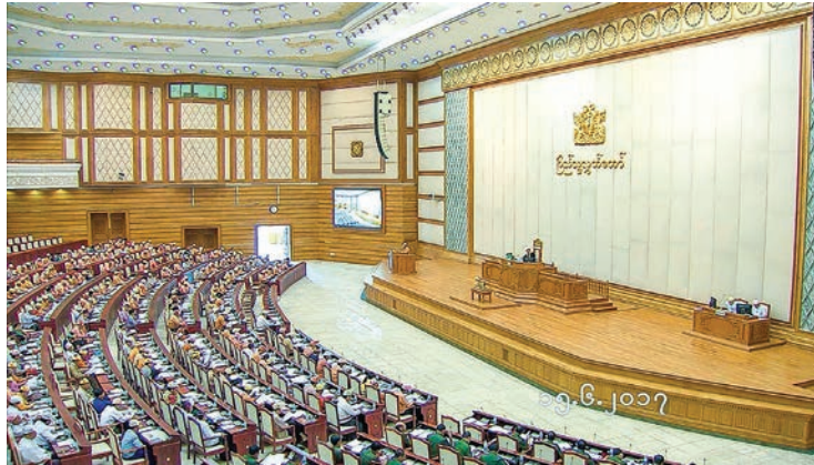
Pyithu Hluttaw is been convened in Nay Pyi Taw.

Post Primary School in Lemewakya village, Basic Education Primary School in Mamein Shidi village and Basic Education Primary School in Doattan village were not on the priority list compared with other schools when last year's budget was pre-