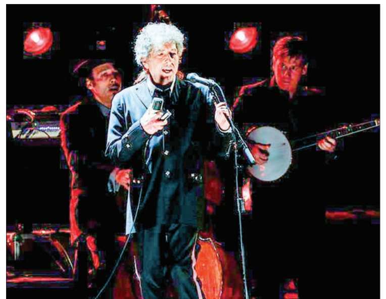
Singer Bob Dylan performs during a segment honoring Director Martin Scorsese, recipient of the Music+ Film Award, at the 17th Annual Critics' Choice Movie Awards in Los Angeles, USA, in 2012.

The media-shy Dylan, 76, delivered his lecture to the Swedish Academy last week just within the six-month time limit set by the organization in order for Nobel laureates to receive the 8 million crowns ($900,000) that goes with the prize. He chose not to attend the annual ceremony and banquet in Stockholm. —Reuters ■