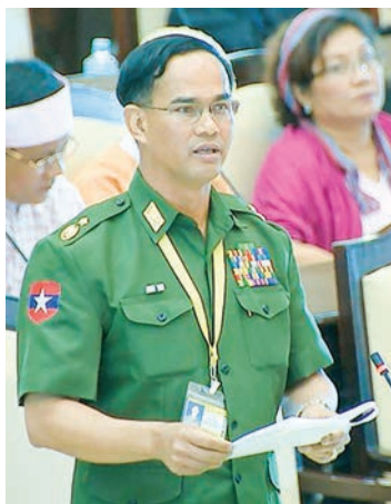
Deputy Minister for Home Affairs Maj-Gen Aung Soe.

He said domesticated animals in Tanai Township currently numbers 145 elephants, 1,928 buffalo and 1,909 cows, and as per the tradition in Tanai Township, these animals were allowed to roam freely and found to have sufficient area of grazing ground. The proposed grazing ground north of Ledo Road, the upper