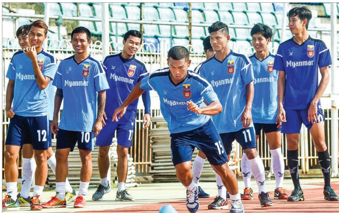
Myanmar U15 players practise for the upcoming match against China Taipei.

In preparation of the SEA Game, Myanmar has been challenged by Inter Milan Youth FC for the play of friendly match in next month. — Shine Htet Zaw ■