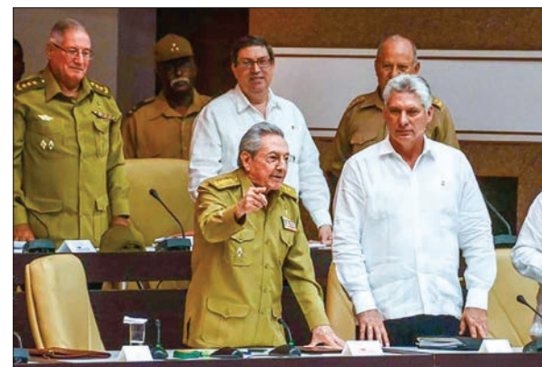
Cuba's President Raul Castro (L, front) gestures while standing next to First Vice-President Miguel Diaz-Canel (R) during an extraordinary session of the National Assembly, in Havana, Cuba, on 1 June 2017.

Castro, who took over the presidency in 2008 from his ailing and now deceased brother Fidel Castro, has vowed to step down as president next February at the end of his second five-year term. He will, however, remain head of the Communist Party, in which political power is vested in Cuba. All other parties are banned.—Reuters ■