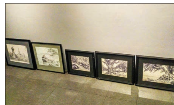
Sketches of the artists are exhibited at the 43rd Art Gallery.

Thirty-eight artists will exhibit their sketches for art lovers and art collectors at the 43rd Art Gallery, Botahtaung Township, Yangon from 18 to 25 June. At the art exhibit, sketch art will be sold for between Ks30,000 and Ks50,000.—Phoe Thant ■