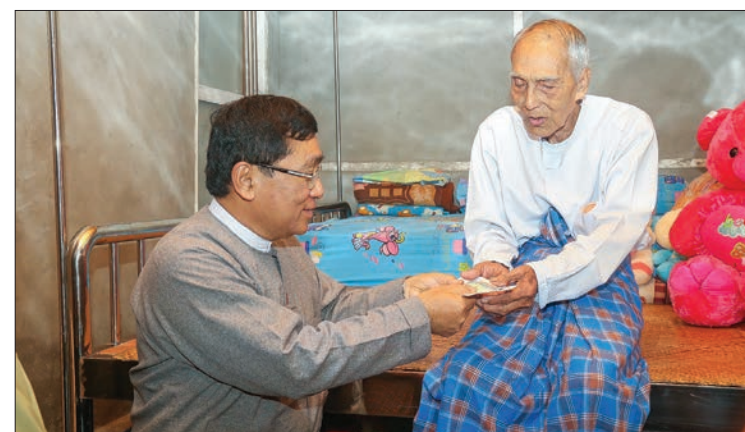
Union Minister Dr Win Myat Aye gives social pension to the elder.

Teams consisting of village tract/ward chairman, village tract/ward elder and a basic education school teacher will present 3 months social pension within the last week of June to all elders 90 years and above in states and regions directly to their homes. In following months, arrangements are underway to present social pension