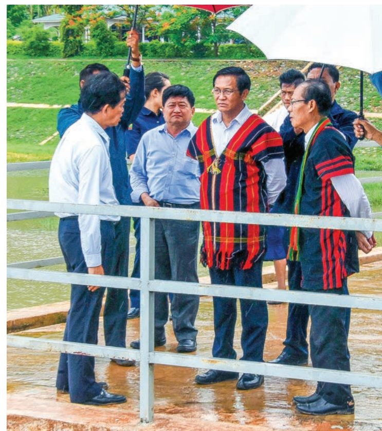
Vice President U Henry Van Thio is seen in his tour of inspection of the diversion dam.

Then, the Vice President asked questions regarding the reclaimed farmlands and the process to be carried out in the future, giving necessary instructions in consultation with