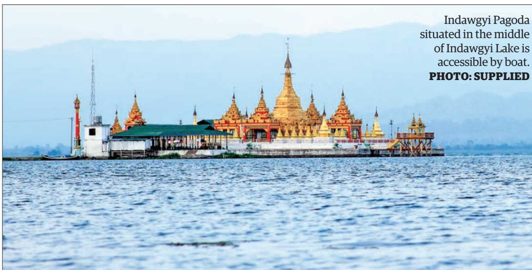
Indawgyi Pagoda situated in the middle of Indawgyi Lake is accessible by boat.

INDAWGYI LAKE in Kachin State was designated as a Man and Biosphere Reserve (MAB) of the UNESCO's MAB network at the 29th session of MAB International Coordination Committee (MAB-ICC), held on 12-15 June 2017, at UNESCO Headquarter in Paris, France.