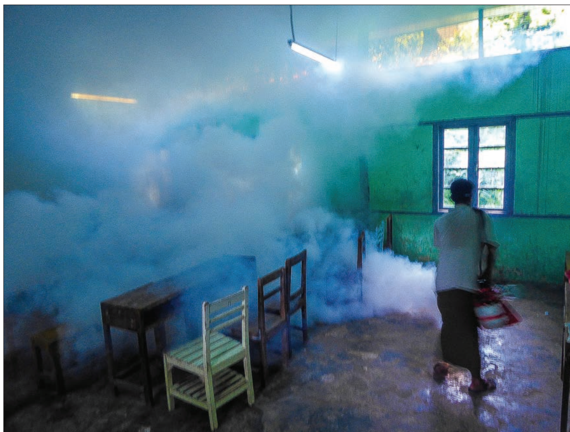
A health worker fumigates a classroom to kill mosquitoes that spread dengue fever.

But this year, there is evidence that further work is needed. ■