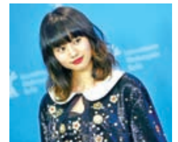
Japanese actress Shioli Kutsuna.

The film has been directed by David Leitch and will hit the US theatres on 1 June next year.—PTI ■