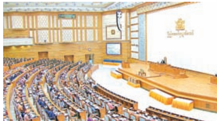
The 7th day meeting of the 2nd Pyidaungsu Hluttaw held yesterday.

After that, Hluttaw announced to enroll the names of the representatives to second it. 8th day meeting of 2nd Pyidaungsu Hluttaw 5th regular session is targeted to be held on 20th June, it was learnt. ■