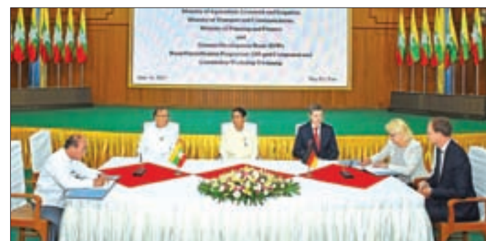
The signing ceremony for Financing, Loan and Separate Agreements with German government-owned development bank KfW was held yesterday in Nay Pyi Taw.

In 2014, the Government of Myanmar developed a comprehensive and ambitious National Electrification Plan (NEP)