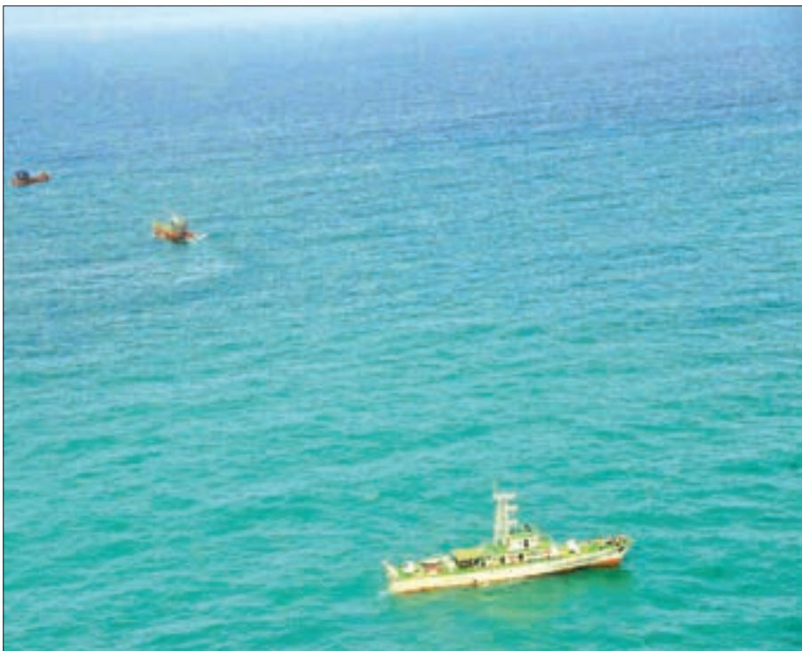
Navy ships search the coast of the Andaman sea looking for the missing passengers of the Y-8 plane that crashed on 7 June.

THE body of a man near Mayingyi Village in the Taninthayi Region was found yesterday, bringing the total number of bodies from the 7 June crash of a military transport plane to 87. As the search for passengers enters its second week, military forces on land, sea and air and local volunteers in fishing boats continued their efforts that they hope will result in the discovery of possible survivors. The most recent body recovered was found during a search along the Maungmagan-Mayingyi coast in the Taninthayi Region yesterday morning. The body of the man was brought to Dawei Military Hospital for identification. Remaining family members