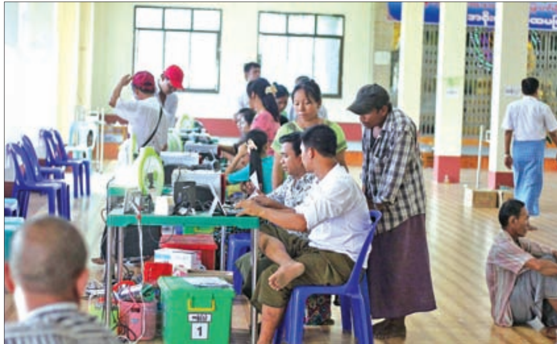
Officials are conducting for temporary identity cards to the squatters in Hlinethaya Township, Yangon Region.

The pilot project of collecting the squatter list was conducted by Yangon Region government in September last year. The task is carried out in the respec-