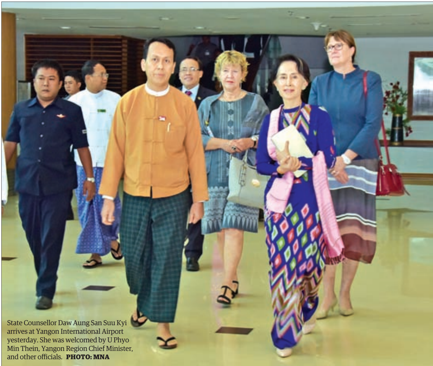
State Counsellor Daw Aung San Suu Kyi arrives at Yangon International Airport yesterday. She was welcomed by U Phyo Min Thein, Yangon Region Chief Minister, and other officials.