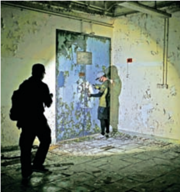
HK URBEX members, inspect the interior of an abandoned British army barracks in Hong Kong, China on 1 June, 2017.

HONG KONG — Atop Hong Kong’s tallest peak blanketed in clouds, three masked urban explorers step back in time as they slip through a wire mesh fence and march towards an abandoned army barracks from the British colonial era. Twenty years after Britain returned Hong Kong to Chinese rule, these young, alternative conservationists are eager to document the city’s remaining historical buildings. Some structures have been demolished over the decades to make room for development in one of the world’s most expensive