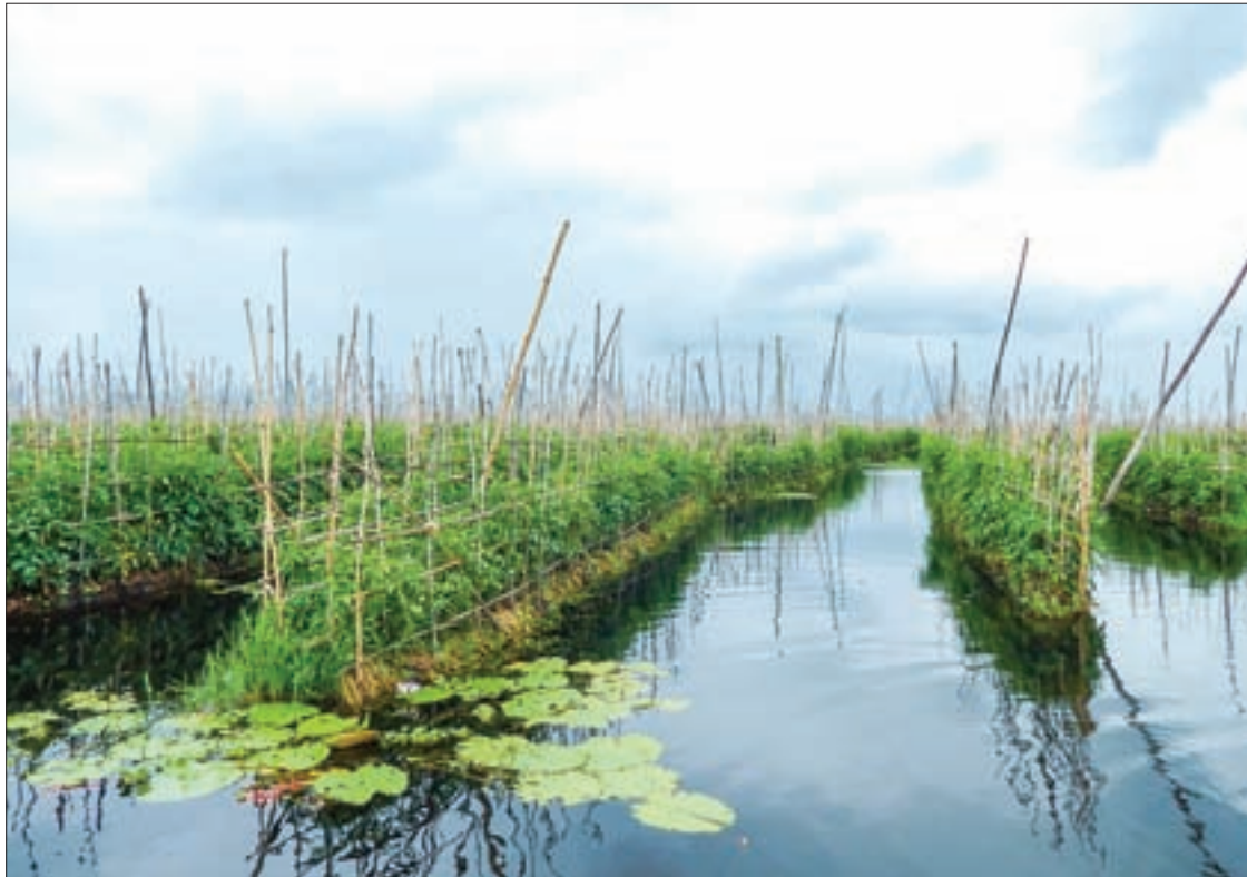
A floating tomato farm in Inle Lake, Shan State.

Previously, local cultivators from the Inle Lake region used chemical fertilizers and pesticides for their farming. Now, the floating tomato cultivators are using the GAP system, which can reduce the cost of growing tomatoes. The Inle cultivators usually plant tomatoes annually during the monsoon and winter