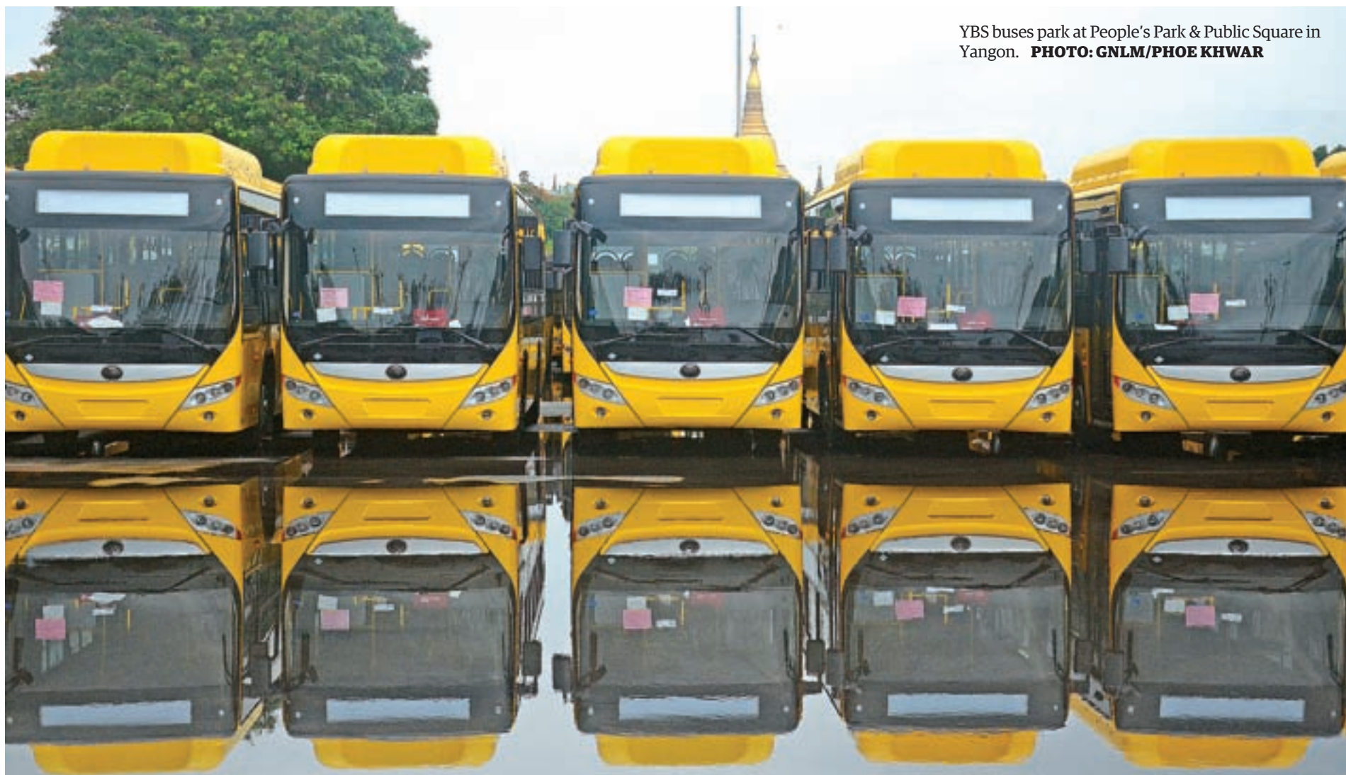
YBS buses park at People's Park & Public Square in Yangon.