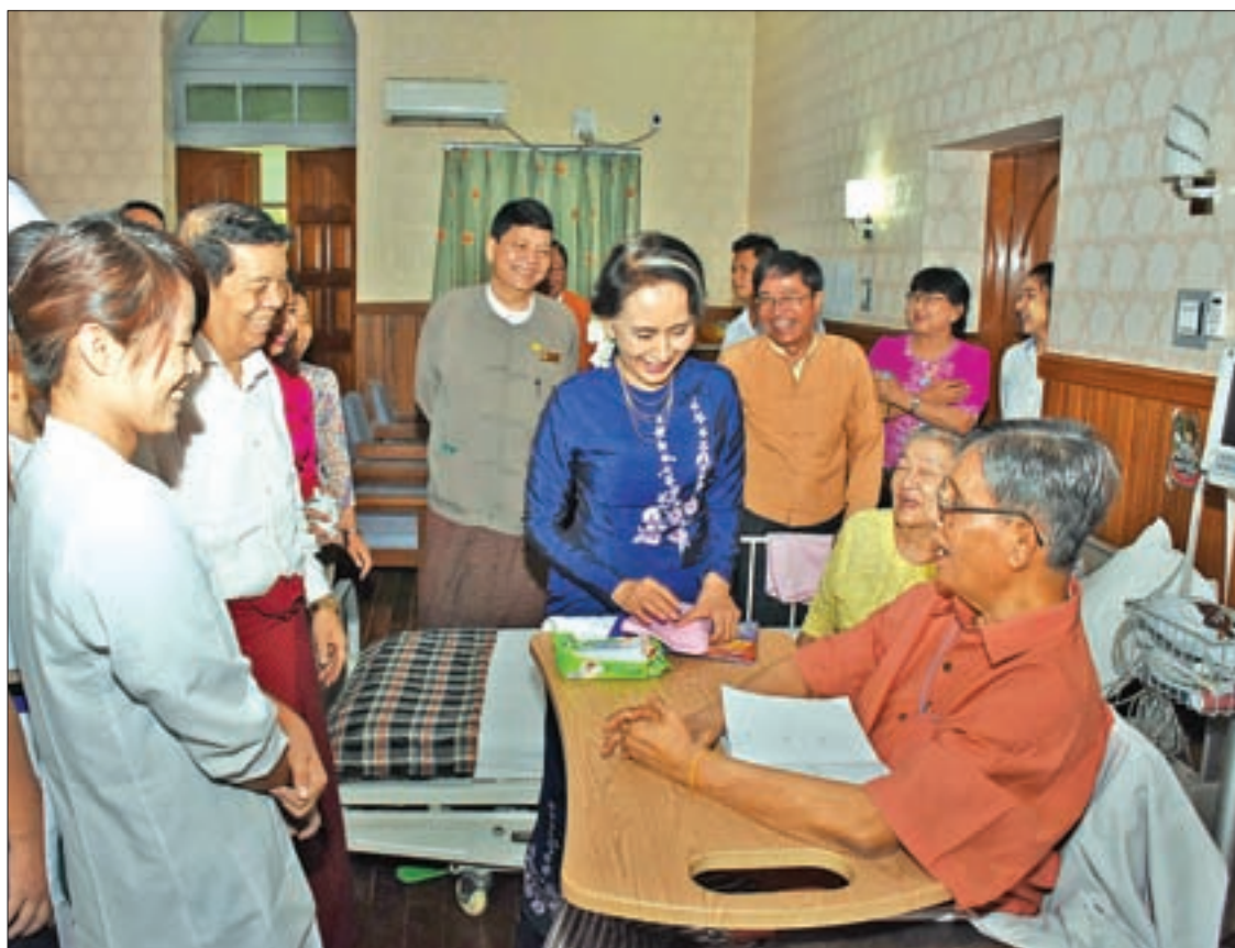
State Counsellor Daw Aung San Suu Kyi visits NLD patron U Tin Oo at the neurological care unit of the Yangon General Hospital yesterday.