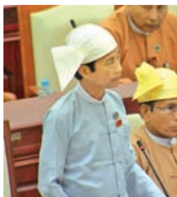
U Khin Maung Cho, Union Minister for Industry and Deputy Minister.

The loans will be disbursed to those who will initiate SMEs if they are in strong condition for the enterprises, in regions and states. And, with a view for SMEs in Myanmar to producing export-quality products, technical support is being given out through international organisations, with educating and sharing knowledge on food production and training on strategic development for upgrading innovative ideas being conducted in regions and states. As for the international loans, 5 billion yen (Ks50 billion) from JICA has been received to lend to SMEs. Out of these, Ks41.558 billion has been being disbursed to 185 initiators in 10 regions and