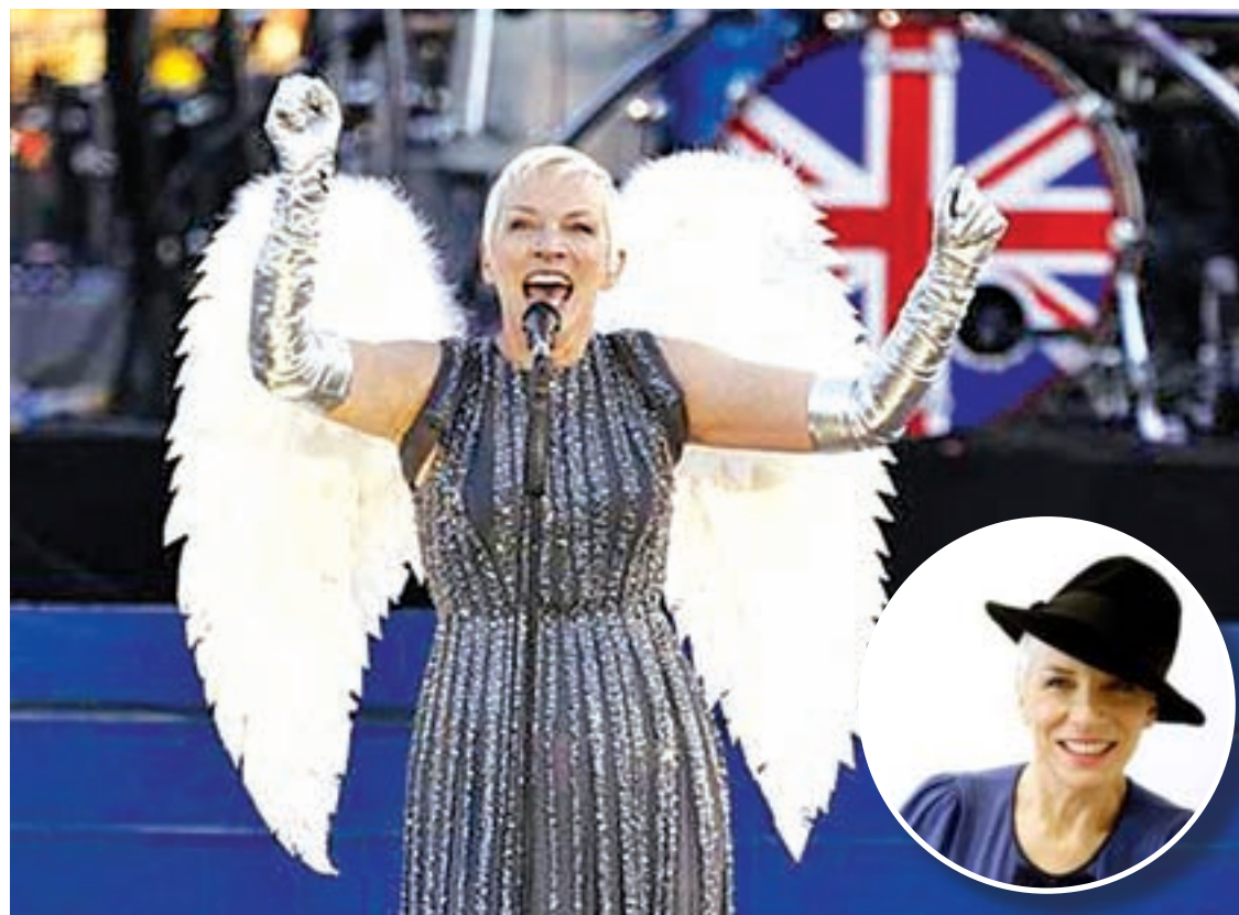
Singer Annie Lennox performs during the Diamond Jubilee concert in front of Buckingham Palace in London on 4 June, 2012.

LONDON — The challenges women face in the developing world, such as poor education and healthcare, child marriage and female genital mutilation may seem insurmountable, but change can come through solidarity from women in rich nations, said singer Annie Lennox.