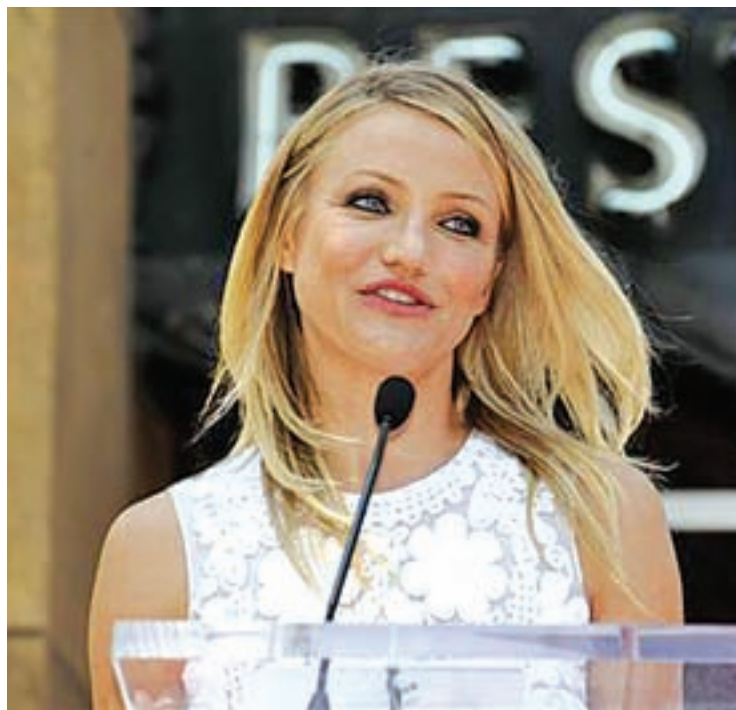
Cast member Cameron Diaz.