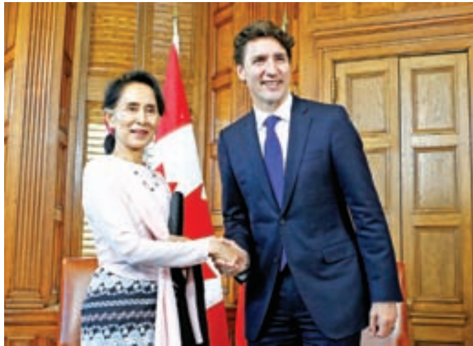
State Counsellor Daw Aung San Suu Kyi meets with Canada's Prime Minister Justin Trudeau in Trudeau's office on Parliament Hill in Ottawa, Ontario, Canada, on 7 June 2017.