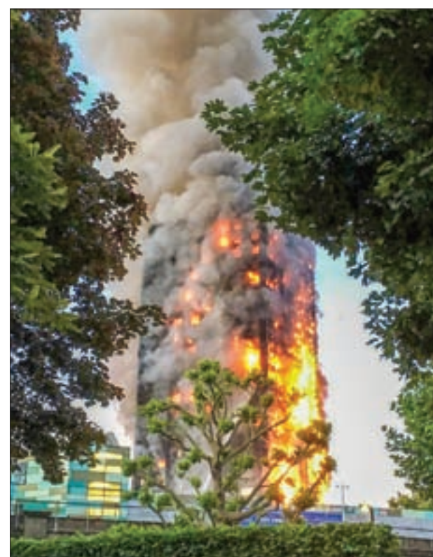
Flames and smoke billow from a tower block at Latimer Road in West London, Britain on 14 June, 2017 in this picture obtained from social media.

“In my 29 years of being a fire fighter, I have never ever seen anything of this scale,” London Fire Brigade Commissioner Dany Cotton told reporters.—Reuters ■