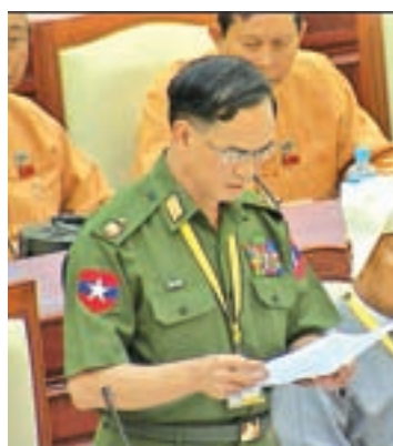
Deputy Minister for Home Affairs Maj Gen Aung Soe.

Major General Aung Soe, Deputy Minister for Home Affairs, replied to the question raised by U Aung Sein of Dawei constituency on the designation of land in Dawei Township.