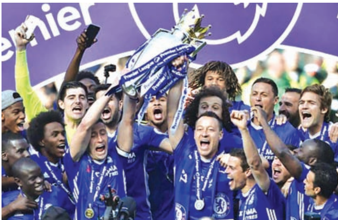
Chelsea's John Terry, Gary Cahill and team mates celebrate with the trophy after winning the Premier League at Stamford Bridge in London on 21 May, 2017.

The other Premier League newcomers Huddersfield Town will play their first top-flight game in 45 years at Crystal Palace as Arsenal open at home to