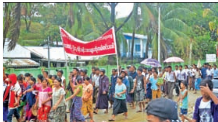
Protestors take to the streets to protest against the deadly attack on the Chakma ethnic tribe in Chittagaung hilly areas.