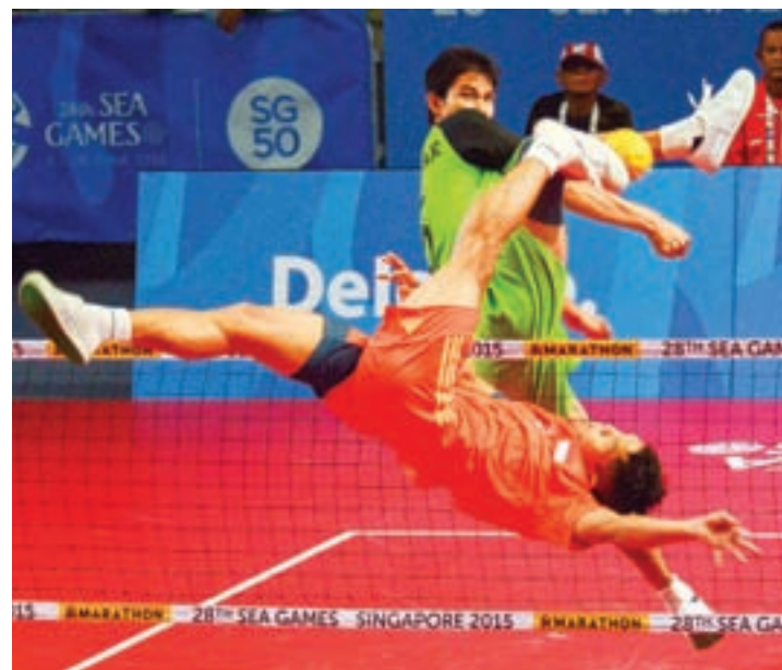
One of Myanmar player competes in 28th SEA GAME in Singapore.

The 30 sports currently scheduled for inclusion are archery, badminton, aquatic sports, basketball, boxing, cycling, equestrian, football/futsal, golf, gymnastics, hockey, karate, lawn bowls, netball, pencak silat, petanque, sailing, sepak takraw (including chinlone), shooting, snooker and billiards, squash, table tennis, taekwondo, tennis, bowling, volleyball (indoor), weightlifting, athletics, and wushu