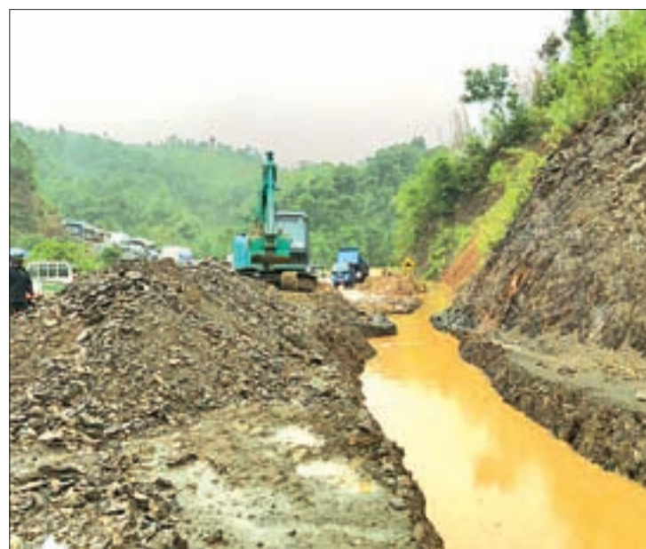
Backhoes are used to fill in parts of the Sittway-Yangon highway that have eroded due to flooding from heavy rains.

Heavy rains in Rakhine on 12 June caused floods on the Sittway-Yangon Highway and resulted in flooding of roads in 12 areas between An and Kazookine village, said the Minister for Transportation. —Min Thit (MNA) ■