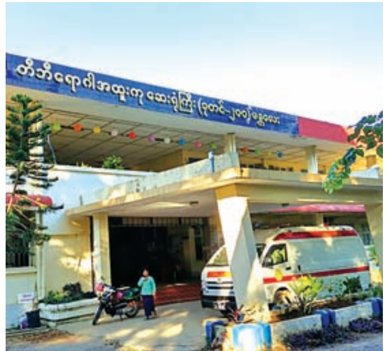
The 200-bed TB Special Hospital in Patheingyi Township, Mandalay Region.

There are approximately 150,000 TB patients detected annually in Myanmar, which is one of the world's 30 TB high-burden countries.—GNLM ■