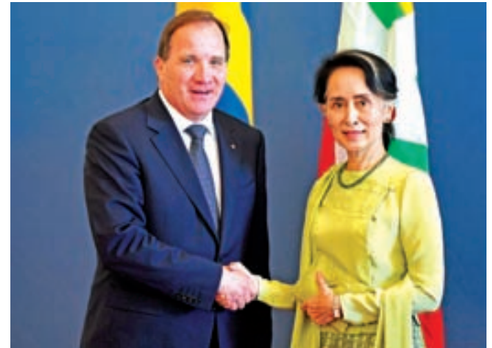
State Counsellor Daw Aung San Suu Kyi (right) shakes hands with Sweden's Prime Minister Stefan Lofven (left) at the Government Rosenbad in Stockholm, Sweden on 12 June 2017.

9. The Myanmar delegation led by the State Counsellor left Toronto by air on 10th June and arrived in Stockholm, Sweden on 11th June 2017. In Sweden,