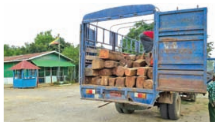
Illegal timber seen on a truck on Mandalay-Muse highway.

The joint investigation force apprehended a six-wheeled truck on 9 June and three small vehicles on 10 June, all illegally transporting timber from Mandalay to Muse. Confiscated from the vehicles were 57 logs of tamalan weighing 4.6792 tons and 14 logs of various padauk wood or rose wood weighing 0.6558 tons. The Customs Department announced that the estimated value of the confiscated timber is around Ks