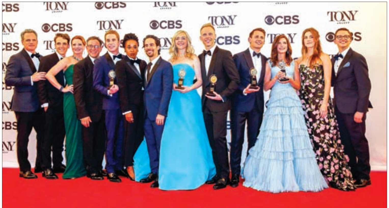
The cast of “Dear Evan Hansen” poses with their various awards at 71st Tony Awards in New York City, US on 11 June, 2017.

The show went on for nine seasons from 19 September, 2005 to 31 March, 2014.—PTI ■