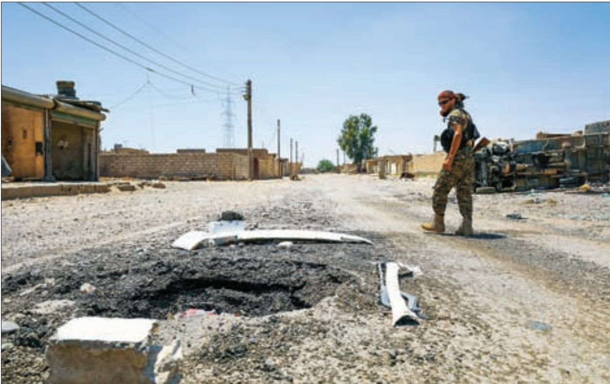
A Syrian Democratic Forces (SDF) fighter walks past a crater in Raqqa's western neighbourhood of Jazra, Syria on 11 June, 2017.

AMMAN — Turkish-backed rebels fought each other on Sunday in the Syrian town of al Bab in the first bout of rebel fighting since they seized the town this year from Islamic State militants, rebels and witnesses said. It was not clear what triggered the armed clashes between rival rebel groups who hold sway in the city since it was seized last February from Islamic State militants. Turkey sent warplanes, tanks and artillery into Syria last year in support of the Arab Sunni rebels, an operation dubbed “Euphrates Shield” which was aimed at driving both Islamic State and Kurdish militia forces away from its border. Checkpoints were spread by the Turkish-controlled military council that runs the city where thousands of people have been returning in recent months with the gradual resumption of basic services, a resident who was contacted in the city said.