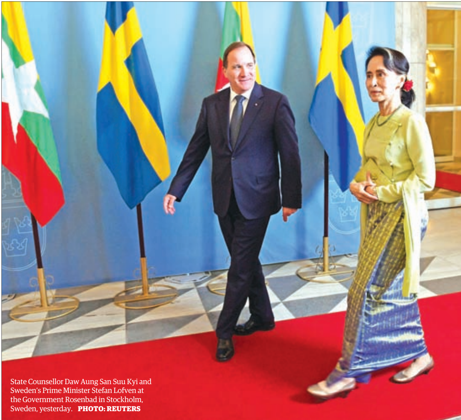
State Counsellor Daw Aung San Suu Kyi and Sweden's Prime Minister Stefan Lofven at the Government Rosenbad in Stockholm, Sweden, yesterday.