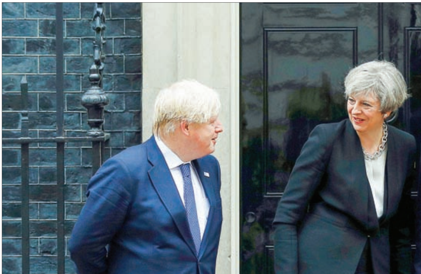
Britain's Prime Minister Theresa May alongside Foreign Secretary Boris Johnson, greets Ethiopia's Prime Minister Hailemariam Desalegn (not pictured) in Downing street ahead of the Somalia Conference, in London, Britain on 11 May, 2017.