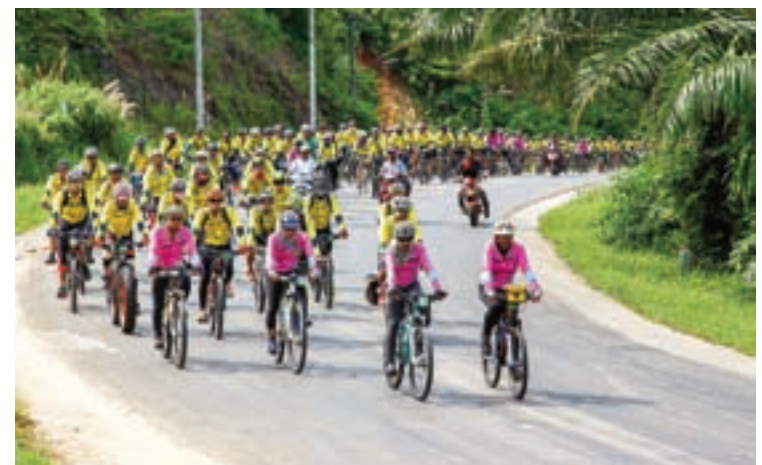
Participants cycling at the opening ceremony of the 4th Myanmar-Thai cycling tour in Kawthoung.