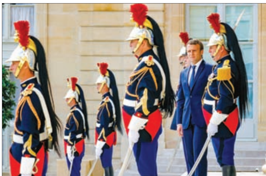
French President Emmanuel Macron waits for guests to leave at the Elysee Palace in Paris, France on 12 June, 2017.

France is Germany's second-biggest trading partner and the strong support for pro-European centrist reformer Macron has sparked hopes that Berlin and Paris will spearhead a broad-based economic revival in Europe and a push for more integration in the euro zone. Projections after the first election round on Sunday showed that Macron's fledgling party is set to trounce France's traditional main parties and secure a huge majority to push through pro-business reforms. "Chancellor Merkel: My heartfelt con-