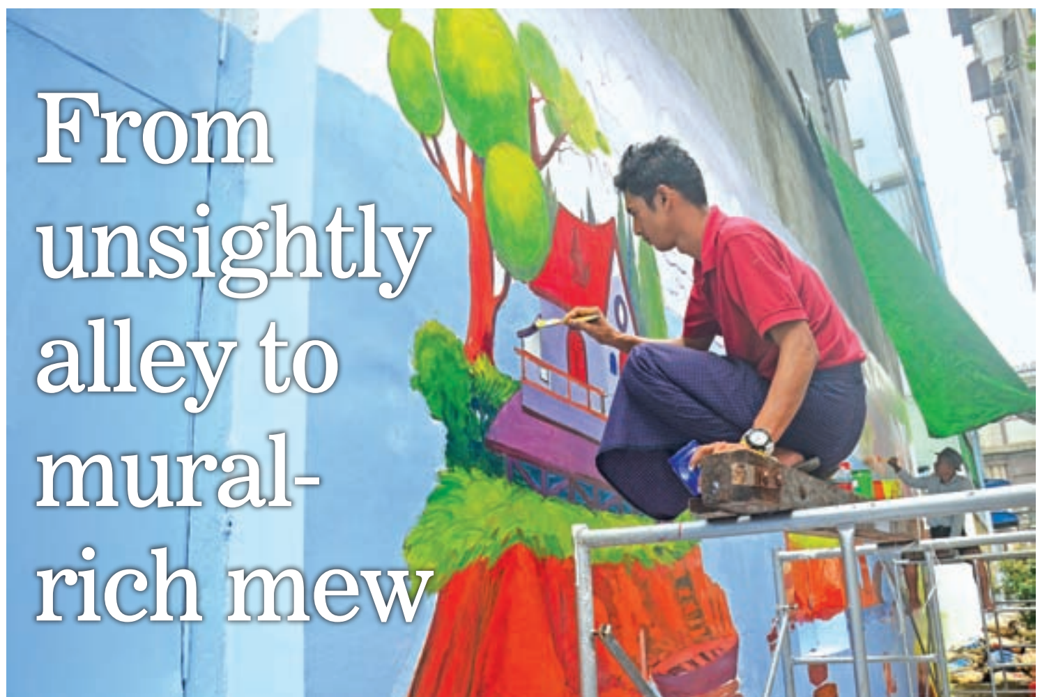
An artist paints a mural in the alley between 31st and 32nd streets in Pabedan Township, Yangon.

Due to limitation of space we are only able to publish "Letter to the Editor" that do not exceed 500 words. Should you submit a text longer than 500 words please be aware that your letter will be edited.