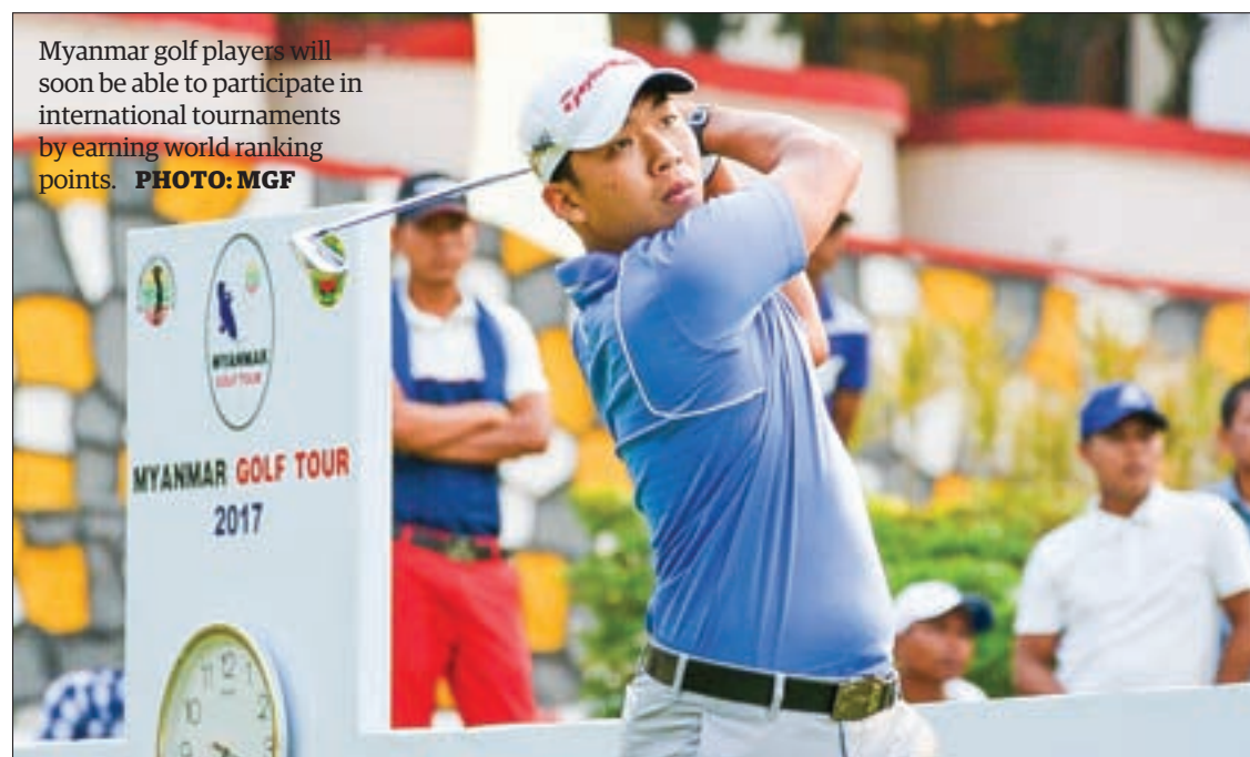
Myanmar golf players will soon be able to participate in international tournaments by earning world ranking points.

Wilander said Nadal's resurgence since pulling out of the French Open last year with a wrist injury — he also reached the Australian Open final and is back at number two in the rankings — is down to former world number one Carlos Moya joining his team. "I never agreed with people who said Rafa should stop working with Toni (Nadal), but having his friend Carlos there and Francisco Roig means that they talk to Toni and give some new ideas and then Rafa trusts the plan. "There has been a clear change since Carlos came in." —Reuters ■