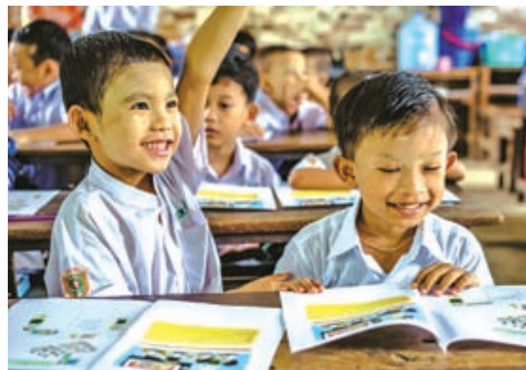
Children learn lessons at a school.

fered at the Union level, the state and region level, the township level and school and family level training. The in-service trainings reached teachers from all categories of grade one schools including monastic and private