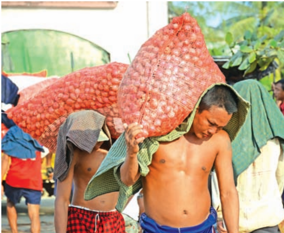
Labours carry the bags of onion at Bayinnaung Market in Yangon.