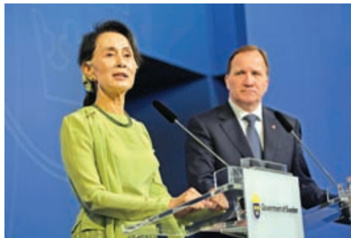
State Counsellor Daw Aung San Suu Kyi (L) and Sweden's Prime Minister Stefan Lofven (R) hold a news conference, at the government building Rosenbad in Stockholm, Sweden, on 12 June 2017.

A number of the UN human rights commission member countries, including China and India, have also dissociated themselves from the resolution or voiced their opposition to the establishment of such a mission.—GNLM and Reuters ■