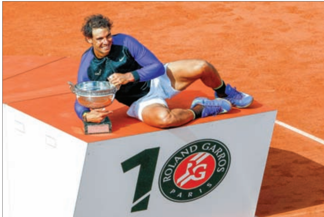
Spain's Rafael Nadal celebrates with the trophy after winning the final against Switzerland's Stan Wawrinka at Roland Garros, Paris, France on 11 June, 2017.

"He has taken confidence away from Wawrinka, from (Andy) Murray, even though he didn't play him. And Roger Federer is a very happy man that he didn't come to the French be-