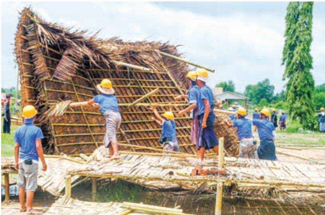
Workers demolishing one of many huts built by squatters on a State owned project site near the Yangon-Mandalay Highway.

Four men and one woman were detained yesterday in the operation for disturbing an express bus and attacking a police.—Than Htike (Hlinethaya)