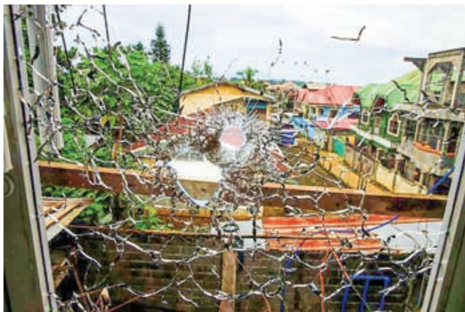
An abandoned hospital window is seen full of bullet holes, as government soldiers continue their assault against the Maute group in Marawi City, Philippines on 12 June, 2017.

As of Saturday the number of security forces killed in the battle for Marawi stood at 58. The