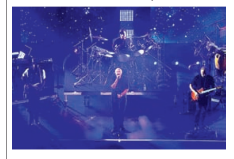
Entertainer Phil Collins performs during the opening ceremony of the 2016 US Open tennis tournament, on 29 August 2016; New York, USA.

Collins became the drummer for the rock band Genesis in the 1970s before starting a solo career that peaked in the 1980s with hits such as "In the Air Tonight". —Reuters