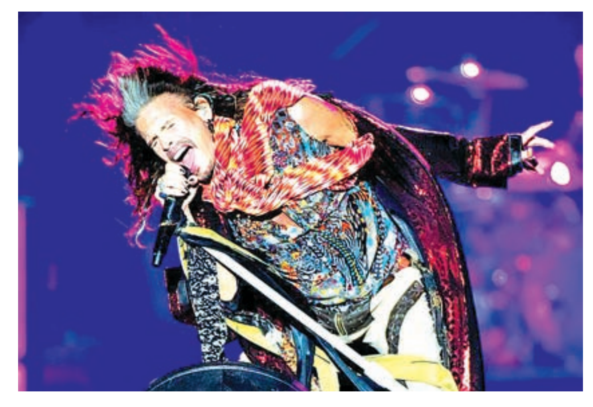
Aerosmith's Steven Tyler performs at the Royal Arena in Copenhagen, Denmark, on 5 June 2017.