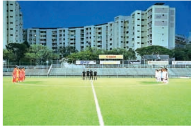
Myanmar and Niigata Football players stay silent before the game started.