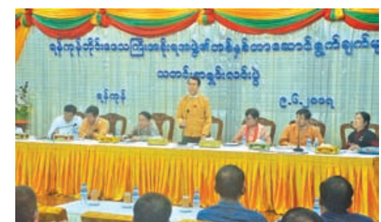
Yangon Region Chief Minister U Phyo Min Thein delivers a speech at the press conference of Yangon Region Government on one-year performance in Yangon yesterday.

In the agricultural sector, the one-year performance featured maintenance of drains, dikes and sluice gates, said U Han Tun, the minister for ag-