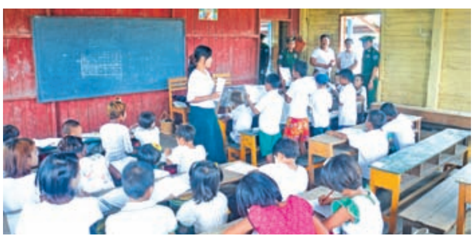
Students learn their lessons at a basic education school in Rakhine State.

With a fertile land for the agriculture,