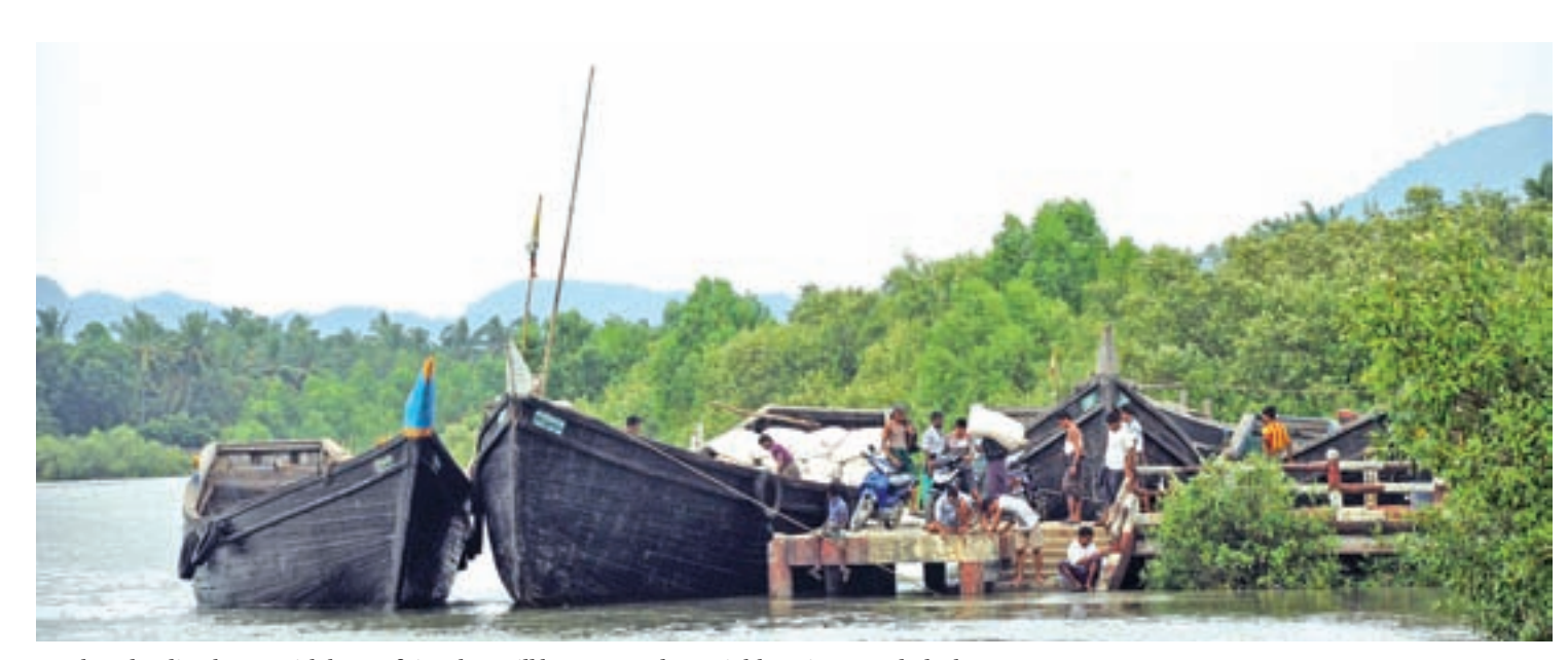
Workers loading boats with bags of rice that will be exported to neighbouring Bangladesh.