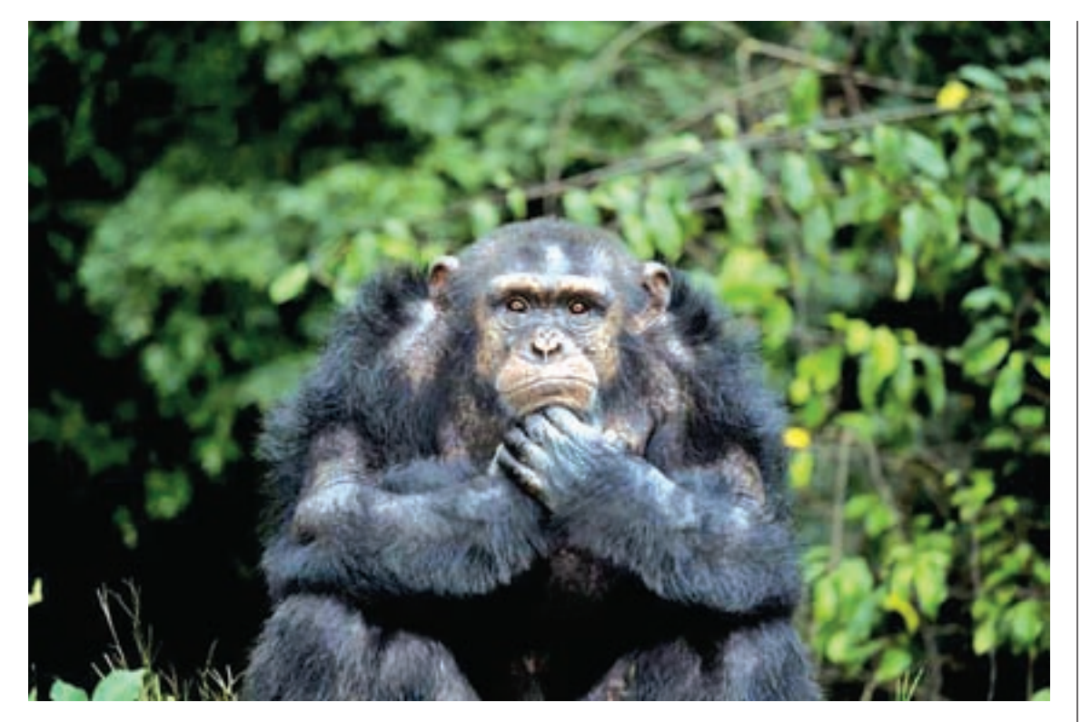
A chimpanzee named Samantha waits for her daily feeding at the Liberia Chimpanzee Rescue Project headquarters in Charlesville, Liberia, on 19 November 2015.