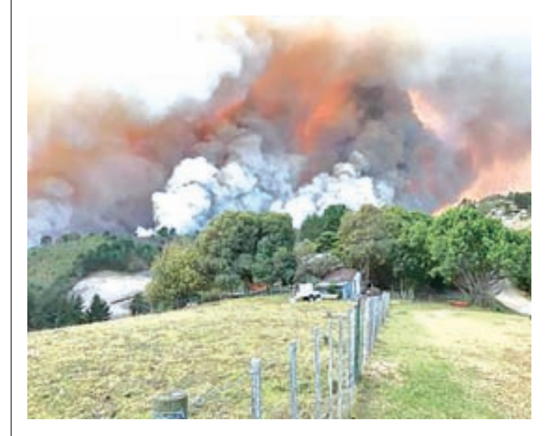
Fires burn at Buffelsvermaak farm near Knysna, South Africa, on 7 June 2017. Strong winds fanned fires which destroyed houses and prompted the evacuation of thousands of residents.

Thousands of people in shantytowns, who have had to cope with the region's worst drought in a century, have been hardest hit, as floods and heavy rain washed away homes built of planks and zinc sheets. —Reuters