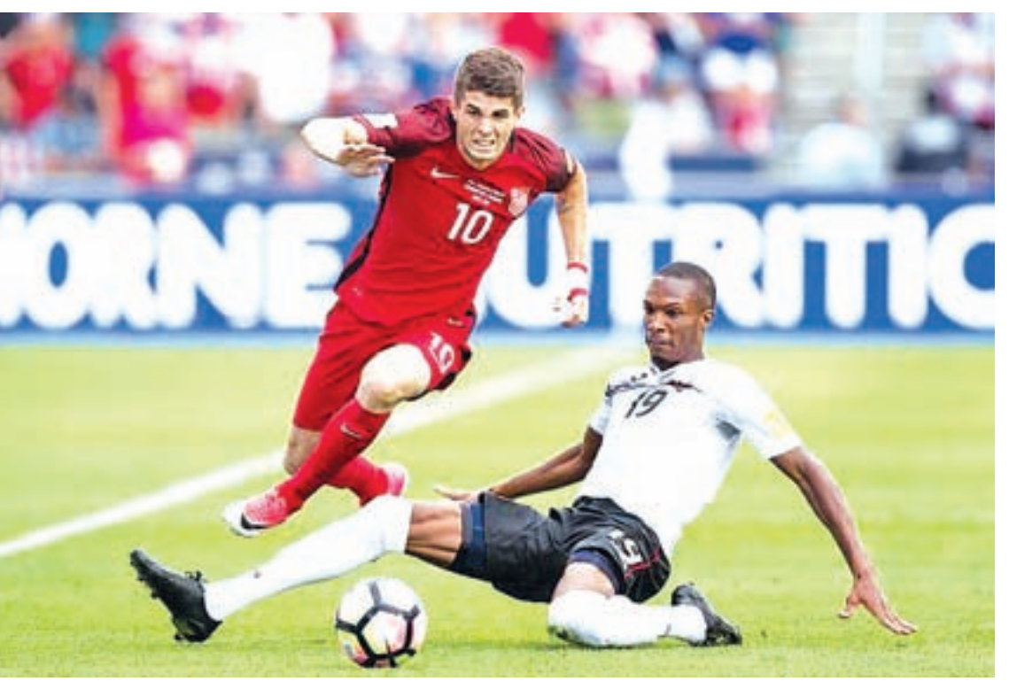
Trinidad & Tobago midfielder Kevan George (19) defends against United States midfielder Christian Pulisic (10) in the first half at Dick's Sporting Goods Park in Commerce City, CO, USA, on 8 June 2017.