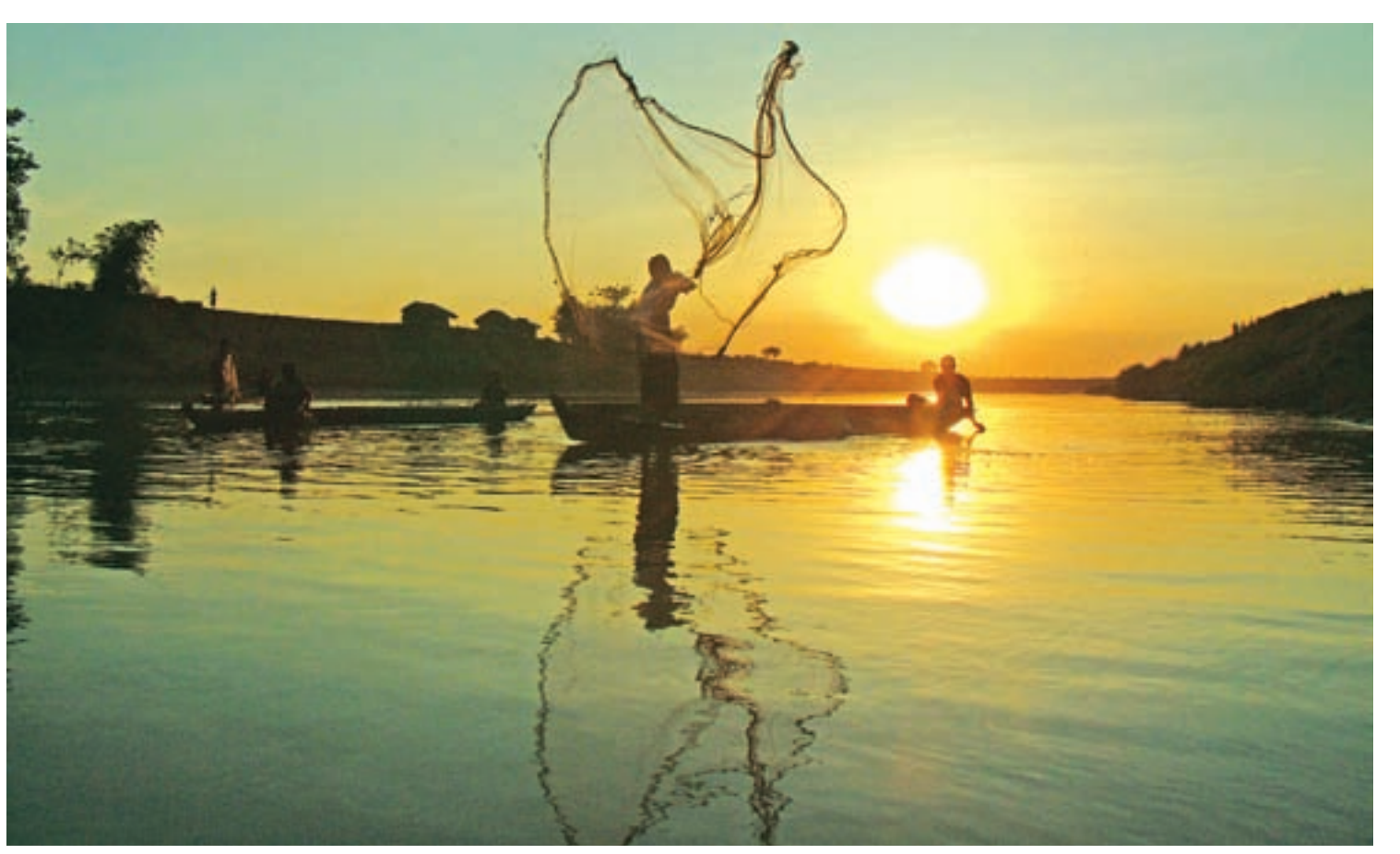
Fisherman throwing fishing net in the Bago River in Bago, 50 miles north-east of Yangon.

Due to limitation of space we are only able to publish "Letter to the Editor" that do not exceed 500 words. Should you submit a text longer than 500 words please be aware that your letter will be edited.