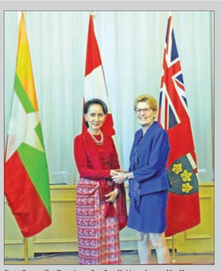
State Counsellor Daw Aung San Suu Kyi is welcomed by Hon Kathleen Wynne, Premier of Ontario on 8 June, 2017. (NEWS ON PAGE 3)