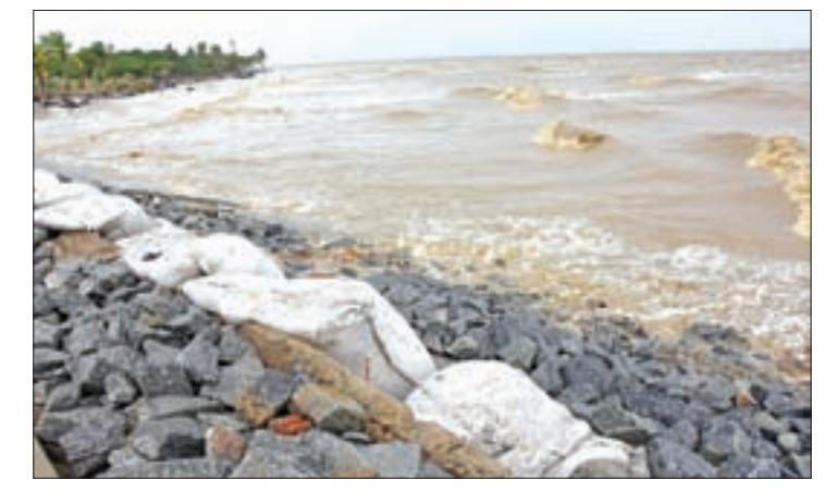
Embankment is seen in Paung Township to prevent sea water.

Alote village is situated in Paung township, and it is a wave-and-tide-prone area. The ebb and flow are happening twice a day, especially severely on Full Moon Days and New