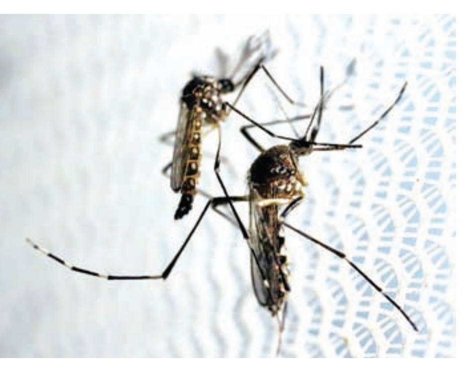
Aedes aegypti mosquitoes are seen inside Oxitec laboratory in Campinas, Brazil in 2016.

"Women in the US territories and elsewhere who have continued exposure to mosquitoes carrying Zika are at risk of infection.