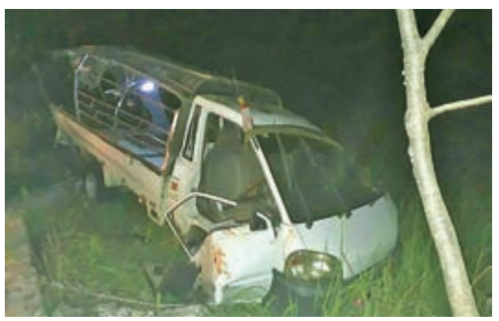
The light truck crashed by an express bus on Ygn-Mdy Highway.

The express bus named Shwe Mann Thu enroute from Yangon to Mandalay was driven by Thann Naing