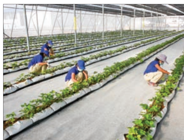
Workers at Prime Farm in Heho Township, southern Shan State, tend to crops grown using state-of-the-art agricultural techniques.

duced. Presently, seven kinds of European strawberries have been planted in two greenhouses measuring 2,400 meters square and one green house 1,500 meters square.—Myanmar News Agency