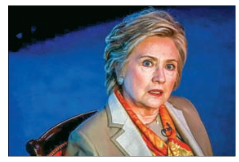
Former US Secretary of State Hillary Clinton takes part in the Women for Women International Luncheon in New York City, New York, US, on 2 May 2017.

RANCHO PALOS VERDES, (CALIF) — Hillary Clinton said on Wednesday she suspects President Donald Trump's campaign gave guidance to Russian government propaganda efforts