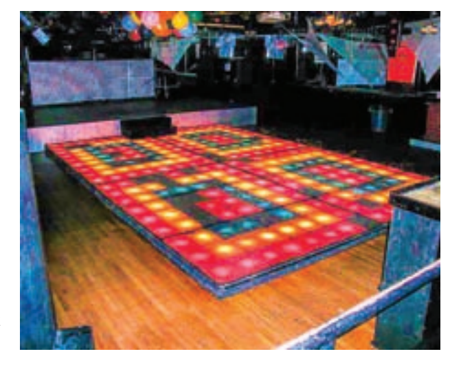
The original disco floor from the 1977 movie 'Saturdav Night Fever' is shown in this handout provided by Profiles in History auctioneers in Calabasas, California on 31 May, 2017.

in Los Angeles during the June 26-28 Profiles in History Hollywood Auction, and carries an estimated price of $1 million to $1.5 million.