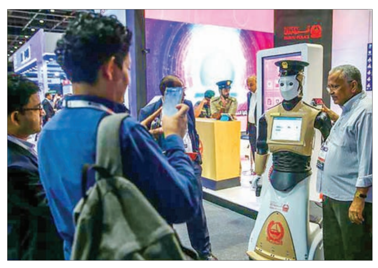
A visitor has a picture taken with an operational robot policeman at the opening of the 4th Gulf Information Security Expo and Conference (GISEC) in Dubai, United Arab Emirates, on 22 May 2017.

WORLD 2 JUNE 2017 THE GLOBAL NEW LIGHT OF MYANMAR