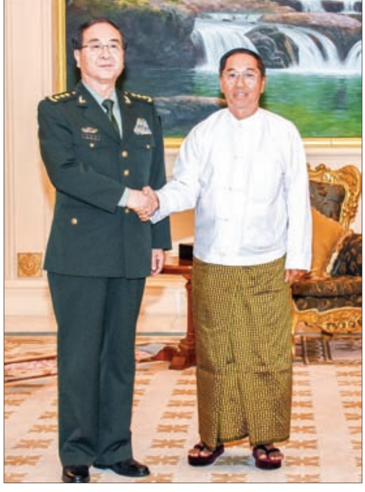
Vice President U Myint Swe shakes hands with Chinese General Fang Fenghui at Presidential Palace in Nay Pyi Taw.

Present at the meeting were Minister of State for Foreign Affairs U Kyaw Tin, Chinese Ambassador to Myanmar Mr. Hong Liang and officials.—Myanmar News Agency