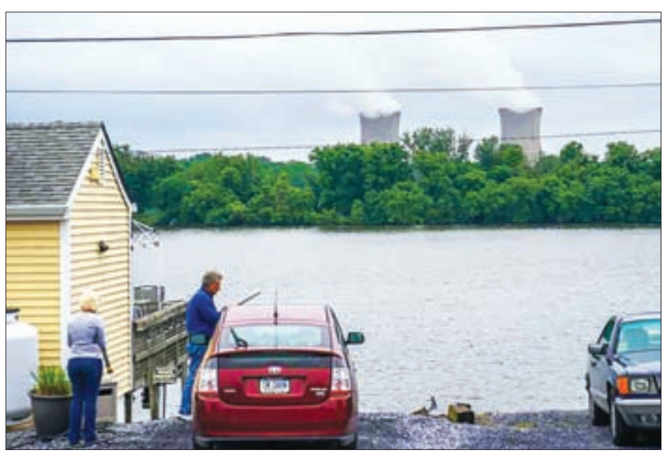
People work on a car across the Susquehanna River in front of the Three Mile Island nuclear power plant in Goldsboro, Pennsylvania, US, on 30 May 2017.

Exelon Corp, the US power company that owns the Middletown, Pennsylvania, power plant, said it will close by 30 September, 2019, unless the state