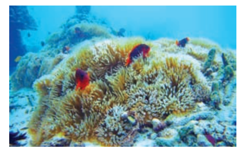
Colorful fish, corals and sponges on the coral reef in Kawthoung, Taninthayi Region.

Tour organizers will include visits to famous pagodas and significant destinations in Mawlamyine. The group will arrive back in Yangon on 9 June. The trip arranged by Myanmar Heritage Trail Tour-