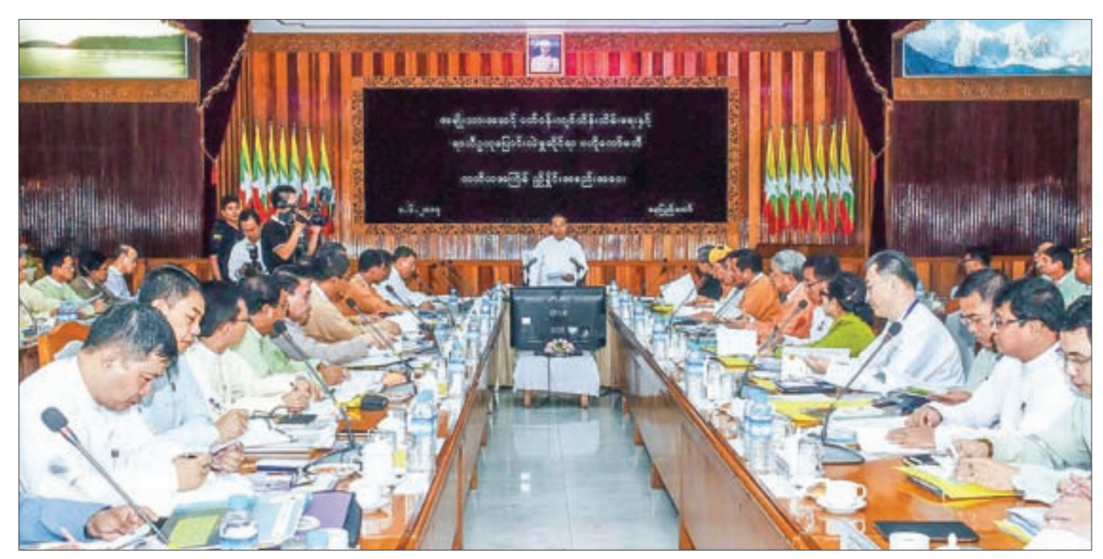
Vice President U Myint Swe addresses the meeting of the Central Committee for National Level Environmental Conservation.

"Conservation of the natural environment and climate change must be done practically on the ground. In carrying out the tasks of industrial development, we must work hard in unity and with full conscientious-