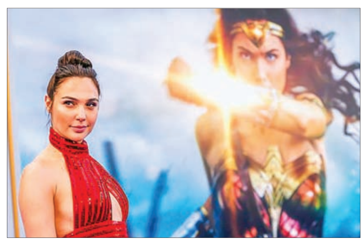
Cast member Gal Gadot poses at the premiere of 'Wonder Woman' in Los Angeles, California US, on 25 May, 2017.

Since her inception in 1941 in DC comic books with her patriotic red bustier embossed with a golden eagle and blue shorts with white stars, Wonder Woman has become a symbol of female empowerment in a comic book world dominated by male super-