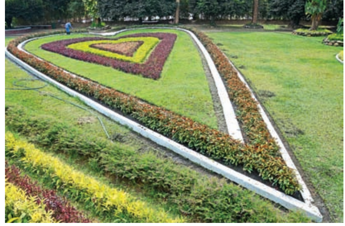
File photo shows decoractive plants in People's Park and Public Square in Yangon.

"The buildings in the Mya Kyun Thar Garden which were not in agreement with the contract would be demolished and YCDC was drafting a master plan," said Yangon Mayor U Maung Maung Soe at the Re-