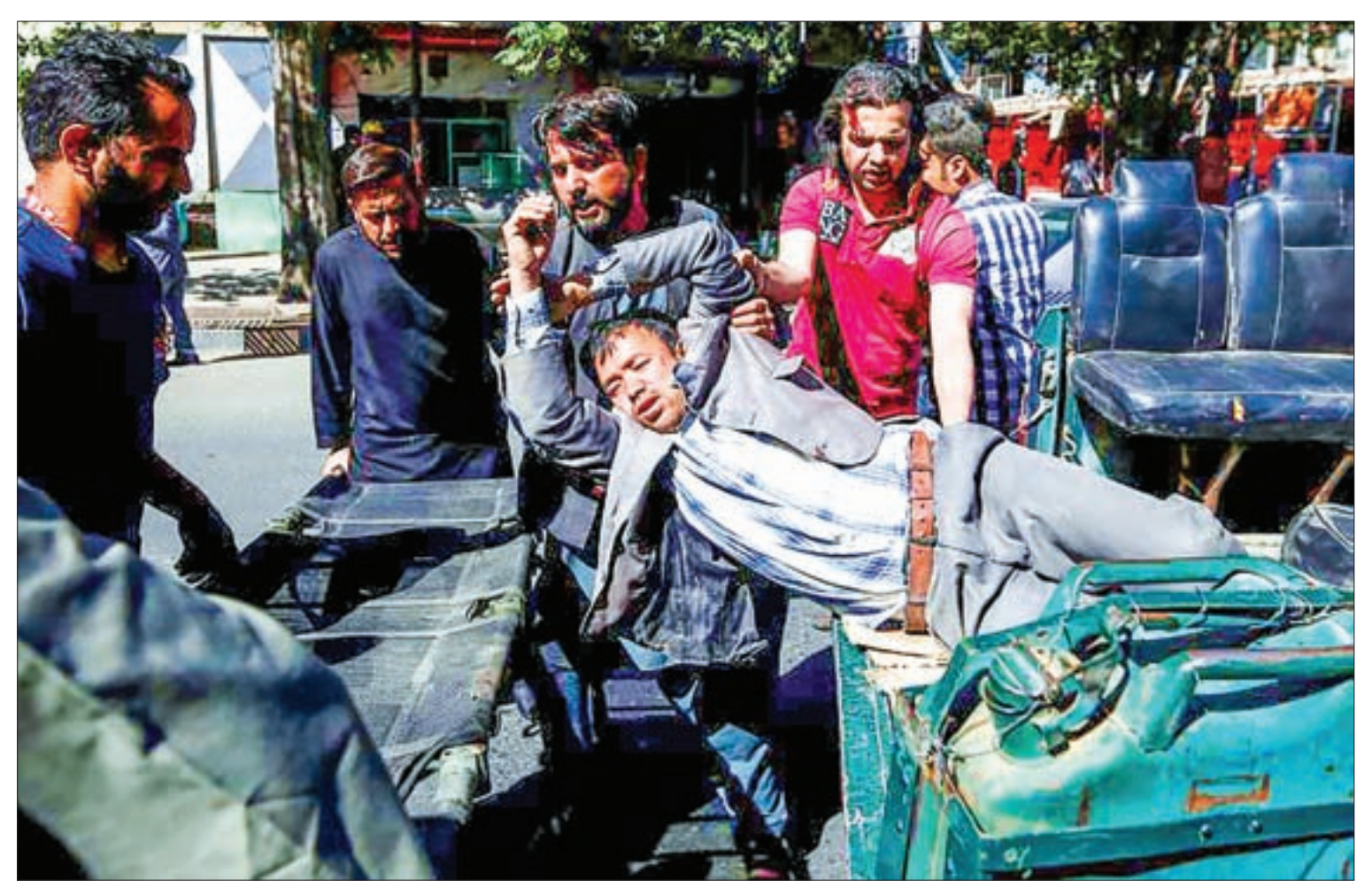
Men move an injured man to a hospital after a blast in Kabul, Afghanistan on 31 May 2017.