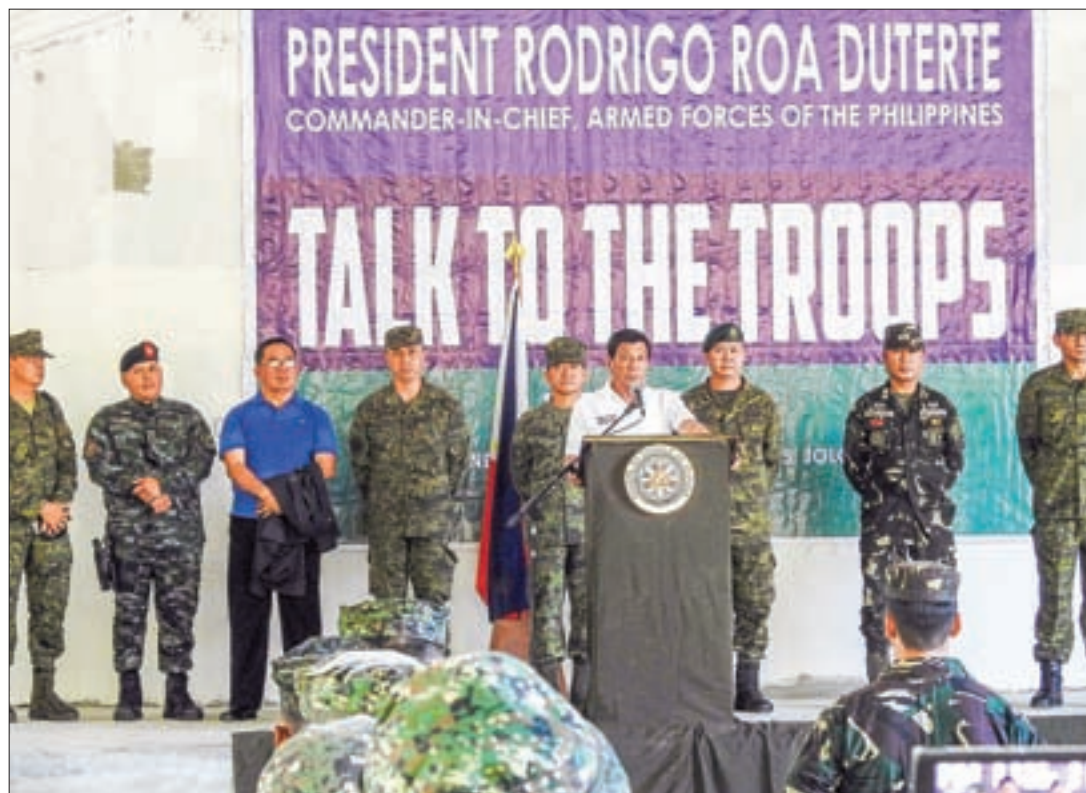
Philippines' President Rodrigo Duterte (C), flanked by military and police officials, talks to troopers during his visit to Camp Teodulfo Bautista in Jolo, Sulu, Philippines on 27 May, 2017.

"I will tell her, when your father, the president of the United States, was screwing Lewinsky ... the girl there in White House, how did you feel? Did you slam