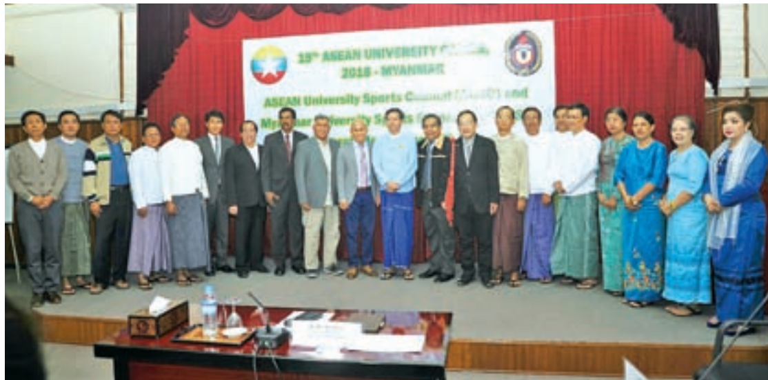
Officials pose a documentary photo after bilateral meeting between ASEAN University Sports Council and Myanmar University Sports Federation.

A BILATERAL meeting between ASEAN University Sports Council-AUSC and Myanmar University Sports Federation-MUSF on holding 19th ASEAN University Games in Myanmar in December 2018. The meeting held at University of Yangon's Diamond Jubilee Hall of the Yangon University was opened with a key note address by Union Minister for Education, Dr. Myo Thein Gyi.