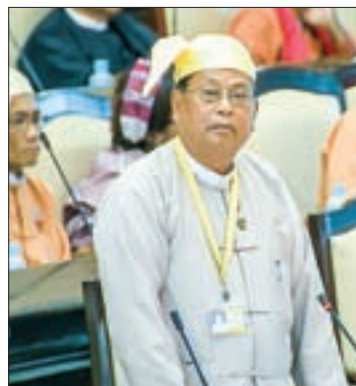
Union Minister for Construction U Win Khaing. PHOTO: MNA

THE seventh day of the fifth session of the second Amyotha Hluttaw was held yesterday in Nay Pyi Taw Amyotha Hluttaw meeting hall, during which questions on information and construction sectors were answered and a bill was tabled. In responding to the question of U Soe Moe of Ayeyawady Region constituency-1 on plans to explain to the public in a transparent manner the rules and details of the Yangon-Pathein Road B.O.T. agreement between a company and Ministry of Construction, the Union Minister for Construction U Win Khaing said if the local public and relevant state and region governments want to know of the rules and details of the B.O.T. agreement between the Ministry of Construction and