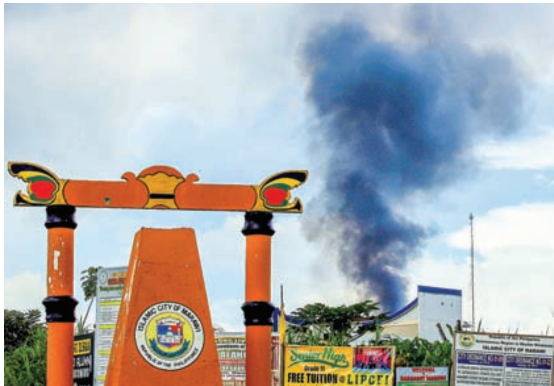
Black smoke coming from a burning building is seen as government troops continue their assault of insurgents from the so-called Maute group, who have taken over large parts of Marawi City, Philippines on 31 May, 2017.

The militants had freed jailed comrades to join the battle and opted to engage in urban warfare because the city had stocks of arms and ample supplies of food.