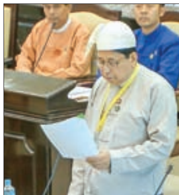
Union Minister for Information Dr. Pe Myint.

A person permitted to conduct B.O.T. construction works under a B.O.T. agreement needs for the construction to meet set