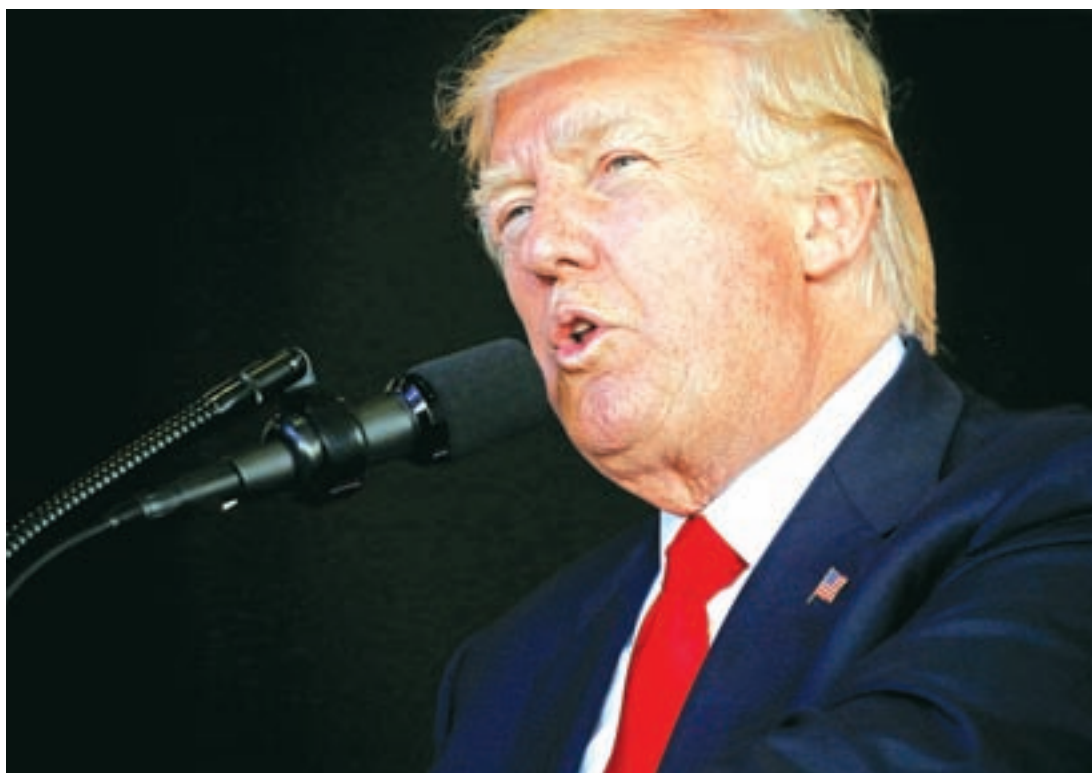
US President Donald Trump.

The accord, agreed on by nearly 200 countries in Paris in 2015, aims to limit planetary warming in part by slashing carbon dioxide and other emissions from the burning of fossil fuels. Under the pact, the United States committed to reducing its emissions by 26 to 28 per cent from 2005 levels by 2025.