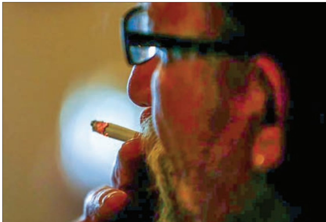
A man smokes a cigarette in a pub on a last day before a smoking ban comes into effect in Prague, Czech Republic on 30 May, 2017.

worked at U Svary Svine since it started in the 1990s, said most customers who come to the small pub smoke while sipping their beers.