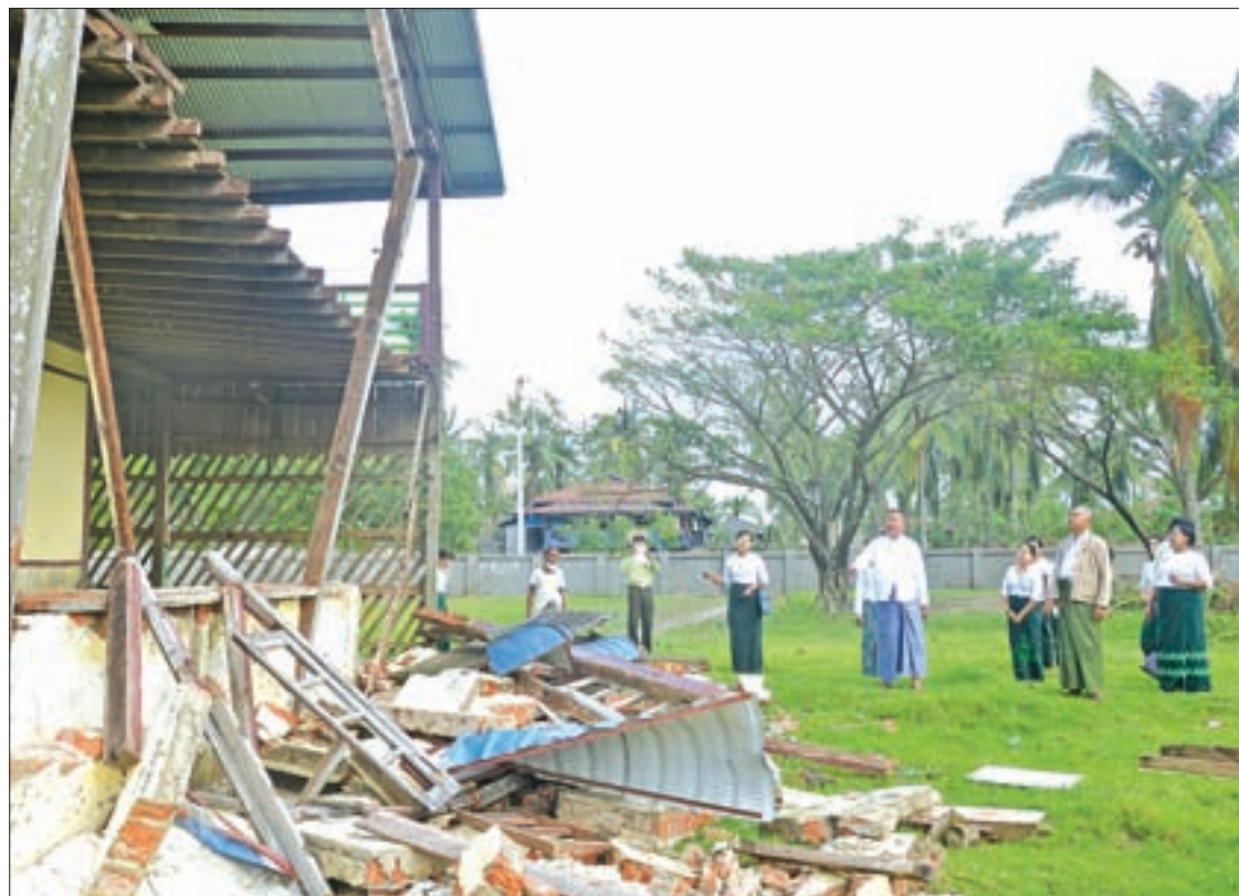
Officials inspect a school building damaged by Cyclone Mora in Sittway.

During his visit, the Union Minister and party spoke words of encouragement to the people who sought shelter at several monasteries during the storm — Maha Zeya Theiddi Adihtan and Seitta Thukha. The minister subsidised one week's worth of ration money for the victims.