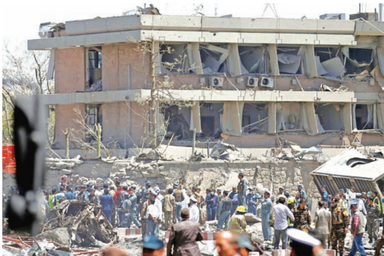
Afghan officials inspect outside the German embassy after a blast in Kabul, Afghanistan on 31 May, 2017.