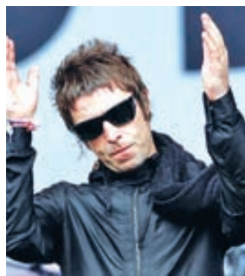
Liam Gallagher performs with his band Beady Eye during the Glastonbury music festival at Worthy Farm in Somerset on 28 June, 2013.

LONDON — Former Oasis frontman Liam Gallagher paid homage to the victims of a suicide bombing in his home town, telling the crowd "Manchester I love you" on a stage lit up by 22 candles, British media reported.