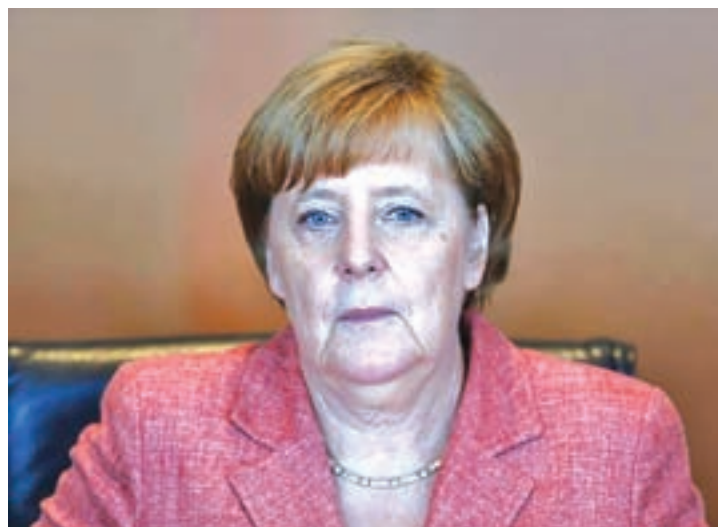
German Chancellor Angela Merkel attends the weekly cabinet meeting at the Chancellery in Berlin, Germany, May 31, 2017.

British Prime Minister Theresa May said earlier this week that Britain would leave the EU without an agreement if it was unable to achieve a satisfactory agreement with the bloc. —Reuters ■