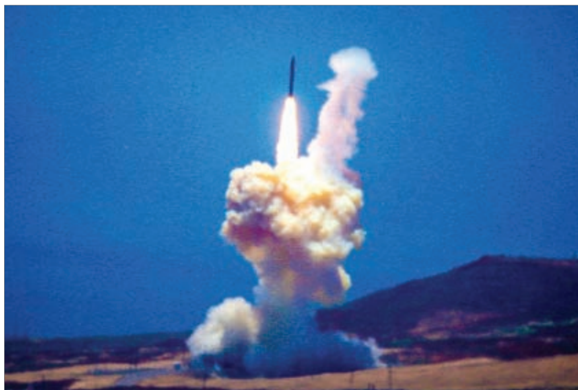
The Ground-based Midcourse Defense (GMD) element of the US ballistic missile defense system launches during a flight test from Vandenberg Air Force Base, California, US on 30 May, 2017.

“This system is vitally important to the defense of our homeland, and this test demonstrates that we have a capable, credible deterrent against a very