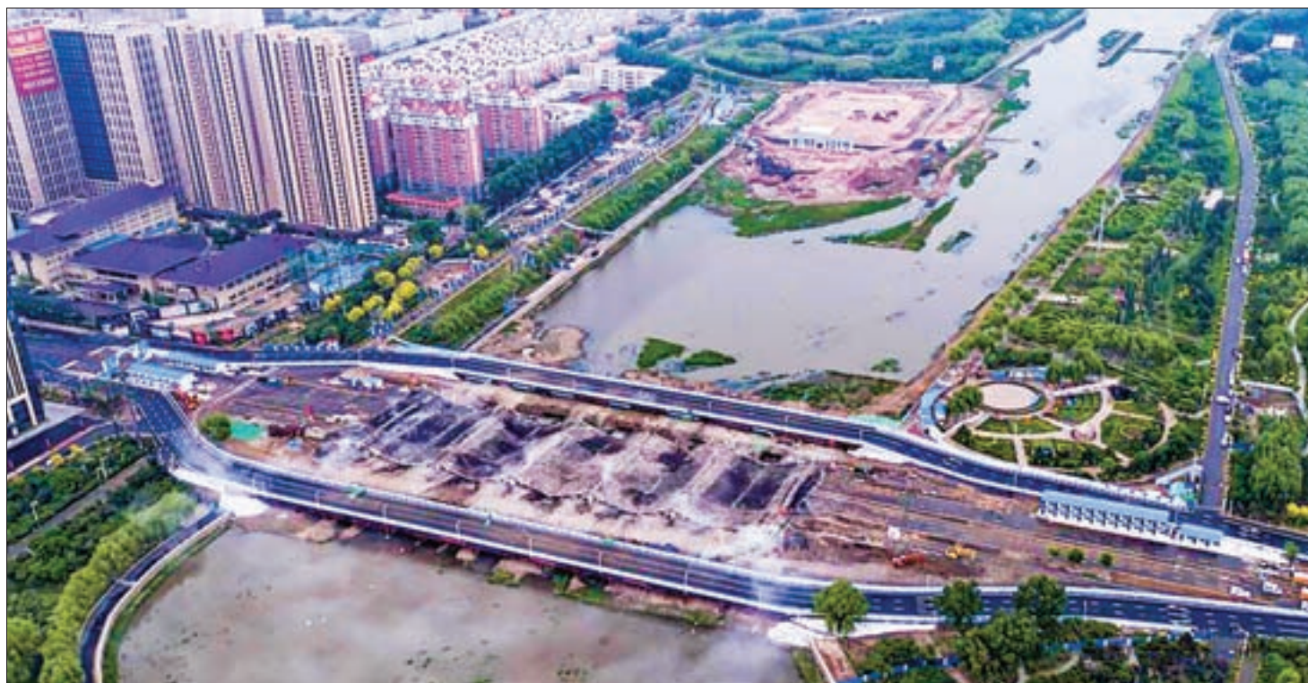
The Changchun Ziyou Bridge is seen after a controlled explosion in Changchun, capital of northeast China's Jilin Province on 31 May, 2017. Based on investigation and calculation, the explosion was designed to demolish only the deck of the bridge. Its pillars were preserved. After the explosion, a new bridge will be built in the next 5 months.