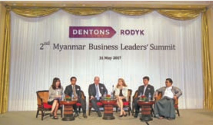
Business leaders discuss economic opportunities in Myanmar.

vices are crucial to the successful functioning of any emerging economy, and I am delighted that Dentons will now have a presence in Myanmar and can contribute to the continued economic de-