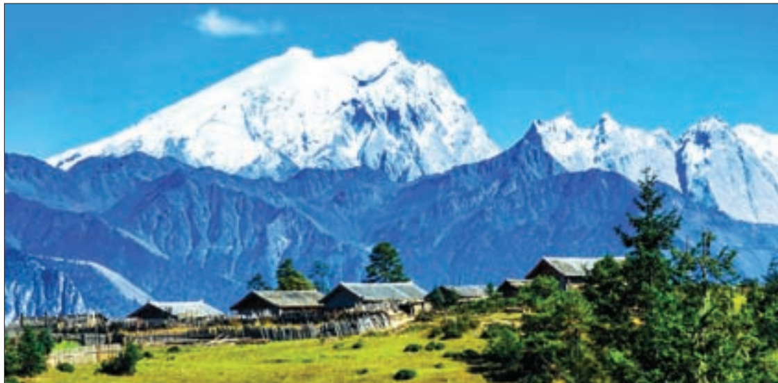
Mt. Khakaborazi in Putao, Kachin State.

Myanmar is also a country rich not only in lands of cultural heritage but also in natural heritage. Much as Myanmar is late to expose its heritage to the world, it can now have achieved in registering 3 distinguished cultural heritage of Myanmar which are old Pyu cities of Sri Kestra, Beikthano and Hanlin in the UNESCO Cultural Heritage List. Though 3 cultural heritage of Myanmar has been in the UNESCO list, there still is no natural heritage of Myanmar registered in the list of UNESCO's World Natural Heritage. Now, Forest Department has submitted the nomination of 7 Myanmar Wildlife Sanctuaries to the UNESCO for the assessment and selection to be registered in Natural World Heritage. Out of those 7 nominated places, Khakaborazi Wildlife Sanctuary will likely be the first to be listed in UNESCO's Natural World Heritage. The organization that spares no effort in striving relentlessly for the Khakaborazi to be registered in the Natural World Heritage is no other than the Forest Department, Ministry of Natural Resources and Environmental Conservation.