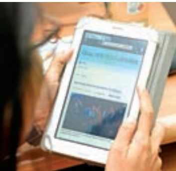
A woman using the internet with a tablet.

To be able to ale advantage of the 4G/LTE services, MPT customers need a mobile device and a 4G SIM card. Currently, the GSM 2G/3G users can exchange their SIM cards with a new 4G sim card free of charge with the same phone number in every MPT office. —Min Thu ■