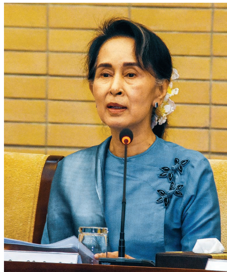
Daw Aung San Suu Kyi delivers the opening speech.