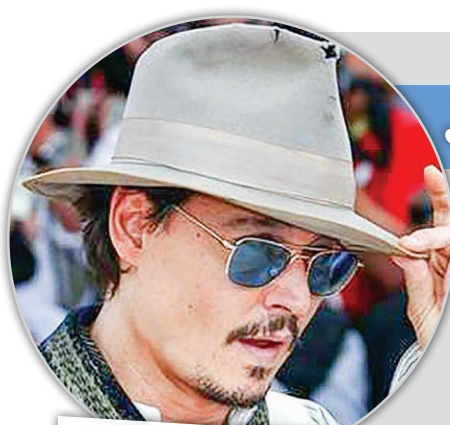
Johnny.

The 30-year-old actress said during her time away from the films she could focus on things which interests her, like helping children, reported E! online. “Yeah, I miss it (Hollywood)...I think there’s a lot of noise that we deal with, so I found a kind of peace in life working with children and helping other people that really interest me,” Lohan says. “I think it’s important for us to recognize that all of this stuff is fun, but you have to take time for you,” she adds.—PTI ■