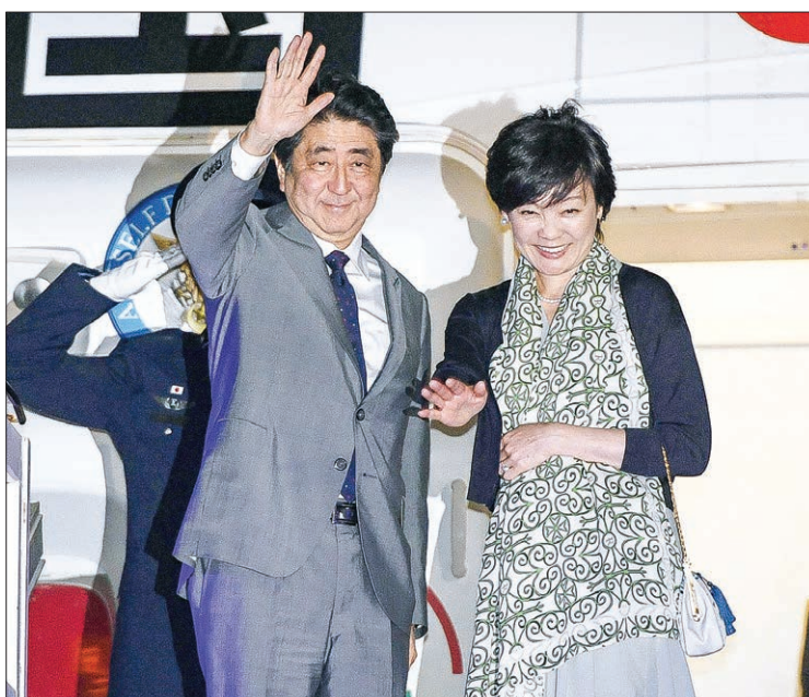
Japan's Prime Minister Shinzo Abe (L) and his wife Akie board a plane bound for Japan at Malta International Airport on 27 May 2017. Abe made a stopover in Malta to hold talks with Prime Minister Joseph Muscat after attending a two-day Group of Seven industrialized nations' summit in Italy.

The Liberal Democratic Party, led by the 62-year-old prime minister, recently extended its term limit for party leaders, enabling him to serve a third consecutive three-year term as president until September 2021 if he wins another party leadership election. Abe will become the longest serving prime minister in Japanese history in Novem-