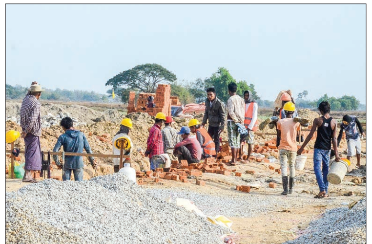
Workers construct a road in Thilawa Special Economic Zone.

Out of 2,400 hectares Thilawa SEZ, 400 hectares are for Zone A, with 96 per cent completed. And, the construction of Zone B on 101 hectares is projected to commence soon and slated to complete in mid 2018. The investors who create more job oppor-