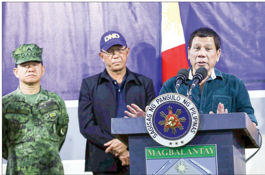
Philippine President Rodrigo Duterte speaks to soldiers next to Defence Secretary Delfin Lorenzana and Armed Forces chief General Eduardo Ano during a visit at a military camp in Iligan City, Philippines on 26 May, 2017.

self," he said, referring to any soldiers who commit violations, then he joked: "If you had raped three, I will admit it, that's on me."