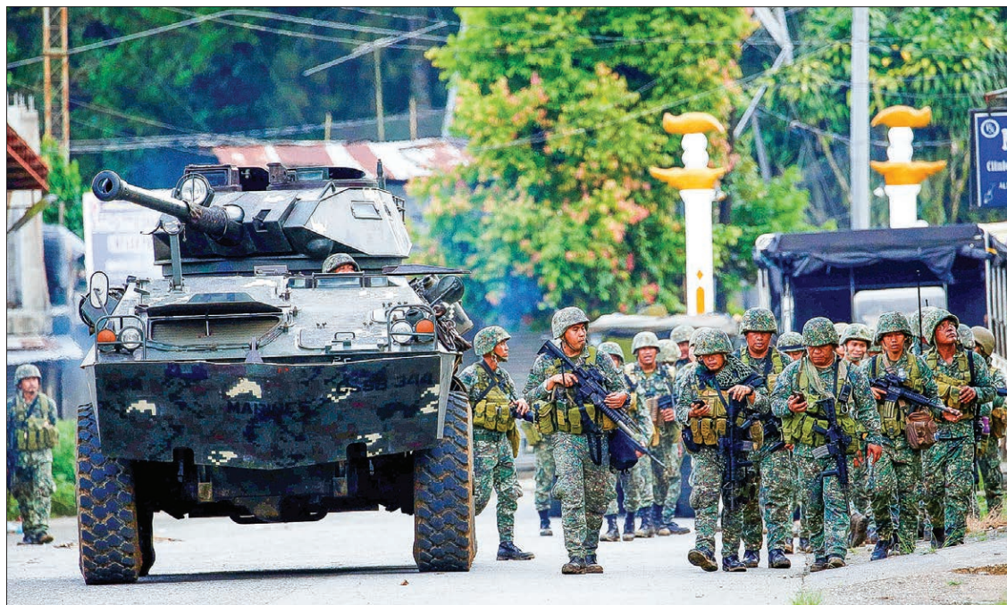
Members of Philippine Marines walk next to an armoured fighting vehicle (AFV) as they advance their position in Marawi City, Philippines on 28 May, 2017.

the sky above Marawi City. Some civilians left on foot, others were seen tying white cloths to poles to distinguish themselves from militants as soldiers huddled behind armoured vehicles slowly advanced.