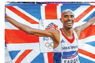
British athletics star Mo Farah.

EUGENE, Oregon — British double Olympic champion Mo Farah made his last US track race a special one, running the year's fastest 5,000 metres at the Prefontaine Classic Diamond League meeting on Saturday.