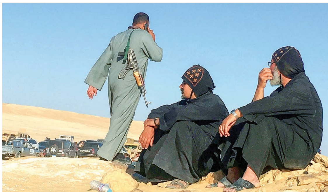
Monks look at an armed policeman following an attack by gunmen on a group of Coptic Christians travelling to a monastery in southern Egypt, in Minya on 26 May, 2017.

A source in Haftar's Libyan National Army told Reuters that