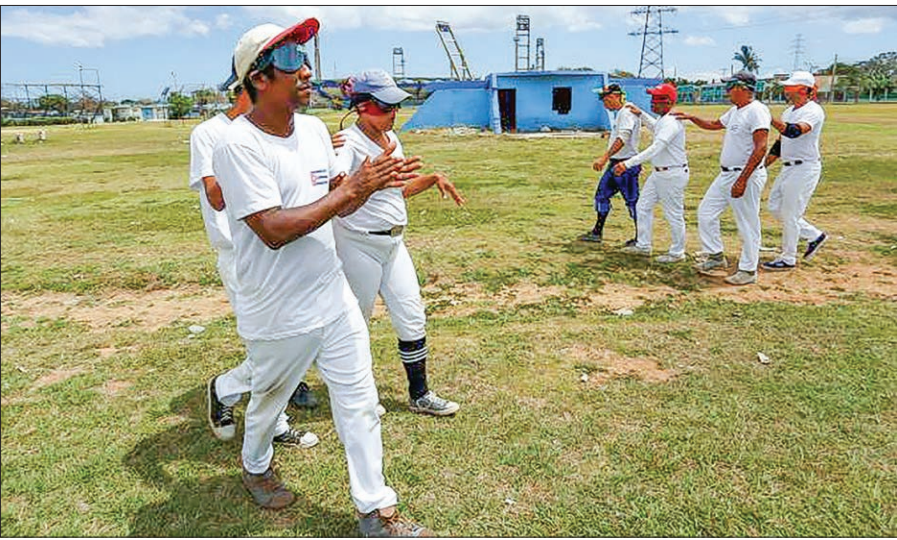
The visually impaired walk at the Changa Medero stadium during a baseball lesson, in Havana, Cuba on 17 May, 2017.

WUZHEN (China) — AlphaGo, a game-playing artificial intelligence programme, on Saturday won its third straight game against the world's top Go player, to sweep the three-game series played in Wuzhen, China. Go is a Chinese board game similar in complexity to chess. AlphaGo is the Go-playing program developed by DeepMind Technologies Ltd., a British AI company acquired by Google in 2014. AlphaGo's comprehensive victory over top-ranked Go player Ke Jie in the Human vs Machine series is expected to further stoke interest in the potential of AI and mechanized "deep learning." Television broadcasts of the games in China were banned by the government, which also censors Google internet search in the country. —Kyodo News ■