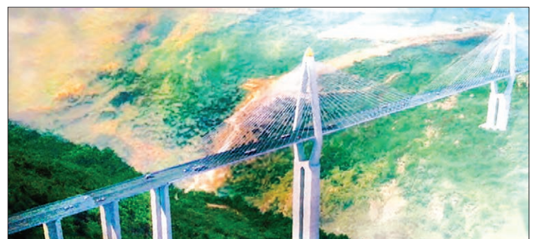
A scale model of new four-lane concrete bridge.

already been submitted to the Shan State government. Construction work will commence only after receiving green lights from the government.