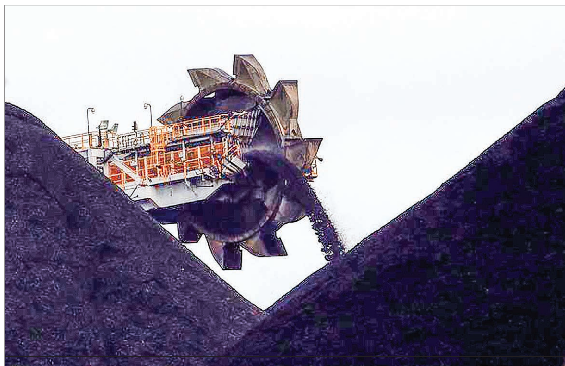
A reclaimer places coal in stockpiles at the coal port in Newcastle, Australia, June 6, 2012.

The port expansion is no longer needed as the company has shrunk the first phase of the mine to 25 million tonnes from 40 million tonnes a year, as it looks to make the mine and rail project more affordable at around $4 billion, instead of more than $10 billion. —Reuters ■