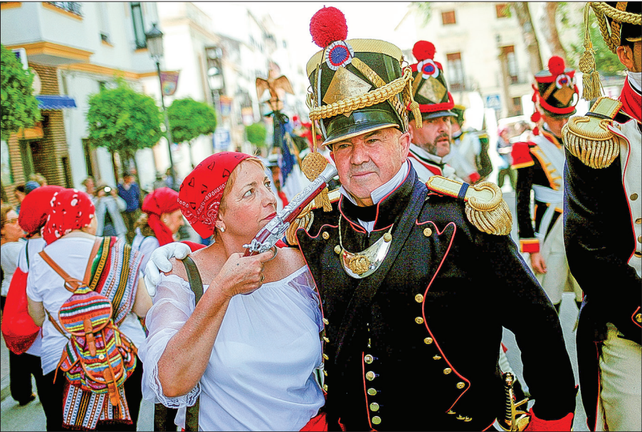
Members of a historical battle re-enactment group, dressed as bandits and the French army, joke before participating in a Spanish Independence War battle re-enactment during the fifth edition of "Ronda Romantica" (Romantic Ronda) in Ronda, southern Spain on 27 May, 2017. Ronda Romantica is a cultural, historical and tourist event during the four days where thousands of people of Ronda and about fifty towns around of "Serrania de Ronda" (Ronda Mountain Ranges), dressed in traditional costumes, recreate the era of the bandits, drovers and romantic travelers in the nineteenth century. They also recreate the war of Spanish Independence which started in 1808 with the invasion by French Napoleonic troops and lasted until 1814, when the French were defeated and expelled from the country.