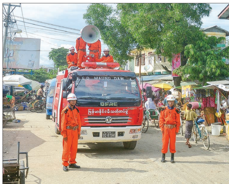
Evacuation team announces cyclone warning over loudspeaker.

Local authorities also held an emergency meeting yesterday to in order to prepare to quickly carry out a response to