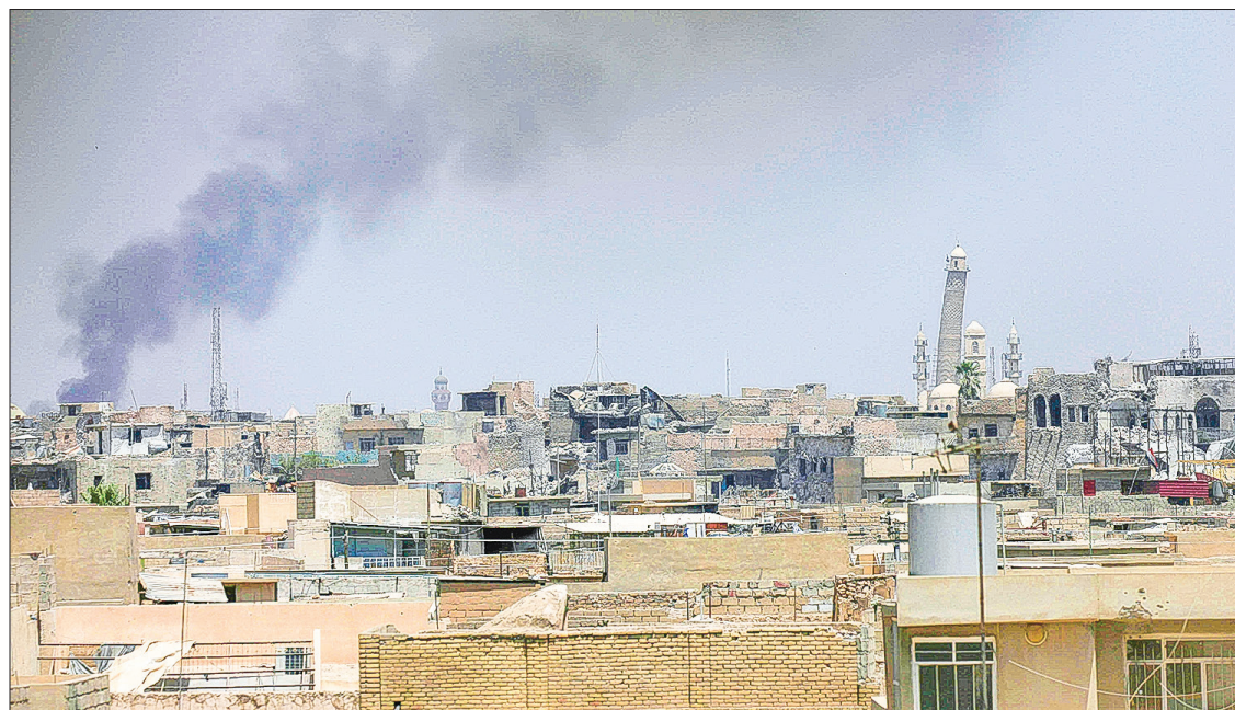
Smoke rises from clashes during a battle between Iraqi forces and Islamic State militants in western Mosul, Iraq on 28 May, 2017.

A video uploaded to the military's Facebook page depicted fighter jets being armed with missiles and taking off as well as aerial footage of air strikes. —Reuters ■