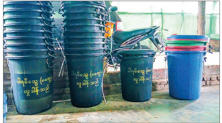
Parame blood donation social organization donated rubbish bins to the Magway general hospital.

We will start our donation when we received the needed items list from an official from the health department. After donating to the general hospital, we have plan to donate to learning/teaching hospital.—MMAL ■