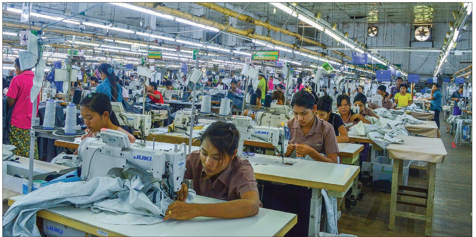
Workers prepare clothing for export at a garment factory in Hlinethayar Industrial Zone in Yangon.

Under the government programme, the Forestry Department will implement 352,438 acres of forest plantations, 285,004 acres of private forest plantations, 808,538 acres of forest to support natural regeneration for timber extraction, 500,000 acres of forest to conserve in the tropical region and 770,332 acres of collective forest.— Kay Lay ■