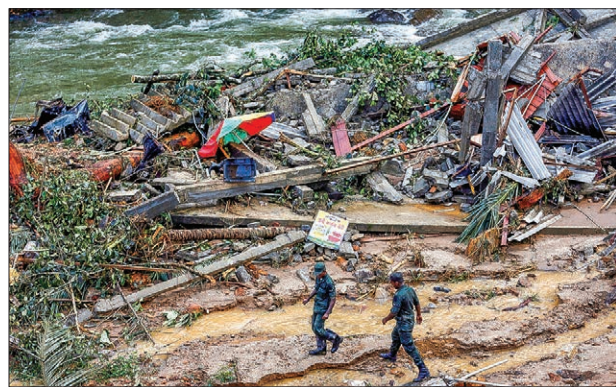
Sri Lankan army soldiers walk past the debris of houses at a landslide site during a rescue mission in Athwelthota village, in Kalutara, Sri Lanka on 28 May, 2017.

COLOMBO — The number of people known to have been killed in floods and landslides in Sri Lanka rose to 122, officials said on Saturday, as the country appealed for international assistance.