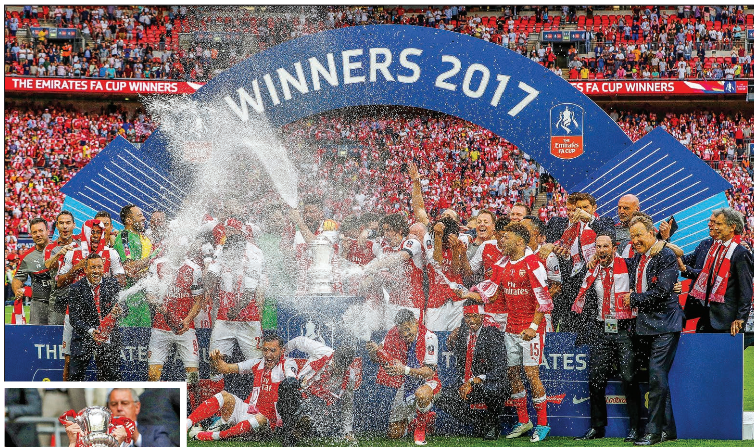
Arsenal celebrate with the trophy after winning the FA Cup final at Wembley Stadium on 27 May, 2017.