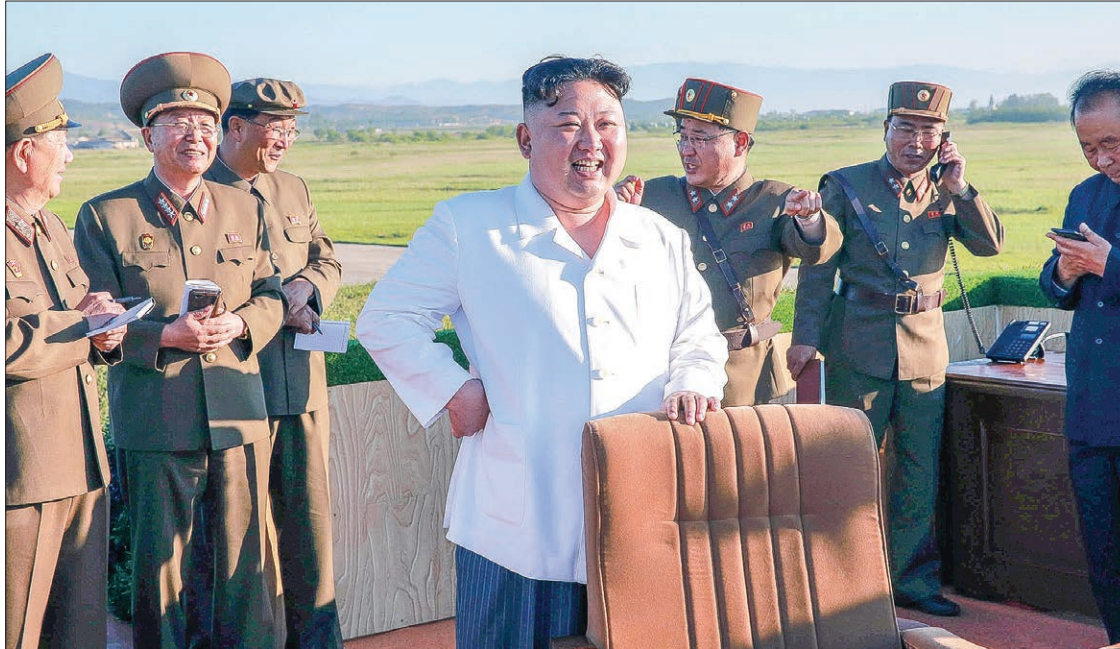
North Korean leader Kim Jong Un watches the test of a new-type anti-aircraft guided weapon system organised by the Academy of National Defence Science in this undated photo released by North Korea's Korean Central News Agency (KCNA) on 28 May, 2017.

The reclusive state rejects UN and unilateral sanctions by other states against its weapons programme as an infringement