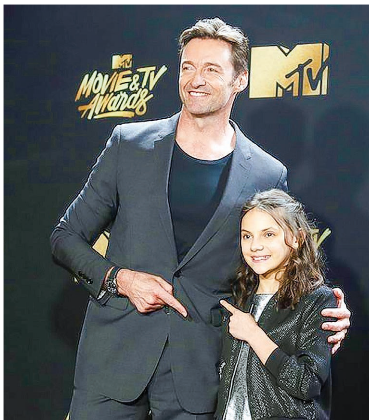
Hugh Jackman and Dafne Keen arrive at the 2017 MTV Movie and TV Awards in Los Angeles on 7 May, 2017.

“That’s the only kind of thing that Jim as a storyteller, a filmmaker... That’s the way his sort of process works. And the way his mind works in terms of what he would aspire to. Which isn’t to say that the studio couldn’t have a conversation about something else, but the one that we’ve been kind of discussing loosely and kicking around is more likely to be its own film,” he told IGN. —PTI ■