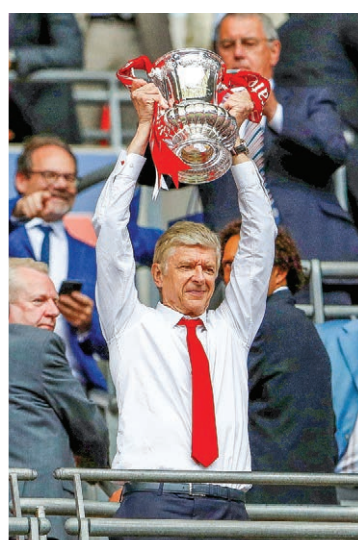
Arsenal manager Arsene Wenger celebrates with the trophy after winning the FA Cup final at Wembley Stadium on 27 May, 2017.

LONDON — Arsenal won the FA Cup for the third time in four years on Saturday when they beat Chelsea 2-1 in the final, thanks to a contested fourth-minute goal by Alexis Sanchez and