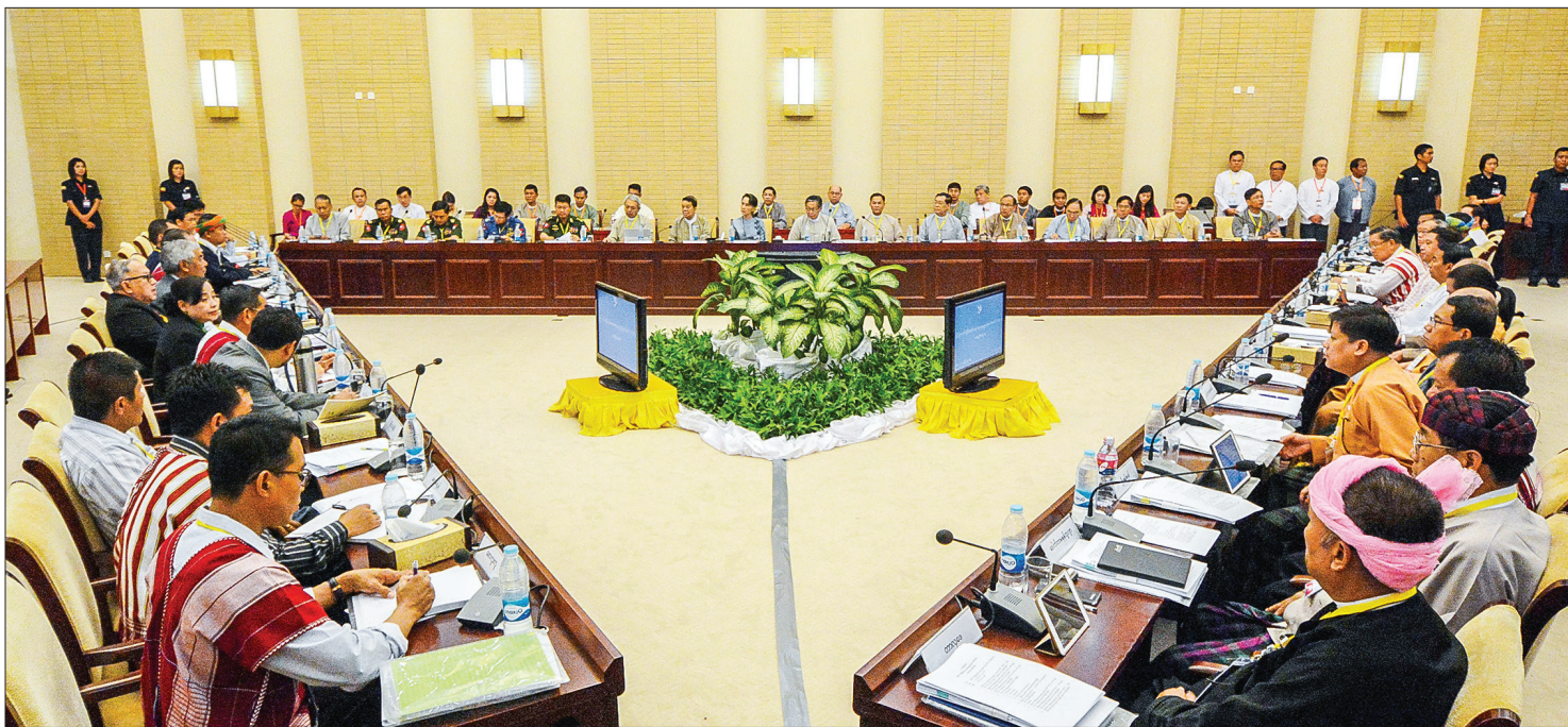
Union Peace Dialogue Joint Committee (UPDJC) holds its 11th meeting in Nay Pyi Taw.