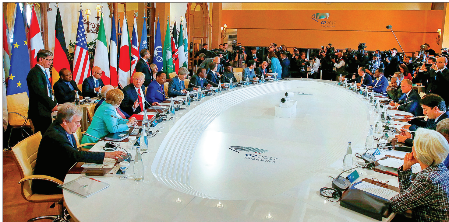
General view of the discussion table at the G7 Summit expanded session in Taormina, Sicily, Italy on 27 May, 2017.