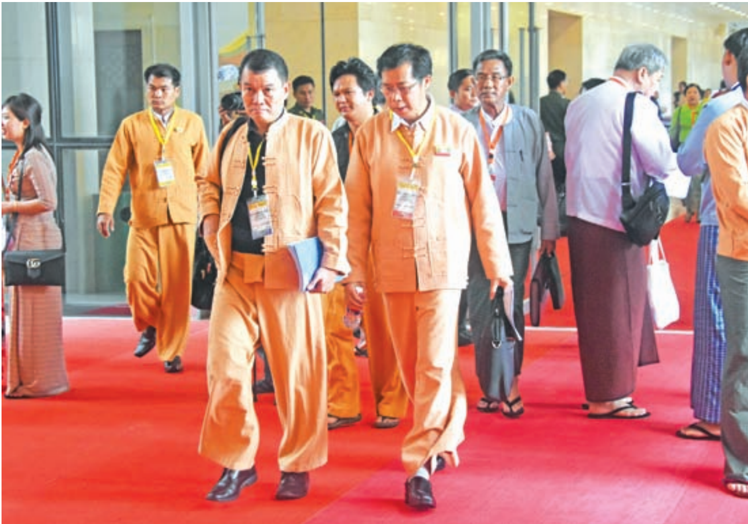
Representatives of ethnic groups arrive for meetings at the Union Peace Conference-21st Century Panglong yesterday in Nay Pyi Taw.