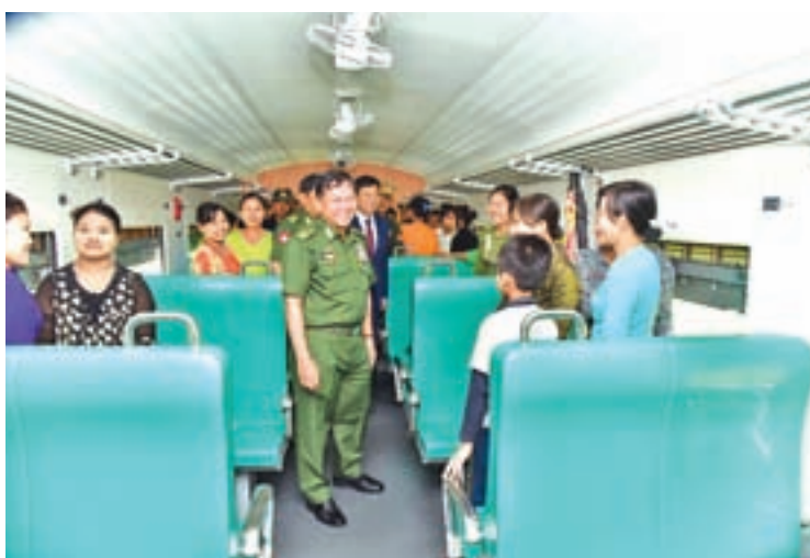
Senior General Min Aung Hlaing greets the passengers on the new locomotives gifted by China.

With the ceremony complete, the Commander-in-Chief of Defense Services, high-ranking Tatmadaw officers, the Chinese ambassador to Myanmar, the military attaché, and their families left Nay Pyi Taw Rail-