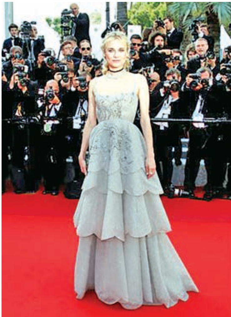
Actress Diane Kruger poses.

“Just holding that grief for this entire movie, the subject