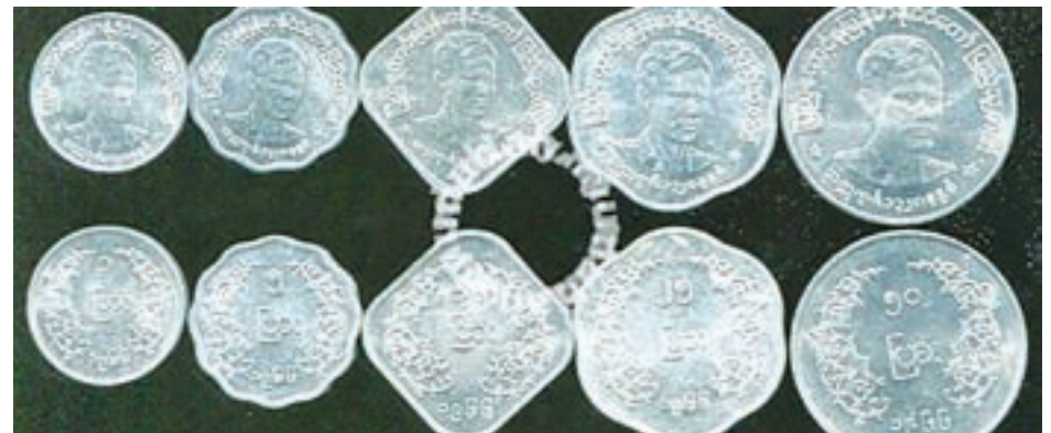
Coins circulated & used in 1960s & 70s

There are ten independent nations that don't use coins (or very rarely use them, such as with Vietnam or Guinea) as of 2012. These countries use paper money for all (or nearly all) currency transactions. In some cases, the nations used to produce coins, but inflation rendered them to be worthless (for instance, the highest denomination coin in Guinea is worth about 1 US cent).