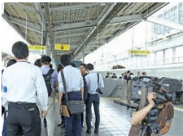
Reporters gather on a platform at JR Okayama Station, western Japan, on 26 May 2017, after a shinkansen bullet train stopped there following a fire on a seat started by an elderly man. The man was arrested and no one was injured.

The incident took place on the JR Sanyo Shinkansen Line connecting Shin-Osaka in western Japan and Hakata in Fukuoka Prefecture,