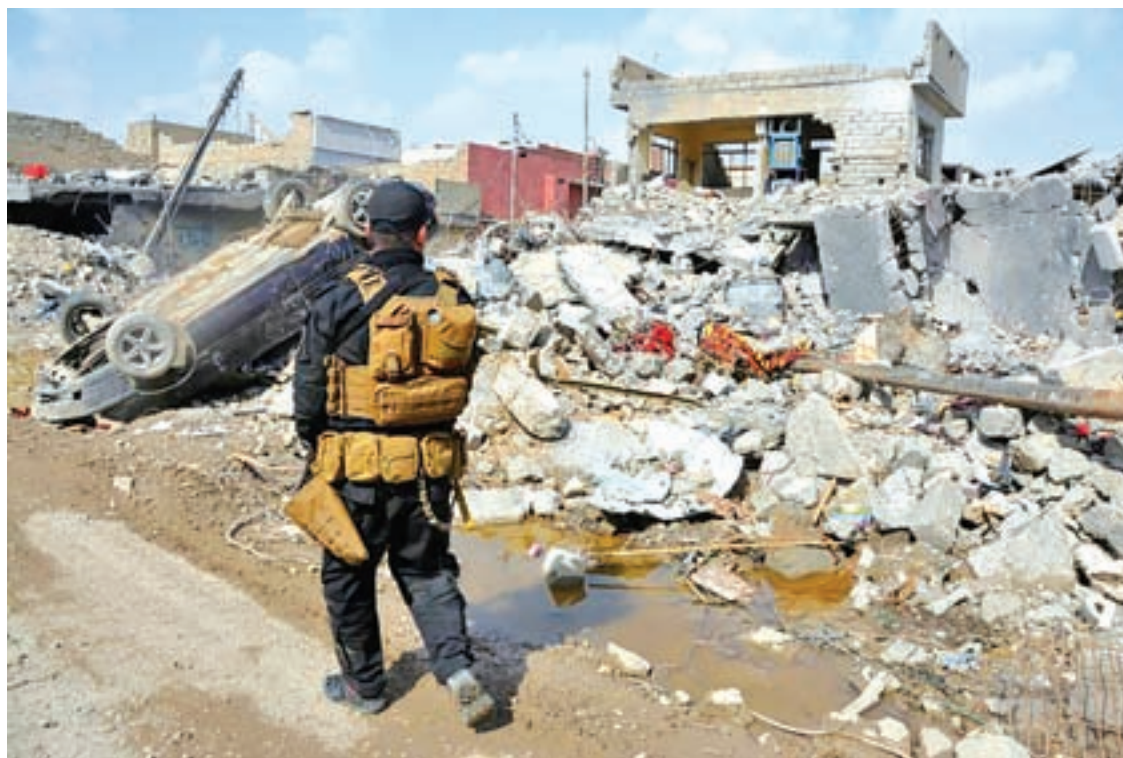
A member of the Counter Terrorism Service (CTS) walks at the site after an air strike attack against Islamic State triggered a massive explosion in Mosul, Iraq, on 29 March 2017.

Prior to the March 17 strike, Iraqi forces were about 100 me-