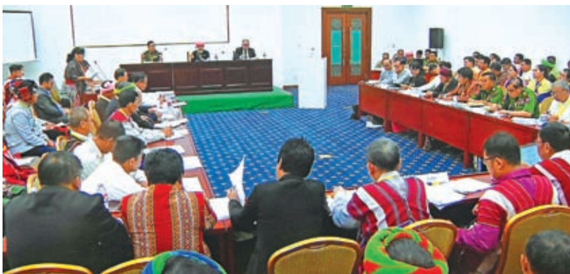
Representatives discuss concerning the security sectors at UPC-21st Century Panglong yesterday.