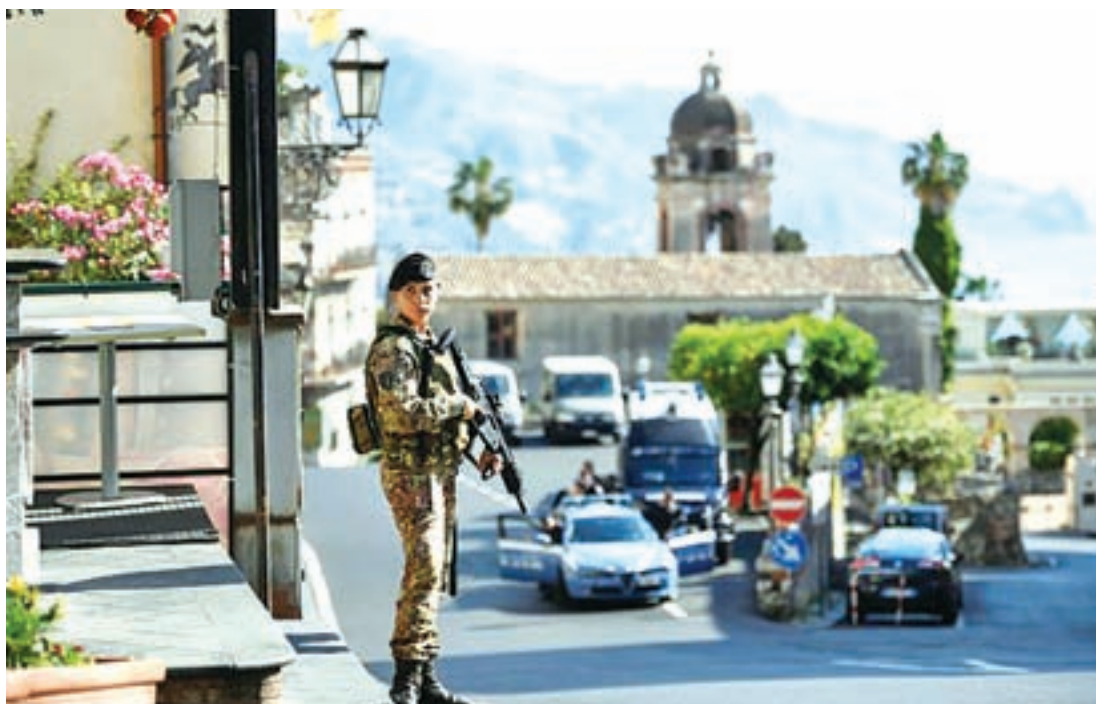
A military guard stands watch at the G7 summit in Taormina, Italy, on 26 May 2017.

"We will have a very robust discussion on trade and we will be talking about what free and open means," White House economic adviser Gary Cohn told