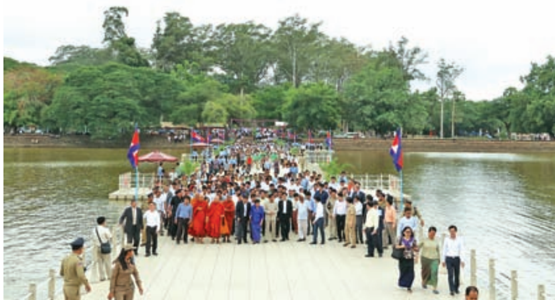
New floating bridge providing access to Angkor Wat temple in northwestern Cambodia opens on 25 May 2017, for temporary use, replacing an ancient stone bridge that needs renovation.