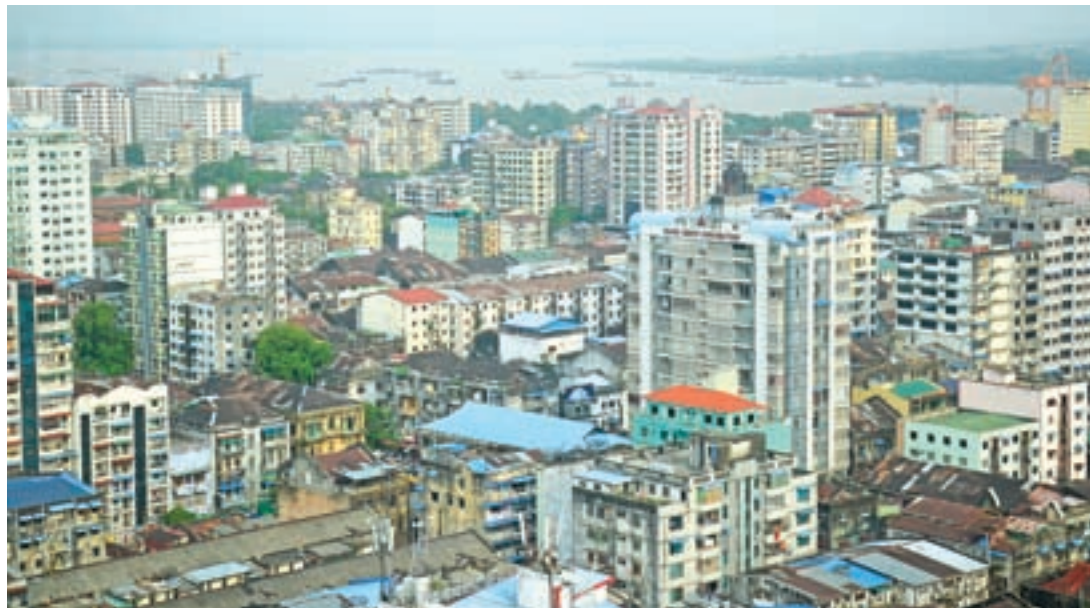
An aerial view of Yangon City with high-rise buildings.