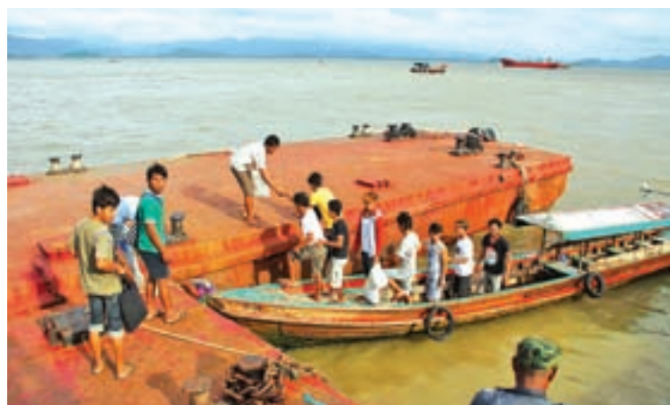
The 14 seaman who survived their ship sinking off the coast of Phuket, arrive in Kawthoung yesterday.