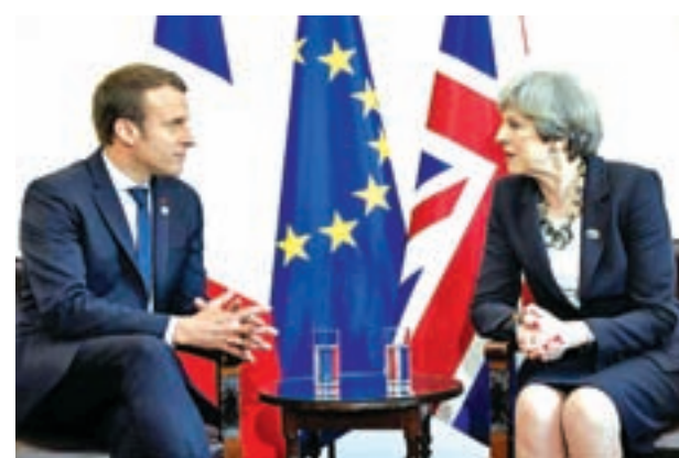
Britain's Prime Minister Theresa May and French President Emmanuel Macron talk during a bilateral meeting at the G7 Summit in Taormina, Sicily, Italy, on 26 May 2017.

Sitting in front of the flags of France, Britain and the European Union, May said she was looking forward to wider discus-