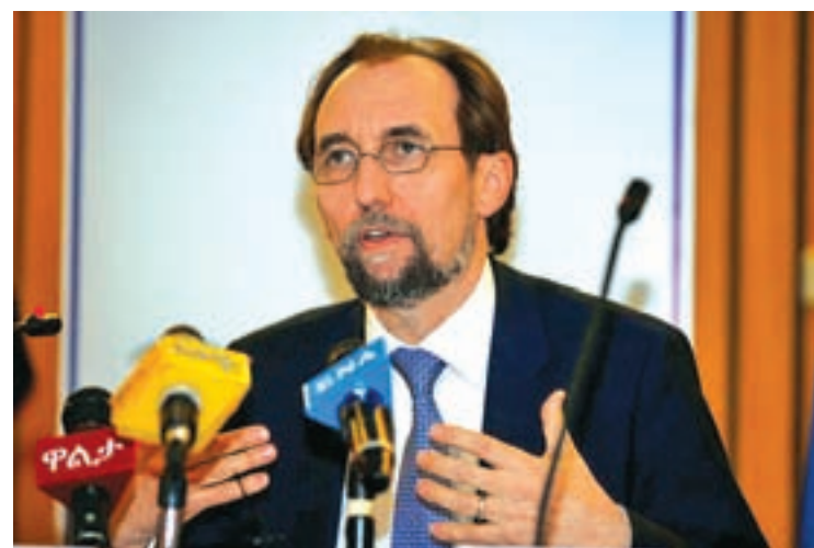
United Nations High Commissioner for Human Rights Zeid Ra’ad al-Hussein of Jordan address a news conference during his visit in Ethiopia’s capital Addis Ababa, on 4 May 2017.

“Unfortunately, scant attention is being paid by the outside world to the appalling predicament of the civilians trapped in these areas,” he added.