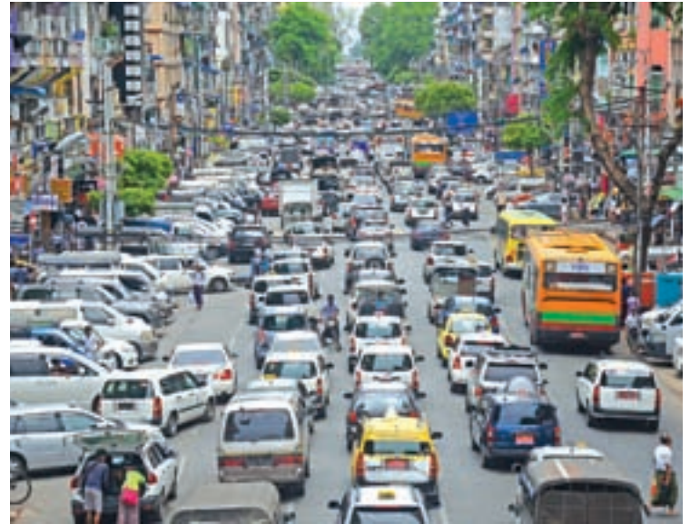
Vehicles seen in downtown Yangon.

According to section 19 of the municipal law relating to roads and bridges, anyone who uses municipal property for car parking shall be given a major fine. Drivers continue to park in public areas for long periods in every township.— 200 ■