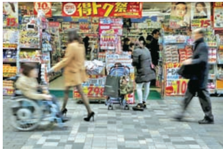
A woman with a baby buggy looks at items outside a discount store at a shopping district in Tokyo, Japan, on 25 February 2016.

With the economy showing signs of life, many analysts now expect the BOJ's next move to be a reduction — rather than an expansion — of its monetary stimulus. But BOJ officials have stressed that any reduction in stimulus would be some time away, pointing to the fact inflation remains distant from their target.—Reuters ■