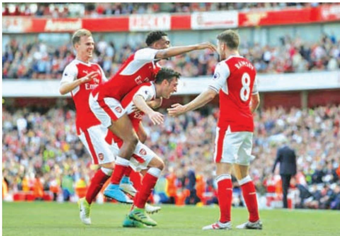
Arsenal's Aaron Ramsey celebrates with teammates after scoring their third goal during their Premier League at Emirates Stadium on 21 May 2017.