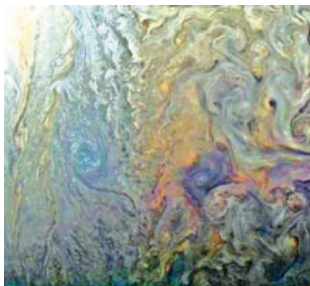
NASA's enhanced-color image of a mysterious dark spot on Jupiter shows a Jovian "galaxy" of swirling storms in this image captured by NASA's Juno spacecraft on 2 February, 2017.

The findings released on Thursday were based on data collected when Juno