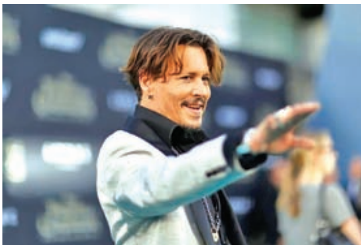
Actor Johnny Depp arrives at The Premiere of Disney’s “Pirates of the Caribbean: Dead Men Tell No Tales” at Los Angeles, California, US, on 18 May.

Depp, who’s had a tough year in the headlines thanks to an acrimonious divorce from wife Amber Heard, as well as claims and counter claims about his behavior and lavish lifestyle, sat out media interviews for the