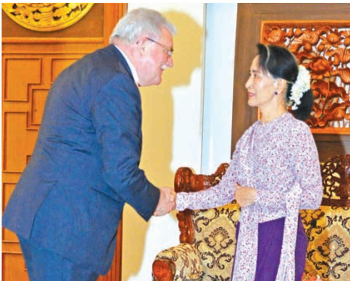
State Counsellor Daw Aung San Suu Kyi welcomes Dr. Werner Langen.

The State Counsellor and Foreign Secretary of the Republic of India discussed matters relating to promoting bilateral relations and cooperation between the two countries including energy sector, infrastructure and culture, trade, investments and matters on exchanged visits of high ranking representatives from both sides at the meeting.— Myanmar News Agency ■