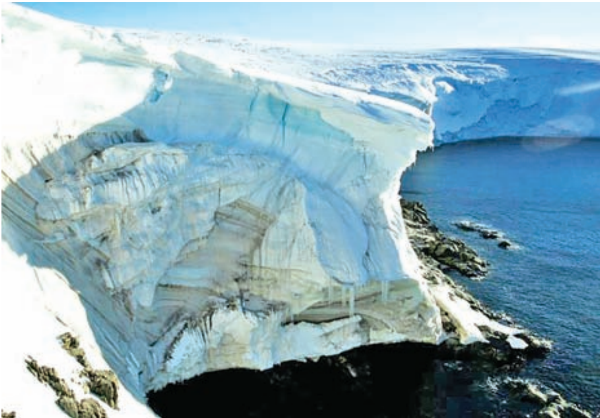
Melting ice shows through at a cliff face at Landsend, on the coast of Cape Denison, Antarctica, on 2 January 2010.