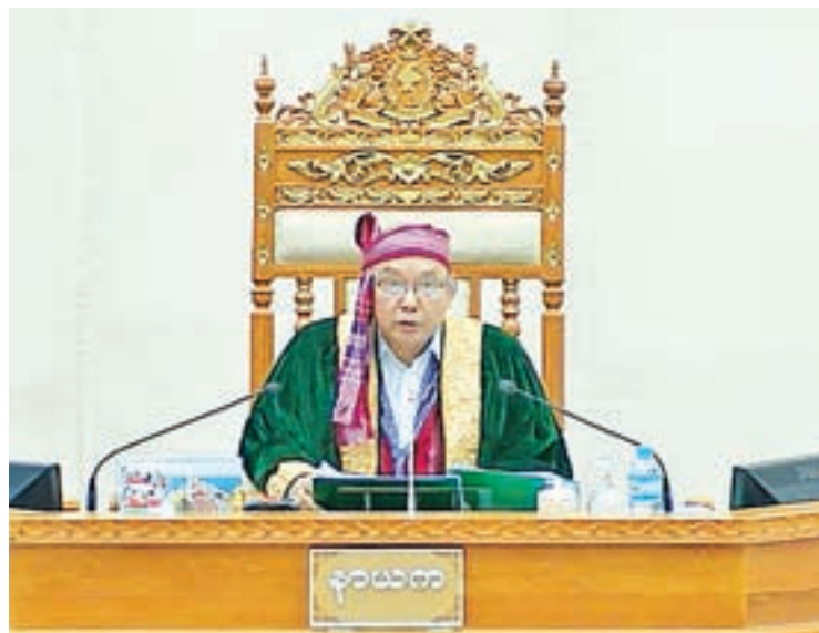
Speaker of the Pyidaungsu Hluttaw Mahn Win Khaing Than.

Afterward, the Patron of the Pyidaungsu Hluttaw announced that any interested