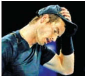
Britain's Andy Murray.

Top-seeded Murray trained on Thursday, ahead of