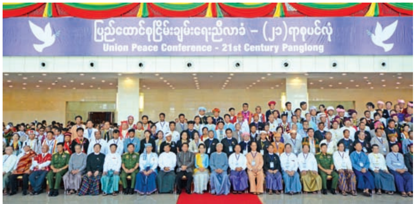
Delegates to the Union Peace Conference—21st Century Panglong 2nd Session pose for documentary photo at the Myanmar International Convention Centre—2 in Nay Pyi Taw yesterday.

“Our intention is not to stop at the ceasefire stage,” she said. “It is to achieve lasting peace through political dialogue.