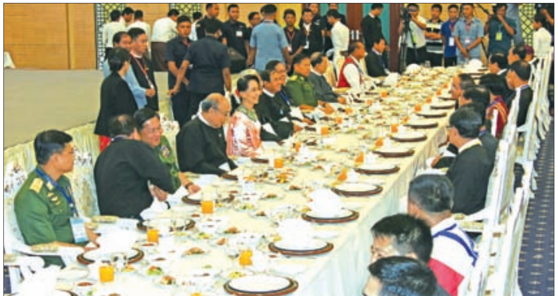
The dinner hosted by State Counsellor Daw Aung San Suu Kyi.