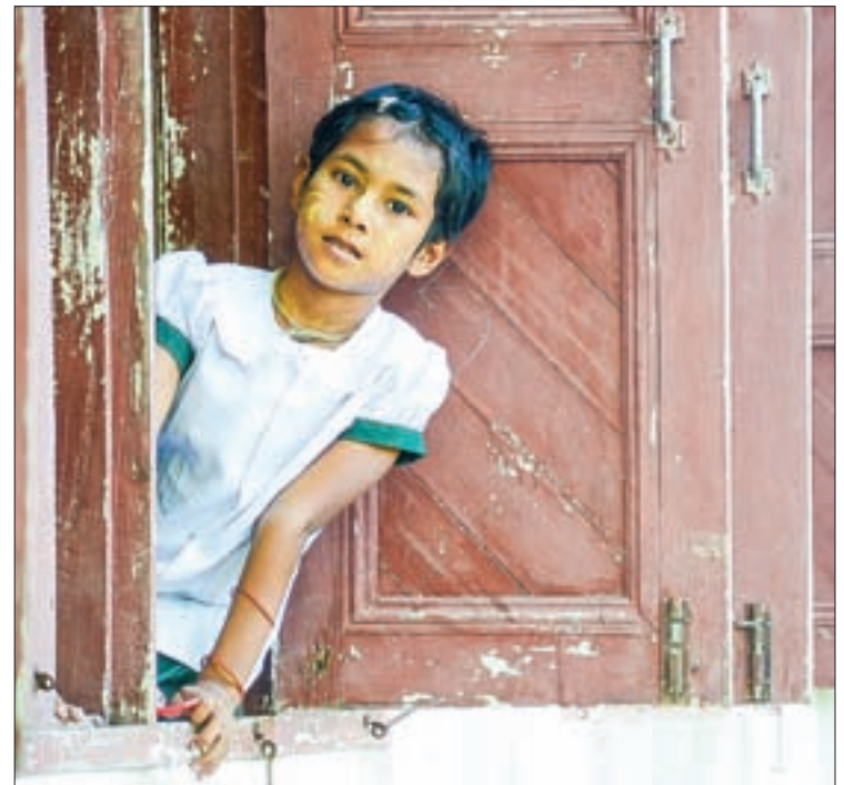
Uniforms, textbooks and note books will be provided to students free of charge for the coming academic year.

According to the latest 2014 census, about 80 per cent of the country's 10-year-olds attend school.—200 ■