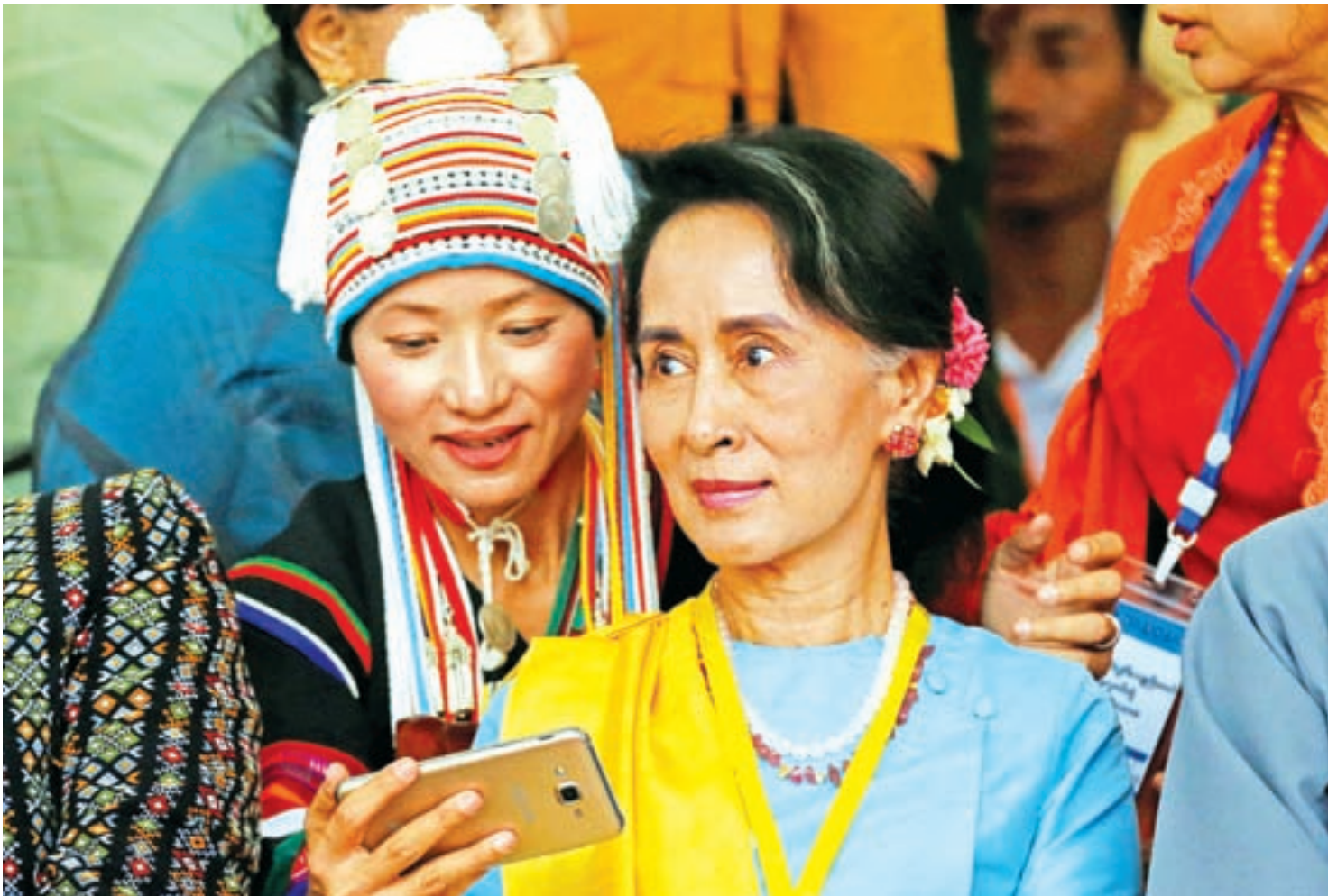
A woman in the ethnic dress of a hill tribe in Shan State takes a selfie with State Counsellor Daw Aung San Suu Kyi after the opening ceremony of the 21st Century Panglong Conference held yesterday at the Myanmar International Convention Centre 2 in Nay Pyi Taw.