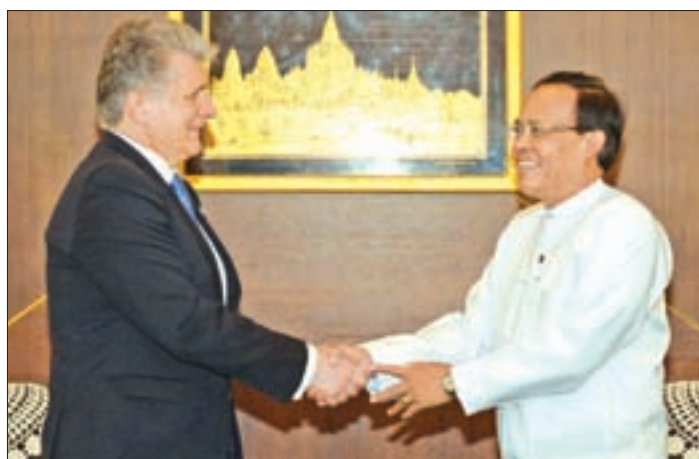
U Kyaw Tin welcomes Mr. Miroslav Jenča, Assistant Secretary-General for Political Affairs of the United Nations.

sides discussed matters pertaining to the continued support of the United Nations on Myanmar Government's efforts on democratic transformation process, socio-economic development, peace process and national reconciliation. —Myanmar News Agency ■