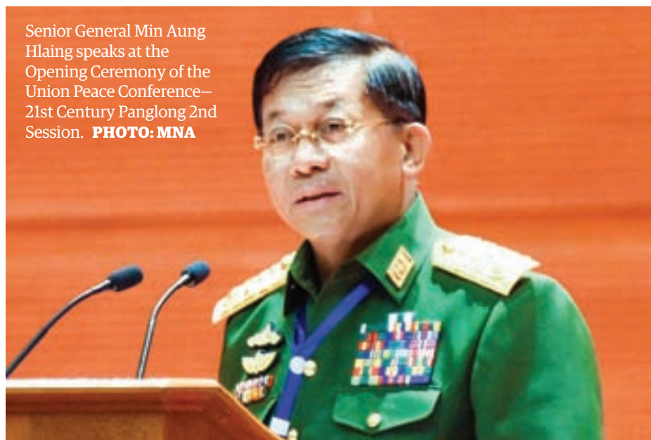
Senior General Min Aung Hlaing speaks at the Opening Ceremony of the Union Peace Conference—21st Century Panglong 2nd Session.

The emergence of NCA was based on two concepts proposed by ethnic armed organizations. The first one was that as the government, the Tatmadaw and ethnic armed organizations which have ceased fire had agreements signed by the organizations individually, it needed to have a national level ceasefire agreement in order to start political dialogues at the national level. The second one was the ceasefire agreements in successive eras were based on the stage of ending attacks. As there was no exact process for monitoring the agreements and no guarantees and agreements for continuously holding political dialogues after ending