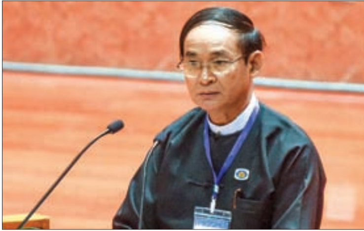
Pyithu Hluttaw Speaker U Win Myint delivers a speech at the Opening Ceremony of Union Peace Conference – 21st Century Panglong—second session.

Our country is a country in which civil war had existed for over 60 years due to different doctrines and beliefs. Because of the civil war, many lost their lives, with most rendered homeless and amputated. Whatever it is, they all are our national brethren and our citizens. So long as the country cannot get internal peace, our national brethren will yet have to lose their opportunities in the field of economy, politics, social affairs, education, health and etc. Stability will never emerge in their respective areas, void of internal peace. I assume that development programmes cannot be implemented without stability in the region.