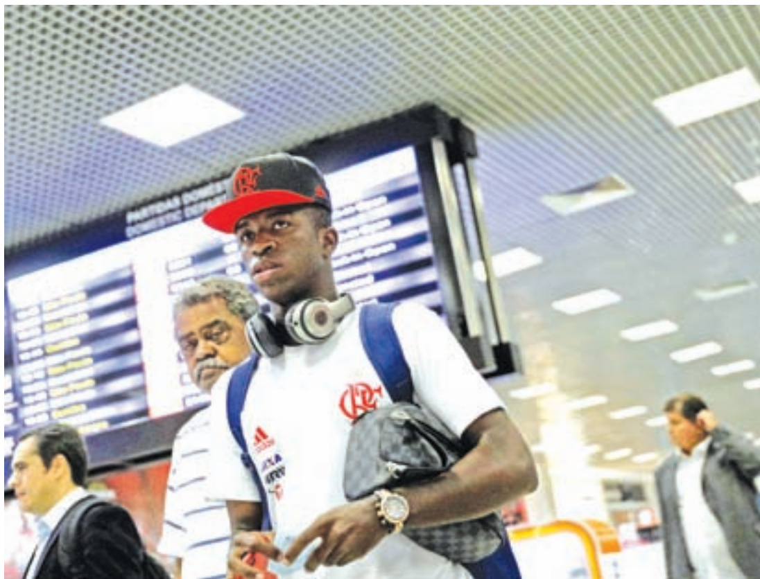
Real Madrid newly-signed player Vinicius Junior, who is playing with Brazilian side Flamengo, is pictured at Santos Dumont airport in Rio de Janeiro, Brazil on 23 May 2017.