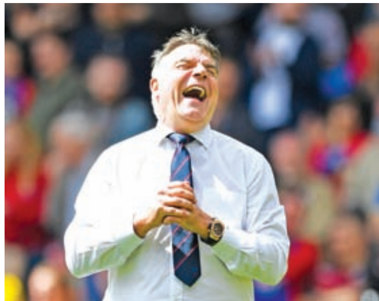
Crystal Palace manager Sam Allardyce.

Some reports suggested Allardyce is not intending to look for another managerial job after a rollercoaster season which began with a 67-day stint in charge of the England national team. He eventually resigned in the wake of a newspaper sting, later joining Palace when they were in relegation trouble. Palace's Premier League status was confirmed after the 4-0 win over Hull City earlier this month and they eventually finished 14 th on 41 points. ■