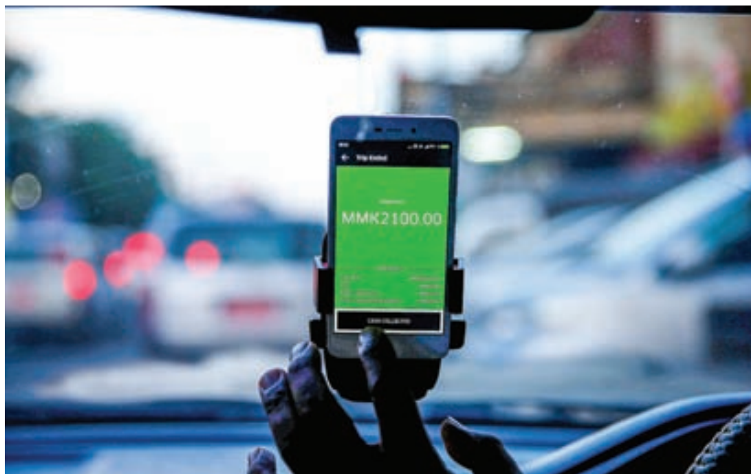
A taxi driver working for Uber uses the Uber app in his car in Yangon on 11 May.