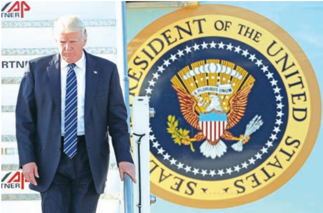
US President Donald Trump.