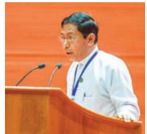
U Than Htay, Chairman, USDP, speaks at the Opening Ceremony of the Union Peace Conference—21st Century Panglong 2nd Session.

During the meeting of 31 August to 2 September 2016, people heard of discussions that include matters that are against