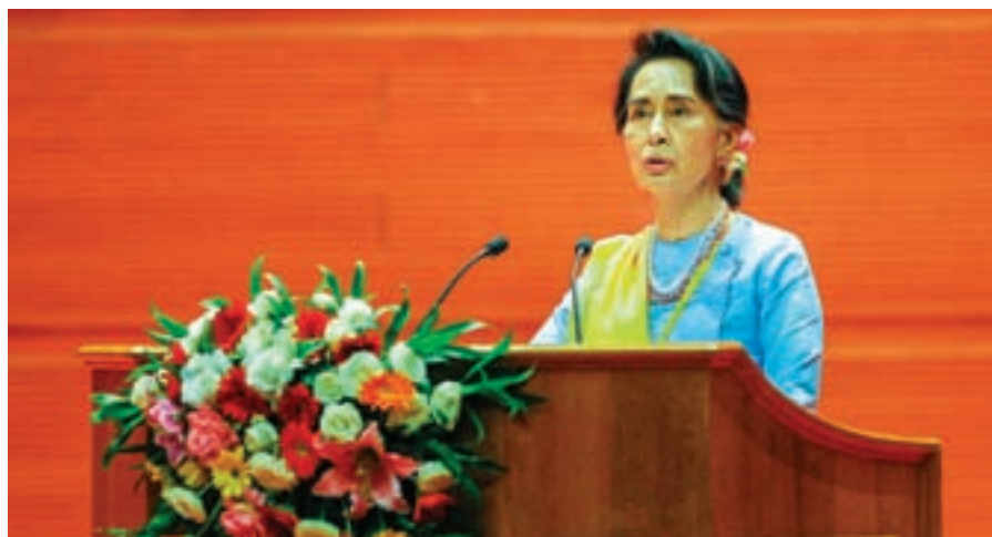
State Counsellor Daw Aung San Suu Kyi speaks at the Opening Ceremony of the Union Peace Conference—21st Century Panglong 2nd Session.

First is the goal that we are striving to achieve. Almost everyone accepts that the resolution to our country's long-running armed conflicts is a federal system that is acceptable to all. Our goal is therefore the "emergence of a democratic federal union based on democracy and federalism". Whether or not we will achieve this goal rests in all of our hands. It is a responsibility that falls on all of our shoulders. I do not think that any of us would wish to avoid, reject or shrink away from this responsibility. The energy, faith and effort that we put in to achieving peace can be a beacon of light for our country, our Union, and all of our peoples. Whether this light