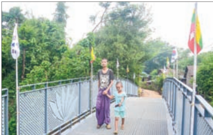
A man and young girl crossing the Yoewa steel bridge built from 1% of POSCO Group employee's salary.

The new bridge was commissioned into service yesterday, with the attendance of more than 150 people including Deputy Director-General Aye