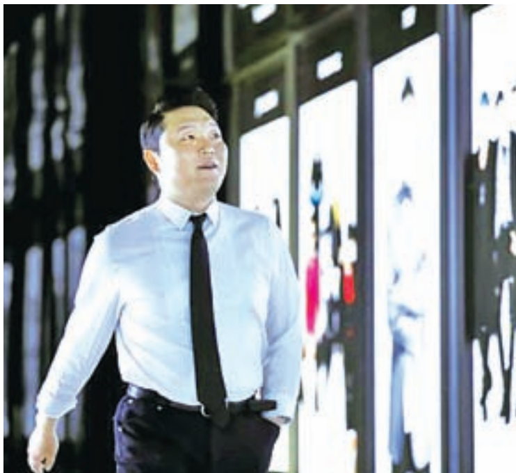
South Korean rapper Psy speaks during an interview with Reuters in Seoul, South Korea on 19 May, 2017.

said Psy. “Like when you throw a party, it takes some time for that excitement to die down after it’s over. I think it took a while for that exhilaration to subside. Now I’m back to my normal life.”