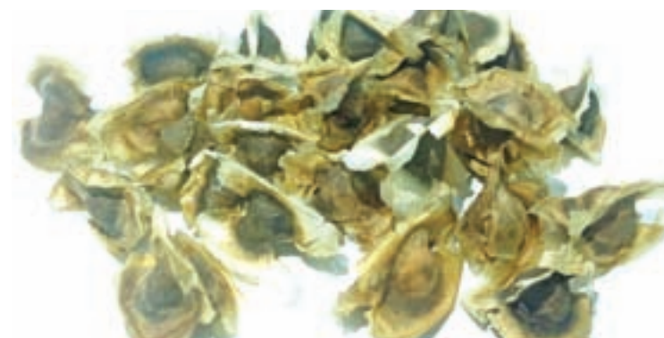
Drumstick tree seeds.

Myanmar Investment Commission (MIC) permitted joint venture investment of GAC (Myanmar) limited for production and marketing of coffee beans (Arabica) and vegetable seeds, according to MIC meeting held on 19th May.—200 ■