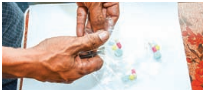
A man packs medicine at a pharmacy.

The health department will stop providing the drug in Kalay, Tamu, Katha, Pyin Oo Lwin, Minbu, Myitkyina, Bhamo and Nyaung U districts out of 45 districts in 2017. The other remaining 37 districts will be provided with the drug starting from October 2017.—200 ■