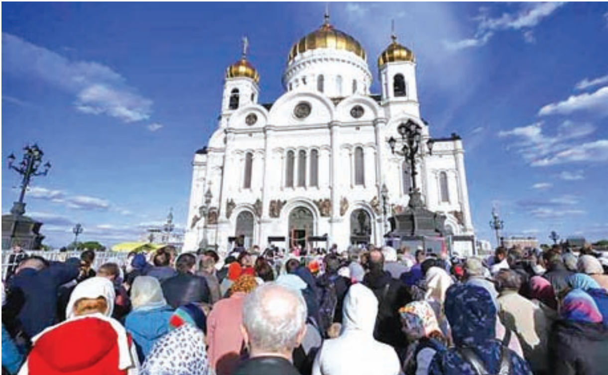
People queue to venerate the relics of Saint Nicholas being shown in the Christ the Saviour Cathedral, after his remains were sent to Russia on loan from their permanent home in Italy, in central Moscow, Russia on 22 May, 2017. PHOTO: REUTERS

After the Soviet Union's demise in 1991, the church has experienced a revival. Although Russia is still formally a secular nation, state media often show Russian Orthodox priests blessing new nuclear submarines and space rocket launches. —Reuters ■