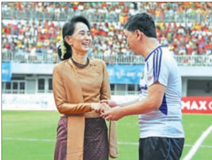
Daw Aung San Suu Kyi shakes hands with U Min Ko Naing at the peace soccer match in Nay Pyi Taw.