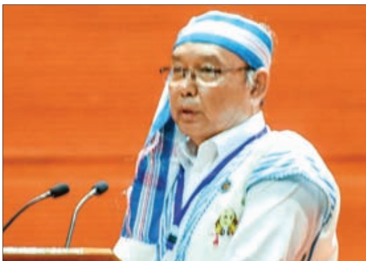
Amyotha Hluttaw Speaker Mahn Win Khaing Than delivers a speech at the Opening Ceremony of Union Peace Conference – 21st Century Panglong—second session.

We had many resources that were required for national development. These resources existed