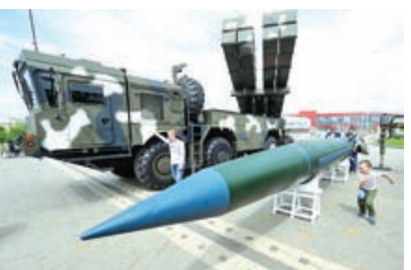
Milex-2017 military exhibition in Minsk.

many neighborhoods. Masked youths man weaponry sparks interest