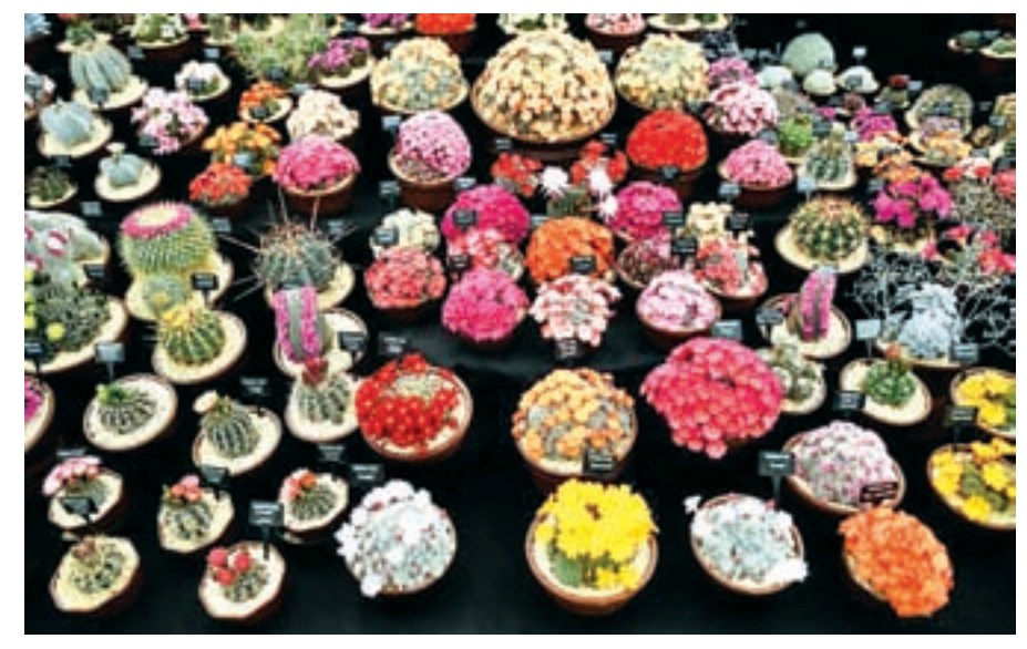
Cacti are displayed at the Royal Horticultural Society's Chelsea Flower show in London, Britain, on 22 May, 2017.

The show, which is organised by the Royal Hor-