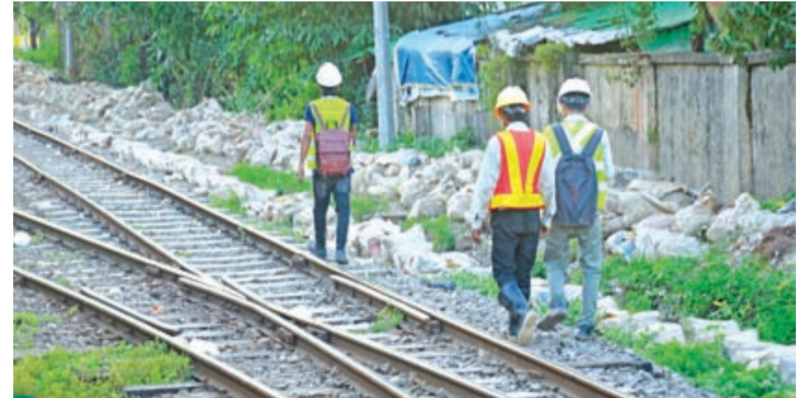
Workers walk next to a railway in Yangon.

tinued. The works of welding the rail lines, replacing new rails and upgrading six stations are currently completed up to Hlawga. The upgrading projects will cost