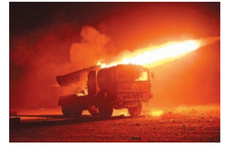
Popular Mobilization Forces (PMF) fire towards Islamic State militants during a battle in Qairawan, west of Mosul, Iraq on 23 May, 2017.

The militants are effectively holding hundreds of thousands of civilians hostage as human shields to slow their advance. —Reuters ■