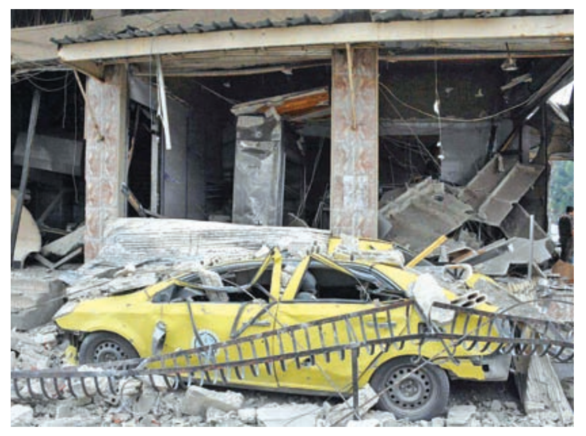
A damaged car lies among rubble after an explosion in the al-Zahraa neighbourhood of Homs city in this handout picture provided by SANA on 23 May, 2017, Syria.