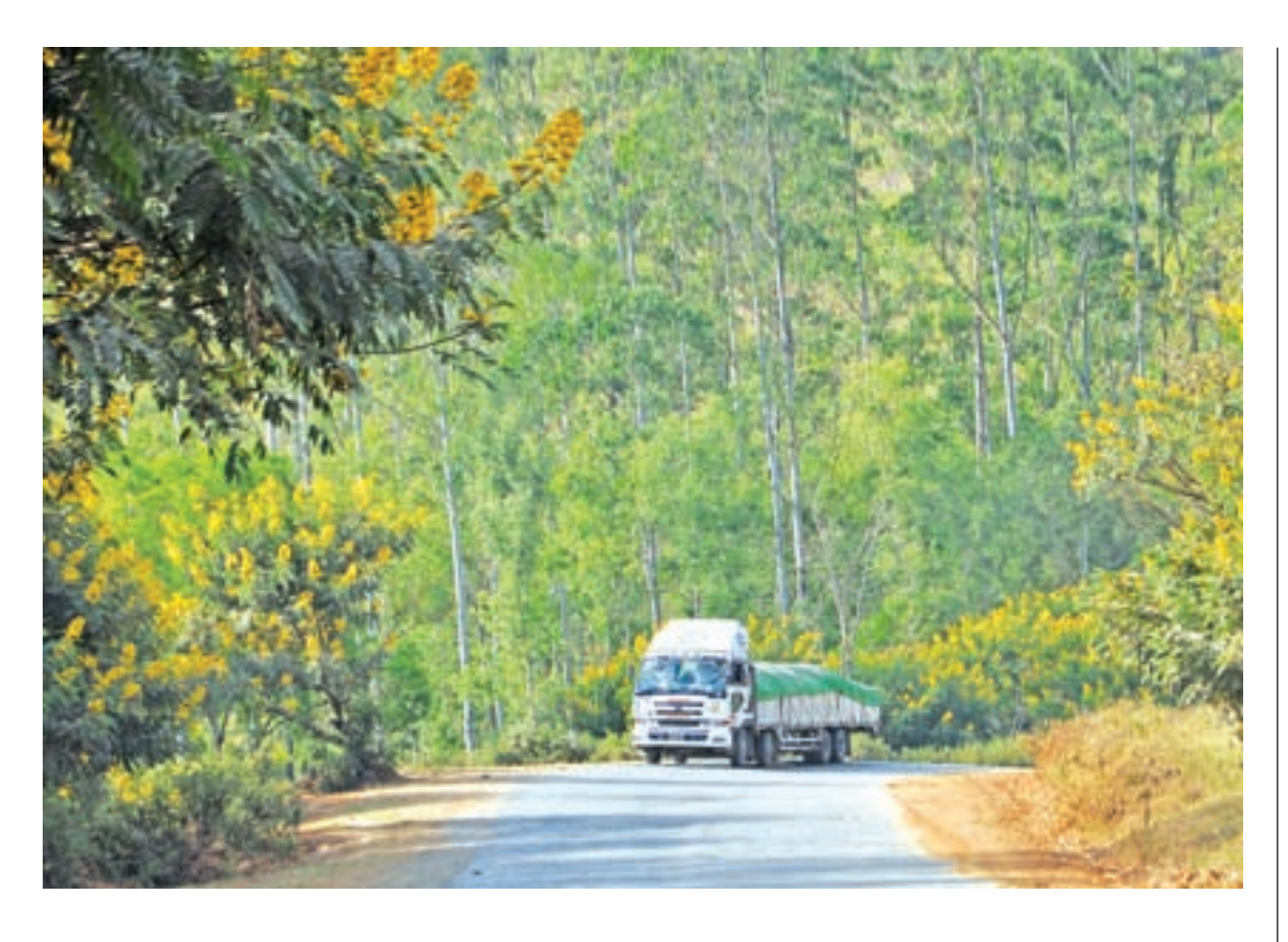
The border trade between Myanmar and its neighboring countries has gone up in the current fiscal year.