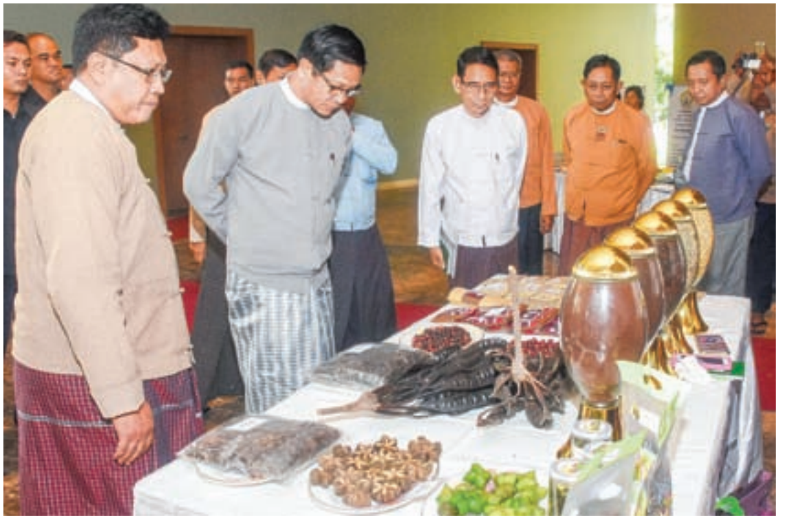
Vice President U Henry Van Thio at the Coffee Forum at the Thingaha Hotel in Nay Pyi Taw.

Dr Aung Thu, Union Minister for Agriculture, Livestock and Irrigation said, "In the period between 2018 to 2030, it is targeted to increase the coffee growing acreage up to 200,000, with 600,00 tonnes of high-quality