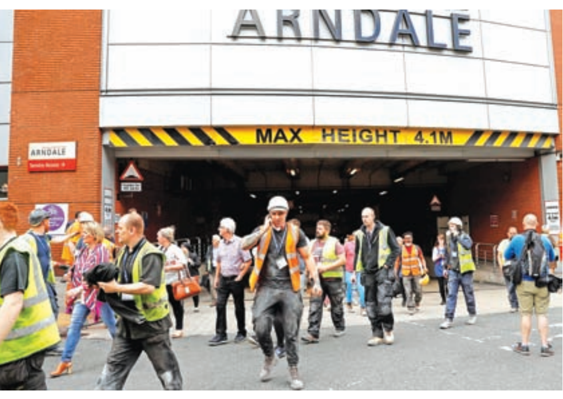
People rush out of the Arndale shopping centre as it is evacuated in Manchester, Britain on 23 May, 2017.

"All acts of terrorism are cowardly," she said. "But this attack stands out for its appalling sickening cowardice, deliberately targeting innocent, defenceless children and young people who should have been enjoying one of the most memorable nights of their lives."