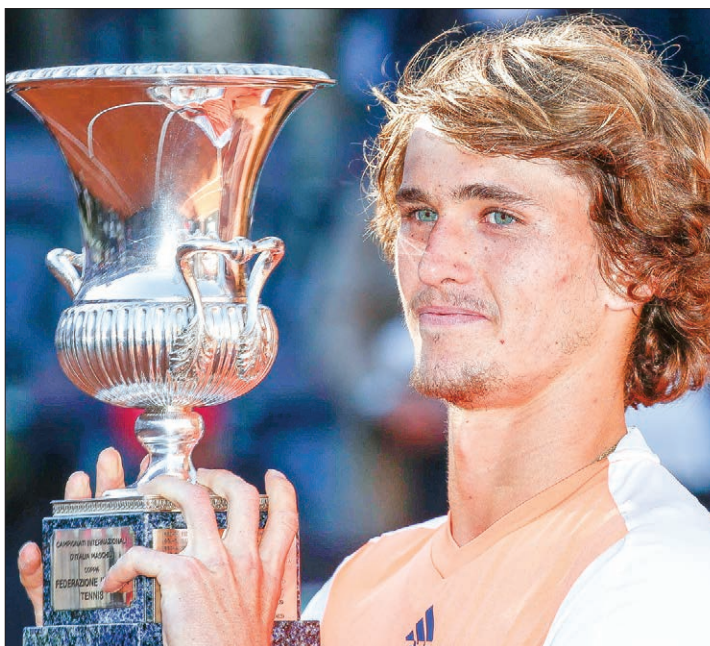
Zverev holds the trophy after his victory.

Djokovic, who has wrestled with injuries and lack of confidence since winning the French Open last June, had looked his old dominant self when he beat Dominic Thiem in Saturday's semi-final but was unable to recapture that form on Sunday. —Reuters ■