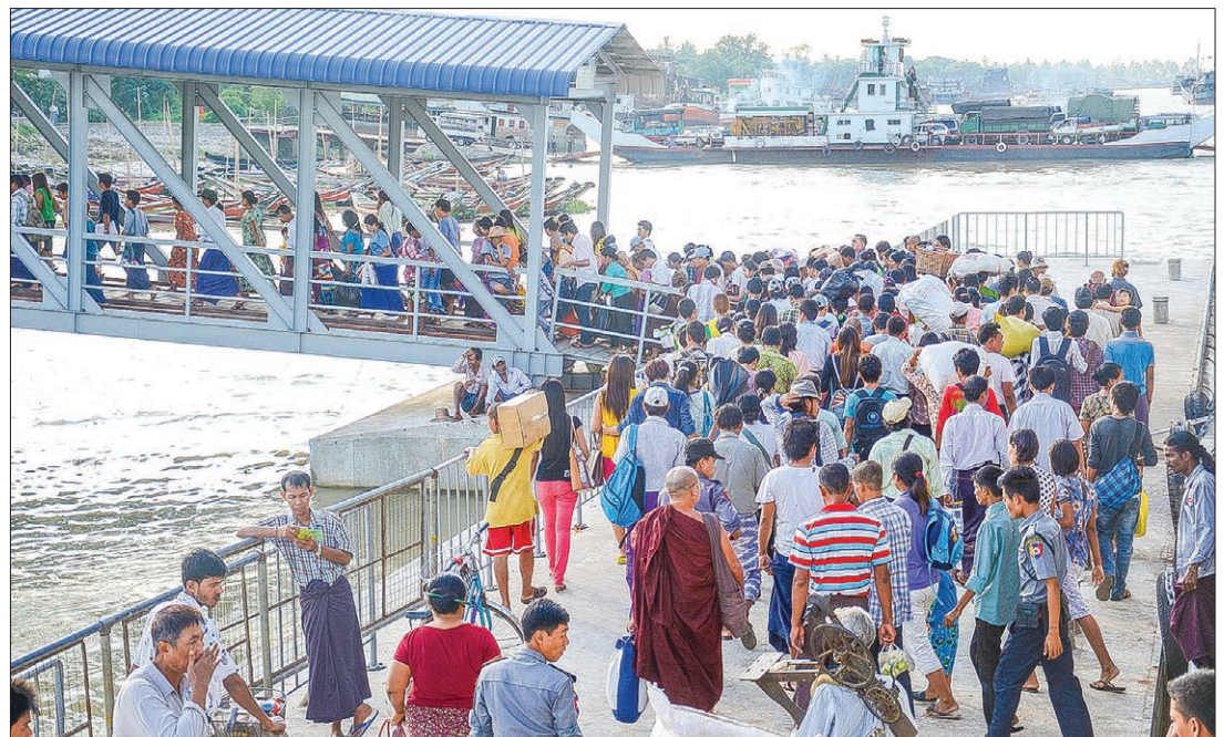
Passengers get off a ferry at the Dala Jetty, Yangon.

Township police force will take the responsibility to install the CCTV. At least four CCTV cameras will be installed to cover the whole areas of the port