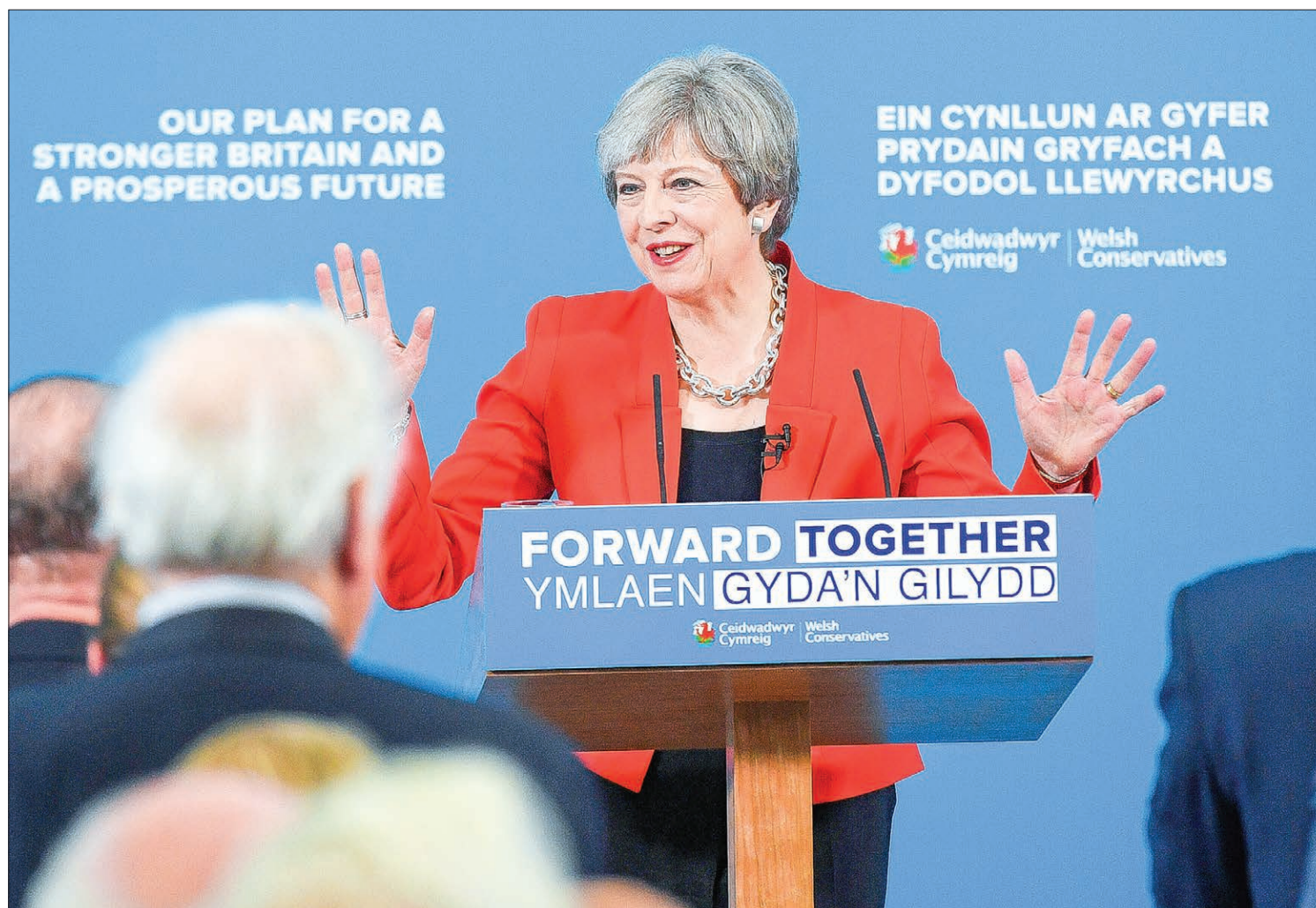
Britain's Prime Minister Theresa May speaks at an election campaign event in Wrexham, Wales on 22 May, 2017.

LONDON — British Prime Minister Theresa May is facing a much closer election after the lead held by her governing Conservative Party halved since she set out proposals to reduce financial support for some elderly voters, opinion polls showed.