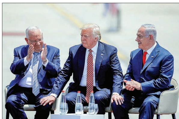
US President Donald Trump (C) sits next to Israel's Prime Minister Benjamin Netanyahu (R) and Israel's President Reuven Rivlin during a welcoming ceremony upon his arrival at Ben Gurion International Airport in Lod near Tel Aviv, Israel on 22 May, 2017.

"We have before us a rare opportunity to bring security and stability and peace to this region and its people, defeating terrorism and creating a future of harmony, prosperity and peace, but we can only get