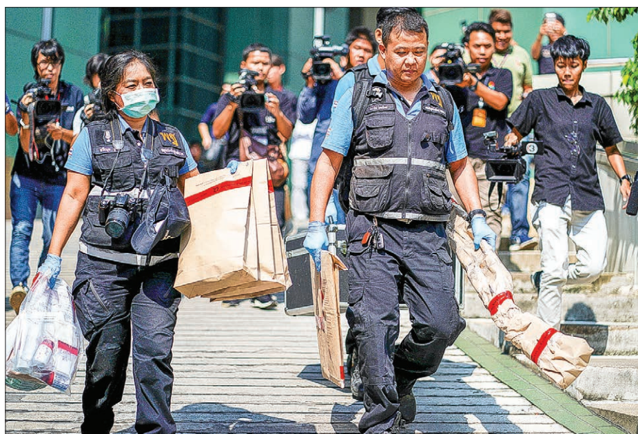
Thai forensic experts carry evidence as they leave from a site of bomb blast at the Phramongkutklo Hospital, in Bangkok, Thailand on 22 May, 2017.

The 22 May, 2014, military coup toppled a demo-