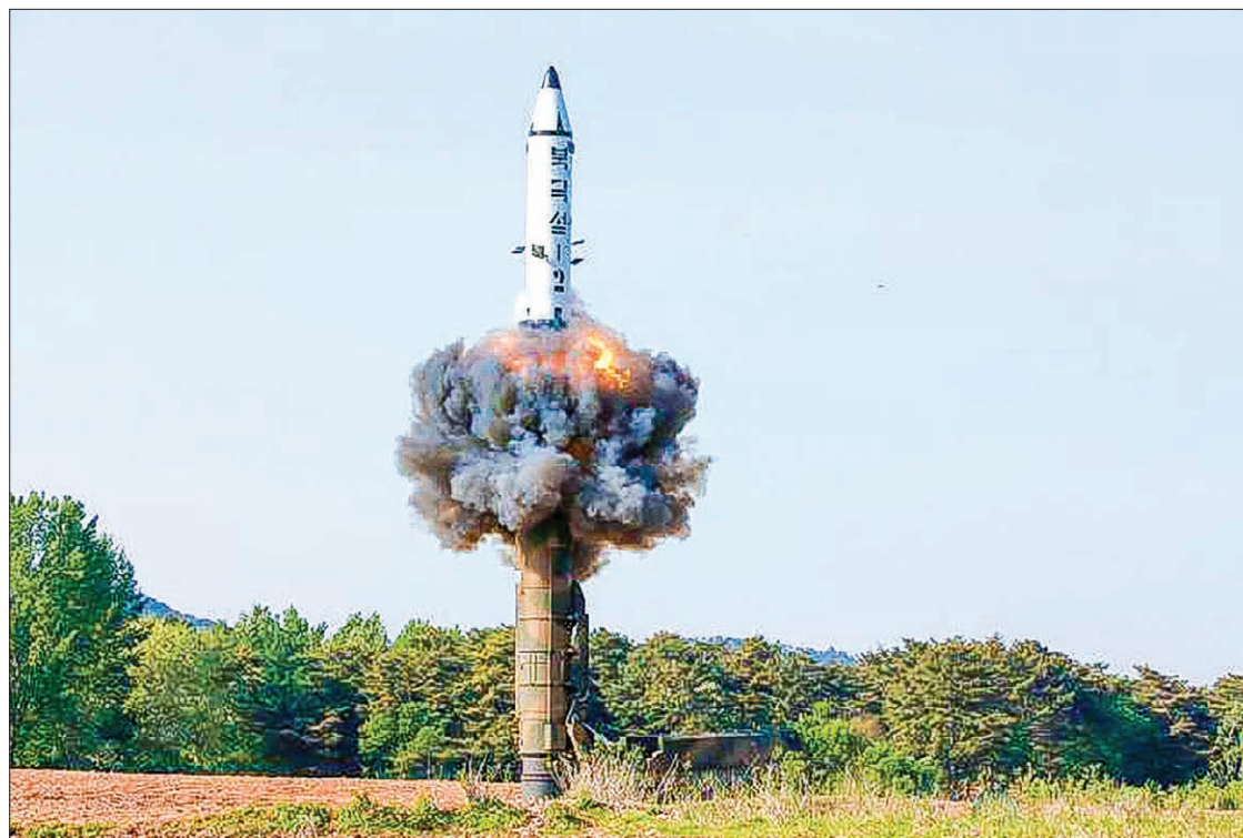
The scene of the intermediate-range ballistic missile Pukguksong-2's launch test in this undated photo released by North Korea's Korean Central News Agency (KCNA) on 22 May, 2017.

The UN Security Council is due to meet on Tuesday behind