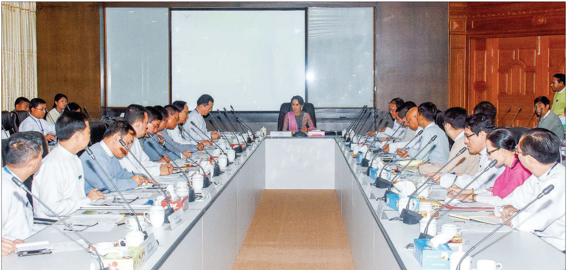
State Counsellor Daw Aung San Suu Kyi addresses the 1st Central Committee Meeting for hosting the 13th ASEM Foreign Ministers Meeting and related meetings.