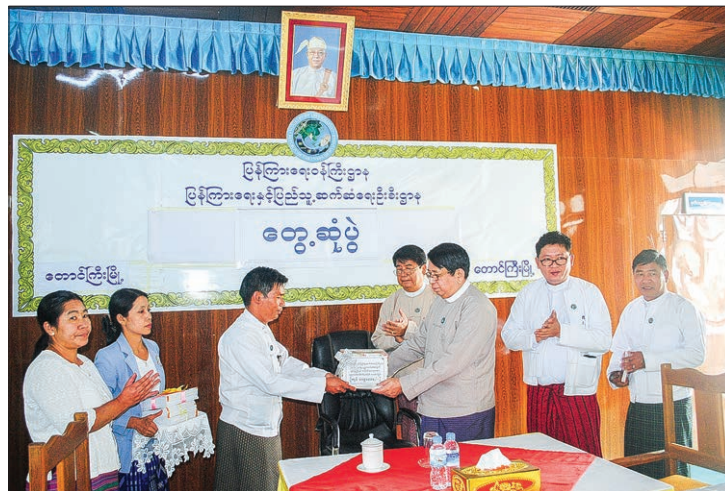
Union Minister Dr. Pe Myint confers financial assistance to staff at Taunggyi Information and Public Relations Department.

The Union Minister for Education Dr. Myo Thein Gyi suggested that components from previous literature festivals which proved to be popular should be included in the next literary festival. Equally important was providing security and travel expenses in an open,