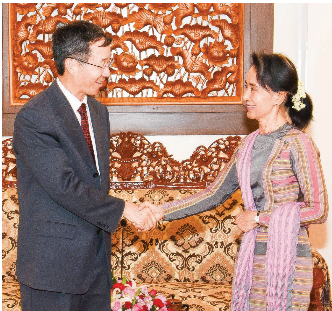
State Counsellor Daw Aung San Suu Kyi welcomes Chinese Special Envoy for Asia Affairs.