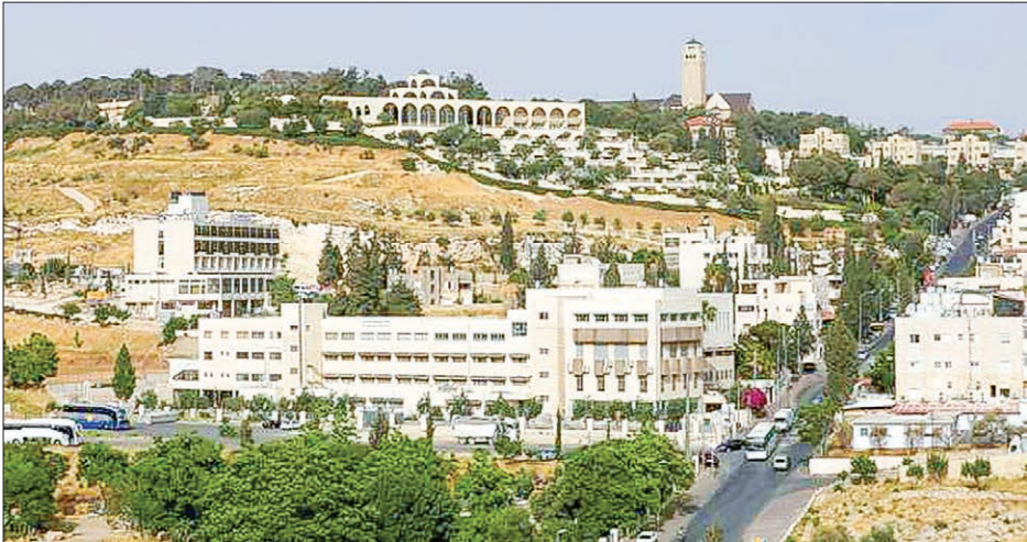
A general view shows the East Jerusalem neighbourhood of Wadi al-Joz in the foreground and Mount of Olives in the background on 14 May, 2017.

JERUSALEM — Israel will soon mark the 50th anniversary of the Six Day War, a conflict in which it captured the Old City of Jerusalem and more than two dozen Palestinian villages around it from Jordan, laying the foundations of a long-simmering dispute. According to the Jewish calendar, the anniversary falls on 24 May this year, even though the anniversary for most of the world will be on 5 June, when the war began in 1967.