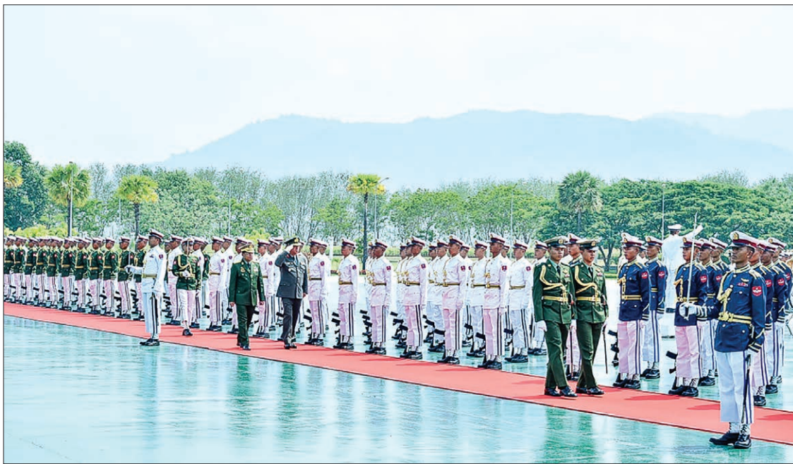
Commander-in-Chief Senior General Min Aung Hlaing (Left) and Chairman of Military Committee General Mikhail Kostarakos (Right) inspect the Honour Guard in Nay Pyi Taw.