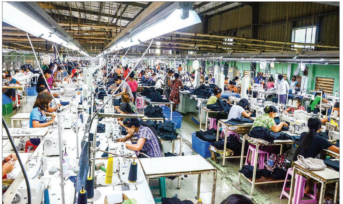
Employees work at a garment factory in Hlaingthaya, Yangon.

To stimulate investments in other industrial sectors other than the garment industry, DICA is discussing future processes together with state and