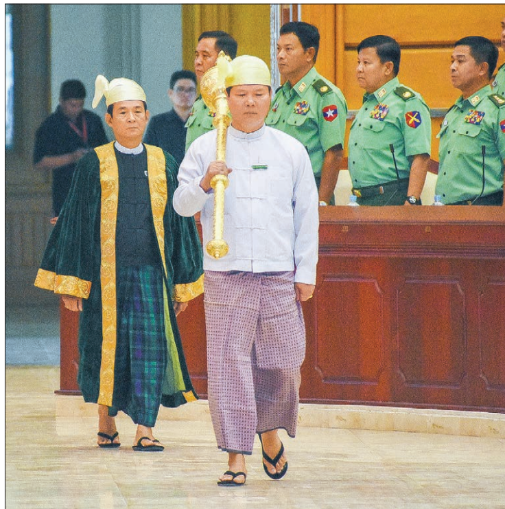
Speaker of Pyithu Hluttaw U Win Myint arrives at the meeting of 3 rd day Pyithu Hluttaw in Nay Pyi Taw.

U Toe Thaung of Mongmit constituency raised questions on plans to maintain bridge No. 5/24 at Kinchaung village, Mongmit Township, restoration of farmlands in Thit Saint Kon, Pe Kon and Nabu villages and removing of sand and mud in Kin Chaung to improve water flow. The deputy minister said the sand and mud removal in Kin Chaung is a huge undertaking requiring a large