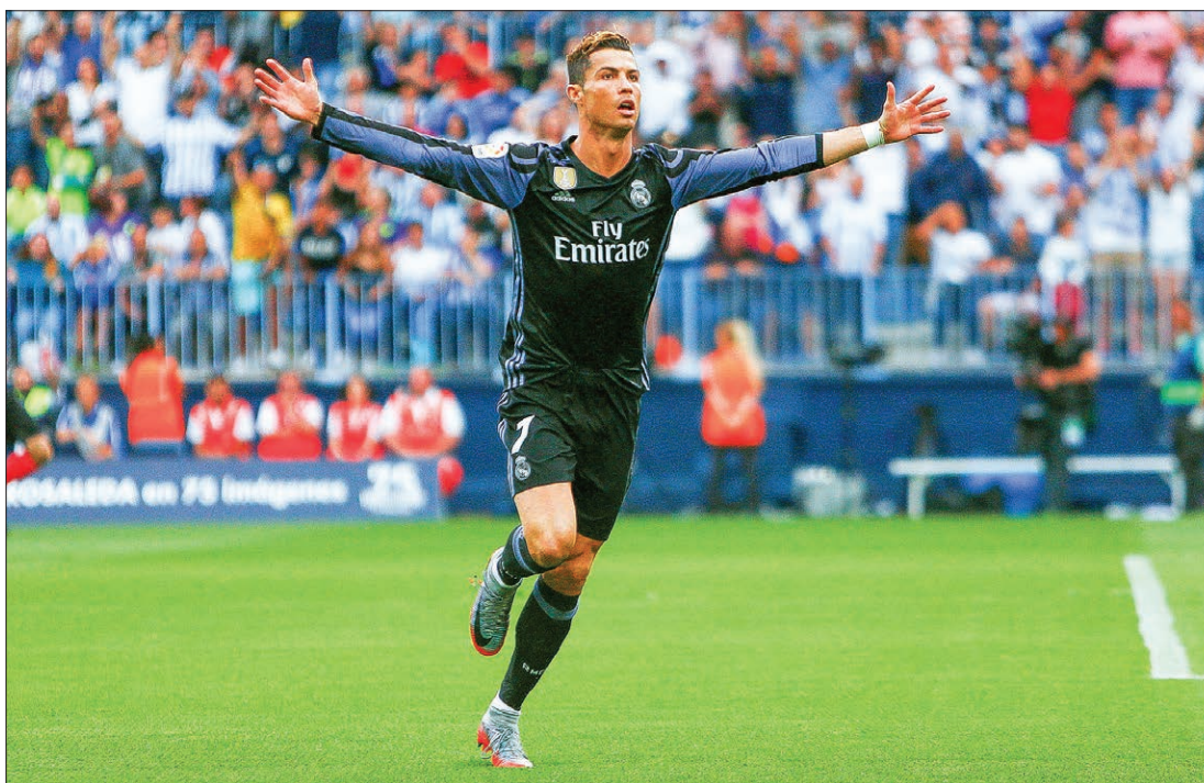
Real Madrid's Cristiano Ronaldo celebrates scoring their first goal during the Spanish Liga Santander between Real Madrid and Malaga at La Rosa Leda in Malaga, Spain on 21 May 2017.

Last year's champions Barcelona finished second on 90 points after coming from two goals down to beat Eibar 4-2 at home. —Reuters ■