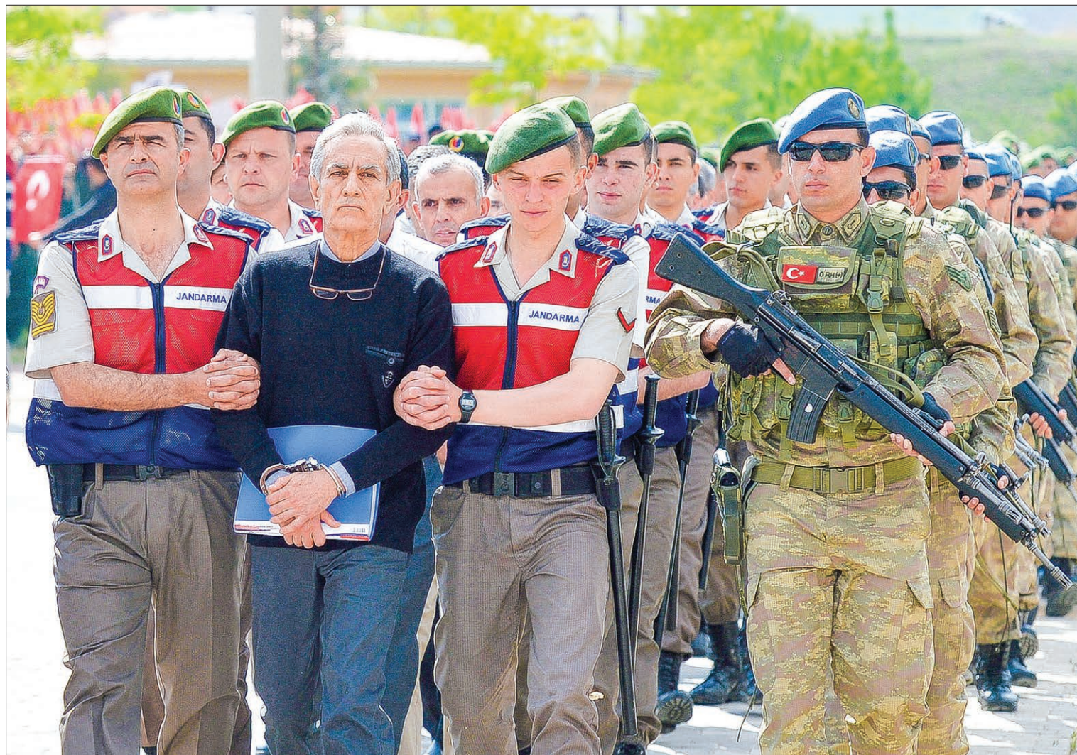
Akin Ozturk, a former Turkish Air Force commander who is accused of plotting and orchestrating last year's failed coup, is escorted by gendarmes as he arrives at the court in Ankara, Turkey on 22 May, 2017.

Erdogan blames Fetullah Gulen, a US-based cleric and a former ally, and his global network for orchestrating the coup, a charge Gulen denies. Turkish authorities have arrested nearly 50,000 people over alleged links