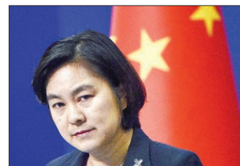
Chinese Foreign Ministry spokeswoman Hua Chunying speaks at a press conference in Beijing on 22 May, 2017.

The three men, who are in their 20s to 50s, arrived there in late March for hot spring development-related work. Since 2015, Chinese authorities have detained at least five other Japanese citizens for suspected spying.