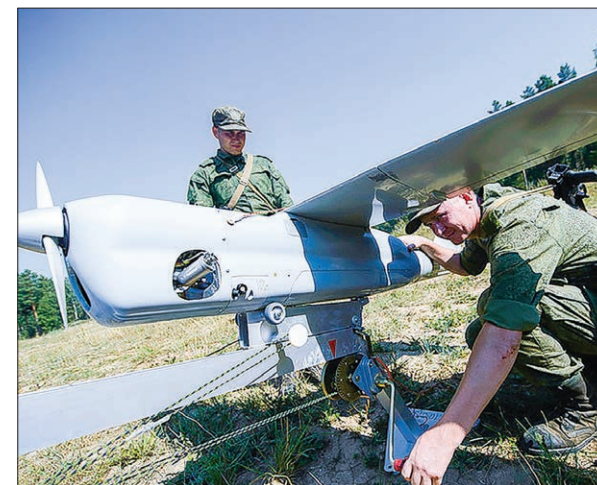
The Amur River formation headquarters conduct round-the-clock monitoring of the fire and flood situation in the area of deployment for a rapid response.