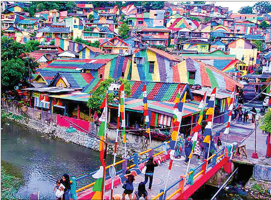
A view of colourful houses at the Kampung Pelangi village in Semarang, Indonesia, on 20 May, 2017 in this photo taken by Antara Foto.