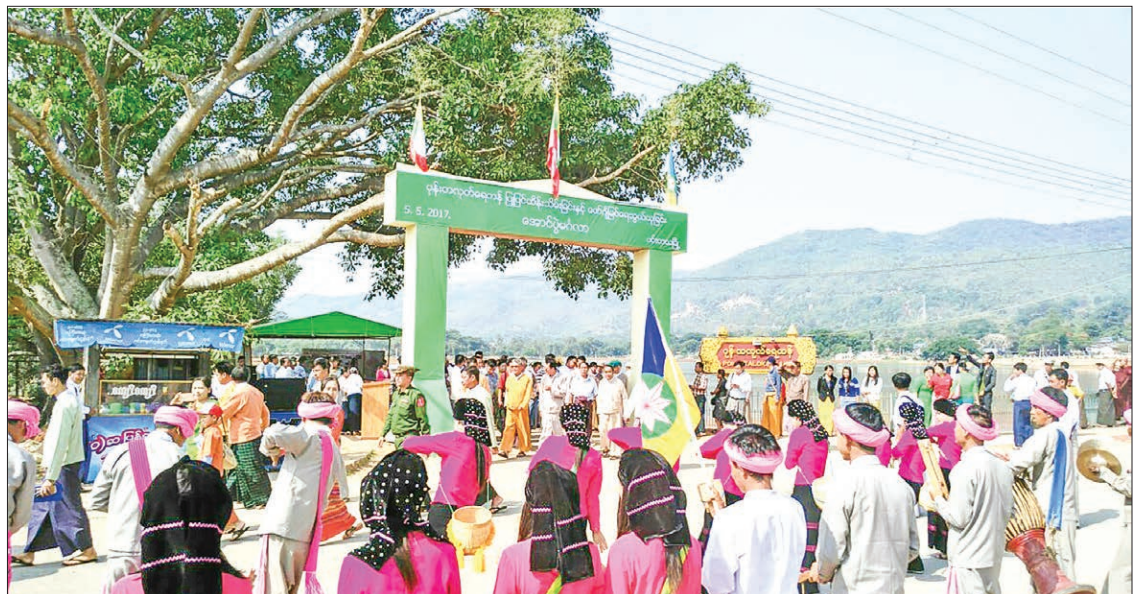
Local ethnic dance troupe performs at the ceremony to open the water supply facility for Pontaloke Lake.