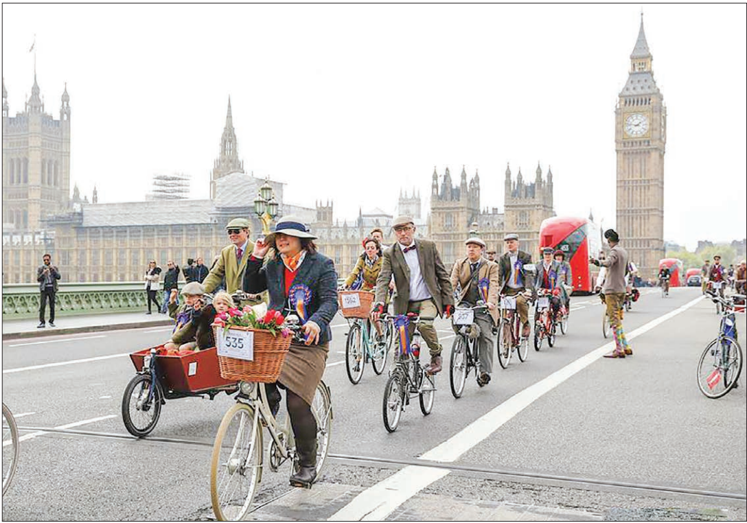
Cyclists wearing vintage clothings take part in the annual Tweed Run bicycle ride in London, Britain, on 6 May, 2017.

Of the 19 imperial family members, 14 are females, of whom half are unmarried. —Kyodo News ■