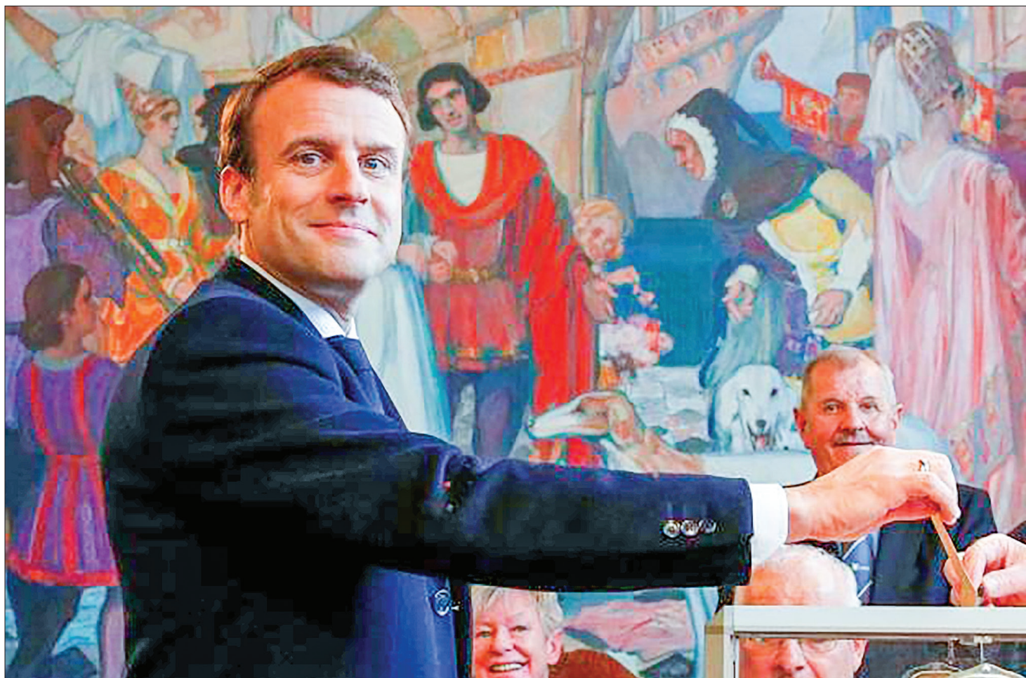
French presidential election candidate Emmanuel Macron, head of the political movement En Marche!, or Onwards!, casts his ballot to vote in the second round of 2017 French presidential election, at a polling station in Le Touquet, France, on 7 May 2017.