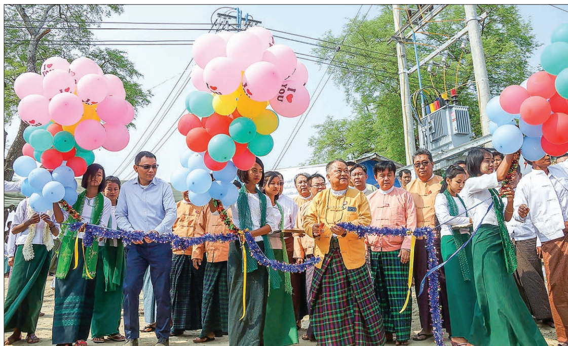
NLD Central Committee Member and spokesperson U Win Htein and officials formally open the two 11KV transformers in Se Kone village in Meiktila Township.

“The development of the electricity, infrastructure and transportation sectors of the country should be carried out not only by the government but also needs the strength of the public. The development processes will be quicker and more successful with the cooperation between