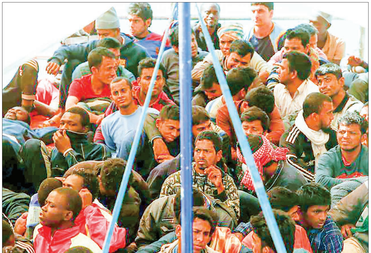
Migrants wait to disembark from the Malta-based NGO Migrant Offshore Aid Station (MOAS) ship Phoenix after it arrived with migrants and a corpse on board, in Catania on the island of Sicily, Italy, on 6 May 2017.

Pope Francis is set to meet US President Donald Trump on 24 May in a potentially awkward encounter given their opposing positions on immigration, refugees and climate change.—Reuters ■