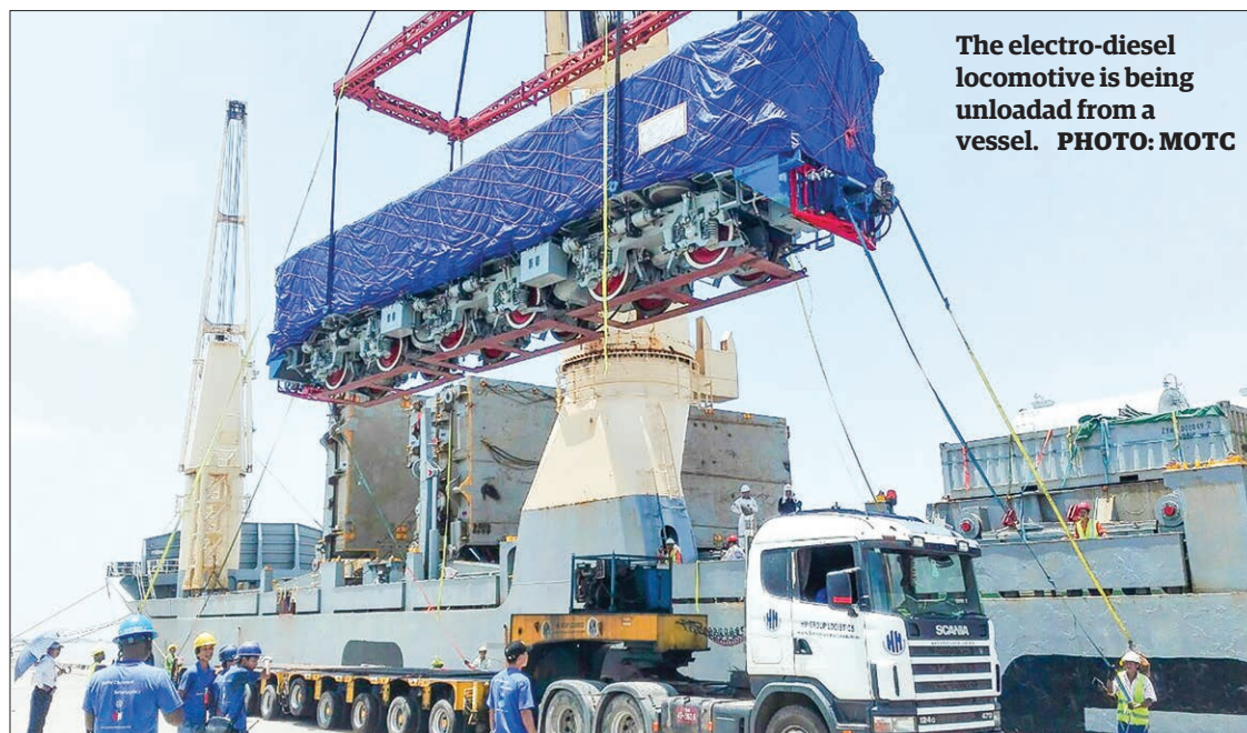
The electro-diesel locomotive is being unloaded from a vessel.

FIVE electro-diesel locomotives with 2000 HP purchased from China arrived at Thilawa Port on 1st May and are unloaded from ship on 6th May.