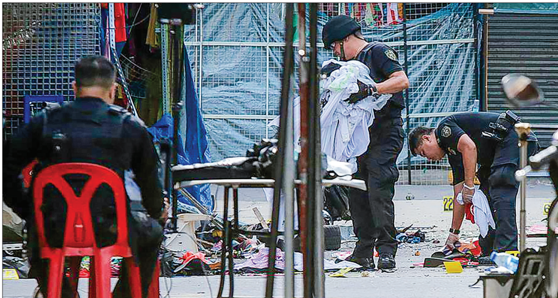
Policemen investigate the blast site in Manila, the Philippines, on 7 May 2017. Two people were killed and four others injured, including a policeman, in twin blasts that rocked Quiapo District in Manila on Saturday, police said.