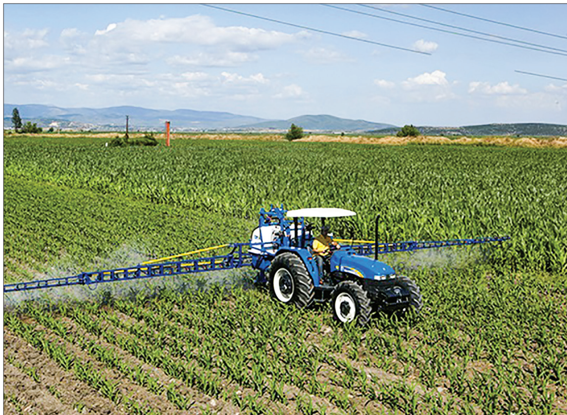
The agreement is part of the government's initiative to usher in agricultural mechanization in Myanmar.