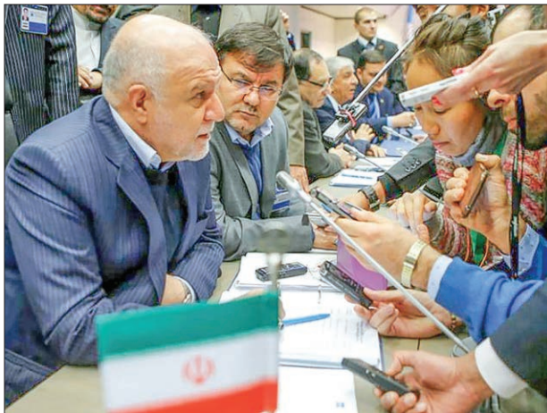
Iran's Oil Minister Bijan Zanganeh talks to journalists during a meeting of the Organization of the Petroleum Exporting Countries (OPEC) in Vienna, Austria, on 30 November 2016.