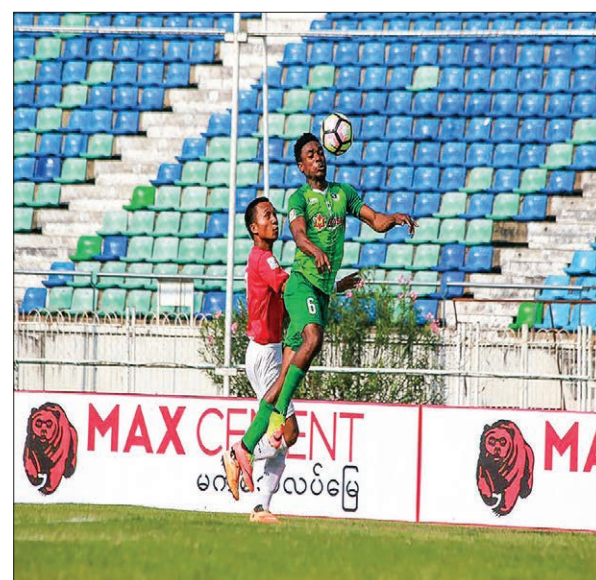
The Chin United player tries to head the ball during the match.