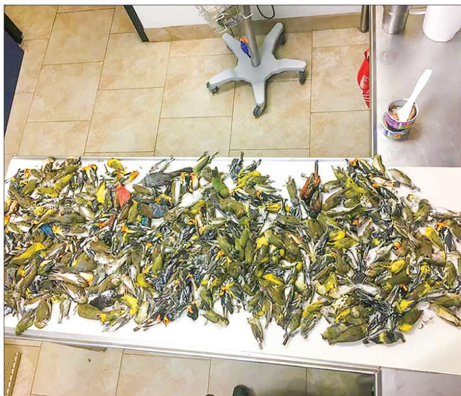
Some of the nearly 400 dead birds which crashed into the American National Building are shown in Galveston, Texas, US, on 4 May 2017.