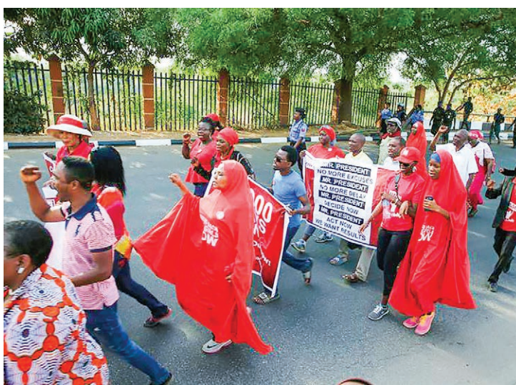
Members of the #BringBackOurGirls campaign rally in Nigeria's capital Abuja to mark 1,000 days since over 200 schoolgirls were kidnapped from their secondary school in Chibok by Islamist sect Boko Haram, Nigeria, on 8 January 2017.

President Muhammadu Buhari will receive the girls