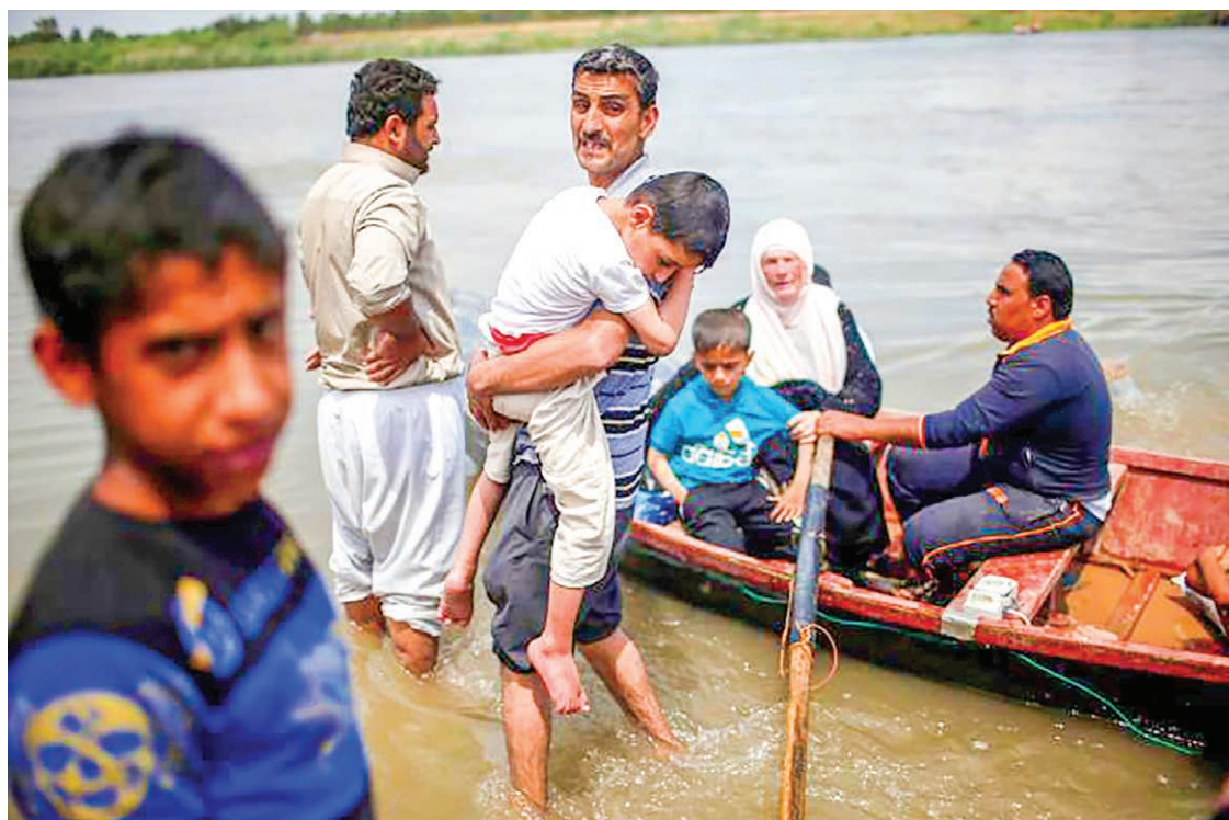
Displaced Iraqis react before crossing the Tigris River by boat after the bridge has been temporarily closed, in western Mosul, Iraq, on 6 May 2017.

Loading up everything from clothes and food to injured or dead relatives, hundreds of families exhausted by war have been crossing the river on small, rickety fishing boats capable of