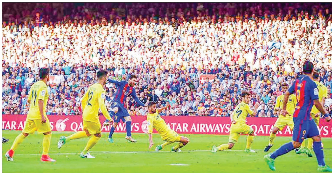
Barcelona's Lionel Messi scores a goal.

"We've got difficult games to come but we're very good, we have 24 players that always want to play and we need to keep going like this and go for the league title."