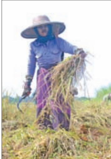
A farmer harvests paddy crop from a field in Kangyidauk, Ayeyawady.

Under its lending rules, the ministry will grant agricultural loans for monsoon crops to farmers who have no more than ten acres of paddy. A total of Ks1400 billion was lent to those