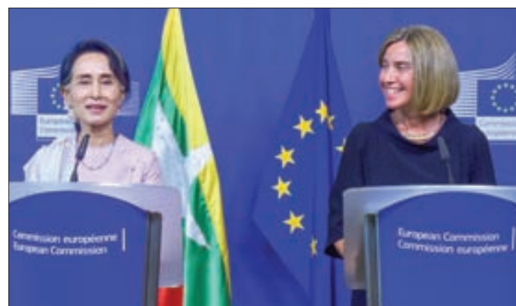
Daw Aung San Suu Kyi gives a press conference with European Union foreign policy chief Federica Mogherini in Brussels.

sion from the United Nations should look into alleged human rights abuses by Myanmar security forces against members of the Muslim community in Rakhine State.