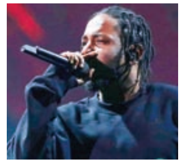
Kendrick Lamar.

The last WGA strike, in 2007/8, went on for 100 days. TV networks broadcast re-runs and more reality shows, while the cost to the California economy was estimated at $2.1 billion, according to the Milken Institute.—Reuters ■