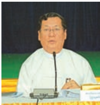
U Thein Swe, Union Minister for Labour, Immigration and Population.

Afterwards, responsible officials answered questions raised