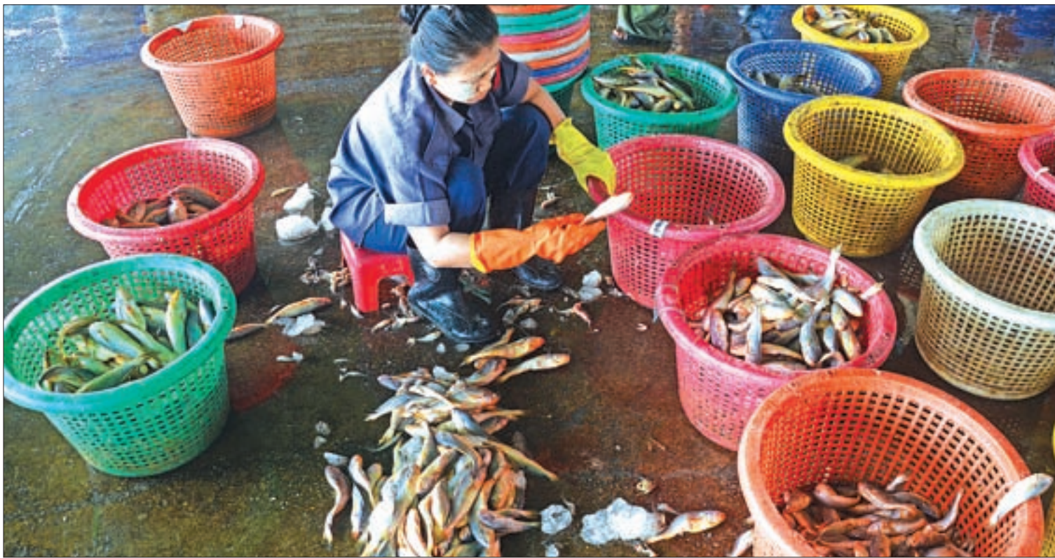
Worker sorts fish to sell at Nyaung Tan jetty in Pazundaung Township, Yangon Region.