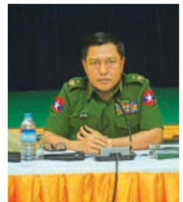
Maj-Gen Soe Naing Oo, Spokesperson of the Tatmadaw.