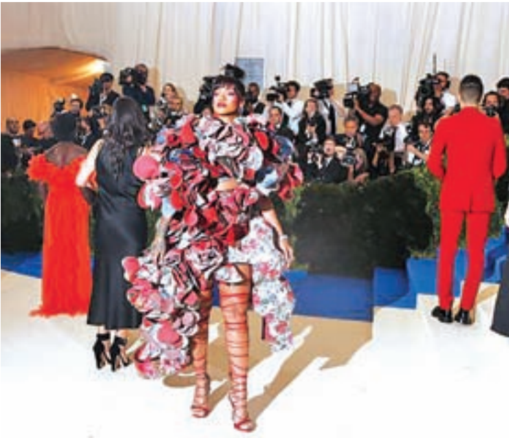
Rihanna.