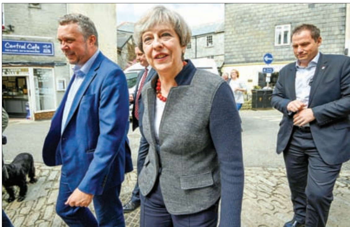
Britain's Prime Minister Theresa May walks during a campaign stop in Mevagissey, Cornwall on 2 May, 2017.