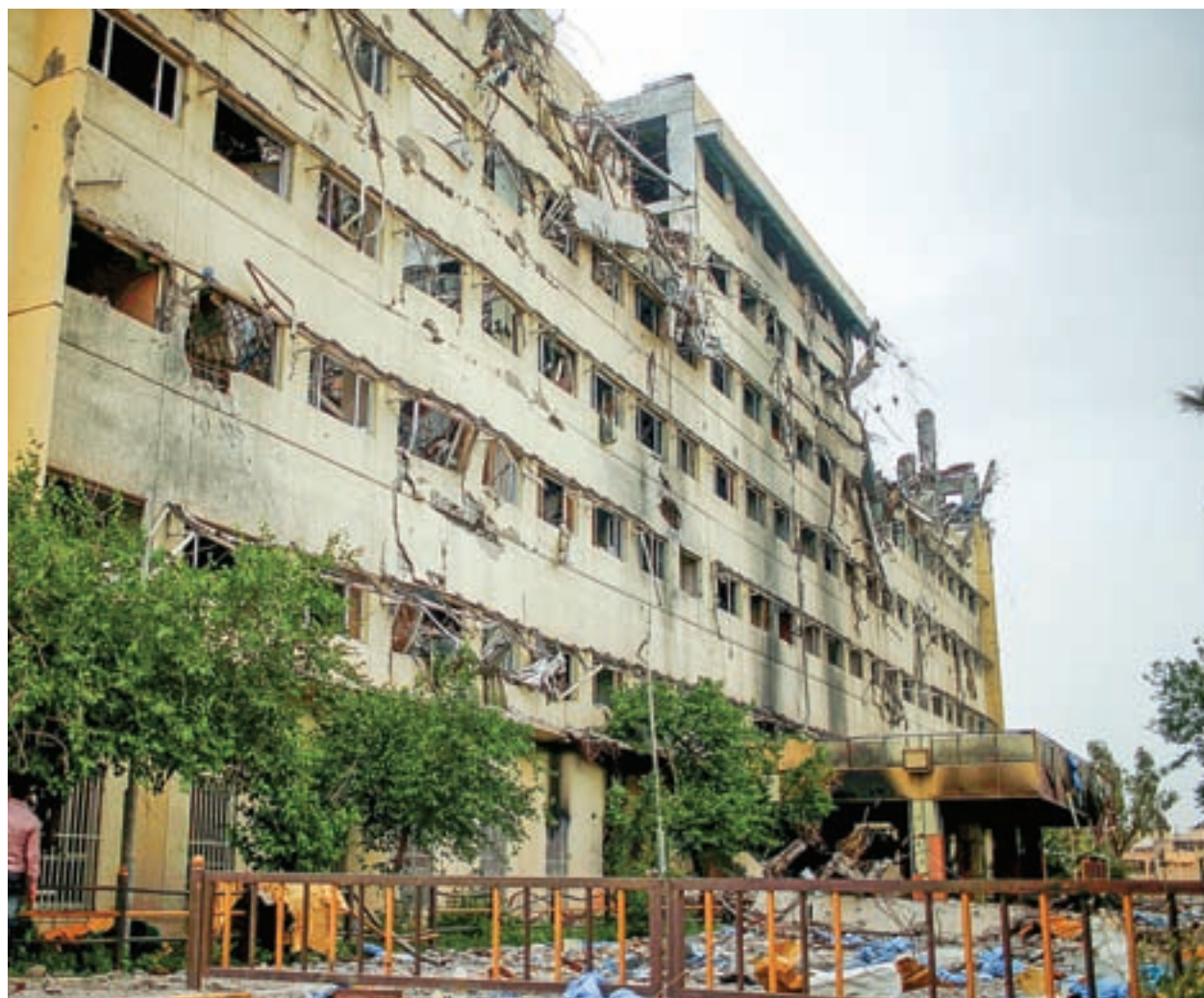
Al-Salam hospital is seen after it was destroyed during the fighting between Iraqi forces and Islamic State militants east of Mosul, Iraq on 2 May, 2017.

However, those efforts are expensive. OBP estimated the total cost of counter-piracy operations in the western Indian Ocean at $1.7 billion last year. —Reuters ■