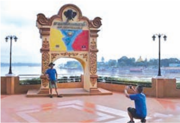
Beautiful landscape at the border of Laos, Myanmar and Thailand.