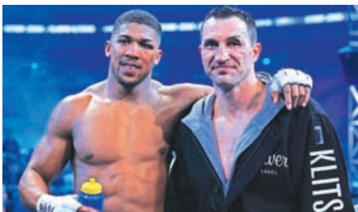
Anthony Joshua and Wladimir Klitschko.

"I think he will want to fight again, because a fighter is the last one to know when to stop. But I think the team around him, his