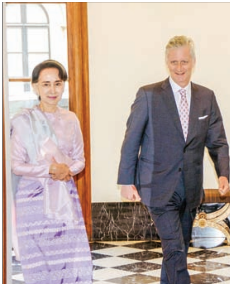
State Counsellor Daw Aung San Suu Kyi and King Philippe enter the King's Palace in Brussels.

Also present at the meetings were Minister of State for Foreign Affairs U Kyaw Tin, Myanmar Ambassador to Belgium U Paw Lwin Sein, Director-Gen-