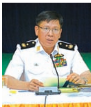
Deputy Minister for Defence Rear-Admiral Myint Nwe.