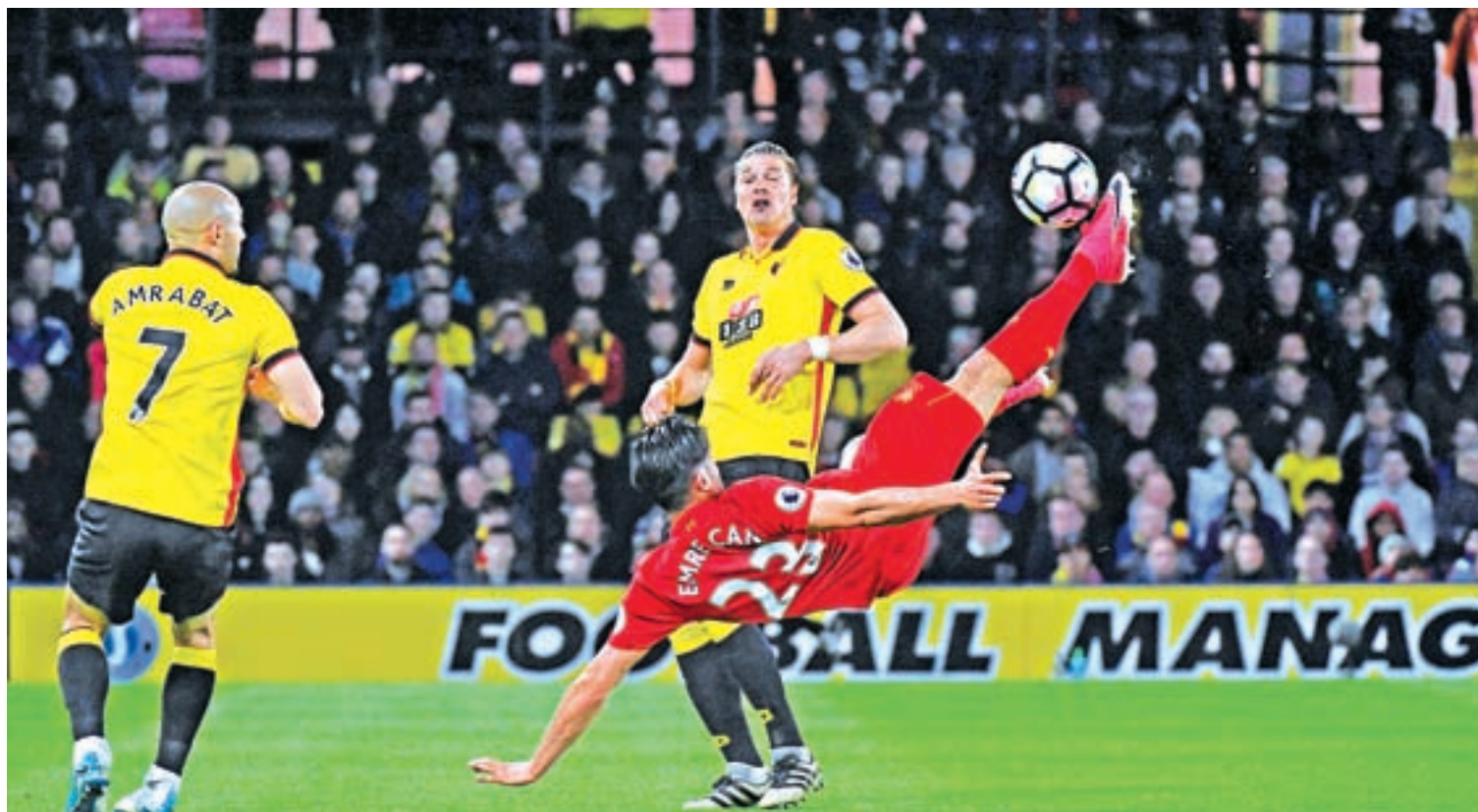
Liverpool's Emre Can scores their first goal during the Premier League between Liverpool and Watford at Vicarage Road on 1 May, 2017.