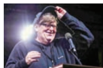
Michael Moore.

The 12-week limited run will see the liberal Moore, 63, use his satirical humor to target Wash-