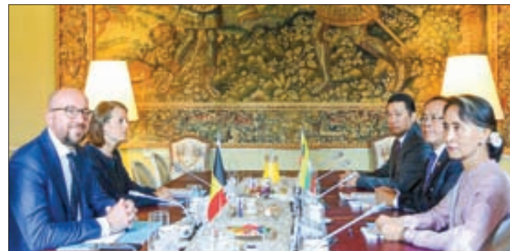
Daw Aung San Suu Kyi holds talks with Prime Minister of Belgium Mr. Charles Michel.

Following the luncheon, they held a joint press conference at the EU Commission building, during which Daw Aung San Suu Kyi and Mrs. Mogherini, the EU's top diplomat, disagreed on whether an international mis-