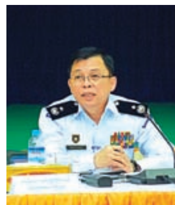
U Myint Kyaing, Permanent Secretary of the Labour, Immigration & Population.