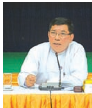
U Myo Aung, Permanent Secretary of the Ministry of Labour, Immigration & Population.