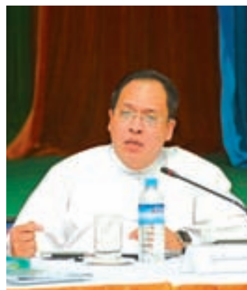
U Set Aung, Vice-Governor of the Central Bank of Myanmar at the press conference held on May 2.

"Out of US$100 million from the World Bank, $25 million will be used for the Central Bank, with the remaining 75 million to be used by Ministry of Planning and Finance. Monetary System of Myanmar will be upgraded with the loan. By doing so, the monetary