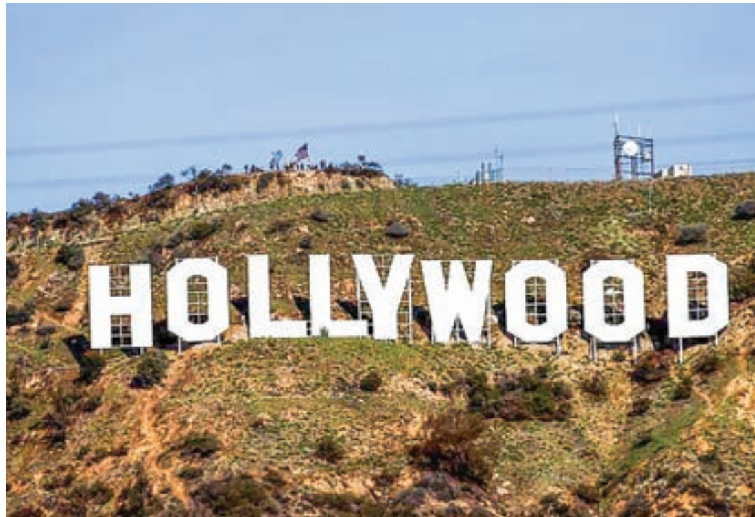
A view shows the “iconic ‘Hollywood’ sign overlooking Southern California’s film-and-television hub in the Hollywood Hills in Los Angeles, California, US, on 1 January 2017.

“T-shirts are printed. Signs are ready to go. Hope we don’t need them,” tweeted David Slack, a writer on CBS shows “Person of