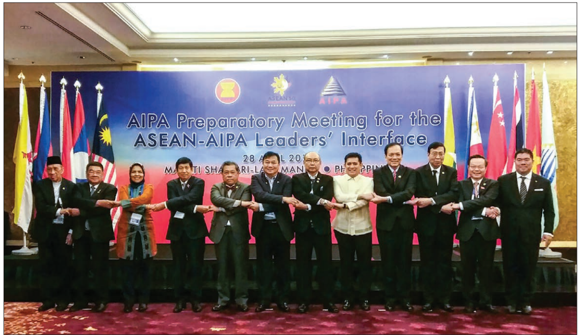
Speakers of parliaments of ASEAN countries join hands as they pose for photo.