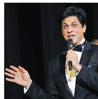
Shah Rukh Khan.

"I put that cat in his hands. It was the studio cat. It was one take," said Coppola.—Reuters ■