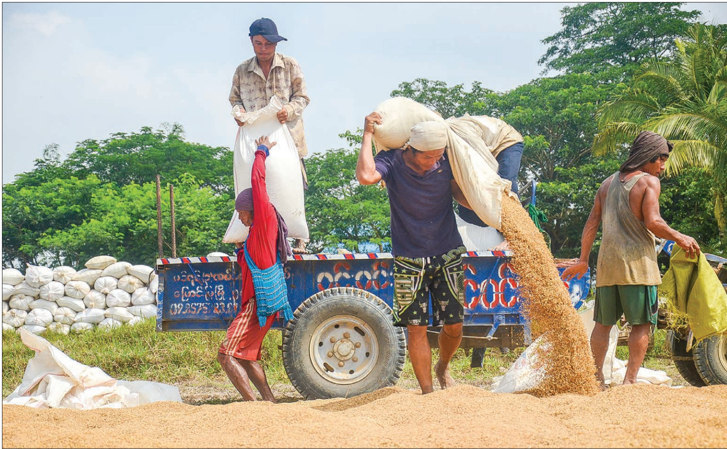
Myanmar farmers harvest rice in Kangyidauk in Ayeyarwady delta.