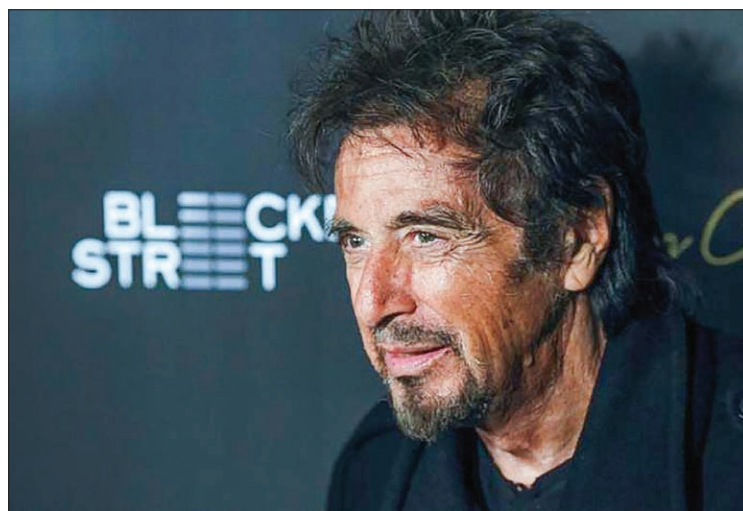
Actor Al Pacino attends the 'Danny Collins' premiere at AMC Lincoln Square Theater in New York on 18 March, 2015.

But the film had a less than auspicious start. Coppola re-