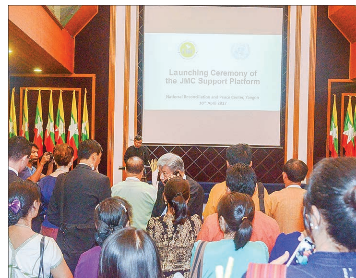
Launching of the JMC Support Platform at the National Reconciliation and Peace Centre in Yangon.

Later in the evening, the Senior General and party flew from Frankfurt International Airport, Germany. —Myanmar News Agency ■