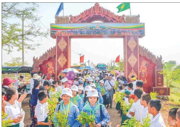
Luyechun students arrive Bagan on 30 April.

At BEHS (1) of Nyaungshwe yesterday morning, two experts gave talks titled “Climate Change and Environmental Conservation” and “Agricultural development and tasks carried out by the department for the long-term preservation of Inle Lake” separately. Old outstanding student (Luyechun) shared their knowledge and experience to the younger students. At the Pale Ngwesaung resort hotel in Ngwesaung, old outstanding