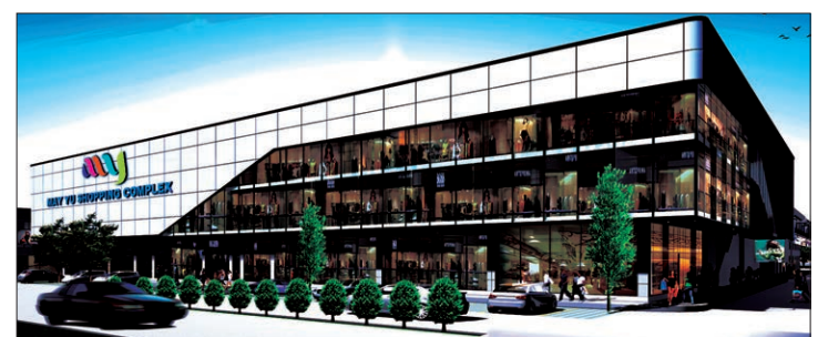
Scale model of Mayyu Market.

The market complex is three-acres wide and will house government and public banks. Shops will also be constructed in the market compound. The