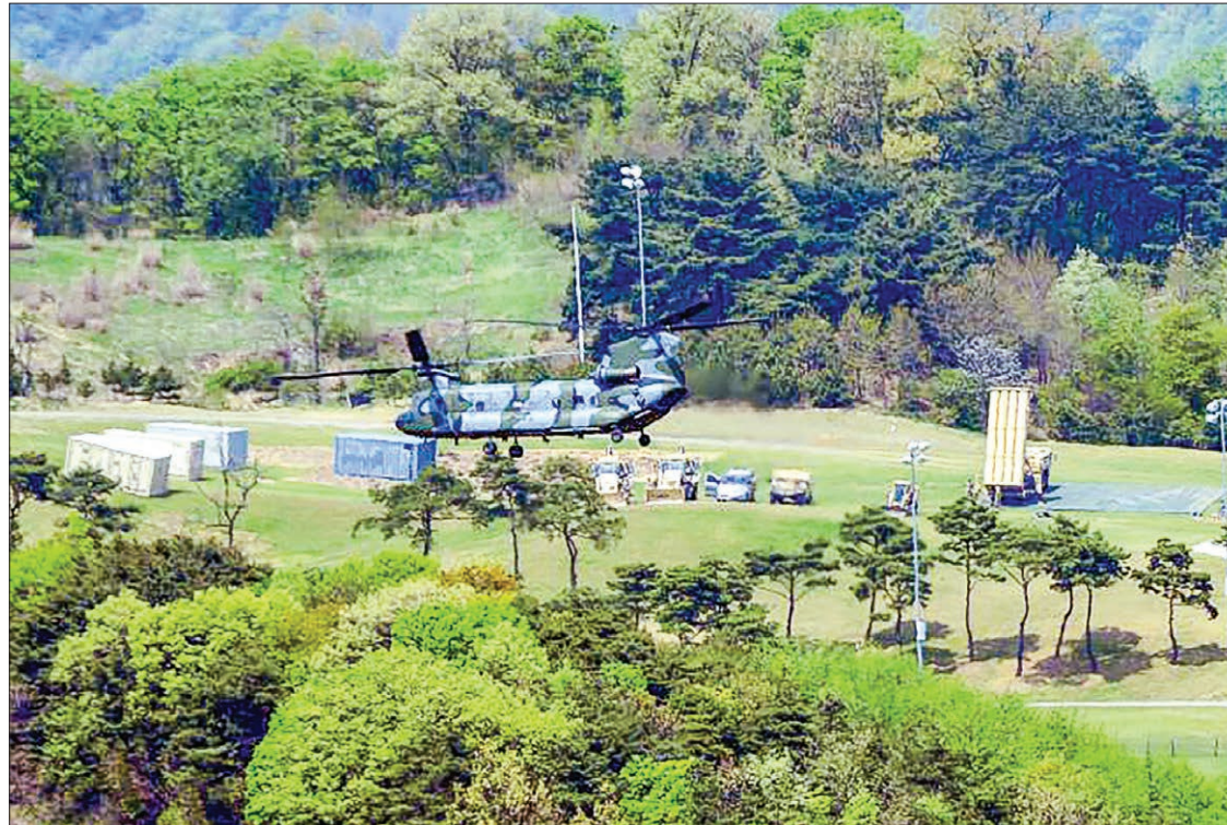
A Terminal High Altitude Area Defense (THAAD) interceptor (R) is seen in Seongju, South Korea on 26 April, 2017.

Trump's comments in an interview with Reuters on Thursday that he wanted Seoul