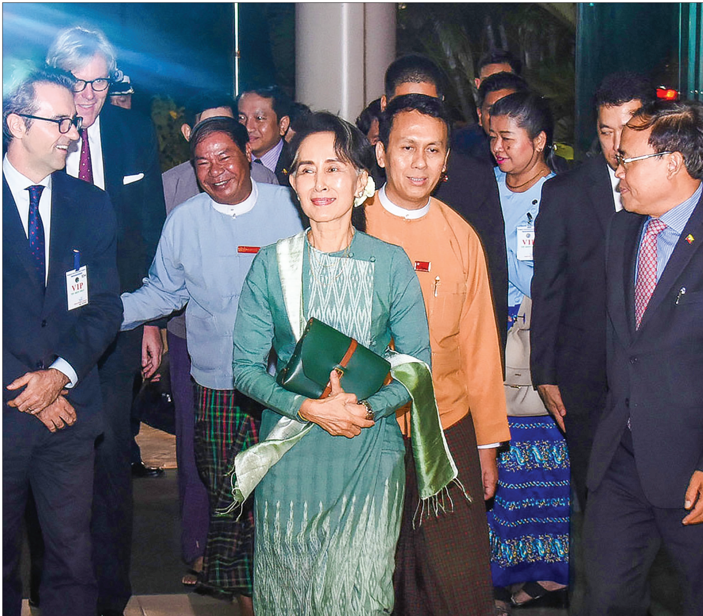
State Counsellor Daw Aung San Suu Kyi is seen off by diplomats and officials at Yangon International Airport.