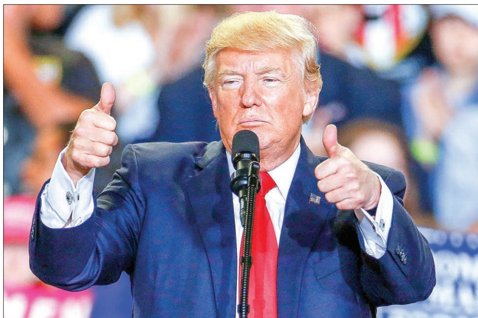
US President Donald Trump appears on stage at a rally in Harrisburg, Pennsylvania, US on 29 April, 2017.

The rally occurred on the same day as a climate march at which thousands of protesters surrounded the White House, and it also coincided with the annual black-tie White House