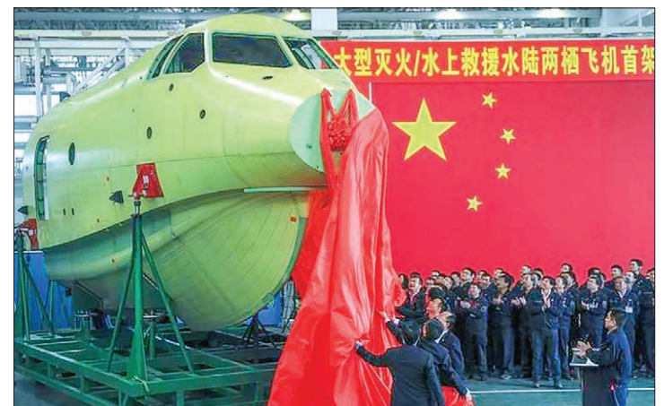
Officials of Aviation Industry Corporation of China (AVIC) unveil the newly-made nose of amphibious aircraft AG600, during a ceremony at a factory in Chengdu, Sichuan province on 17 March, 2015.

The seaplane's maiden flight comes amid China's increasing assertiveness to its territorial claims in the disputed South China Sea where it is building airfields and deploying military equipment, rattling nerves in the Asia-Pacific region and the United States.