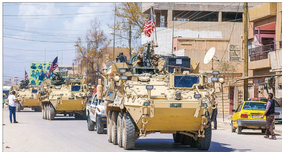
US military vehicles travel in the northeastern city of Qamishli, Syria on 29 April, 2017.

The jihadist group still controls large swathes of Syria's Euphrates basin and its vast eastern deserts near the border with Iraq, but it has lost large tracts of its territory over the past year and many of its leaders have been killed.—Reuters ■