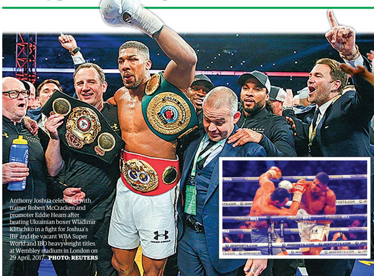
Anthony Joshua celebrates with trainer Robert McCracken and promoter Eddie Hearn after beating Ukrainian boxer Wladimir Klitschko in a fight for Joshua's IBF and the vacant WBA Super World and IBO heavyweight titles at Wembley stadium in London on 29 April, 2017.