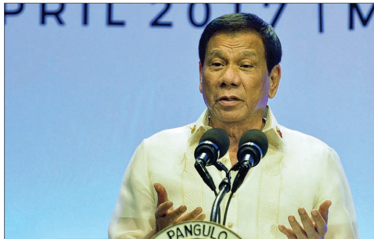
Philippine President Rodrigo Duterte holds a press conference in Manila on 29 April, 2017, following a one-day summit there of the Association of Southeast Asian Nations.

The leaders urged North Korea to "immediately comply fully with its obligations arising from all relevant UN Security Council resolutions and stressed the importance of exercising self-restraint in the interest of maintaining peace, security and stability in the region and the world."