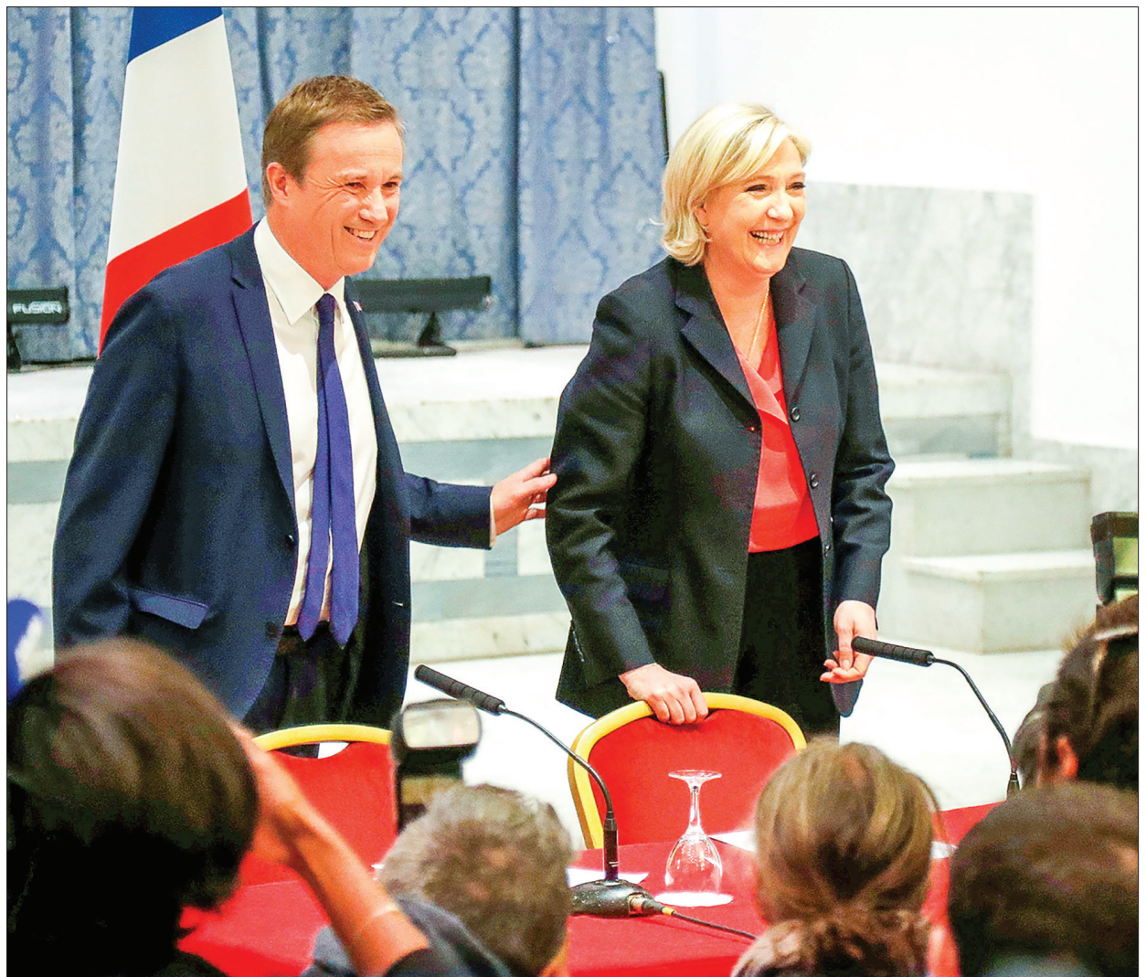
Marine Le Pen French National Front (FN) political party leader and candidate for French 2017 presidential election and Debout La France group former candidate Nicolas Dupont-Aignan attend a news conference in Paris, France, on 29 April, 2017.