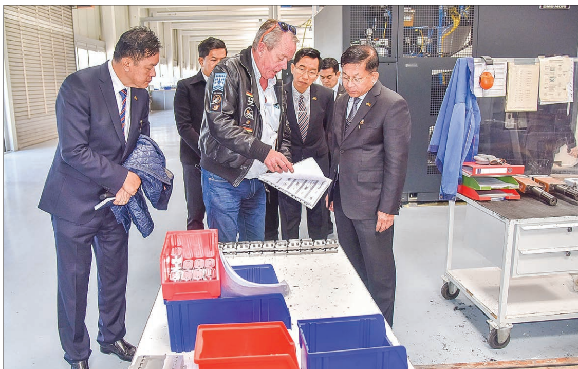
Senior General Min Aung Hlaing visits GROB Aircraft Company in Memmingen.