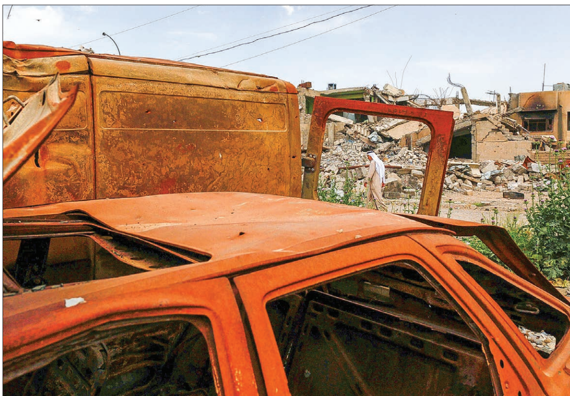
An Iraqi man walks past buildings and cars which were destroyed during fighting between Iraqi forces and Islamic State fighters in eastern Mosul, Iraq on 30 April, 2017.

News of the US casualty came as US President Donald Trump marked his first 100 days in office. During last year's presidential election campaign, Trump vowed to give priority to destroying Islamic State, which operates mostly in Syria and Iraq.—Reuters ■