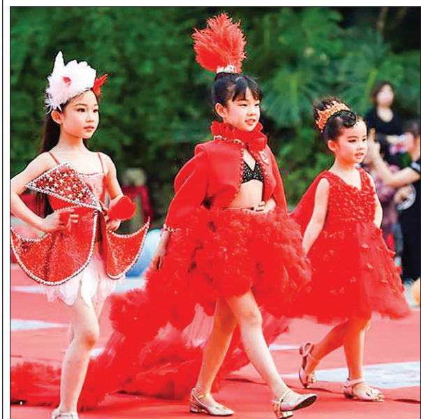
A child presents a creation during a Child Model Show in Fuzhou, capital of southeast China's Fujian Province, on 30 April 2017.

area of the network to explore, while making time to experience the local food and culture along the way. "It took us something like 10 days to do every single line in Hokkaido," Dibben said. "You're up against only a handful of trains a day on some lines, so you have to work around the timetable." To date, they have ridden on around one hundred minor railways. In the early years, the JRS organized trips with tour companies to visit Japan, but certain train lines were not made for big crowds. Smaller railways pose a logistical nightmare. "There are a lot of very small railways in Japan, and taking 30 odd people on a single coach train is probably not a good idea," Dibben pointed out. While the JRS continues to arrange bigger tours to Japan every few years, with a group of enthusiasts dedicated to smaller, local lines, they started informally organizing holidays together. Their first trip was in 2008, with the first focused trip of an area to the Tohoku region coming in 2009. They have since been to the northernmost station in Japan in Wakkanai, Hokkaido, down to Kyushu in southwestern Japan, with journeys to places like the last stop on a local line that is served by just three single carriage services a day. On the day they were traveling, one of the morning trains had been canceled.—Kyodo News ■