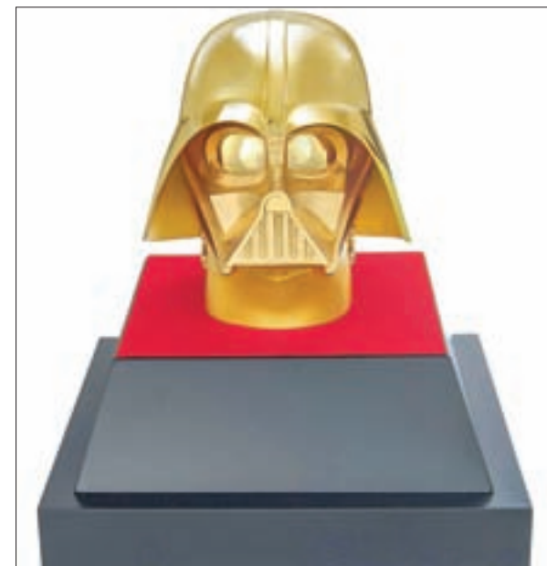
Supplied photo shows a pure gold replica of the mask and helmet worn by Darth Vader, a character in the Star Wars film series. Tanaka Kikinzoku Jewelry KK, a jeweler in Tokyo, will put on sale the life-size representation for 154 million yen ($1.4 million) on 4 May, or Star Wars Day, to commemorate the 40th anniversary of the release of "Star Wars," the sci-fi franchise's first film.

The plaque's suggested sale price is 1.22 million yen ($11,000). The coins bear designs associated with the film series and the number "1977525," indicating on 25 May, 1977, the date of the first film's release. Tanaka Kikinzoku will sell only 77 copies of the plaque. —Kyodo News