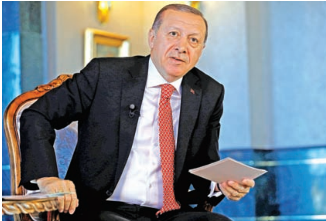
Turkish President Tayyip Erdogan attends an interview with Reuters at the Presidential Palace in Ankara, Turkey on 25 April, 2017.

“If they are not acting sincerely we have to find a way out. Why should we wait any longer? We are talking about 54 years,” he said.