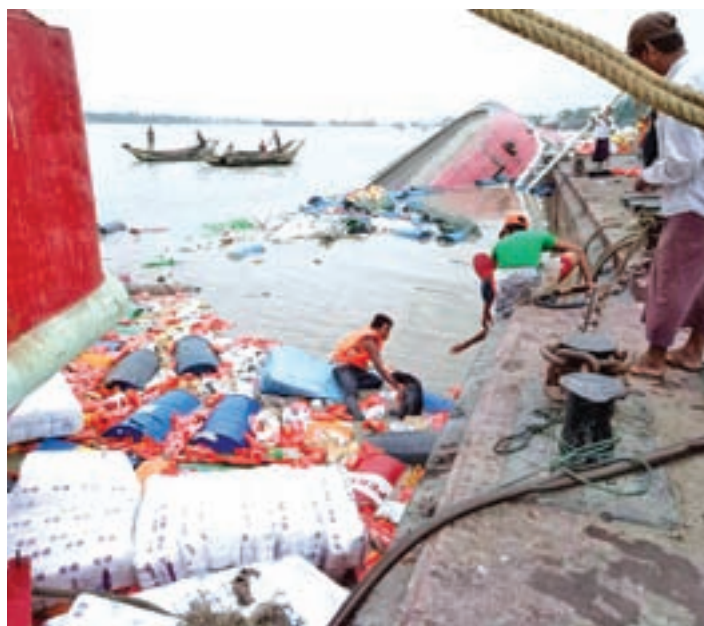
A firefighter rescuing a dog at the site of the sunken ship.

The captain and eight other staff members of the ship began their operations around 3pm and the ship began to capsize on its right side around 4pm after water entered the deck until it reached