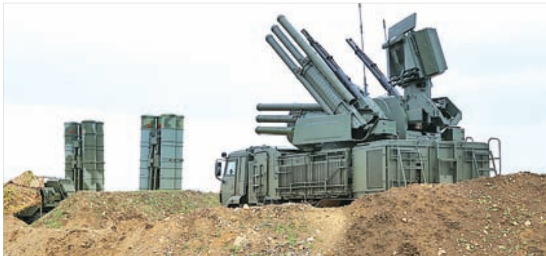
Russian Pantsyr-S1 air defence weapon system and the S-400 long-range air defence missile systems deployed at Hmeimim air base in Syria.