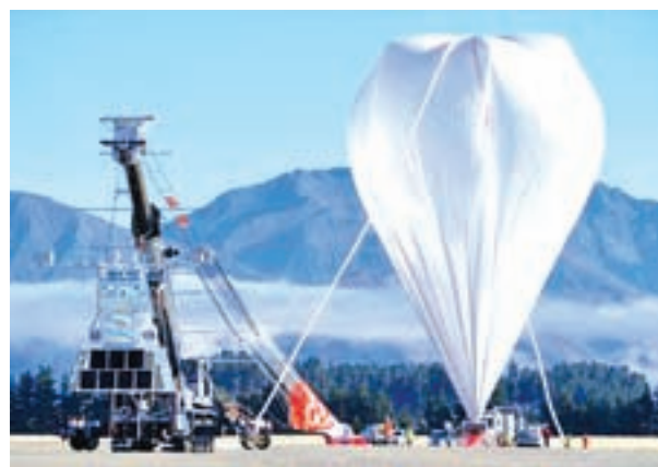
NASA's Super Pressure Balloon stands fully inflated and ready for lift-off from Wanaka Airport, New Zealand before it took flight at 10:50 am local time on 25 April, 2017 (1850 EDT on 24 April, 2017).

New Zealand was also the base for NASA's scientific balloon program in 2015 and 2016. —Reuters