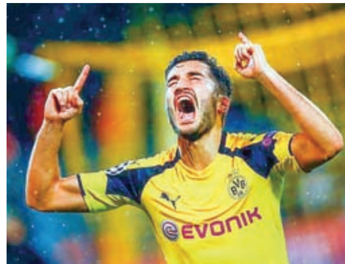
Dortmund's Nuri Sahin.

Plagued by injuries for much of his career, the highly-skilled 28-year-old suffered a partial ankle ligament tear in their 3-2 win over Borussia Moenchengladbach on Saturday.—Reuters