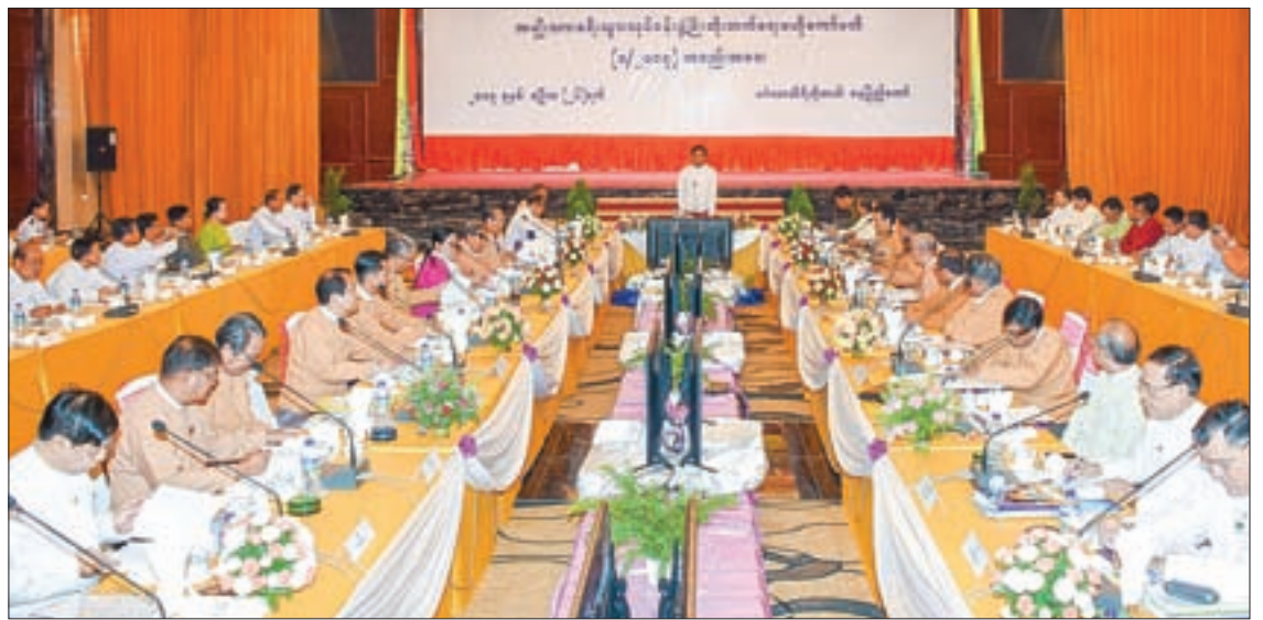
Vice President U Henry Van Thio addresses the co-ordination meeting of Central Committee for the Development of the National Tourism Industry in Nay Pyi Taw yesterday.