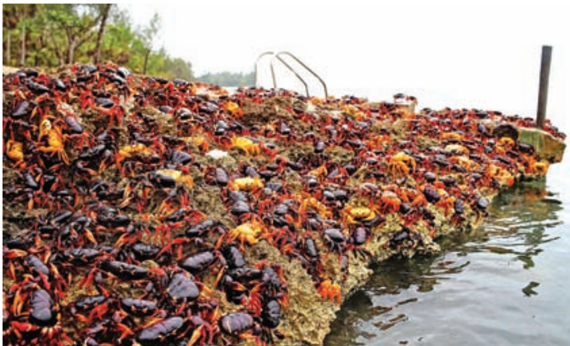
Crabs coming from the surrounding forests gather near the sea to spawn in Playa Giron, Cuba, on 21 April, 2017.

That does not threaten the survival of the two prolific species, Gecarcinus ruricola and lateralis ,