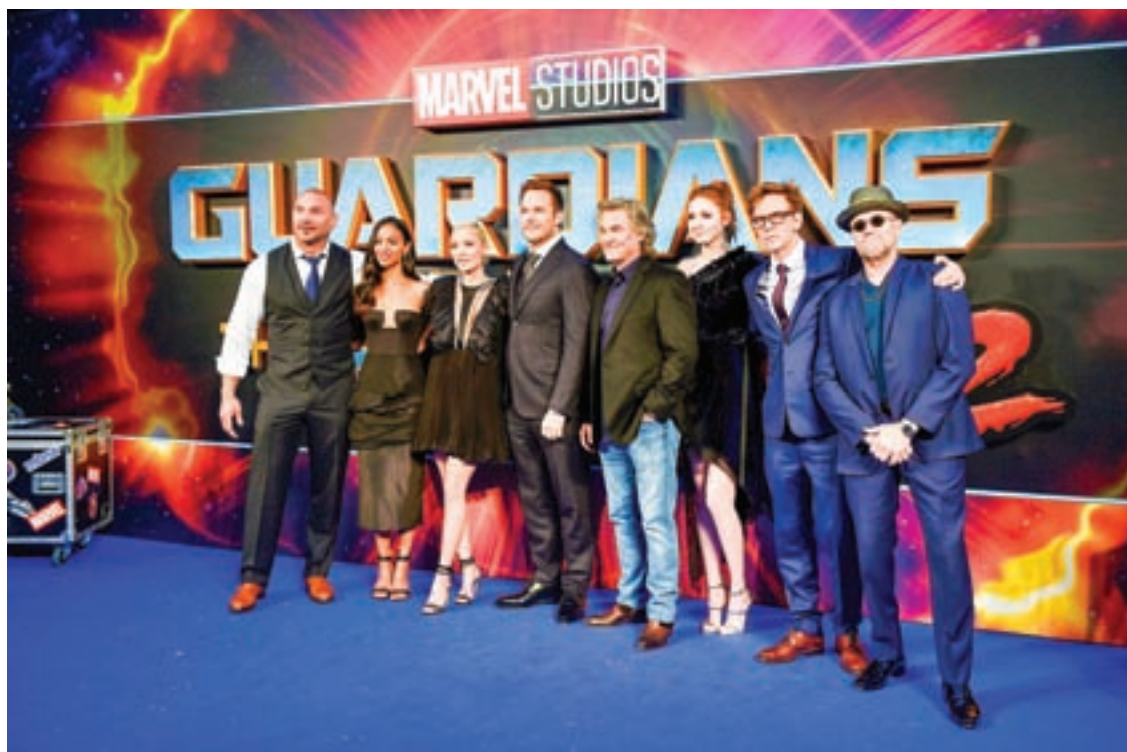
Cast members (L-R) Dave Bautista, Zoe Saldana, Pom Klementieff, Chris Pratt, Kurt Russell, Karen Gillan, director James Gunn and Michael Rooker pose as they attend a premiere of the film "Guardians of the galaxy, Vol 2" in London, Britain on 24 April, 2017.

After spending much of the first film trying to kill each other, warring sisters Gamora (Zoe Saldana) and Nebula (Karen Gillan) find themselves in close quarters in "Guardians Vol 2" and faced with