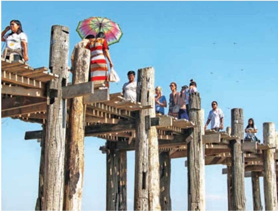
Local and foreign travelers cross U Bein Bridge over Taungthaman Lake in Mandalay.