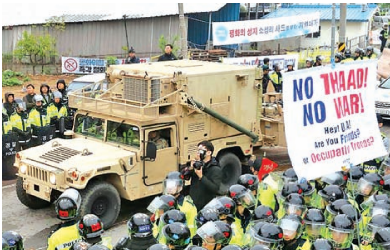
A US military vehicle which is a part of Terminal High Altitude Area Defence (THAAD) system arrives in Seongju, South Korea on 26 April, 2017.

South Korea has said China has discriminated against some South Korean companies in retaliation against the deployment. —Reuters