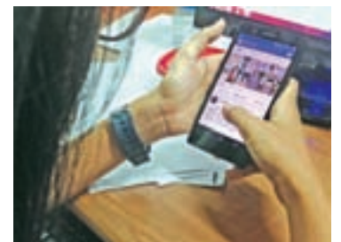
A person using Facebook with a phone.

Moreover, 51 per cent of the people use the internet for entertainment, 31 per cent for information about products and services, 20 per cent for surfing information and 24 per cent for sharing their opinion.