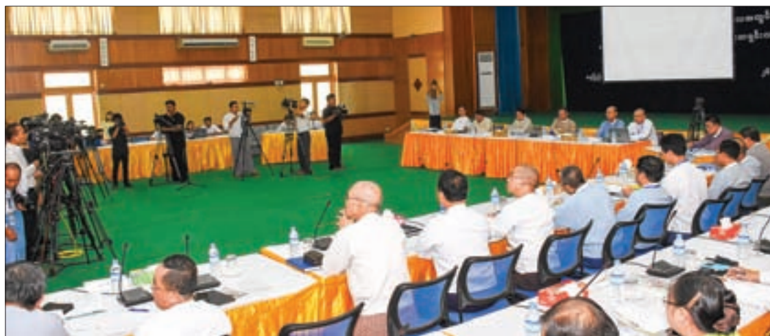
Union Ministers Dr. Pe Myint, Dr. Myo Thein Gyi and Dr. Than Myint attend press conference on one year performance of the four ministries at the hall of the Ministry of Information in Nay Pyi Taw yesterday.

He said the priority works in the government education sector reform are in providing early childhood nurturing and development program, providing at least a primary level education to all and increasing access to middle and high school level education, providing education to physically and financially handicapped children and children in difficult and least developed areas, compiling syllabus for ethnic languages under the supervision of region and state governments to support the ethnic language and culture, arranging for adequate number of teachers to obtain a good student-teacher ratio, arranging to increase the teaching proficiency the teachers, providing education materials to schools in difficult and least developed areas as well as to middle and high school that lacks the education materials, developing the right to draw own curriculum,