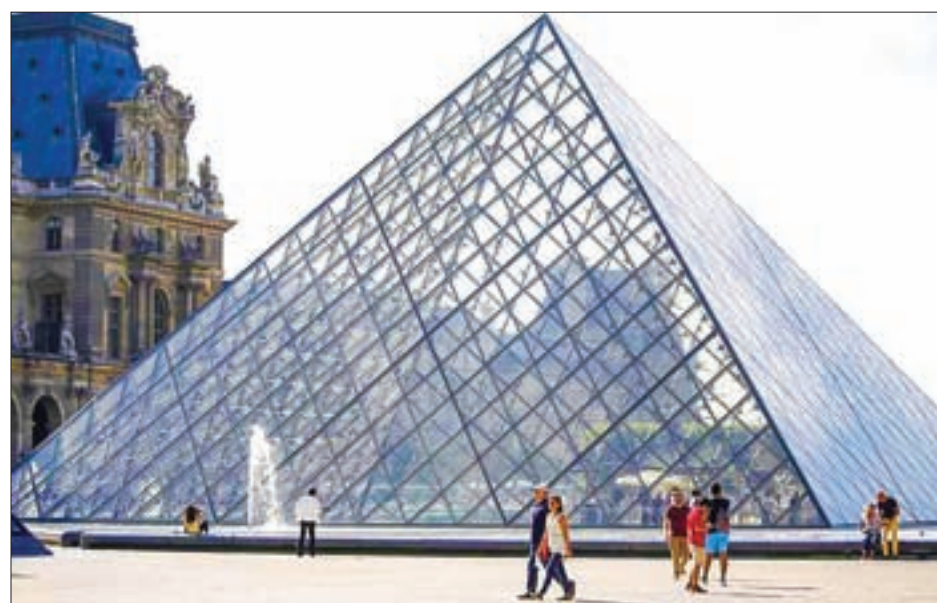
Tourists stand in front of the Louvre Pyramid designed by Chinese-born US Architect Ieoh Ming Pei in Paris, France on 13 September, 2016.