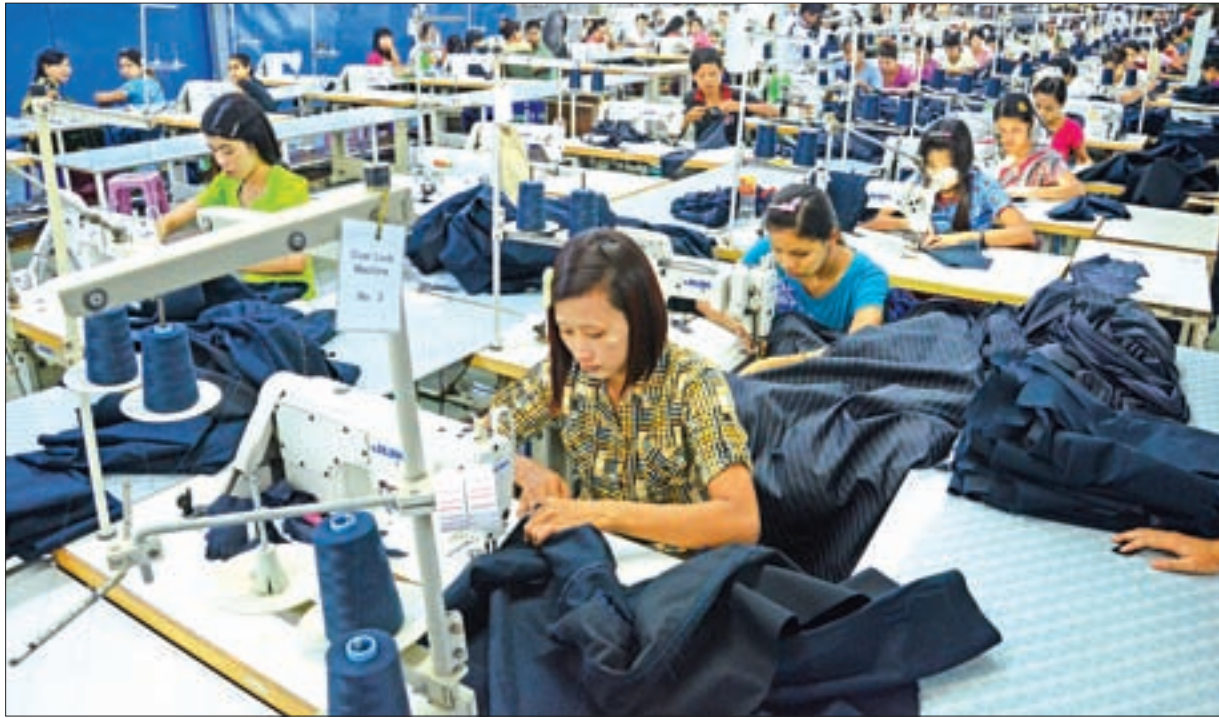
File photo shows employees work on a production line at a garment factory in Hlaingthaya, Yangon.