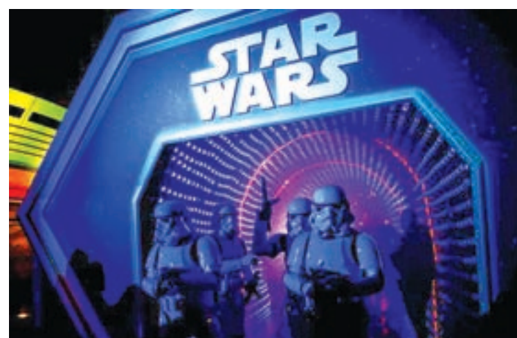
Characters of Star Wars take part in an event held for the release of the film 'Star Wars: The Force Awakens' in Disneyland Paris in Marne-la-Vallée, France on 17 December, 2015.

LOS ANGELES — The final film in the new "Star Wars" trilogy, "Star Wars: Episode IX," will be released in May 2019, movie studio Walt Disney Co said on Tuesday.