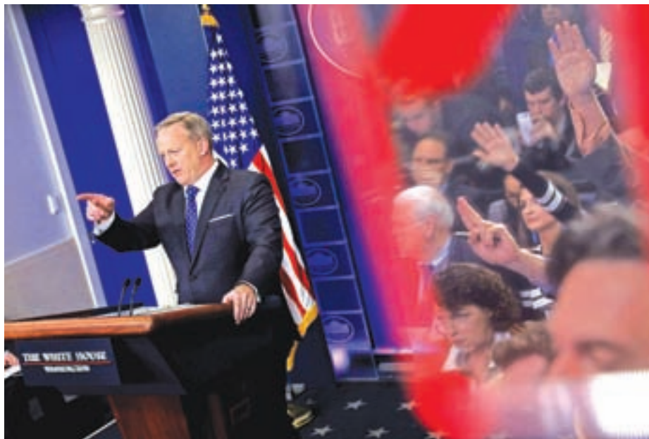
White House spokesman Sean Spicer.

The meeting was set for one day after a North Korean holiday on Tuesday marking the 85th anniversary of the founding of its army. While North Korea has in the past staged nuclear or missile tests to mark the day, this year it conducted a major live-fire exercise.