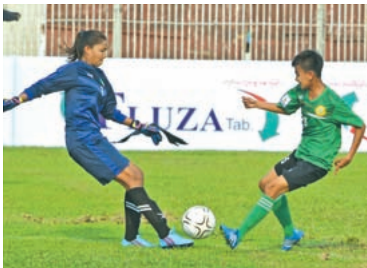
Players from Gandamar FC and Education FC vie for the ball during 2016-2017 Women's National League at Aung San Stadium in Yangon.