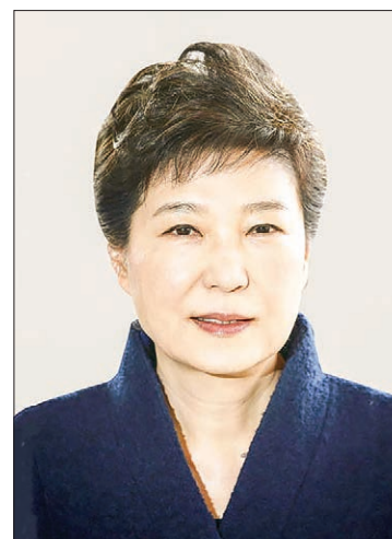
South Korea's ousted President Park Geun Hye.

Park became the country's first democratically elected leader to be dismissed from office when the Constitutional Court on 10 March upheld a parliamentary impeachment vote against her, effectively stripping her of immunity from criminal prosecution.—Kyodo News