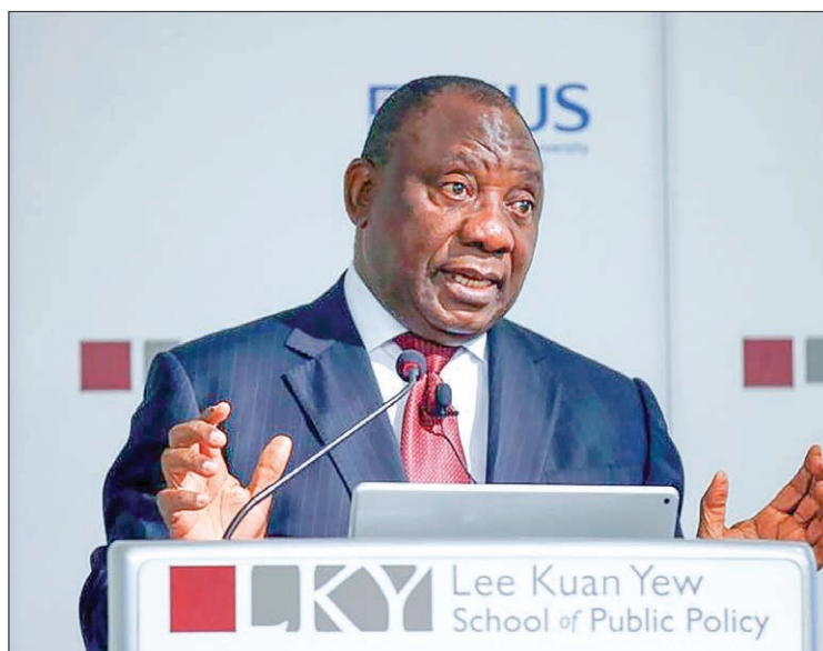
ent Cyril Ramaphosa speaks during a lecture at the Lee Kuan Yew School of Public Policy in Singapore on 7 October, 2016.

Ramaphosa's remarks are a marked contrast to Zuma's. He