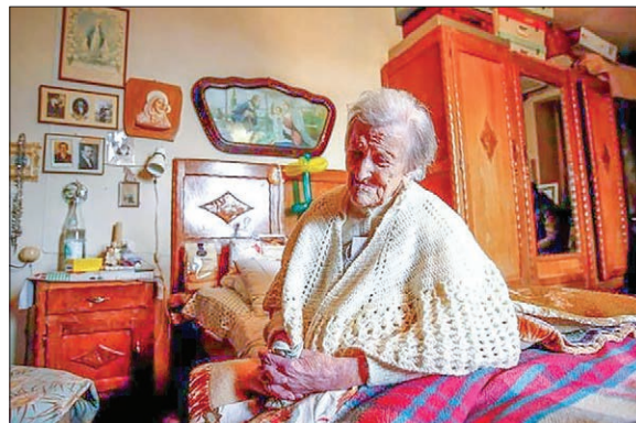
Emma Morano, thought to be the world's oldest person and the last to be born in the 1800s, sits on her bed during her 117 th birthday in Verbania, northern Italy on 29 November, 2016.

"I worked in a factory until I was 65, then that