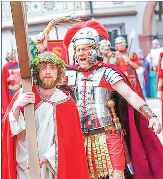
Members of the Italian community take part in a re-enactment of the crucifixion of Jesus Christ on Good Friday in Bensheim, southwest of Frankfurt, Germany on 14 April, 2017.

According to the Christian faith, Jesus rose from the dead on Easter Sunday, symbolizing death is not the end but rather a new beginning.—Reuters