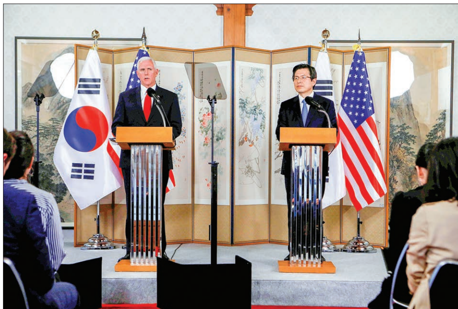
US Vice President Mike Pence speaks beside acting South Korean President and Prime Minister Hwang Kyo-ahn during a news conference in Seoul, South Korea on 17 April, 2017.

Pence, whose father served in the 1950-53 Korean War, said the United States would stand by its