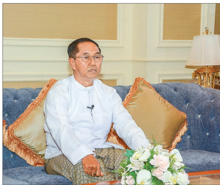
Vice President U Myint Swe.

On the occasion of the New Year, I send these greetings and good wishes for the good health and auspiciousness of all ethnic nationalities living in the Republic of the Union of Myanmar.