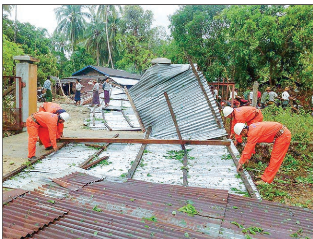
Firefighters remove debris in Kyaukpyu after Cyclone Maarutha damaged several areas on Sunday.