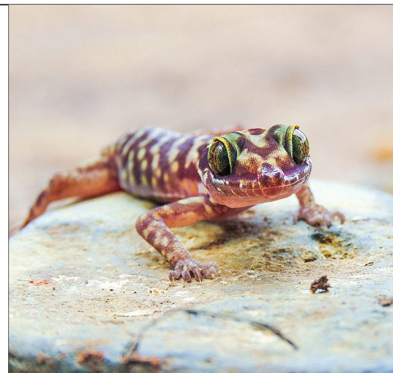
The Tenasserim Mountain bent-toed gecko is one of two new species of gecko discovered during a biodiversity survey in little-studied areas of Myanmar by Smithsonian and Fauna & Flora International scientists.