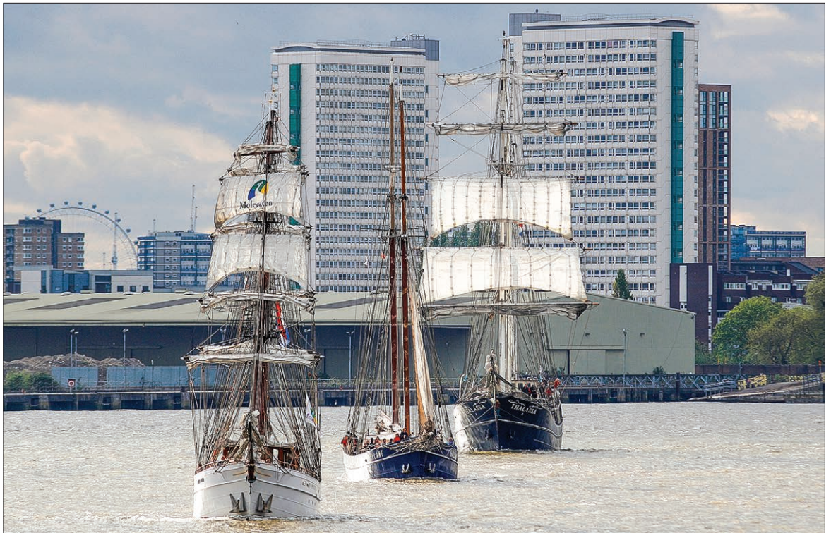
Participants in the Royal Greenwich Tall Ships Festival embark on a journey to Portugal, as they sail down the river Thames, in London, Britain, on 16 April, 2017.