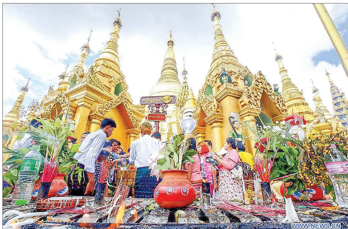
People visit Shwedagon Pagoda on the first day of Myanmar's traditional new year in Yangon, Myanmar, on 17 April, 2017.

Also during the New Year, it is customary for people to free caged birds into the wilderness