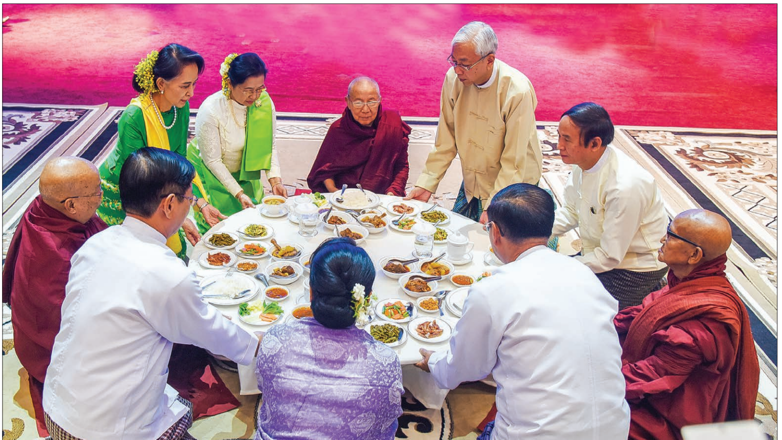
State Counsellor Daw Aung San Suu Kyi, upper left, First Lady Daw Su Su Lwin, centre left, President U Htin Kyaw, upper right, and Pyithu Hlut-taw Speaker U Win Myint, far right, offer a traditional day meal known as a soon to members of the Sangha at the Presidential Palace.