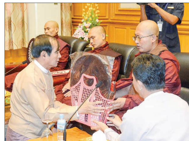
Pyithu Hluttaw Speaker U Win Myint donates offertories to a Member of the Sangha at the Paritta reciting ceremony held at Pyithu Hluttaw office in Nay Pyi Taw.