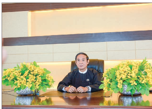
Speaker of Pyithu Hluttaw U Win Myint.