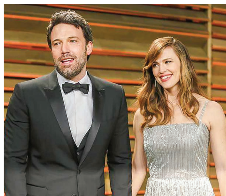
Actor Ben Affleck and his wife, actress Jennifer Garner arrive at the 2014 Vanity Fair Oscars Party in West Hollywood, California on 2 March, 2014.

Affleck and Garner co-starred in the 2003 superhero film “Daredevil” and were married in 2005. They announced plans to divorce a day after their 10th wedding anniversary in 2015.—Reuters