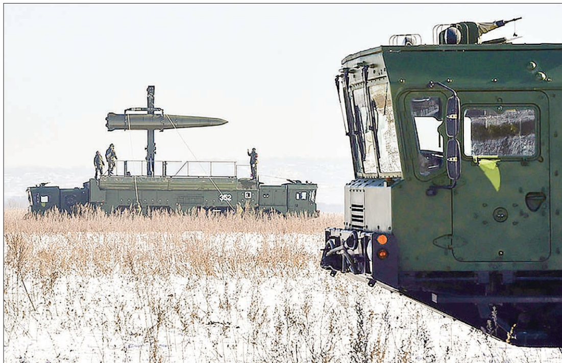
An upgraded version of the tactical missile system Iskander-M will be presented after 2020.

MOSCOW— An upgraded version of the tactical missile system Iskander-M will be presented after 2020, Rosstec corporation's CEO Sergey Chemezov has said.