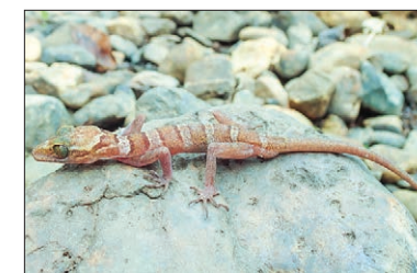
The Lenya banded bent-toed gecko is one of two new species of gecko discovered during a biodiversity survey in little-studied areas of Myanmar by Smithsonian and Fauna & Flora International scientists.

In 2016, the paper's authors conducted a survey of the amphibians and reptiles of the proposed national park, finding 67 species of frogs, snakes and lizards, including the two newly discovered bent-toed geckos. Myanmar has 18 known species of bent-toed