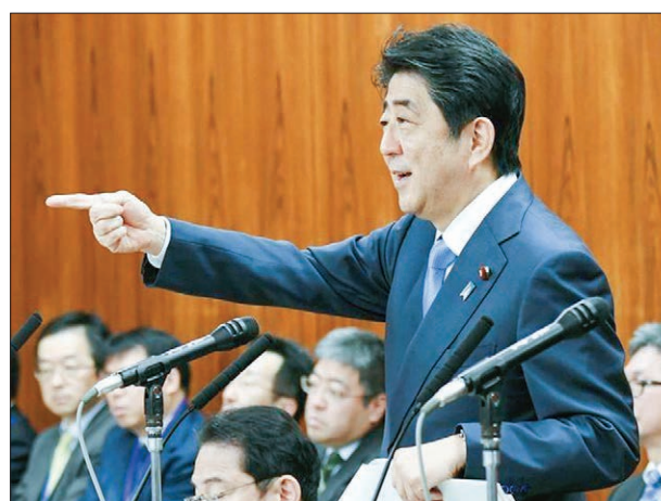
Japan's Prime Minister Shinzo Abe speaks during an upper house panel session at the Parliament in Tokyo, Japan, in this photo taken by Kyodo on 13 April, 2017.

Abe told parliament he would exchange views on North Korea with Russian President Vladimir Putin