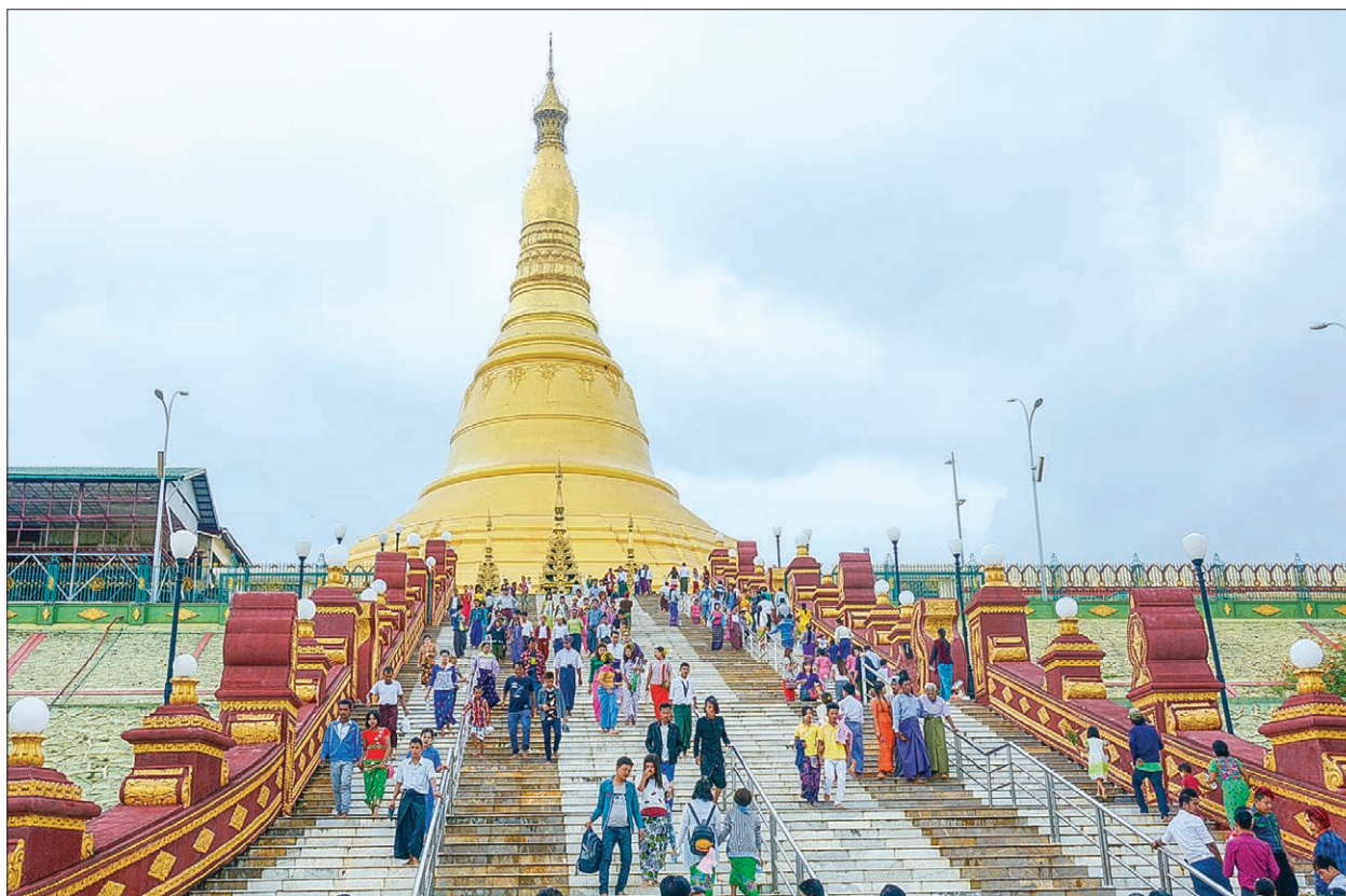
Buddhist devotees visit Uppatasanti Pagoda on the first day of the Myanmar New Year.

In the morning, the 9th Paritta recitation ceremony with a view to exorcizing evil spirits and bad omens was held at the Cave of Uppatasanti Pagoda, in Nay Pyi Taw where pilgrims and audience listened to the sermons delivered by