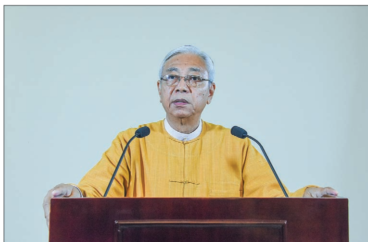
President U Htin Kyaw.

That is why, just as we have projects which can be implement-