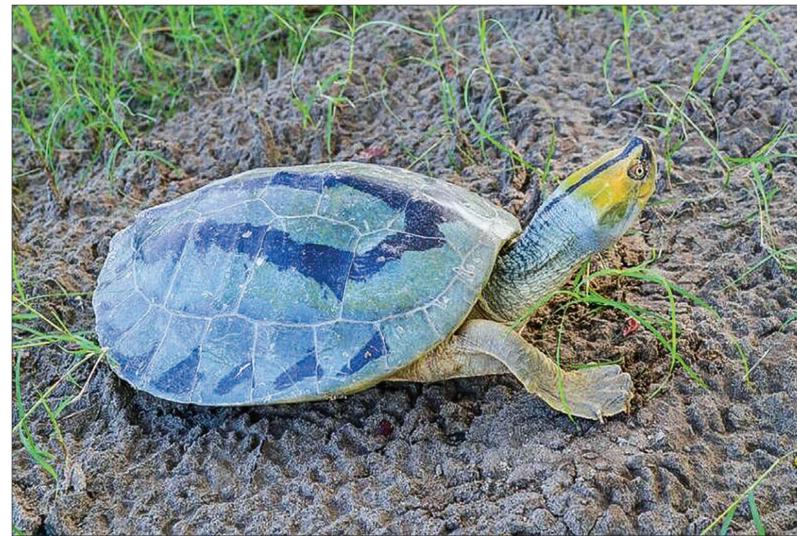
Male in breeding colors.

“A combination of overharvesting of eggs, incidental loss in fishing gear, and habitat loss due to gold mining had pushed the species to the brink of extinction.