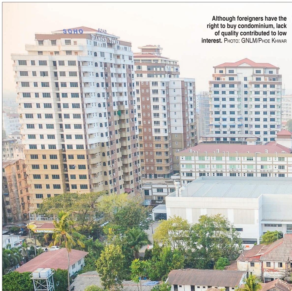
Although foreigners have the right to buy condominium, lack of quality contributed to low interest.