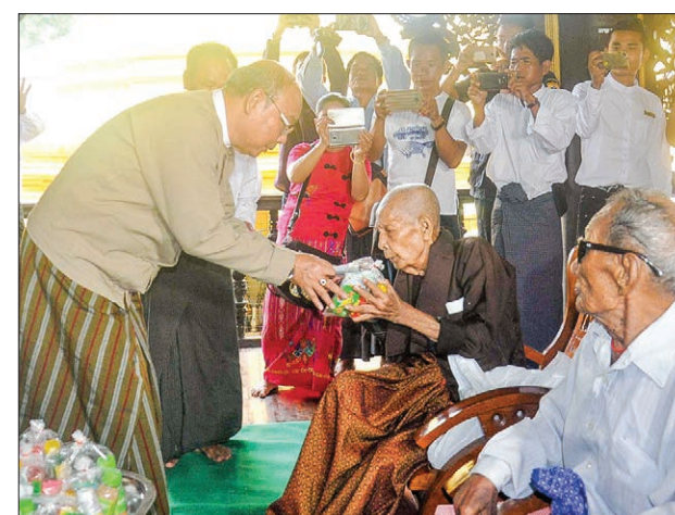
Amyotha Hluttaw Speaker Mahn Win Khaing Than presents gift to an elder person.

They also attended the ceremony of paying respect to 274 elderly people held at the pagoda and donated cash and kind to the aged people. On the occasion, elderly people above 80 years old from five wards in Myawady were provided with cash and kind.