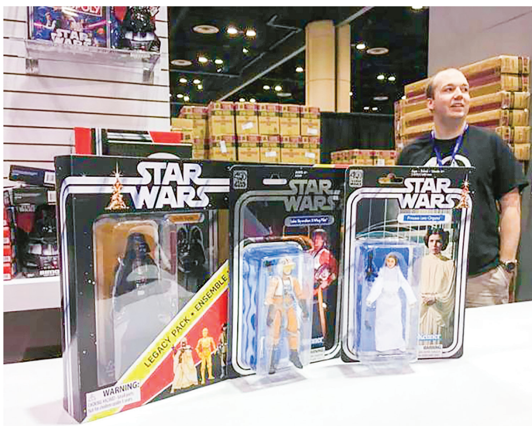
Star Wars products are lined up at the annual Star Wars Celebration where Walt Disney Co licensees are selling a new Luke Skywalker action figure, limited-edition Stormtrooper helmets and other coveted merchandise, in Orlando, Florida, US on 14 April, 2017.

The movie stars were on hand during the 2017 Star Wars Celebration at the Orange County