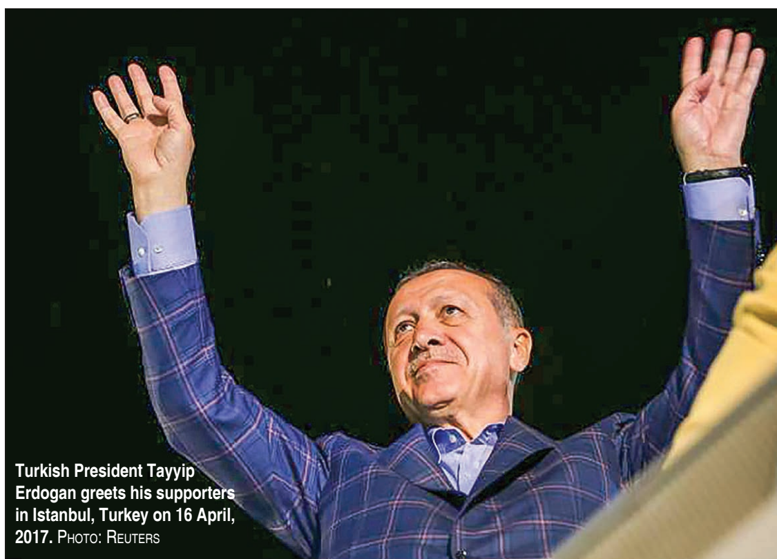
Turkish President Tayyip Erdogan greets his supporters in Istanbul, Turkey on 16 April, 2017.

sition Republican People's Party (CHP), Kemal Kilicdaroglu, said the legitimacy of the referendum was open to question. His party said it would demand a recount of up to 60 per cent of the votes.