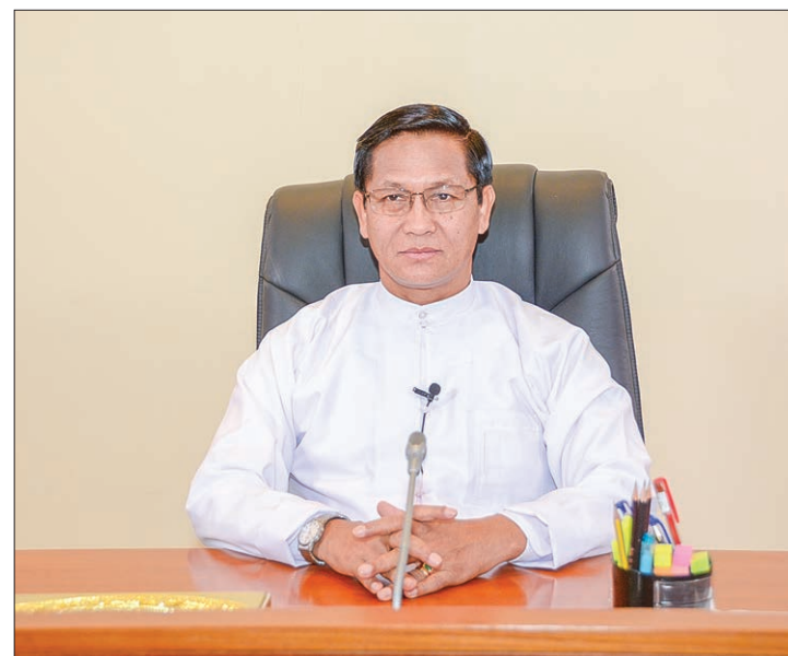
Vice President U Henry Van Thio.

May it be an auspicious and Happy New Year.