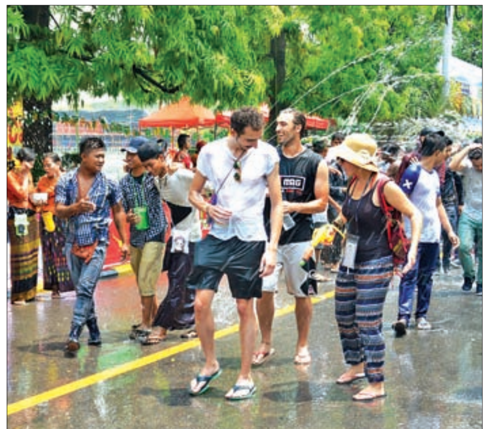
Crowds of revellers including locals and tourists throng "the Walking Thingyan" of Mandalay enjoying the cooling factor of Thingyan Festival.