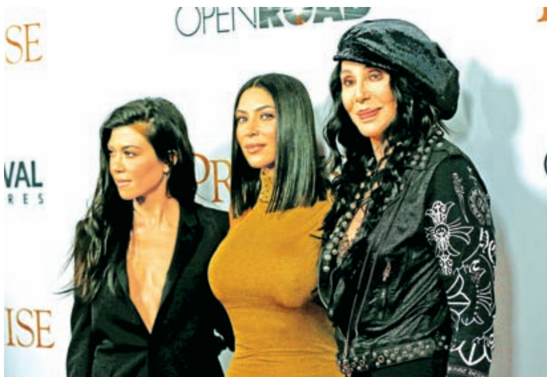
Singer Cher (R) poses with television personalities Kim Kardashian (C) and Kourtney Kardashian at the premiere of ‘The Promise’ in Los Angeles, California, US, on 12 April 2017.

“As we were shooting, we were watching the same events in the same location - people under siege in the mountains and drowning in the Mediterranean,”