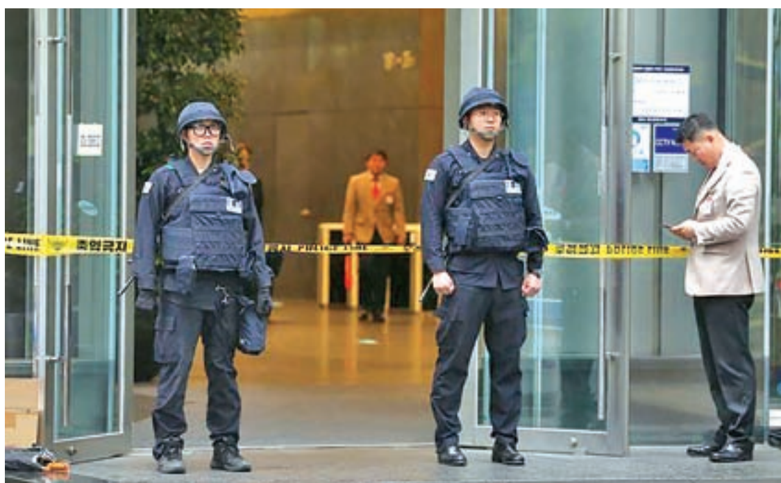
South Korea policemen stand guard at an entrance of a Samsung Group's building in Seoul, South Korea, on 14 April 2017.

Ahn Cheol-soo of the centrist People's Party, a runner-up in opinion surveys, said he would first have phone calls with US and Chinese leaders, before announcing a statement to ask the DPRK to stop any provocations.—Xinhua