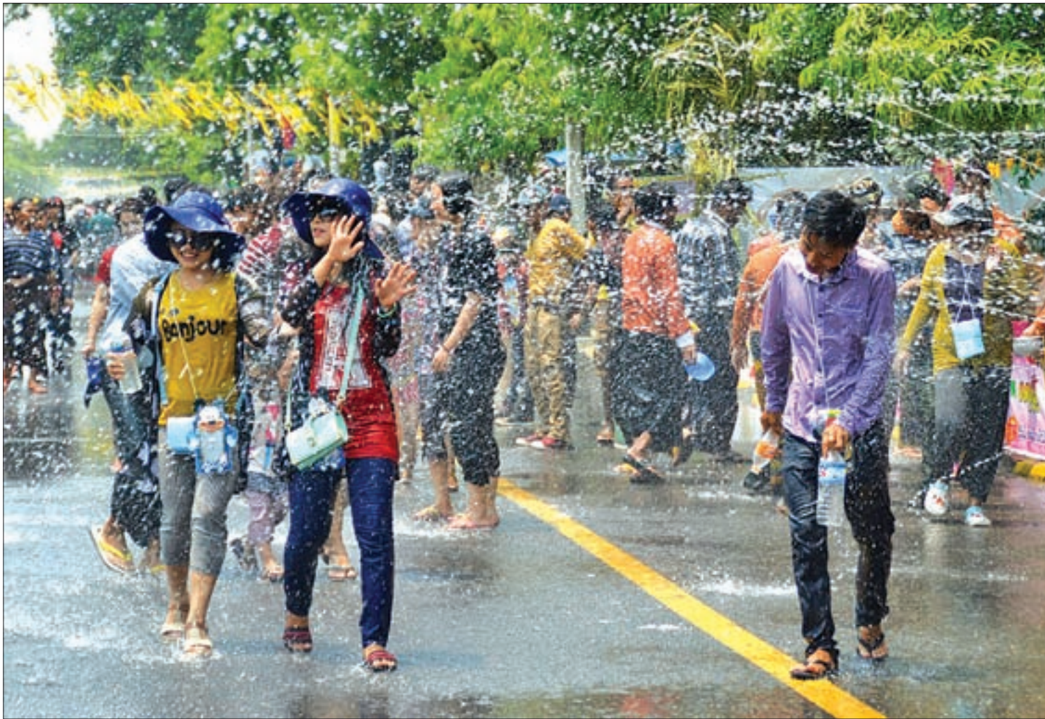
Walking Thingyan on the 26th Street becomes a popular site in the Thingyan Festival in Mandalay.

CROWDS flocked to Mandalay City's pandals, pavilions and entertainment stages yesterday, the Akya day of the Myanmar Traditional New Year Water festival.