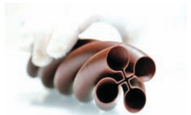
Gaetan Richard, founder of the Miam Factory 3D printing chocolate company, displays a three-dimensional shape object after being printed at Belgian chocolate company Miam Factory in Gembloux, Belgium, on 10 April 2017.

While dark chocolate is most popular, milk and white chocolate are also available.—Reuters