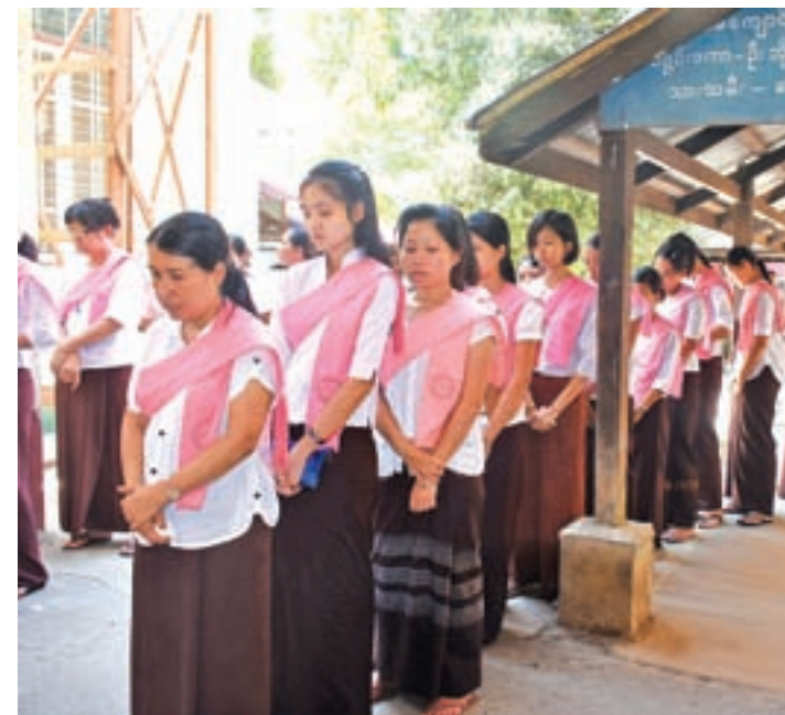
Youths learn meditation at Mingun meditation center in Yangon.