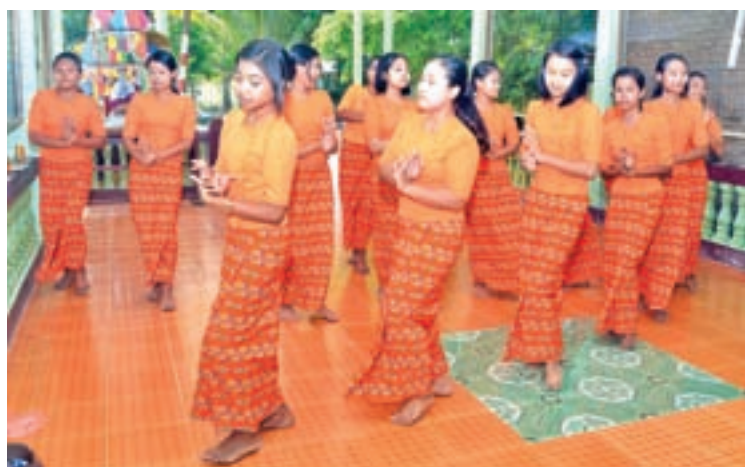
Dance troupe performing at a small pavilion in Buthidaung.