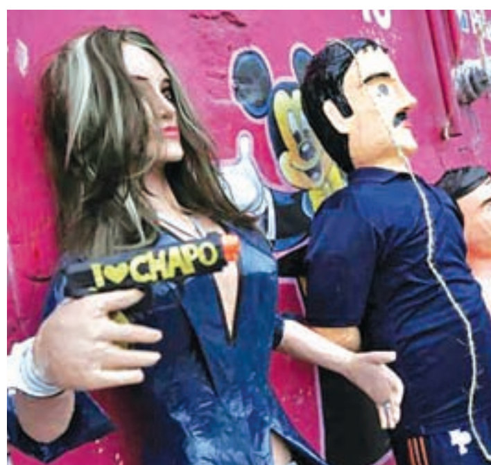
Pinatas depicting Mexican actress Kate del Castillo (L) and the drug lord Joaquin “El Chapo” Guzman are displayed outside a workshop in Reynosa, in Tamaulipas state, Mexico, on 13 January 2016.

Del Castillo brokered an interview between Guzman, the boss of the Sinaloa drug cartel,