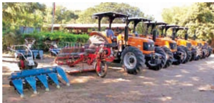
Farming implements for sale to local farmers in Sagaing Region.

In fiscal 2016-2017, the Agriculture Mechanisation Department sold 52 hand-push tractors with four instalments in three years, 2,167 China made hand tractors with three instalments in two years, 19 Sonalika tractors with three instalments in two years, four Kubota tractors with three instalments in two years and 47 reconditioned tractors, according to Regional Agricultural Mechanization Department.—The Mirror