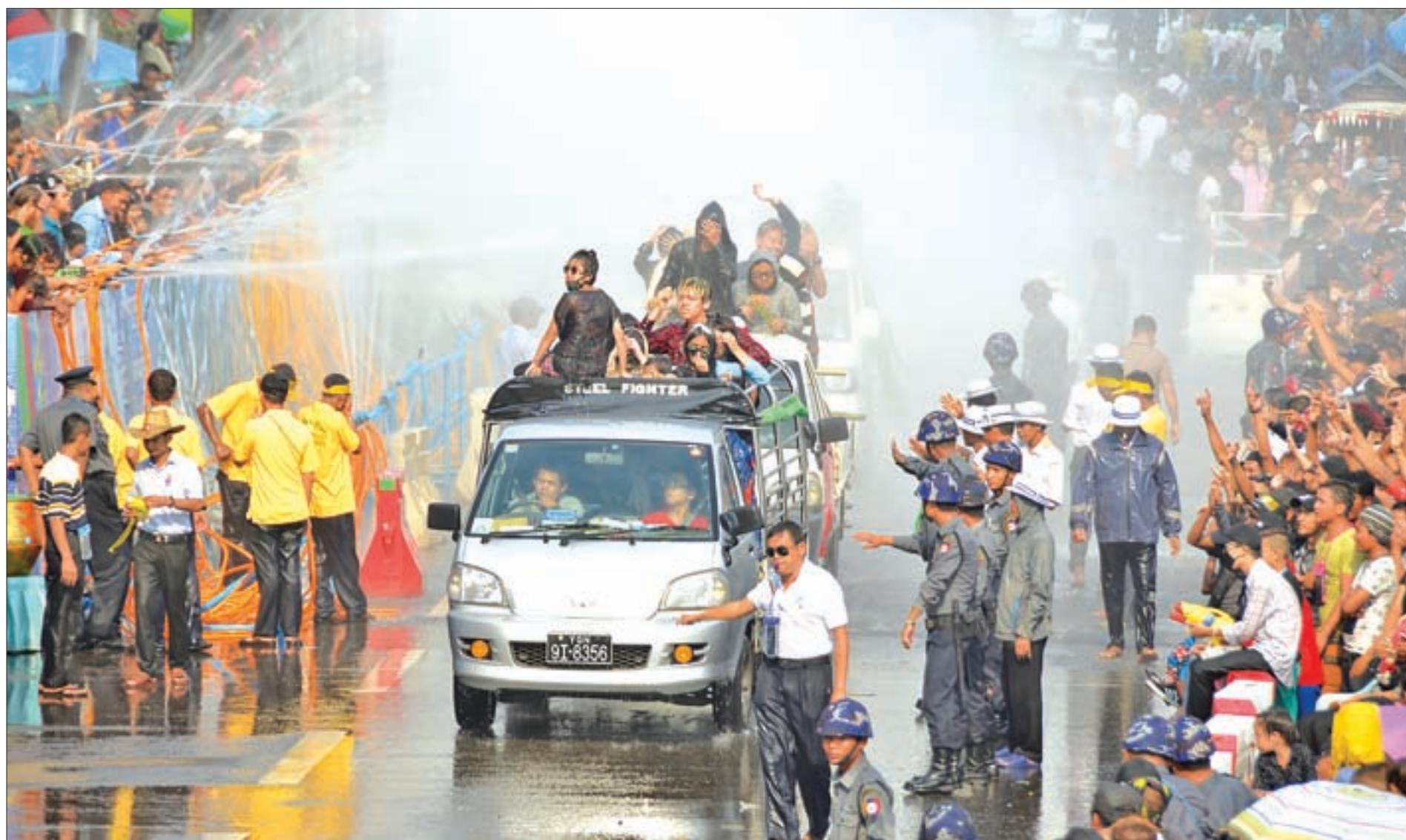
Revelers enjoy the water festival with the fine weather on Akya Day. The weather is expected to be cloudy and showers is expected over many areas during the festival.