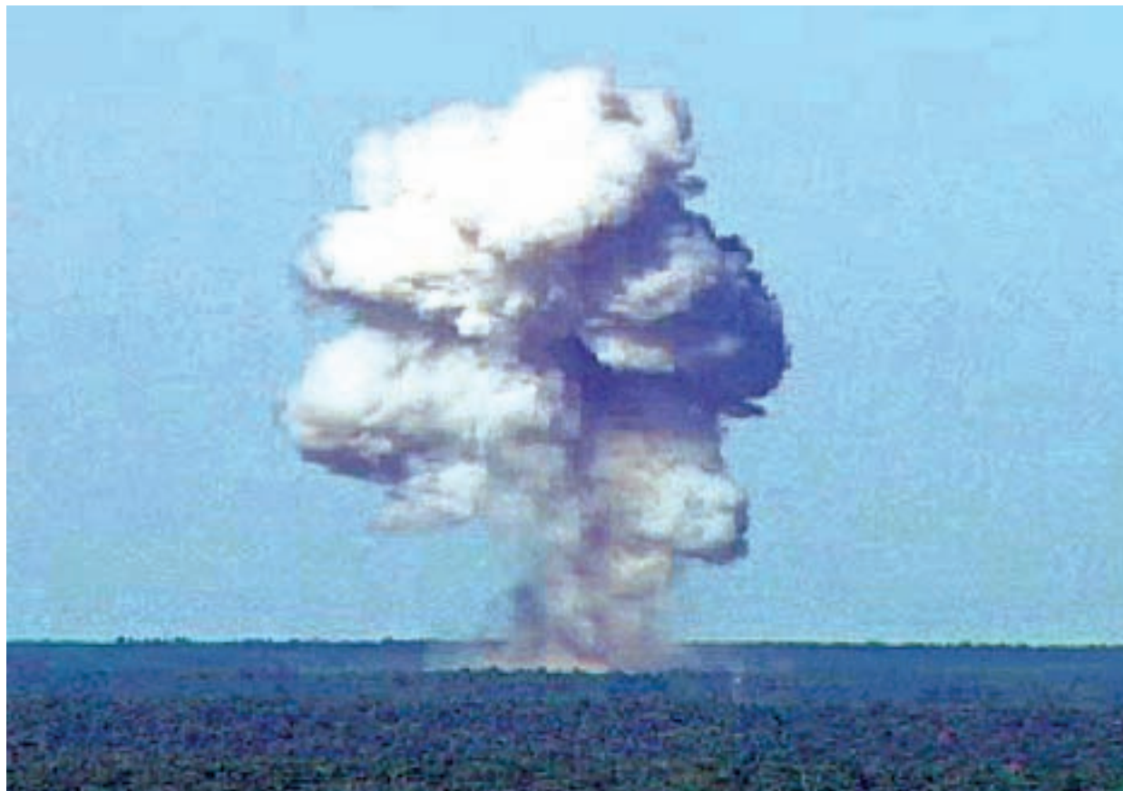
The GBU-43/B, also known as the Massive Ordnance Air Blast, detonates during a test at Elgin Air Force Base, Florida, US, November 21, 2003 in this handout photo provided on 13 April 2017.