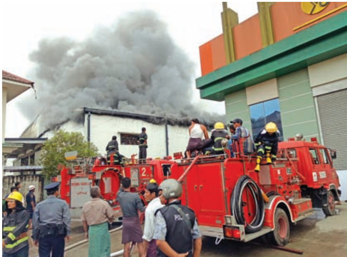
Firefighters put out the fire at about 6pm in Shwelinban Industrial Zone in Hlinethaya Township.