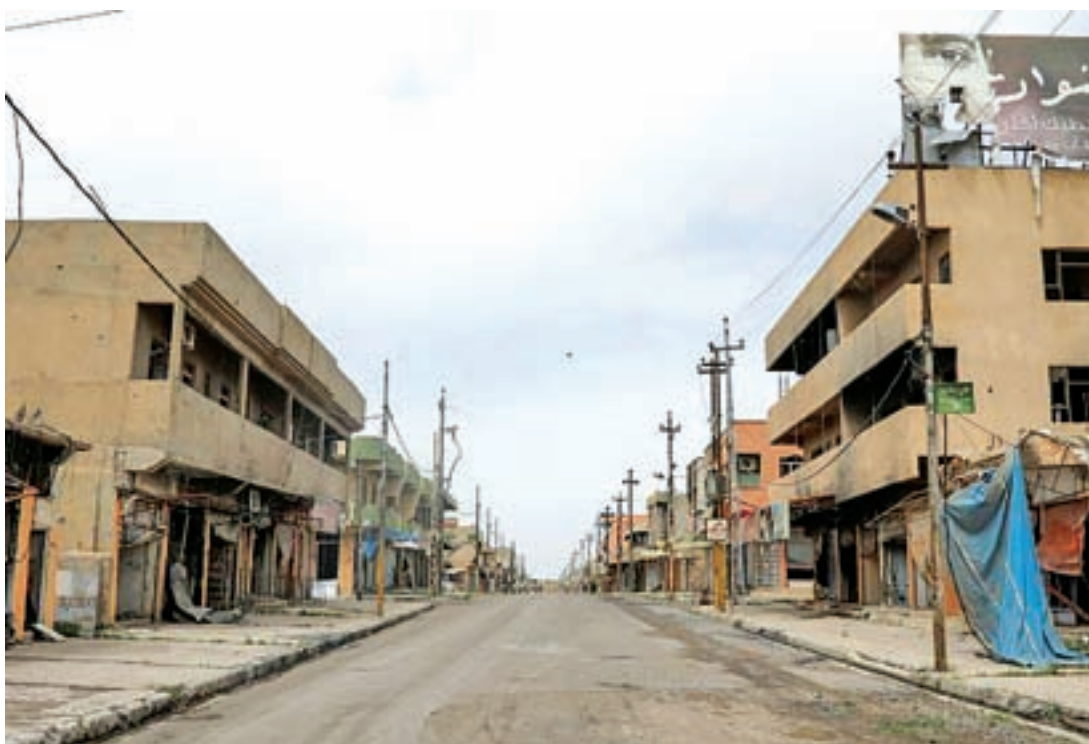
Empty streets and destroyed buildings are seen in the town of Qaraqosh, south of Mosul, Iraq, on 12 April 2017.

"Oh Hussein" is daubed in red on the wall of a church torched