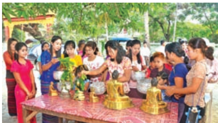
Ethnic Rakhine women wash Buddha statues with scented water.