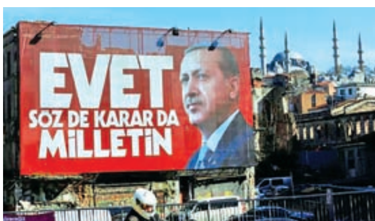
A billboard carrying a picture of Turkish President Tayyip Erdogan and a slogan that reads: 'Yes. It is for the people to speak and to decide' is seen on a building ahead of the constitutional referendum in Istanbul, Turkey, on 13 April 2017.

Opponents fear a lurch towards authoritarianism under a president they see as addicted to power and intolerant of dissent, chipping away at the secular