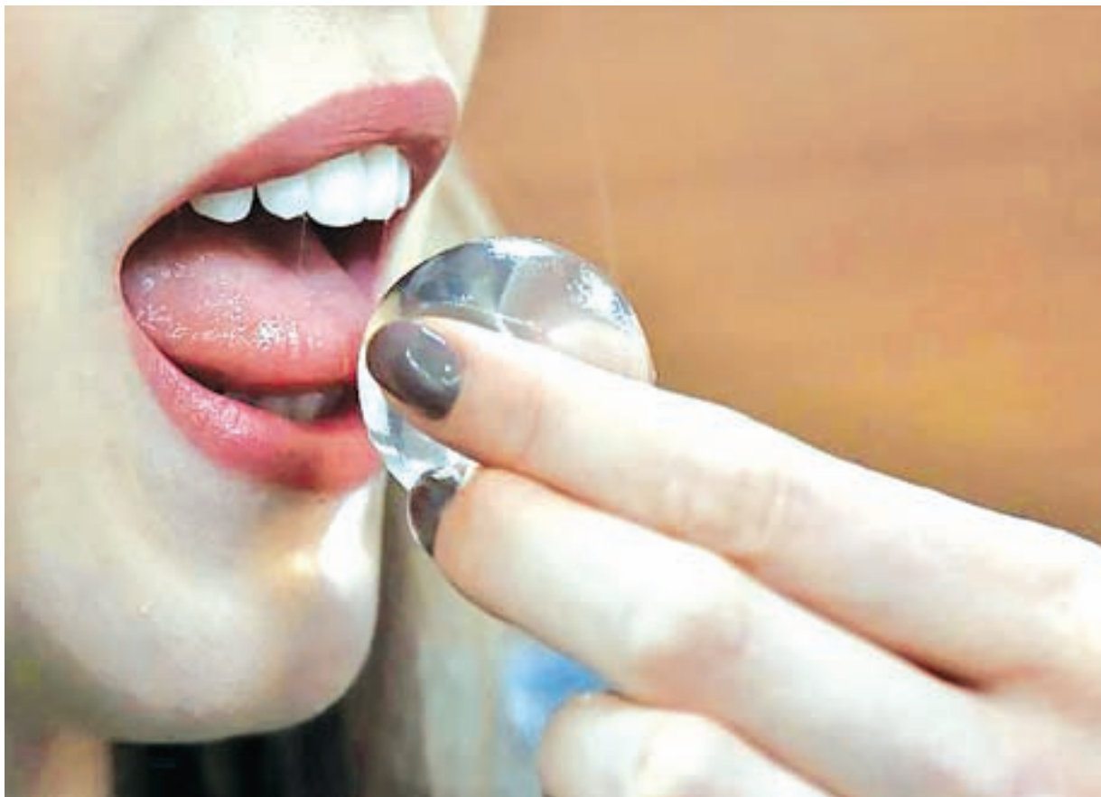
A woman consumes an 'Ooho' plastic-less water container in London, Britain, on 12 April 2017.

The United Nations fears it could reach Asia and the Mediterranean in the next few years.— Reuters