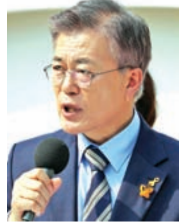
Moon Jae-in, a presidential candidate of South Korea's biggest Minjoo Party.

To facilitate the rice branding, VFA proposed the Vietnamese government to reduce the value added tax imposed on local firms from five percent to zero percent in the next 5-7 years, reported VET.—Xinhua