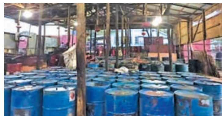
Ministry of Electric Power and Energy issued the permanent licenses to private businessmen in April.

because the authorities are now issuing one-year licenses. We also don't need to worry about the authorities coming to inspect our businesses. The oil market does not change because of issuing of licenses. Crude oil is mainly supplied by Magway region. Kani, Kalay and Kyunhla Pale also supplied the crude oil, said a local businessman. The oil refined by Kyaukkamyauk village is mainly used for engines, trailers and small businesses. As the private businessmen are now holding licenses, they are making less profit now.—MMAL