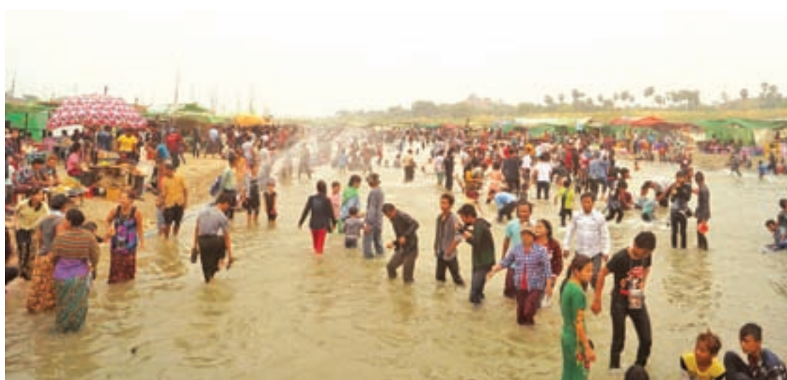
Revellers celebrating Thingyan Water Festival in Yaw Creek, Seikphyu Township. PHOTO: SOE LIN NAING

Members of the Myanmar Police Force have taken the preventive measures, educating the shops and revellers along the beach of the creek during the festival. —Soe Lin Naing (IPRD)