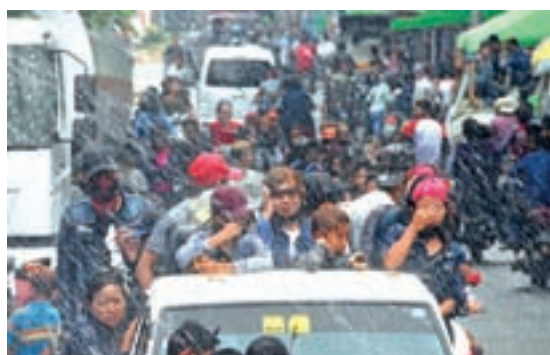
Revelers soak themselves under splash of water enjoying the Thingyan festival in Nay Pyi Taw.

WHILE many Yangon youths are participating in the traditional celebration of Thingyan by happily throwing water, many others entered monasteries and meditation centres.