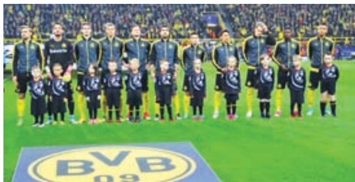
Borussia Dortmund players line up before the game at Signal Iduna Park, Dortmund, Germany, on 12 April 2017.

serious enough to warrant a longer delay than 24 hours, irrespective of the challenges it would have posed for travelling fans and to adjust the match calendar."