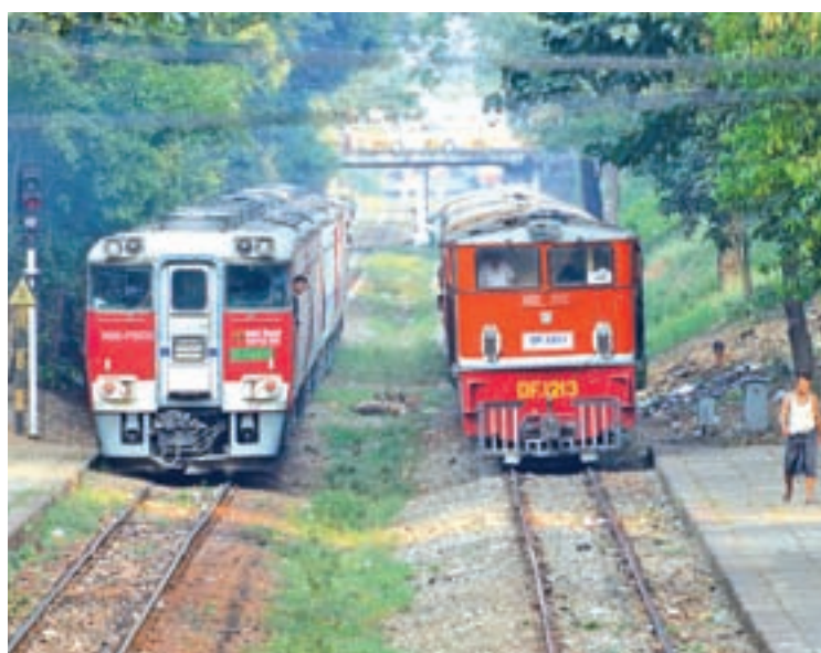
Two locomotives on railway lines at a rural railway station.

Myanmar Railways also invited tenders for implementation of 10 projects including upgrading of Yangon circular railway.—200