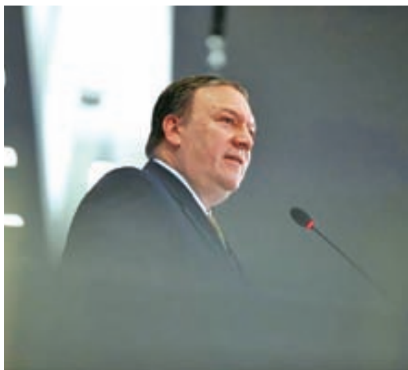
Central Intelligence Agency Director Mike Pompeo speaks at The Center for Strategic and International Studies in Washington, US, on 13 April.

Pompeo and President Donald Trump, who chose him to head the CIA, have