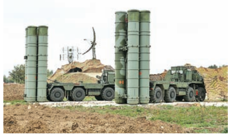
Russia's S-400 air defence systems. The S-400 and Pantsir systems provide reliable protection for the Russian air group at Hmeymim.

He added that "the crews of Russian air defence systems in Syria are on duty round the clock." Two US destroyers, The Ross and The Porter launched 59 cruise missiles Tomahawk at Syria's Sha'irat air base on orders from President Donald Trump. Four Syrian soldiers were killed, two went missing and four others were injured. The attack destroyed six MiG-23 planes, a radar station and a canteen room. In 2016, several bat-