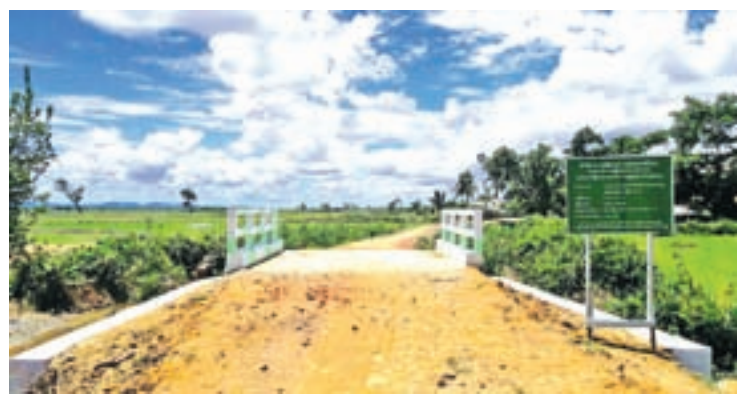
Upgraded Buthidaung-A Ngu Maw Road is commissioned into service.

Ks189.44 million was spent on this project and once it is completed, un-interrupted travel to Thabatetaung, Kakyetbet and Maung Ni village via Buthidaung will be possible.—