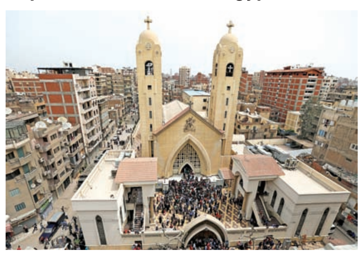
A general view is seen as Egyptians gather by a Coptic church that was bombed on Sunday in Tanta, Egypt on 9 April, 2017.

CAIRO — At least 36 people were killed and 100 injured on Sunday by an explosion in a church in the Nile delta city of Tanta, Egyptian state television