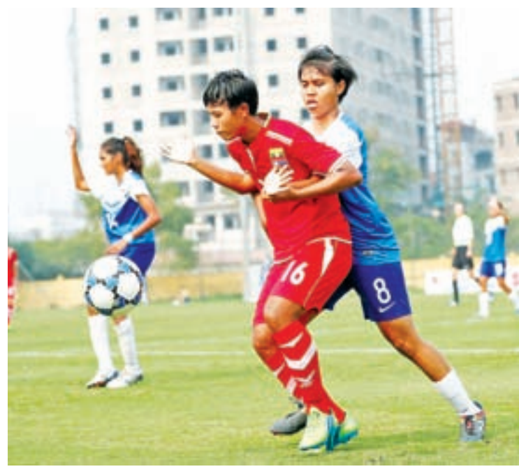
Players of Myanmar women's football team and Singapore women's football team vie for the ball.