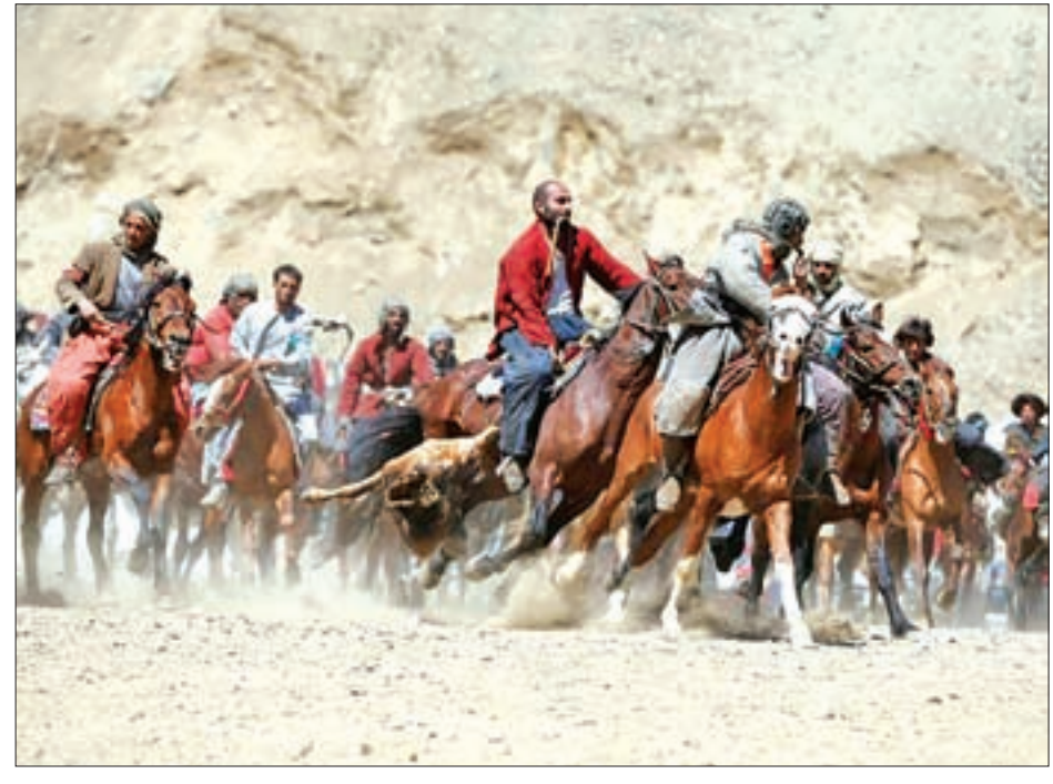
Afghan horsemen compete during a Buzkashi game in Panjshir province, north of Kabul, Afghanistan on 7 April, 2017.

Rusting hulks of Russian-made tanks and guns