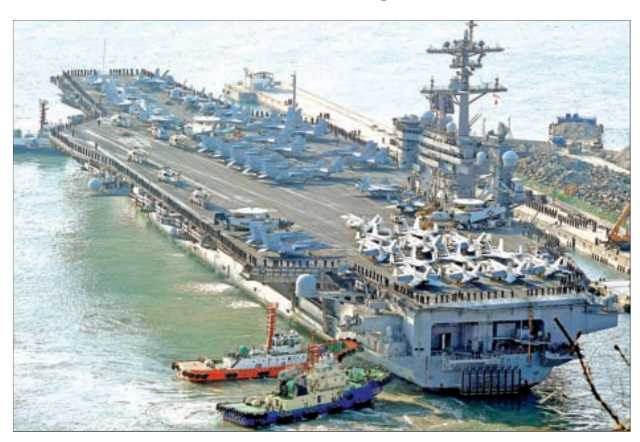
File photo taken in March 2017 shows the USS Carl Vinson aircraft carrier arriving at the port of Busan. A US Navy carrier group, led by Carl Vinson, is heading to the Korean Peninsula, a Navy official said on 8 April, following North Korea's missile tests and amid signs that Pyongyang is preparing for a sixth nuclear test.

WASHINGTON — A US Navy carrier strike group is heading to the Korean Peninsula, a Navy official said on Saturday, following North Korea's successive missile tests and amid signs that Pyongyang is preparing for a sixth nuclear test.