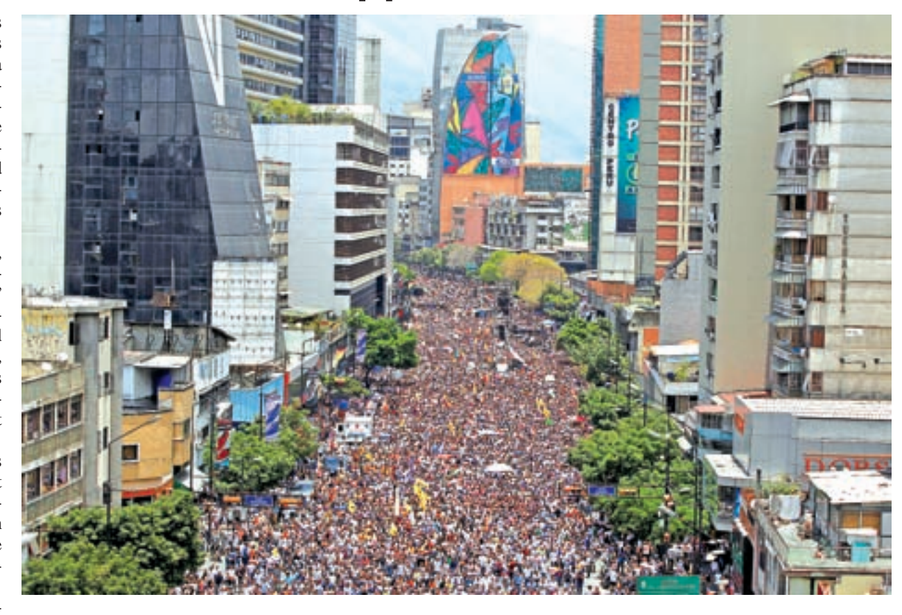
People participate in an opposition rally in Caracas, Venezuela, on 8 April 2017.

Security forces fired tear gas on one major avenue in Caracas while police in the opposition hotbed San Cristobal shot rubber