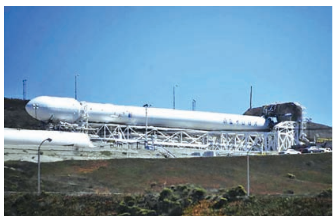
A SpaceX upgraded Falcon 9 rocket undergoes launch preparations at Vandenberg Air Force Base in California, on 27 September 2013.