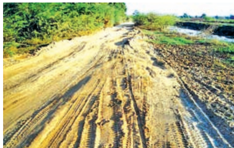
Thazi-Nyaungyan Road being upgraded in Thazi Township.