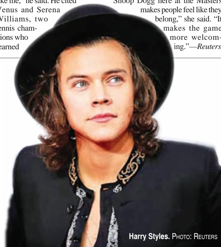
Harry Styles.

Starting next year, the Academy said PwC will place a third accountant in the Oscars show control room, who will be able immediately to notify the director should a mistake be made. —Reuters