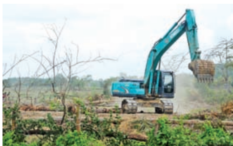
Land reclamation task being carried out in Warpeik village, Maungdaw, Rakhine State.