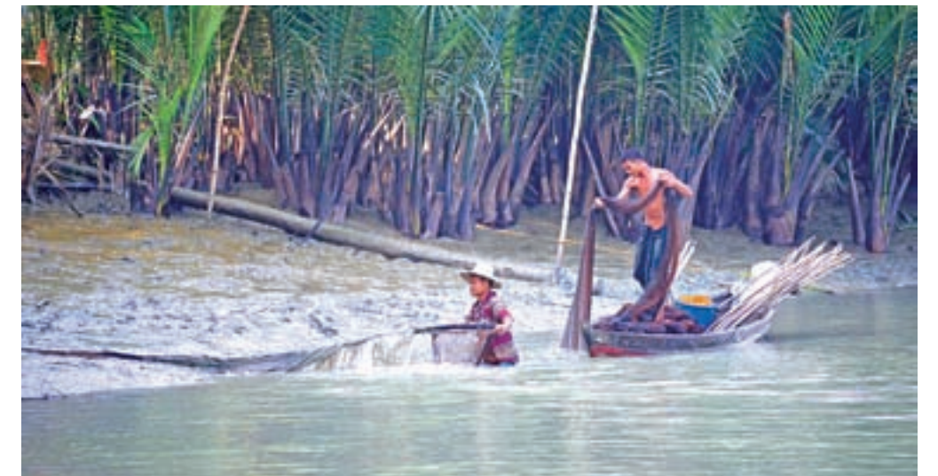
Myanmar government has taken steps for conservation of the country's natural resources on land and in the sea including management of natural resources in coastal areas in order to effectively combat the effects of climate change.

“ Myanmar can be an excellent model. But it needs to be cautious and make sure that new investments being made in the country are low carbon and climate resilient.”