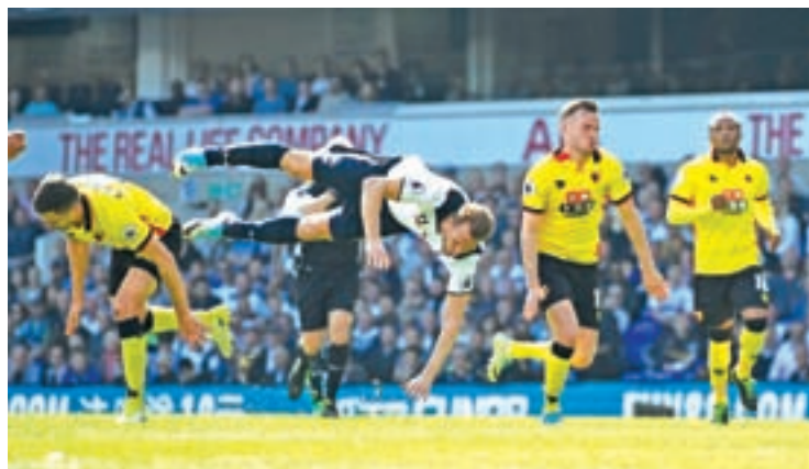
Tottenham's Harry Kane is fouled by Watford's Craig Cathcart during the Premier League between Tottenham Hotspur and Watford at White Hart Lane on 8 April, 2017.

Eric Dier made it 2-0 six minutes later before Son added a third with a low shot just before half-time. Son crashed in his second on the volley in the 54th minute after which the hosts cruised through to full-time. Second-placed Tottenham's sixth successive league victory took them to 68 points from 31 games with Chelsea, who face Bournemouth away later, on 72.—Reuters