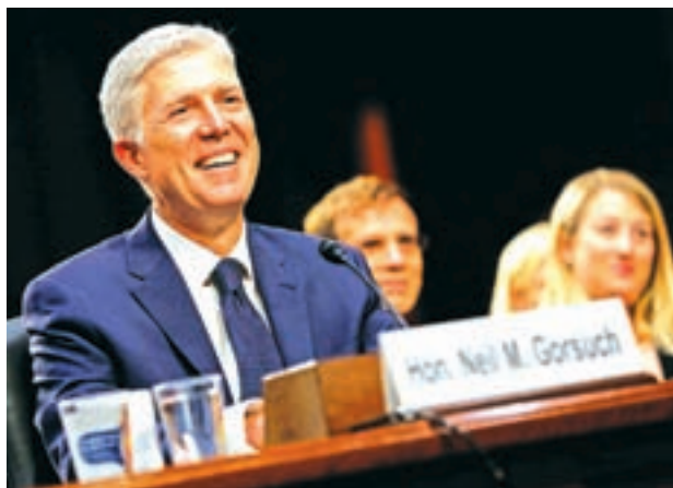
Neil Gorsuch.

The only surprise stumble in the effort came when Trump attacked judges who blocked his order banning US entry by people from certain Muslim-majority countries. Gorsuch distanced himself from the president's Twitter messages.