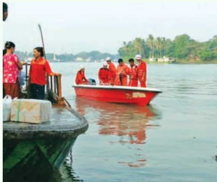
Firemen carrying out search and rescue operation in the Ngawun River in Pathein after the ferry accident.

A systematic investigation should be made into the accident to find the causes and take action against those who are responsible for this tragedy.