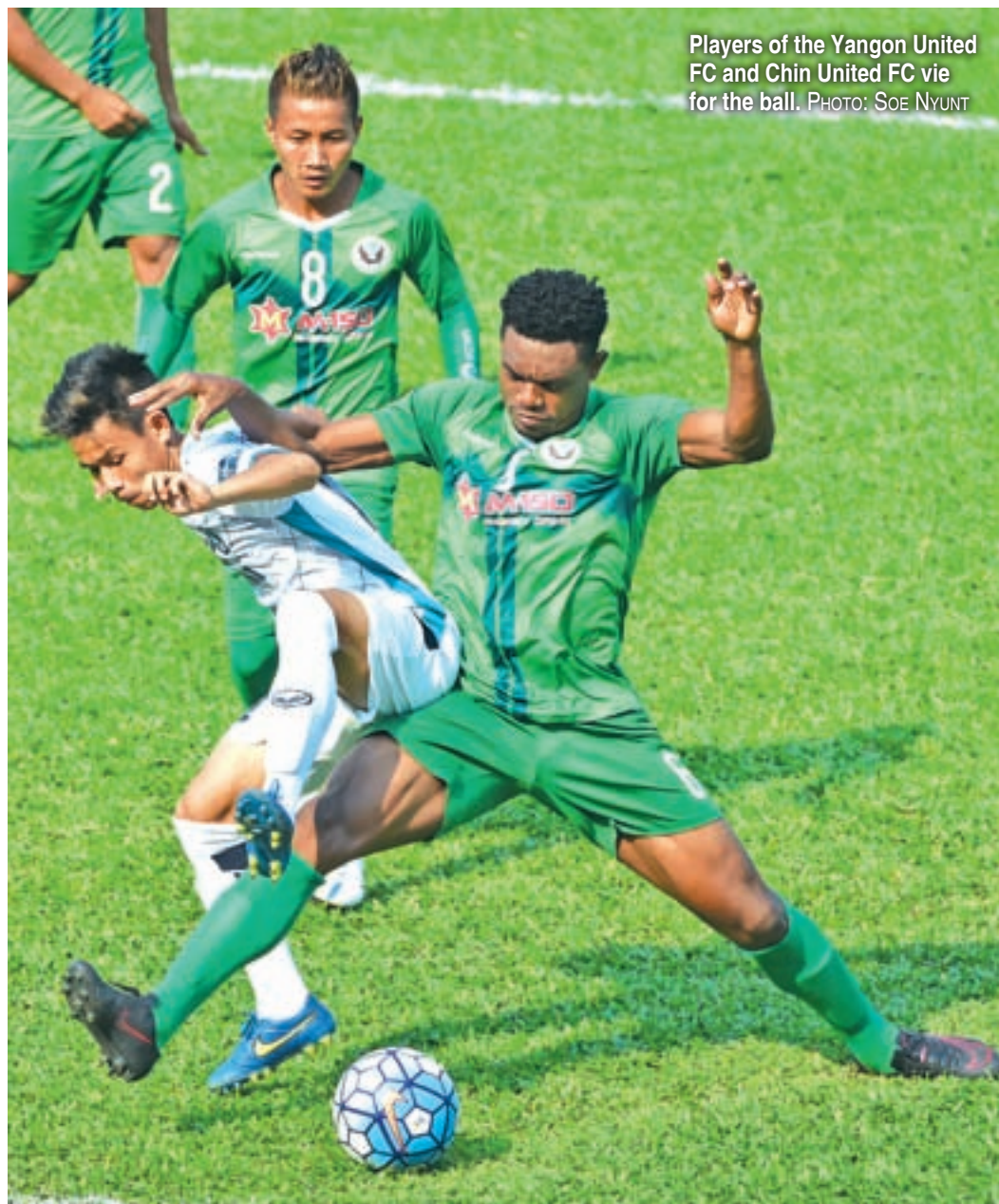
Players of the Yangon United FC and Chin United FC vie for the ball.

"I have sympathy with every manager that is fighting hard to reach their objectives," the Portuguese added. "Some of us, we are sacked in the middle of the season. It's difficult for everyone, so of course I have sympathy."—Reuters