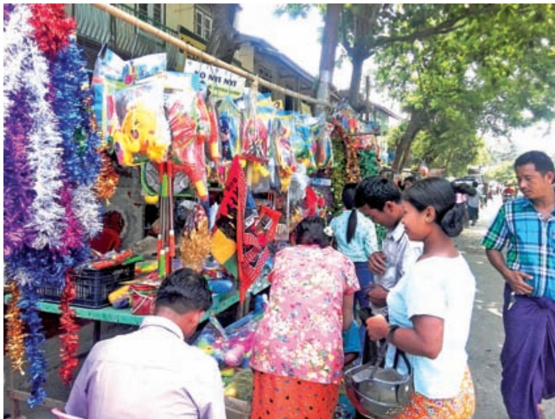
Maungtaung dwellers preparing to celebrate traditional Thingyan festival.