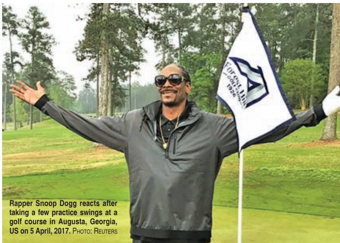
Rapper Snoop Dogg reacts after taking a few practice swings at a golf course in Augusta, Georgia, US on 5 April, 2017.

The marijuana aficionado may not find Augusta National, where