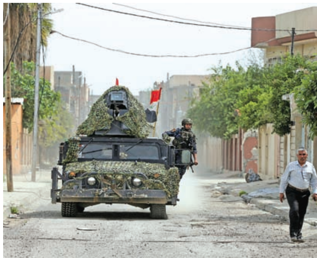
Iraq's Federal Police members patrol the streets of western Mosul, Iraq, on 8 April 2017.

"I fear those (families) who stayed in Daesh's grip met a terrible fate".—Reuters