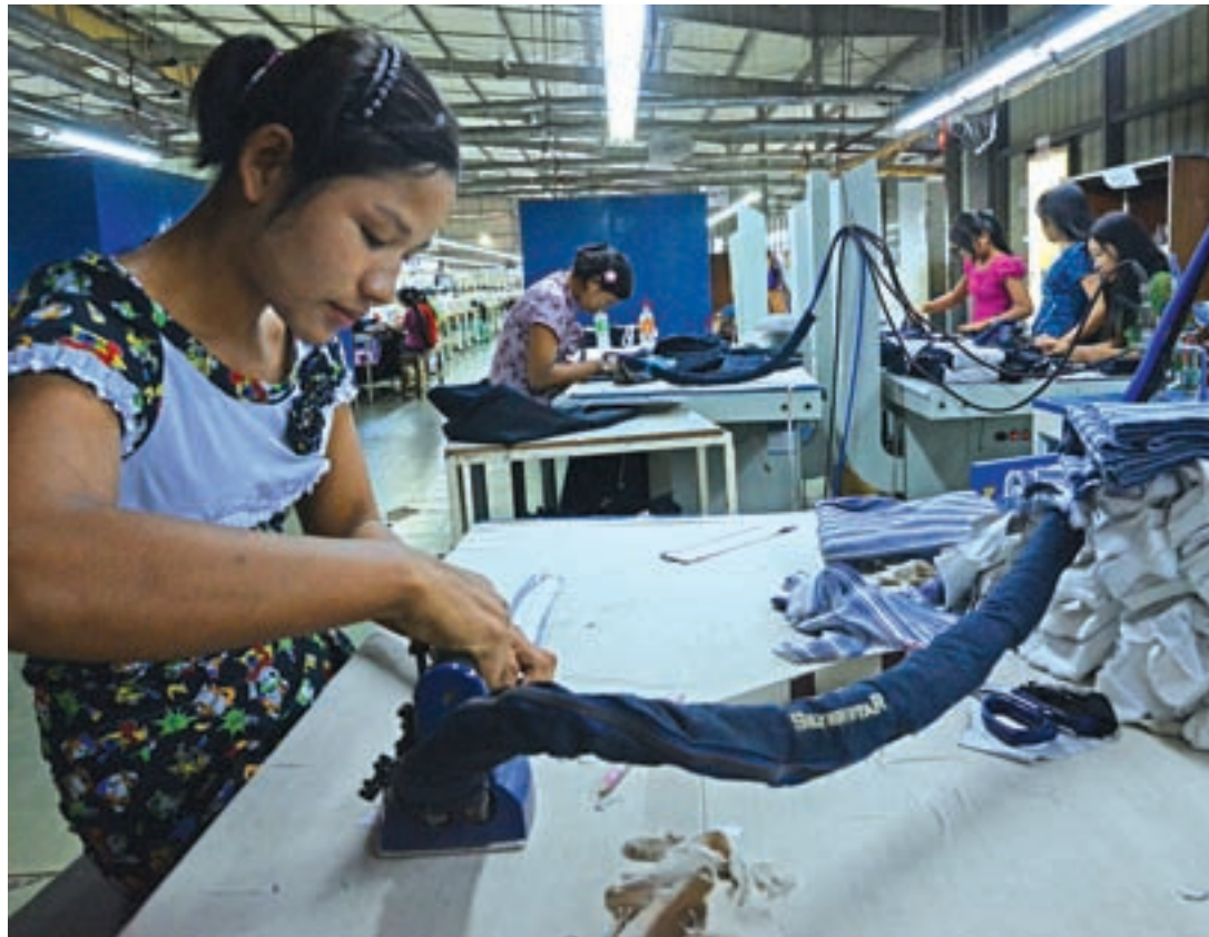
An employee works on production line at a garment factory in Hlaingthaya, Yangon.

The types of new investment businesses also include manufacturing and sales of plastics recycling products; spraying collodion, polyester, imitation silk polyester, eiderdown and related products, construction of office tower, leasing and management of office space; manufacturing and marketing of instant noodles; production and distribution of sales of day old chicks; construction of cinemas and operation of movie show, and