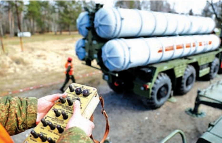
Photo shows Russian-made S-400 Triumf long-range surface-to-air missile systems. The delivery of S-400 anti-aircraft missile systems was discussed in early March between Russian President Vladimir Putin and his Turkish counterpart Recep Erdogan.