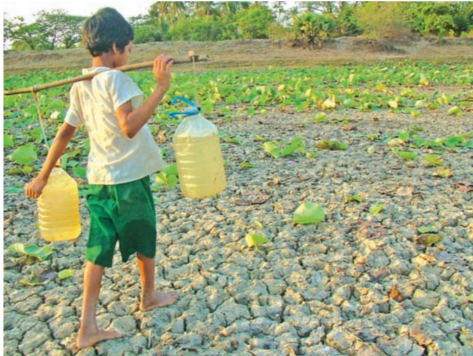
Myanmar has long been struggling with the direct consequences of climate change.