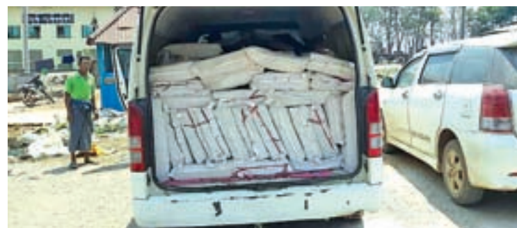
Illegal timber seized at Yaypu Checkpoint in Hsenwi Township. PHOTO: CHIT HLA (IPRD)

wi township forestry department.—Chit Hla (IPRD)