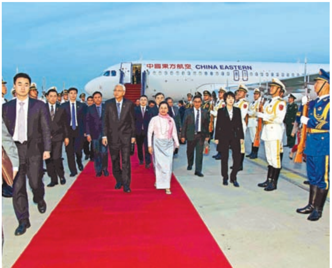
President U Htin Kyaw and First Lady receive red carpet welcoming at Beijing International Airport.

Afterwards, the President and entourage were taken to Diaoyutai State Guest House in Beijing where they will stay.— Myanmar News Agency