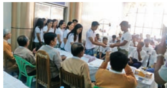
An official from KBZ's BFM presents cash assistance to survivors of the ferry accident.

SURVIVORS of the ferry that capsized in the Ngawun River in Ayeyawady Region and families of the victims have been provided with cash by KBZ's Brighter Future Myanmar Foundation-BFM.