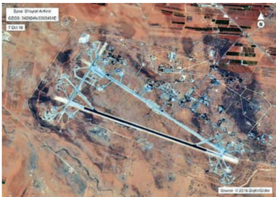
Shayrat Airfield in Homs, Syria in an image released by the Pentagon after announcing US forces conducted a cruise missile strike against the Syrian Air Force airfield.

“We strongly condemn the illegitimate actions by