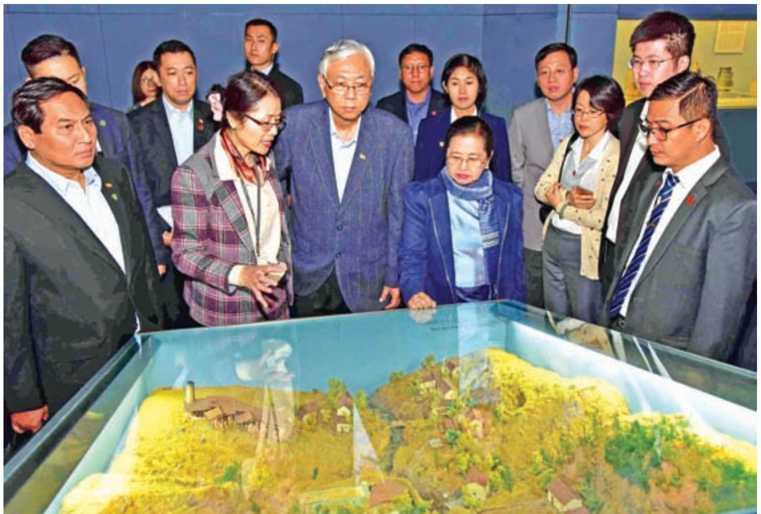
President U Htin Kyaw and First Lady Daw Su Su Lwin visit Shanghai Museum in Shanghai, China.