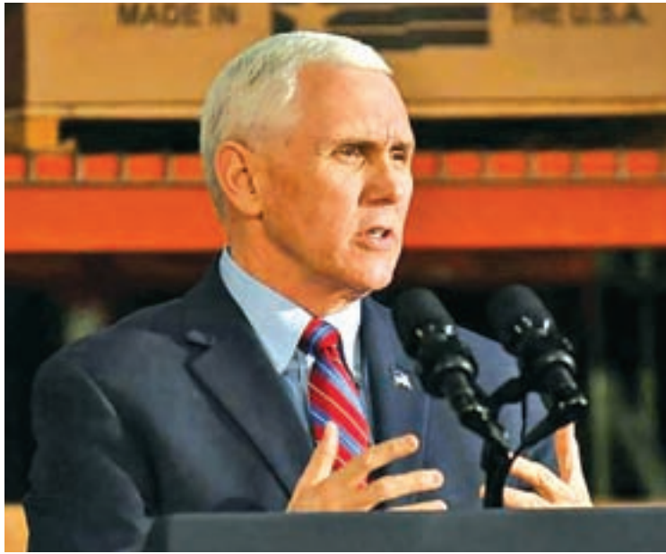
US Vice President Mike Pence in Louisville, Kentucky, US on 11 March, 2017.

BAGHDAD — US Vice President Mike Pence on Saturday assured Iraqi Prime Minister Haider al-Abadi of continued US support to defeat Islamic State, the Iraqi government said in a statement.