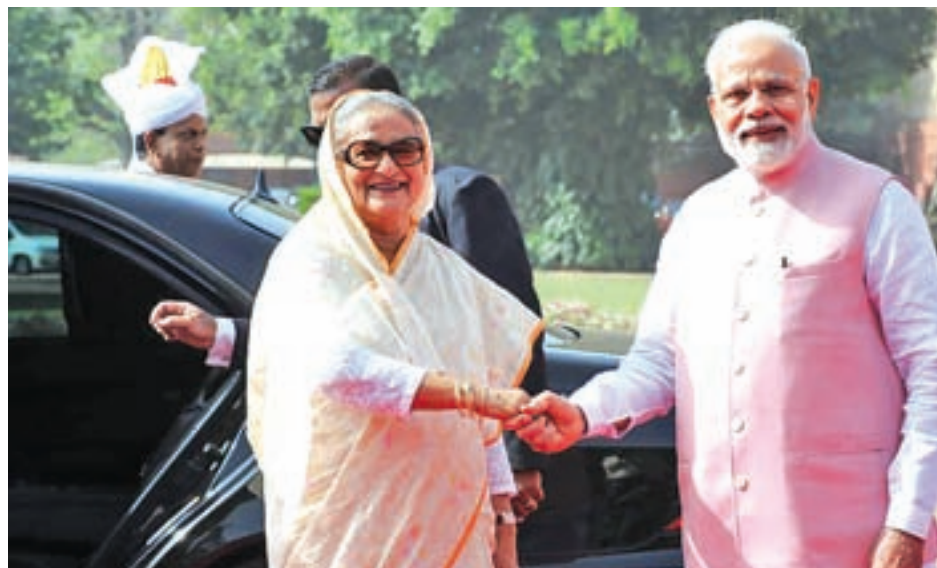
Indian Prime Minister Narendra Modi (R) shakes hands with his Bangladeshi counterpart Sheikh Hasina during the ceremonial reception at the Indian Presidential Palace in New Delhi, India on 8 April, 2017. Hasina is on a four-day state visit to India.