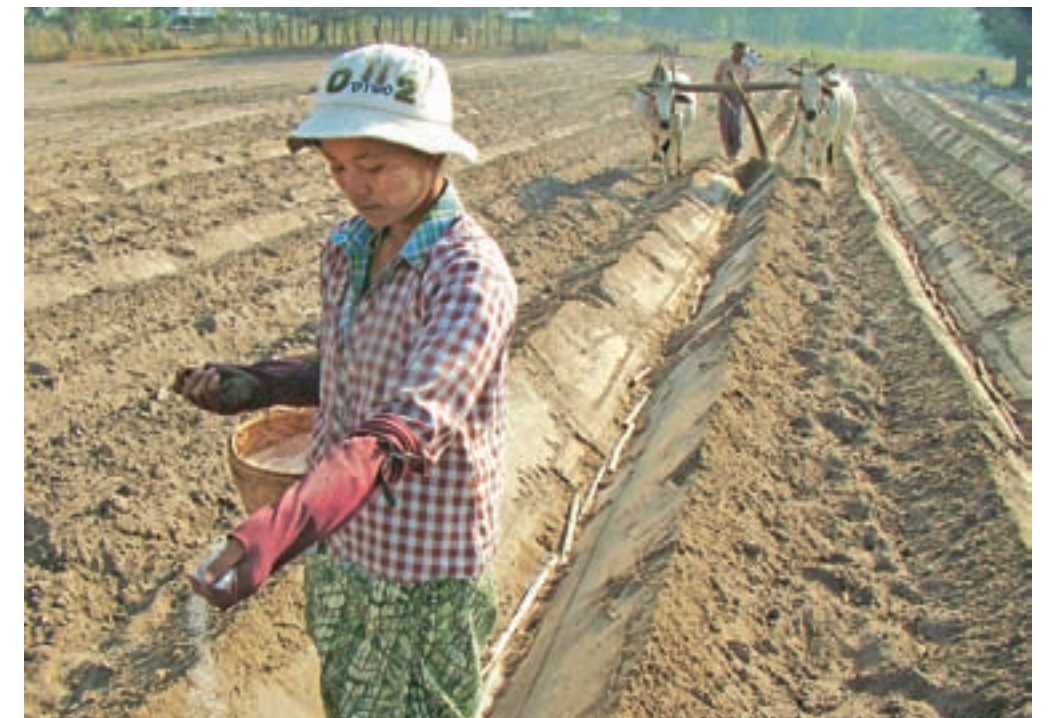
Longer period of drought can make challenges for Myanmar's largest rural population to grow crops and earn a living.

EDITOR'S NOTE: This story was supported by a grant from the Earth Journalism Network. Devex retains full editorial independence and responsibility for this content.