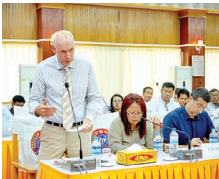
A participant taking part in the meeting.

RAKHINE State Chief Minister U Nyi Pu met coordination committee members and UN and INGO staffs at the state government office yesterday morning.