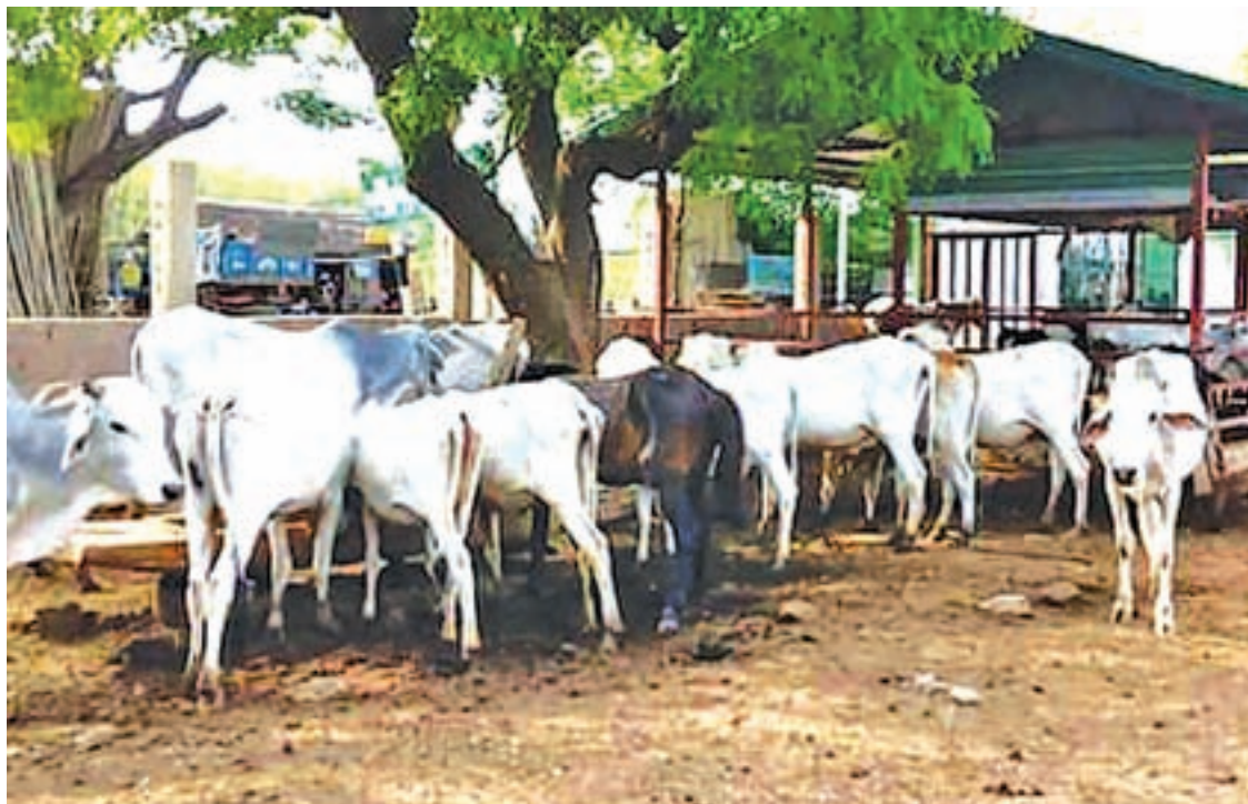
Oxen to be donated to Ingyin Myaing Ngwe Taung monastery in Thabeikkyin township in Mandalay Region.

The past 34 festivals have saved the lives of 207 oxen worth Ks 64.6 million, it is learnt.—MMAL