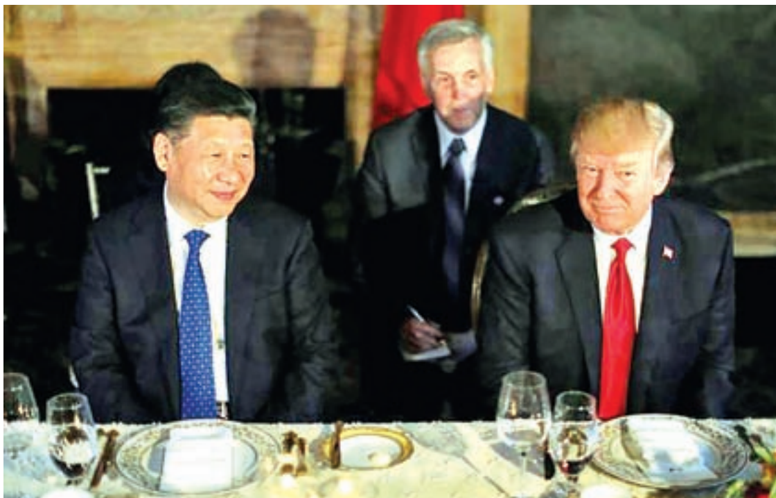
Chinese President Xi Jinping and US President Donald Trump attend a dinner at the start of their summit at Trump's Mar-a-Lago estate in West Palm Beach, Florida, US, on 6 April 2017.

Xi and his wife, Peng Liyuan, joined Trump and his wife, Melania, at a long table in an ornate candle-lit private dining room festooned with red and yellow floral centerpieces, where they dined on