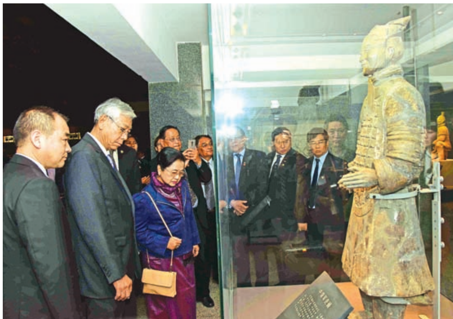
President U Htin Kyaw and First Lady Daw Su Su Lwin observe a Terracotta warrior in Xi'an museum, Shaanxi Province, China.