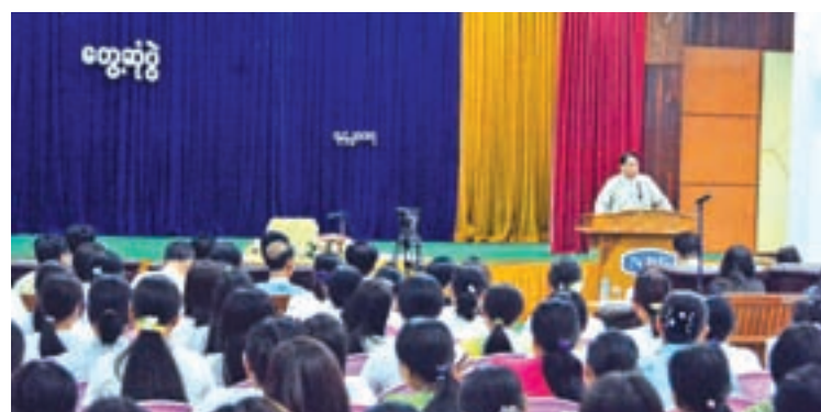
Union Minister Dr. Pe Myint speaking at the meeting with staff from the News and Periodicals Enterprise in Nay Pyi Taw.

At the meeting, the Union Minister cordially heard the necessities presented by the staff and fulfilled their requirements. Afterward, the Union Minister inspected the MRTV broadcasting work, Master Control Room, Convergence News Room, and the studio of National Races Channel.— Myanmar News Agency