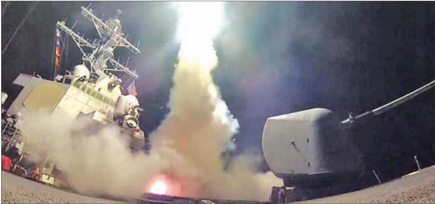
US Navy guided-missile destroyer USS Porter (DDG 78) conducts strike operations while in the Mediterranean Sea which US Defence Department said was a part of cruise missile strike against Syria on 7 April 2017.