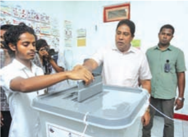
Maldivian Jumhooree Party presidential candidate Qasim Ibrahim (2nd R) casts his vote at a polling station during the presidential elections in Male, on 9 November 2013.