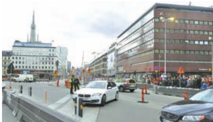
Police officers guard near the department store in central Stockholm, Sweden, on 7 April 2017.