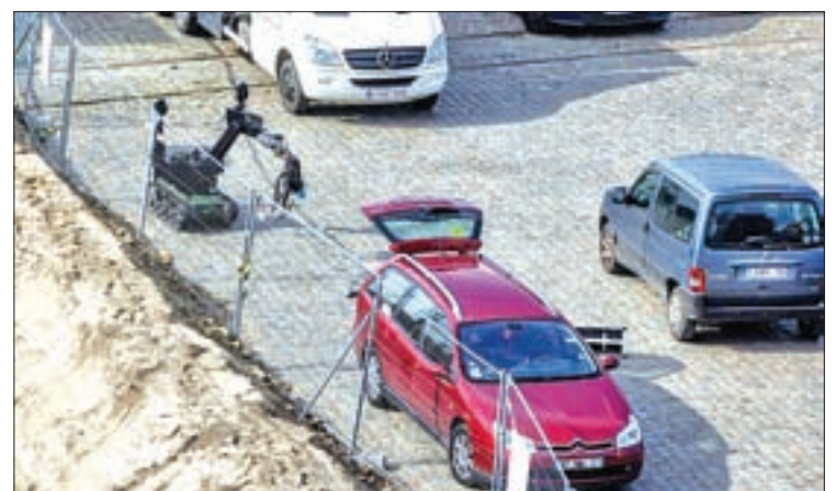
A bomb disposal robot is seen removing items from a car which had entered the main pedestrian shopping street in the city at high speed, in Antwerp, Belgium, on 23 March 2017.

The previous day, police had shot dead a British man at the Houses of Parliament after he had rammed dozens of people with his car on Westminster bridge. He killed five people.—Reuters