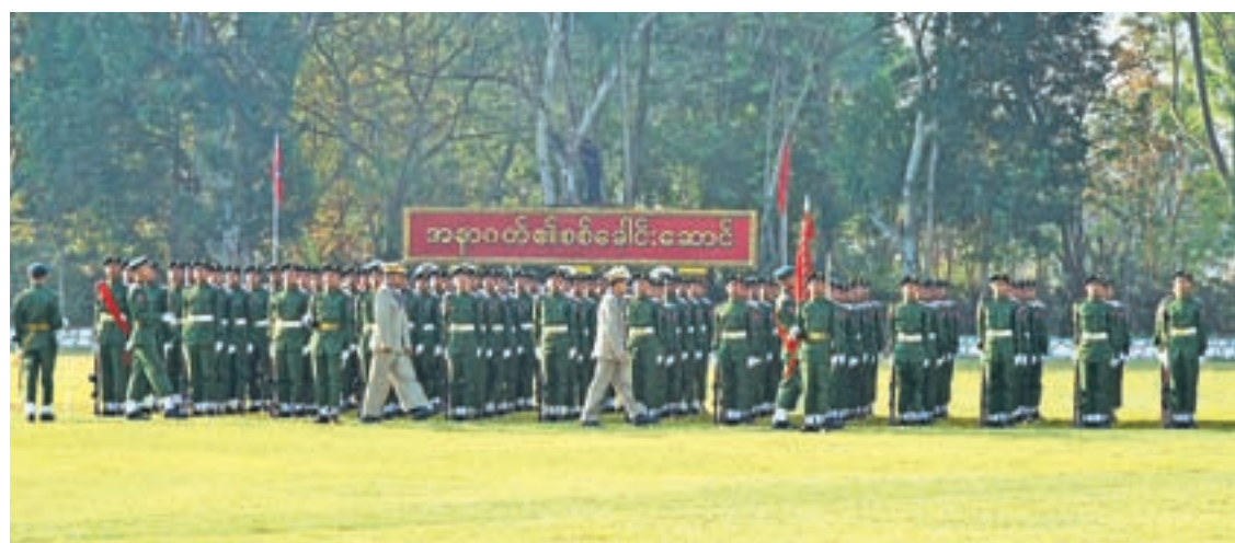
Vice-Senior General Thiripyanchi Soe Win inspects graduation parade of the cadets at the OTS in Bahtoo Station.