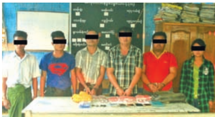
Detained five suspects and seized drugs.

Police have filed charges against all suspects who were in possession of 29,800 Yaba tablets worth Ks84.9 million under sections 15/19(A)/20 of the Anti-Narcotic Drugs and Psychotropic Substances Laws. — Than Oo (Lemyithna)