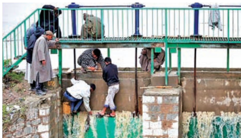
People try to stop water flowing through the gate of a flood channel after incessant rains in Srinagar, on 7 April 2017.

"We are relieved as the water level is receding and the rains are reducing," said one resident. "We are praying that rain should stop."—Reuters