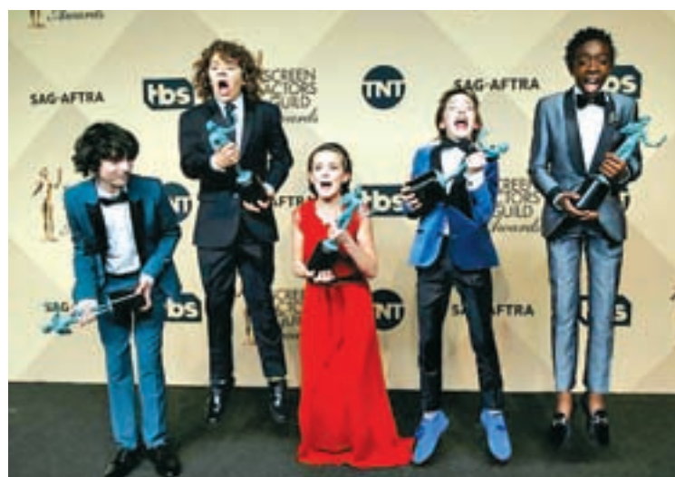
The cast of 'Stranger Things' poses with the awards they won for Outstanding Performance by an Ensemble in a Drama Series backstage at the 23rd Screen Actors Guild Awards in Los Angeles, California, US, on 29 January 2017.

New categories this year include best American story, for a TV show or movie that showcases America at its "open and diverse" best. MTV said "best fight against the system" (formerly best fight) will recognize the TV show or movie whose characters exemplify a fight "against a system that tries to keep them down."—Reuters