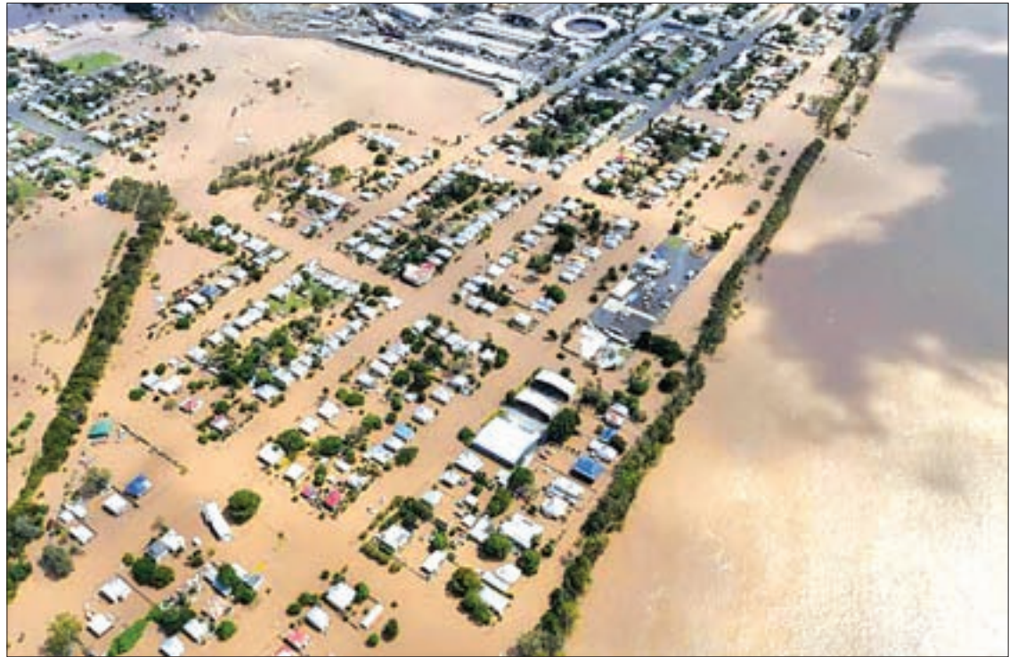
Houses are surrounded by floodwaters adjacent to the Fitzroy River (R) brought on by Cyclone Debbie in Rockhampton, Australia, on 6 April 2017.

Back in Australia, the disaster zone stretched 1,000 km (600 miles) from Queensland state's tropical resort islands and Gold Coast tourist strip to the farmlands