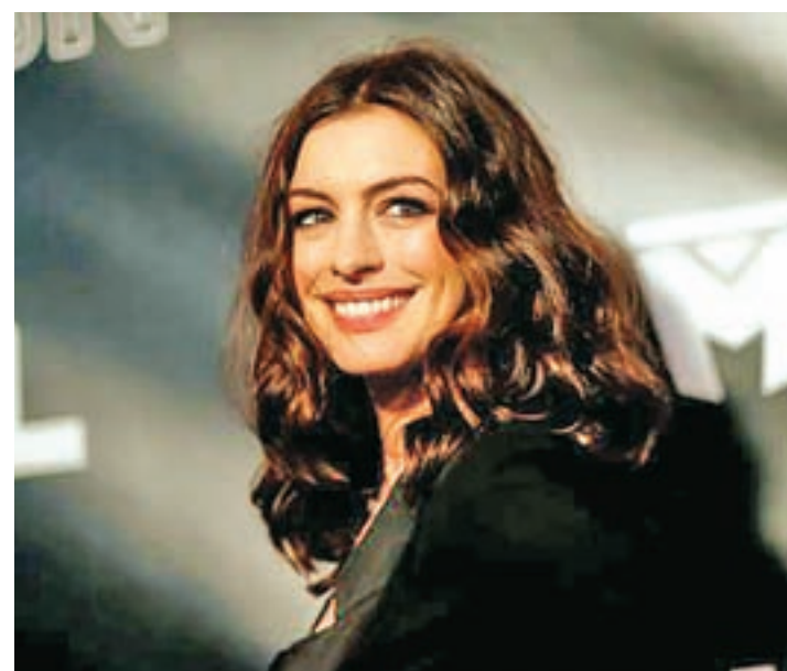
Cast member Anne Hathaway poses at the premiere of the movie "Colossal" in Los Angeles, California, US, on 4 April 2017.