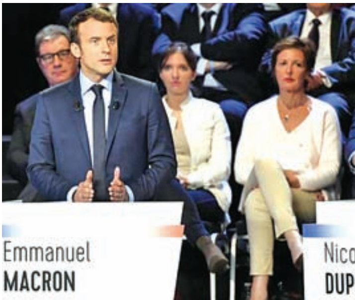
Emmanuel Macron of the political movement En Marche ! (Onwards !) attends a prime-time televised debate for the candidates at French 2017 presidential election in La Plaine Saint-Denis, near Paris, France, on 4 April 2017.