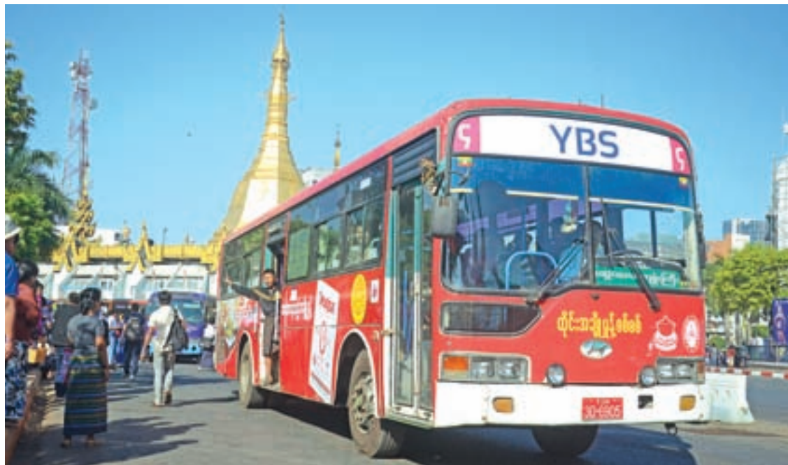
YBS No 4 runs at Sule bus-stop in Yangon.