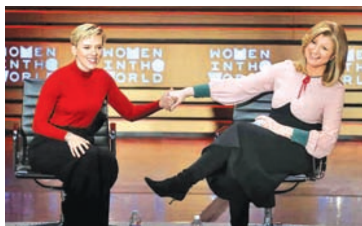
Actress Scarlett Johansson (L) embraces Arianna Huffington, founder and CEO of Thrive Global, during the Women In The World Summit at the David H. Koch Theater at Lincoln Center in New York City, NY, US on 6 April 2017.

"I would never rule anything out, but I have a very full life right now," she added.—Reuters