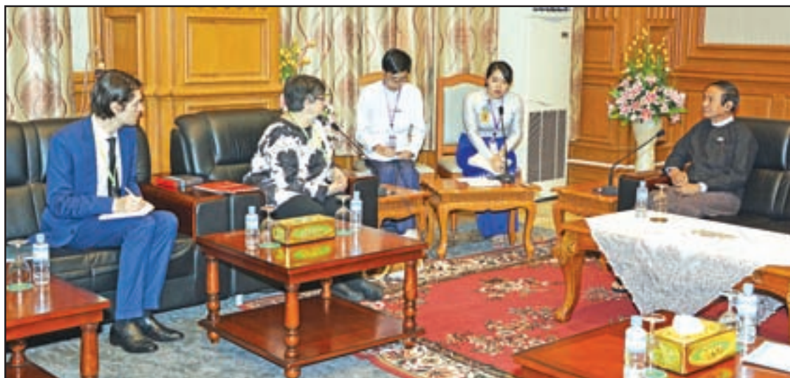
Pyithu Hluttaw Speaker U Win Myint receives Former President of Switzerland Ms. Ruth Dreifuss in Nay Pyi Taw.