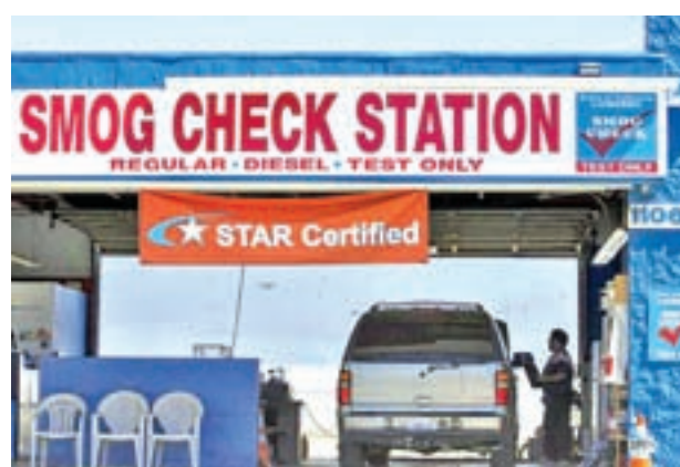
A vehicle has its emissions tested at a smog testing facility in Oceanside, California, US in 2015.

They also alleged that fees connected with the purchase of pollution allowances amounted to a tax. Because California's landmark Proposition 13 tax reform law prohibits the legislature from passing new taxes without a two-thirds majority, the Chamber of Commerce and its fellow plaintiffs argued that the system of fees and