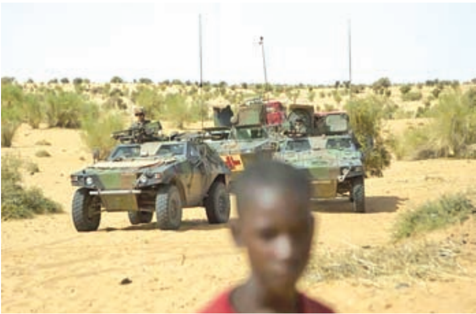
French soldiers from Operation Barkhane patrol north of Timbuktu on 6 November 2014.

Myanma Oil and Gas Enterprise Ministry of Electricity and Energy