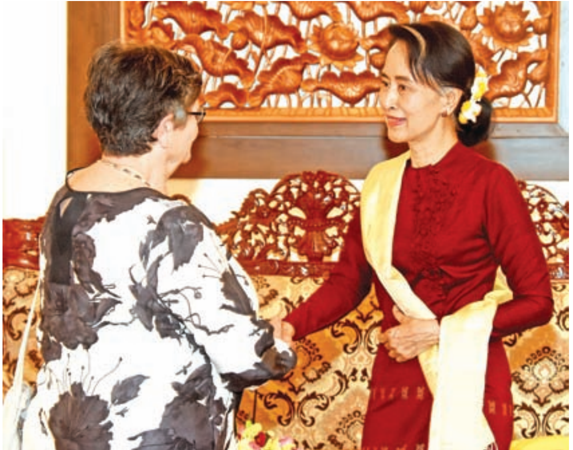
State Counsellor Daw Aung San Suu Kyi welcomes Ms. Ruth Dreifuss, Chair of Global Commission on Drug Policy (GCDP) and Former President of Switzerland, in Nay Pyi Taw.

yesterday. During the meeting, they exchanged views on matters pertaining to the work of the GCDP as an international player in drugs policies, and root causes and challenges in prevention and elimination of narcotic drugs.