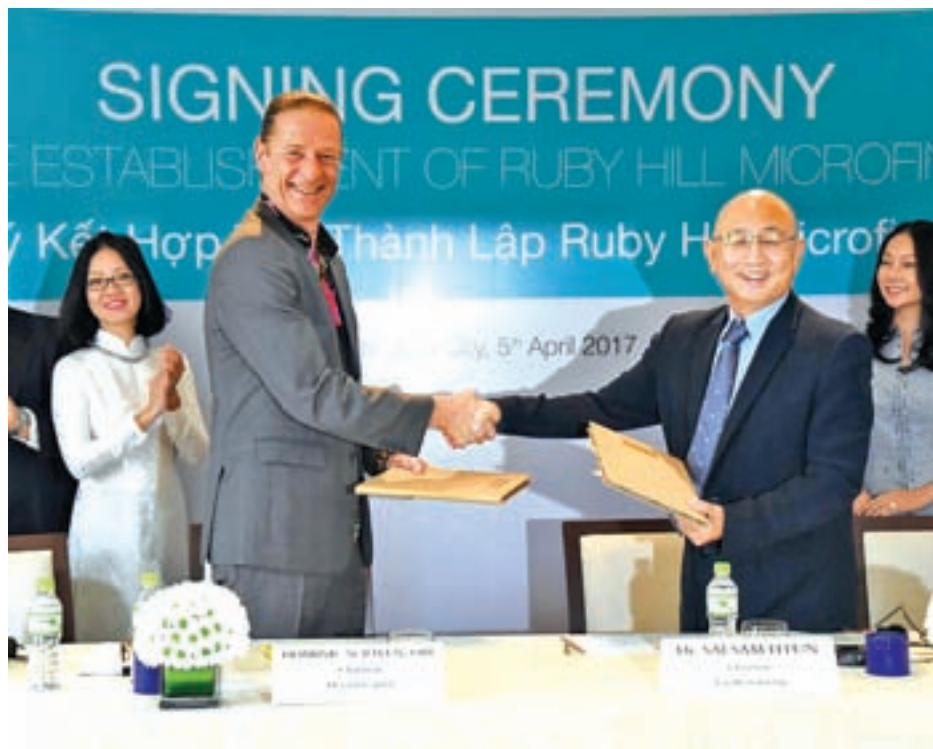
A signing ceremony between Myanmar's Ruby Hill Microfinance Co and Dragon Capital Group on 5 April.

Dragon Capital, the earliest investment fund in Viet Nam, manages $1.5