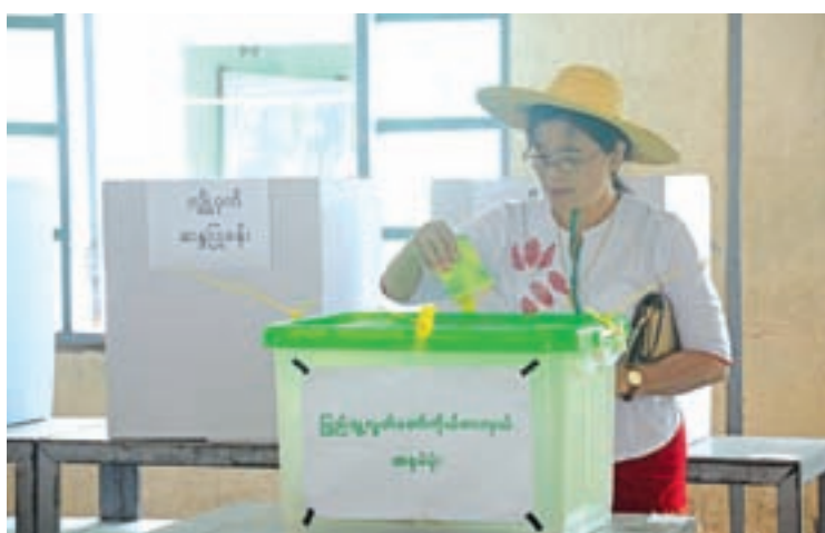
A woman casts a vote in the by-election in Yangon.

strongest supporters and sponsors of Myanmar's democratic transition, as well as investing financial backing in development and the ongoing peace process.