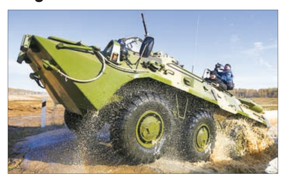
Thailand is also interested in other kinds of equipment — in particular, the air defense systems.

'Negotiations on the delivery of the Mi-17V-5 military transport helicopters to the Kingdom of Thailand are in the final stage. The draft contract has been agreed on, and we hope to sign it in the near future," he said. The source added that no talks are underway with Thailand regarding potential contracts on other types of weapons. "This