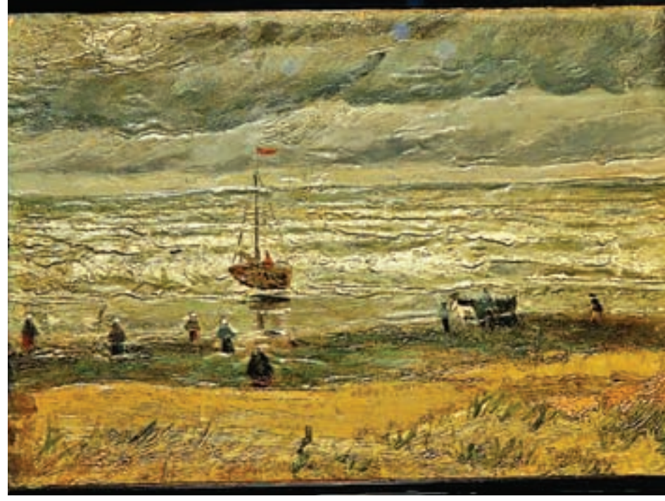
The canvas 'View of the Sea at Scheveningen', one of the two recovered paintings by Vincent van Gogh which were stolen from the Van Gogh Museum in 2002, is pictured at the van Gogh Museum in Amsterdam, Netherlands, on 21 March 2017.