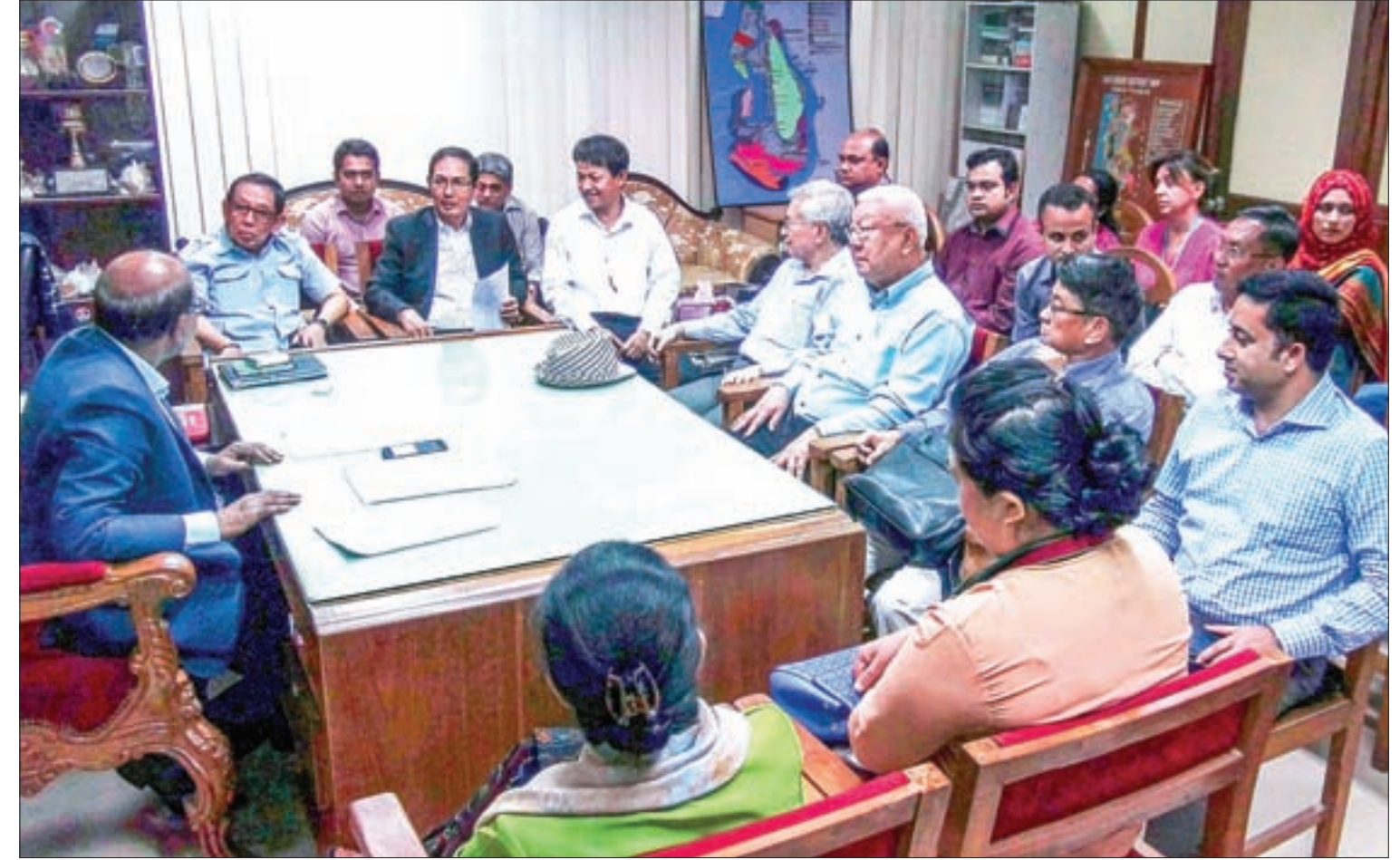
Members of the Maungtaw investigation commission hold talks with Bangladeshi authorities in Cox's Bazaar, Bangladesh.

The aim of Maungtaw Investigation Commission is to submit suggestions, practical solutions, and assessments of the problems SEE PAGE 3 >>