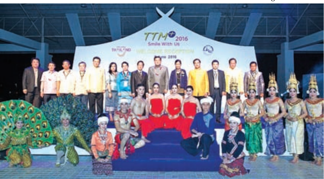
Performers and officials from the Ministry of Hotels and Tourism at the 2016 Thailand Travel Market.

The Ministry of Hotels and Tourism is in a mission of turning Myanmar into a new popular tourist destination of the world while protecting the natural environment and ancient cultural heritages with all out efforts.