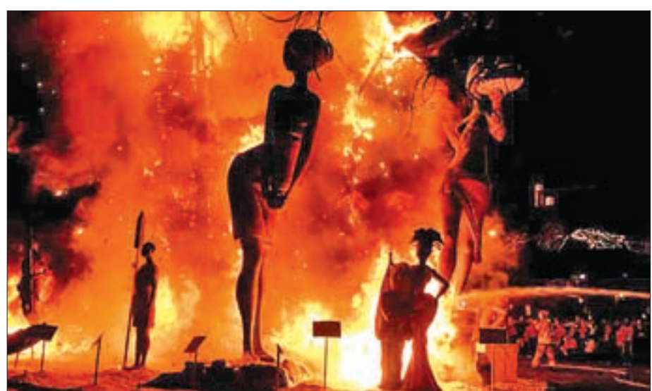
Figures of a Fallas monument are burning during the finale of the Fallas festival, which welcomes spring and commemorates Saint Joseph's Day, in Valencia early, on 20 March 2017. Photo: Reuters

The sculptures are put on display beforehand, with the public voting to save their preferred figure from the flames.— Reuters