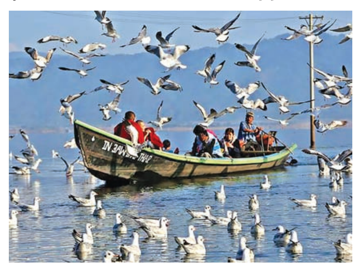
Birds soar near a visitor boat in Indawgyi lake in Mohnyin, Kachin State, which is to be preserved.