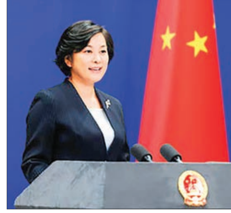
Chinese Foreign Ministry spokeswoman Hua Chunying.

"China places great importance on the preservation of the South China Sea's ocean ecology, this is certain," Chinese Foreign Ministry spokeswoman Hua Chunying told a daily news briefing.