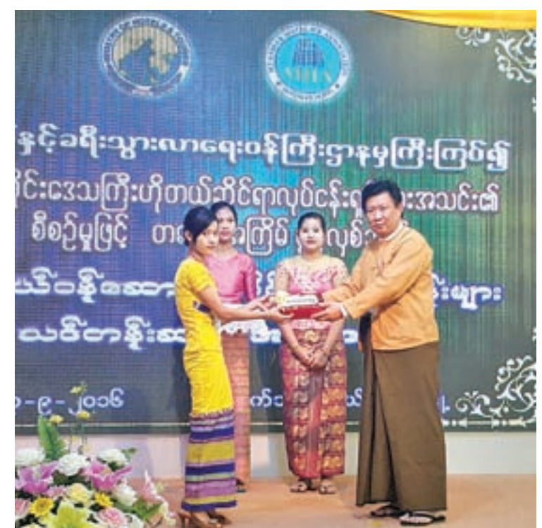
A participant accepting a prize at the Hotels and Tourism training course in 2016.