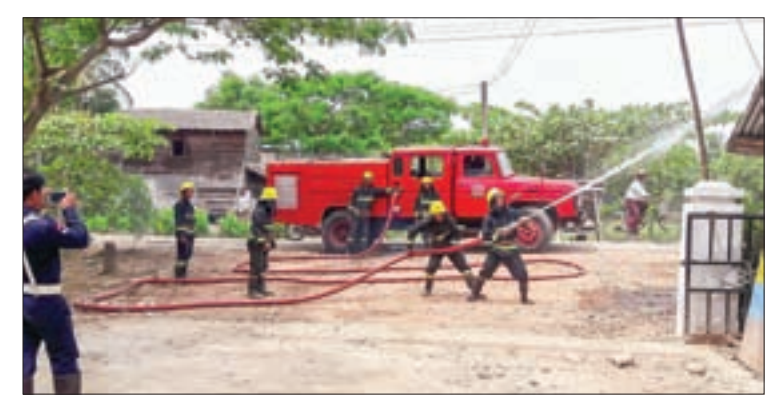
Firefighters conduct five drill.