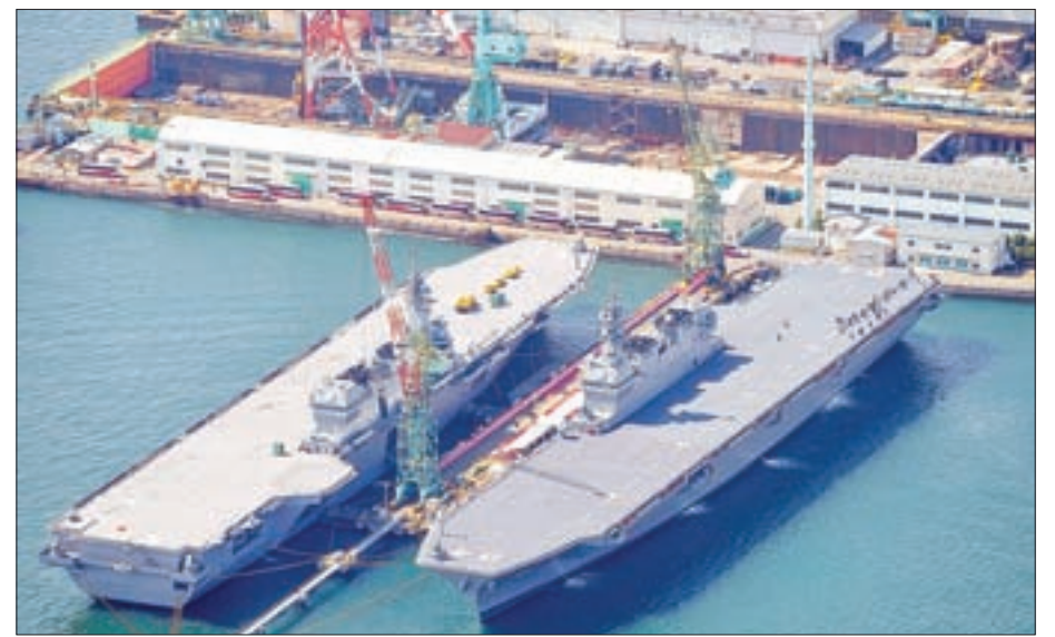
Japan Maritime Self-Defence Force's (JMSDF) latest Izumo-class helicopter carrier DDH-184 Kaga (R) is seen next to JMSDF's helicopter carrier Izumo in Yokohama, Japan on 22 March 2017.

A ceremony to mark its retirement was held the same day at the Sasebo naval base in Nagasaki, southwestern Japan.