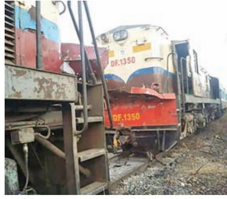
A head-on collision on Mandalay-Myitkyina railroad.

The accident damaged both locomotives.—MNA