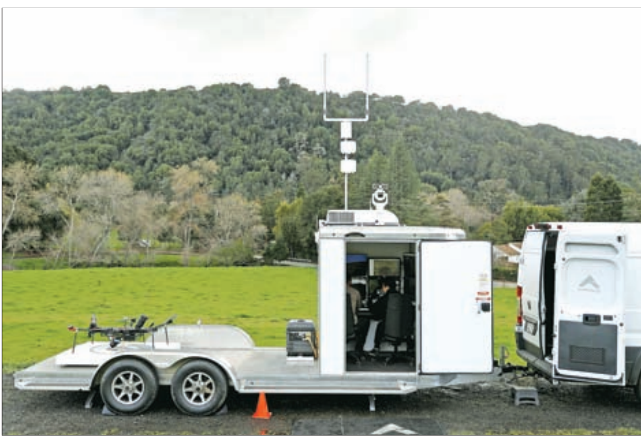
An Airspace Systems Interceptor autonomous aerial drone sits on its mobile launchpad and command center during a product demonstration in Castro Valley, California on 6 March 2017.