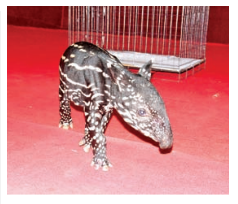
The rare Tapir is seen at Kawthoung Forestry Dept.

There are 130 villages in Pindaya township and 90 villages in Ywar Ngan township. —Min Min