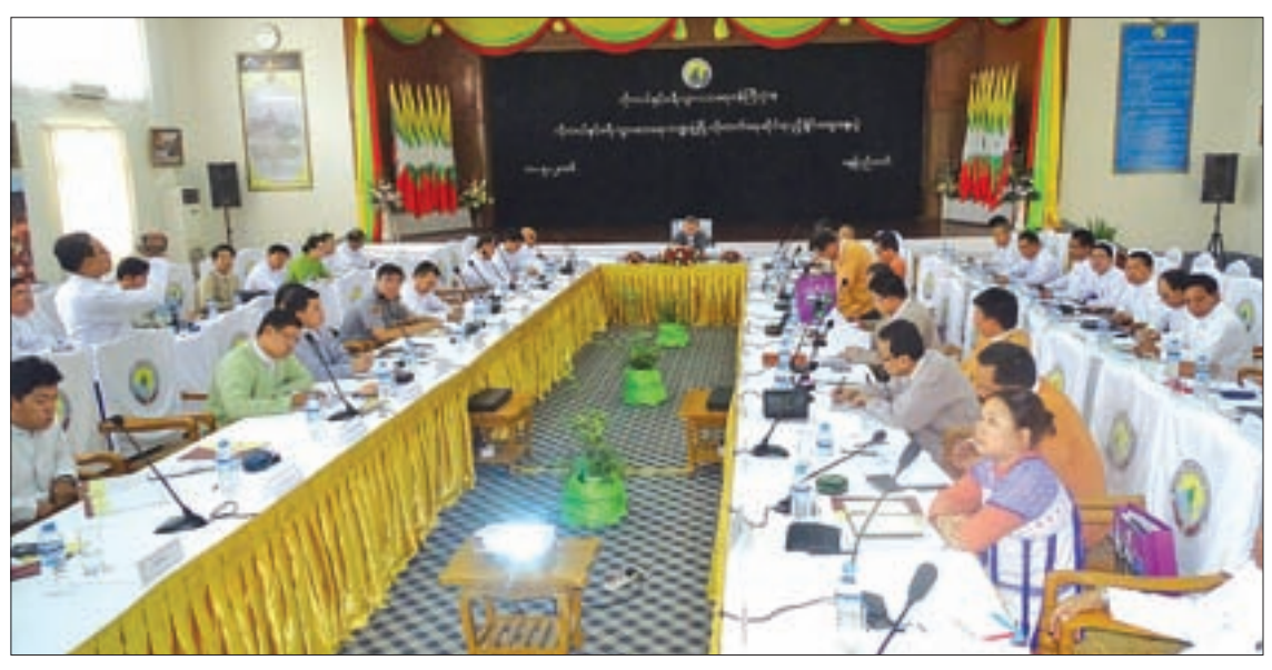
Officials attending a meeting by the Ministry of Hotels and Tourism to discuss on possible developments in the sector.

During its one-year period the government in office extended the community-based tourism in the villages of Pindaya and Ywangan townships of Danu region in Shan State, Loinwe Phayataung Yayseil Village-Tract and Sakar Village in Nyaungshwe Township, Majeegan Village in Sale Township, Magway Region, Hsawlaung Village in Kanpetlet Township, Chin State, Hsintaung Village in Thazi Township, Meiktila District, Mandalay Region, Kyaikthale Village-Tract in Twantay Township, Yangon Region, Zalon Mountain, and Khamoe, Nyaungthaya