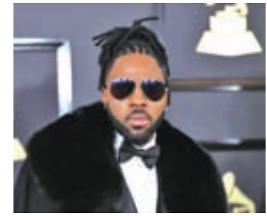
Singer Jason Derulo.

"The role has to be perfect for me, the storyline has to be perfect for what I'm trying to portray first and maybe it's not the lead