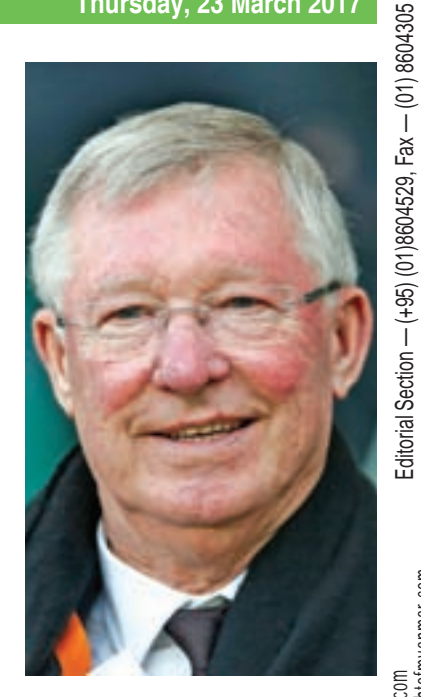
Sir Alex Ferguson.

United visit Belgian outfit Anderlecht in the first leg of their Europa League quarter-final on 13 April before hosting the return a week later.—Reuters