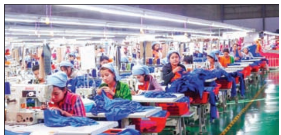
Workers at a garment factory. Employment has increased in recent years.