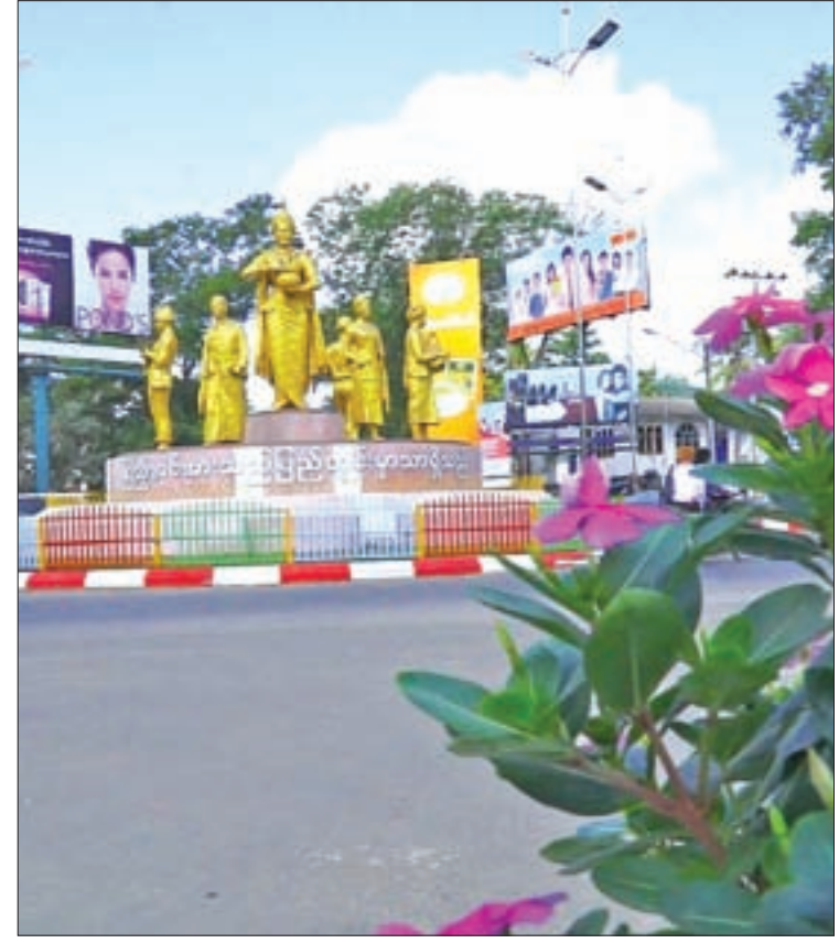
Statues of national races are erected in downtown Pathein.