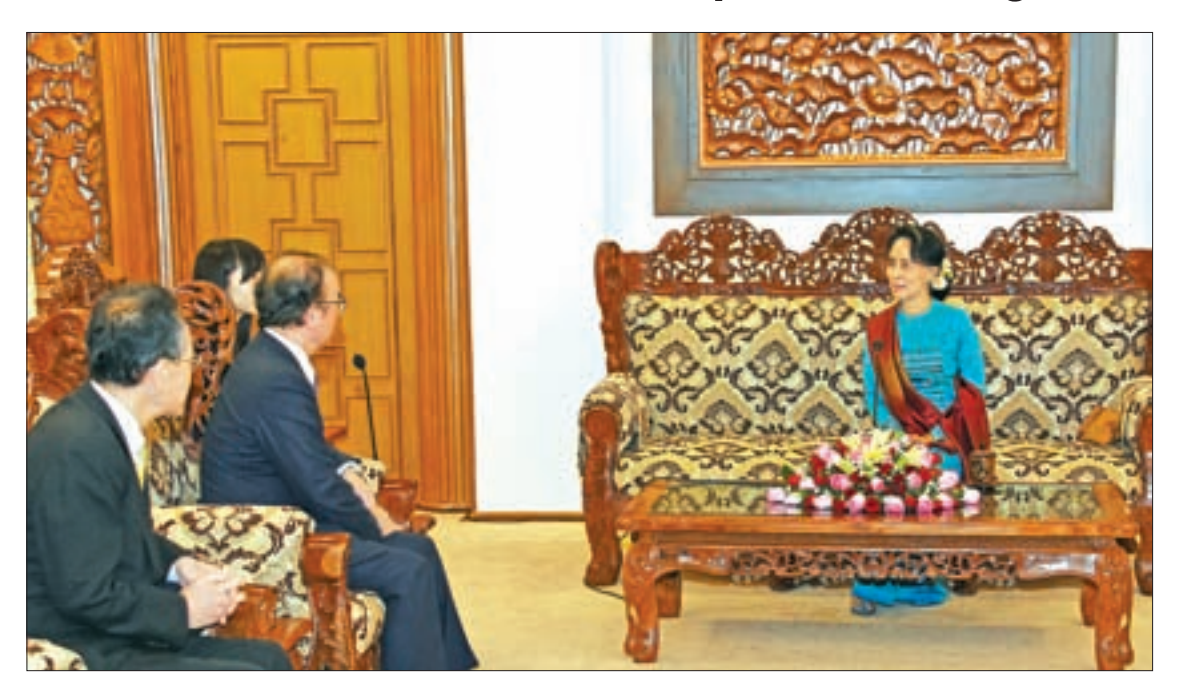
State Counsellor Daw Aung San Suu Kyi holds talks with Mr. Tadashi Ogura.

Minister for Foreign Affairs Daw Aung San Suu Kyi received the