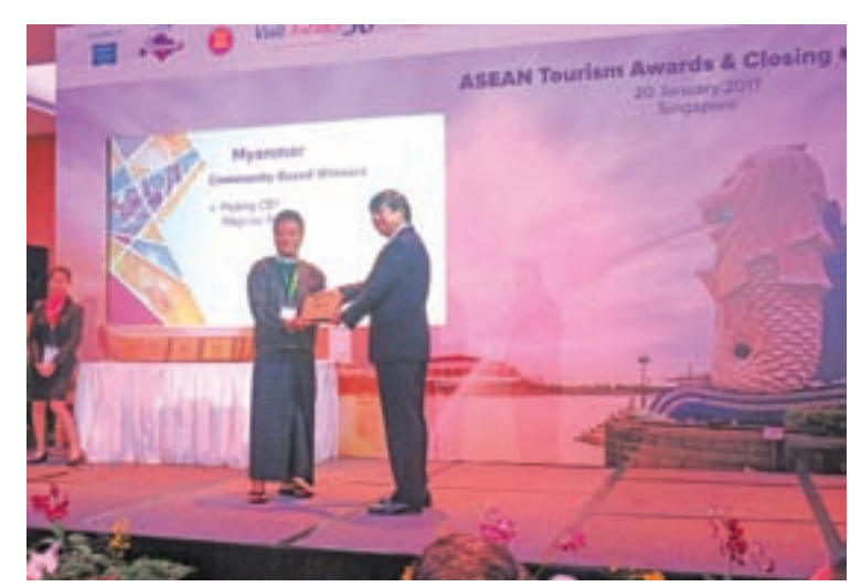
CBT (Award) winner from Myaing, Magway Region accepts prizes in Singapore.