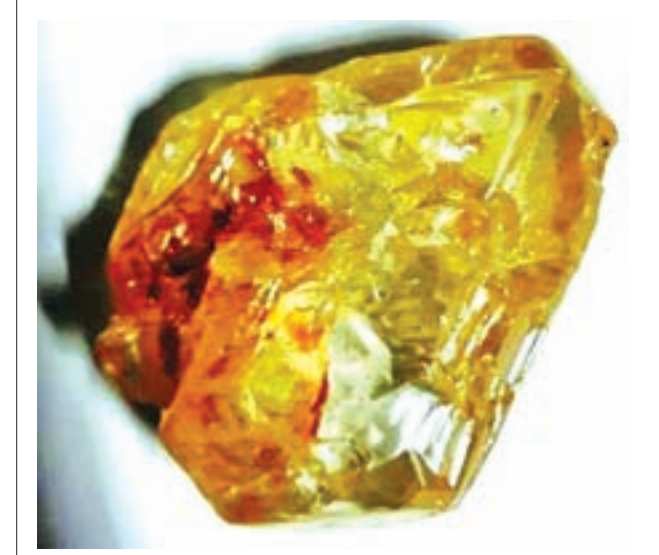
An undated picture released 16 March 2017 of a 706-carat diamond discovered by pastor Emmanuel Momoh in eastern Sierra Leone. Photo: Reuters

A 1,111-carat diamond was unearthed in a Botswana mine in 2015. —Reuters