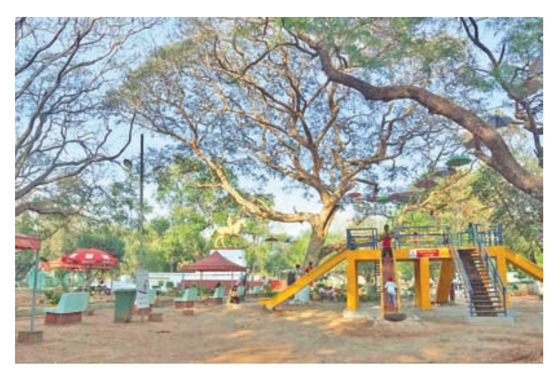
People spending their leisure time at Bogyoke Park in Magway.

A plan to issue citizenship scrutiny cards to the locals was carried out in Magway Region from 1 November 2016 to 2020 with the arrangement of the regional government. As part of the first phase of the plan, the 10year citizenship scrutiny cards were issued to 42,272 people and 18-year citizenship scrutiny cards to 16,508 persons totaling 58,780 citizens from 57 schools in 193 village-tracts and nine wards during the period from 1-11-2016 to 28-2-2017. Citizenship scrutiny cards were issued to the 49.01 percent of the people in Magway Region who have yet to apply national identity cards, within three months of the plan.