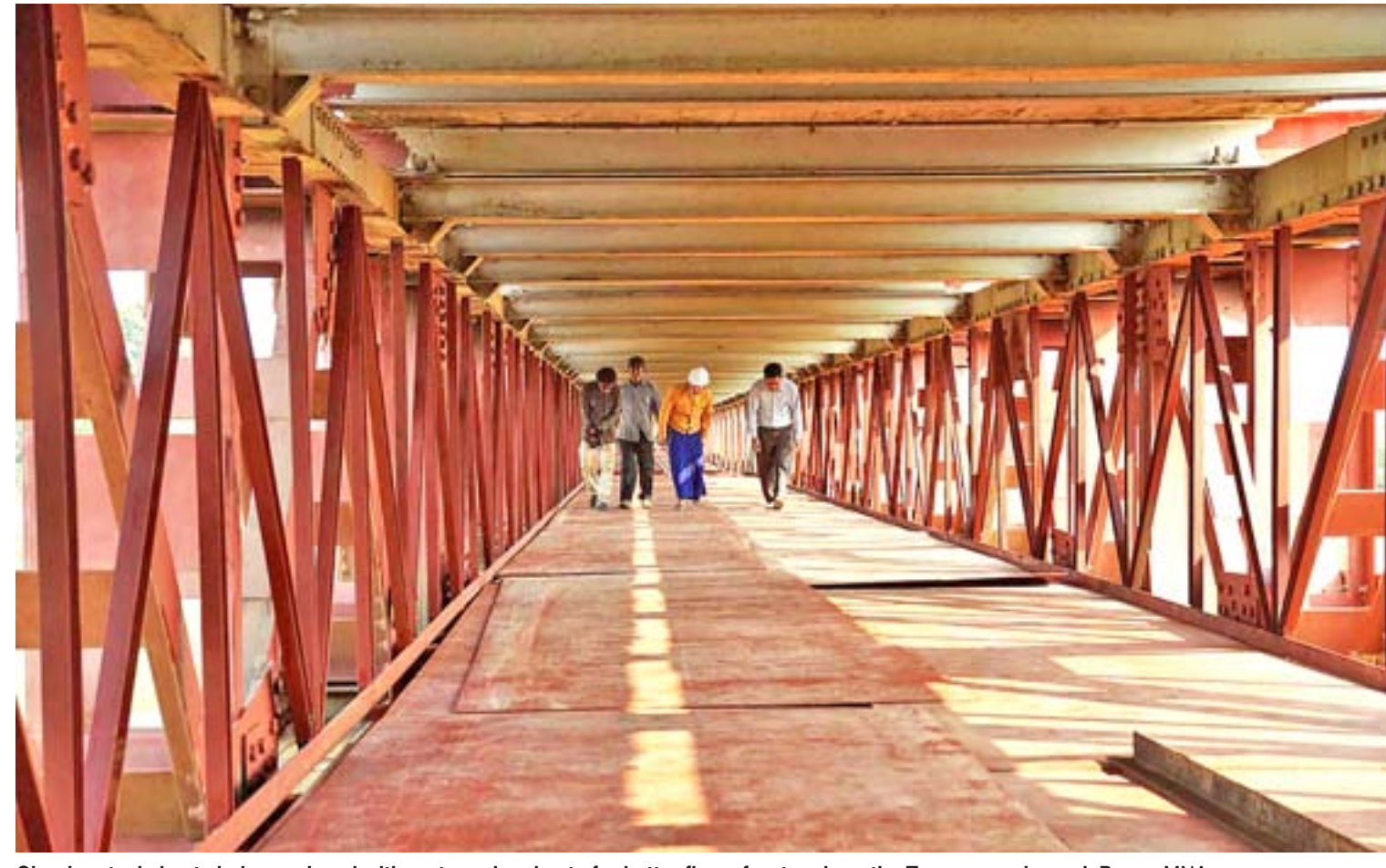
Circular steel sheets being replaced with rectangular sheets for better flow of water along the Taungman channel.

With a view to offering better services to the public, winning public trust in nurturing effective services and practicing check and balance system among government departments in fulfilling basic necessities of the people in Magway Region, 14,429 times of public services by the General Administration Department, 12,622 times by the Myanmar Police Force, 3,865 times by