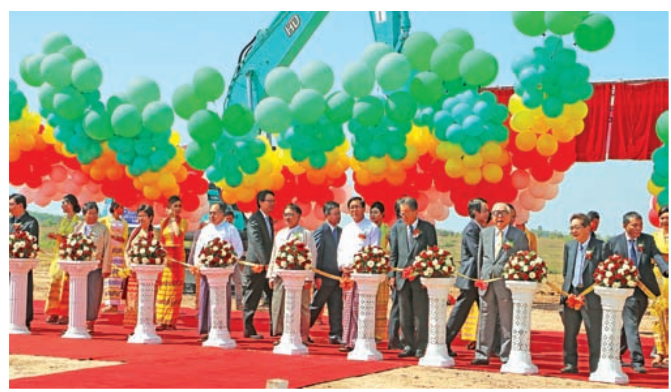
Officials of the Ministry of Commerce take part in commencing ceremony of Thilawa Special Economic Zone on 24 February.