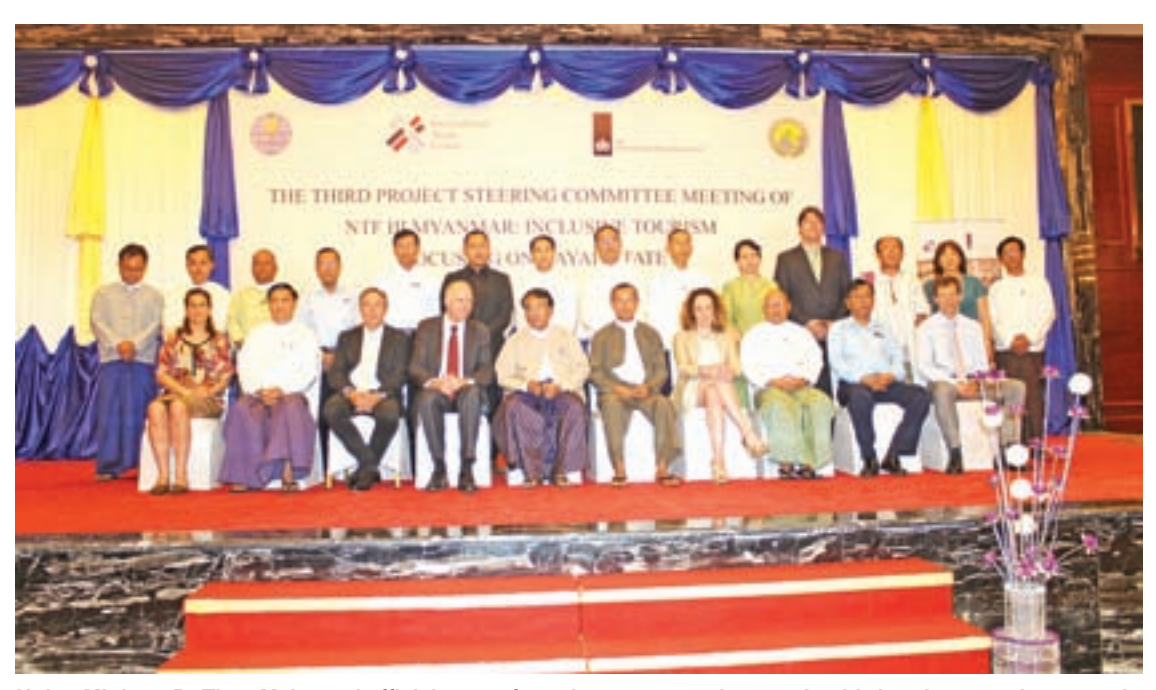
Union Minister Dr Than Myint and officials pose for a documentary photo at the third project steering committee meeting of NTF III Myanmar.

was managed to have been implemented for people to be able to observe. For informing the public concerning the performances of the Ministry, commerce website, Myanmar Trade Website, trade promotion Website, Consumer Website, National Trade Portal and Trade Repository Website, Commerce Journal Website have been posted.