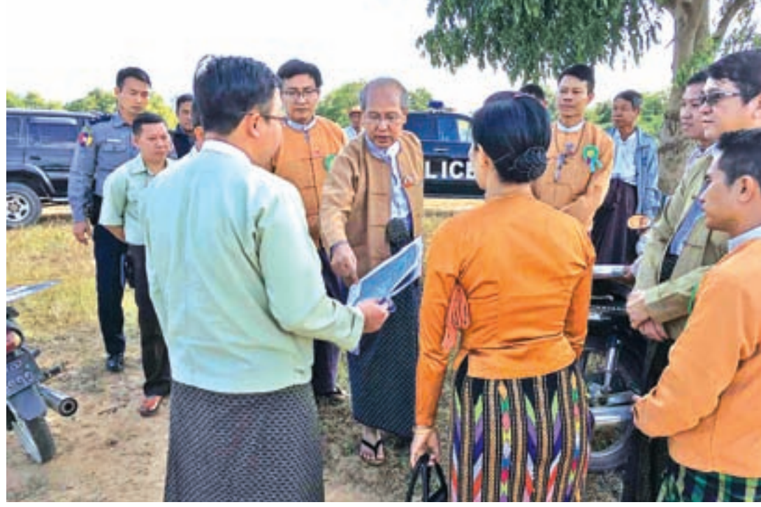
Magway Region Chief Minister assists in establishing new plots for residents in Sedoktara.

As regards the education sector, altogether 97 schools big and small were upgraded with the emergence of new school buildings, utilizing K 930.150 million to meet the set standards. At the same time, a total 352 schools were provided with 11051 desks using the funds to the value of K 472.319 million for the conveni-