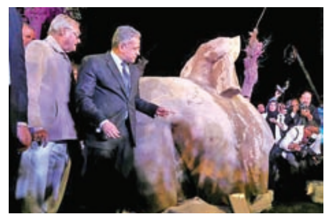
Prince Henrik of Denmark (L) and Egyptian Minister of Antiquities Khaled Al-Anani stand beside the colossus now believed to be of King Psammetich I in Cairo, Egypt, on 16 March 2017.

CAIRO — A massive eight-meter statue discovered in the ground water of a Cairo slum this month is likely not a depiction of the revered Pharaoh Ramses II as first believed, Antiquities Minister Khaled Al-Anani said on Thursday.