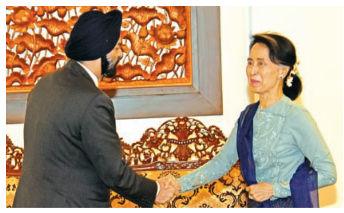
State Counsellor Daw Aung San Suu Kyi shakes hands with Mr. Ajay Banga.

At the talks with the Vice President of Treasury and Syndications of IFC, views were exchanged on topics such as Myanmar's economic development, infrastructural developments needed to increase the flow of foreign investments into Myanmar, and prospects for Myanmar and IFC to cooperate in the areas of agriculture, SMEs, development of the financial market and human resources development.— Myanmar News Agency