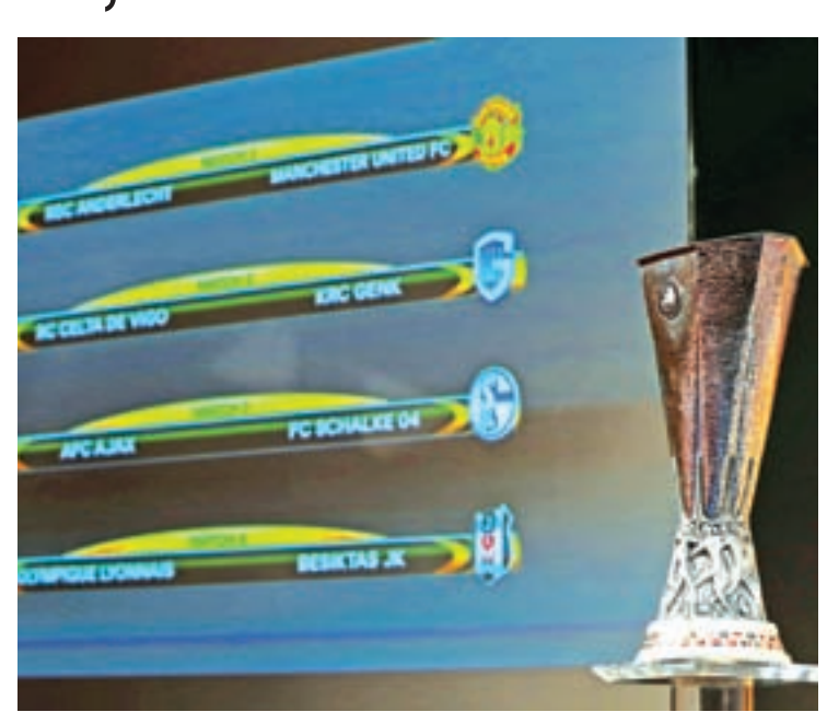
The UEFA Europa League trophy is pictured after the draw of the quarterfinals in Nyon, Switzerland, on 17 March 2017.

Ajax Amsterdam will meet Germany's Schalke 04, French club Olympique Lyon face Turkey's Besiktas and Spain's Celta Vigo take on Belgian side Genk.