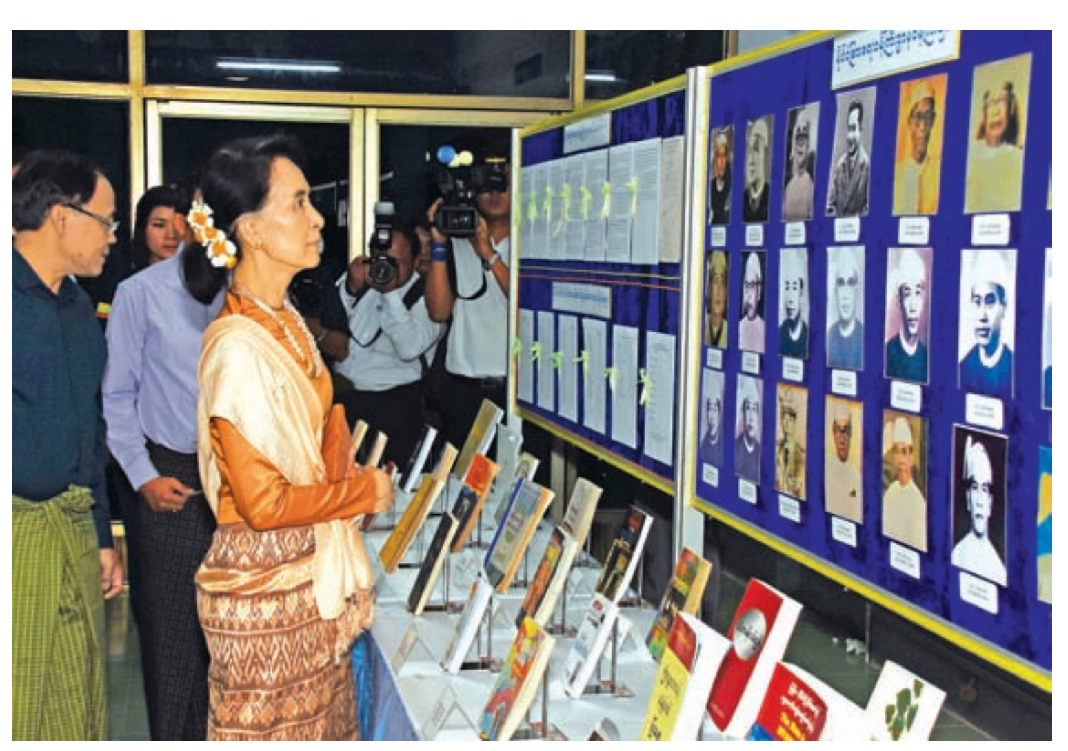
State Counsellor Daw Aung San Suu Kyi looks at the portraits of former foreign ministers, including her father, at a display in Nay Pyi Taw.

A ceremony to mark the 70th Anniversary of the Ministry of Foreign Affairs and a gala dinner were held on the lawn of the Ministry in Nay Pyi Taw yesterday evening.