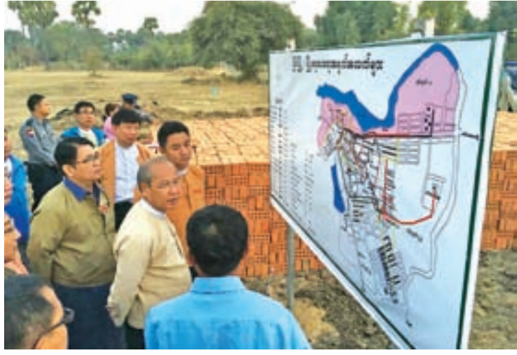
Magway Region Chief Minister views plans for better water pipelines in Myaing Township.

As part of efforts to ensure rule of law in the region, action has been taken against 26 gamblers along with one vehicle and 102 motorcycles in Pwintbyu Township, Minbu District. Similarly. one township judge, one district education officer and one township administrator in Magway Region were charged with code of ethics of civil servants. The Magway Region government is making utmost efforts to exercise culture of democracy in judicial pillar through check and balance system. At the same time, the regional government put emphasis on improving socioeconomic status of the local people, endeavoring to make equitable development in all townships in the region.