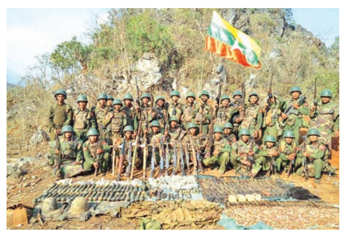
Tatmadaw troops after recovering Point 1088 in Shan State.

THE TATMADAW have occupied an area in Laukkai, Shan State known as Point 1088, a strategic area on a hill near the China border that was once controlled by the Myanmar National Democratic Alliance Army (MNDAA).