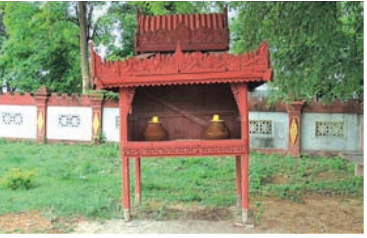
The wooden altar housing two water pots are ready to quench the thirst of passer-by.

Within the precincts of pagodas, drinking- water provision is made available for the devotees or pilgrims by the charities. There are charitable water donations being made for the residents at water scarcity affected areas in Myanmar. On the way up to the Kyaik- Hti- Yoe Pagoda Known as The Golden Rock Pagoda, the traditional style of drinking water pots is placed on the altar or stand for the visitors or pilgrims or public. The drinking- water for the pilgrims and devotees is available on the premises of the pagodas in the country.Drinking water donation charities donate clean drinking water to devotees and pilgrims at various famous pagodas in Myanmar.The water donation is made for anyone almost everywhere in Myanmar regardless of any races or any social classes. The government organization has laid down a project for exploration of ground fresh water in the arid areas and some drought affected areas in Myanmar. The project has been implemented to some degree i.e sinking artesian wells to supply fresh water to the residents there. Since Myanmar abounds with river water, rivulets, ponds, stream and waterfalls,