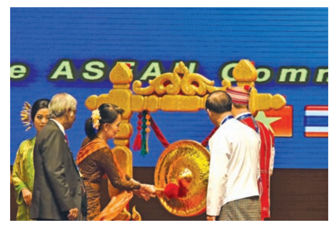
State Counsellor Daw Aung San Suu Kyi strikes a gong at an ASEAN event at Pyidaungsu Hluttaw.