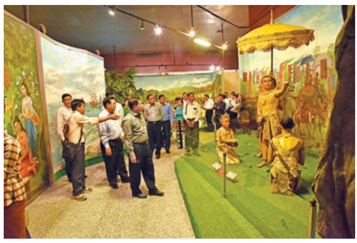
Defence Services C-in-C Senior General Min Aung Hlaing visits Angkor Wat Temple in Siem Reap.

Then the Speaker of Pyidaungsu Hluttaw announced the 14th Meeting would be held on March 13.--Myanmar News