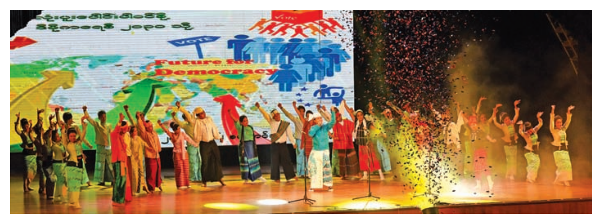
Myanmar traditional performers entertain audiences with dance and song at the ceremony to mark International Democracy Day in Nay Pyi Taw.

The laws include various topics such as systematic spending of budget allotted for projects across the country; ensuring systematic taxation; protecting of people's rights and guaranteeing their security; matters on foreigners; dams and reservoirs for farmers; worksite safety and health for workers; smooth transportation for the convenience of people; and matters relating to companies for smooth flowing of foreign investments.