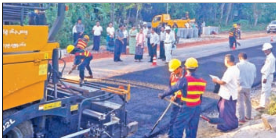
Kayin State Chief Minister Daw Nan Khin Htwe Myint and offcials observe paving of Eindu-Zarthabyin road.