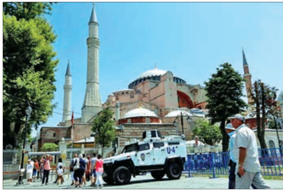
Tourists enter the Byzantine-era monument of Hagia Sophia as they pass by an armoured police vehicle in the Old City of Istanbul, Turkey, on 13 July 2016.

"It is better to have some people coming at lower prices than to have an empty hotel," said Surucuoglu, who relies on Germany for 90 per cent of