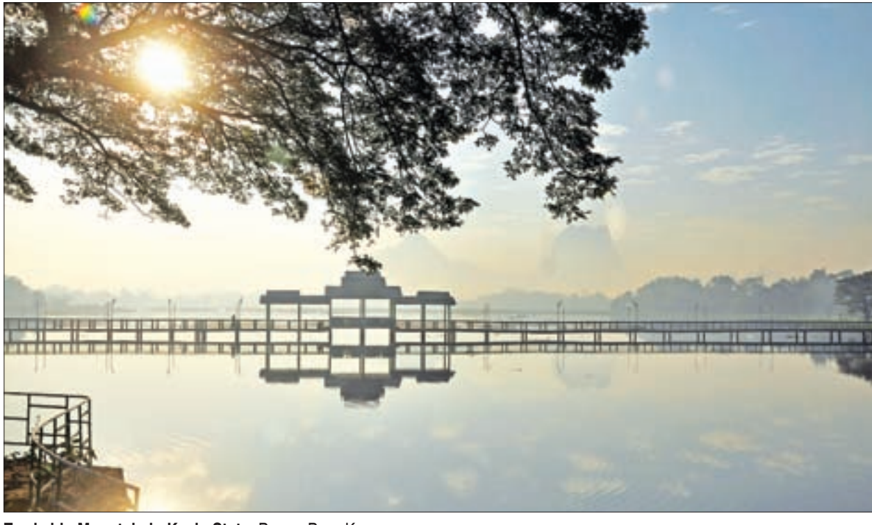
Zwekabin Mountain in Kayin State.

AYIN State with an area of 11730.85 square miles is sit-Luated in the southeast of Myanmar. It shares border with Shan State and Kayah State to the north, Thailand to the east, Mon State and Taninthayi Region to the south and Bago Region and Mon State to the