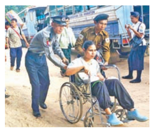
Officials warmly welcome IDPs from the Thai-Myanmar border.