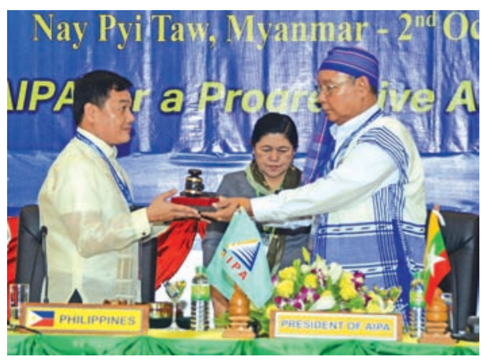
Pyidaungsu Hluttaw Speaker Mahn Win Khaing Than accepts chairmanship of the 37<sup>th</sup> General Assembly of the ASEAN Inter-Parliamentary Assembly.

During the one year period of Pyidaungsu Hluttaw since its commencement, it could serve the interests of the nation