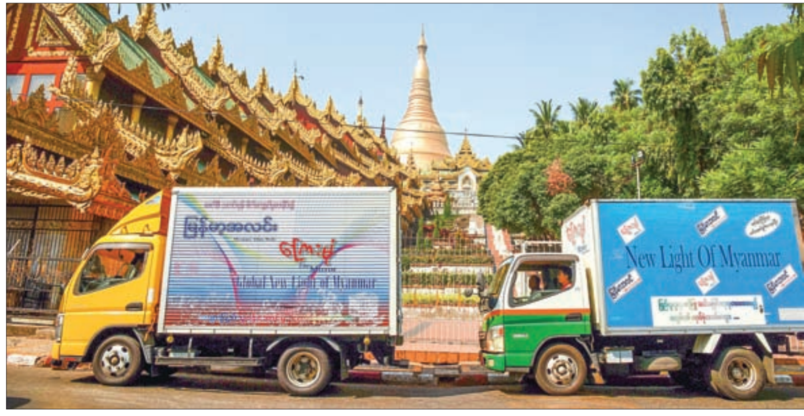
The trucks transport the newspapers to airport, railway stations and bus terminals early morning to deliver the dailies to houses.

DURING one-year period when the incumbent government took office, Statenewspapers—the Myanma Alinn, the Kyemon (the Mirror) and joint-venture the Global New Light of Myanmar are operating as a linking machinery between the People and the Government, by making reforms. Especially, form of collecting news, presentation and lay-out forms, quality of a newspaper and economic policies were managed to be changed successfully in one year. Success was achieved due to subscribers' increasing demands for more copies, because of satisfying designs of the logos and news presentation patterns. People's voices and breaking news of performances of 3 major panels of the State—