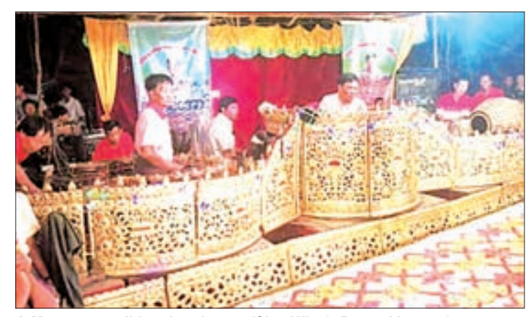
A Myanmar traditional orchestra (Sine Wine).

THE hiring of Myanmar traditional orchestras (Sine Wine) for religious events such as novitation ceremonies and donations in rural areas is dropping as a result of the low incomes of the farmers.