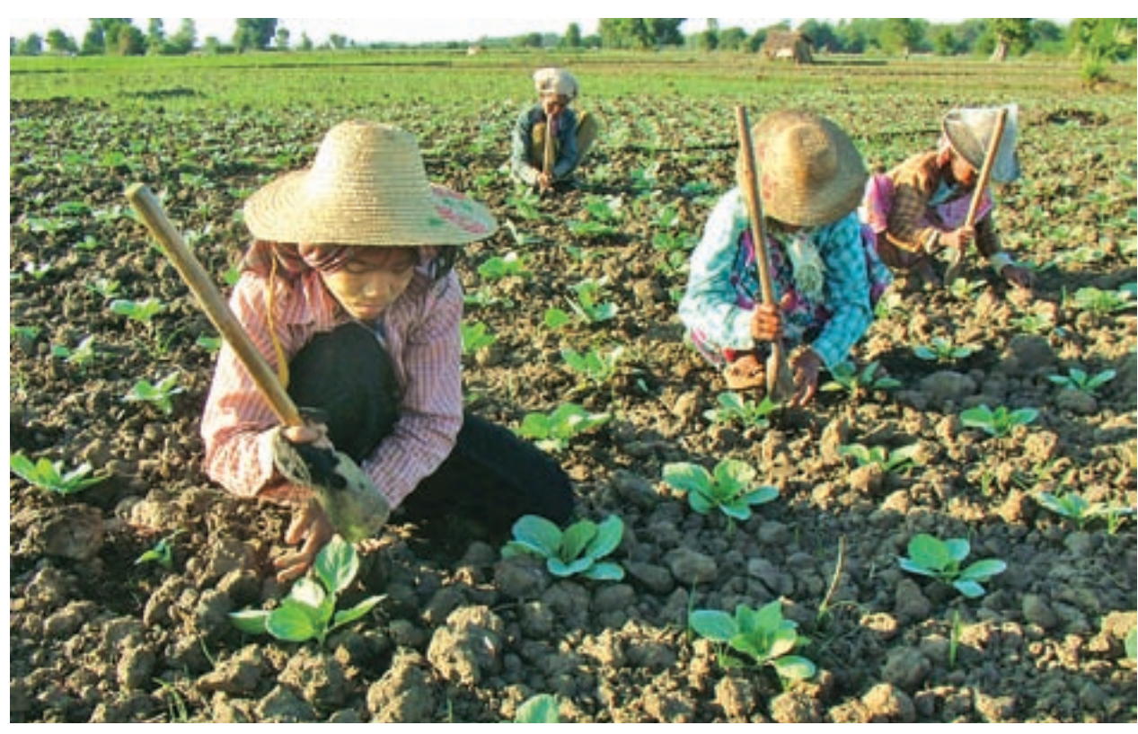
Farmers work on a cabbage farm outside Nay Pyi Taw.