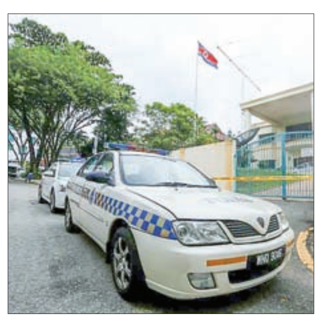
Police cars block the entrance of a sealed off North Korea embassy in Kuala Lumpur, Malaysia on 7 March, 2017.

KUALA LUMPUR/ SEOUL — North Korea barred Malaysians from leaving the country on Tuesday, sparking tit-fortat action by Malaysia, as police investigating the murder of Kim Jong Nam in Kuala Lumpur sought to question up to three men hiding in the North Korean embassy.