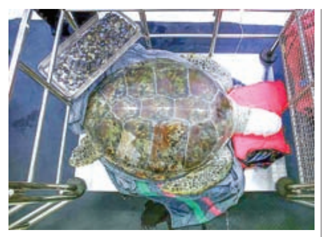
Omsin, a 25 year old femal green sea turtle, rests next to a tray of coins that were removed from her stomach after a surgical operation at the Faculty of Veterinary Science. Chulalongkorn University in Bangkok, Thailand on 6 March,