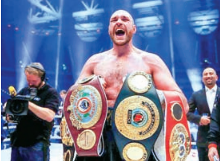
Tyson Fury celebrates with belts as he defects Wladimir Klitschko at IBF & WBO Heavyweight Titles at Esprit Arena in Dusseldorf, Germany on 28 November 2017.

WBA belts last year, revealing he was seeking medical help, after telling Rolling Stone magazine that he had taken cocaine to help his depression.