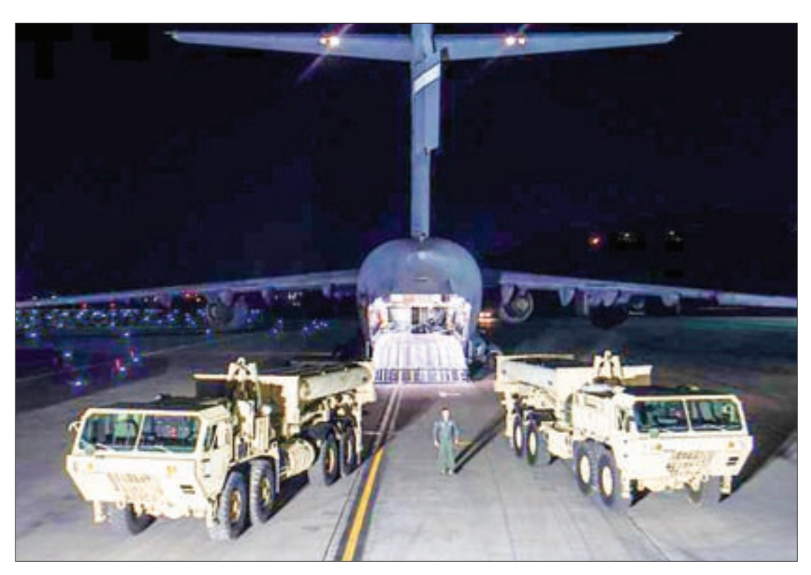
Terminal High Altitude Area Defense (THAAD) interceptors arrive at Osan Air Base in Pyeongtaek, South Korea, in this handout picture provided by the United States Forces Korea (USFK) and released by Yonhap on 7 March 2017.

SEOUL — The United States started to deploy the first elements of its advanced anti-missile defence system in South Korea on Tuesday after North Korea's test of four ballistic missiles, US Pacific Command said, despite angry opposition from China.