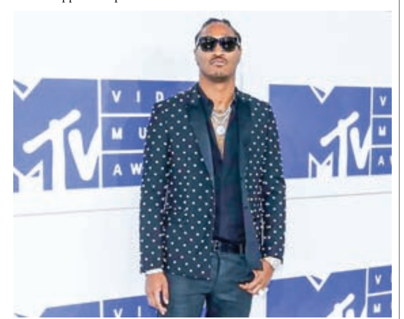
Rapper Future arrives at the 2016 MTV Video Music Awards in New York, US on 28 August, 2016.

On the Digital Songs chart, which measures online singles sales, British singer Ed Sheeran's "Shape of You" held onto the top spot with another 141,000 copies sold. —Reuters