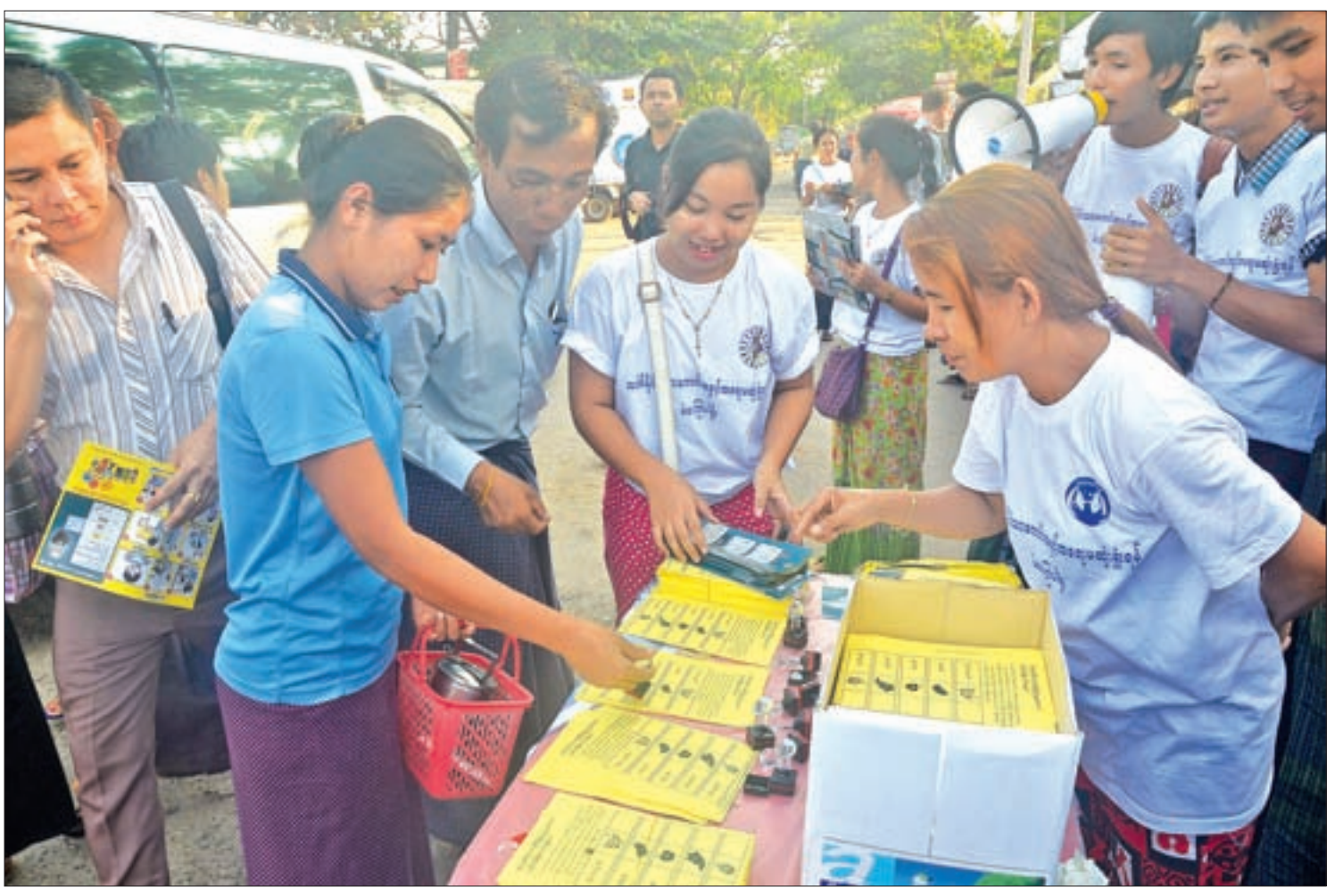
Members of civil society raise awarness of the voting process for the upcoming 1 April by-election in Hlinethaya.