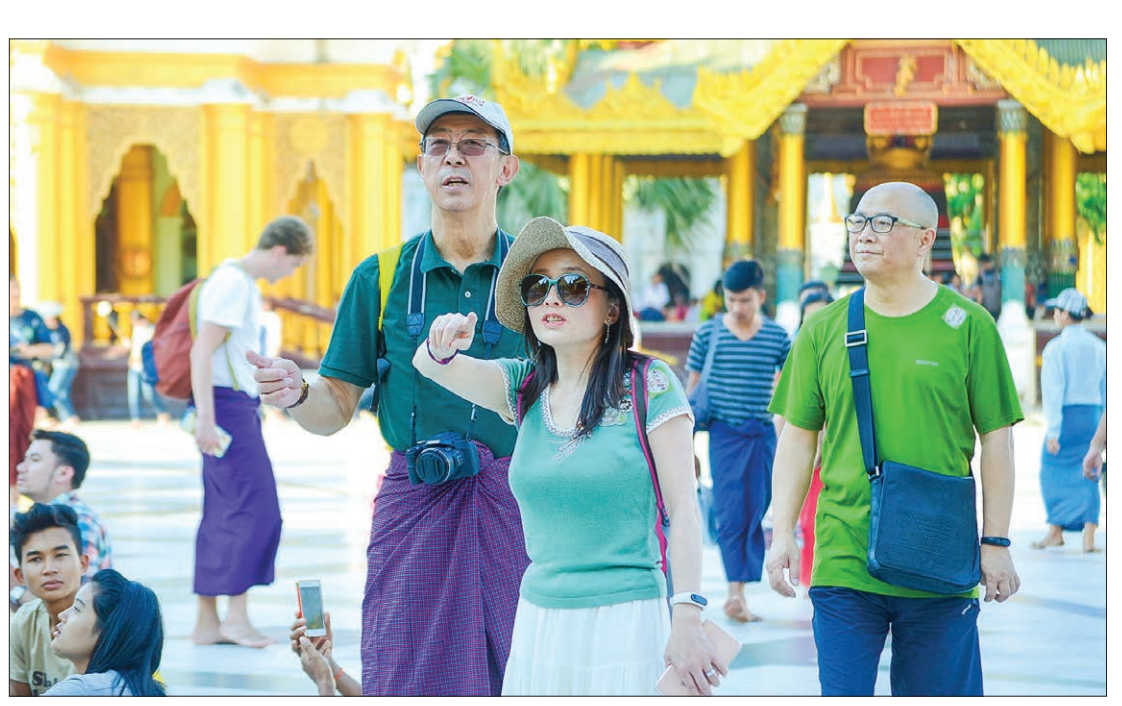
Tourists seen at Shwedagon Pagoda in Yangon on 29 January 2017. The Myanmar Tourism Federation wants to promote Chinese visitors by twofold.