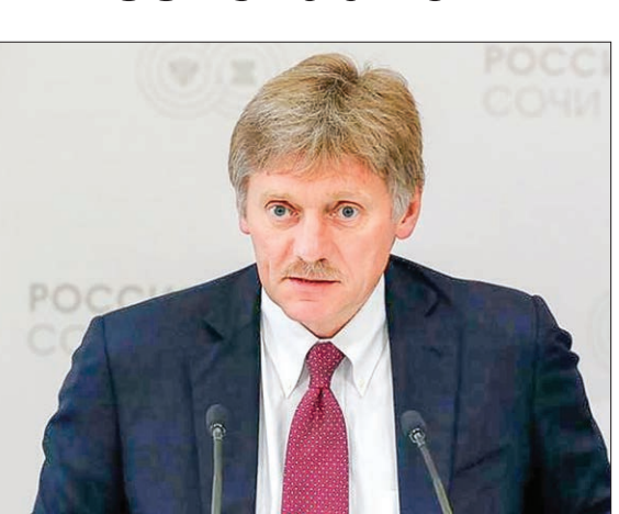
Kremlin spokesman Dmitry Peskov.

Earlier in the day, North Korea fired four missiles from its western coast toward the Sea of Japan. According to the Japanese government, they flew about 1,000 kilometres, with three of them falling in Japan's exclusive economic zone. Tokyo strongly condemned Pyongyang's