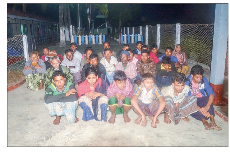
Detained 28 suspects seen in Maungtaw Township in Rakhine State.

Border Guard Police seized an illegal motorboat in the Naf River with 28 people on board Sunday night near Maungtaw Township in Rakhine State.