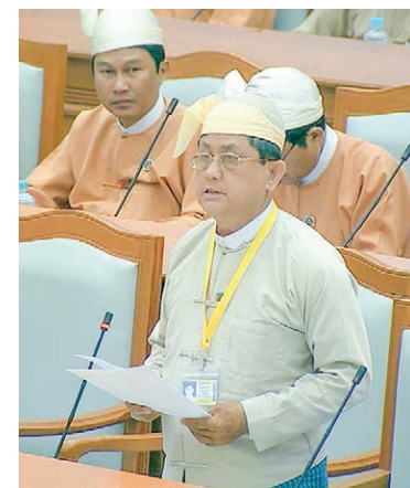
Deputy Minister for Planning and Finance U Maung Maung Win.