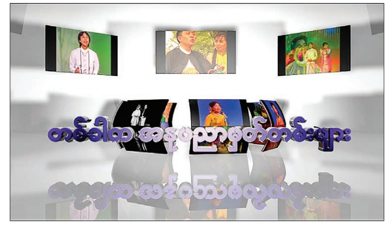
A file photo shows a programme of MRTV.

broadcast in order of hour series. Starting from 15th February 2017, news times were reduced to 8 times a day from 13 times per day, so as to be stronger. Important news and news that people deserve to know urgently are being broadcast as breaking news and update news. Debate programs describing expertise discussions and ideas of scholars and professionals over the current affairs of the country are also being presented. Likewise, people's voices are being also described with a view to standing up for the people. Descriptions of one-day activities of grass root people and a new radio program, "Talk Show" a production by linking with Search for Common Ground (SFCG) were broadcast successfully.