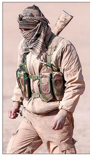
An Syrian Democratic Forces (SDF) fighter walks with his weapon in northern Raqqa province, Syria on 6 February, 2017.

"The road is under the control of the SDF," spokesman Talal Silo said in a voice message sent to Reu-