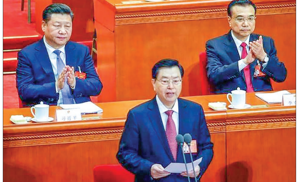
China's President Xi Jinping and China's Premier Li Keqiang clap as Chairman of the Standing Committee of the National People's Congress (NPC) Zhang Dejiang (front) speaks during the opening session of the National People's Congress (NPC) at the Great Hall of the People in Beijing, China on 5 March, 2017.

He added that it was unfortunate that "street politics" had become a part of everyday life in Hong Kong while the neighboring Shenzhen city was catching up economically. "It is quite possible that Shenzhen can overtake Hong Kong in two years," Tam cited