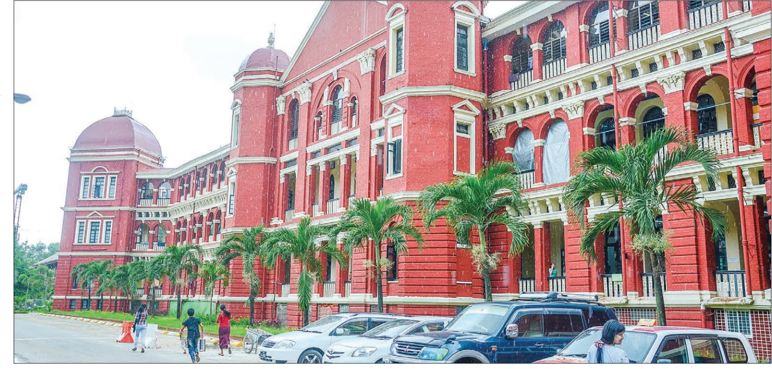
Yangon General Hospital, reminiscient of an era long past, standing proud since 1899. It is under consideration for the 18th blue plaque by YHT.

The YHT is now observing the collecting data related to the history of Yangon General