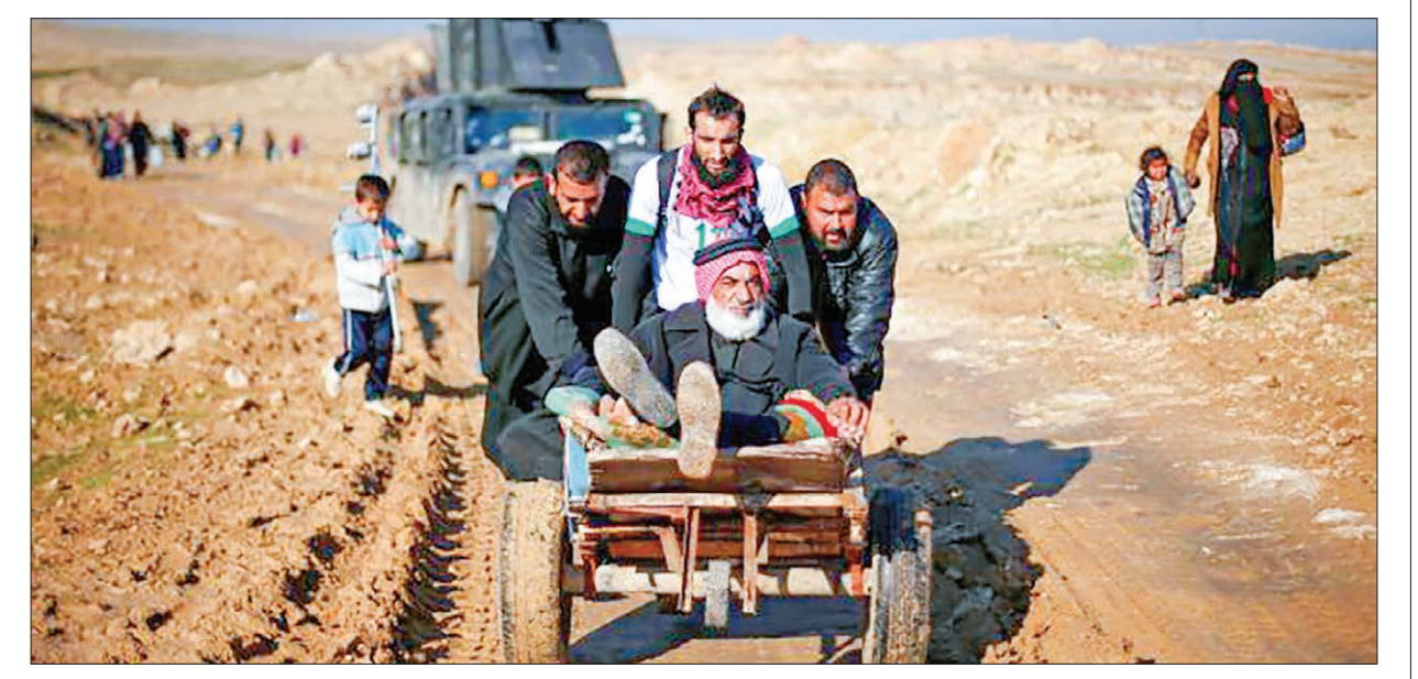
Displaced Iraqis flee their homes, as Iraqi forces battle with Islamic State militants, in western Mosul, Iraq, on 6 March, 2017.

Baghdadi proclaimed the caliphate from Mosul's grand Nuri mosque in the old city centre which is still under his followers' control. The Iraqi forces are advancing toward the old city center form the south and the southwest. -Reuters