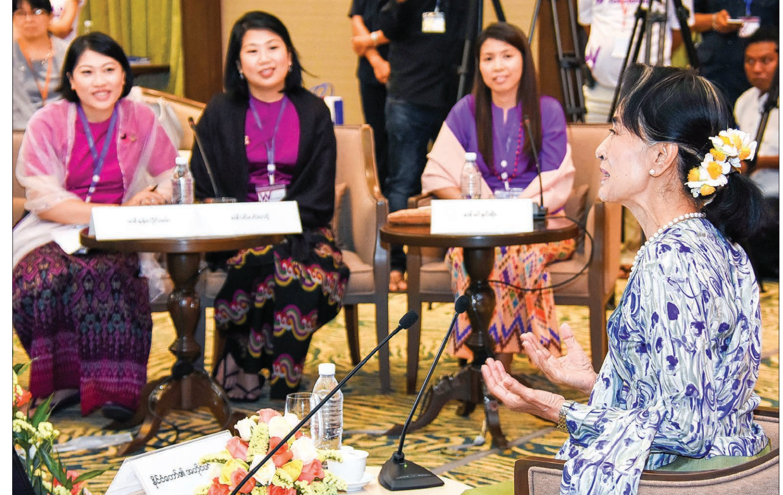
State Counsellor Daw Aung San Suu Kyi, right, addresses the opening day of Women's Week Myanmar yesterday in Nay Pyi Taw.

"We cannot overlook the fact that other countries are more developed in the legal sector; however, we must also consider the effects of these laws as well. Which is why when we think of women's opportunities, we must also consider Rule of Law, without which legislations for gender equality will be nothing more than words on paper," said the State Counsellor. She also stressed the im-