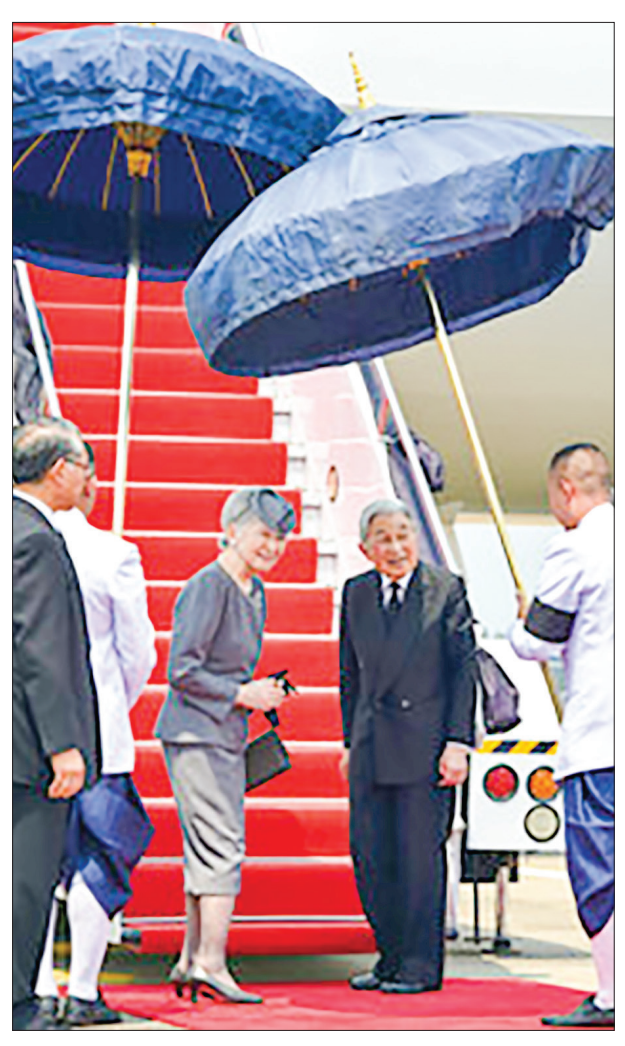
Japanese Emperor Akihito and Empress Michiko leave Bangkok for Tokyo, on 6 March 2017, after completing a weeklong trip to Vietnam and Thailand.