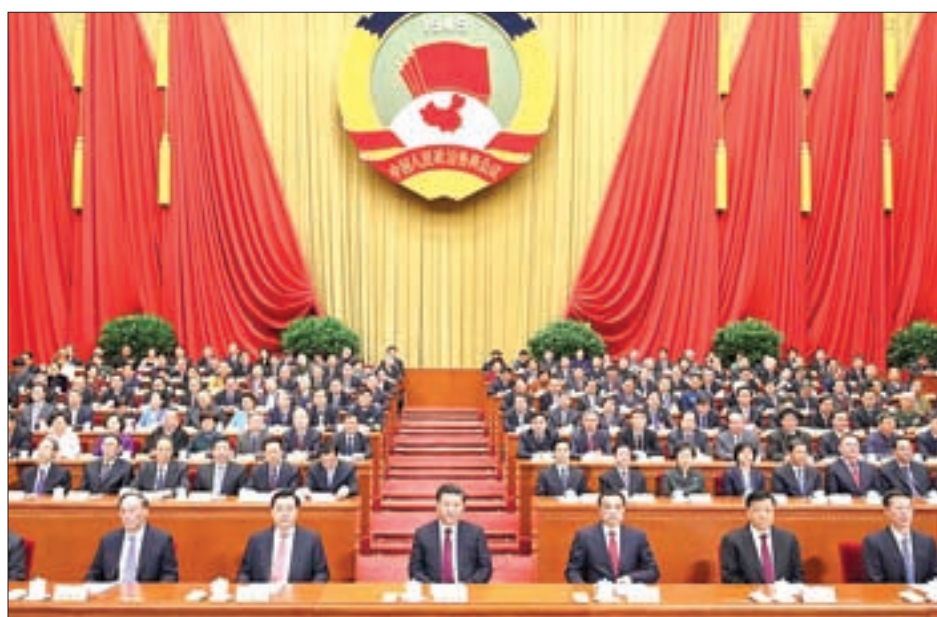
Xi Jinping (3 rd L, front), Li Keqiang (3 rd R, front), Zhang Dejiang (2 nd L, front), Liu Yunshan (2 nd R, front), Wang Qishan (1 st L, front) and Zhang Gaoli (1 st R, front) attend the opening meeting of the fifth session of the 12 th National Committee of the Chinese People's Political Consultative Conference at the Great Hall of the People in Beijing, capital of China, on 3 March 2017.

Wang is likely to head the new commission, the three sources said, a role that would under normal circumstances make a strong case for him to remain at Xi's