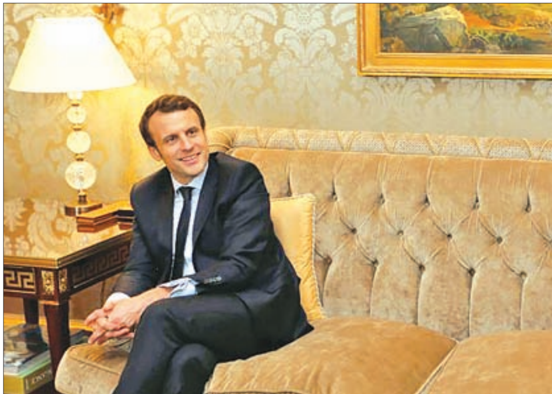
Emmanuel Macron, head of the political movement En Marche !, or Onwards !, and candidate for the 2017 French presidential election, attends a meeting about international affairs with former US Secretary of State John Kerry (not seen) in Paris, France on 3 March, 2017.

PARIS — Centrist candidate Emmanuel Macron cemented his status as favourite to win the French presidency on Friday as pressure mounted on his conservative rival, Francois Fillon, to pull out because of a deepening financial scandal.