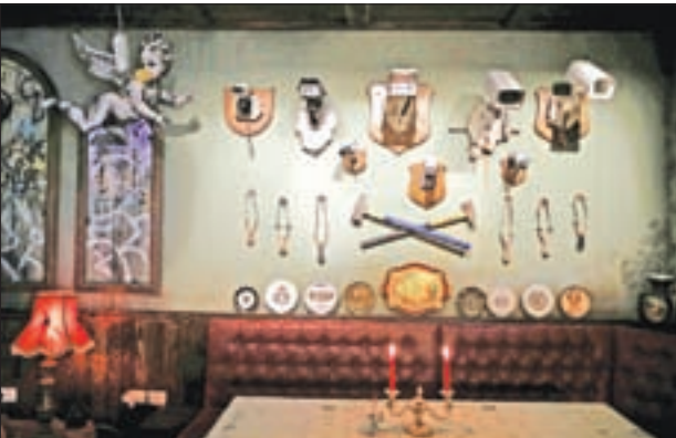
Installations are seen inside the Walled Off hotel, which was opened by street artist Banksy, in the West Bank city of Bethlehem, on 3 March 2017.

The Banksy statement said the hotel "offers a warm welcome to people from all sides of the conflict and across the world" and was financed by the artist. Gentle music from a self-playing pianola fills the candle-lit dining room where a framed painting of Jesus looks up at three warplanes, stencilled on the wallpaper above.—Reuters