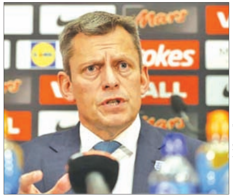
Chief Executive Martin Glenn.

The quarter-finals are scheduled for 11-13 March with hold-