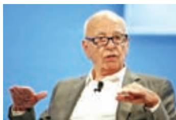
Rupert Murdoch, Executive Chairman News Corp and Chairman and CEO 21st Century Fox speaks at the WSJD Live conference in Laguna Beach, California on 29 October, 2014.