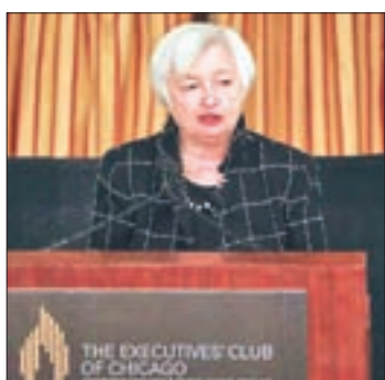
Federal Reserve Chair Janet Yellen addresses the Executives Club of Chicago in Chicago, Illinois, US, on 3 March 2017.

It’s a welcome turn for the Fed chair, who has hoped to get rates off the ground throughout