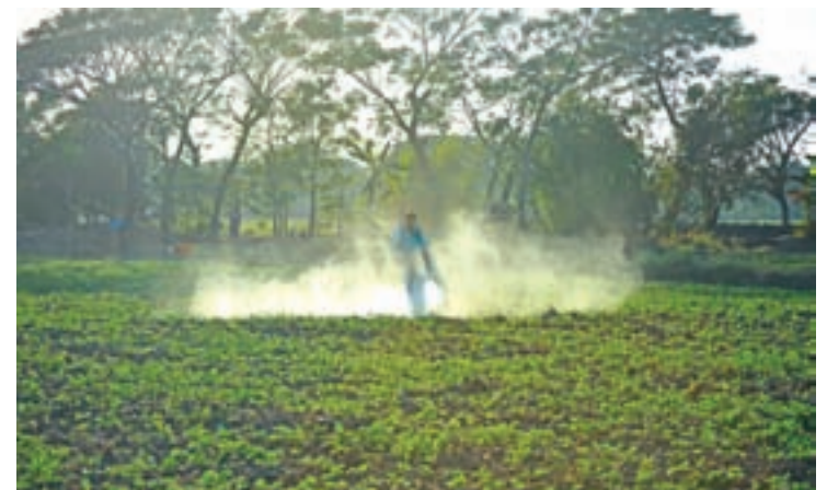
A farmer sprays pesticides on a plantation.

Myanmar trade value via Thailand has increased after Myawady-Dawna mountain crossing road was opened. The trade value via the border gate amounted to US$723.732 million from 1 April 2016 to 17 February 2017.— Min Min