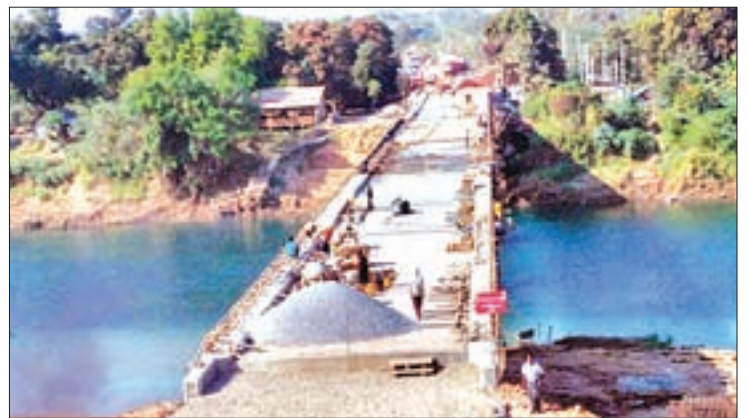
A new concrete road bridge over Dohtawaddy River is under construction .

U Ye Hsint, one of residents from Shwesayan Village near the project, said travelers face inconvenience to return home at night because of lack of bridge across the river.—Min HtetAung (Mandalay Sub-printing House)