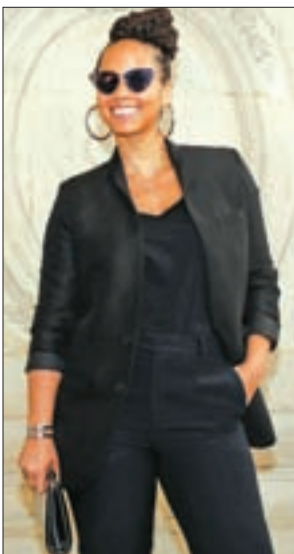
Musician Alicia Keys poses during a photocall before the French fashion house Christian Dior Fall/Winter 2017-2018 women's ready-to-wear collection during Fashion Week in Paris, France, on 3 March 2017.

A Christian Dior logo appeared on the bottom of jackets as well as on under-