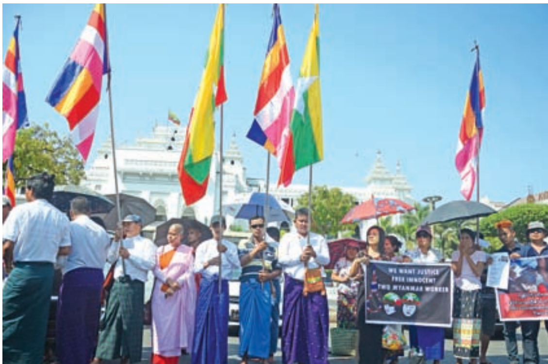
People protest against the decision by a Thai court's death sentence for the two workers.

A Thai appeals court upheld the death sentences for two Myanmar migrant workers convicted of the murder of two British backpackers on a vacation island