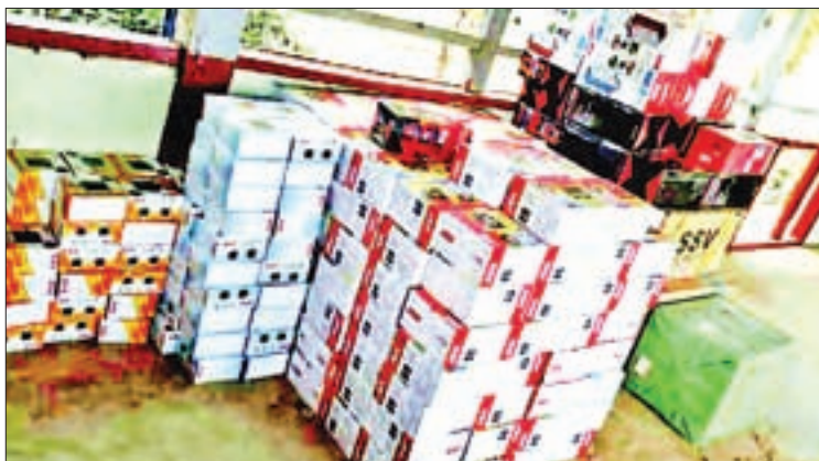
Photo shows custom duties unpaid items worth over Ks 1,800 million seized by Customs Department.

CUSTOMS Department under the Ministry of Planning and Finance seized custom duties unpaid items worth over Ks 1,800 million in February, according to the Customs Department.