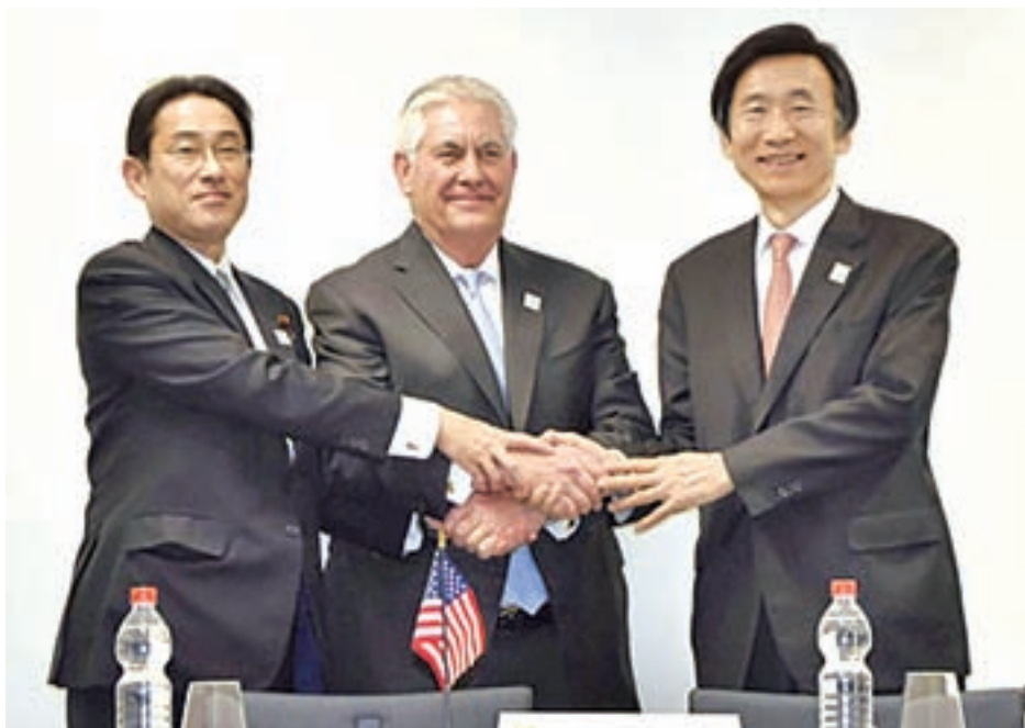
(From L) Japanese Foreign Minister Fumio Kishida, US Secretary of State Rex Tillerson and South Korean Foreign Minister Yun Byung Se shake hands ahead of their talks in Bonn, Germany, on 16 February, 2017. The three foreign chiefs met on the sidelines of a two-day foreign ministerial session of the Group of 20 major economies in the western German city.

The two sides are expected to coordinate a