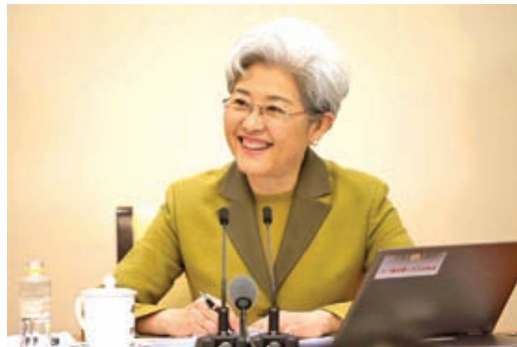
Fu Ying, spokesperson for the fifth session of China's 12 th National People's Congress (NPC), speaks during a press conference on the session at the Great Hall of the People in Beijing, capital of China, on 4 March 2017. The fifth session of the 12 th NPC is scheduled to open in Beijing on 5 March.

"The enhancement of China's capabilities is conducive to safeguarding regional peace and stability, not the contrary," she continued. According to Fu, China and some ASEAN (Association of Southeast Asian Nations) countries have already returned to dialogue and consultation, and tensions in the South China Sea have shown trends of easing.