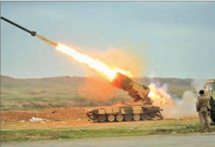
An Iraqi Army officer (R) uses his mobile phone to film a rocket launched towards Islamic State militants during a battle with Islamic State militants in Mosul, Iraq on 3 March, 2017.