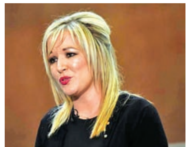
Newly elected Sinn Fein leader Michelle O'Neill speaks to media at the count centre in Ballymena, Northern Ireland on 3 March, 2017.

The DUP's failure to win at least 30 seats also means it no longer has the power to veto legislation on its own, something the conservative party has done to block extending gay marriage to the province. —Reuters