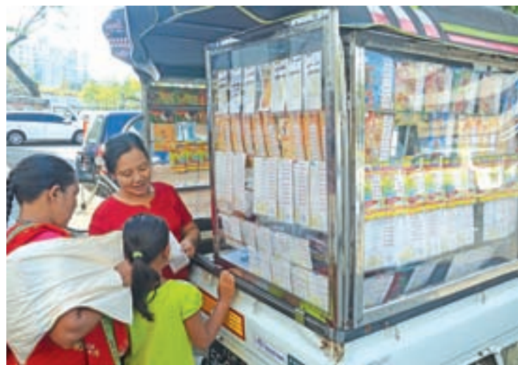
Mobile lottery shops attract people following the government begins to selling 1 billion kyat jackpot.

THE Internal Revenue Department of Myanmar began selling tickets to state lottery of 1 billion kyat (about 736,919 US dollars) jackpot, which has attracted people's interest in the state lottery, according to market survey Saturday.