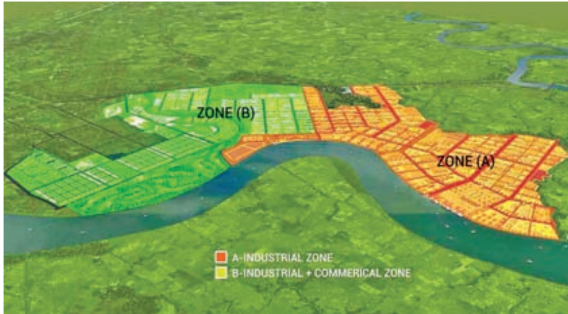
Scale model of New Pathein Industrial City Project being implemented in Ayeyawady Region.

The project implementer sets to spend approximately US$100 million for the new development scheme which has currently been established in designated place