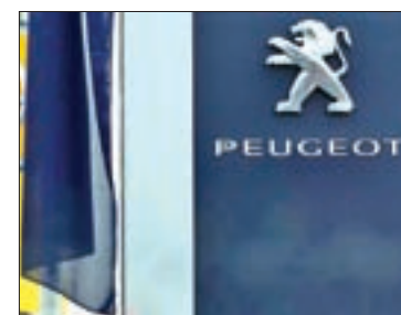
The logos of French car maker Peugeot and German car maker Opel are seen at a dealership in Villepinte, near Paris, France, on 20 February, 2017.

NEW YORK — General Motors and France’s PSA Group will hold a press conference on Monday morning, they said on Saturday, with the subject expected to be the acquisition of the US carmaker’s loss-making Opel unit.