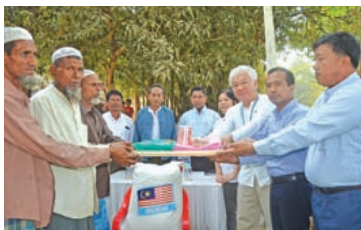
Local authorities provide aid from Malaysia to the villagers in Maungtaw Township in Rakhine State.

The relief assistance donated by Malaysia to the villages were 6000 bags of rice, 1846 noddle packets, 975 packs of drinking water, 100 packs of tooth paste, 36 packs of tooth brush, 94 packs of towels, 35 packs of balm, 562 packs of detergents, 22 packets of soap, 8 packs of combs, 139 packets of women's sanitary towels, 50 packets of shaving sticks, 9 packets of nail clippers and 50 packets of slippers.— Myanmar News Agency