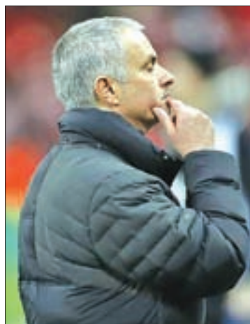
Mourinho.

LONDON — Manchester United manager Jose Mourinho dismissed as "nonsense" media reports that captain Wayne Rooney is open to the idea of returning to his boyhood club Everton at the end of the season.