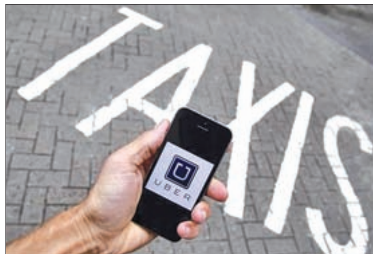
A photo illustration shows the Uber app logo displayed on a mobile telephone, as it is held up for a posed photograph in central London, Britain, on 28 October 2016.

“We take any effort to undermine our efforts to protect the public very seriously,” Dylan Rivera,