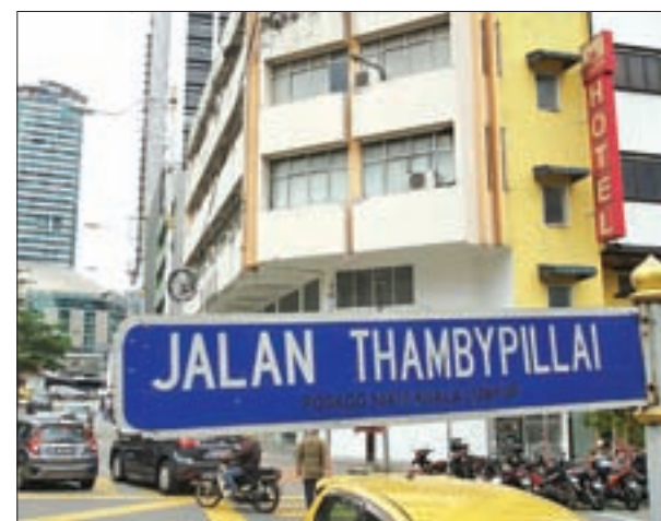
A general view of the building housing Glocom's offices in Kuala Lumpur, Malaysia, on 7 February, 2017.

The foreign ministry said Malaysia highly valued the work carried out by the UNSC Panel of Experts by ensuring the full implementation of all relevant resolutions.