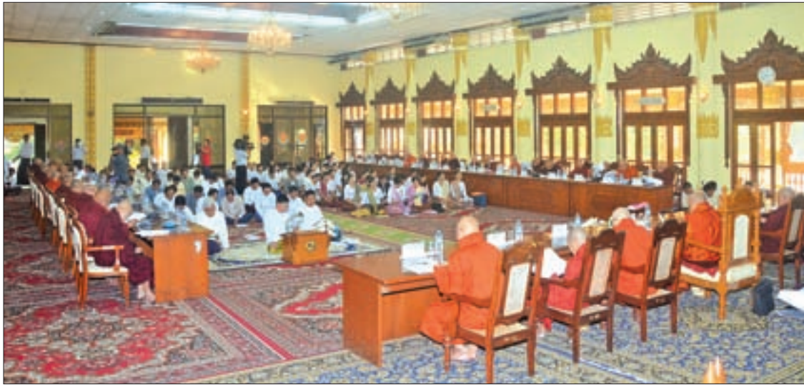
Second day of the Seventh State Sangha Maha Nayaka Committee's 47- member meeting in progress.