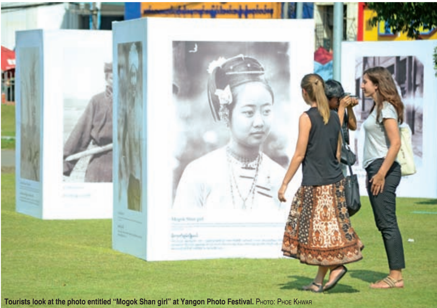
Tourists look at the photo entitled "Mogok Shan girl" at Yangon Photo Festival.

With an epicenter 45 kilometers northwest of Homalin Township, Sagaing Region and near Myanmar-India border, the quake jolted at 8:41 a.m. local time (0211 GMT). No loss of life or property has been reported so far.— GNLM