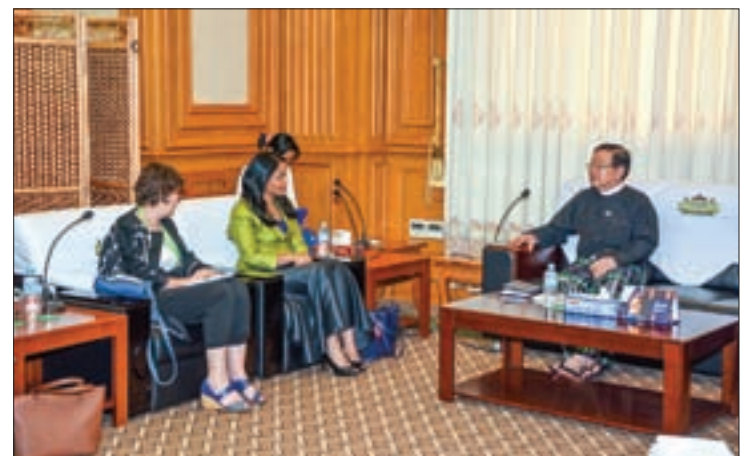
Deputy Speaker of Pyithu Hluttaw U Ti Khun Myat holds talks with Ms. Margaret Hodge and Ms. Rushanara Ali, members of House of Commons from the Labour Party of Britain in Nay Pyi Taw.

Ministry of Foreign Affairs, as Ambassador Extraordinary and Plenipotentiary of the Republic of the Union of Myanmar to Malaysia. —Myanmar News Agency