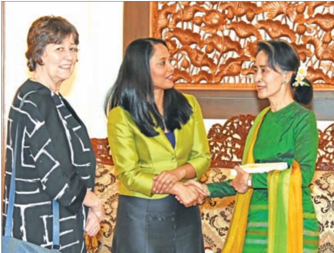
State Counsellor Daw Aung San Suu Kyi welcomes Ms. Rushanara Ali MP from the Labour Party of the United Kingdom at the Ministry of Foreign Affairs in Nay Pyi Taw.