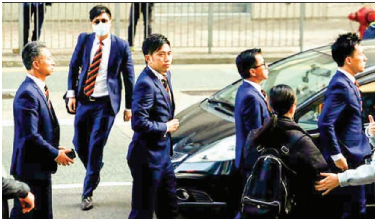
Five of the seven police officers, charged in connection with the beating of a protester during Occupy Central pro-democracy demonstrations, arrive at a court in Hong Kong, China on 14 February, 2017.

The trial centered on an incident on 15 October, 2014, at the height of the protests. A group of police officers was filmed dragging a protester, Ken Tsang, to a dark corner by a pumping substation next to the protest site, where he was kicked and punched. The officers were later suspended from duty. District court judge David Dufton said in a written summary that all