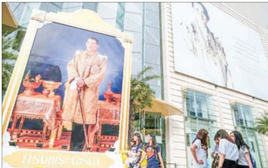
Portraits of Thailand's King Maha Vajiralongkorn Bodindradebayavarangkun and the late King Bhumibol Adulyadej are displayed at a department store in central Bangkok, Thailand, on 17 January, 2017.

"His majesty has proven himself to be very adept at managing the junta and the military," said academi-