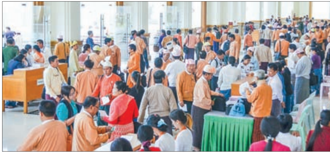
Members of Pyithu Hluttaw gather at the Parliament building to attend the meeting in Nay Pyi Taw.

“An ecotourism working committee was formed on the development of ecotourism, designating 15 ecotourism zones including Alaung-taw Katthapa National Park. In implementing the tasks for the development of the tourism industry in the long run, three major sectors — minimising as much as possible the destruction of natural environment, not harming social and cultural matters and characteristics of the local people due to the tourism industry, and making sustainable development of tourism-related businesses and local people to be taken into consideration. Like-