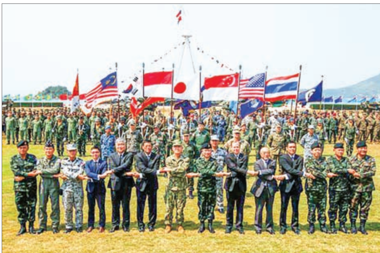
US Admiral Harry Harris, commander of the Pacific Command, and Thailand Chief of Defence Forces General Surapong Suwana-Adth (C) pose for a picture during the opening ceremony of the Asia-Pacific multilateral military exercise known as Cobra Gold, at Sattahip Royal Thai Marine Corps Base in Chonburi, Thailand on 14 February, 2017.

"We need Thailand to get back to being the re-