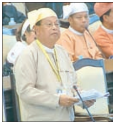
U Win Khaing, Union Minister for Construction.

Currently, there is a 50-ton capacity crane vehicle which is on 24-hour standby to clear traffic.