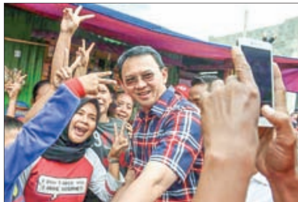
Jakarta governor Basuki Tjahaja Purnama (C) take pictures with residents during his campaign at Jatinegara district in Jakarta, Indonesia, on 6 February, 2017.

The shirts are aimed at invoking a folksy charm and conjuring up a sense of hard work, and Purnama often wears one.