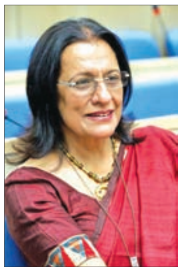
Dr Poonam Khetrapal Singh.

THE WHO South-East Asia Region is making rapid progress against vaccine-preventable diseases. The Region was certified polio-free in 2014. Maternal and neonatal tetanus was routed in