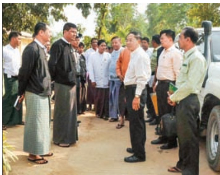
Vice President U Myint Swe enquires officials of the Buthidaung Correctional Department in Northern Rakhine.

Buthidaung Prison holds up to 1,388 prisoners, but currently houses only 1,294 prisoners. According to the findings of the investigation done by the Myanmar Human Rights Commission into Buthidaung Prison, it is learnt that