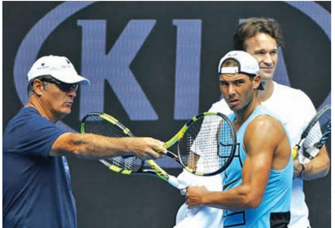
Spain's Rafael Nadal reacts with his coaches Toni Nadal (L) and former player Carlos Moya during a training session ahead of the Australian Open tennis tournament in Melbourne, Australia, on 15 January, 2017.