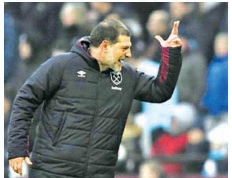
West Ham United manager Slaven Bilic.