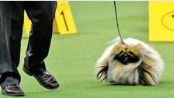
Chuckie, a Pekingese, wins the Toy group at the 141st Westminster Kennel Club Dog Show, in New York City, US February 13, 2017.