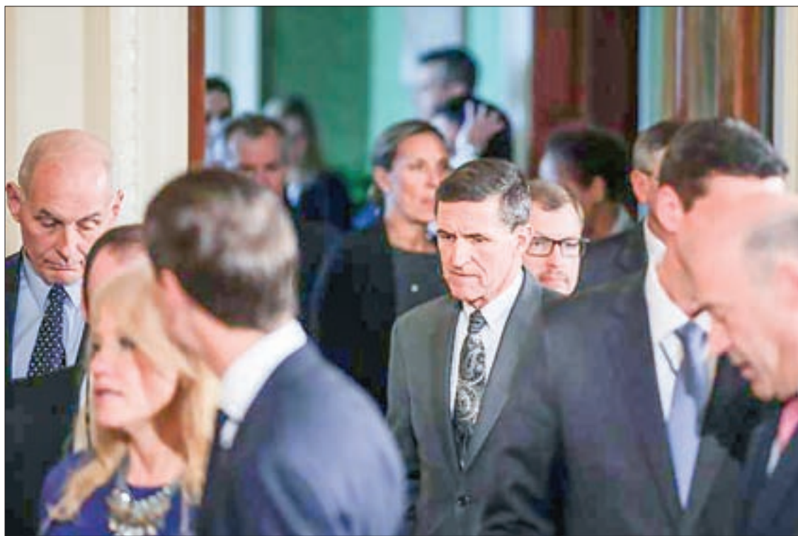
White House National Security Advisor Michael Flynn (C) arrives prior to a joint news conference between Canadian Prime Minister Justin Trudeau and US President Donald Trump at the White House in Washington, US, on 13 February, 2017.

WASHINGTON — President Donald Trump's national security adviser, Michael Flynn, resigned late on Monday after revelations that he had discussed US sanctions on Russia with the Russian ambassador to the United States before Trump took office and misled Vice President Mike Pence about the conversations.