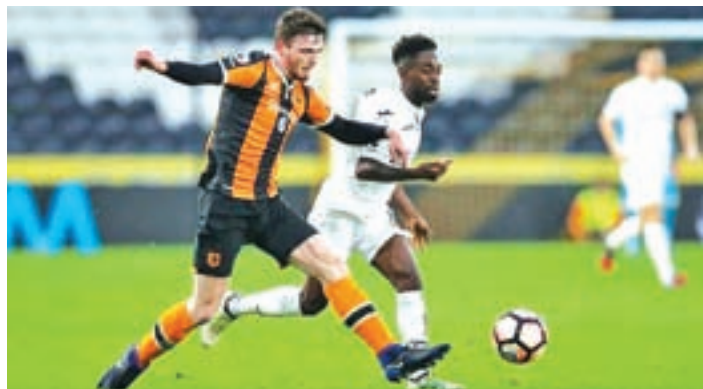
Hull City's Andrew Robertson and Swansea City's Nathan Dyer in action during the match of FA Cup Third Round.

Sunday, but lasted less than 10 minutes before limping off. A scan on Monday revealed that the 29-year-old winger had ruptured the Achilles tendon in his left ankle. Former Southampton forward Dyer has featured in five games since Paul Clement was appointed Swansea manager last month. —Reuters