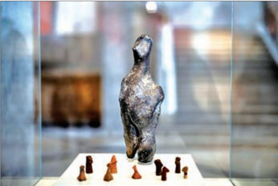
A 7000-year old Neolithic statuette is temporarily displayed at the National Archaeological Museum in Athens, Greece, on 10 February, 2017.

ATHENS — A bird-like statuette dating back 7,000 years has mystified archaeologists in Greece who still do not know exactly what it is, or where it came from. The “7,000-year-old enigma,” as it has been dubbed by the National Archaeological Museum, has been put on display until March 26 after being brought from the museum’s storerooms. It is the latest item to be presented under the title “The Unseen Museum” — a reference to the roughly 200,000 antiquities from statues to gold jewelry and every-day objects in store and not on daily display. Carved out of granite, the 36 cm (14 inches) “enigma” statuette of the late Neolithic era has a pointed nose and long neck leading to a markedly round belly, flat back and cylindrical stumpy legs. “It could depict a human-like figure with a bird-like face, or a bird-like entity which has nothing to do with man but with the ideology and symbolism of the Neolithic society,” Katya Manteli, an archaeologist with the museum, told Reuters.