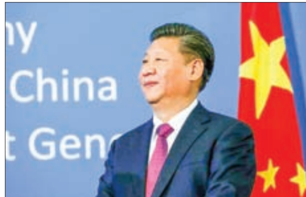
Chinese President Xi Jinping attends a meeting at the United Nations European headquarters in Geneva, Switzerland, on 18 January, 2017.

Speaking at a workshop on fighting graft, Xi said leading officials must practice strict self-discipline and “eliminate special privileges”, state news agency Xinhua said late on Monday.