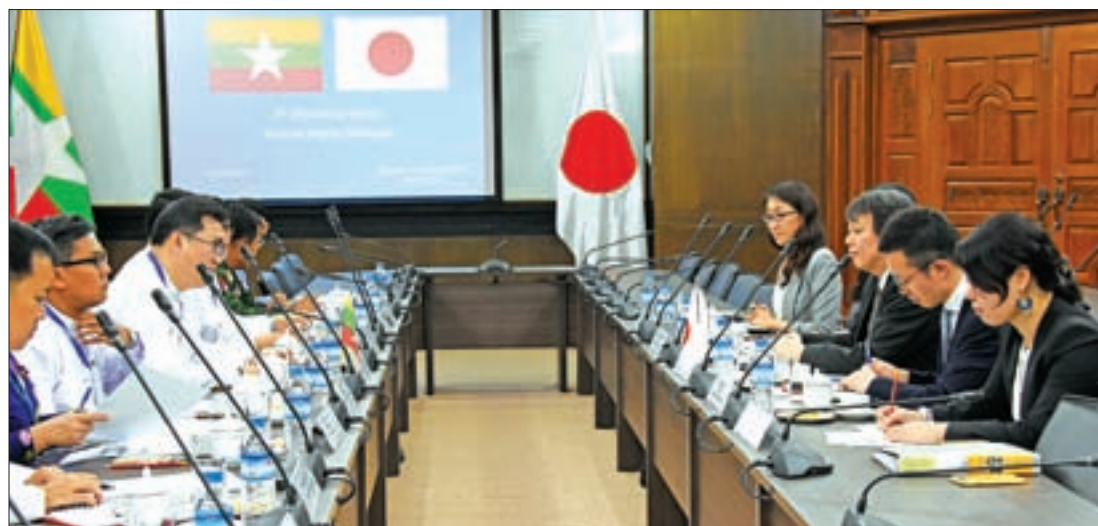
Representatives of Myanmar and Japan participate in 4 th Myanmar-Japan Human Rights Dialogue.