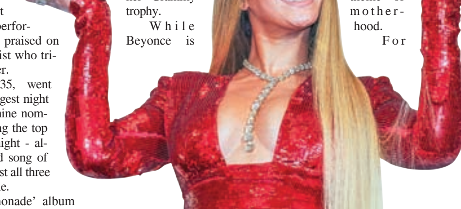
Beyonce accepts the Grammy for Best Urban Contemporary Album for 'Lemonade' from presenter William Bell at the 59th Annual Grammy Awards in Los Angeles, California, US, on 12 February, 2017.