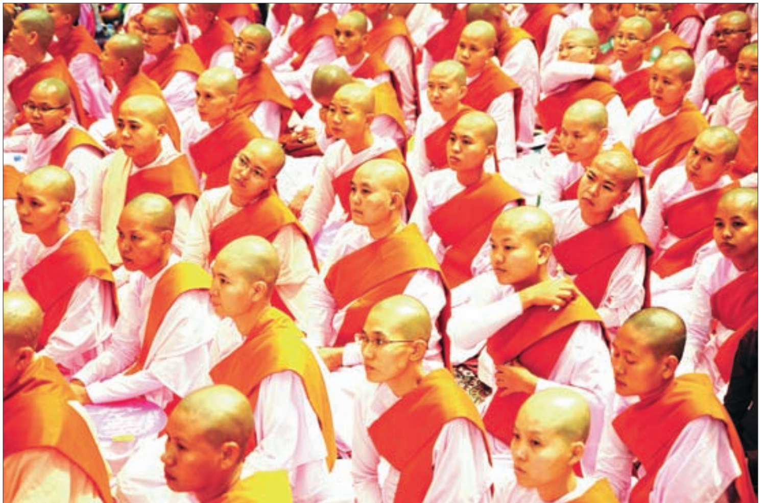
Nuns gathered yesterday create a sea of pink and saffron. Religious degrees were conferred on Buddhist monks and nuns at the 58th Maha convocation held at the Maha Pasana Cave in Thiri Mingalar KabaAye Hillock in Yangon yesterday. The degrees were conferred on those who passed the Dhammacariya, Pali Pathamapyan, Nikaya Exam, Abhidhamma and Visuddhi Magga examinations with credit.