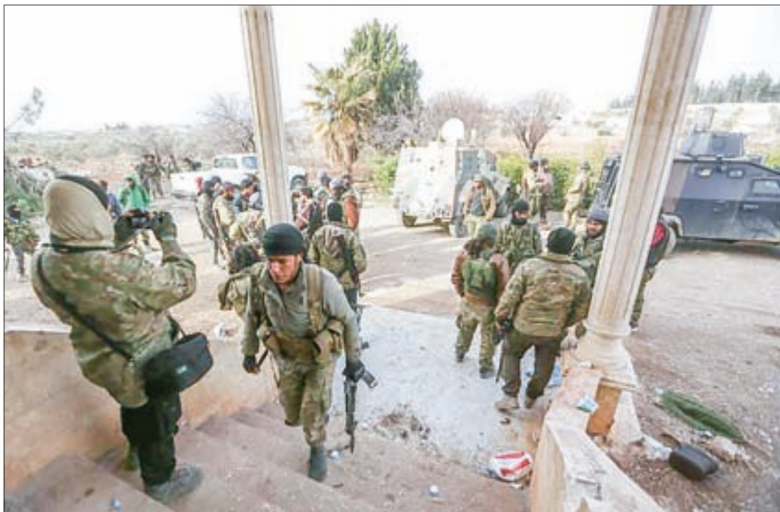
Rebel fighters stand with their weapons on the outskirts of the northern Syrian town of al-Bab, Syria on 8 February, 2017.

President Tayyip Erdogan and other Turkish leaders have been saying for weeks that the al-Bab offensive was nearing an end.—Reuters