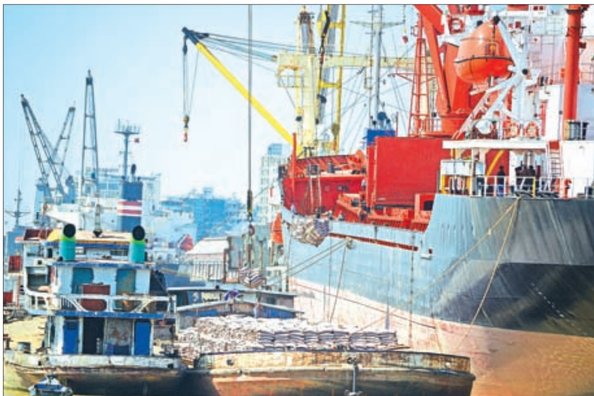
A ship loaded goods to export at a port in Yangon on 14 January 2017.

The country's exports from the private sector mainly comes from garment enterprises under Cut-Make-Pack (CMP) system,