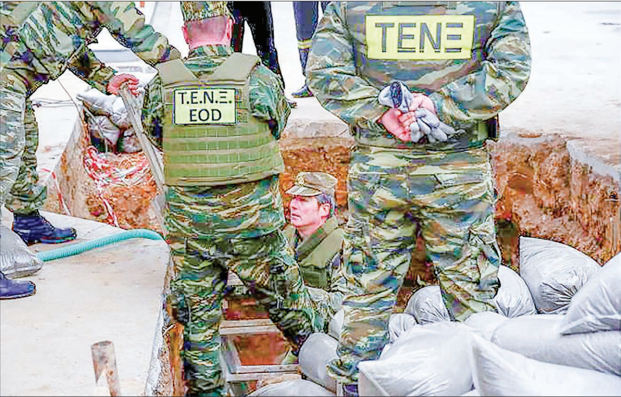
A military officer (C) of the Hellenic Army's Explosives Ordnance Disposal (EOD) is seen inside a hole in the ground where a 250 kg World War Two bomb was found during excavation works at a gas station, before an operation to defuse it, in the northern city of Thessaloniki, Greece, on 12 February, 2017.