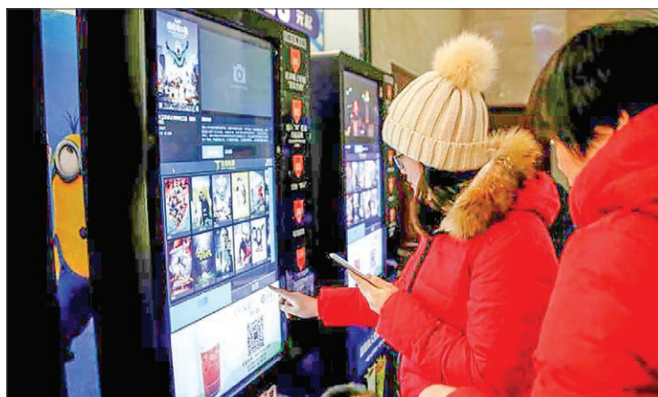
People print movie tickets from a machine at a cinema in Tianjin, China, on 13 January, 2017.

China's cinema ticket sales slowed last year, rising 3.2 per cent against the year before to