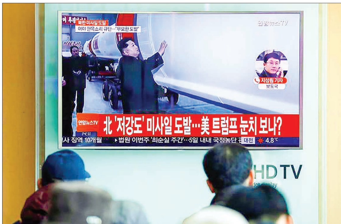
Passengers watch a TV screen broadcasting a news report on North Korea firing a ballistic missile into the sea off its east coast, at a railway station in Seoul, South Korea, on 12 February, 2017.

"I just want everybody to understand, and fully know, that