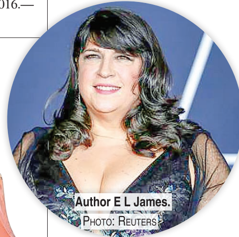
Author E L James.

In the "Fifty Shades" trilogy, Christian Grey is a young handsome billionaire entrepreneur with a penchant for bondage, discipline, dominance, submission and sadomasochism (BDSM) who introduces the beautiful but naive Anastasia "Ana" Steele to his world of whips and sex toys.