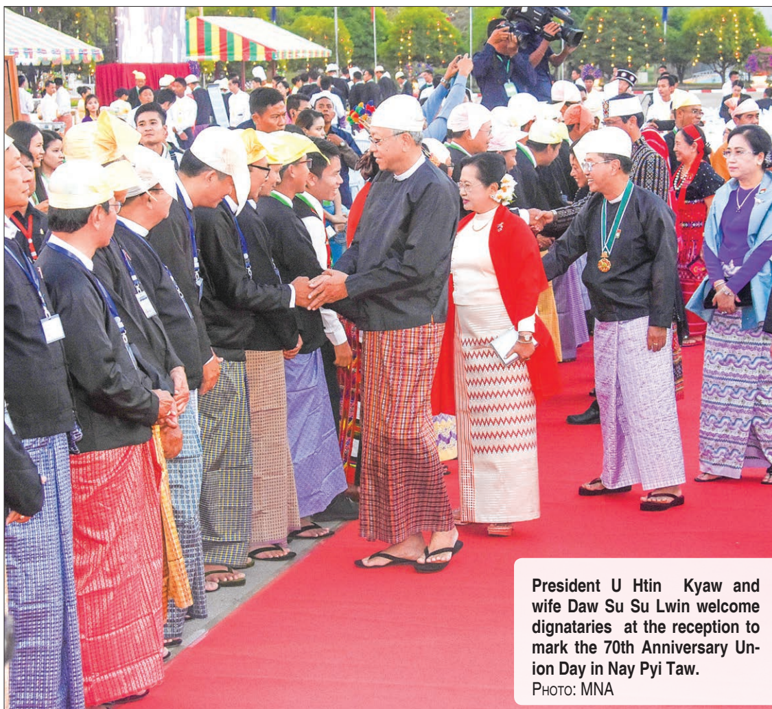
President U Htin Kyaw and wife Daw Su Su Lwin welcome dignitaries at the reception to mark the 70th Anniversary Union Day in Nay Pyi Taw.

Artists from the Ministry of Culture and cultural dance troupes of regions and states entertained dignitaries with a variety of traditional dances following the dinner.— Myanmar News Agency