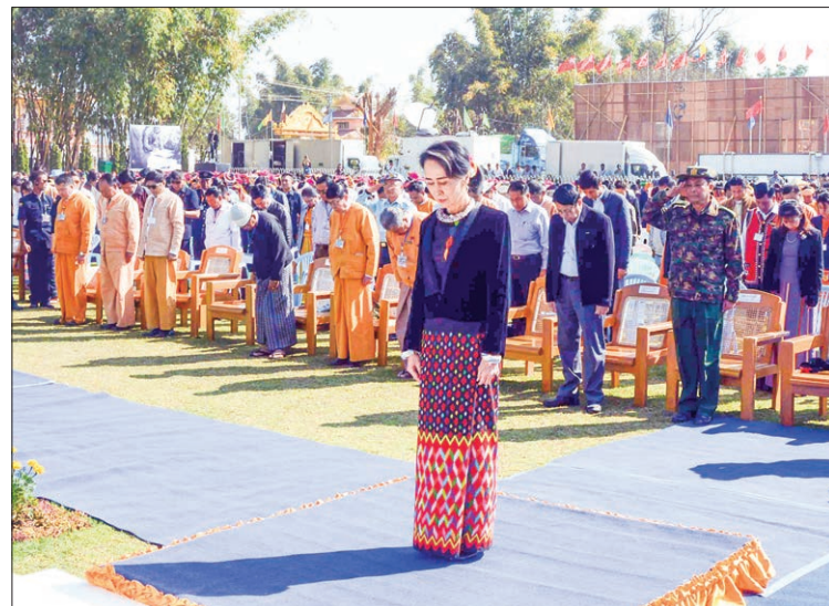
Daw Aung San Suu Kyi and congregation salute the State Flag at the 70 th anniversary Union Day in Panglong yesterday.