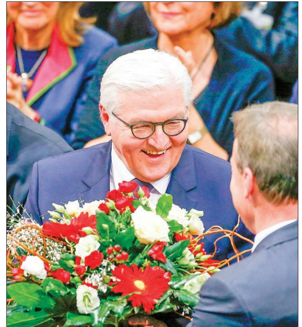
German president-elect, Frank-Walter Steinmeier, receives flowers after the first round of voting of the German presidential election at the Reichstag in Berlin, on 12 February, 2017.

Pilot whales are not listed as endangered, but little is known about their population in New Zealand waters.—Reuters