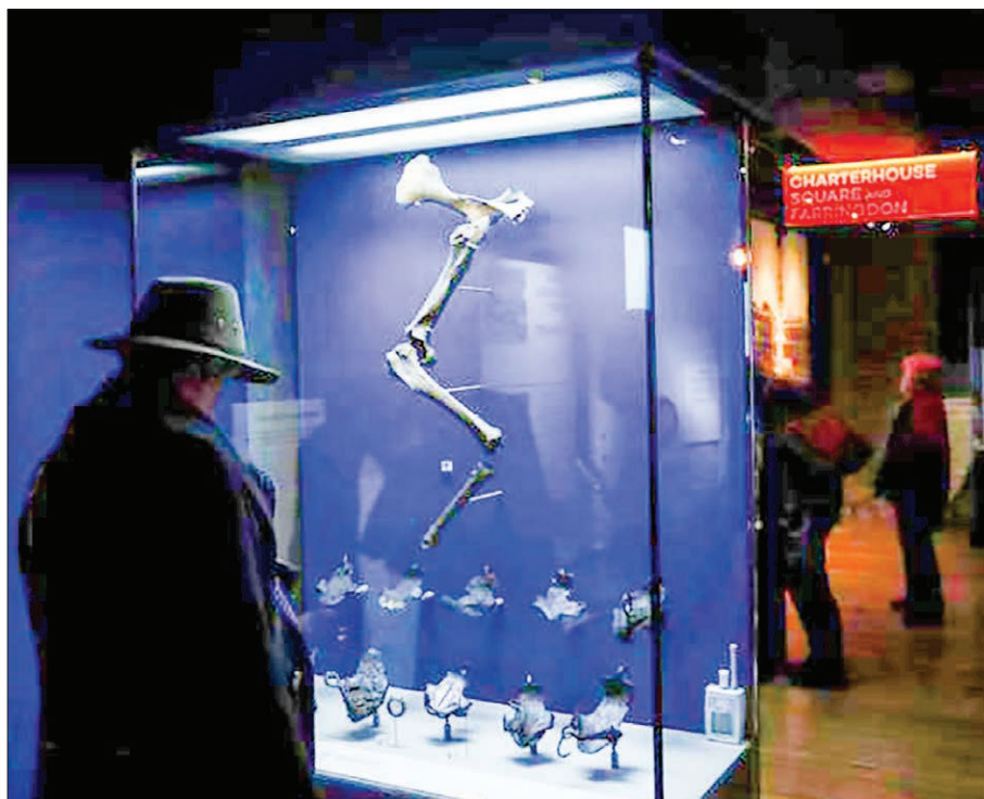
A visitor looks at horseshoes and bones at the 'Tunnel: The Archaeology of Crossrail' exhibition at the Museum of London, in London, Britain on 10 February, 2017. PHOTO: REUTERS

London's new east-west Crossrail project has been under construction since 2012 but archaeological excavation works ahead of the tunneling began in 2009. The exhibition runs until 3 September. — Reuters