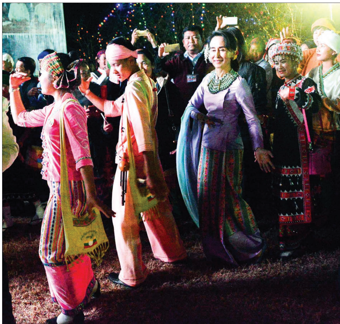
The State Counsellor ceremonially lit a bonfire and participated in an ethnic traditional dance as part of the Union Day dinner held in Shan State.

THE State Counsellor sent a message to those involved in the peace process to be unselfish and of dutiful spirit, and able to inspire future generations.