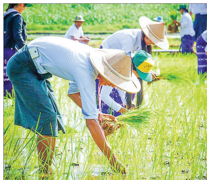
Farmer plant rice in rain-fed field in outskirts of Yangon.

Mango plays a central role as a fruit crop among the horticultural fruits in Myanmar. The majority of mango is consumed as fresh dessert fruit in the ripening stage and as a salad in the immature stage because of its attractive flavor, taste, aroma, texture and nutritional value.—200