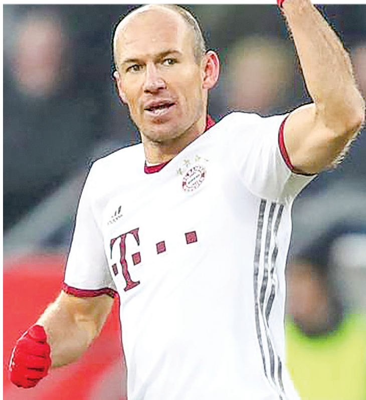
Munich's Arjen Robben.

The visitors added two more through Wallace and Aaron Hunt to make it three wins in three matches in all competitions and move out of the bottom three