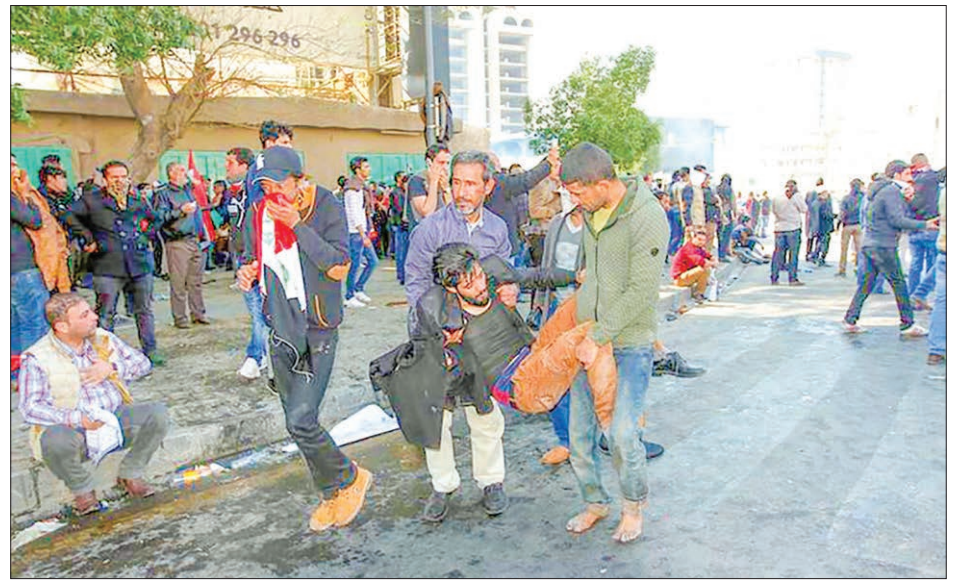
Protesters carry a man overcome by tear gas after supporters of Iraqi Shi'ite cleric Moqtada al-Sadr tried to approach the heavily fortified Green Zone during a protest at Tahrir Square in Baghdad, Iraq on 11 February, 2017.

In a statement, Maliki's Dawa party accused