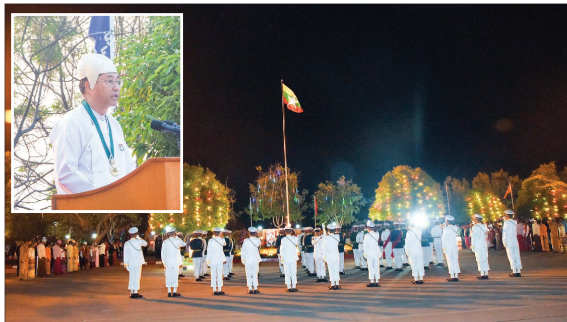
Honour guard salutes the flag in Panglong. Inset, Vice President U Myint Swe addressed the crowd.

A STATE flag hoisting and saluting ceremony was held in commemoration of the 69th Anniversary Union Day at the square of Nay Pyi Taw City Hall yesterday