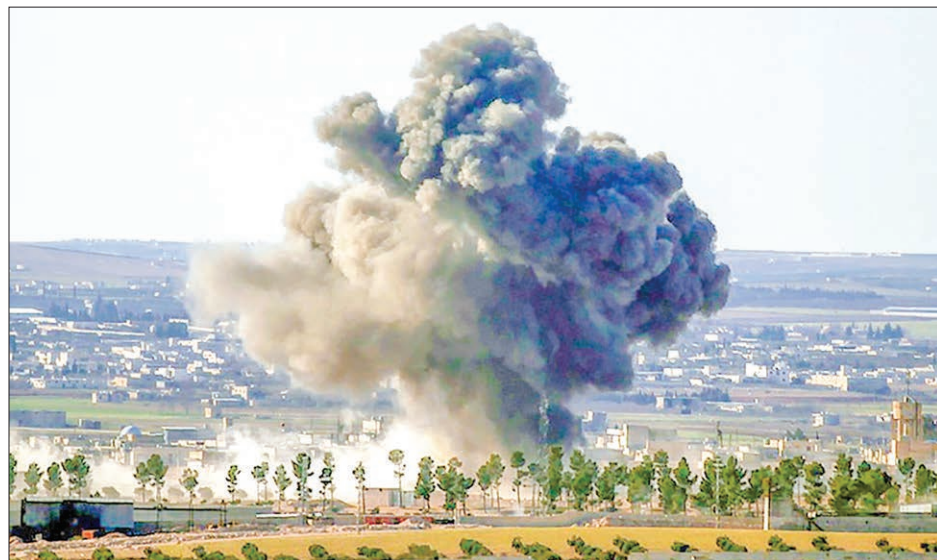
Russia's Defence Ministry said that the government forces destroyed 650 militants, two tanks and four IFVs and 18 all-terrain vehicles with heavy weaponry and other equipment.

MOSCOW — Syrian government forces supported by Russian air strikes have retaken the town of Tadeef, the most reinforced position of Islamic State near the city of Al-Bab, and reached the contact line with the Free Syrian Army as it was coordinated with Turkey, Russia's Defence Ministry said on Saturday.