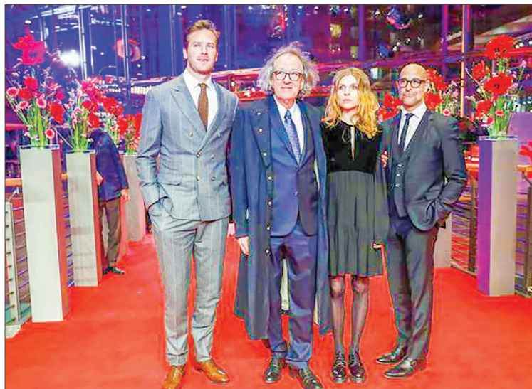
Actors Armie Hammer (L-R), Geoffrey Rush, Clemence Poesy and director Stanley Tucci arrive for the screening of the movie 'Final Portrait' at the 67th Berlinale International Film Festival in Berlin, Germany, on 11 February, 2017.

BERLIN — If you want a taste of the psychological and physical strain that comes with posing for one of the 20 th century greatest painters, then go watch "Final Portrait". Director Stanley Tucci's adaptation of US writer James Lord's memoir "A Giacometti Portrait" offers a window into the chaotic life of Swiss painter and sculptor Alberto Giacometti in Paris in the 1960s.