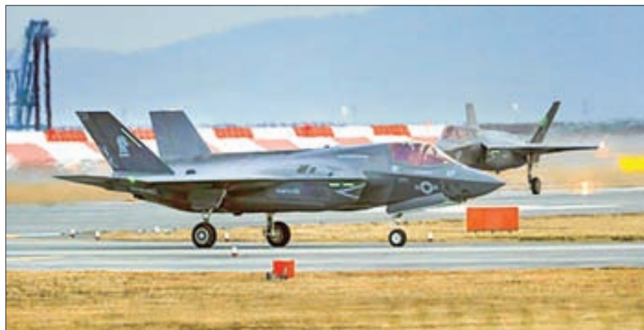
File photo taken in January 2017 shows an F-35 stealth aircraft arriving at US Marine Corps Air Station Iwakuni in western Japan. It was announced on 8 February that the F-35s have started their first training exercises around Okinawa.

They are successors to the F/A-18 Hornet and AV-8 Harrier jets that are currently based at Iwakuni. A total of 16 F-35Bs are scheduled to be deployed at Iwakuni.— Kyodo News