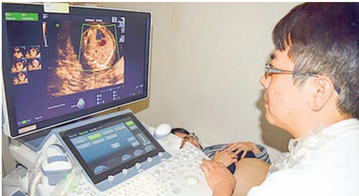
Photo taken in January 2017 shows a doctor at the Kanagawa Children’s Medical Centre in Yokohama examining the cardiac condition of a fetus through echography.

After an intense echographic examination, a doc-