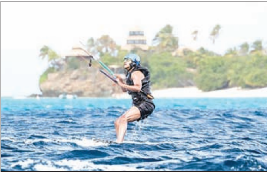
Obama tries his hand at kite surfing during a holiday with British businessman Richard Branson on his island Moskito, in the British Virgin Islands.

Photographs and video on the website of Branson’s Virgin Group show the former president, a life-long surfer, figuring out the increasingly popular sport in which people ride a board while being pulled behind a kite. “Being the former president of America, there was lots of security around, but Barack was able to really relax and get into it,” Branson wrote. Obama and his wife, Michelle, were spotted last week in the British Virgin