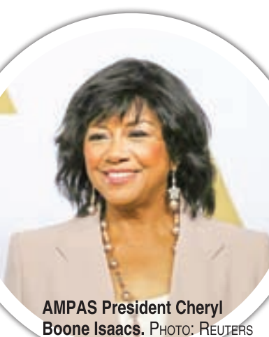
AMPAS President Cheryl Boone Isaacs.

Speaking at a luncheon in Beverly Hills for the 2017 nominees, Isaacs noted that there were "some empty chairs in this room, which has made Academy artists