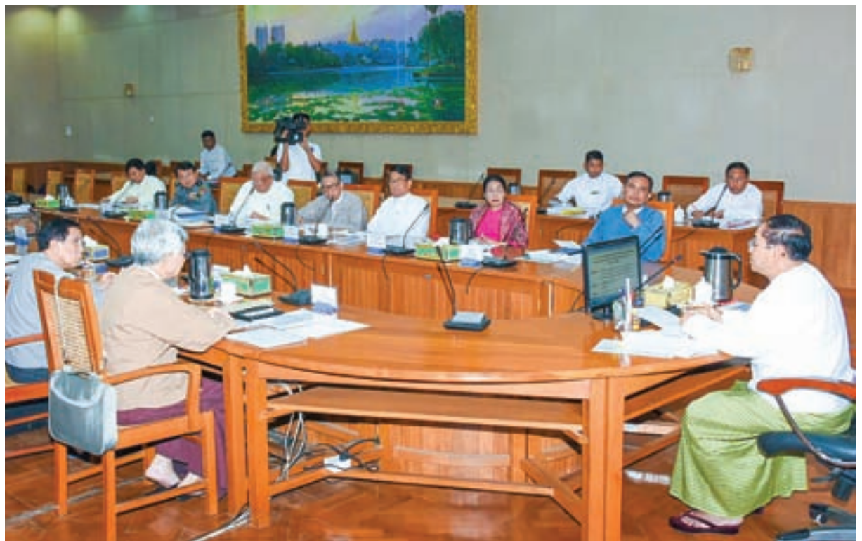
Vice President U Myint Swe, right, addresses the meeting of the Maungtaw Investigation Commission.

After discussions by the commission members, Vice-President U Myint Swe gave a concluding speech.