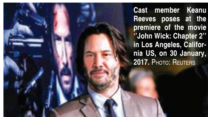
Cast member Keanu Reeves poses at the premiere of the movie "John Wick: Chapter 2" in Los Angeles, California US, on 30 January, 2017.

"When we speak out against those who try and put up barriers, we reinforce this important truth — that all artists around the world are connected by a powerful bond, one that speaks to our creativity and common humanity," she said, to loud applause.—Reuters