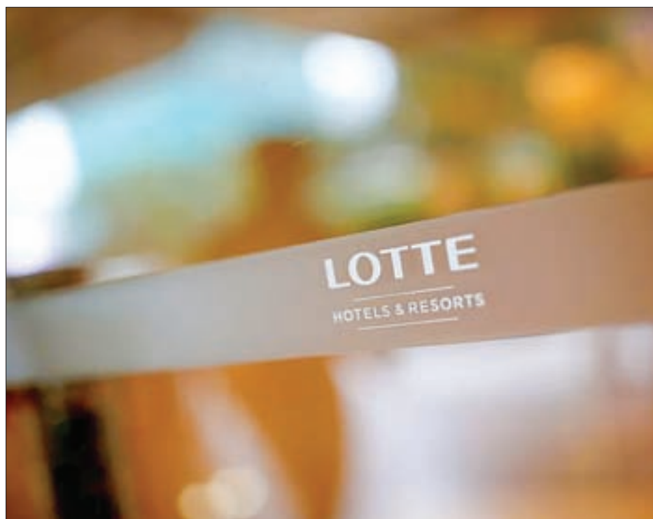
The logo of Lotte Hotel is seen at a Lotte Hotel in Seoul, South Korea, on 7 June 2016.

sition to the THAAD deployment was clear.