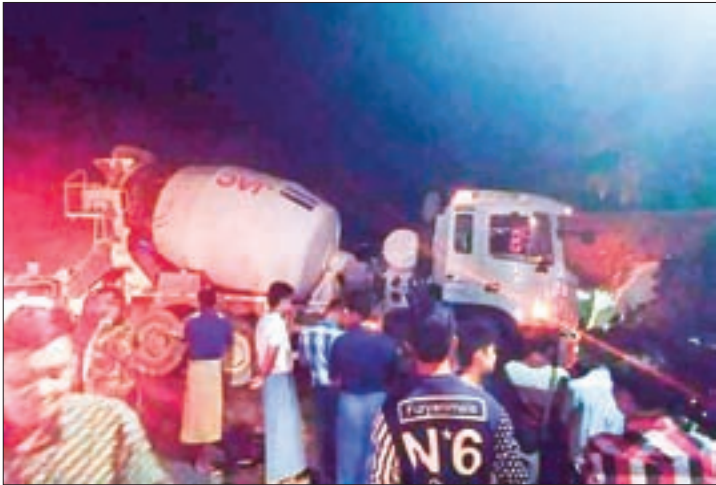
Five cars crash on Yangon-Mawlamyine Road on Tuesday.

FIVE cars crashed on the road between Yangon and Mawlamyine Tuesday evening, according to a police report. The wreck happened on the road near Pawtawmu Village in Thaton Township in Mon State. No life-threatening injuries were reported, police say. A truck heading to Mawlamyine from Yangon being driven by Thiha Tin Htay, 26, collided with an eight-wheeled vehicle being driven by Aung Myint Naing, 32, damaging a major part of body of the truck, which continued to crash into three other cars including an express car and two luxury cars. Actions are being taken against the two drivers under Section 279 of the Penal Code.— Myitmakha News Agency