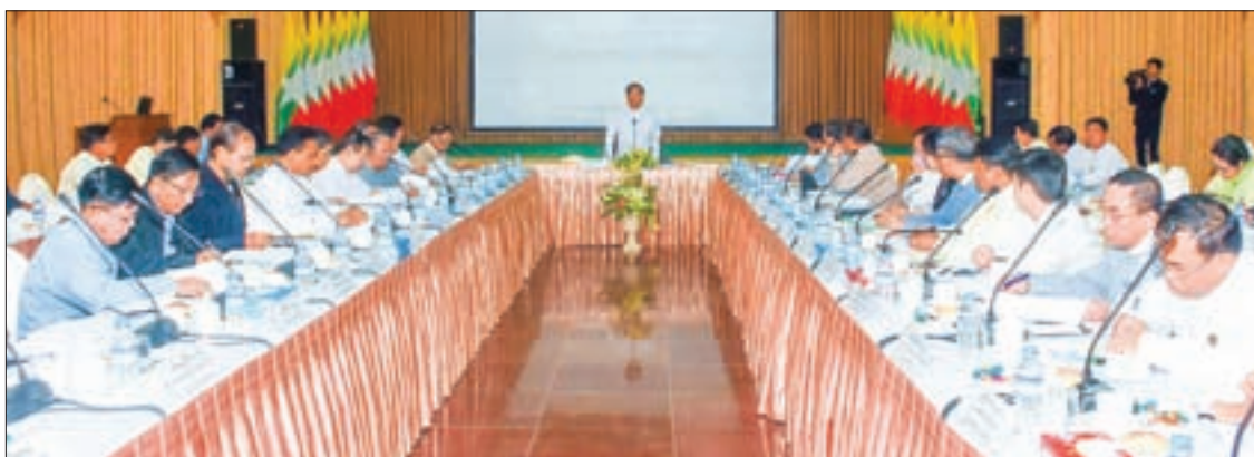
Vice President U Myint Swe addresses the meeting of the Private Sector Development Committee.

The government formed the Private Sector Development Committee in November 2016 to implement more effective development programmes for the private sector by taking the role of guiding and coordinating policies and programmes and to improve private-sector related