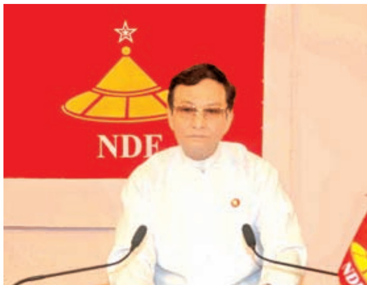
U Khin Maung Swe Chairman of National Democratic Force Party.

CHAIRMAN of National Democratic Force Party U Khin Maung Swe presented the policies, attitudes and programmes of his party on 8 February 2017, on Radio and TV programmes.