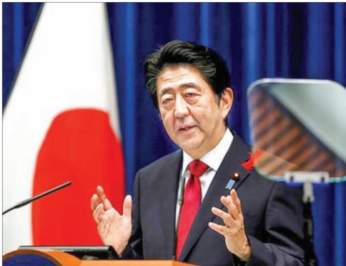
Japan's Prime Minister Shinzo Abe speaks during a news conference at his official residence in Tokyo, Japan, on 6 October, 2015.

"A failure of the first official meeting would send a very, very damaging message to the world," said a former Japanese diplomat