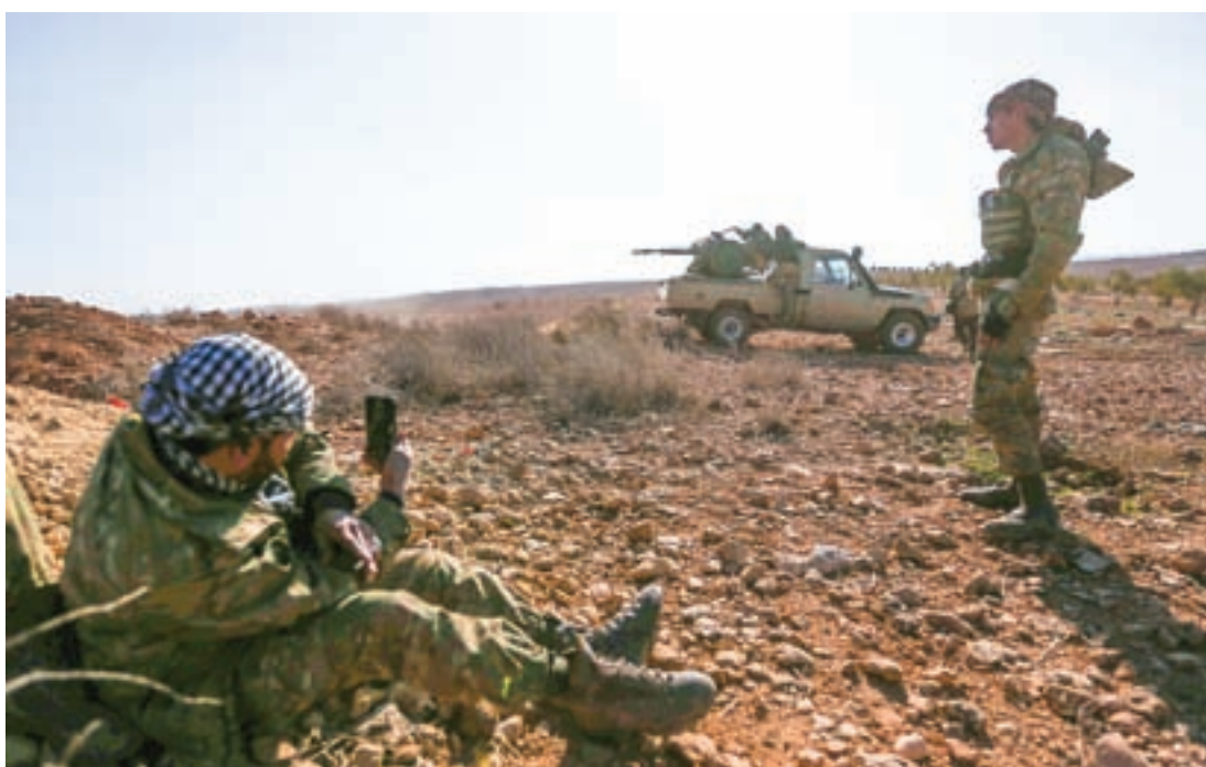
Rebel fighters fire their weapon during an offensive against Islamic State militants, on the outskirts of al-Bab in February 2017.

"With last night's assault, Islamic State's defences have been broken through and the advance is now continuing," said the official, speaking from the Turkish city of Gaziantep. Turkish military reinforcements had been sent to the area about a week ago, the rebel added.